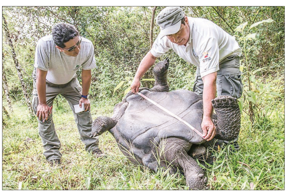
Members of the Galapagos National Park service measure a giant tortoise on Santa Cruz Island, in the remote Ecuadorean archipelago 600 miles off South America's Pacific coast.

The newly released tortoises join 394 others