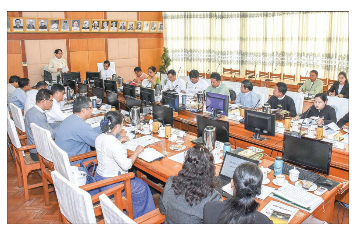
Union Minister Dr. Pe Myint addresses the coordination meeting (1/2019) in Nay Pyi Taw yesterday.

assessed and reviewed and meeting attendees are urged to openly discuss and suggest,