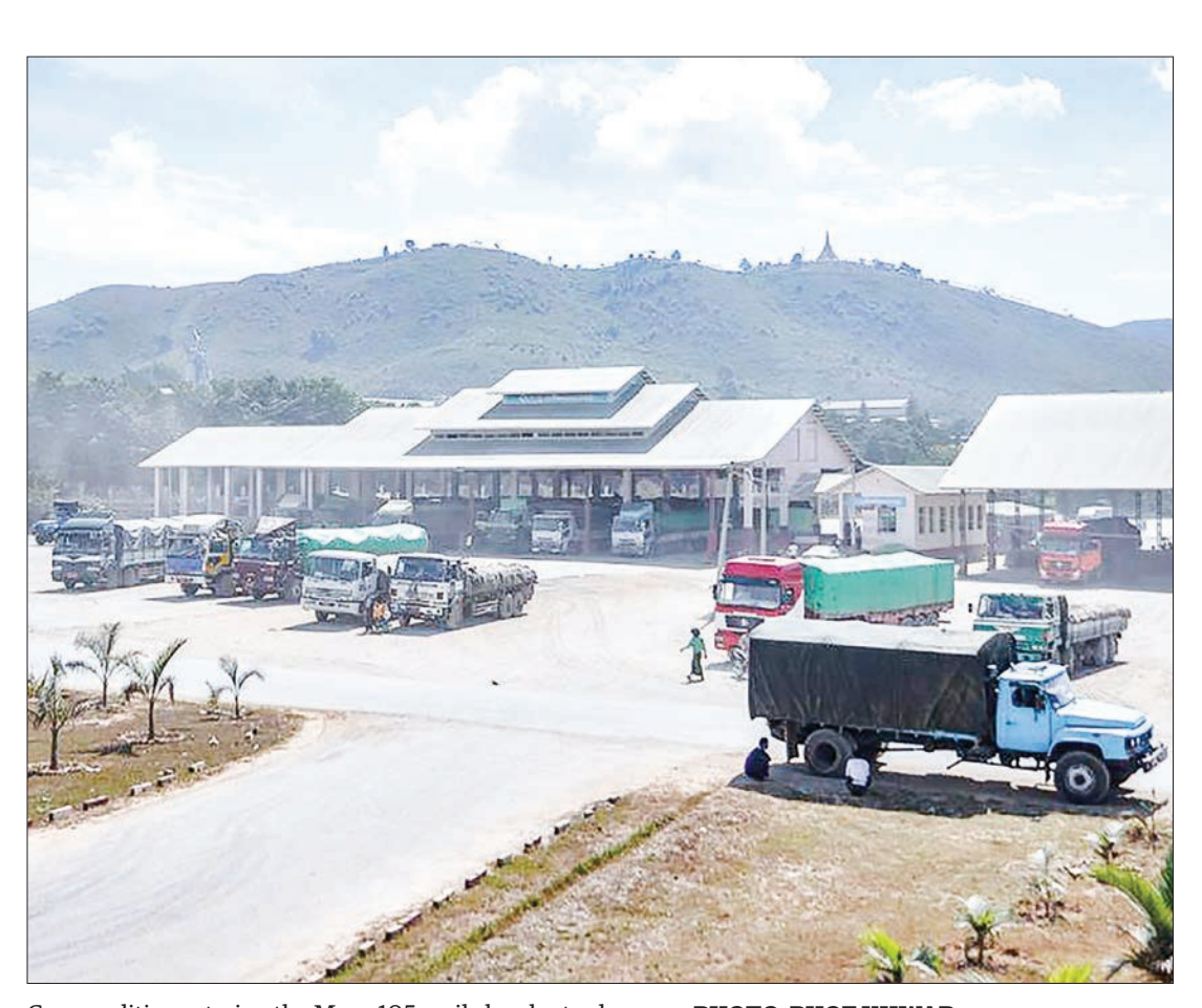
Commodities entering the Muse 105—mile border trade zone.

THE import value using the individual trading cards (ITCs) at borders totalled K17.8 billion in the current 2018-2019 fiscal year, while individual exports stood at K3.9 billion, according to the latest report of the Ministry of Commerce.