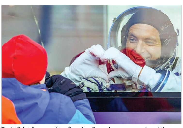
David Saint-Jacques of the Canadian Space Agency, a member of the International Space Station (ISS) expedition 58/59.