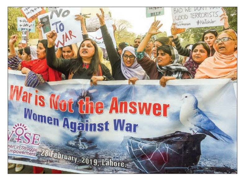
Pakistani civil society activists shout slogans as they march during a peace rally in Lahore on 28 February, 2019.

status and the hashtag #WelcomeBackAbhi swiftly trending on social media, India's Prime Minister Narendra Modi called on his citizens to "stand as a wall" in the face of an enemy that "seeks to destabilise India".—AFP