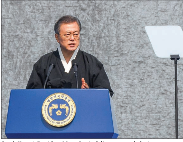
South Korea's President Moon Jae-in delivers a speech during a ceremony commemorating the 100<sup>th</sup> anniversary of the March First Independence Movement against Japanese colonial rule, in Seoul on 1 March, 2019.

Moon had been set to unveil details of new economic cooperation between the two Koreas this week, and now faces major questions over his dovish approach, but signalled he would not change track. Seoul would consult with the US on ways to resume South Korean tourism to the North's Mount Kumgang and operations