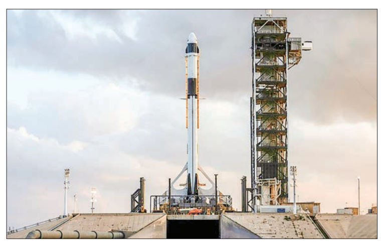
This image courtesy of SpaceX and obtained from NASA shows, the SpaceX Falcon 9 rocket and Crew Dragon spacecraft rolled out to Launch Complex 39A at NASA Kennedy Space Center on 3 January, 2019. PHOTO: AFP

The cooling of US relations with Russia has increased pressure for the US to be able to send people to space on its own. NASA has always relied on the aerospace industry for its manned space programmes. Launius recalls that back in the days of the Apollo moon missions "almost everybody in that room were contractors, not NASA employees."—AFP