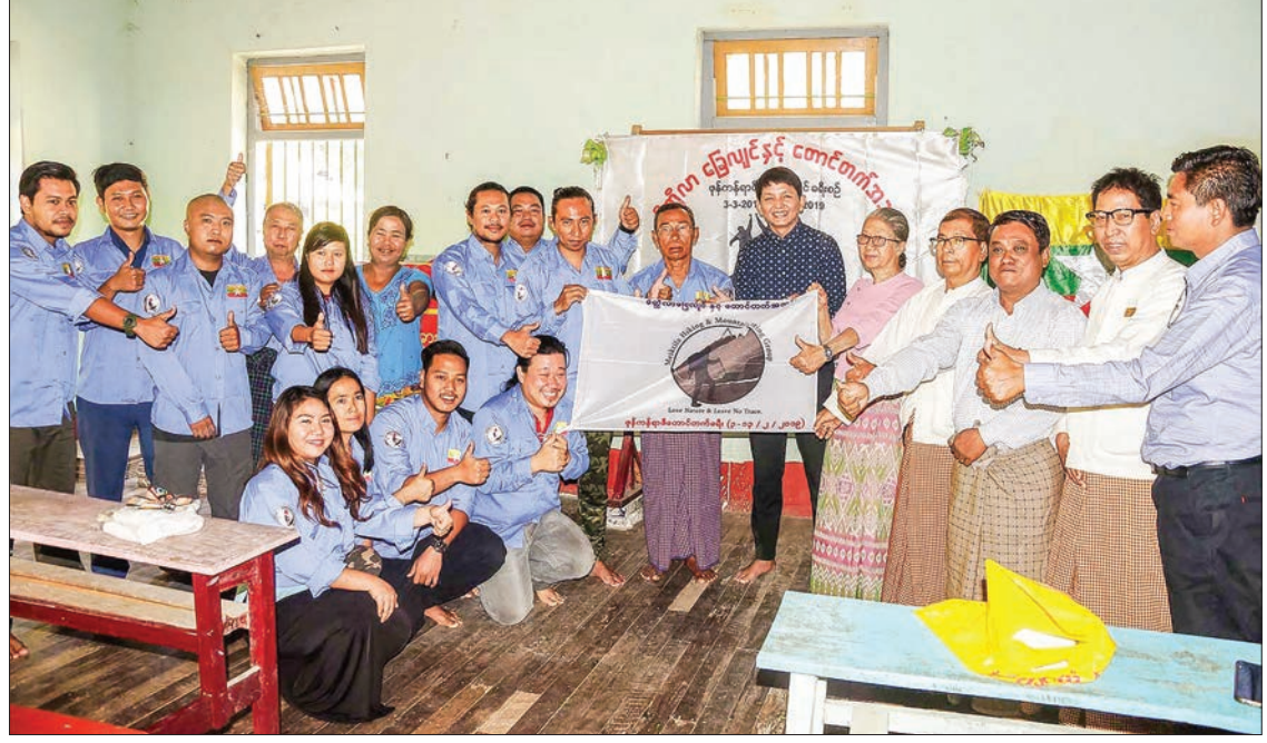
Meiktila hiking and mountaineering club members pose for the documentary photo with the victory flag.

Alcohol and drug are prohibited among the club