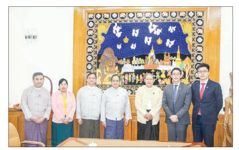
Union Minister U Soe Win and Singaporean Deputy Chief of Mission Mr. Koh Chee Chian pose for a photo.