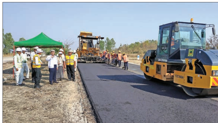
Union Minister U Han Zaw inspects the mechanized nylon tar laying on Yangon-Mandalay expressway.

UNION Minister for Construction U Han Zaw inspected the mechanized nylon tar laying of the section between mileposts 180/0 and 180/3 on Yangon-Mandalay expressway (Nay Pyi Taw section) on 23 February.