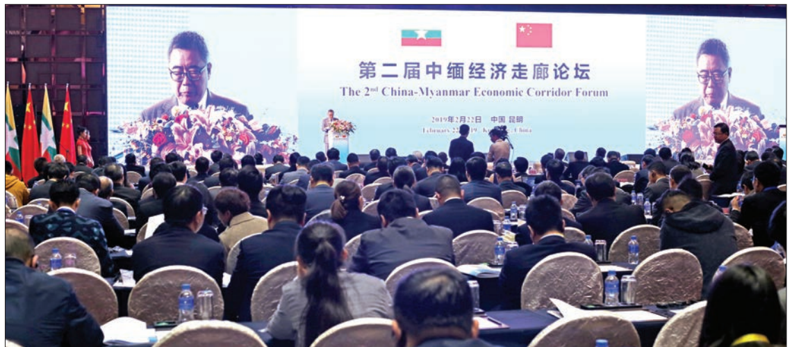
The 2 nd China-Myanmar Economic Corridor Forum in progress in Kunming, China.

On 22 February, the Union Minister and delegation participated in the 2 nd China-Myanmar Economic Corridor Forum, the meeting on the projects of the China-Myanmar Economic Corridor Forum, and visited Yunnan contractors investment group. The forum discussed agriculture, livestock breeding, forestry, mining, Kyaukphyu special economic zone, tourism, railroad, bilateral cooperation, projects of