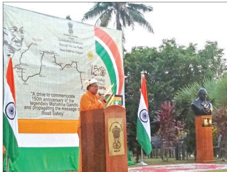
Union Minister U Ohn Maung addresses the Concluding Ceremony of Bapu@ 150 Car Rally New Delhi to Yangon yesterday.

In his speech at the meeting, the Union Minister said, border gates are ready to welcome foreign tourists to promote the Myanmar's tourism industry,