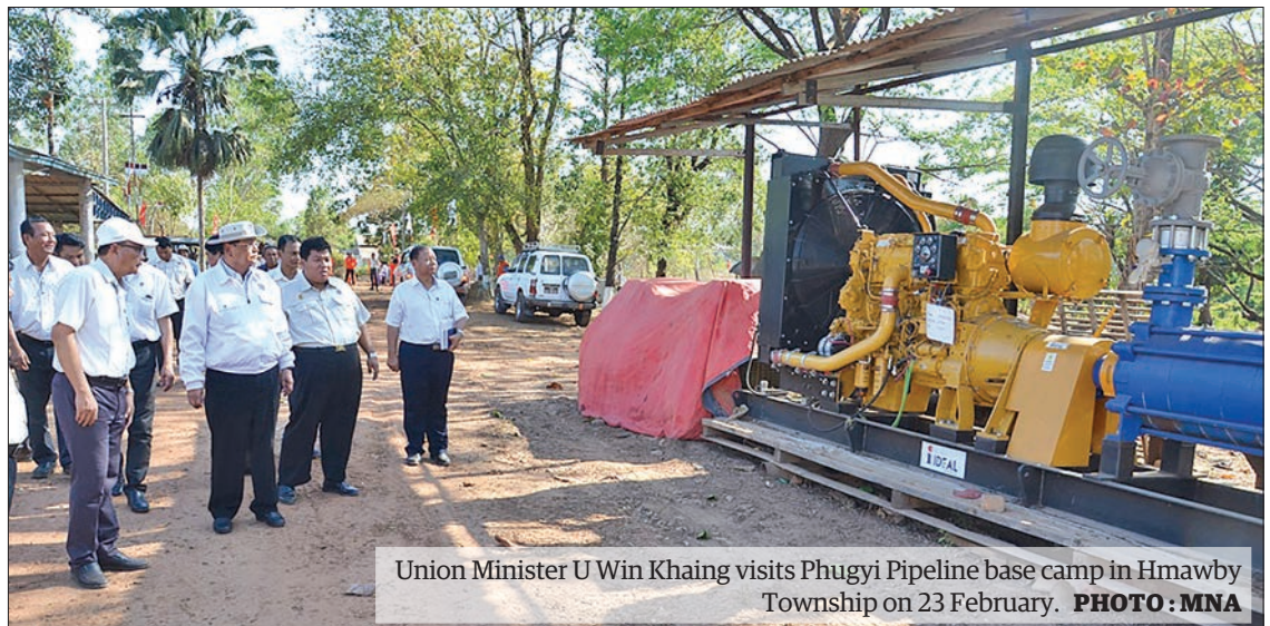
Union Minister U Win Khaing visits Phugyi Pipeline base camp in Hmawby Township on 23 February.

Pyay oilfield started producing oil and gas in 1965. Its maximum daily oil output reached 2563 barrels in July 1994. It produced 25.618 cubic feet of gas in June 1998. The old oilfield now has 13 wells that are producing 65 barrels of oil and 0.078 cubic feet of gas. Efforts are being made to increase oil and gas output.