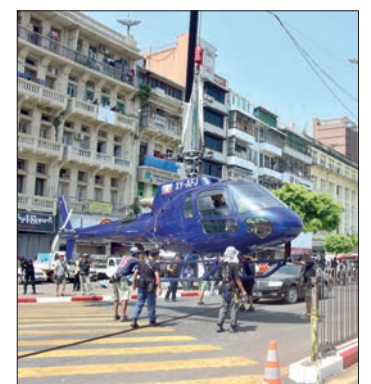
The crew of Line Walker-2 prepares a helicopter for a scene in the movie in downtown Yangon.