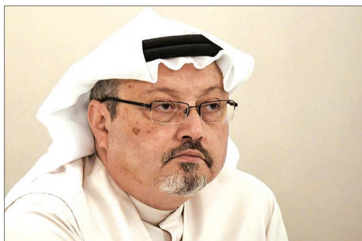
The murder of Jamal Khashoggi has put strain on US-Saudi relations.

RIYADH (Saudi Arabia)—Saudi Arabia has replaced its ambassador to the United States, a royal decree announced Saturday, as the fallout over journalist Jamal Khashoggi's murder tests rela-