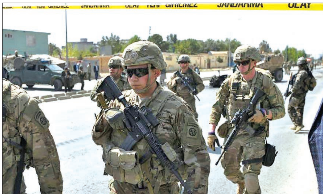
There is still no timetable for a US withdrawal or ceasefire in Afghanistan.

Analysts say this round will likely see the Taliban push for the removal of its leaders from a UN travel blacklist, matched with pressure from the US for