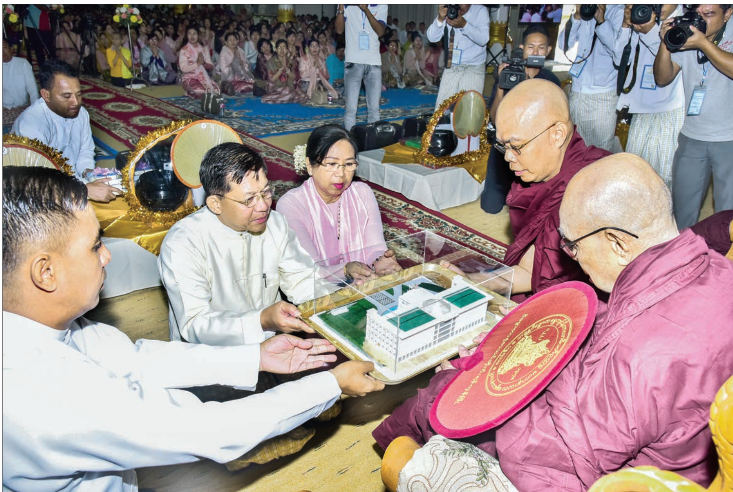
Senior General Min Aung Hlaing and wife present a replica the main building of the Dhammaduta Chekinda Buddhist University to Sayadaws.