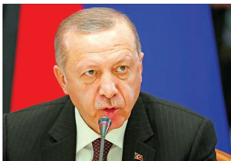
Turkish President Recep Tayyip Erdogan has lashed out at his Egyptian counterpart over the recent execution of nine people.

who wonder why Tayyip Erdogan does not speak to Sisi, because there are mediators who come here sometimes, but I will never talk to someone like him,” he said.