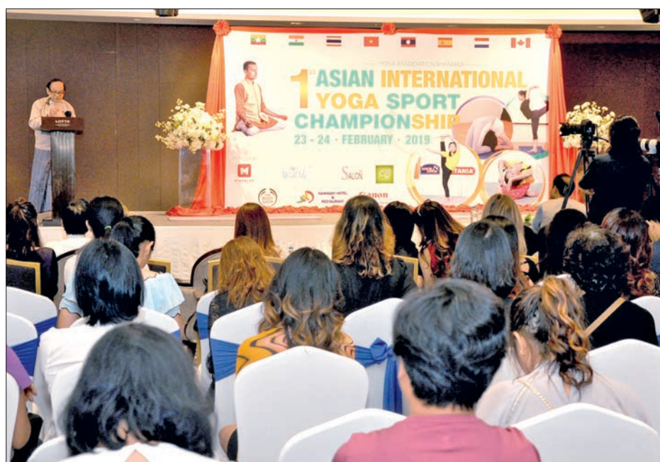
Union Minister Dr. Myint Htwe addresses the prize awarding ceremony for the 1 st Asian International Yoga Sport Championship in Yangon yesterday.

“Yoga also prevents hypertension, diabetes, cardiac disorder and vein diseases and depression through reducing the