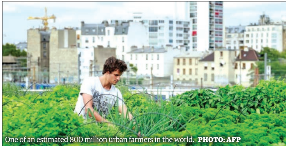
One of an estimated 800 million urban farmers in the world.

market gardens in even the most run-down of urban districts to connected vertical farms using indoor farming techniques to meet spiralling food demand in areas largely bereft of arable land. The FAO wants to see the trend prosper and become durably and sustainably embedded within public policy. Yves Christol, of French cooperative In Vivo, has identified six models of the genre. They include a key European variant, electronically managed without recourse to pesticide—or even soil or sunshine.