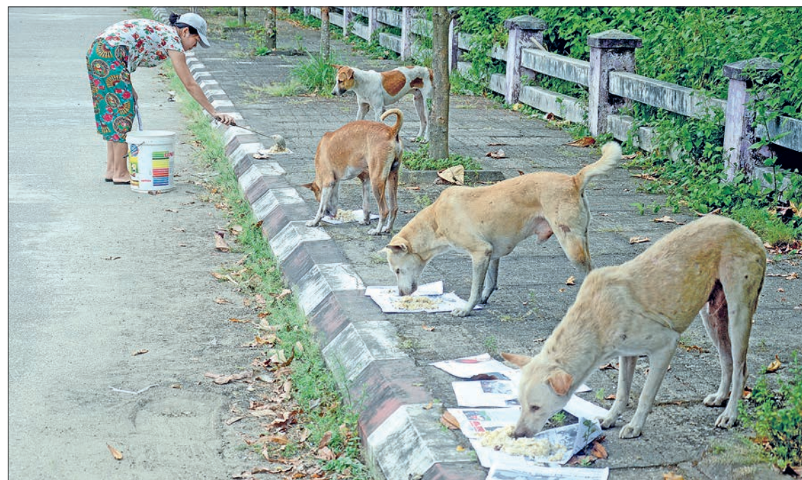
A dog lover feeds stray dogs in Yangon.