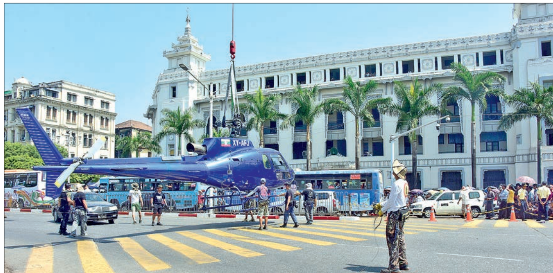
A helicopter scene, shootouts, and a car chase involving a gang of criminals with guns blazing were filmed yesterday for the Line Walker-2.