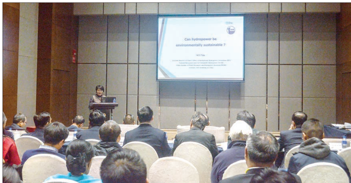
A workshop on hydropower electric generation technology at the InterContinental Hotel in Kunming, China on 21 February.

Experts discussed developing the hydropower technology of Myanmar and the world, se-