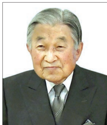
Undated photo shows Japanese Emperor Akihito. He is set to abdicate on 30 April 2019.

their trips abroad was "far beyond international goodwill" as they created "a deep impression" both in Japan and the visited countries. After hearing those speeches, the emperor said he believes it is "fortunate that I have been able to undertake duties with the help of people" and expressed gratitude to "the people, in whom I take pride and for whom I feel joy in being 'the symbol of the state' and the civilization of this country built over the long period." Referring to a series of disasters that struck Japan during his reign, he said "affected people who endured many hardships and those from other parts of Japan who stood by them and offered support in various ways have become an