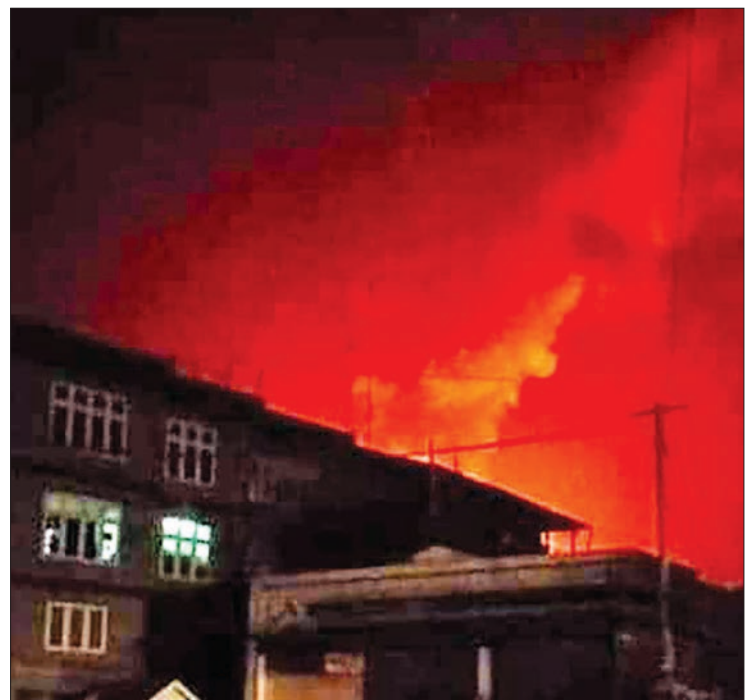
Fire engulfs the two-story house in Aungban on 23 February.