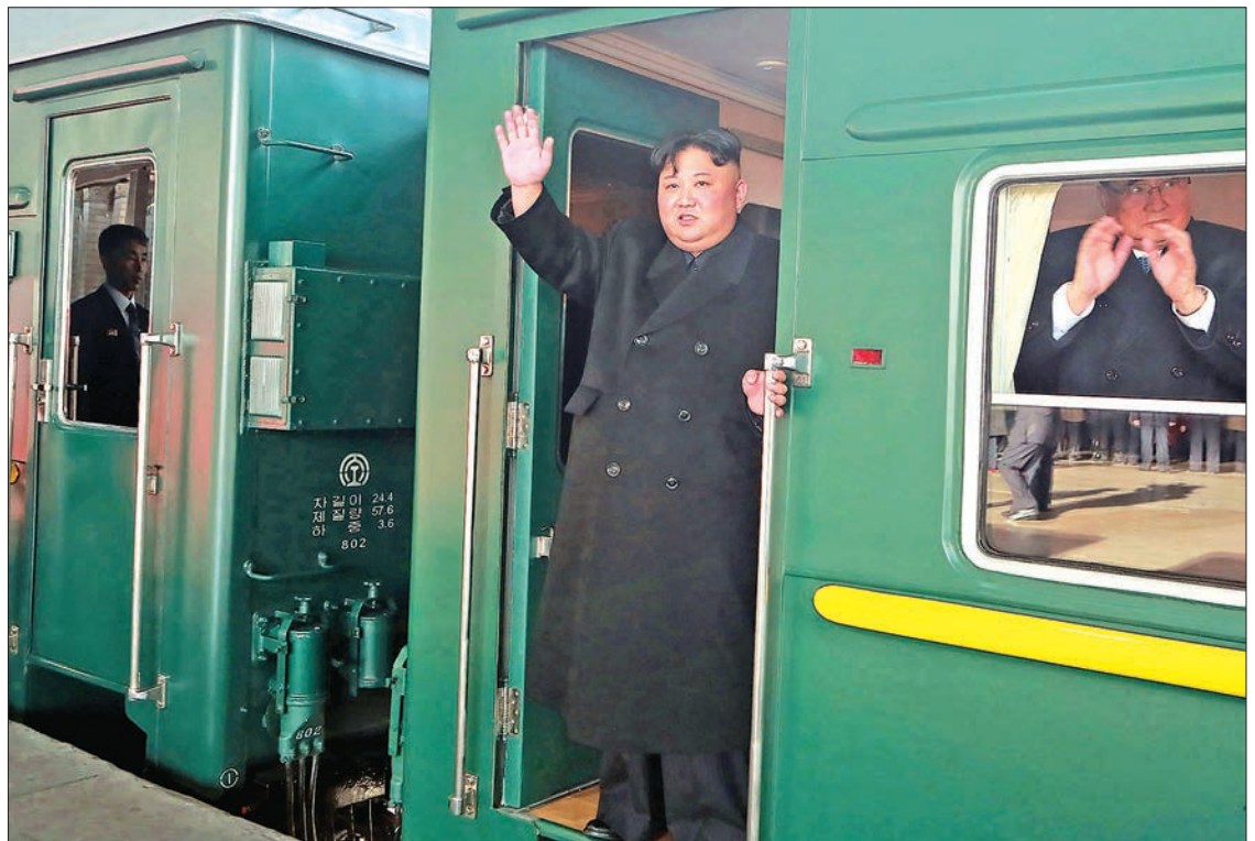
This picture taken on 23 February 2019 and released from North Korea's official Korean Central News Agency (KCNA) on 24 February shows North Korean leader Kim Jong Un (C) departing Pyongyang Station for the second North Korea-US summit meeting in Hanoi, Viet Nam.

Accompanying the North Korean leader was right-hand man and top general Kim Yong Chol, who met with Trump in the White House last month, along with several other top dignitaries, KCNA said. Security was tight before the train's arrival in Dandong, with