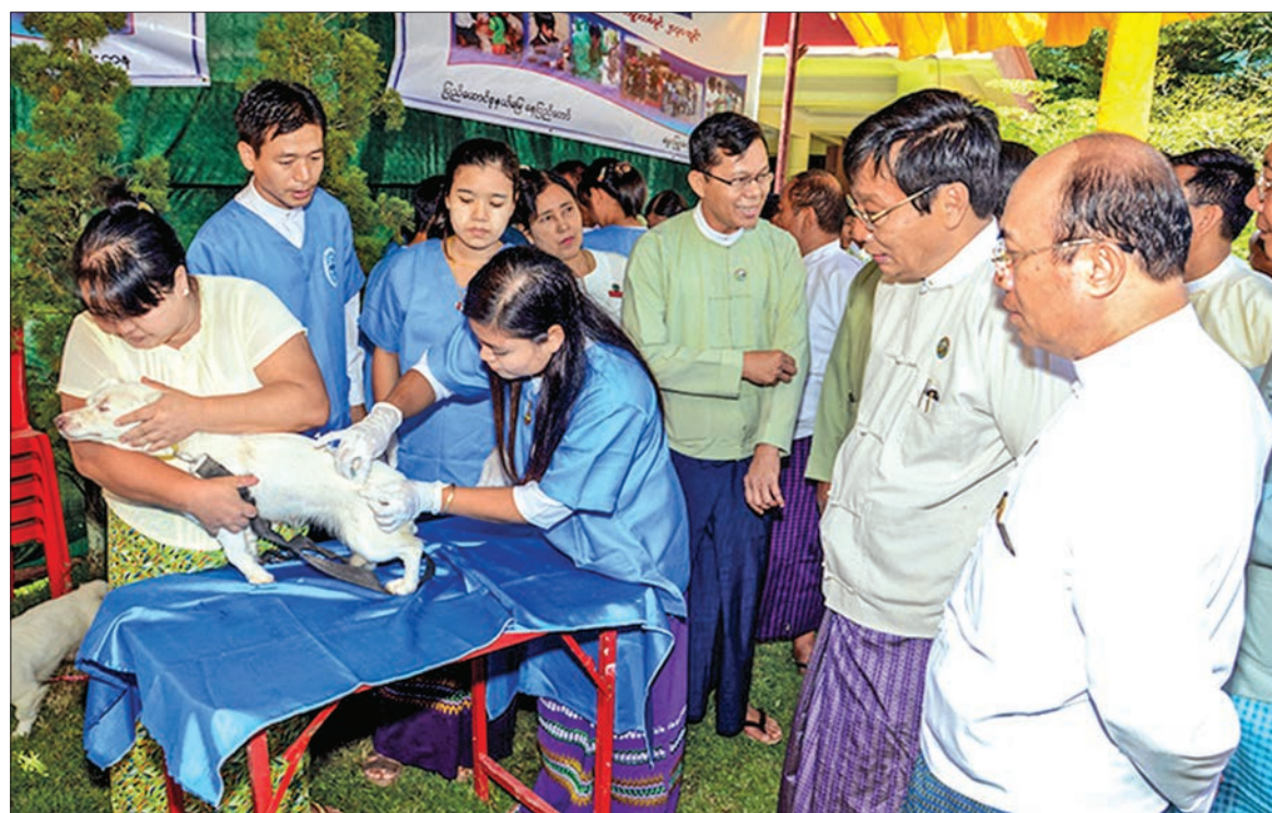
Veterinarian giving vaccination injection to dog at 11 th World Rabies Day ceremony in 2017.

(PEP) is the immediate treatment of a bite victim after rabies exposure. This prevents virus entry into the central nervous system, which results in imminent death. PEP consists of: