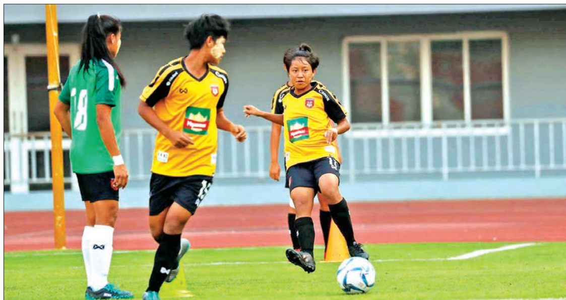
The Myanmar U-16 women's national football team undergoes training in Mandalay.

Matches featuring Myanmar will be broadcast live on the Myawady Channel and on My Sports' Facebook page, according to the football federation.—Lynn Thit(Tgi) ■