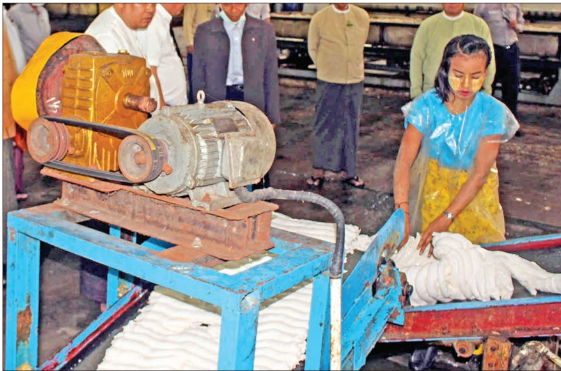
A woman working at the production-line of a rubber processing factory in Myeik.

The Union of Myanmar Federation of Chambers of Commerce and Industry-UMFCCI and the Japan Productivity Center had carried out a pilot