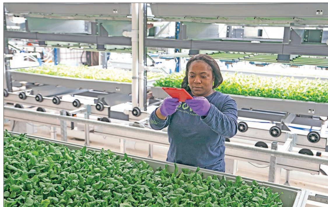
A Bowery Farming employee inspects some of their greens grown at the hydroponic farming company in Kearny, New Jersey.

In a warehouse that was once a steel mill with 40-foot (12-meter) ceilings, the company is growing kale and arugula leaves set in rows of 12 metal racks each. The roots are suspended in the air as they are intermittently irrigated while the leaves bask under LED lights. AeroFarms experiments regularly with lighting and nutrients with an eye towards finding the optimal recipe for each plant and developing the best algorithm. — AFP ■