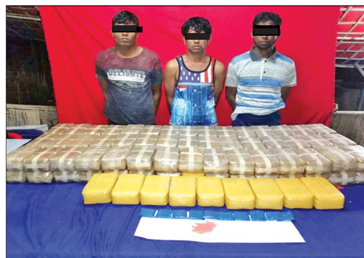
Three suspects seen with illegal drugs in Maungtau Township.