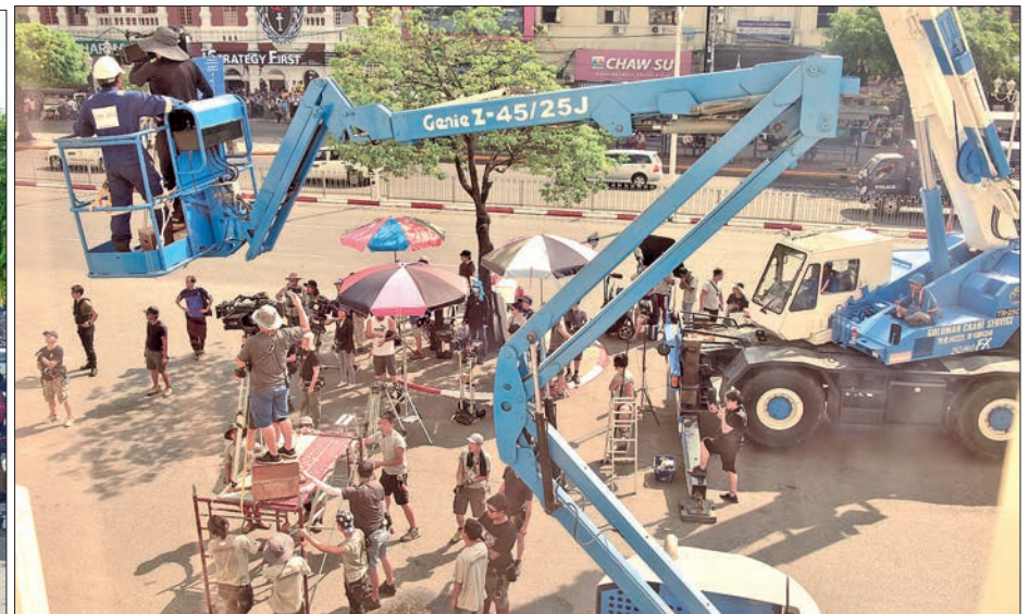
The crew of the Line Walker-2 shooting team film scenes for the movie in the downtown Yangon yesterday.

tions Company, who are taking shared responsibility for the film on Myanmar's side, has issued an apology to the public for the temporary traffic inconveniences caused during the filming process and has kindly requested their continued patience. —Nyunt Ko Ko (Translated by Zaw Htet Oo)