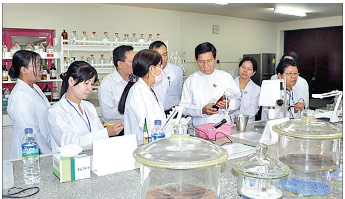
Union Minister U Khin Maung Cho visits Industrial Supervision and Inspection Department in Hinthada on 23 February.

At the meeting hall of the division, the Union Minister heard a report on invention of new drugs through research work, presented by its in-charge. The Union Minister spoke of the need to conduct research and lab test in accord with the international standards, maintain the quality of drugs through regular overhauling of the production machines, manufacture quality drugs and apply innovative means to attract consumers, produce new types of drugs in addition to distributing medicines that are important for public health and conduct test on foodstuff. The functions of the division involve the work of testing foodstuff, water, wastewater, drugs and related materials and herbal plants through advance technologies and equipment in-