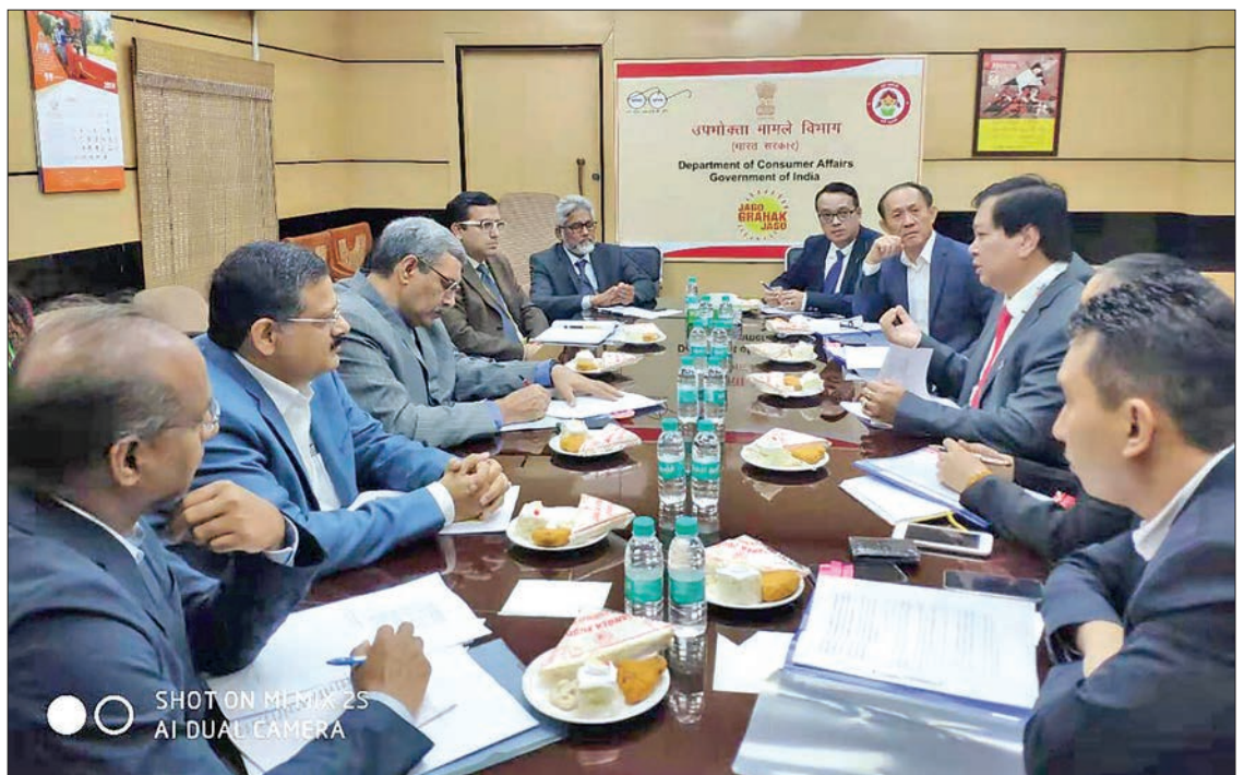
Myanmar Ambassador to India U Moe Kyaw Aung discusses investment and trade matters with Indian governmental officials in New Delhi.

In the afternoon, the Myanmar Ambassador and delegation also met with Joint Secretary of Asean Division from Ministry of Commerce and Industry Shri Rajineesh and party, and discussed cooperation matters, seeking the ways to increase pulses and beans export from Myanmar to India.—MNA ■ (Translated by Kyaw Zin Tun)