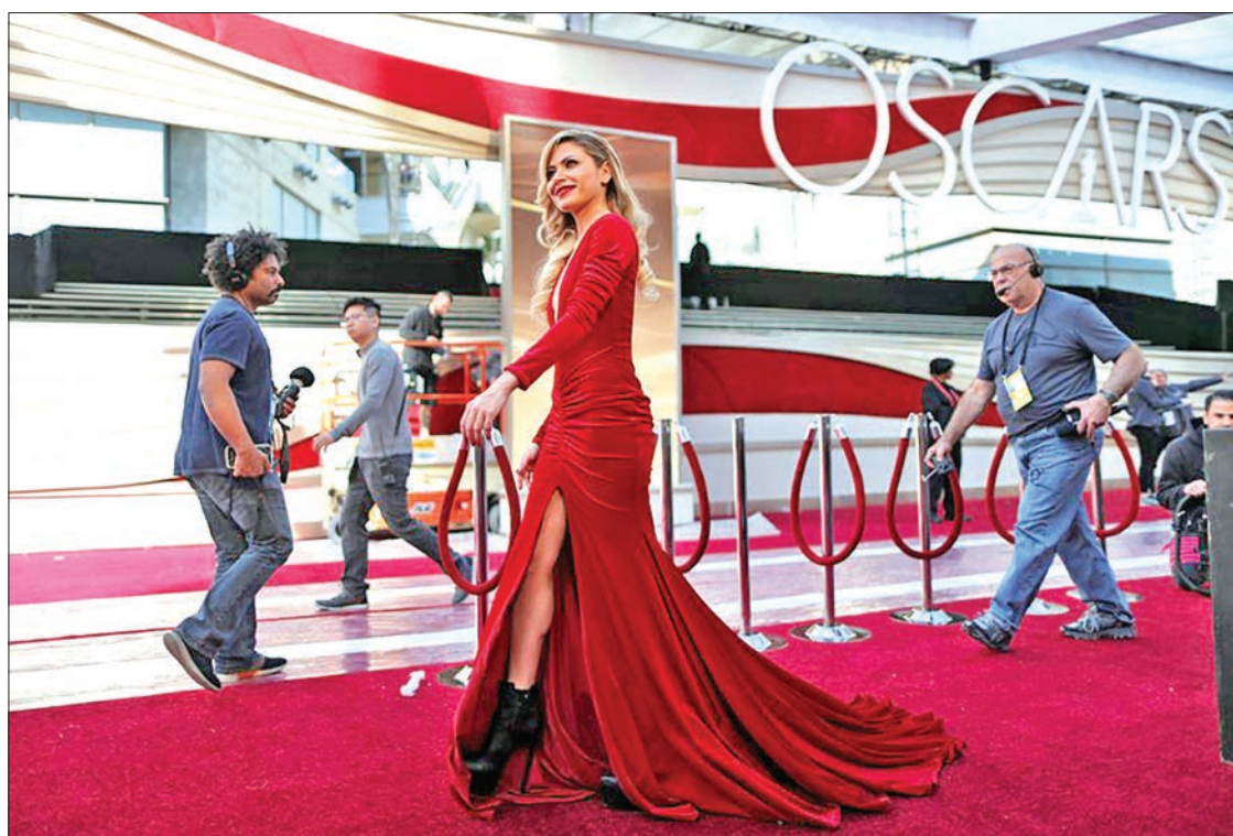
A woman walks the Oscars red carpet as preparations continue for the 91 st Academy Awards in Hollywood, Los Angeles, California, US on 23 February 2019.

Two biopics—"Vice" about former US vice president Dick Cheney and "Bohemian Rhapsody" about the band Queen—round out the list of contenders for best picture. The 7,900-odd voting members of the Academy of Motion Picture Arts and Sciences had bold choices in front of them—traditional art-house Oscar bait, and big, rous-