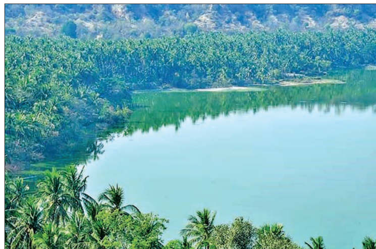
Twinma Lake in Kani Township, Sagaing Region, the main source for natural spirulina in Myanmar.

in compiling their research papers and testing and examining the samples sent by the related ministries.—MNA ■ (Translated by TMT)