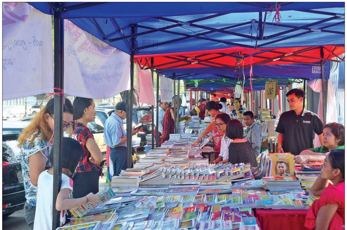
The Weekend Book Street in Yangon attracts local book-lovers.

talks under the title "Movies written from novels" focusing on creation of youth directors and literature.