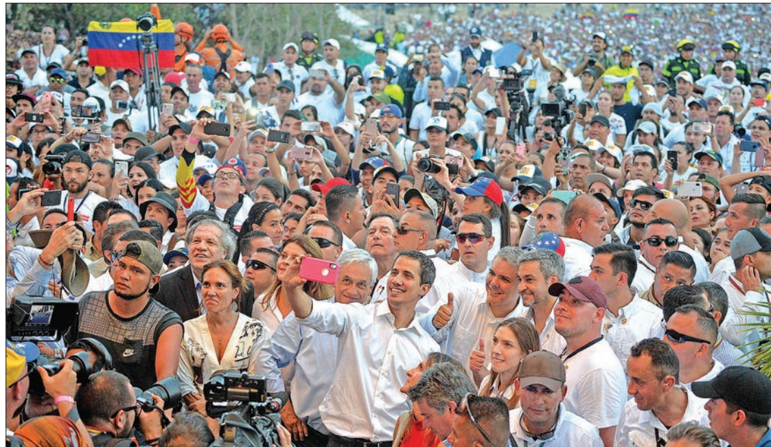
Venezuela's opposition leader Juan Guaido (c) takes a selfie his wife Fabiana Rosales (r, foreground), Chilean President Sebastian Pinera (next to him at left), Colombian President Ivan Duque (c, right, giving thumb up) and Paraguayan President Mario Abdo Benitez during the "Venezuela Aid Live" concert, organized to raise money for the Venezuelan relief effort, at the head of the Tienditas International Bridge in Cucuta, Colombia, on 22 February 2019.

US Secretary of State Mike Pompeo said the United States "will take action" as he condemned violence perpetrated by Maduro's "thugs." Guaido, meanwhile, announced he would participate in Monday's Lima Group meeting in Bogota, and called on the international community to be prepared for "all possibilities" with regard to Maduro. The country is gripped by a humanitarian crisis that has seen poverty soar during a prolonged recession and hyperinflation. A boat carrying aid from the US territory of Puerto Rico had to turn back