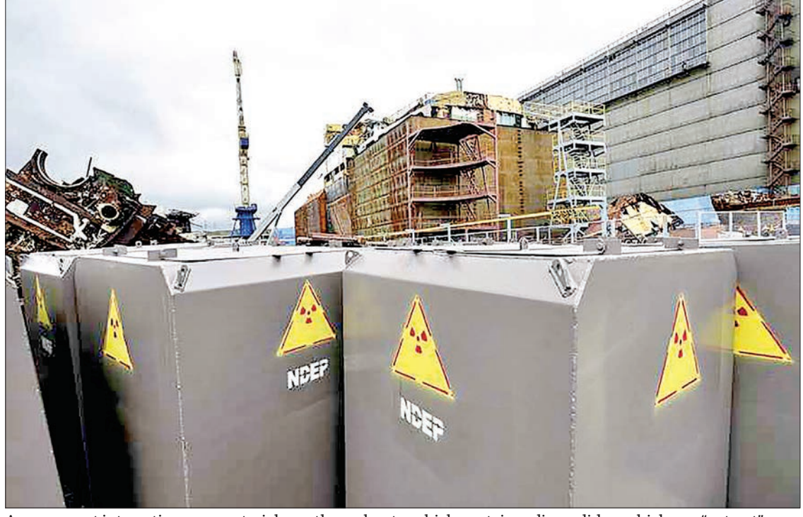
Among most interesting new materials are the sorbents, which contain radionuclides, which can "extract" radioactive substances from waste, and further storage would not harm the environment.

compose such ceramic materials, as they consist of analogues to natural minerals, which are hard to decompose,—Rutile, Purochlore, Hollandide and others," the expert continued. "Our tests have confirmed the new sorbents