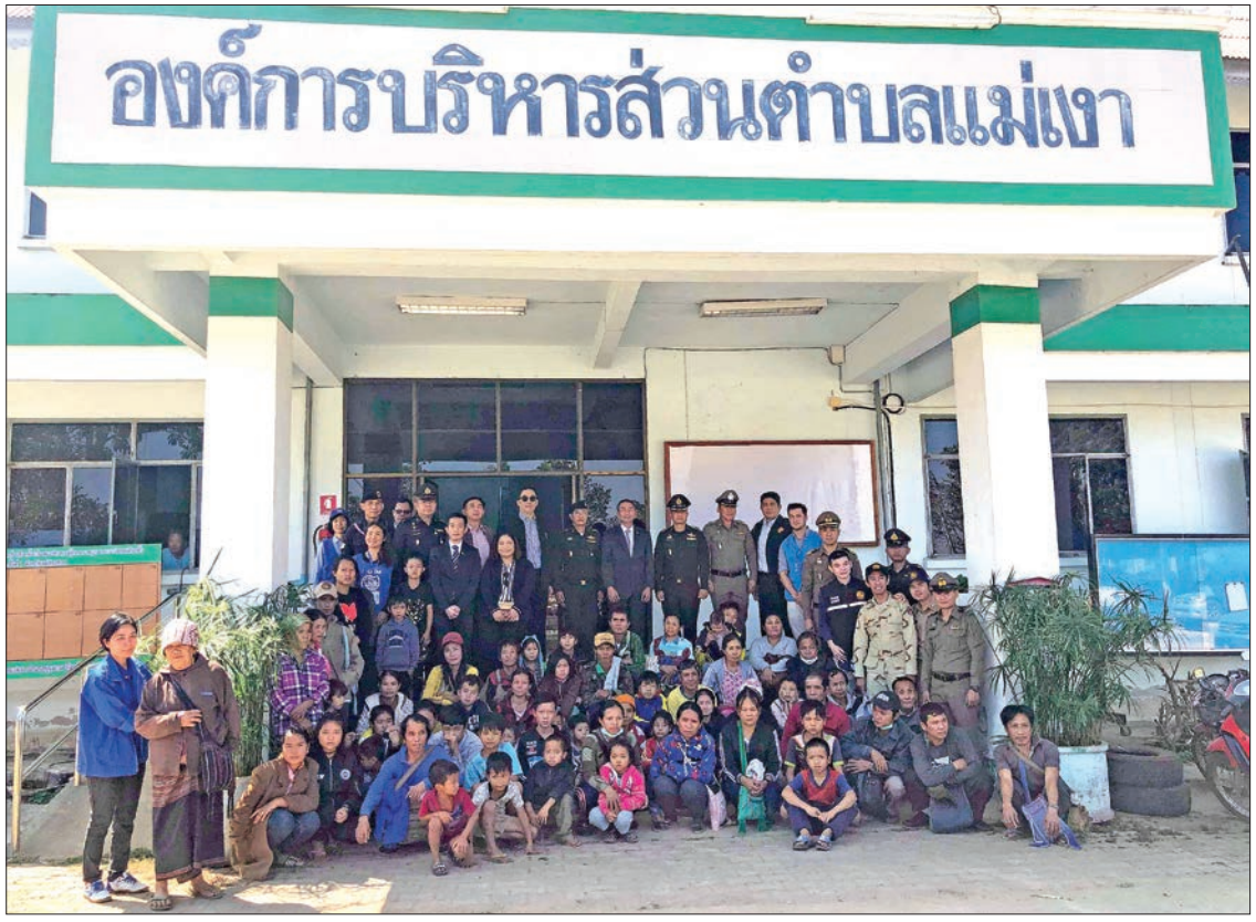
Myanmar nationals are seen with Myanmar diplomats and Thai officials in Thailand before returning home.

The returnees were transported to Me Se Reception Cen-