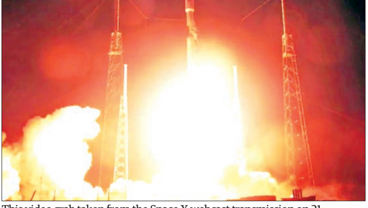
This video grab taken from the Space X webcast transmission on 21 Februrary, 2019, shows Nusantara Satu satellite lifting off Space Launch Complex 40 (SLC-40) carrying Israel's Beresheet spacecraft at Cape Canaveral Air Force Station, Florida.

"This is history in the making—and it's live! Israel is aiming for the #moon and you're all invited