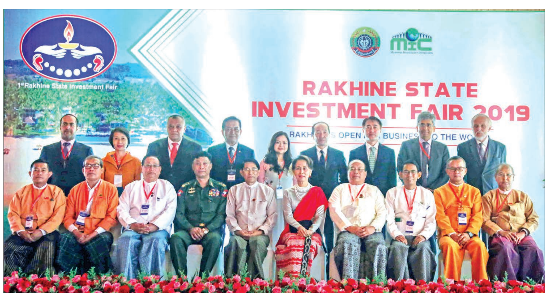
State Counsellor Daw Aung San Suu Kyi poses for the documentary photo together with union ministers, chief ministers and diplomats at the opening ceremony of Rakhine State Investment Fair (2019) in Ngapali Beach, Thandwe yesterday.