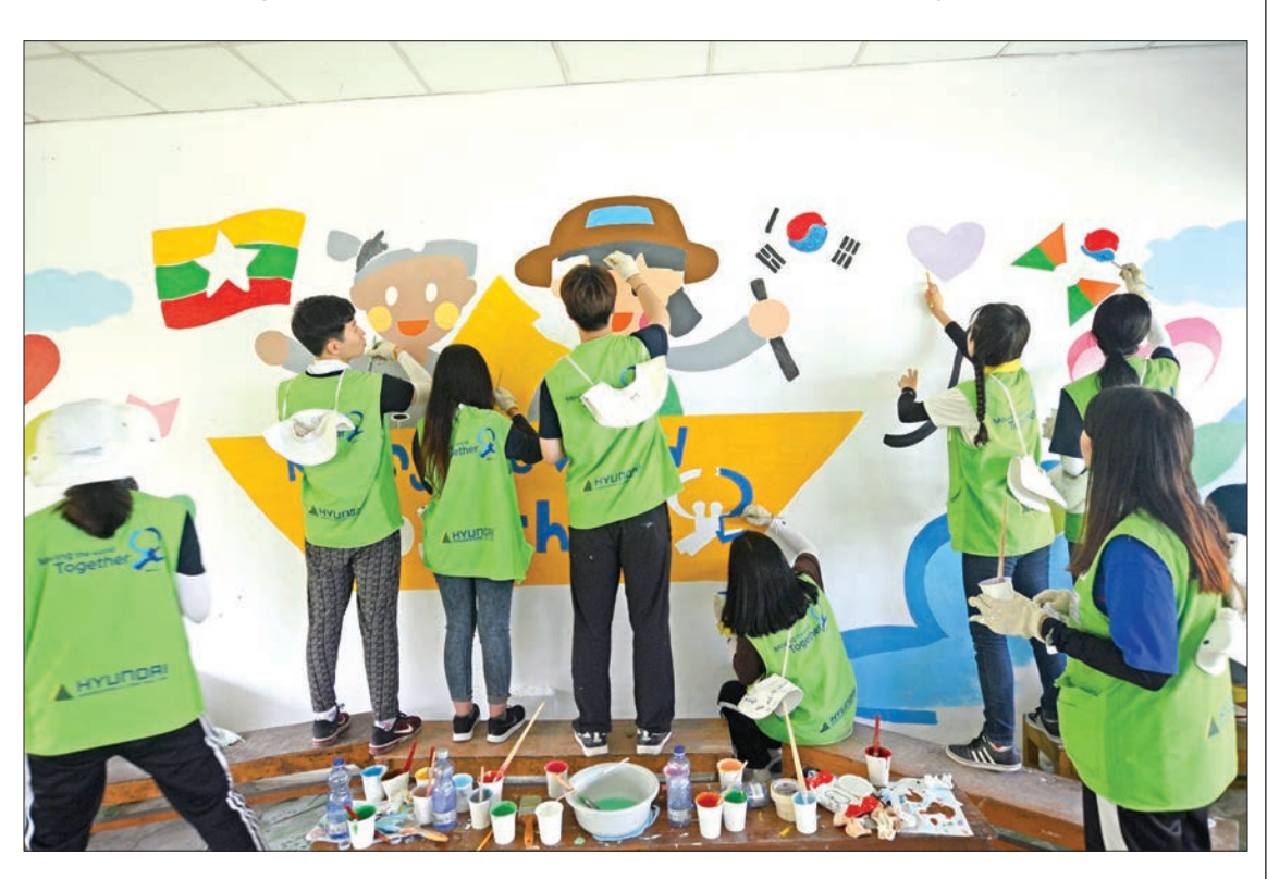
Korean University students paint on the wall at a school in Thakayta Township.

KOREAN university students volunteered their services at three schools in Thakayta Township under a cultural exchange program, and helped repair, paint, create murals, and provide educational services at the institutions.