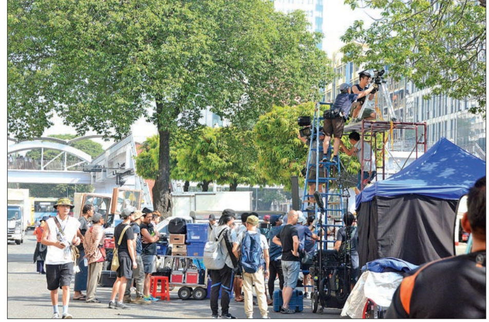
The crew of Line Walker-2 taping a scene from the Hong Kong movie near Sule Pagoda in downtown Yangon.