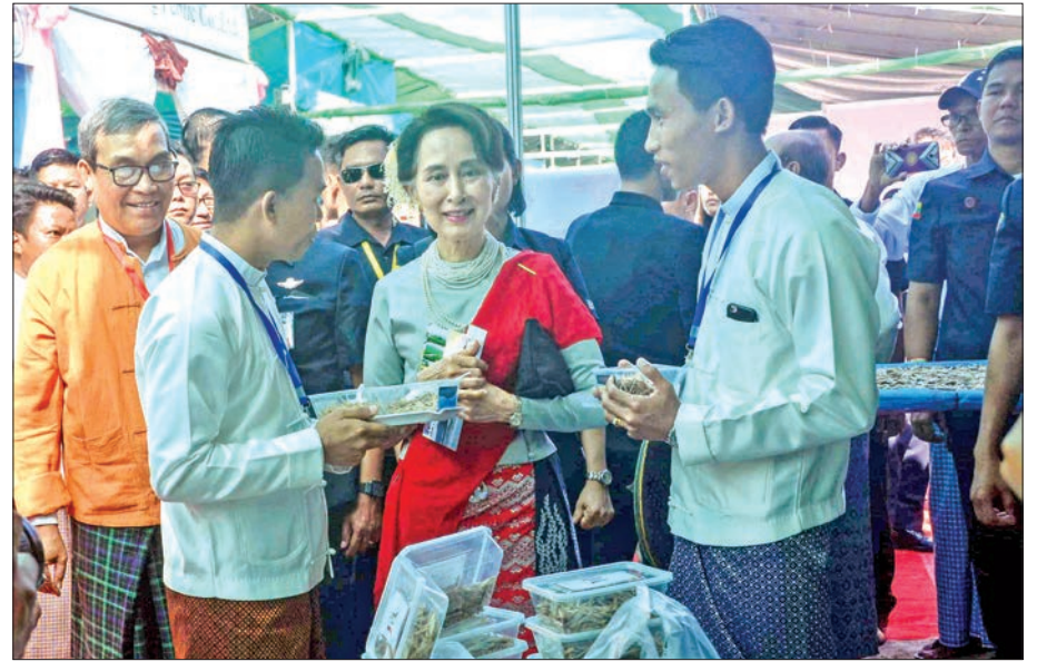
State Counsellor Daw Aung San Suu Kyi observes food displayed at the opening ceremony of Rakhine State Investment Fair (2019) in Ngapali Beach, Thandwe.