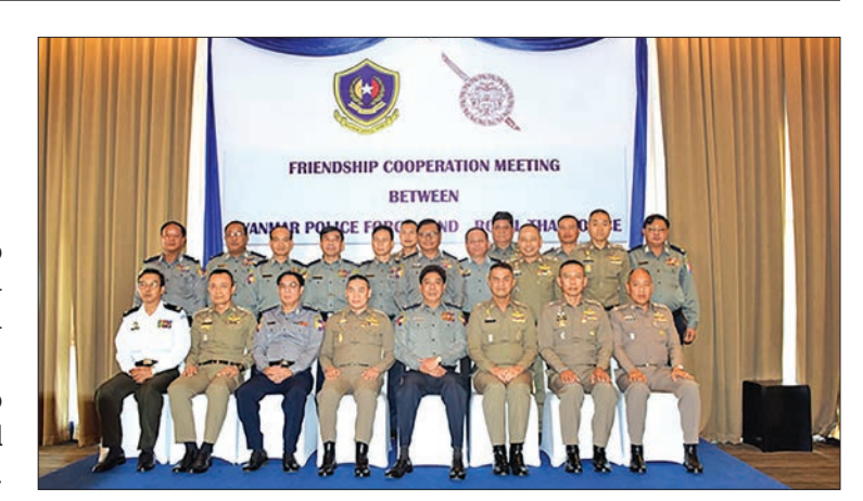
Senior officials of Police Forces from Myanmar and Thailand pose for a photo at the friendship cooperation meeting in Nay Pyi Taw.

After the meeting, the two police forces exchanged gifts and posed for documentary photos. —MNA (Translated by Kyaw Zin Lin)