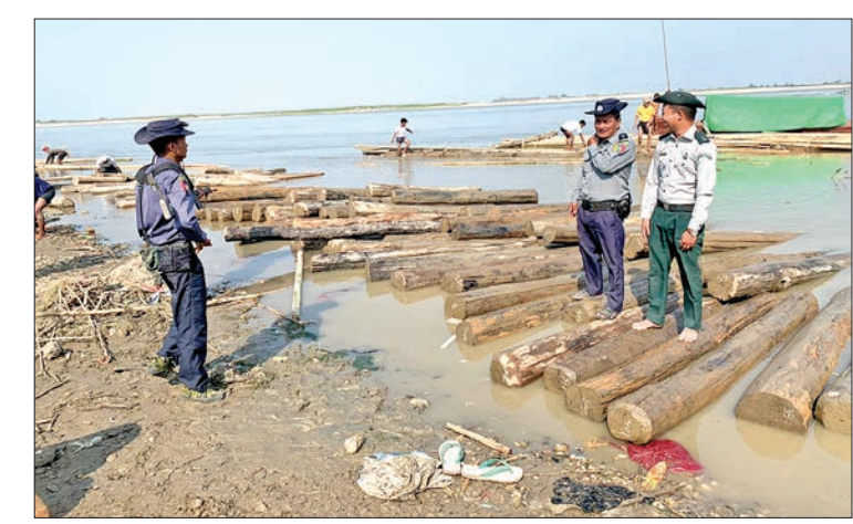
Officials from the Forest Department inspect seized illegal timbers in Katha Township in Sagaing.