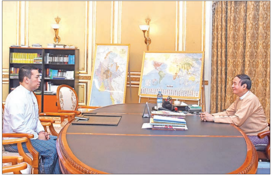
President U Win Myint gives policy guidance to U Thant Sin, Myanmar Ambassador to the Republic of Korea in Nay Pyi Taw yesterday.