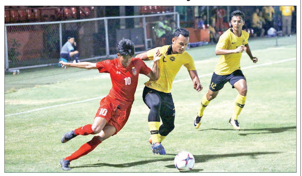
Myanmar (red), Malaysia (yellow) vying for the ball at yesterday's AFF U-22 Championship group match at the RSN Stadium in Phnom Penh, Cambodia.

MYANMAR suffered a narrow 0-1 loss to Malaysia yesterday in the Group B encounter of the AFF U-22 Championship 2019 at the RSN Stadium in Phnom Penh, Cambodia. The match ended Myanmar's chances of advancing to the semi-finals.