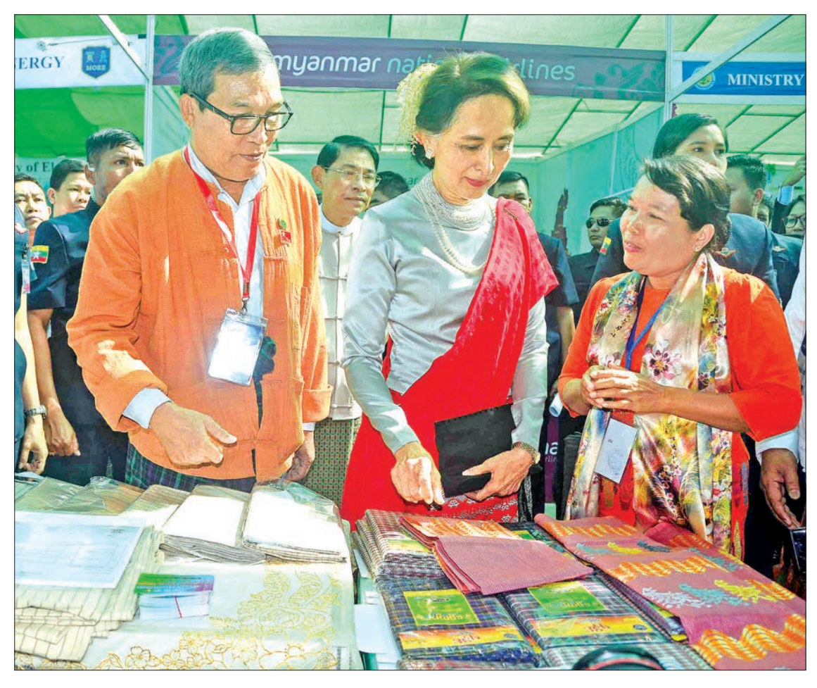
State Counsellor Daw Aung San Suu Kyi observes an exhibition showcasing Rakhine traditional textiles at the opening ceremony of Rakhine State Investment Fair (2019) in Ngapali Beach, Thandwe.

The Rakhine State Investment Fair is held at Ngapali beach in Thandwe, Rakhine State for three days from 21 to 23 February.