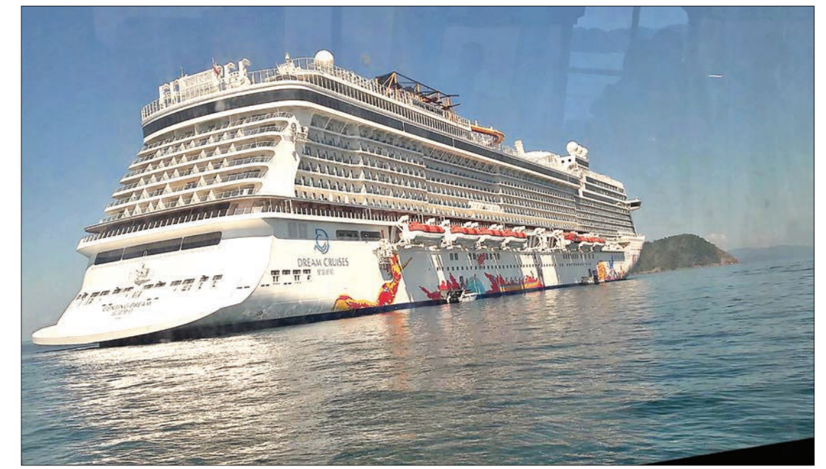
Cruise docked offshore near ship docking in Khayingwa Island.

The tourists visited Khayingwa Island through the Phuket