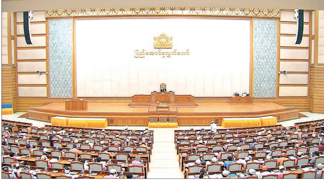
Pyidaungsu Hluttaw is being convened in Nay Pyi Taw.

The efforts of OIC, EU and UNHRC climaxed with the submission of a fact finding mission report on Myanmar to the 39th session of the UNHRC. The Government is urged to counter and respond to this and raise the public knowledge on the mortal