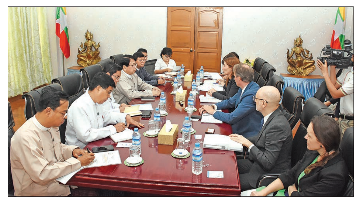
Union Minister Dr. Pe Myint holds talks with EU Ambassador Mr. Kristian Schmidt and EU Trade delegation at the Ministry of Information yesterday.

During the meeting, the Union Minister, the Deputy Minister and the guests discussed press freedom in Myanmar, reviewing process of Ministry of Information for amending some laws related with media, and sending local and foreign media to be able to cover situation in Rakhine State.—MNA (Translated by Kyaw Zin Lin)