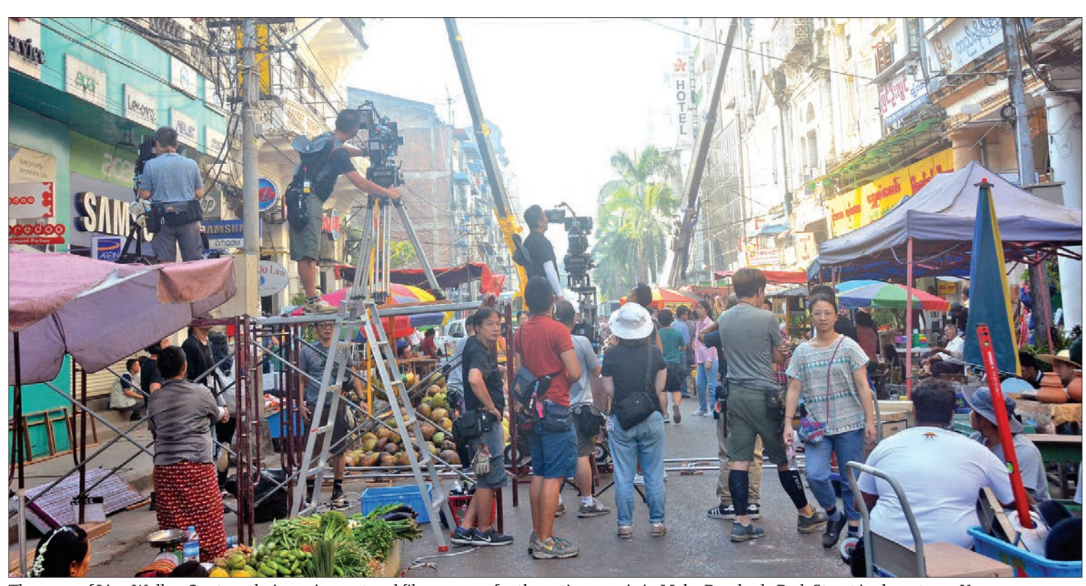
The crew of Line Walker-2 set up their equipment and films scenes for the action movie in Maha Bandoola Park Street in downtown Yangon.