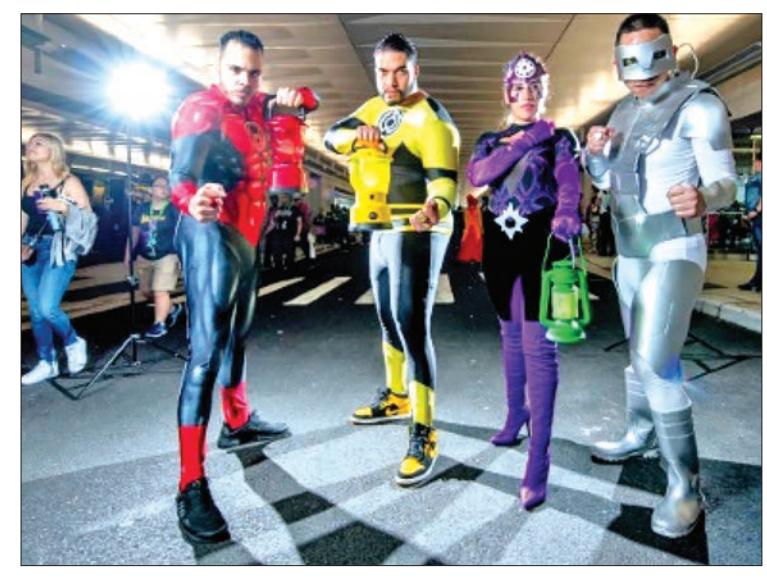
Fans wear DC Comics superhero outfits in New York in October 2018.

He said DC Comics and Vertigo had agreed to relinquish the rights to "Second Coming" and he plans to have it published by another company.—AFP ■