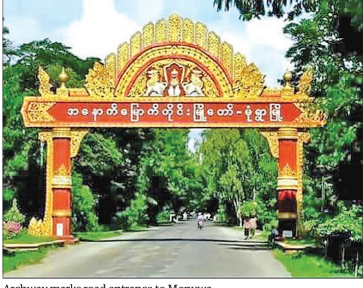
Archway marks road entrance to Monywa.

To raise municipal funds, two municipal staffers have each been assigned five townships, which have District