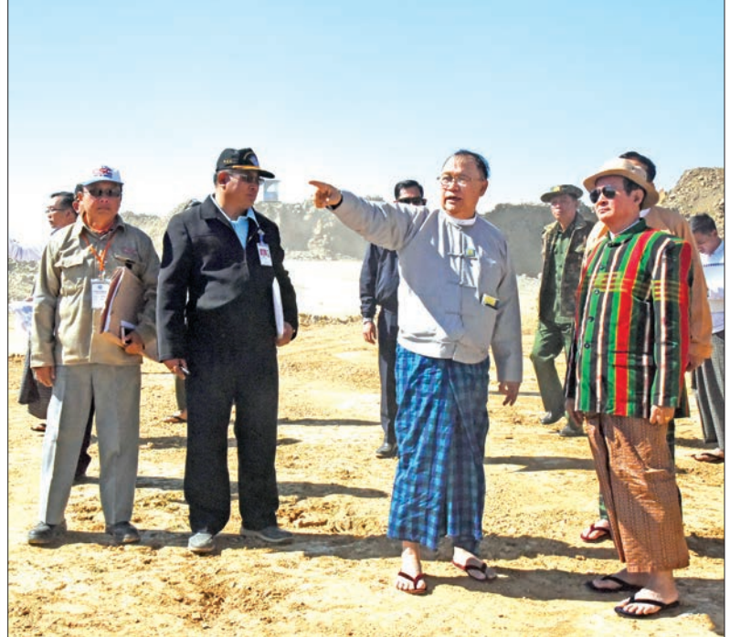
President U Win Myint (Right) inspects the construction of Surbung Airport project in Falam, Chin State.