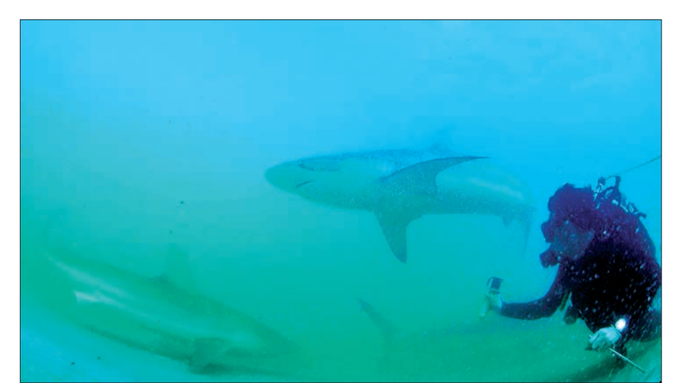
Every winter, as sea temperatures drop, sharks seeking warmer waters head to a northern Israeli shore, drawing enthusiasts hoping for a glimpse of the predators.

The PhD student, researching sharks at Haifa