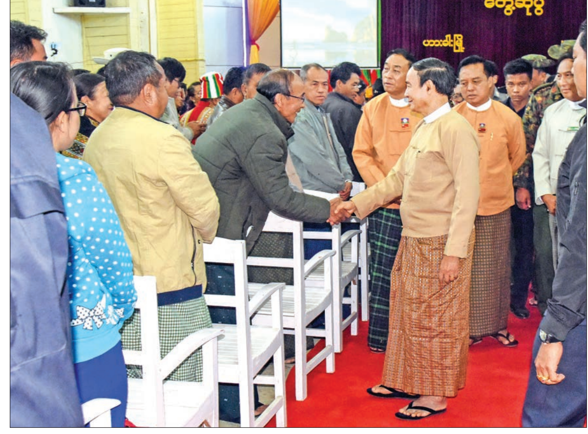
President U Win Myint greets representatives from executive, legislative and judiciary pillars in Chin State yesterday.

The President said the judiciary pillar must be able to hand out unimpeded justice. Section 11 (a) of the Constitu-