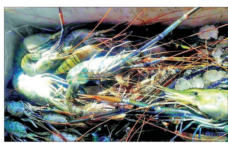
Myanmar's export items to foreign markets include fishery products.

THE bilateral trade between Myanmar and the US totalled US$230 million in the October-December period in the current fiscal, with exports surpassing imports, according to data released by the Ministry of Commerce. In the three-month period in the current FY (Oct 2018-Sep 2019), exports stood at $121.6 million, while imports were recorded at $108.5 million.