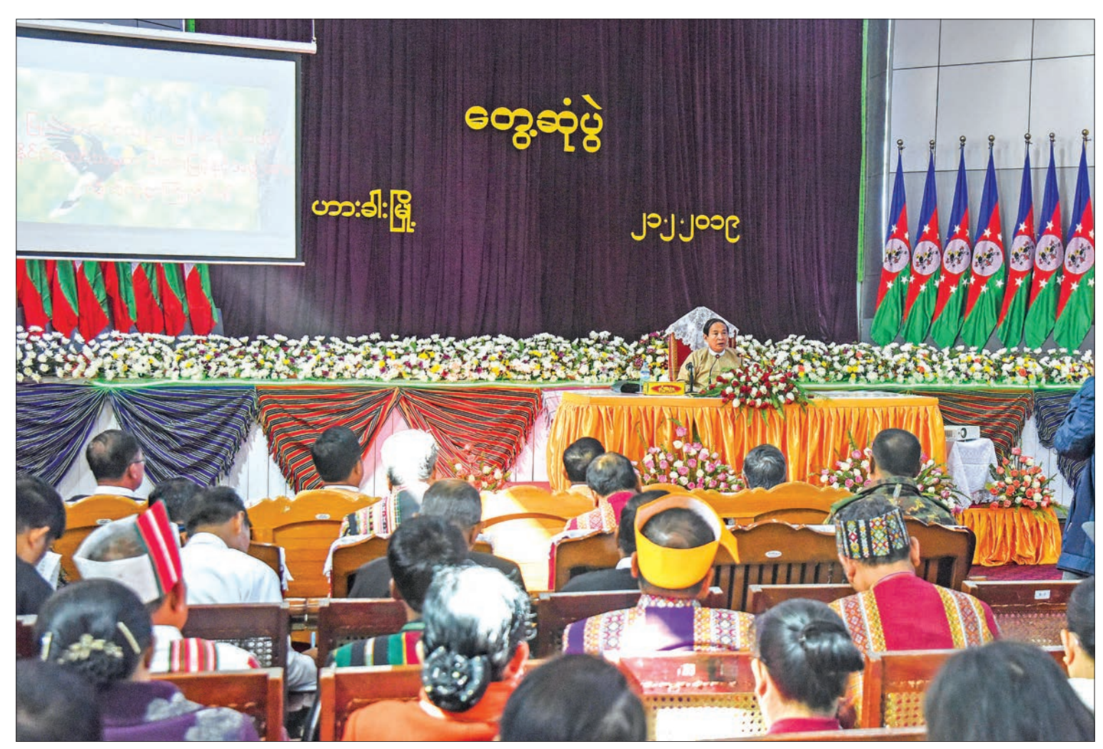
President U Win Myint delivers the speech at the meeting with officials from executive, legislative and judiciary pillars in Chin State.

He said people commonly believe reform is achieved when the government administration changes, but the truth is change needs to be conducted throughout all levels of government for effective reforms to take place. Likewise, the people need to change their mentali-