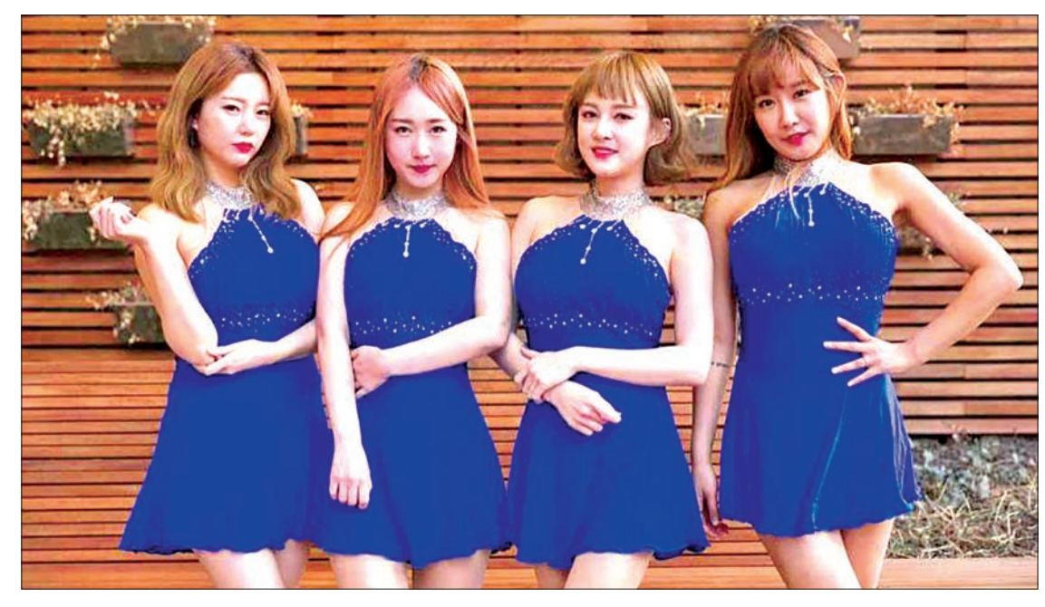
This picture taken on 14 March, 2017 shows K-pop group SixBomb members posing for a photo during an interview with AFP in Seoul. All four members of obscure K-pop outfit SixBomb went through extensive plastic surgery, from nose jobs to breast implants, before releasing their new single on 16 March.

The guidelines from the ministry of gender equality drew criticism online — and also from a lawmaker who said it was reminiscent of censorship during the country's period of authoritarian government which ended in 1980s.