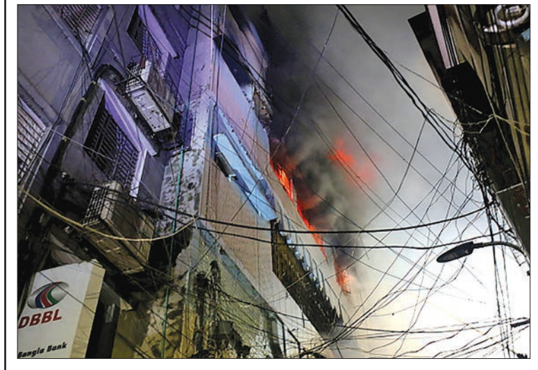
Fire-fighters try to control fire at Chawkbazar, old part of Dhaka city, Bangladesh on 21 February, 2019.

Flames were mostly under control early Thursday after firefighters worked through the night, The Associated Press reported, quoting an official of the Fire Service and Civil Defence in Dhaka as saying that many victims had been trapped under buildings.—Kyodo News ■