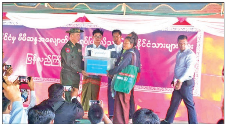
Kayin State Minister of Security and Border Affairs Colonel Myo Min Naung provides aids to the Myanmar nationals returned from Thailand.

The Government of the Republic of the Union of Myanmar and the Government of the King-