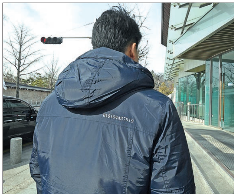
This picture taken on 18 February, 2019 shows 12 digits — 615104427919 — sewn onto the back of a jacket of one of South Korea's presidential house staff members, on the street outside the presidential Blue House in Seoul.