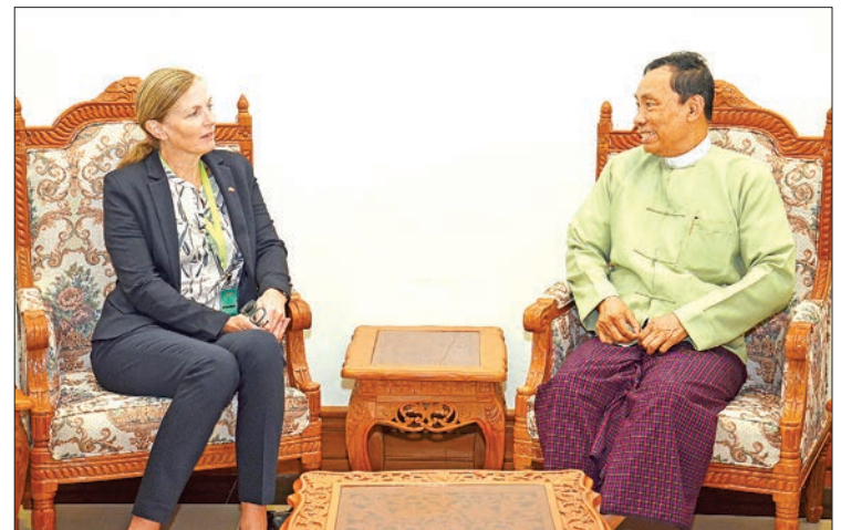
Thura U Shwe Mann meets with Norwegian Ambassador Ms. Tone Tinnes at the Hluttaw Building in Nay Pyi Taw.

During the meeting, they exchanged views and openly discussed the matters related to legal affairs, bilateral relations affairs and bilateral cooperation between the two nations. — MNA (Translated by Kyaw Zin Tun)