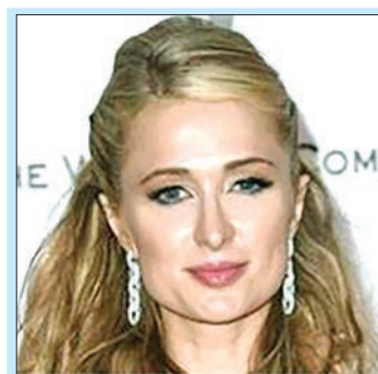
Paris Hilton.