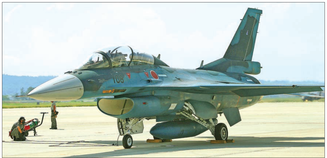
An F-2 fighter jet.

Critics say Pyongyang has made no concrete commitments so far and is unlikely to surrender its nuclear weapons. —AFP ■