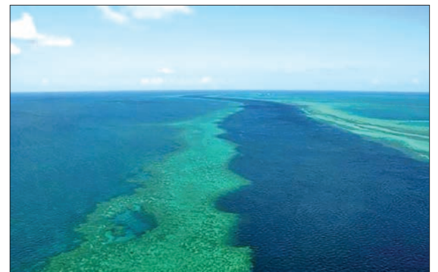
The rat-like Bramble Cay melomys lived on a tiny island at the top of the Great Barrier Reef and had not been seen in a decade.

Australia’s environment ministry on Tuesday said it had officially trans-