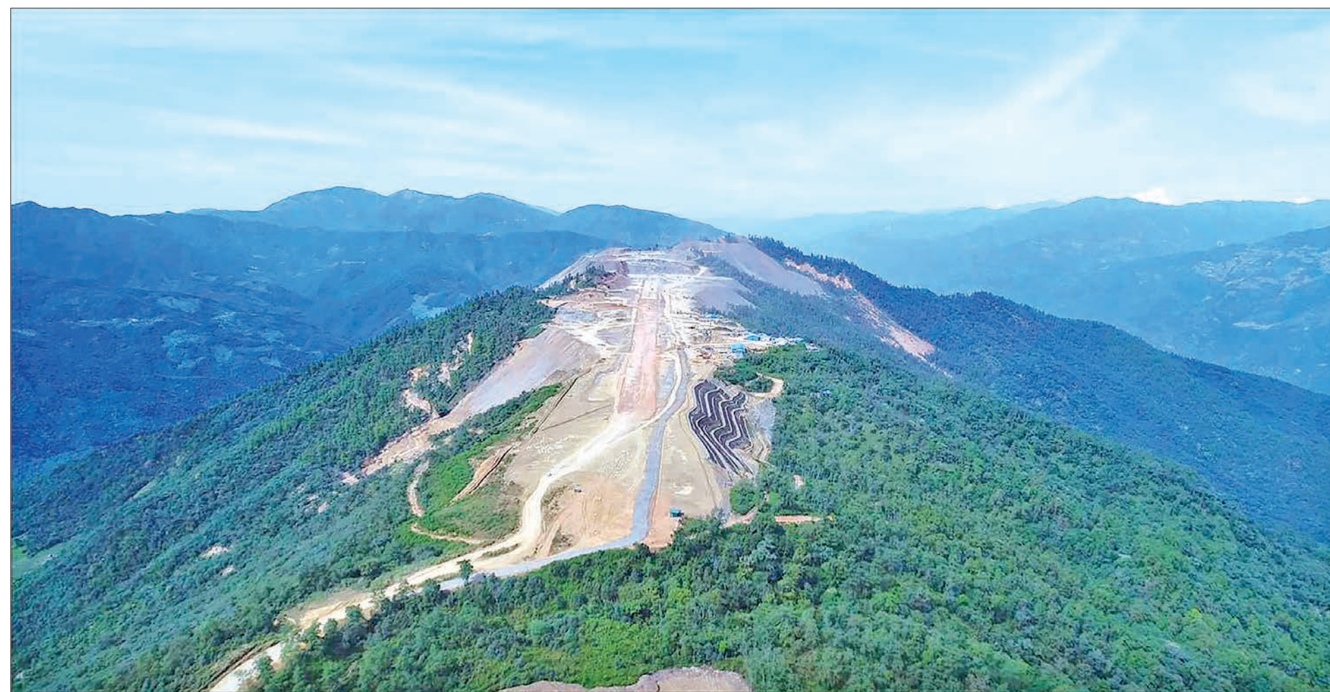
An aerial view Surbung Airport that is currently under construction in Falam, Chin State.

A field study of the map of the airport project area, an old airport used during the World War II, regional situation and requirements have already been conducted. Moreover, an aerial survey of the perimeter in connection the limits in the aviation sector have also conducted with a Caravan Cess-