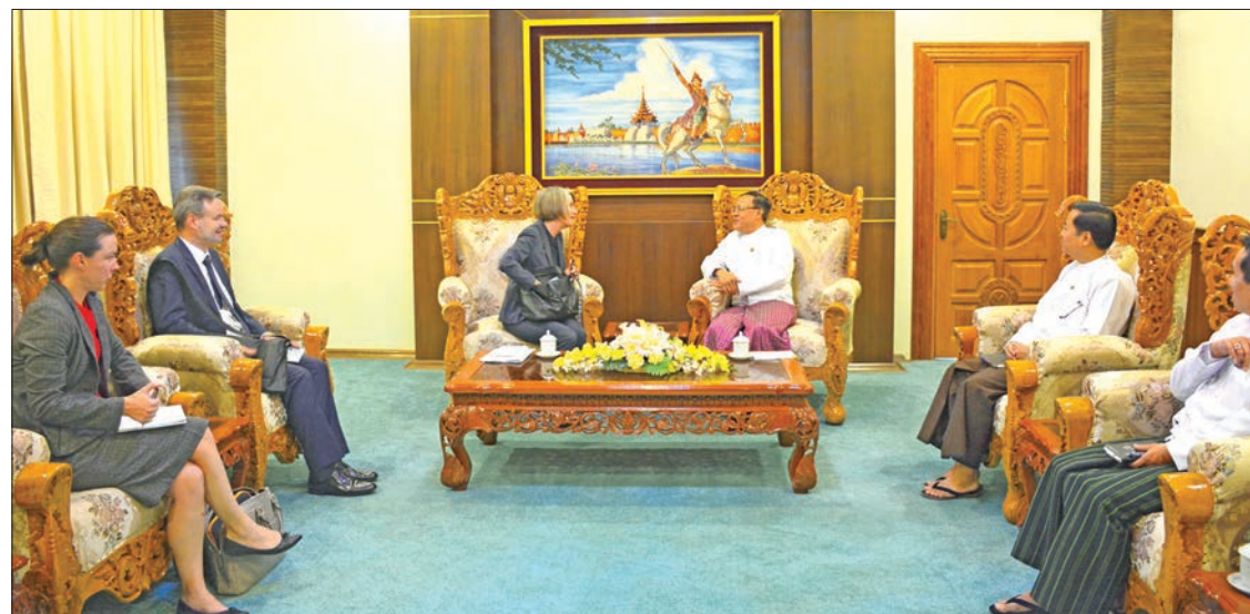
Union Minister U Kyaw Tin meets Australian Ambassador Ms. Andrea Faulkner in Nay Pyi Taw.

Myanmar's democratization process, potential areas of bilateral cooperation such as education, eradication of narcotic drugs and prevention of human trafficking.—MNA