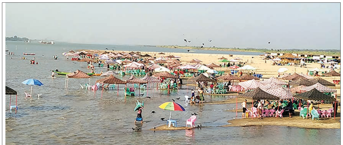
Nyaung Chaungtha beach in Nyaungdon attracts visitors in summer.

“The Nyaung Chaungtha Inland beach, which was first