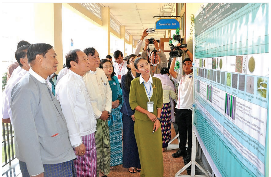
Union Minister Dr. Myint Htwe looks at a research poster displayed at the 9th Traditional Medicine Research Congress in Mandalay yesterday.

The Union minister urged the authorities to invite traditional medicinal practitioners from foreign countries including neighbouring countries in next congress, stressing the need to