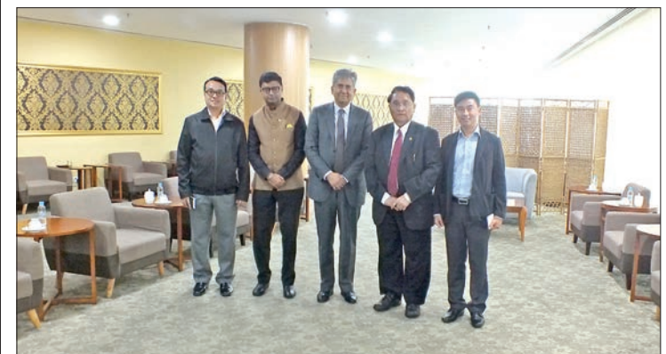
Union Minister Dr. Than Myint departs from Yangon to attend 4 th ASEAN-India Expo and Summit yesterday.

UNION Minister for Commerce Dr. Than Myint left Yangon for New Delhi, India by air to attend 4 th ASEAN-India Expo and Summit that will be held on 21 to 23 February in New Delhi.