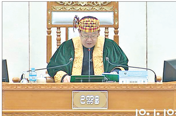
Speaker of Pyithu Hluttaw U T Khun Myat.