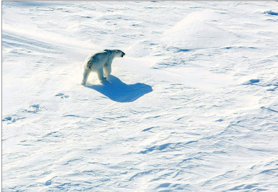
Officials has declared a state of emergency a week ago.

MOSCOW, (Russia) — An “invasion” of aggressive polar bears in inhabited areas of Arctic Russia has come to an end, officials said Tuesday, ten days after the animals came to the area looking for food.