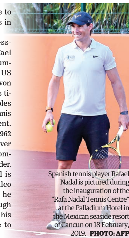
Spanish tennis player Rafael Nadal is pictured during the inauguration of the "Rafa Nadal Tennis Centre" at the Palladium Hotel in the Mexican seaside resort of Cancun on 18 February, 2019.

Mexico's most successful ever player was Rafael Osuna, a former world number one who claimed the US Open title in 1963. He also won three Grand Slam doubles titles and the Olympic doubles gold medal in 1968 when tennis was a demonstration event. He helped Mexico to the 1962 Davis Cup final, their only ever appearance in the team competition championship decider. World number two Nadal is due to play in the Acapulco Open next week, an event he has won twice before although he had to pull out before his first match last year due to injury.—AFP ■