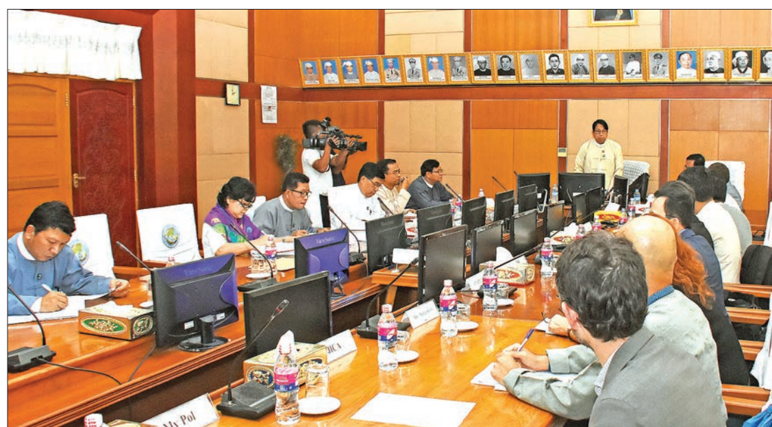
Union Minister Dr. Pe Myint delivers the speech at the meeting with media representatives from UNESCO, IMS/Fojo, Internews, BBC Media Action, JICA, DW Akademie and My Pol in Nay Pyi Taw.