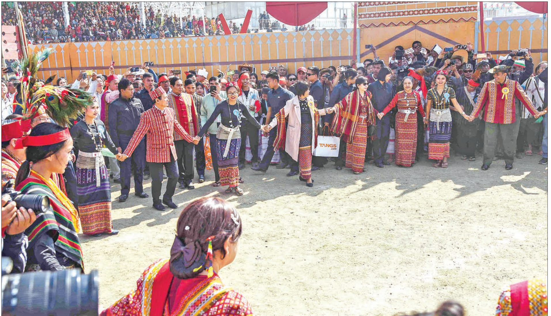
President U Win Myint and First Lady Daw Cho Cho participate in the Chin traditional performance at the 71 st Anniversary of Chin National Day in Haka, Chin State.