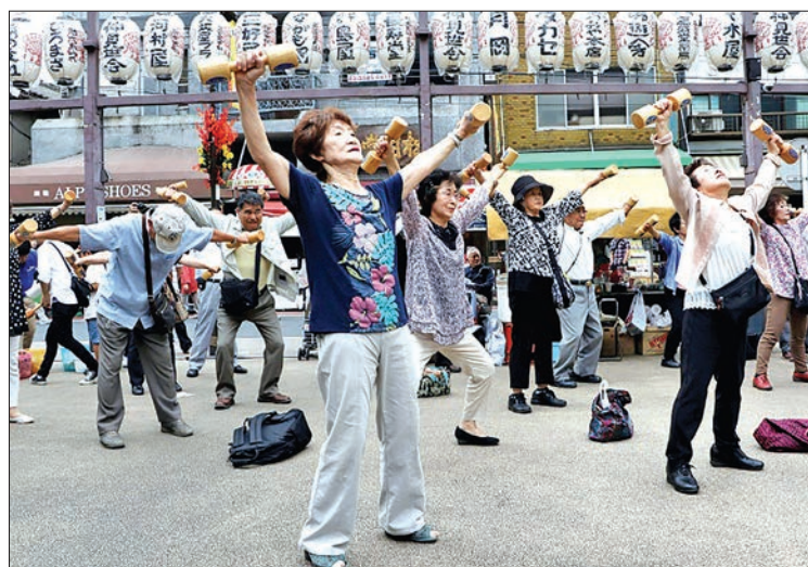
The Ashitaba plant appears to induce a key process that helps remove 'cellular garbage' that can build up as cells age.

TOKYO (Japan)—In Japan, the slightly bitter leaves of the Ashitaba plant have long been considered healthy, and a new study has found the traditional belief may have good scientific grounds.