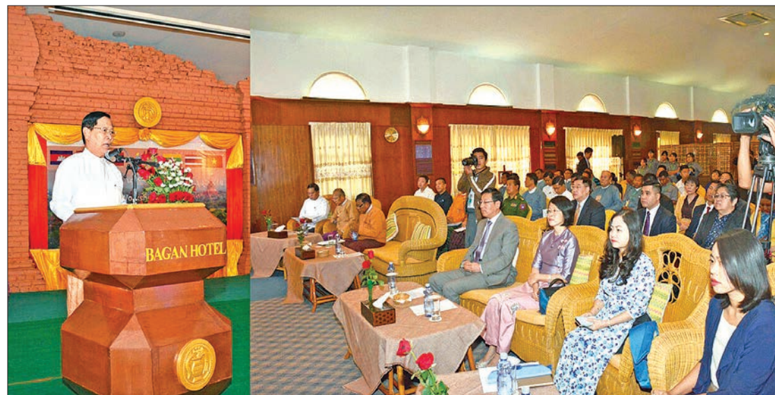
Union Minister Thura U Aung Ko delivers a speech at workshop in Bagan.