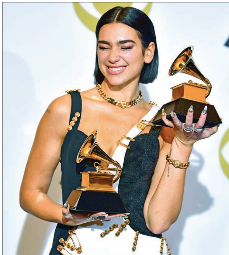
Singer Dua Lipa poses with her awards for Best New Artist and Best Dance Recording “Electricity” in the press room during the 61st Annual Grammy Awards on 10 February, 2019, in Los Angeles.

Anne-Marie, who shot to fame as the vocalist on Clean Bandit’s worldwide hit “Rockabye”, is nominated for four awards, including for the Britney Spears inspired video to “2002”,