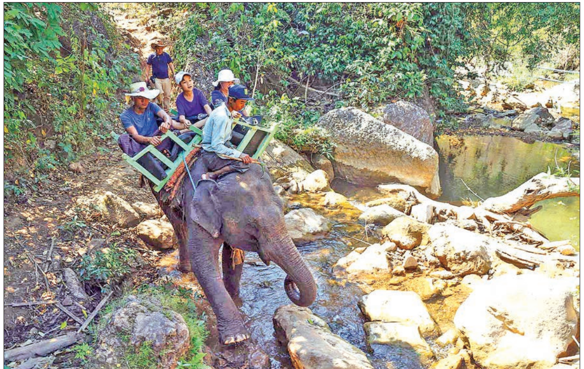
Visitors enjoy elephant ride at Shan Yoma elephant camp.

“At present, visitors can ride elephants, watch and help them bathe, and observe the daily life of elephants and the mahouts