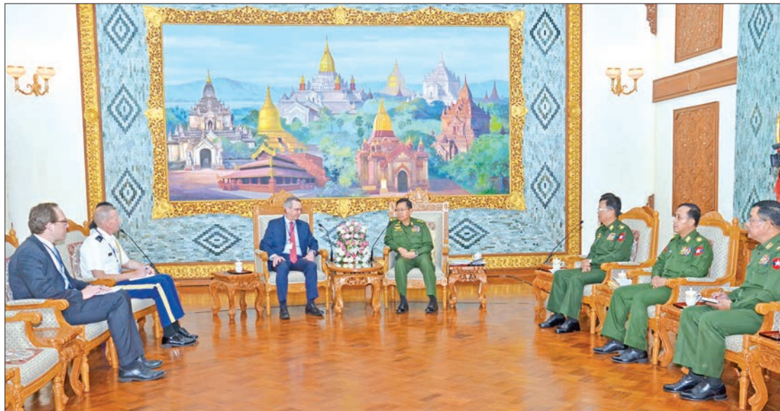
Vice Senior General Soe Win holds talks with US Ambassador Mr. Scot Marciel at the Bayintnaung Guest Hall in Nay Pyi Taw.

DEPUTY Commander-in-Chief of Defence Services Commander-in-Chief (Army) Vice Senior General Soe Win received Mr. Scot Marciel, Ambassador of the United States of America, yesterday morning, at the Bayintnaung Guest Hall in Nay Pyi Taw.