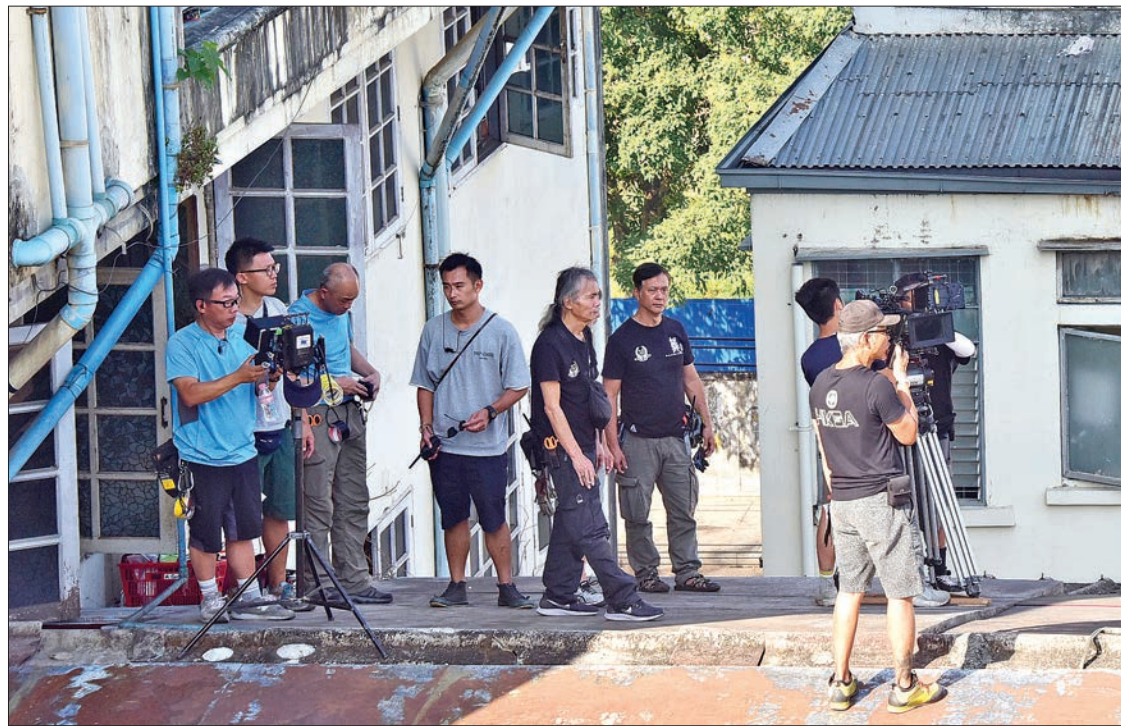
Film crew of Line Walker-2 taping a scene from the Hong Kong movie on top of a roof of the YMCA building on Theinbyu Road in Yangon yesterday.

"I also want to point out that our roads have traffic jams even before this Hong Kong movie came to film here. There are alternative routes provided. I don't want people to be pointing blame at this fact and failing to see the many positive benefits this film is bringing to Myanmar."