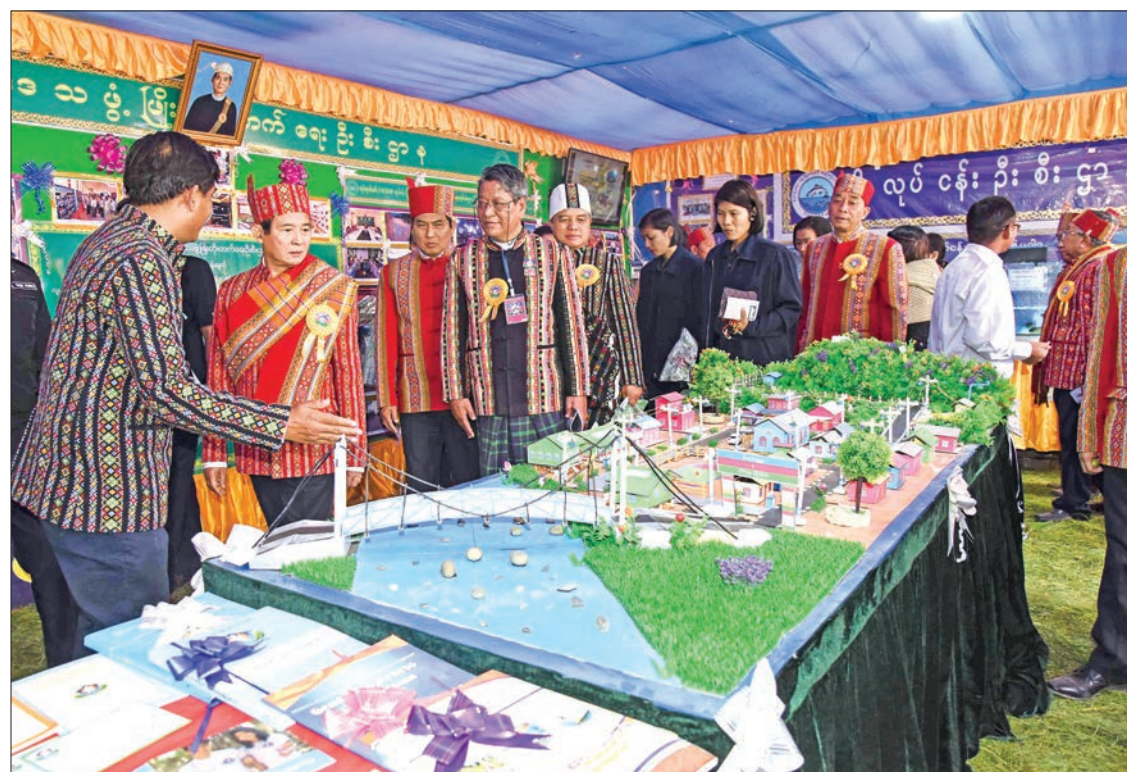
President U Win Myint looks around the departments' booths to mark 71 st Anniversary of Chin National Day in Haka, Chin State yesterday.

Later in the evening, the President, First Lady, and entourage attended the bonfire ceremony, with traditional dances, held in the compound of the state Hluttaw building. —MNA