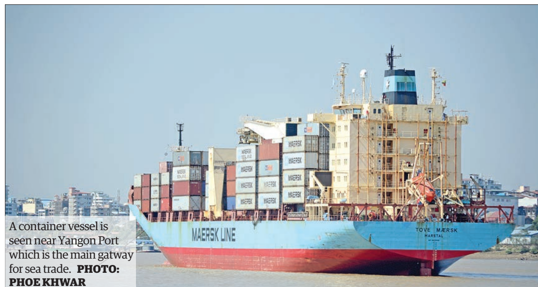
A container vessel is seen near Yangon Port which is the main gateway for sea trade.