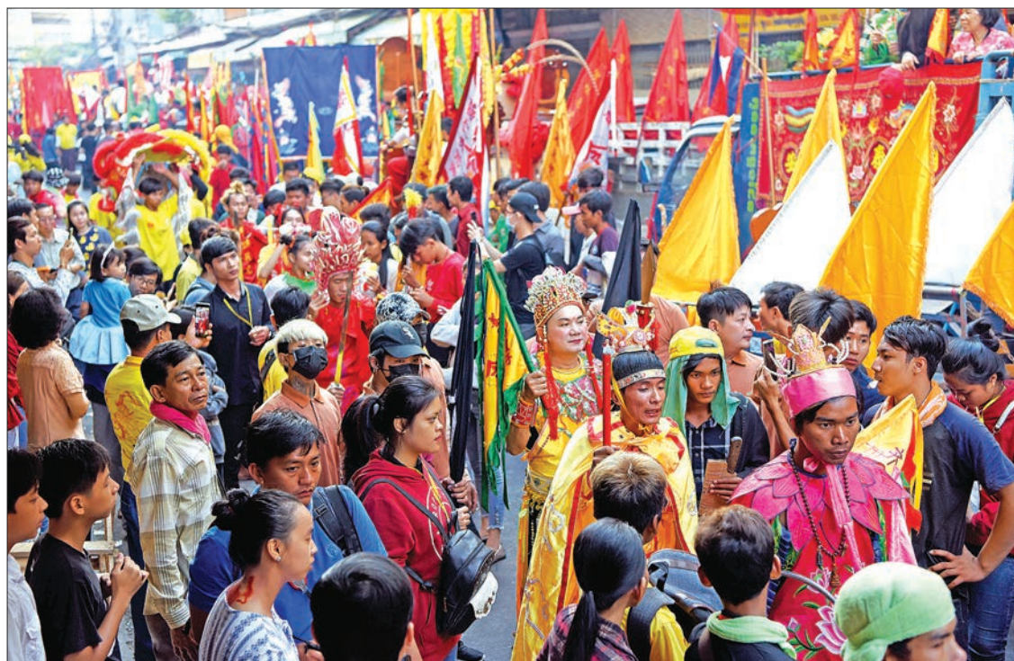
Mediums participate in the Hei Neak Ta or Spirit Parade in Phnom Penh on 19 February, 2019. The parade marks the end of Lunar New Year celebrations.

PHNOM PENH (Cambodia)—Spirit mediums in headdresses and lurid make-up, their cheeks pierced by needles and tongues cut by knives, led a striking procession on Tuesday through the Cambodian capital to mark the end of Chinese New year.