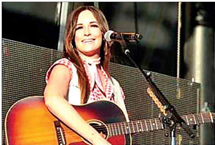
US singer-songwriter Kacey Musgraves.

LOS ANGELES — Singer-songwriter Kacey Musgraves has been added to the list of people who will be presenting the trophies to the winners at the upcoming 91 st Academy Awards.