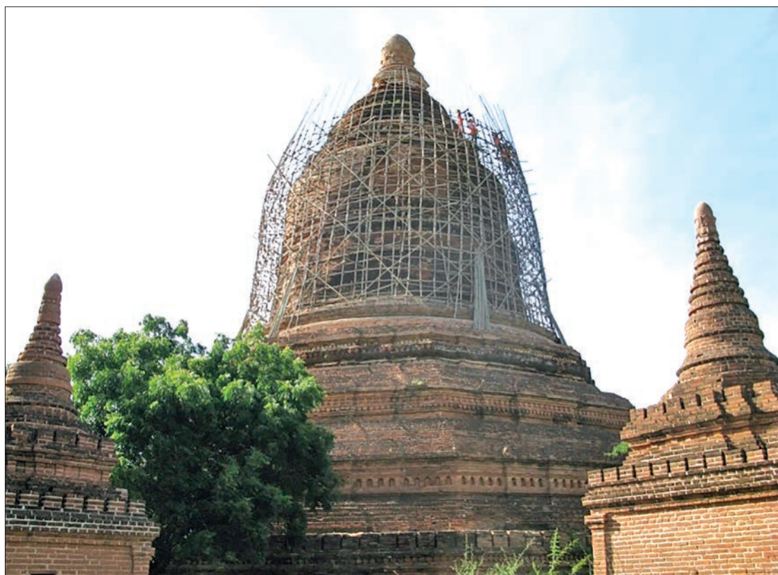
Restoration of an ancient temple in Bagan.

The meeting was concluded after the State Counsellor and Chairperson of the Steering Committee on implementation of BRI gave additional comments and guidance on the discussions.—MNA