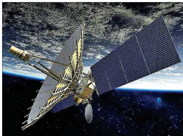
Spektr-R space radio telescope.

Attempts to establish control with the satellite are being made on a regular basis: scientists send a signal to Spektr-R, which is being ping-ponged and received by stations in Moscow region’s Pushchino, Ussuriiskoye in Russia’s Far East and Green Bank