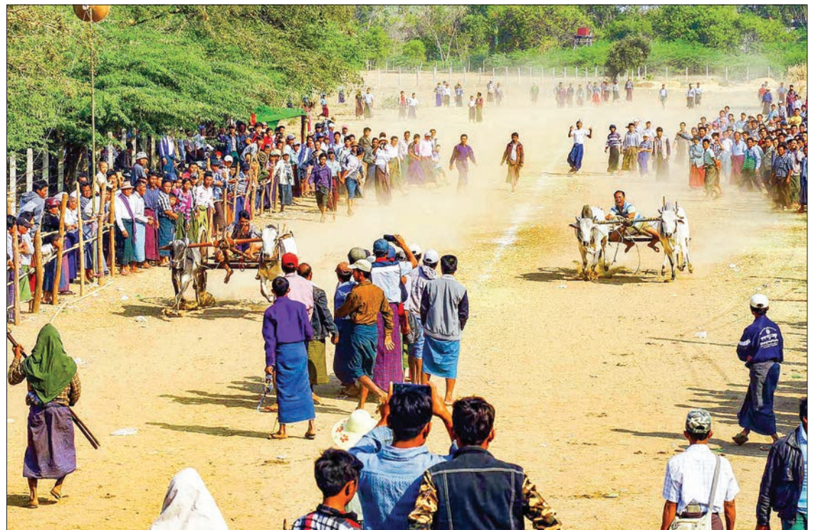
Bullock cart races are held during Wundwin Myat Nyi Naung pagoda festival.

The bullock cart race at the Myat Nyi Naung pagoda festival is famous in Meiktila District. This is the reason why local people from Kyaukse District are participating in the bullock cart race. The