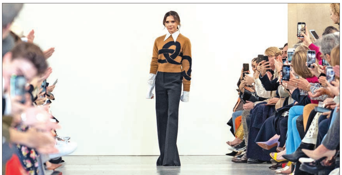
British designer Victoria Beckham acknowledges the crowd during her 2019 Autumn / Winter collection catwalk show at London Fashion Week in London on 17 February, 2019.

signer said she wanted to accentuate “lots of colour, lots of pattern” in her collection, with a bold palette ranging from ab-sinthe green to lipstick red, dusty pink to pale teal. Tweeds, wools and silks were “matched and mismatched”, in everything from blazers and trousers to sweaters and scarves, alongside a plethora of high-heeled boots, closed or open-toed. “Throughout, there is a celebration of the inherent femininity of dresses — ideas of their past, and proposals for the future,” the designer explained in her show notes. Despite being a respected figure in the fashion landscape, Beckham is still sailing in troubled financial waters, with losses rising to £10.3 million ($13.3 million, 11.7 million euros) for 2017, according to figures published in December.—AFP ■