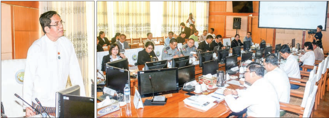
Deputy Minister U Aung Hla Tun delivers the speech at the preliminary coordination meeting on copyright forum.

A PRELIMINARY coordination meeting to hold a forum on copyright was held at the meeting hall of Ministry of Information in Nay Pyi Taw yesterday morning.