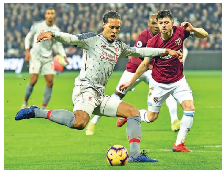
Liverpool's Dutch defender Virgil van Dijk (c) plays the ball during the English Premier League football match between West Ham United and Liverpool at The London Stadium, in east London on 4 February, 2019.

The Frenchman moved to 5-2 and saved a break point a game later as he closed out victory.—AFP ■