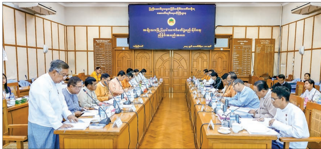
Coordination meeting of National Urban Committee - NUC in progress.

IN a bid to design national urban policies, authorities discussed setting up a National Urban Committee - NUC during a co-ordination meeting held at the Ministry of Construction in Nay Pyi Taw yesterday.