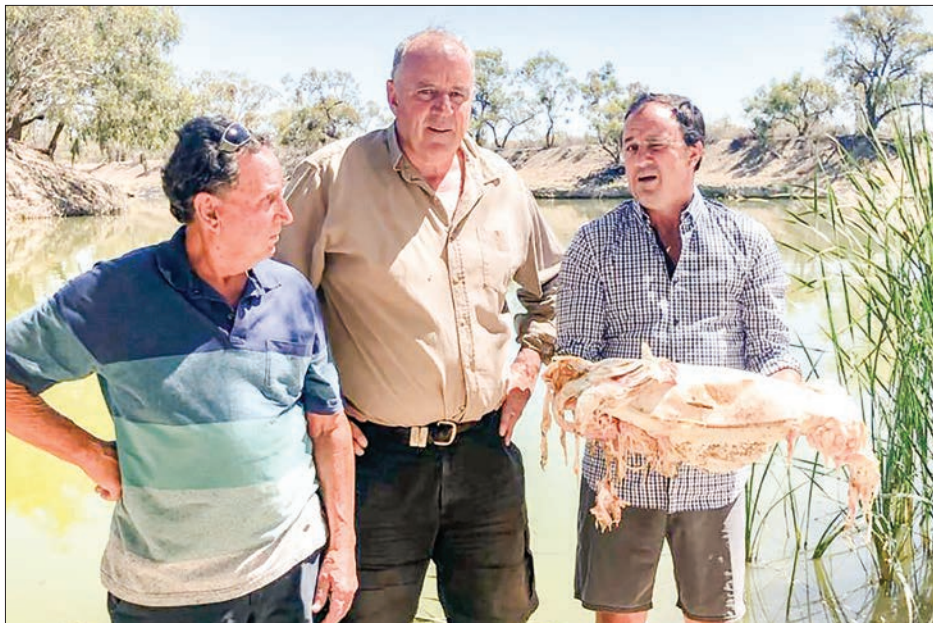
This decades-old Murray cod was among millions of fish which died in mass kills in December and January in the Darling river.

“Our review of the fish kills found there isn’t enough water in the Darling system to avoid catastrophic outcomes,” said Craig Moritz, chair of the independent expert pan-