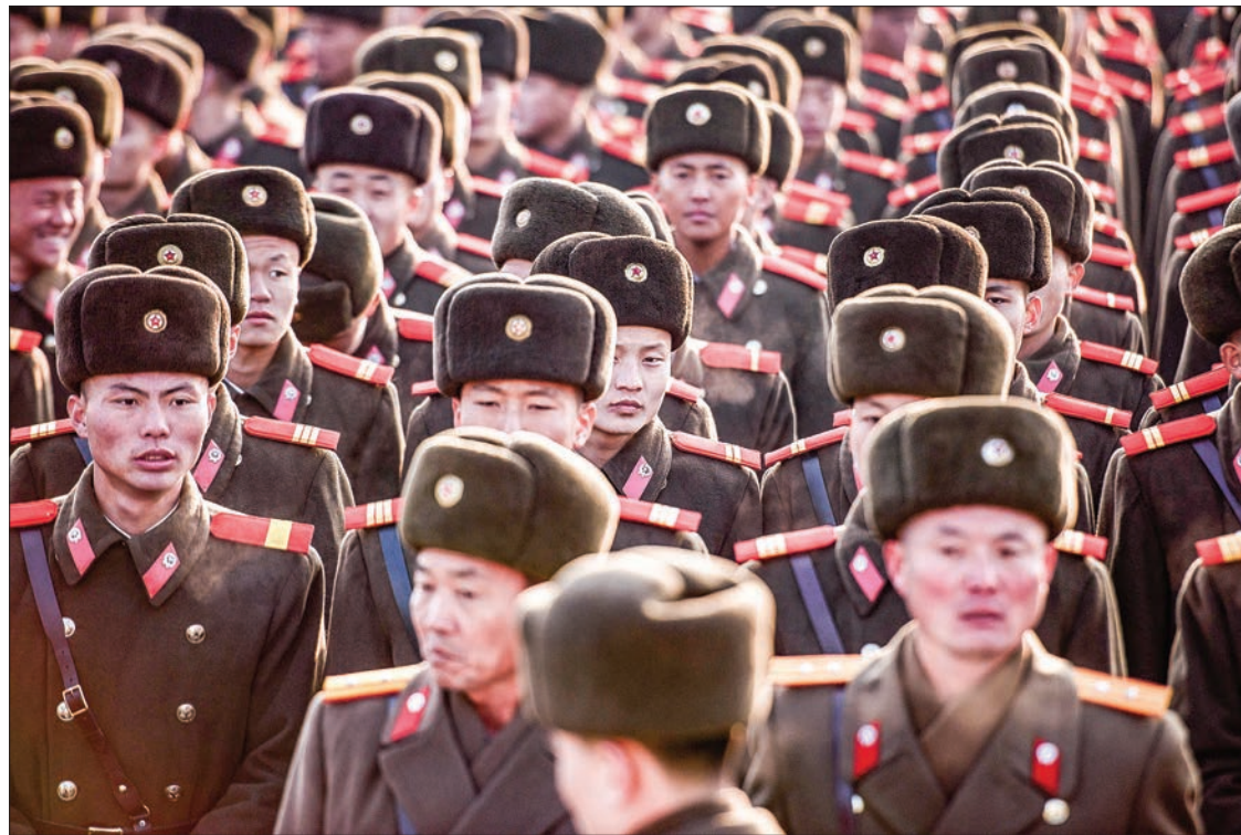
Korean People's Army (KPA) soldiers gather as they prepare to pay their respects before the statues of late North Korean leaders Kim Il Sung and Kim Jong Il as part of celebrations marking the birthday of late North Korean leader Kim Jong Il, known as the 'Day of the Shining Star', on Mansu hill in Pyongyang on 16 February, 2019.

“He may surprise some but he won’t surprise me, because I have gotten to know him &