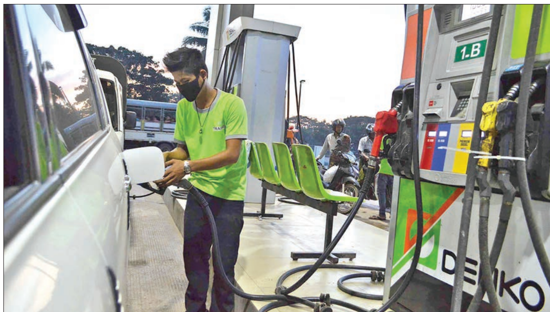
An employee at a fuel station fills up a car with fuel.

LOCAL fuel prices, which had been stable for a month, are on the rise in the market, according to taxi drivers.