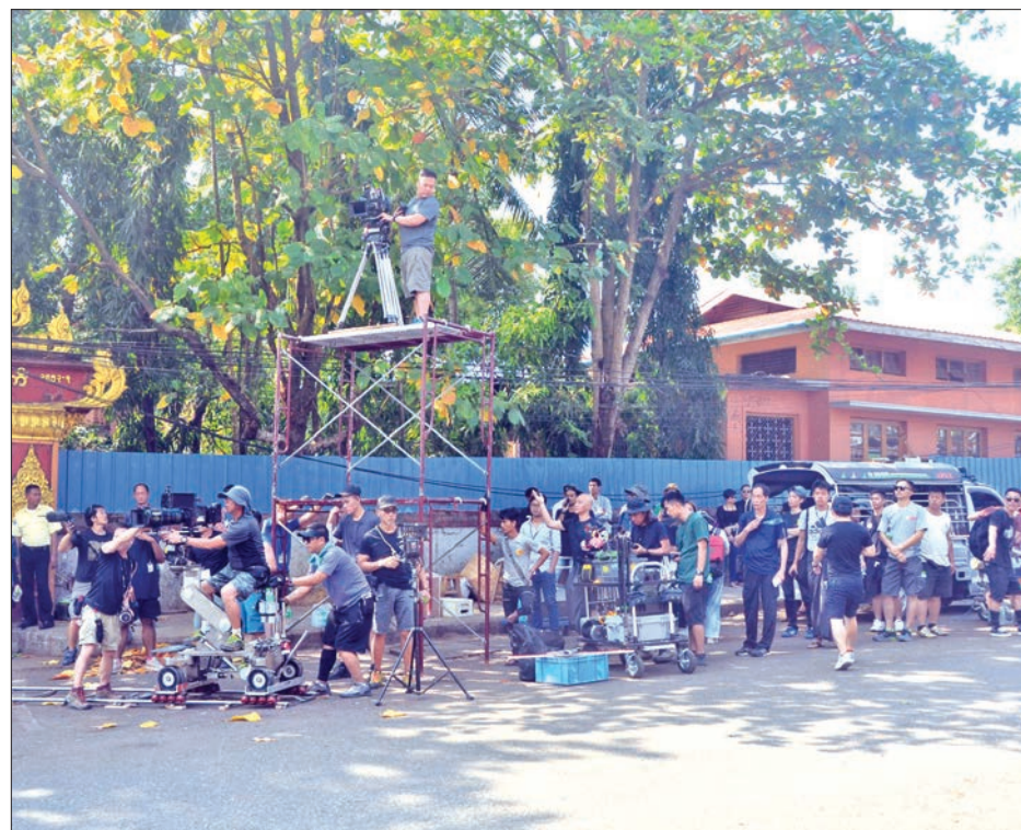
Film crew of Line Walker-2 set up camera equipment near the eastern entrance of Shwedagon Pagoda for filming a scene for the movie.