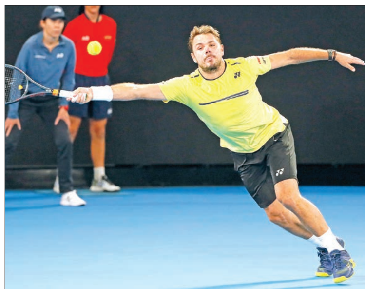
Switzerland's Stanislas Wawrinka plays a forehand return to Canada's Milos Raonic during their men's singles match on day four of the Australian Open tennis tournament in Melbourne on 17 January, 2019.

ROTTERDAM (Netherlands) — Gael Monfils defeated good friend Stan Wawrinka 6-3, 1-6, 6-2 on Sunday to win his eighth career title at the Rotterdam Open.