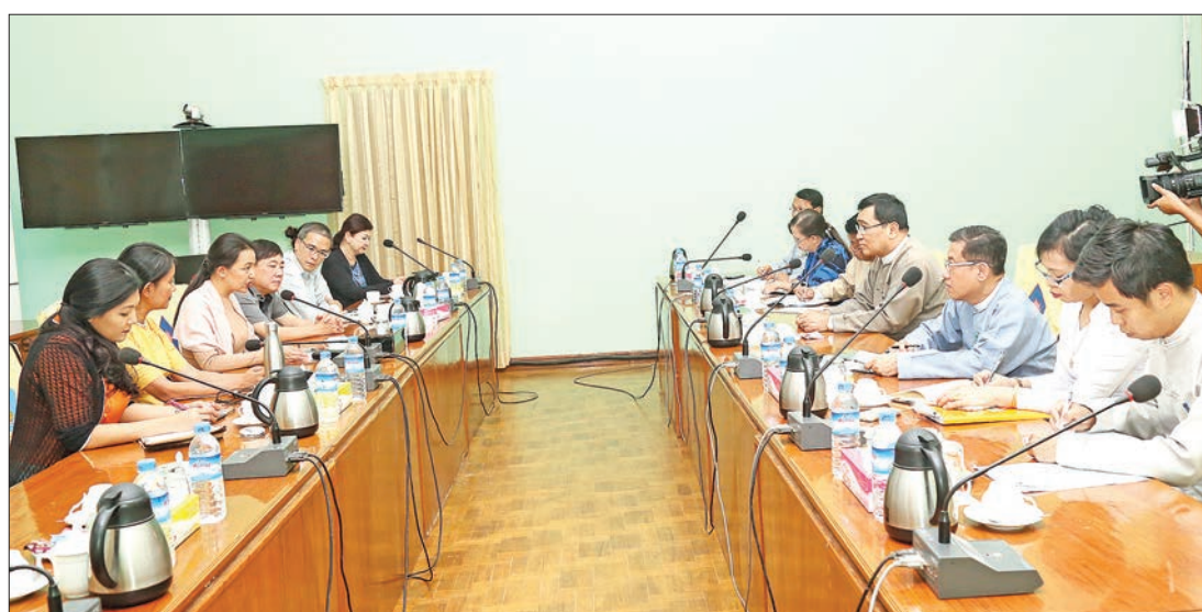
Union Minister Dr. Win Myat Aye holds talks with Asia Philanthropy Circle - APC representatives yesterday.

DR. WIN MYAT AYE, Union Minister for Social Welfare, Relief and Resettlement, received representatives from Asia Philanthropy Circle - APC at his ministry yesterday. The APC is currently working together with the International Relations