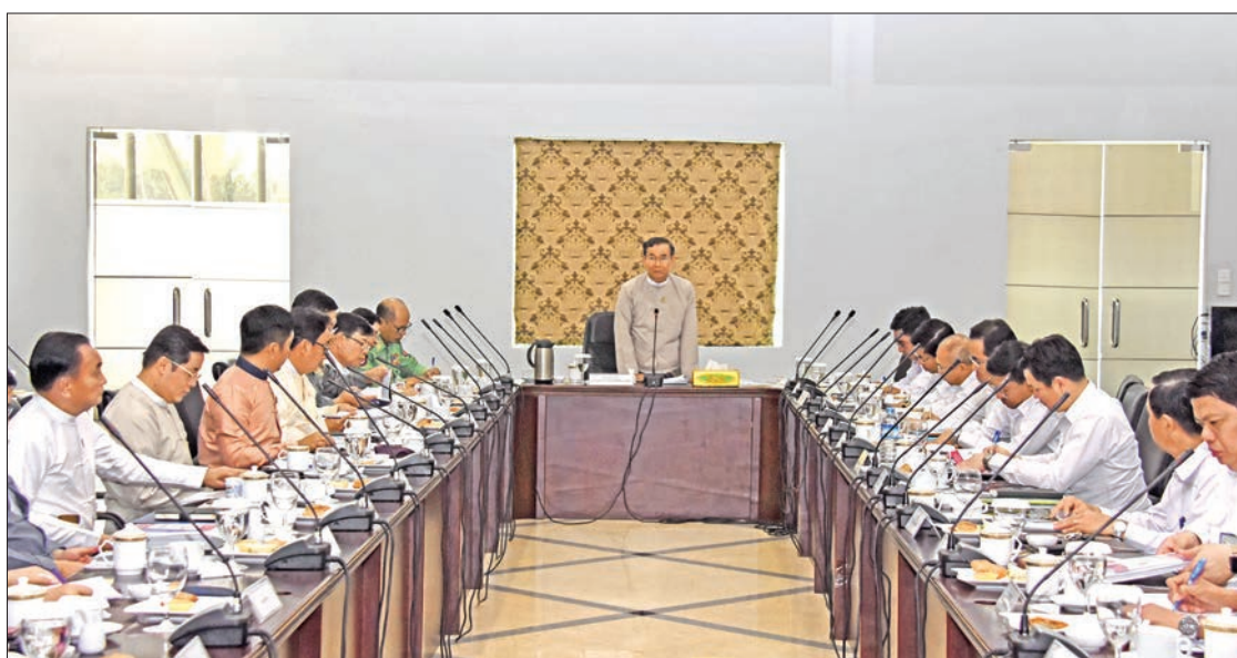
Union Minister U Ohn Win delivers a speech at Myanmar Gem Emporium Central Committee meeting in Nay Pyi Taw yesterday.

First, Central Committee Chairman Union Minister for Natural Resources and Environmental Conservation U Ohn Win said Myanmar Gem Emporium Central Committee had formed work committees and through the management of the central committee and efforts of the work committees, successes were achieved in the past emporiums. Gem business owners and gem merchants coming to buy the gem lots are to follow the emporium rules and regulations and past emporiums' strengths are to be maintained while weaknesses are to be improved.