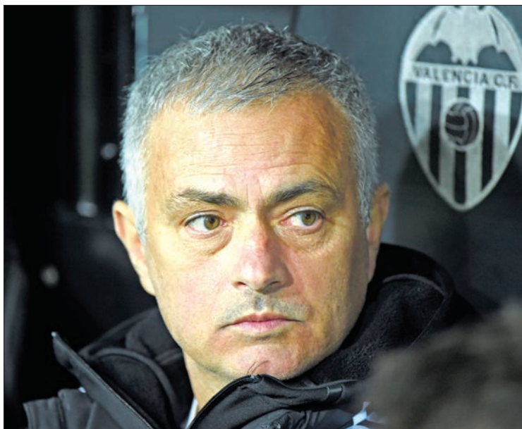
Jose Mourinho.

"I like to learn all the time, to work in a different league would be a fantastic experience. (At the moment) I'm calm, I'm trying to enjoy life with family and friends and calmly working to hopefully find another opportunity in football."