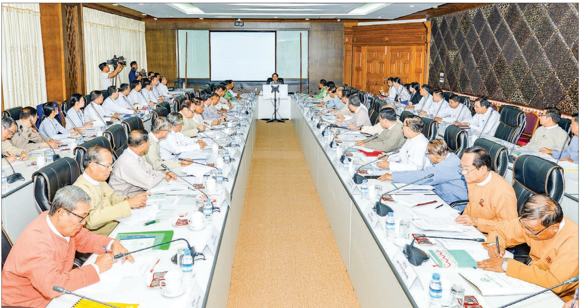
State Counsellor Daw Aung San Suu Kyi addresses the Steering Committee for the Implementation of Belt and Road Initiative in Nay Pyi Taw yesterday.

S TATE Counsellor Daw Aung San Suu Kyi, Chairperson of the Steering Committee for the Implementation of BRI, attended and made an opening address at the first Meeting of the Steering Committee which was held in Ayeyarwaddy Hall of the Ministry of Foreign Affairs, Nay Pyi Taw, yesterday at 10:00 am. Present at the Meeting were