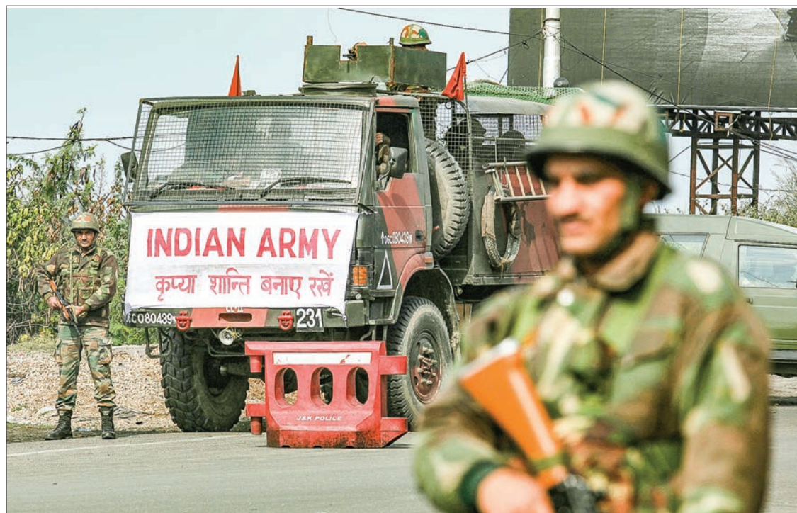
An Indian army soldier stands guard during a curfew in Jammu on 18 February, 2019.

Tens of thousands of people, mainly civilians, have died in Kashmir since an armed rebellion broke out in 1989. —AFP ■