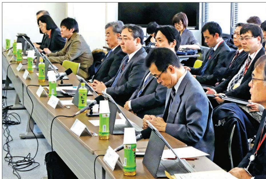
A health ministry panel approves on 18 February, 2019 the world’s first clinical test in which artificially derived stem cells will be used to treat patients with spinal cord injuries.

Every year, some 5,000 people sustain spinal cord damage in Japan, and the number of people living with some sort of spinal cord-related injury is estimated to total over 100,000.—Kyodo News ■