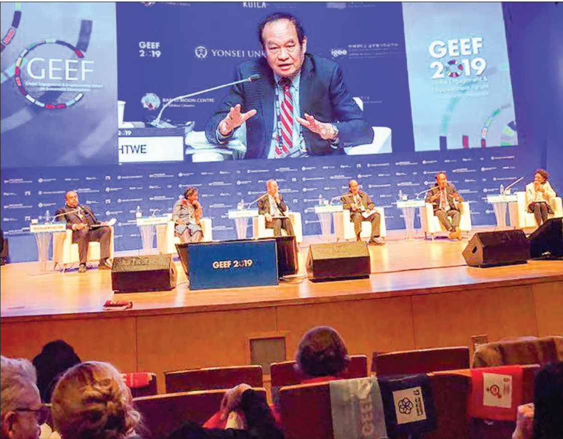
Union Minister Dr. Myint Htwe addresses second annual Global Engagement & Empowerment Forum on Sustainable Development in Seoul.