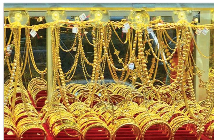
Gold jewellery displayed at a shop in downtown Yangon.

Global gold prices have been on the upswing daily since mid February, standing at $1,324 per ounce on 18 February, $1,321 per ounce on 16 February, $1,314 per ounce on 15 February, and $1,306 per ounce on 14 February.