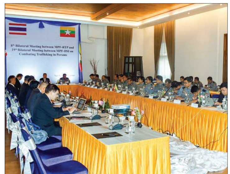
Bilateral Meeting between MPF-RTP (Myanmar Police Force-Royal Thai Police) on Combating Trafficking in Persons held in Nay Pyi Taw yesterday.