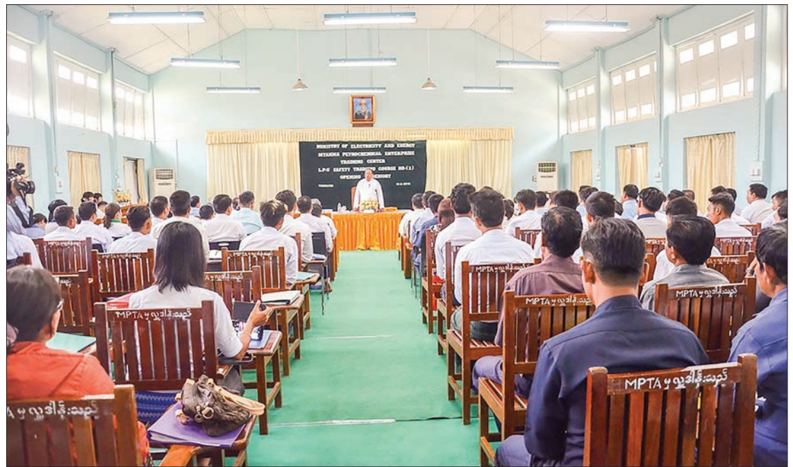
Union Minister U Win Khaing addresses the Opening ceremony of LPG Safety Training Course No. 2 in Thanlyin yesterday.

LPG Safety Training Courses were being conducted for personnel from LPG distri-