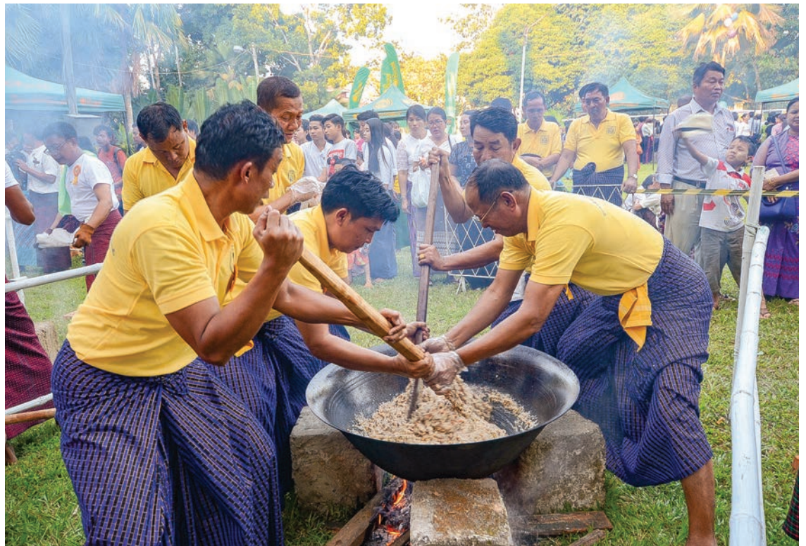
A team participates in the 12 th Traditional Htamane Making Contest at the Shwedagon Pagoda on 18 February, 2019.