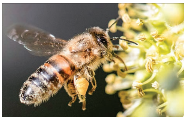
The petition wants 10 per cent of green spaces in Bavaria be turned into flowering meadows. PHOTO: AFP

Having ruled the wealthy state known for its Oktoberfest and lederhosen traditional dress almost uninterrupted for decades, the CSU in October lost its absolute majority as voters angry with its hardline stance against migrants turned to the Greens party.—AFP ■