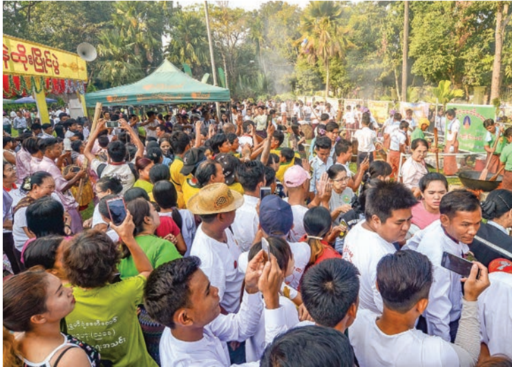
People enjoy the 12 th Myanmar Traditional Htamane making contest at the Shwedagon Pagoda on 18 February, 2019.