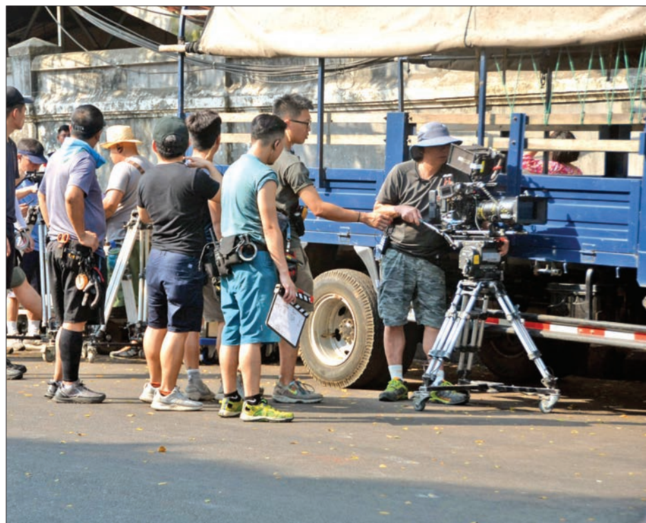
The crew of Line Walker-2 taping a scene for the Hong Kong film at the eastern entrance of Shwedagon Pagoda in Yangon yesterday.