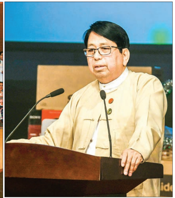
Union Minister Dr. Pe Myint delivers the opening addresses at the 73 rd anniversary of Myanmar Radio and Television (MRTV) at Tatkon MRTV yesterday.

MYANMAR Radio and Television (MRTV) celebrated its 73 rd anniversary at the MRTV Auditorium yesterday afternoon. Union Minister for Information Dr. Pe Myint attended and addressed the event.