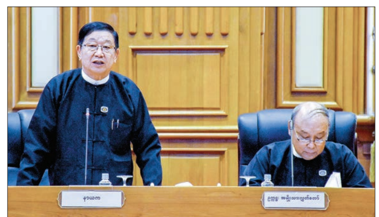
Pyidaungsu Hluttaw Speaker U T Khun Myat delivers the speech at the 2 nd coordination meeting in Nay Pyi Taw yesterday.

Next, Pyidaungsu Hluttaw Deputy Speaker explained about the pre-distributed aims, duties, responsibilities, rights and terms of the joint committee formation draft announcement and attending representatives from political parties and group wise representatives join the discus-