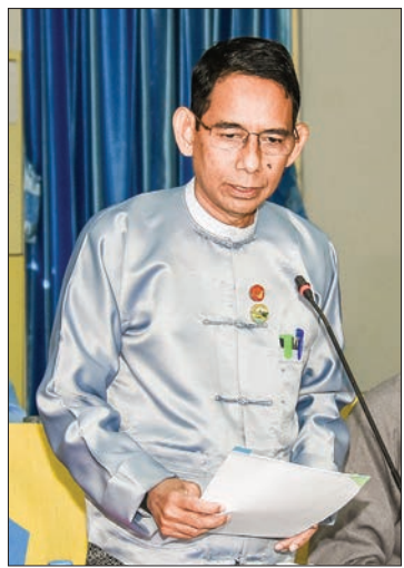
Union Minister Dr. Aung Thu.