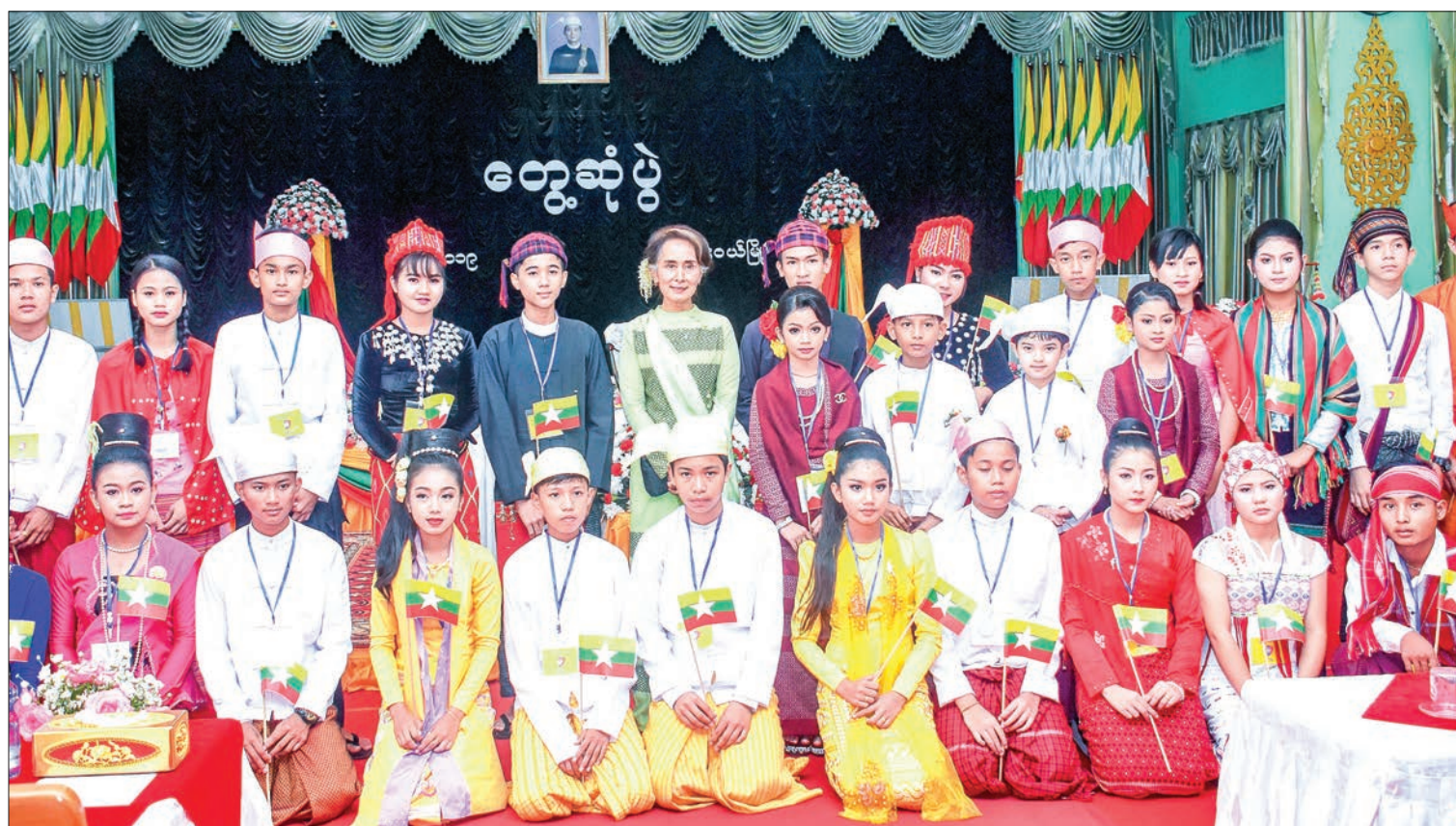
State Counsellor Daw Aung San Suu Kyi poses for the documentary photo with local people in Dawei at Dawei Town Hall.