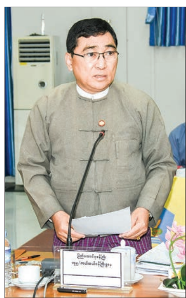
Union Minister Dr. Win Myat Aye.

the ministries carried out the disaster management work, giving example to floods happened in the country last year.