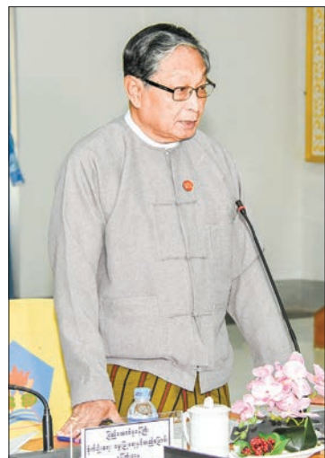
Union Minister U Kyaw Tint Swe.