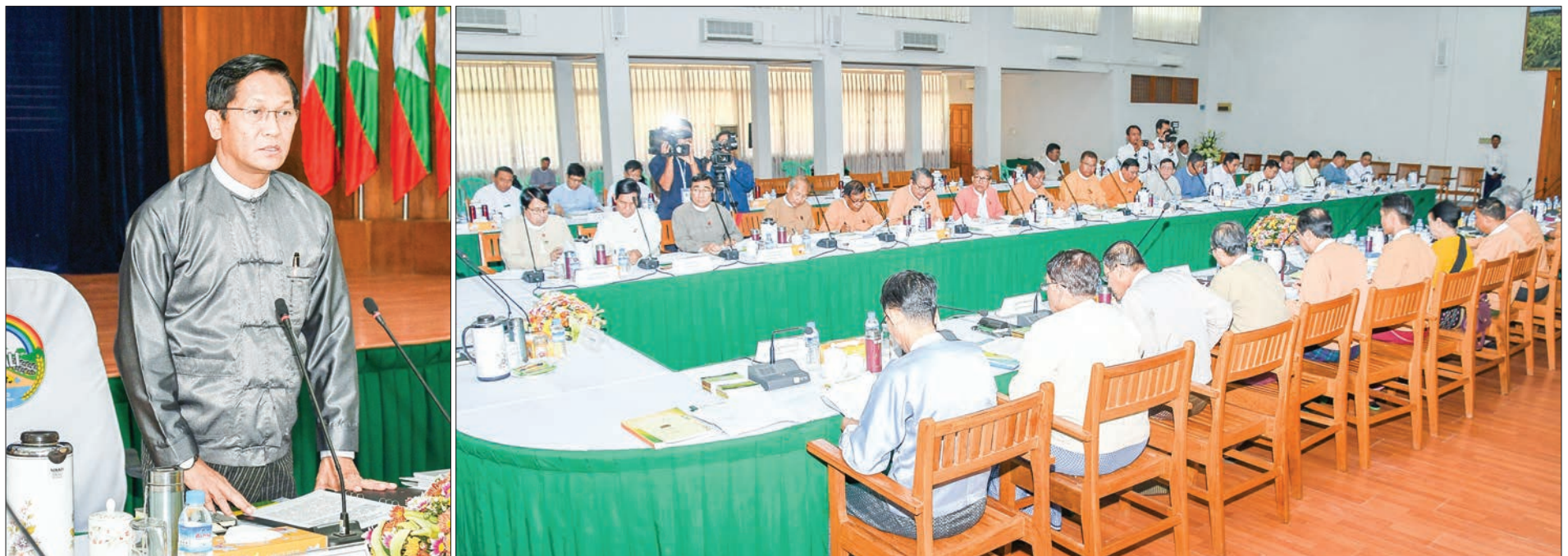
Vice President U Henry Van Thio addresses meeting of the Leading Committee for Projection of the Farmer Rights and Enhancement of their Benefits in Nay Pyi Taw yesterday.

AS head of the Leading Committee for the Farmer Rights and, Vice President U Henry Van Thio called on the committee to speed up full enforcement of the Law of Protection of the Farmer Rights and Enhancement of their Benefits since the law passed its second amendment on 18 December 2018.