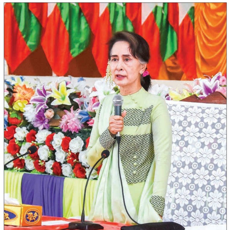
State Counsellor Daw Aung San Suu Kyi addresses meeting with local people in Kawthoung, Taninthayi Region, yesterday.