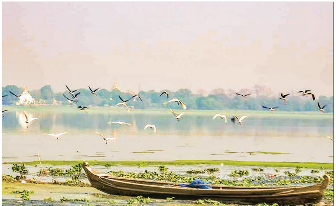
Species of migratory birds in flight near Taungthaman Lake in Mandalay.

"Likewise, officials from the Forestry Department, My-