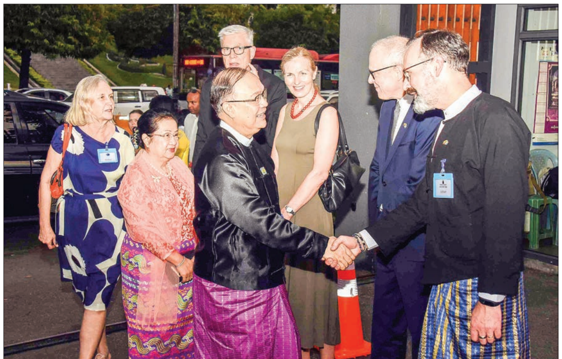
Union Minister U Thant Sin Maung and wife Daw Khin Than Aye are welcomed by Finnish Ambassador Ms. Riikka Laatu at the Nordic Day Ceremony in Yangon.

Finnish Ambassador Ms. Riikka Laatu delivered greeting speeches. Then, the Union Minister took a documentary photo together with the ambassadors, followed by a dinner reception hosted by the ambassadors. The ceremony was attended by ambassadors and diplomats from other foreign embassies stationed in Myanmar; United Nations representatives for Myanmar and invited guests.—MNA ■ (Translated by Kyaw Zin Lin)