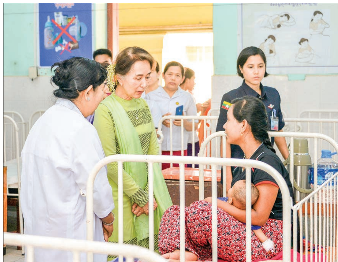
State Counsellor Daw Aung San Suu Kyi encourages a mother who is giving care to her child receiving medical care at Dawei Hospital, Dawei, yesterday.

Graduates from Dawei University should work in other places of the Union as only then can they knew the progresses of the entire country. Identifying as Dawei people is a matter related to the entire country and thus relevant ministry will conduct discussion said the State Counsellor.