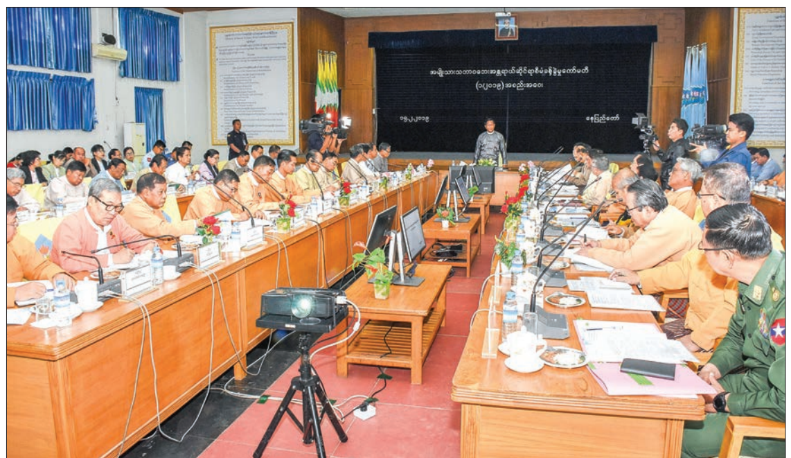
Vice President U Henry Van Thio addresses National Disaster Management Committee meeting.

As the disaster management demands collective strength from different institutions, it needs systematic formation, policies and rule and procedures which are