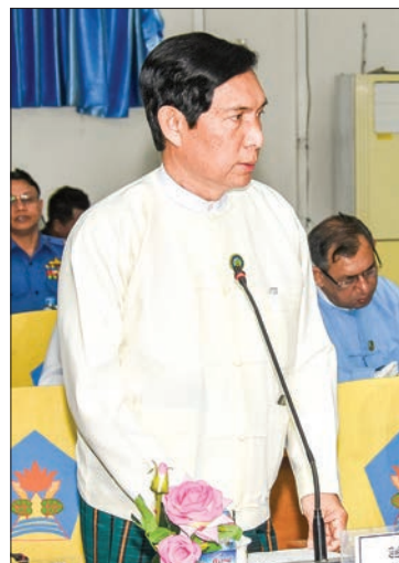
Union Minister U Khin Maung Cho.