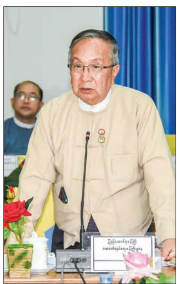
Union Minister Dr. Han Zaw.