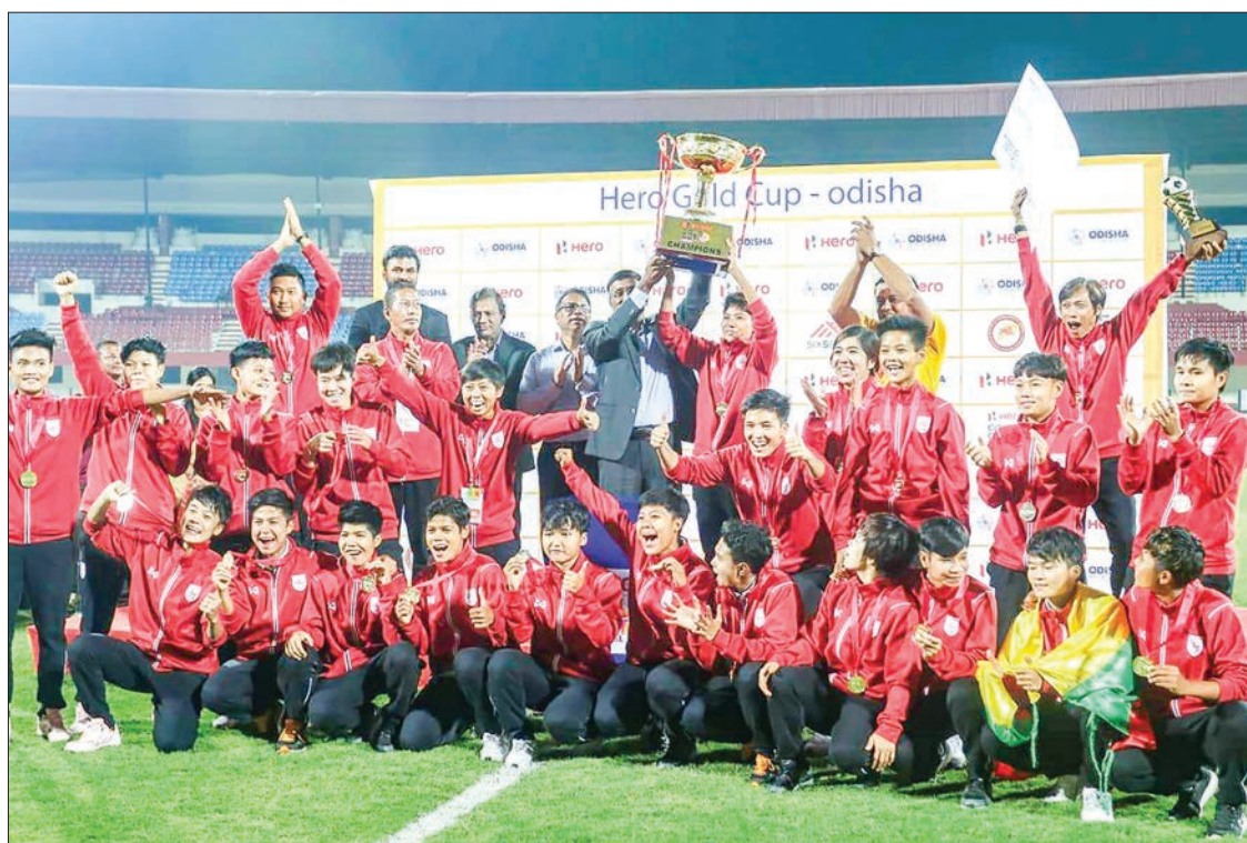
The Hero Gold Cup champions, Myanmar women's national football squad, take the trophy at the awards ceremony at Kalinga Stadium in Bhubaneswar, Odisha, India, yesterday.

With the victory, Myanmar lifted the coveted trophy as an undefeated team in the tournament. Earlier, Myanmar had defeated Nepal 3-0 and beat India and Iran 2-0 at the group stage.—Lynn Thit (Tgi) ■