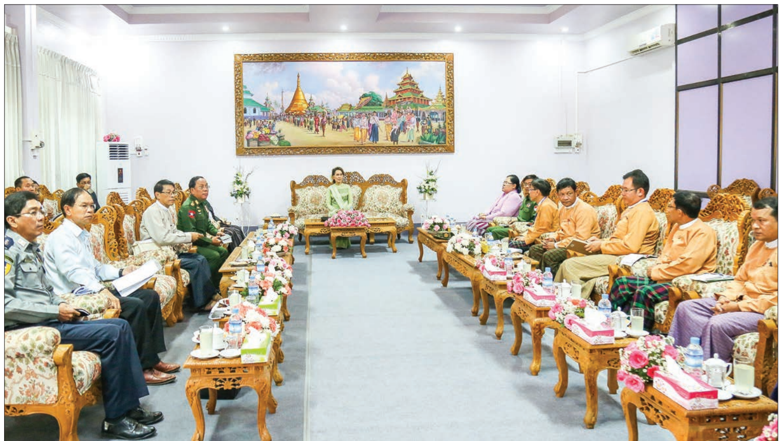
State Counsellor Daw Aung San Suu Kyi meets with Region Chief Minister and region government members at Dawei Airport

From there, the State Counsellor went to Dawei Hospital and cordially greeted people taking treatments. While doing this, hospital officials were questioned about prevailing illnesses and disease, pre-