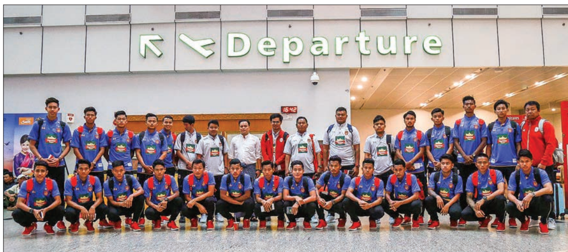
The Myanmar U-22 team with football officials at the Yangon International Airport yesterday. The team left for Cambodia for the AFF U-22 Championship.