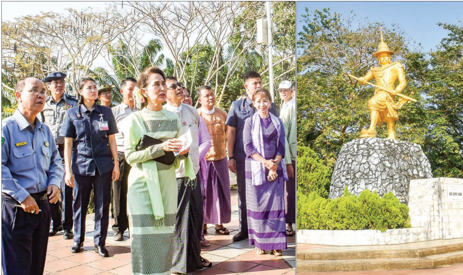
State Counsellor Daw Aung San Suu Kyi visits statue of King Bayint Naung on the Bayint Naung hill in Kawthoung yesterday.