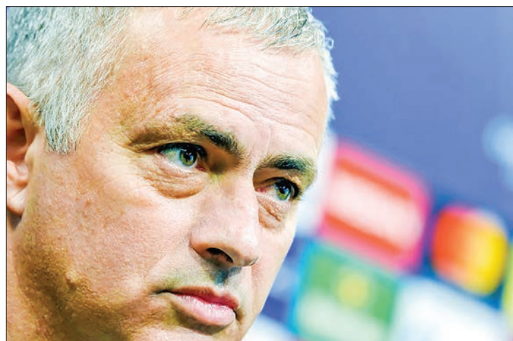
Sacking Jose Mourinho cost Manchester United nearly £20 million.