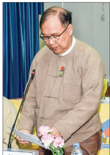
Union Minister U Thant Sin Maung.