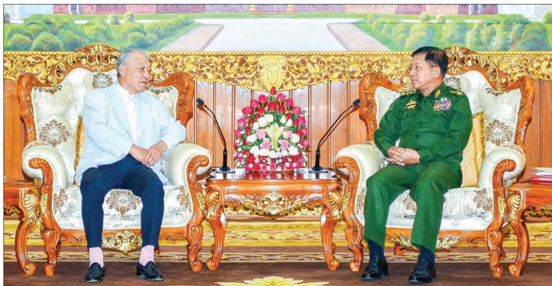
Senior General Min Aung Hlaing meets with Special Envoy of the Government of Japan for National Reconciliation Mr. Yohei Sasakawa in Nay Pyi Taw.

Japan's participation in regional development and humanitarian aid in Rakhine State, the government and Tatmadaw's efforts to resolve issues in Buthidaung and Maungtau townships and Japan's support in portraying the true situation to the international community, the Tatmadaw's efforts in implementing political stability and security throughout the country, and Japan's ongoing plans to invest in factories and workshops in Myanmar to create employment opportunities, according to information released by the Office of the Commander-in-Chief of Defence Services. —MNA (Translated by ZHO)