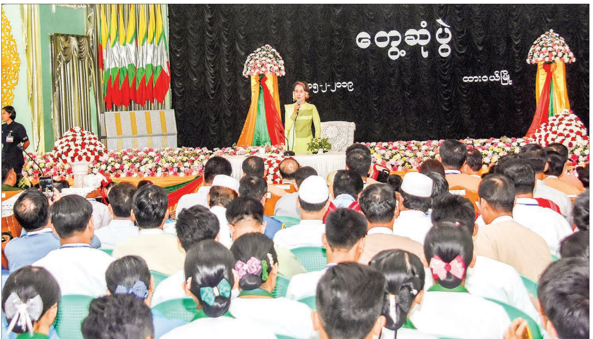
State Counsellor Daw Aung San Suu Kyi meets residents from Dawei District, Taninthayi Region, yesterday.

T HE Chairperson of the Central Committee for Development of Border Areas and National Races, State Counsellor Daw Aung San Suu Kyi who was in Kawthoung Town, Taninthayi Region visited Cape Bayint Naung in Kaw-