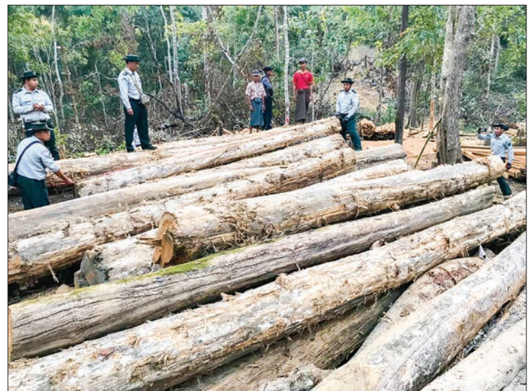
Officials from Forest Department inspects seized illegal timbers near Katha Township.