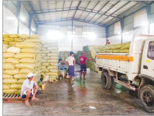
Workers loading sacks of green gram at exporter's warehouse.

U Myint Naing of Nangkhale Model Village, who owns ten acres of green gram plantations, said he has already harvested green gram and is waiting for some time to