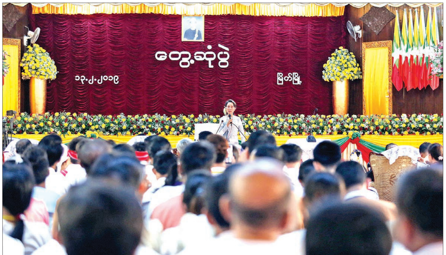
State Counsellor Daw Aung San Suu Kyi meeting with the authorities and local people in Myeik in Taninthayi Region.

The State Counsellor arrived at B.E.H.S. 7 Myeik and delivered a speech at the ceremony to award winners of the district-level competitions commemorating the 104 th birth anniversary of Bogyoke Aung San, the architect of Myan-