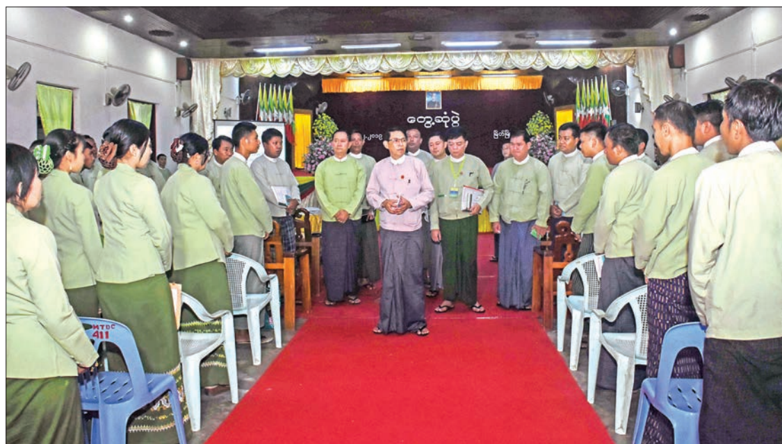
Union Minister U Min Thu greets GAD staff in Myeik, Taninthayi Region yesterday.

The Union Minister acknowledged the common perception of the public on the GAD and told the staff there is no need to be discouraged. He asked the staff to understand that the GAD simply follows the policies set by the political system and the executive pillar.