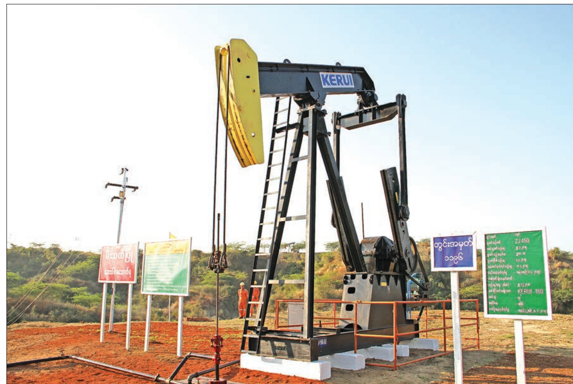
An oil well in Chauk oil field in Magway Region.

In 2017-2018, the country generated a total of (19,193) Gigawatt hours and that (42) per cent came from the utilization of gas turbines. A total of only (39) per cent of households in the country is getting electricity from the national grid. The Union of Myanmar holds (11) millions households across the country, and that (6 point 7) millions