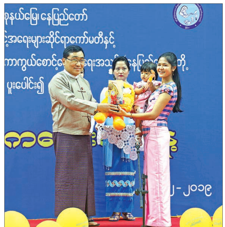
Union Minister Dr. Win Myat Aye hands over a prize to a child and mother who won an ECCD contest during Myanmar Children's Day celebrations held in Nay Pyi Taw