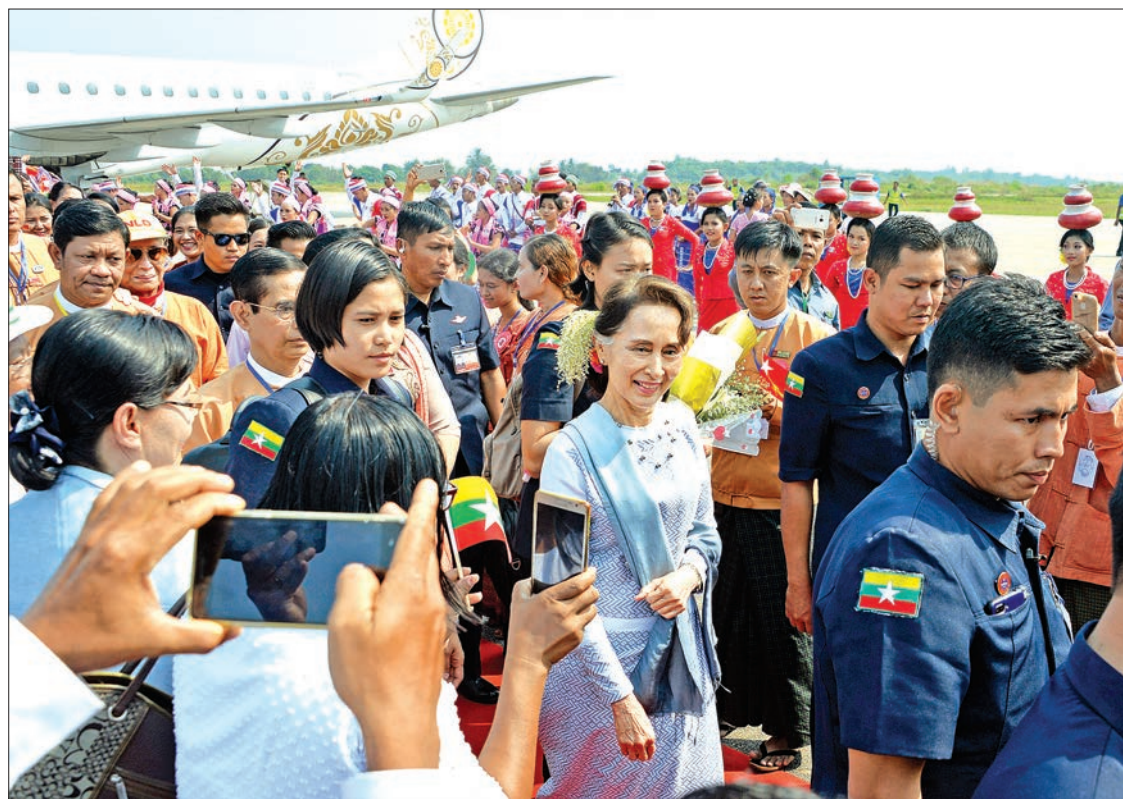
State Counsellor Daw Aung San Suu Kyi is welcomed by local residents at the Myeik Airport in Myeik.

She said her ruling party has never broken a promise made to the people, and never will. She said they will take effective action, within the legal framework, on any incident that might harm the people. All who have assumed the responsibility of working for the benefit of the entire country and its people need to be straightforward in their duties and perform them with dignity, said the State Counsellor. She concluded