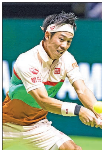
Kei Nishikori rallies from a one-set deficit to beat Pierre-Hugues Herbert on 12 February, 2019 to advance to the second round of the ABN AMRO World Tennis Tournament in Rotterdam.

"I'm not 100 percent yet, but it's the first match so it can't be helped." Herbert took a one-set