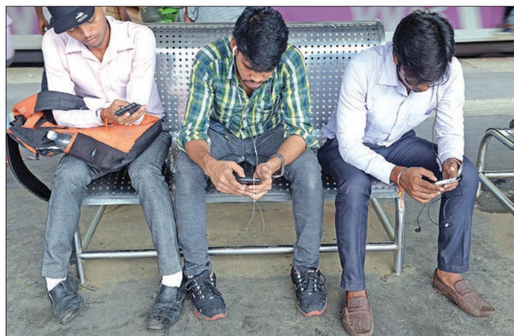
Indians surf the internet on their phones at a free wi-fi zone inside a suburban railway station in Mumbai on 22 August, 2016.

In October, it extended the deadline to January to reevaluate the situation. — AFP ■