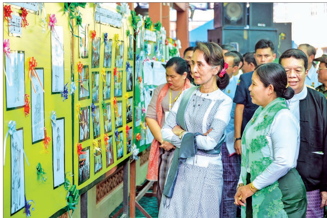
State Counsellor Daw Aung San Suu Kyi looks at the paintings and photos displayed at the ceremony for commemorating the 104 th birth anniversary of Bogyoke Aung San at B.E.H.S. 7 in Myeik.

The State Counsellor also promised to solve the issues that can be solved as soon as possible and urged the authorities to put the some issues that can not be solved yet on the record. —MNA (Translated by Zaw Htet Oo)