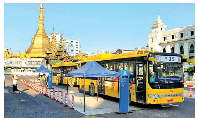
New buses parked in downtown Yangon to provide ferry service.

The card payment system will be installed on three YBS bus lines, which are running in six townships. The installation of the system on the buses will