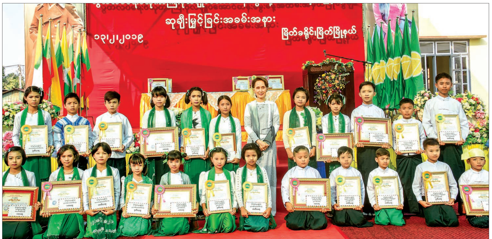
State Counsellor Daw Aung San Suu Kyi poses for a documentary photo with the award-winning students at B.E.H.S 7 in Myeik yesterday.

Union Government's visits to the states and regions are for getting an on-the-ground perspective of the people's actual situation.