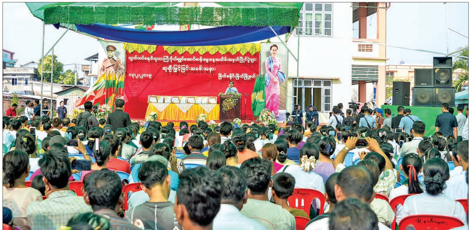
State Counsellor Daw Aung San Suu Kyi delivers the speech at the awarding ceremony of the district-level competitions to mark the 104 th birth anniversary of Bogyoke Aung San in Myeik on 13 February.

The State Counsellor continued to say that wherever she met