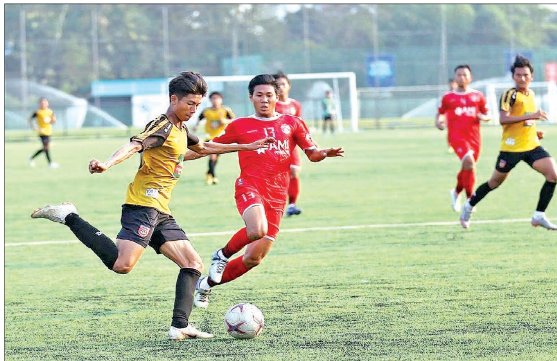
A player from the Myanmar U-22 team (yellow) kicks the ball in yesterday's friendly match against Ayeyawady F.C.

The remaining minutes of the second half expired after cautious play by both teams, and the match ended with a 1-0 win for the Myanmar team.—Lynn Thit (Tgi) ■