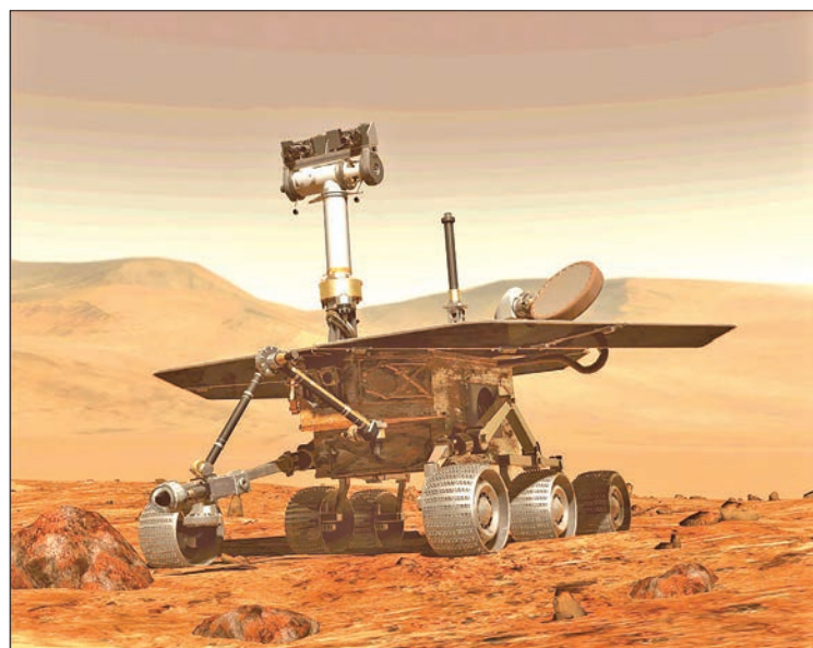
This computer generated image obtained on 31 August, 2018 shows the Opportunity rover of NASA part of the Mars planet exploration programme.

“What we’ve proposed is that your smartphones come fitted with a speedometer, with a measurement system which tells you how much sound you’re getting and tells you if you are going over the limit”. — AFP ■