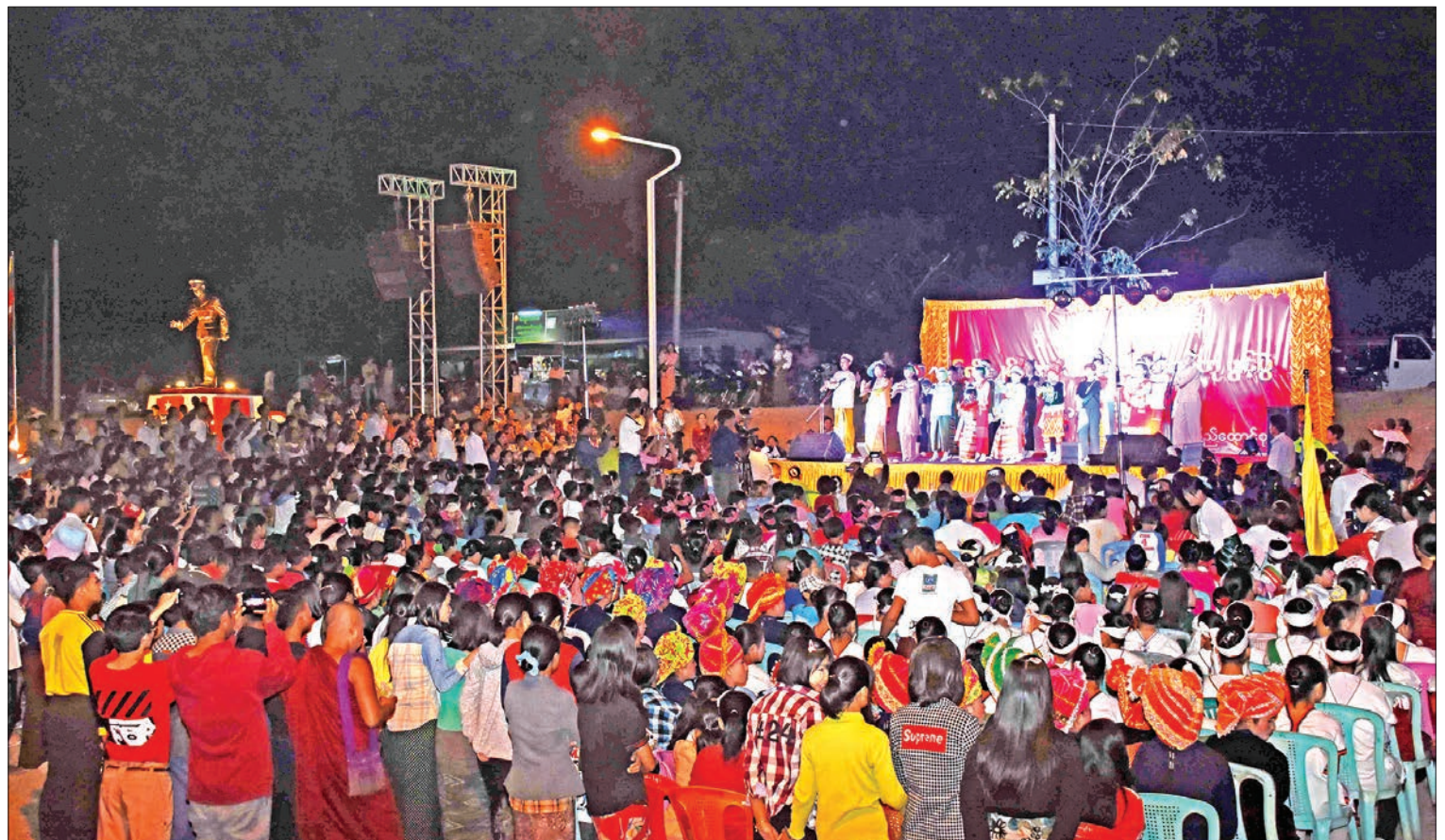
People seen at the opening ceremony of Bogyoke Aung San Statue and commemoration of Bogyoke Aung San's 104 th birthday in Pobbathiri Township, Nay Pyi Taw Council Area.

Students from No.20 Basic Education High School entertained with 'Bon Taw' song, and female students from Swan Pyae Private School entertained with 'Lahu Myanmar' dance. Afterwards, donors presented awards to the winners of paint-