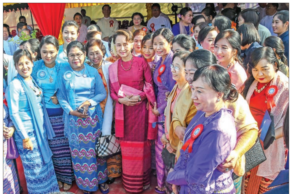
State Counsellor Daw Aung San Suu Kyi poses for the photo together with attendees during the stake-driving ceremony for orphans nursery in Nay Pyi Taw. (NEWS ON PAGE - 1)