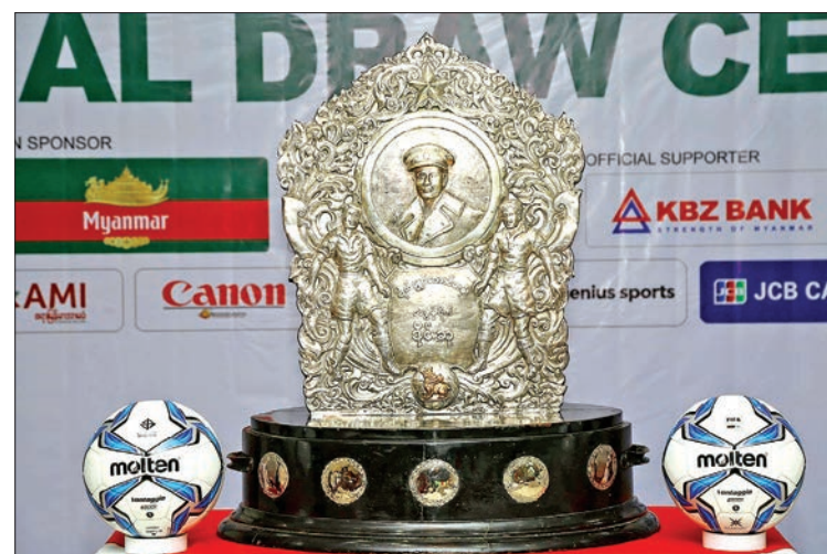
The Bogyoke Aung San Shield on display at the drawing ceremony of the tourney.