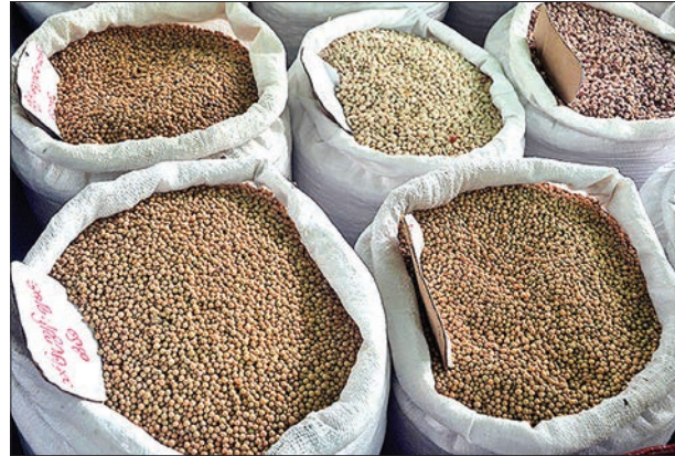
Myanmar pulses are kept on display for sale in a shop at a market.

"At present, only a small volume of mung beans and pigeon peas are stockpiled in the pulses market. Additionally, the number of pigeon peas growers has decreased this year. This being so, we do not have concerns over pigeon peas, even if India does not purchase them. But, most growers have cultivated mung beans. Therefore, the Myanmar pulses association is preparing to purchase them