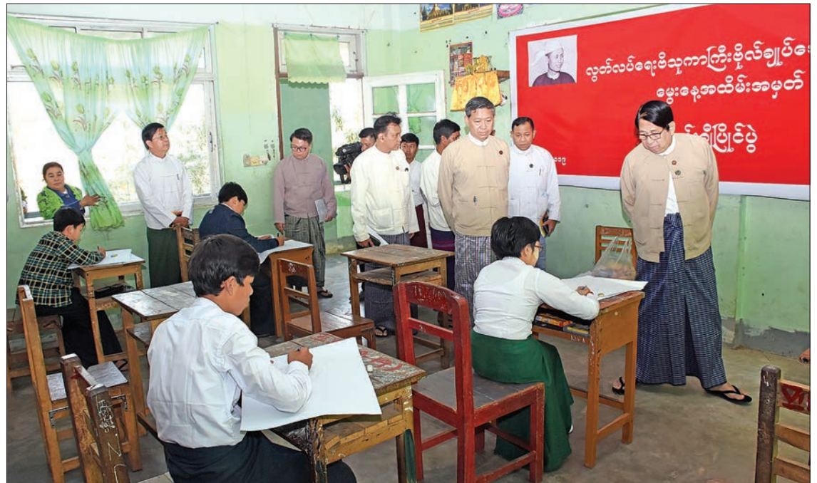
Union Ministers Dr. Pe Myint and Dr. Myo Thein Gyi observe drawing contest to commemorate the Bogyoke's birthday at B.E.H.S 7 in Nay Pyi Taw yesterday.

The Union Ministers also visited B.E.H.S. 7 and observed a seminar, wall posters and pho-