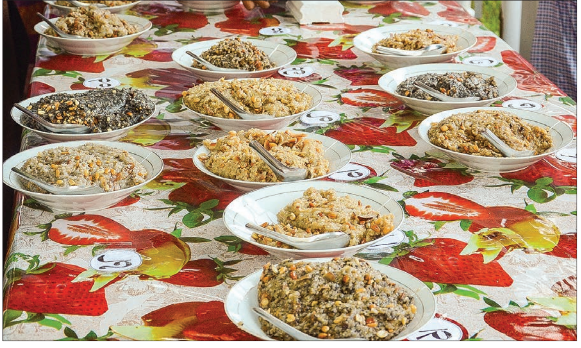
The htamane delicacy is prepared for donation.

The Global New Light of Myanmar is accepting submissions of poetry, opinion, articles, essays and short stories from young people for its weekly Sunday Next Generation Platform. Interested candidates can send their work to the Global New Light of Myanmar at No. 150, Nga Htat Kyee Pagoda Road, Bahan Township, Yangon, in person, or by email to ce@globalnewlightofmyanmar . com with the following information: (1) Sector you wish to be included in (poetry, opinion, etc.), (2) Own name and (if different) your penname, (3) Your level of education, (4) Name of your School/College/University, (5) A written note of declaration that the submitted piece is your original work and has not been submitted to any other news or magazine publishing houses, (6) A color photo of the submitter, (7) Copy of your NRC card, (8) Contact information (email address, mobile number, etc.).— Editorial Department, The Global New Light of