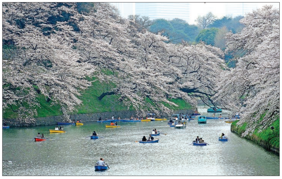
In this file photo taken on 27 March, 2018 visitors row boats past cherry blossoms in full bloom in the Japanese capital Tokyo. PHOTO: AFP

Just observing the bud can give surprisingly accurate information about how far the flower is from full bloom.—AFP