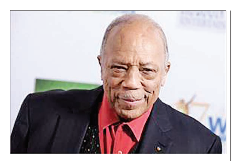
Veteran record producer Quincy Jones.

SOCIAL 13 FEBRUARY 2019 THE GLOBAL NEW LIGHT OF MYANMAR