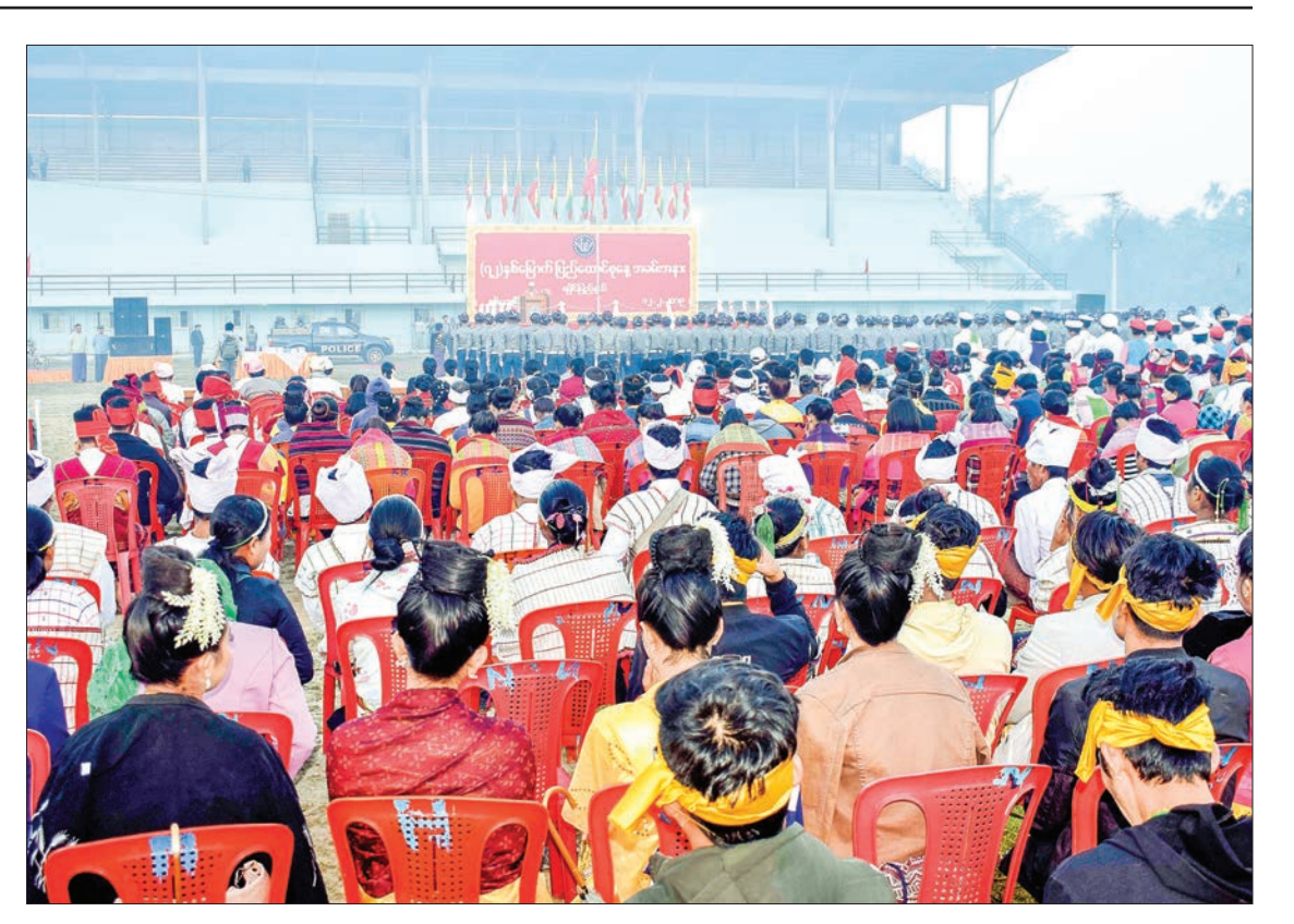
Rakhine State Chief Minister U Nyi Pu reads the message sent by President U Win Myint to the 72<sup>nd</sup> Anniversary of Union Day celebration in Sittway yesterday.

The ceremony ended at night with the Chief Minister and ministers presenting cash awards to ethnic performing troupes.—Tin Tun (IPRD)