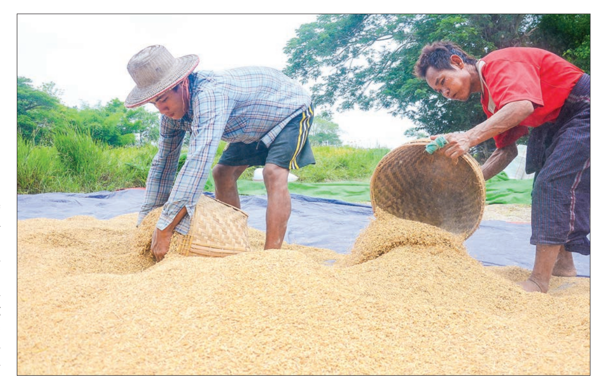
Farmers collect paddy after drying them under the sun in Ayeyawady Delta.

Myanmar is ranked seventh globally in rice production, according to the Food and Agriculture Organization of the United Nations, but it lags behind other major rice-growing neighbors such as Thailand and Viet Nam in the mechanization of the pro-