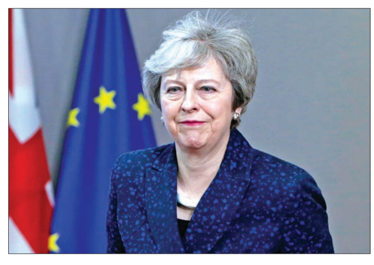
British Prime Minister Theresa May leaves after a meeting with the President of the European Council at the European Council in Brussels on 7 February, 2019.

Leadsom, responsible for bringing government business through parliament, said the talks were "pretty crucial but delicate negotiations with the EU to try to make sure that we can sort out the problem with an unlimited backstop".