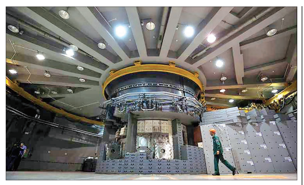
PIK high-flux reactor.