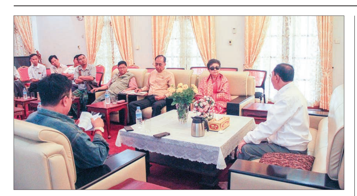
Union Minister Nai Thet Lwin meets with states/regions ethnic affairs ministers who attend the 72<sup>nd</sup> Anniversary Union Day ceremony.

After the dinner, the President, First Lady, State Counsellor and the guests were entertained by artists from the Ministry of Religious Affairs and Culture, Department of Fine Arts and states/regions cultural dance troupes in the City Hall open-air stadium. — MNA