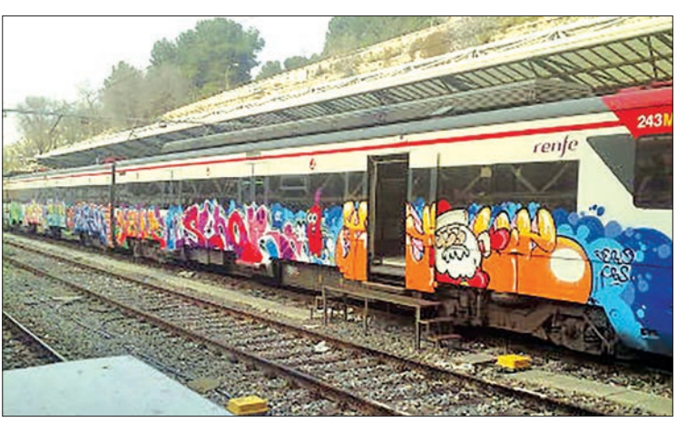
Ten people, aged between 21 and 27, were arrested on suspicion of belonging to the gang.

These operated in much the same way, and were accused of causing over 200,000 euros worth of damage to train carriages around the country. —AFP