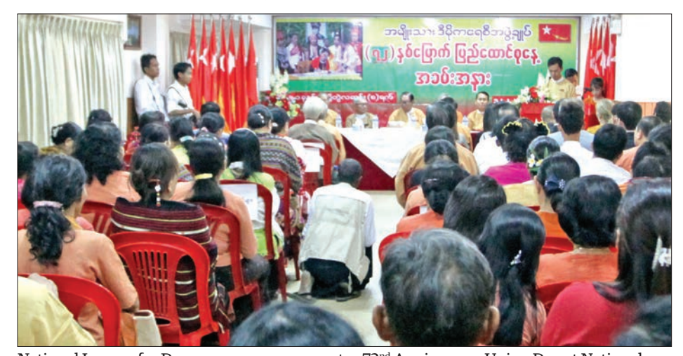
National League for Democracy commemorates 72<sup>nd</sup> Anniversary Union Day at National League for Democracy headquarters in Bahan Township, Yangon.

THE 72<sup>nd</sup> Anniversary of Union Day ceremony was held at the National League for Democracy (NLD) headquarters yesterday morning.