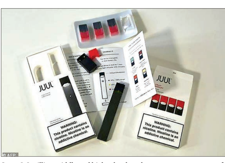
Some 3.6 million middle and high school students were current users of vaping products, up from 2.1 million the year before, while the number of cigarette smokers and consumption of other tobacco products remained stable.

While the number of middle and high school cigarette smokers has been falling steadily since 2011, the number of vapers in that group has increased dramatically, from 1.5 per cent then to 20.8 in 2018. The survey estimates 4.9 per cent of college students vape. The US categorizes e-cigarettes as tobacco products, a definition not shared by all countries. —AFP ■