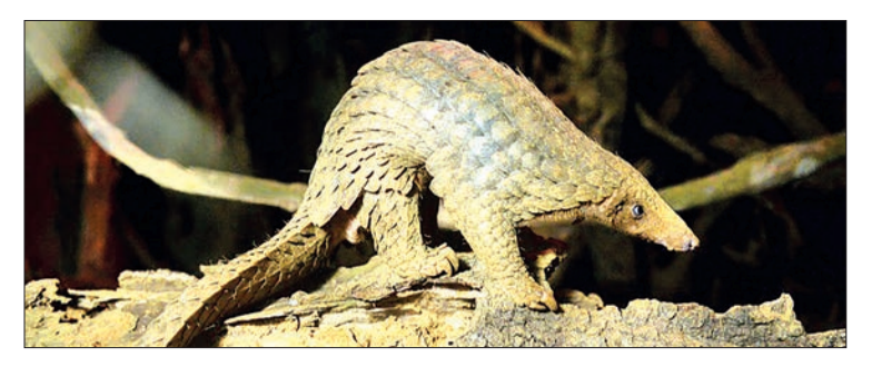
Pangolin body parts are highly valued in traditional medicine in countries including China and Viet Nam while their meat is considered a delicacy.

The haul included about 1,800 boxes full of frozen pango-