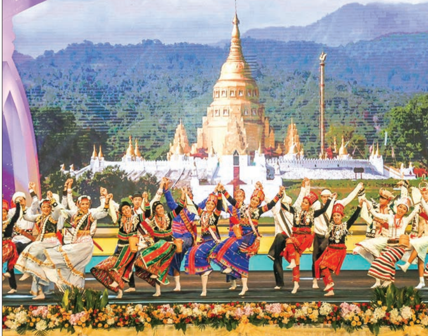
President U Win Myint, first lady and attendees enjoy the traditional dance performance at the dinner in commemoration of 72<sup>nd</sup> Anniversary Union Day in Nay Pyi Taw.