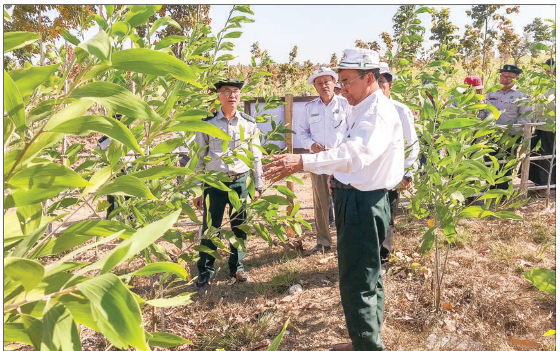
Union Minister U Ohn Win inspects the layout of Shwesettaw Mann Chaung Elephant Protection Camp in Minbu Township, Magway Region yesterday.

and team then inspected a joint-venture coal mine outside the Padaung-Pyawbwe forest reserve in Minbu Township, and No 25 saw mill of Myanma Timber Enterprise in Ngaphe Township,