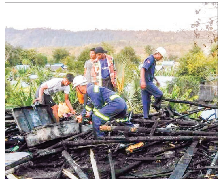
Firefighters working on the scene.