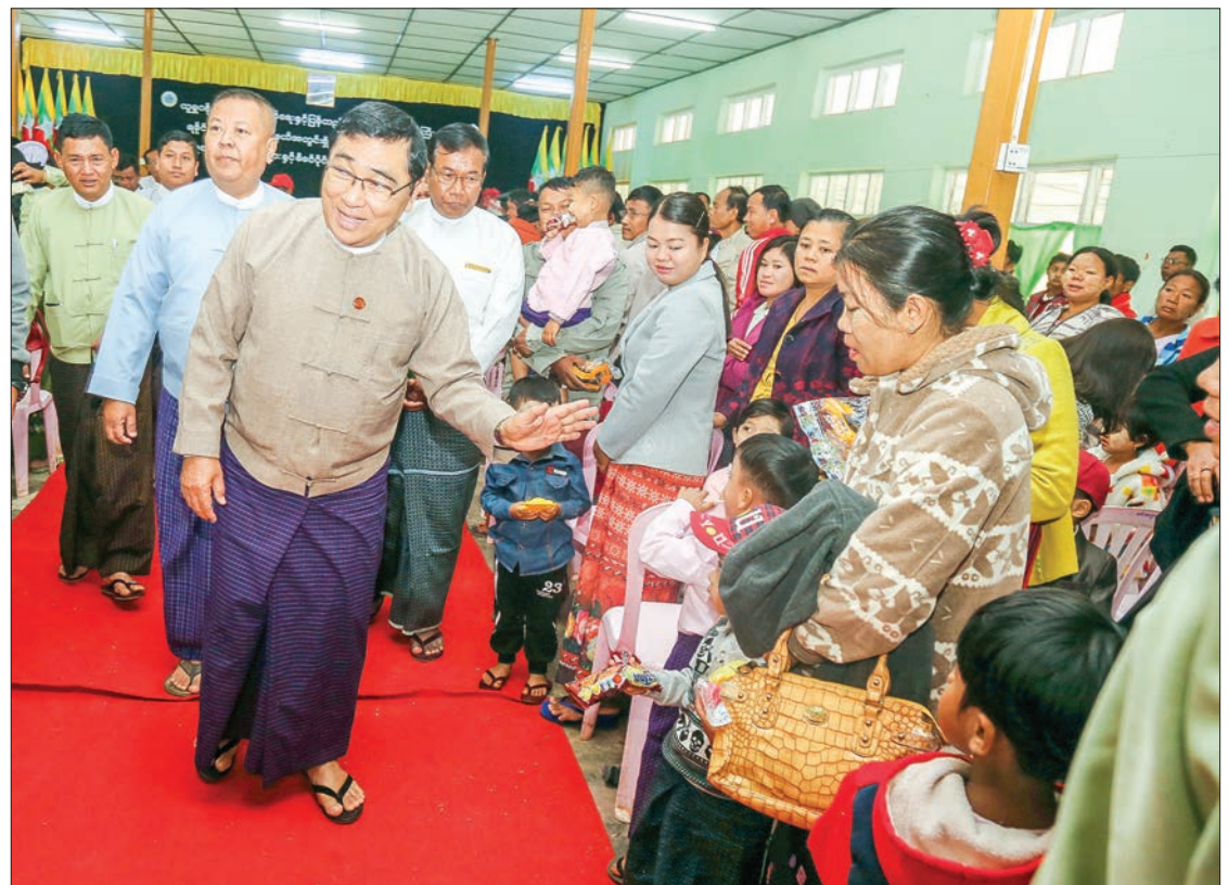
Union Minister Dr. Win Myat Aye greets families in An Township, Rakhine State during a ceremony to provide assistance.

"The ministry is also implementing preparatory measures for risk management, quick response programs, and rehabilitation undertakings for ensuring a better situation," the minister said, urging local people, the Government, and social organizations to join hands to maintain peace and stability,