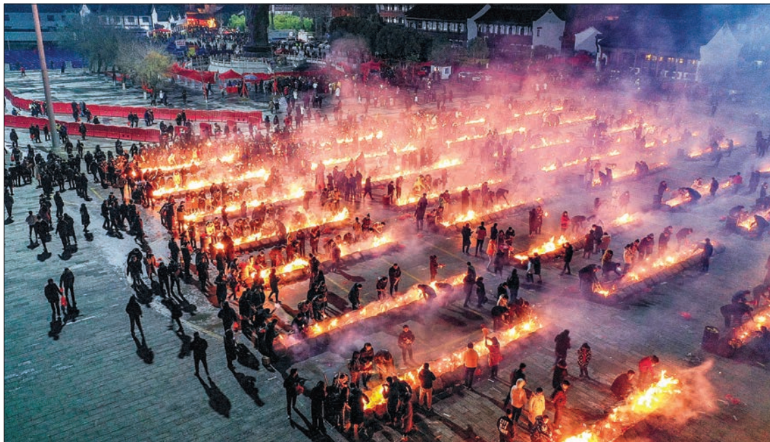
Chinese worshippers offer prayers and burn incense on the fifth day of the Lunar New Year at the Guiyuan Buddhist Temple in Wuhan, central China’s Hubei province on 9 February, 2019.

In a country with almost 200 million internal migrants, the return home by workers during the festival season is the world’s largest annual migration.—AFP ■