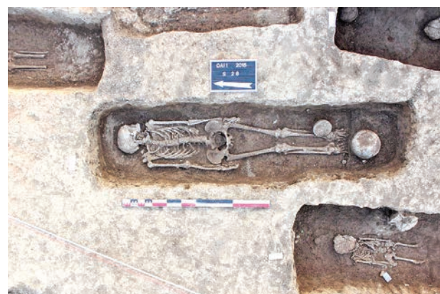
Burial 28 at OAI1 excavated in 2015, one of two individuals who had remaining DNA from the Myanmar study.