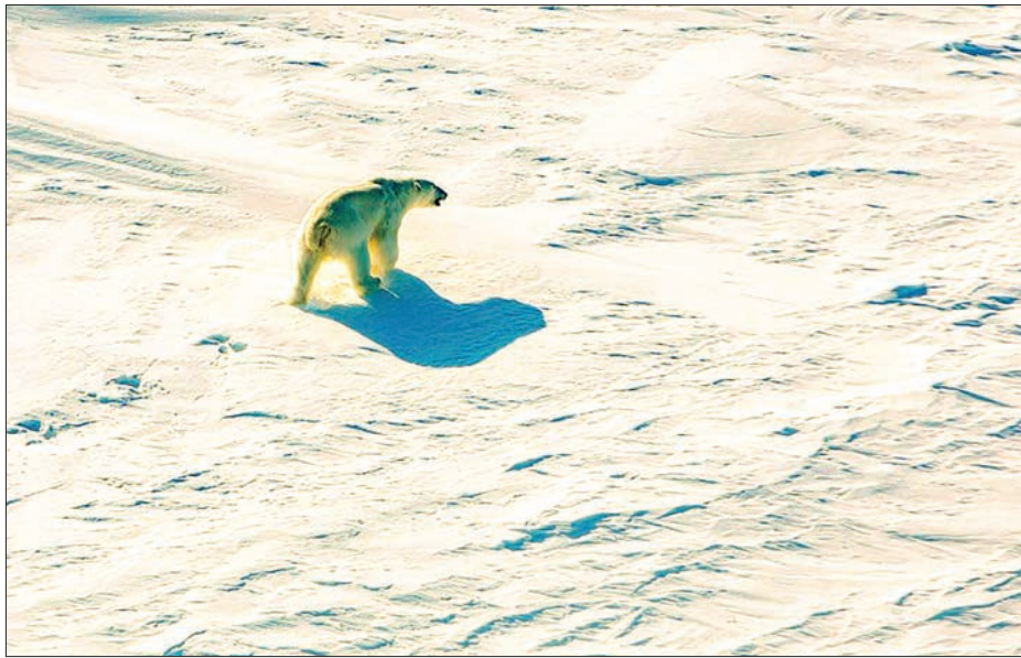
Polar bears are affected by global warming with melting Arctic ice forcing them to spend more time on land where they compete for food.

Russian authorities have so far refused permission to shoot the bears but