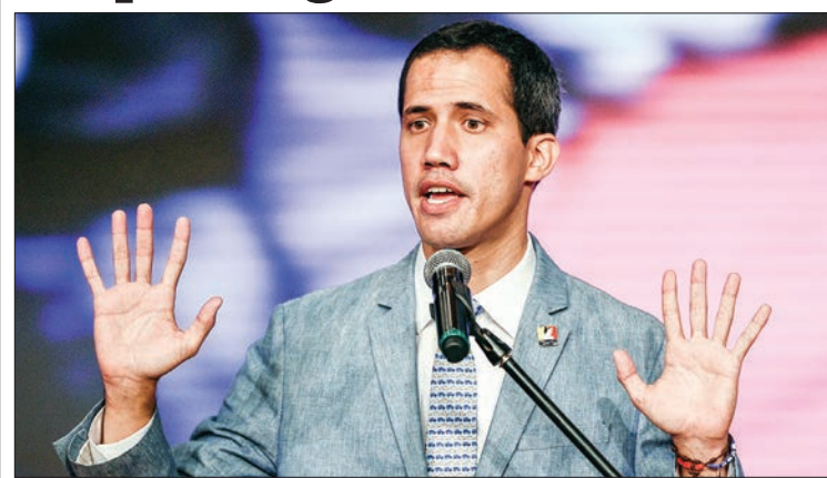
The president of Venezuela's National Assembly and self-proclaimed acting president Juan Guaidó delivers a speech at the Central University of Venezuela (UCV) in Caracas on 8 February, 2019.

CARACAS (Venezuela)—An active-duty Venezuelan army colonel who is a military doctor has dropped his allegiance to President Nicolas Maduro, backing opposition leader Juan Guaidó instead.