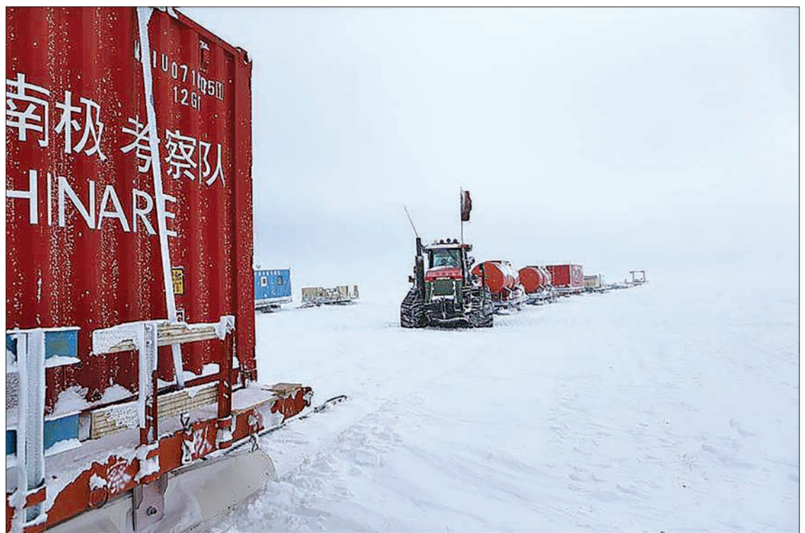
Photo taken on 8 February, 2019 shows an inland expedition team of China's 35 th Antarctic expedition on its journey in Antarctica.

The government is committed to building a strong, effective and equitable public health service for all New Zealanders, he said, adding it aims to eliminate viral hepatitis as a major public health threat by 2030.—Xinhua ■