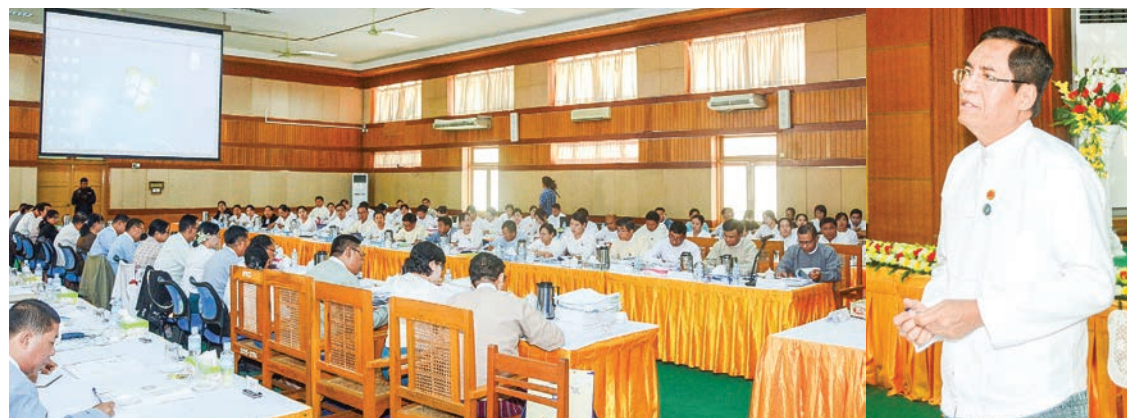
Deputy Minister U Aung Hla Tun addresses the annual IPRD meeting in Nay Pyi Taw.

DEPUTY Minister for Information U Aung Hla Tun stressed the need for continuous efforts to help make the 28-year-old In-