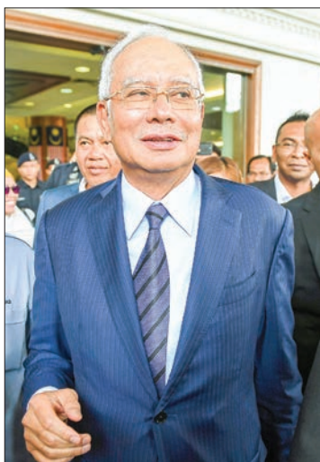
Former Malaysia’s prime minister Najib Razak. allegedly bought with cash plundered from public coffers.

The money was purportedly used to fund a global shopping spree—a $250-million super-yacht, high-end real estate, and Monet and Van Gogh artworks were among the items