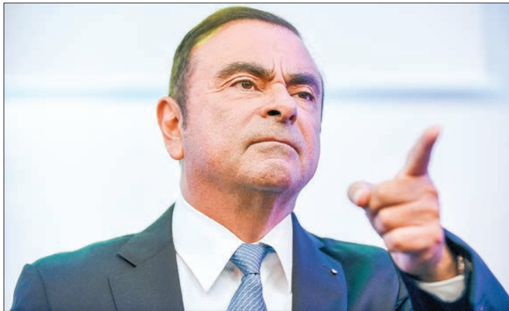
Renault-Nissan chairman and CEO Carlos Ghosn.

PARIS (France)—Lawyers for French carmaker Renault have criticised their Japanese alliance partner Nissan for its handling of an internal probe into the Carlos Ghosn scandal, a Sunday newspaper has reported. In a letter to Nissan dated 19 January, the lawyers said they had “serious concerns about the methods used” by the company and its legal team, including the way they treated some Renault employees, according to France’s Le Journal du Dimanche . Former head of the alliance Ghosn is being held in Japan on charges he under-reported millions of dollars in pay as head of Nissan. “Renault has gathered sufficient evidence to understand and regret the methods used by Nissan and its lawyers to seek interviews with Renault employees through the Japanese public prosecutor’s office,” they said. Nissan was seeking “evidence to support allega-