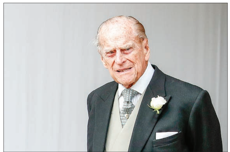
Prince Philip.