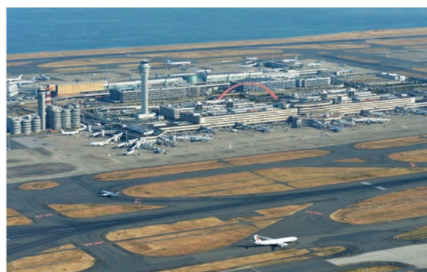
Haneda airport in Tokyo in January 2017.

Located about 15 kilometres south of central Tokyo, the major airport is expected to see even stronger travel demand, coupled with an increase in international flights