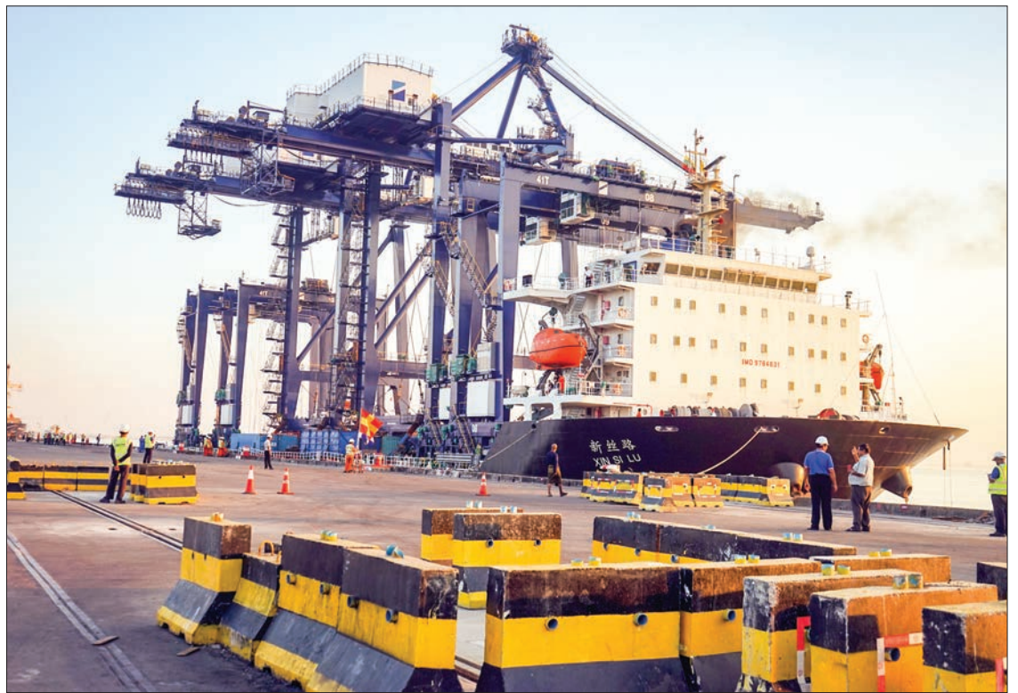
A cargo ship anchored at Thilawa Port, which is an important facility for maritime trading.

Fourteen foreign enterprises received permits and endorsements for projects with capitals of $60.6 million at the Myanmar Investment Commission meeting held on 4 February. The foreign enterprises were approved and endorsed by the Myanmar Investment Commission and the Yangon Region Investment Committee. They will be engaged in manufacturing, livestock and fisheries, and other service sectors, creating 11,684 jobs. The existing foreign enterprises have also recruited 1,000 new employees. The MIC is targeting to attract $5.8 billion in foreign investments in the 2018-2019 fiscal year.—GNLM ■