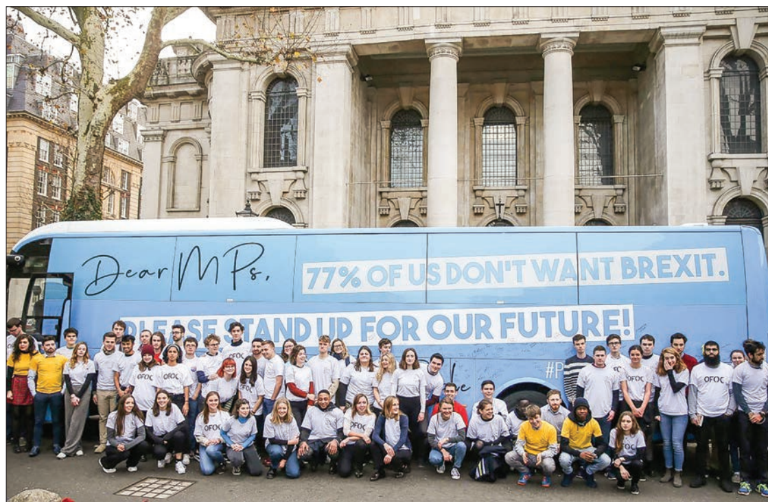
In this file photo taken on 27 November, 2018 Members of Our Future, Our Choice (OFOC) a youth movement supporting a People's vote on the Brexit deal pose by a campaign bus in London.

The list includes Japanese investment bank Norinchukin, media company TVT Media, financial services providers MarketAxess and Azimo, and maritime insurer UKP&I, the agency