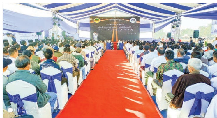
Union Minister for Construction U Han Zaw delivers the speech at the inauguration of the upgraded Hmawby-Taikkyi road.

THE upgraded 48 feet, four-way Hmawby-Taikkyi concrete road section of the Yangon-Pyay Road was officially opened in Taikkyi Township, Yangon Region yesterday. The construction of the road section was undertaken by Max Highway Co. Ltd under the B.O.T system.