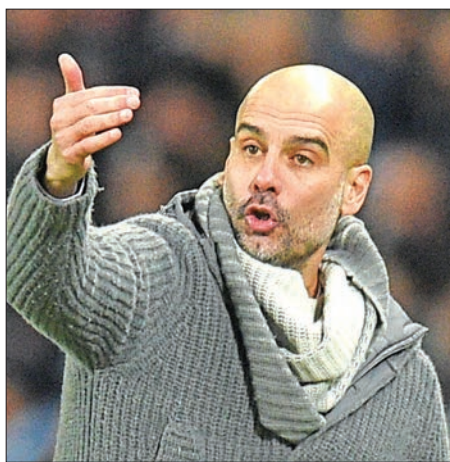
Pep Guardiola.

"I think he can play in that position, I am pretty sure," said City manager Guardiola ahead of Sunday's match at home to