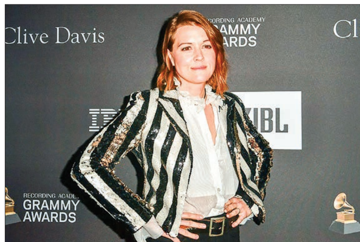
US singer-songwriter Brandi Carlile, 2019’s most nominated woman artist, arrives at a pre-Grammy event on the eve of the awards show.

Untouchable pop star Ariana Grande—who dropped her highly anticipated album “Thank U, Next” just before the Grammys—slammed producer Ken Ehrlich over her decision not to