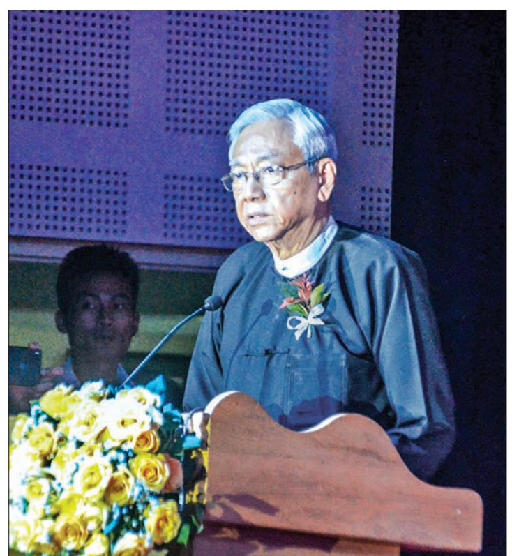
Former President U Htin Kyaw speaks at the literary seminar marking the 110 th birth anniversary of the late national poet and literary icon, Sayargyi Minthuwn.

TO MARK the 110 th birth anniversary of the late national poet and literary icon, Sayargyi Minthuwn, a literary seminar was organized yesterday at the Co-operative Business Center at the junction of the New University Avenue Road and Sayar San Road in Bahan Tsp, Yangon Region.