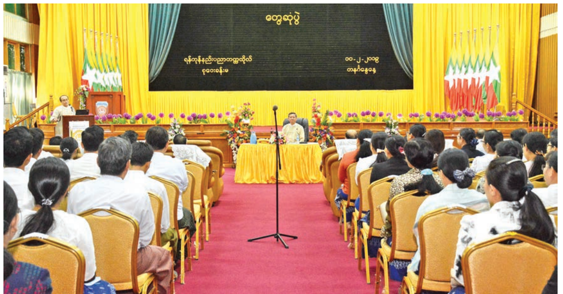
Union Minister Dr. Myo Thein Gyi addresses faculty of Yangon Technological University yesterday.

The Union Minister also dealt with matters relating to high-tech learning for improving competitiveness of graduates,