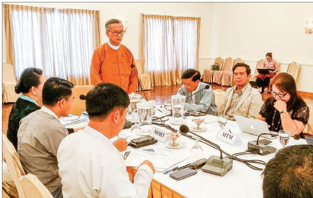
Union Minister for Hotels and Tourism U Ohn Maung, addresses a tourism promotion meeting in Yangon yesterday.