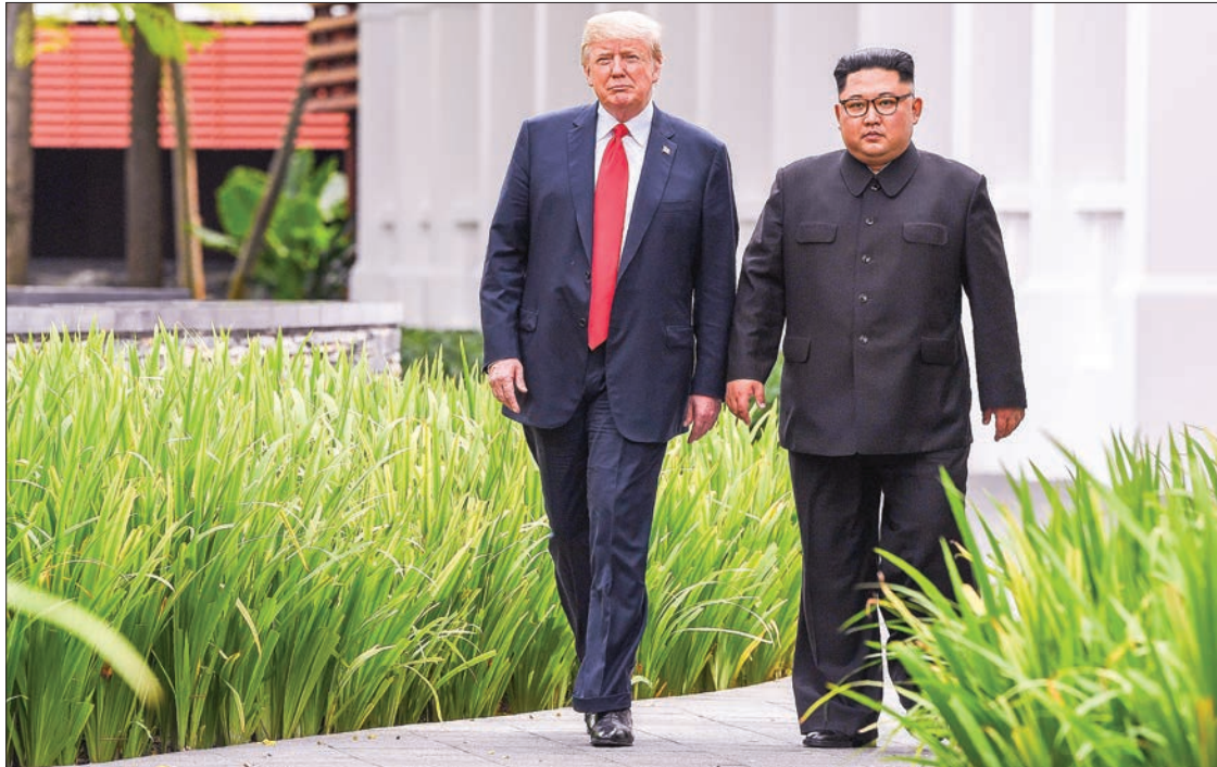
In this file photo taken on 11 June, 2018 North Korea’s leader Kim Jong Un (r) walks with US President Donald Trump (l) during a break in talks at their historic US-North Korea summit, at the Capella Hotel on Sentosa island in Singapore.

meet in Hanoi from 27 to 28 February following their landmark first summit in Singapore last June.