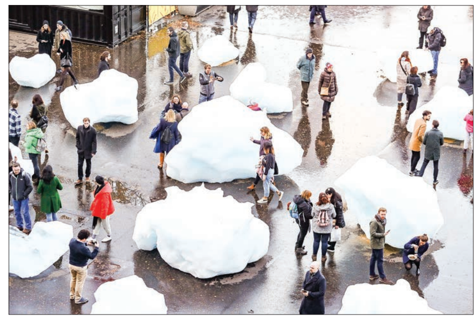
Visitors interact with blocks of melting ice, an exhibit entitled 'Ice Watch' created by Icelandic-Danish artist artistOlafurEliasson and leading Greenlandic geologist MinikRosing outside Tate Modern in central London on 11 December 2018.

sheets have focused on how quickly they might shrink due to global warming, and how much global temperatures can rise before their disintegration — whether over centuries or millenia — becomes inevitable, a threshold known as a "tipping point."