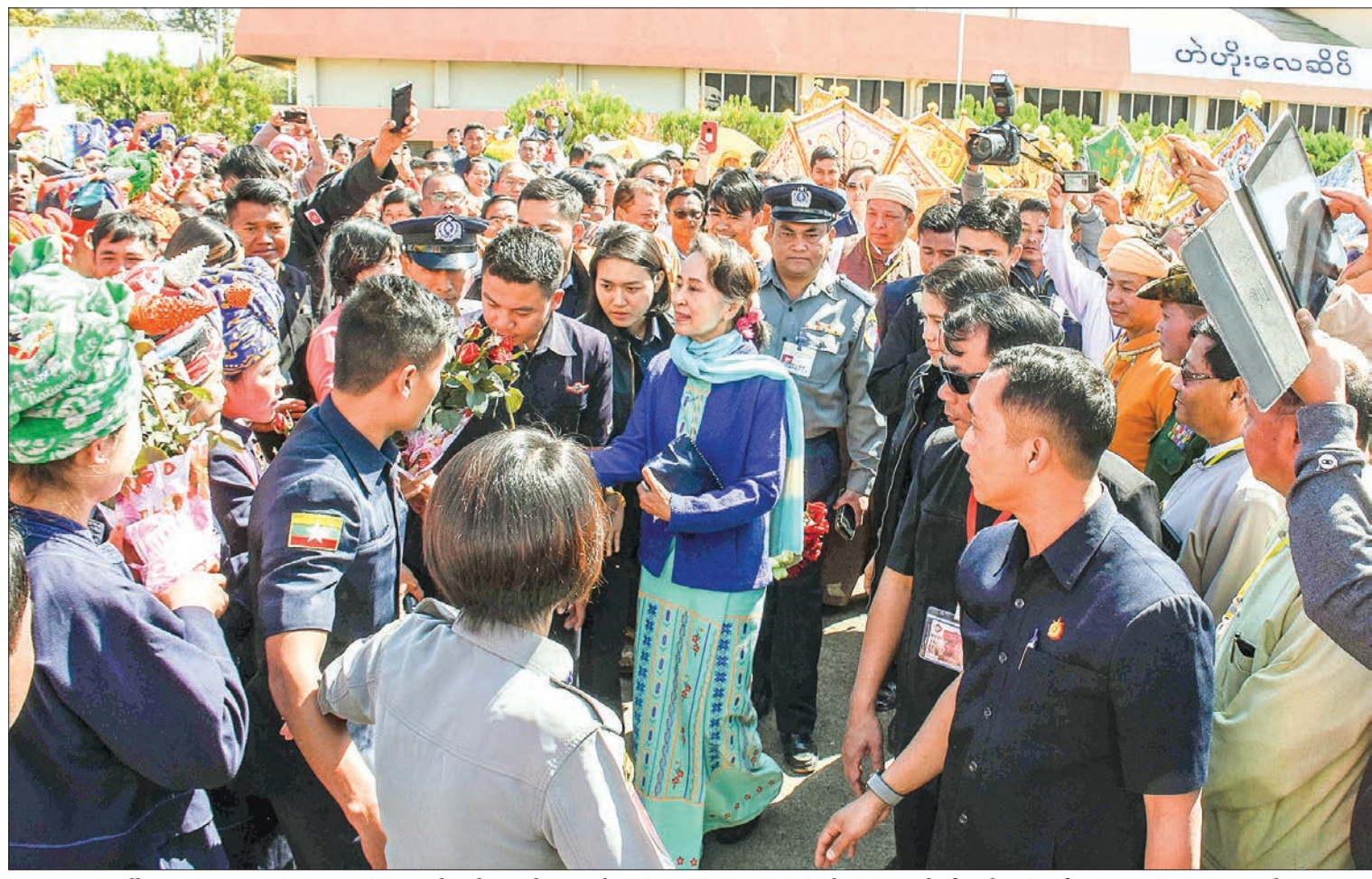
State Counsellor Daw Aung San Suu Kyi greets local people at Heho Airport in Taunggyi, Shan State, before leaving for Nay Pyi Taw yesterday.

As the capital of Shan State, Taunggyi has improved physically, but the mindset of the people about environmental issues needs to change, she said,