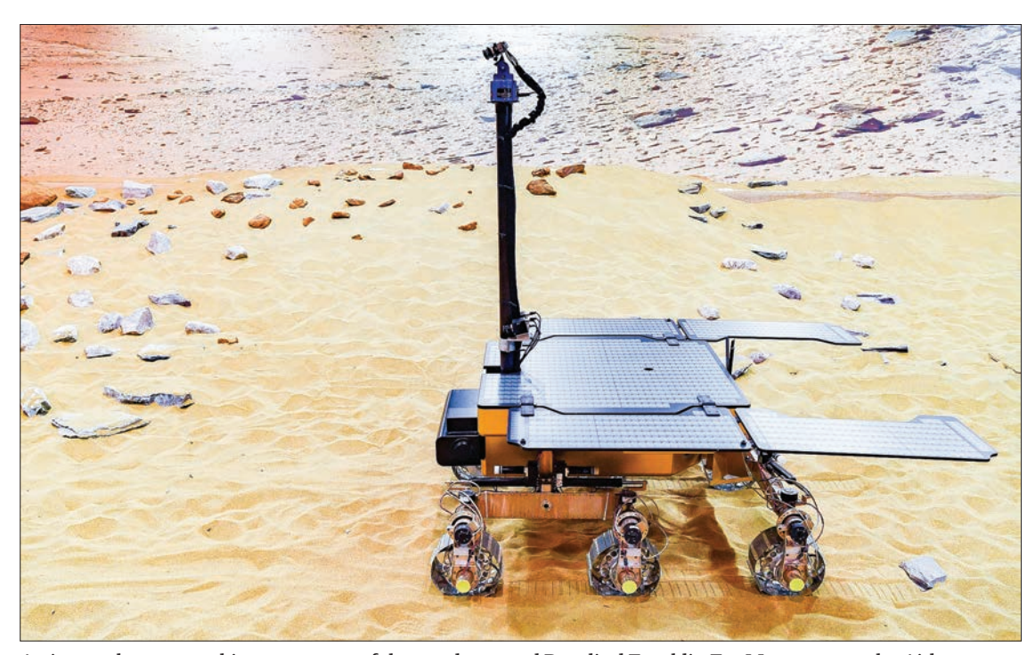
A picture shows a working prototype of the newly named Rosalind Franklin ExoMars rover at the Airbus Defence and Space facility in Stevenage, north of London on 7 February, 2019.

Franklin's work was used to formulate the seminal 1953 hypothesis about the structure of DNA—the molecule containing an organism's genetic code. She died of cancer at the age of 37 in 1958. The three men who were