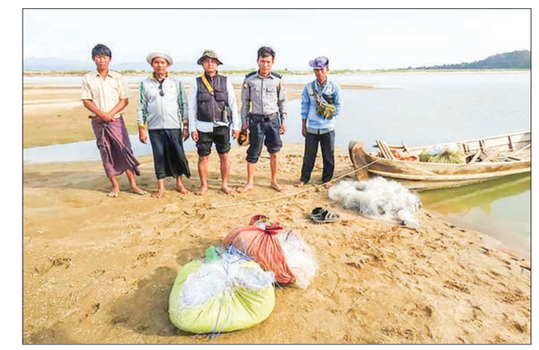
An illegal fishing boat, seized by Sagaing Region governemnt officials, is moored on the river bank.

The Sagaing Region's Department of Fisheries and the Wildlife Conservation Society