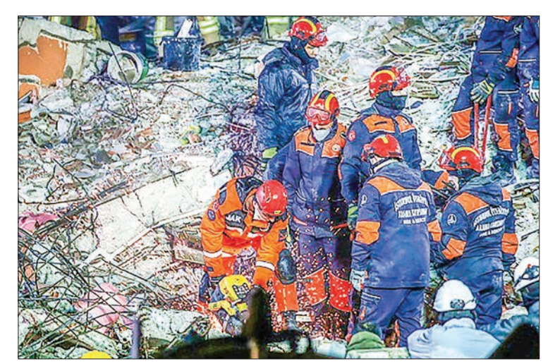
Officials carry out search and rescue missions on the debris of an 8-storey building after it collapsed in Istanbul on 7 February, 2019.