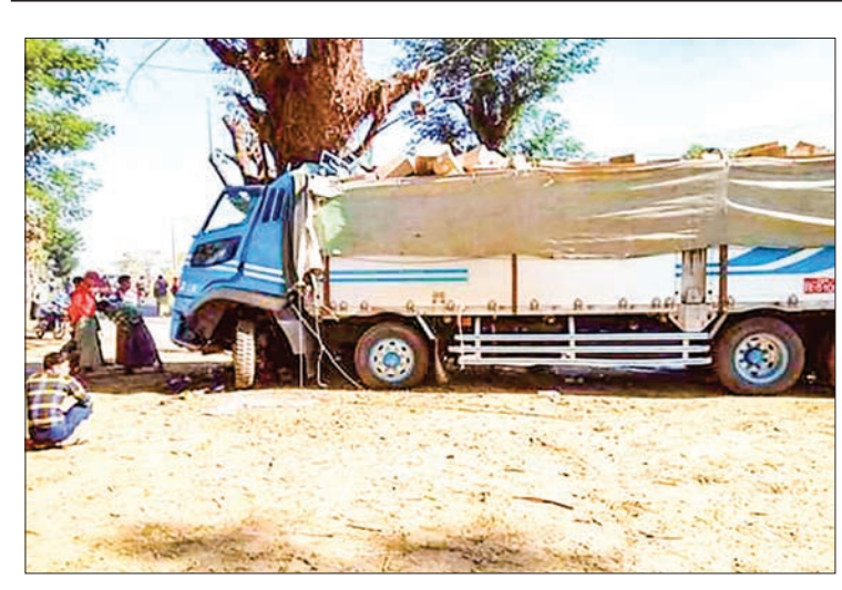
Two men died after a 12-wheel truck struck the tree on Yangon-Mandalay Expressway in Bago.

areas, especially protected areas.—Myo Win Tin (Monywa) ■ (Translated by Khaing Thanda Lwin)