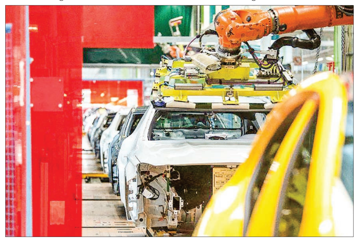
The troubles of the car industry are worry for Europe's overall economy.

ue to monitor closely the situation in Italy," said EU Economic Affairs Commissioner Pierre Moscovici, who handles the fraught negotiations with Rome. —AFP ■