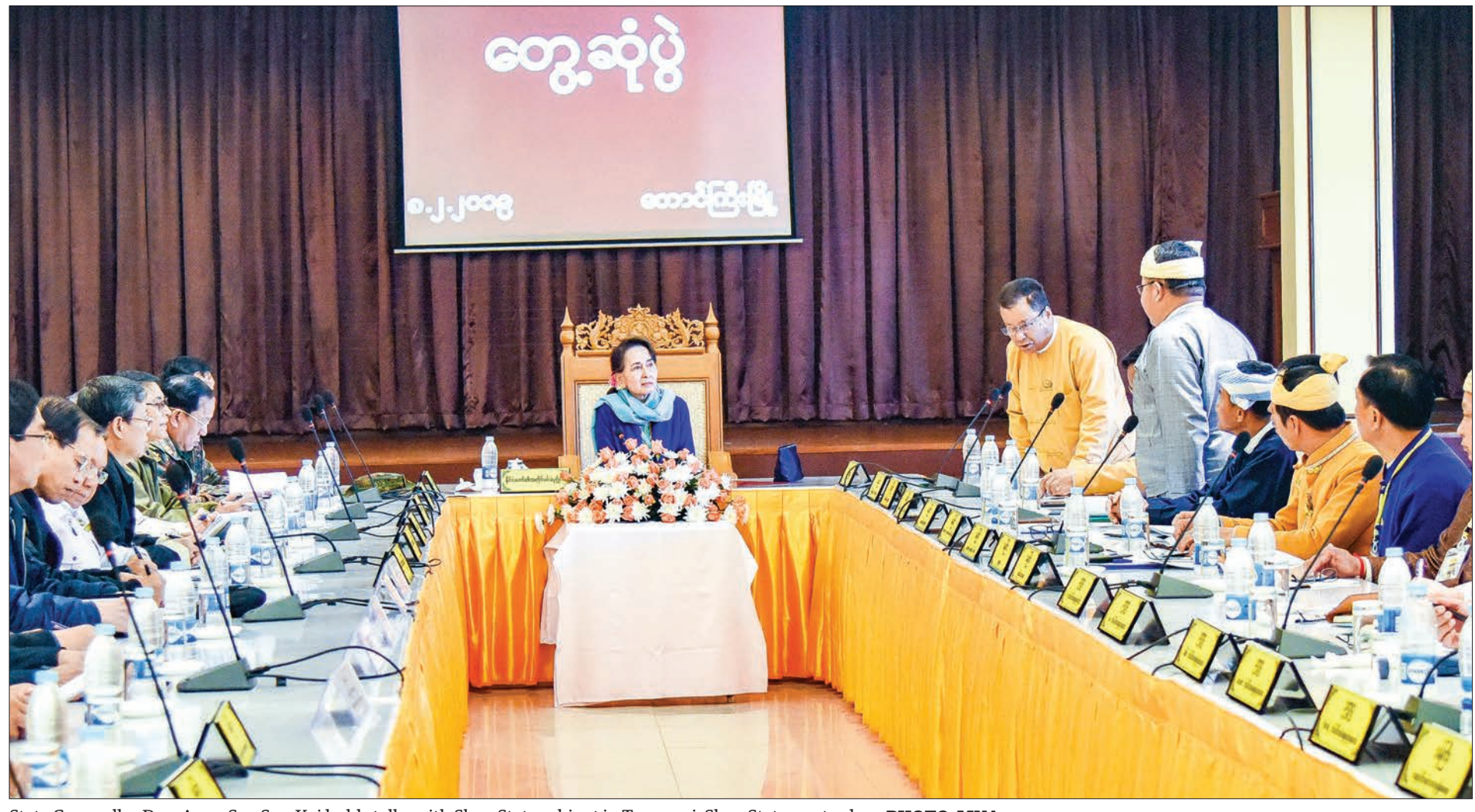
State Counsellor Daw Aung San Suu Kyi holds talks with Shan State cabinet in Taunggyi, Shan State, yesterday.