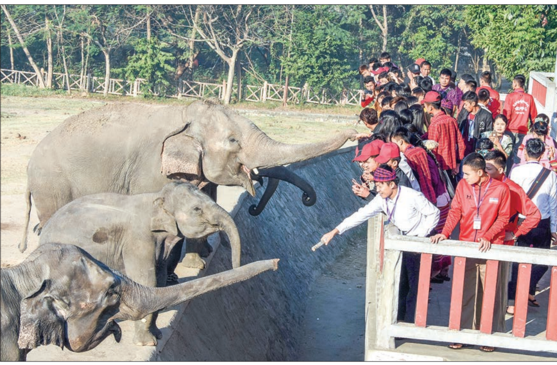
Ethnic cultural troupes feeding elephants at the elephant camp in Nay Pyi Taw.

troupes from Lawwaw and Gaybar ethnic tribes visited the Nay Pyi Taw Zoological Gardens and Safari Park, Planetarium, Bodh