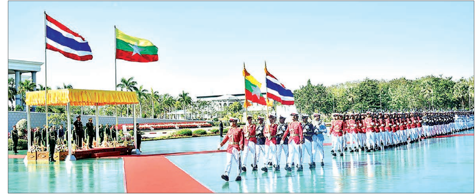
Senior General Min Aung Hlaing and General Ponpipat Benyasri of the Royal Thai Armed Forces observe the honor guard.

At the meeting, they exchanged views on the role of the two armed forces for the peoples of the two countries, the important role of the armed forces of Thailand as a good neighbor of Myanmar in emergence of the Nationwide Ceasefire Agreement in 2015, cooperation of the two armed forces from the top to lower levels, exchange of cultural troupes and sports teams, promoting of exchange of friendship visits, cooperation