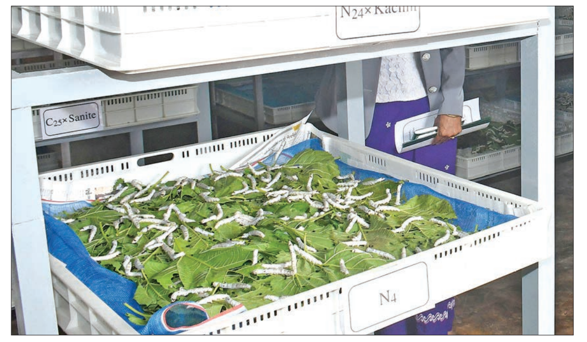
Silkworms surrounded by mulberry leaves on display at the research centre in PyinOoLwin.

EFFORTS are needed to produce value-added products through sericulture and find more domestic and external markets, said silkworm plant growers.