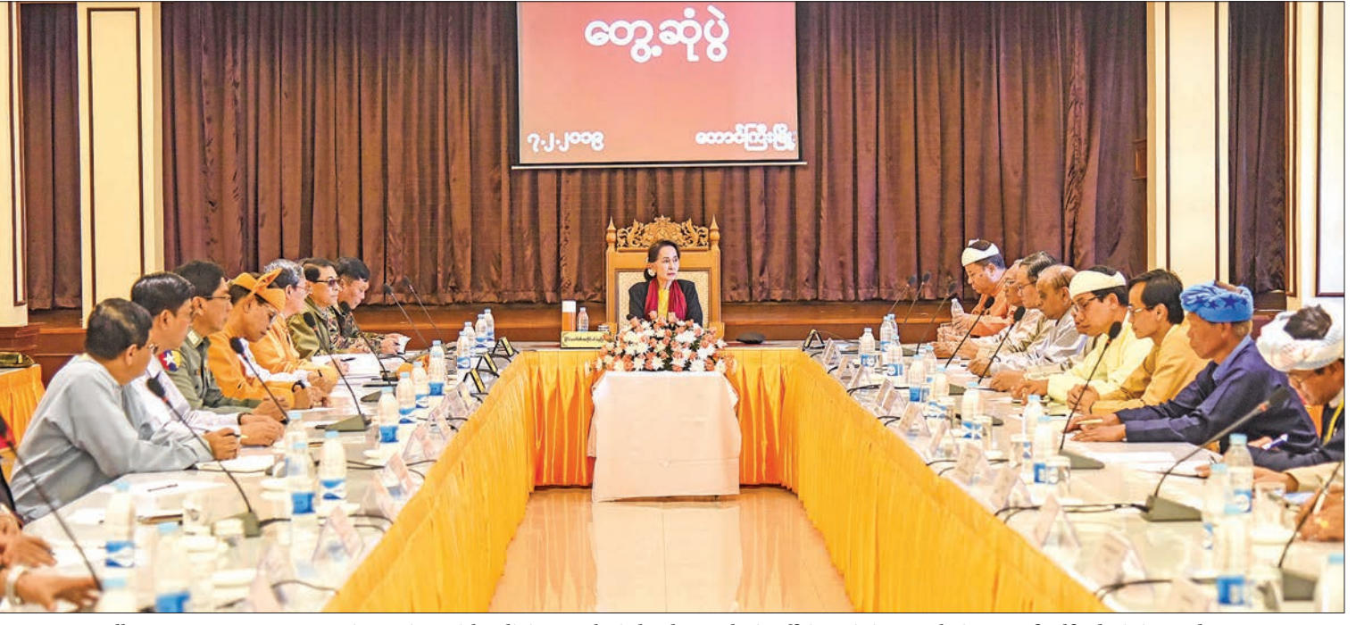
State Counsellor Daw Aung San Suu Kyi meeting with religious, ethnic leaders, ethnic affairs ministers, chairmen of self-administered zones, regional leading bodies in Taunggyi, southern Shan State on 7 February 2019.

Next, religious leaders, ethnic national leaders, min-