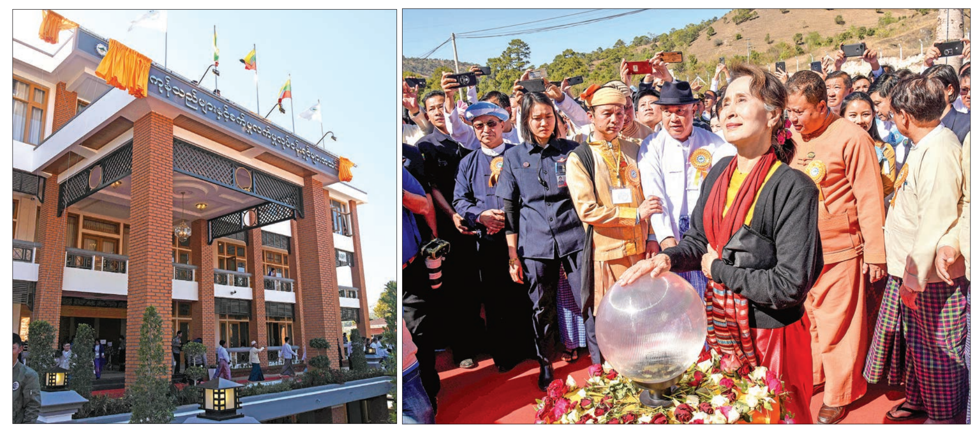
State Counsellor Daw Aung San Suu Kyi formally opens the building of Shan State (South) Federation of Chambers of Commerce and Industry in Taunggyi yesterday.