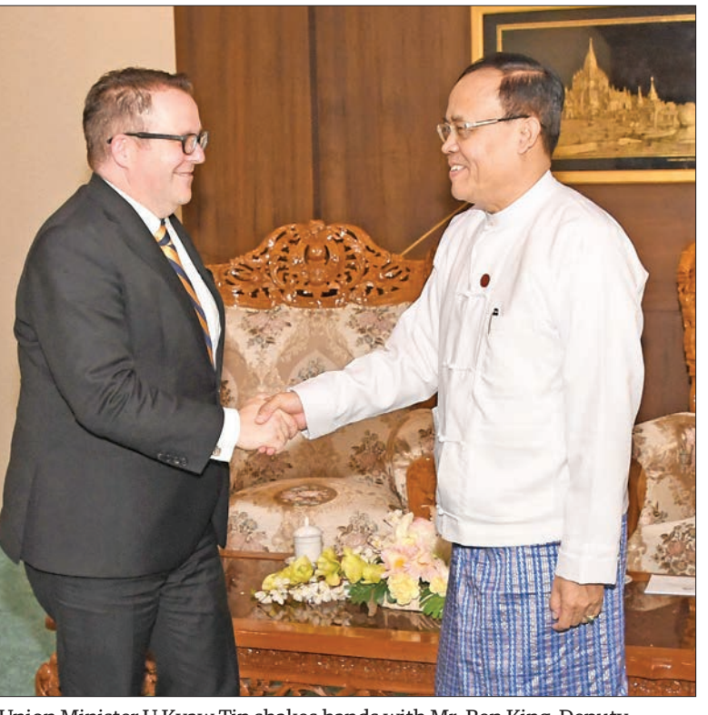
Union Minister U Kyaw Tin shakes hands with Mr. Ben King, Deputy Secretary of Asia and Americas Group of the Ministry of Foreign Affairs and Trade of New Zealand in Nay Pyi Taw yesterday.

Also present at the meeting were officials from the Ministry of Foreign Affairs and Mr. Knut