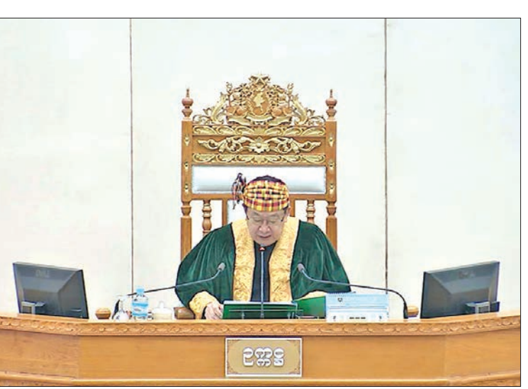
Pyithu Hluttaw Speaker UT Khun Myat.

There were some studies and submissions made by both foreign and local investors to invest in Kayah State and an investment