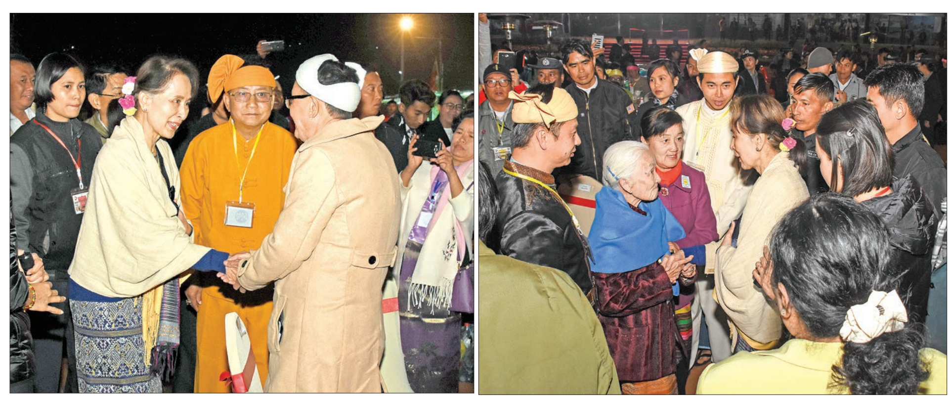
State Counsellor Daw Aung San Suu Kyi greets elderly persons at the dinner to mark the 72<sup>nd</sup> Shan State Day in Taunggyi, southern Shan State yesterday.