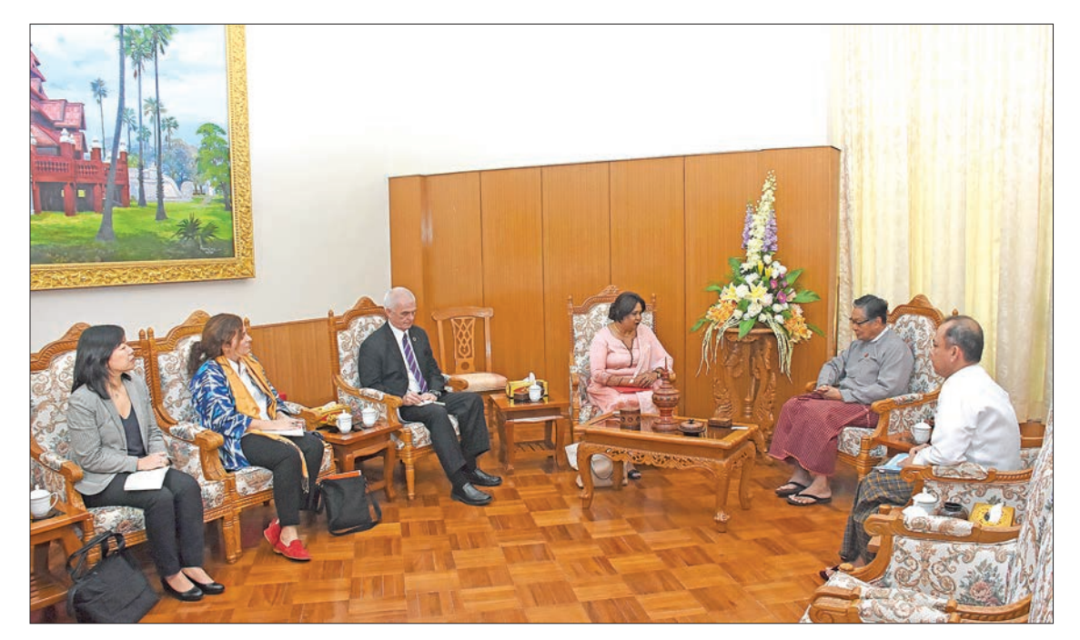
General on Sexual Violence in Conflict in Nay Pyi Taw yesterday.

UNION Minister for the Office of State Counsellor U Kyaw Tint Swe received Ms. Pramila Patten, Special Representative of the Secretary-General on Sexual Violence in Conflict, at the Ministry of the Office of the State Counsellor, Nay Pyi Taw at 1100 hours on 7 February 2019. During the meeting, they