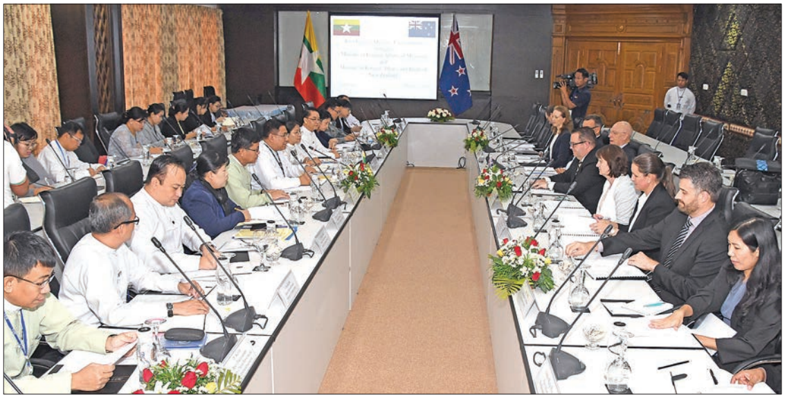
First Myanmar-New Zealand Foreign Office Consultations in progress in Nay Pyi Taw yesterday.

lations and cooperation, Foreign Policy settings and priorities as well as security and stability in the region. They also deliberated on Myanmar-New Zealand Joint Commitment for Development (JCfD) and its priority areas such as agriculture, renewable energy, knowledge and skills and disaster risk management, and potential new areas of cooperation. Permanent Secretary also briefed on the Government's priorities and ongoing efforts for peace and national reconciliation, recent developments in