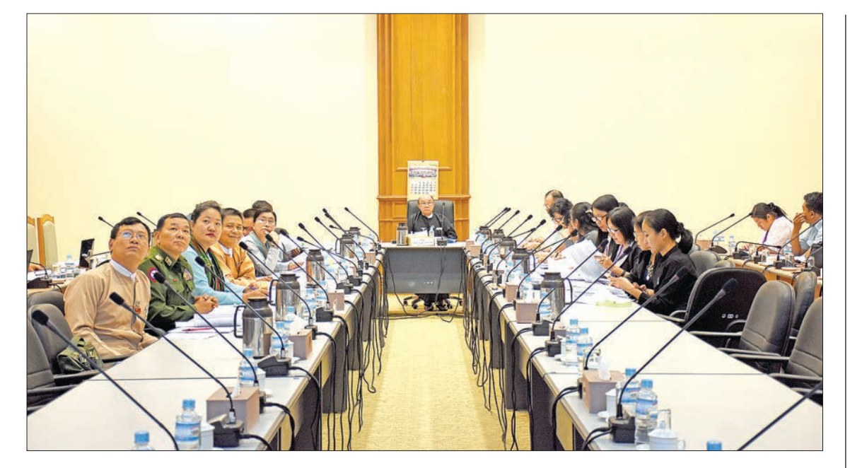
Deputy Speaker of Pyidaungsu Hluttaw, U Tun Tun Hein, discusses two bills disagreed on by the Hluttaws at a Pyidaungsu Hluttaw Joint Bill Committee in Nay Pyi Taw.