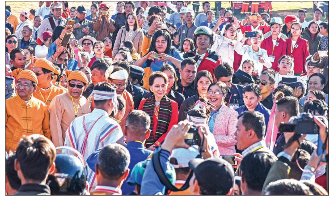
State Counsellor Daw Aung San Suu Kyi is welcomed by local people as she arrives to attend the 72<sup>nd</sup> Shan State Day celebrations in Taunggyi yesterday.

In the evening, the State Counsellor and party attended a dinner to mark the 72<sup>nd</sup> Anniversary Shan State Day hosted by the Shan State Government.—MNA (Translated by GNLM)