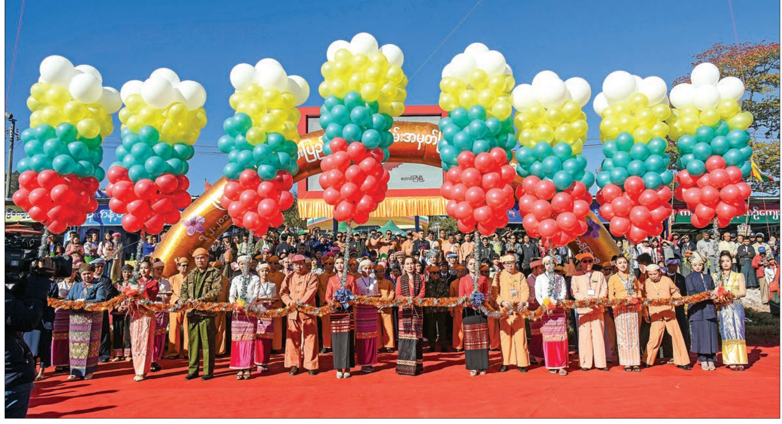
State Counsellor Daw Aung San Suu Kyi cuts ceremonial ribbon to open the exhibition of 72<sup>nd</sup> Shan State Day celebrations in Taunggyi.

"As you all know, we have not yet reached our goal of a genuine democratic federal Union. It is our duty to march towards and reach the goal, and that is the historic duty of our generation. Every generation has its own historic duty. In our history, some