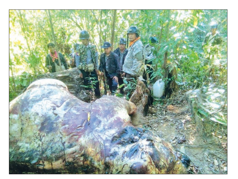
Authorities inspect an elephant carcass and parts of elephant skin.