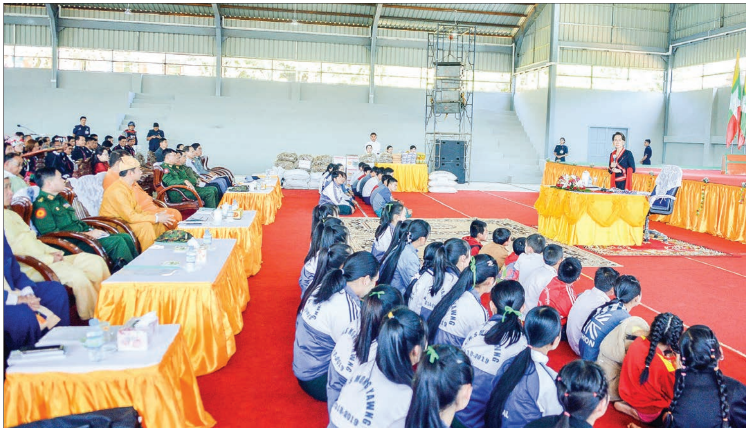
State Counsellor Daw Aung San Suu Kyi meets with local people from Mongyawng in Shan State yesterday.