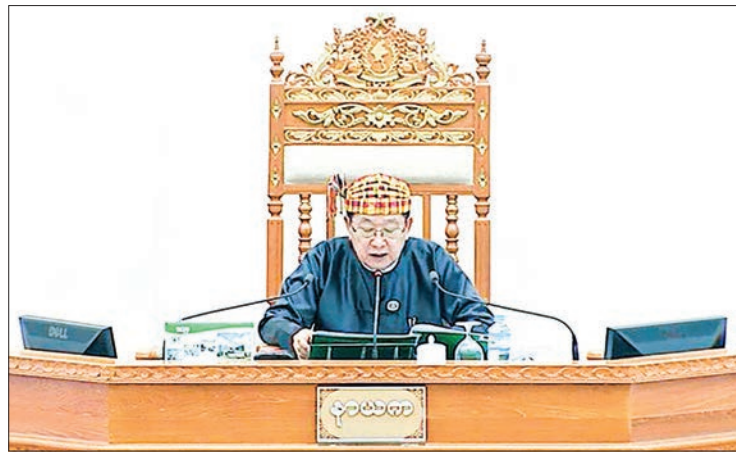
Pyidaungsu Hluttaw Speaker U T Khun Myat.

a precedent (which must be followed by the current Hluttaw). U Maung Myint expressed his view that the claim made by the proposer of the motion that it was done so in conformity with Rule 66 and that the proposal does not involve sections 433, 434 and 435 of the Constitution is wrong. He stated that if the constitution is to be amended sections 443, 444 and 445 of the constitution cannot be put in abeyance.