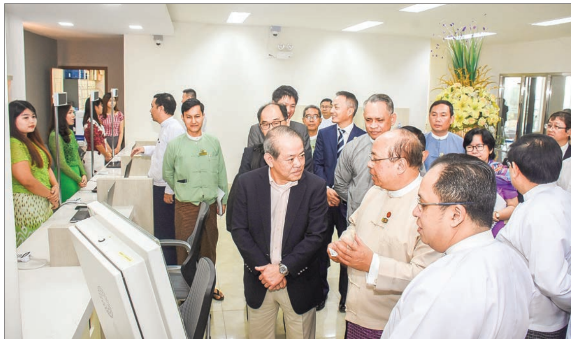
Union Minister U Thaung Tun inspects One Stop Service Centre in Thilawa Special Economic Zone.

THE Chairman of Myanmar Investment Commission (MIC) and Union Minister for Investment and Foreign Economic Relations, U Thaung Tun and MIC members visited Thilawa Special Economic Zone in Thanlyin Township this morning.