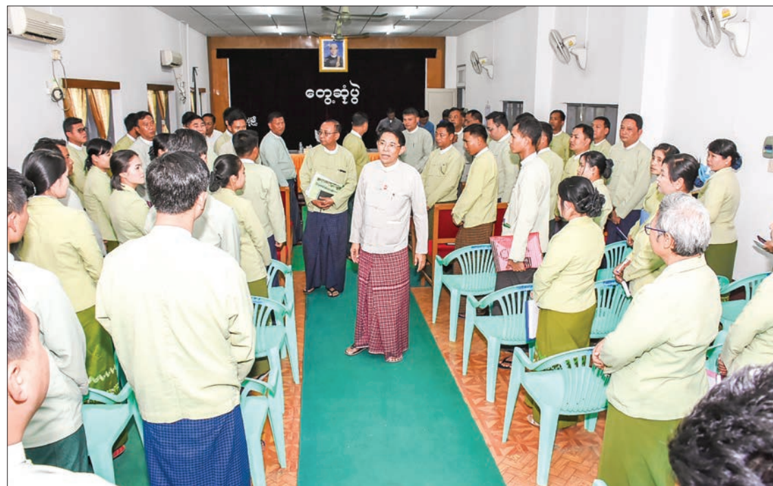
Union Minister U Min Thu greets staff from General Administration Department in Shan State (East).

Point Number Three: Don't be afraid of reforms, carry them out bravely while anticipating changes ahead, as we have been known to do. Not being prepared to change can result in breaking away from work processes and cause stress at work. Reforms start with changes in individual mindsets and convictions, and government employees are urged to commit to them. With peace of mind, employees must carry out reforms with added momentum to become a model for reforms in Myanmar, just as the "General Administration Department is a model for reforms".