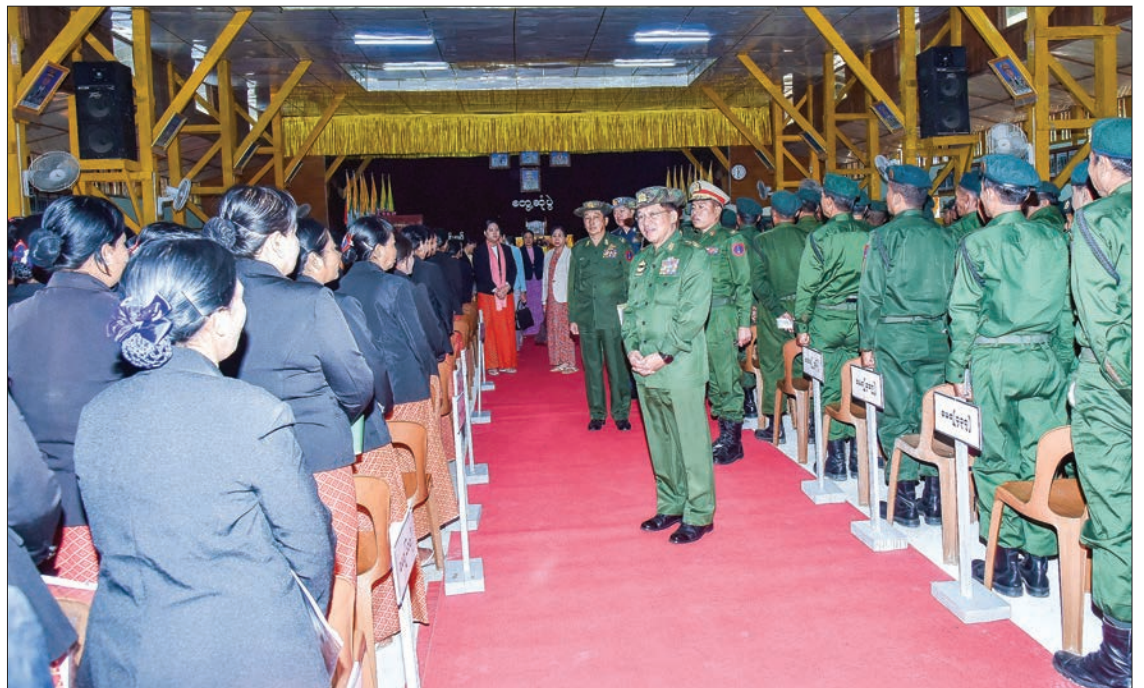
Senior General Min Aung Hlaing meeting with officers, other ranks and families of the Bhamo Cantonment in Myitkyina yesterday.

Tatmadaw Commander-in-Chief and party went to Tatmadaw hospitals to encourage Tatmadaw personnel from Myitkyina and Bhamo undertaking treatments and presented foods. Similarly wife of Tatmadaw