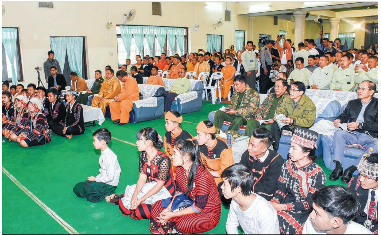
State Counsellor Daw Aung San Suu Kyi meets with local people in Tachilek in Shan State yesterday.