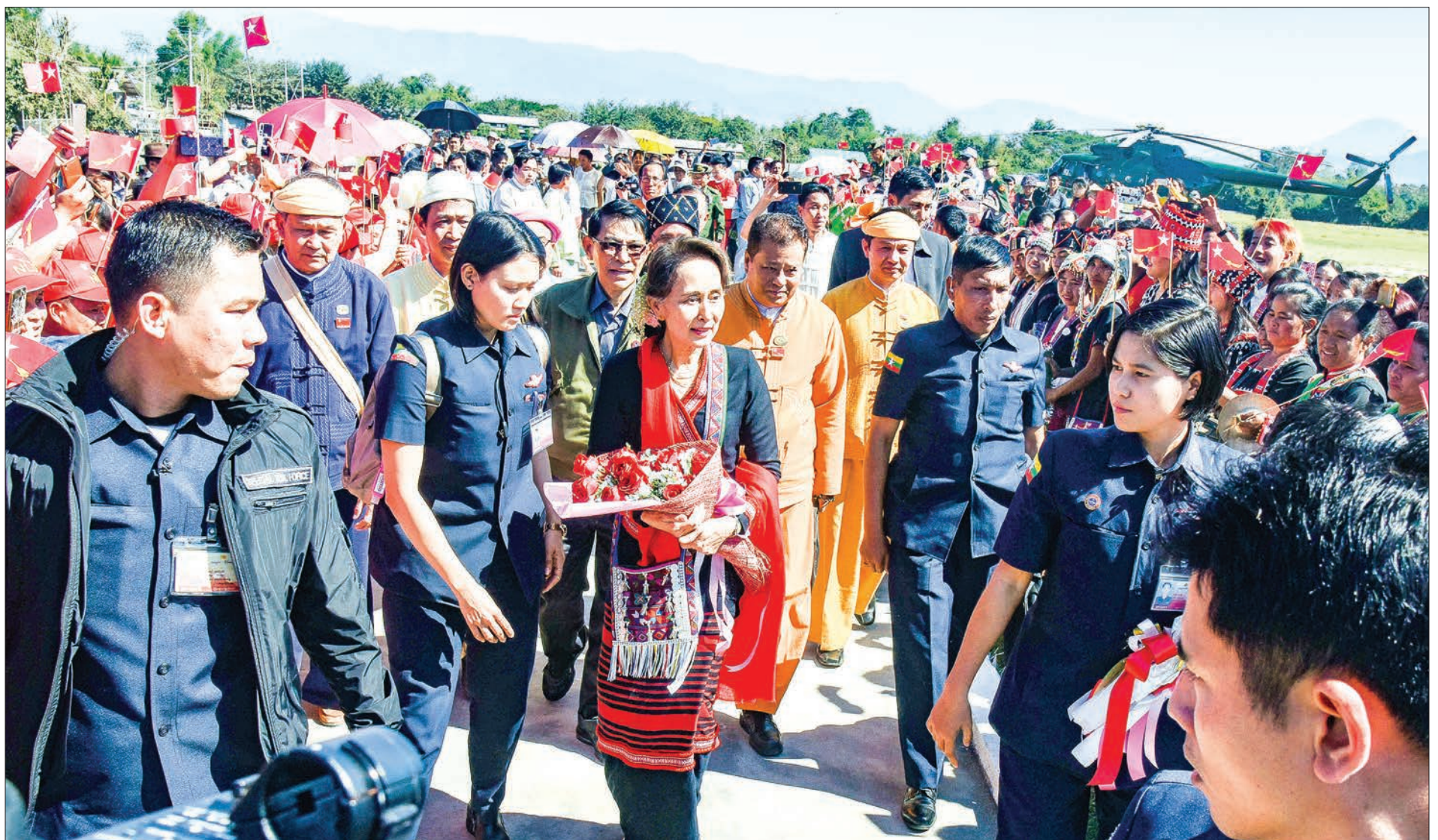
State Counsellor Daw Aung San Suu Kyi is welcomed by local people as she arrives at Mongyawng in Shan State yesterday.

S TATE Counsellor Daw Aung San Suu Kyi, in her capacity as Chairperson of the Central Committee to Implement the Development of Border Areas and Ethnic Nationals, visited Tachilek Township in Shan State yesterday.