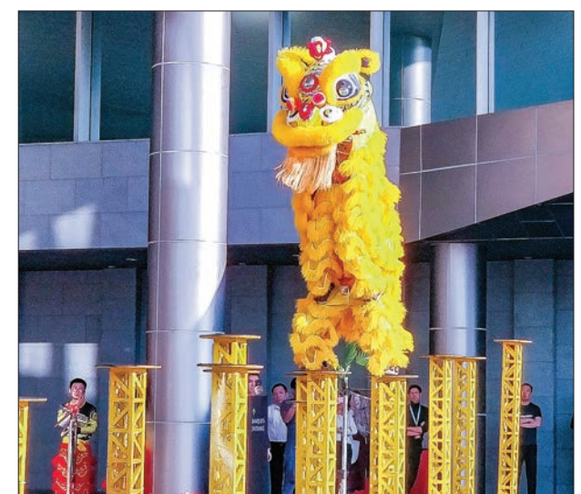
As an important tradition of Chinese New Year, Lotte Hotel in Yangon entertains visitors with a Lion Dance performance to bring prosperity and good luck for the upcoming year.

An archway in Chinatown wishes people a Happy New Year as Yangonians flock to enjoy the festivities, (Below). Yangon's Chinese community lights traditional incense at a temple in Chinatown. (Bottom left). The celebrations of the Chinese Lunar New Year began in Yangon, yesterday, the first day of the Year of the Pig in China's lunar calendar.