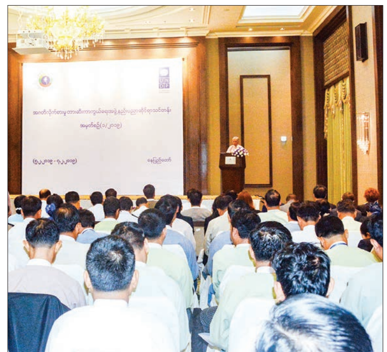
Anti-Corruption Commission Chairman U Aung Kyi addresses the Corruption Prevention Unit's technical training 1/2019 in Nay Pyi Taw.

CUP project is aimed at preventing corruption at the governmental departments and fighting petty corruption and preventing grand corruption. Ms. Dawn Del Rio, Deputy Country Director of UNDP, explained techniques to prevent corruption. 114 officials from 14 ministries, 18 staff from the Anti-Corruption Commission totalling 132 trainees are attending the three day training which will end on 7 February.— MNA