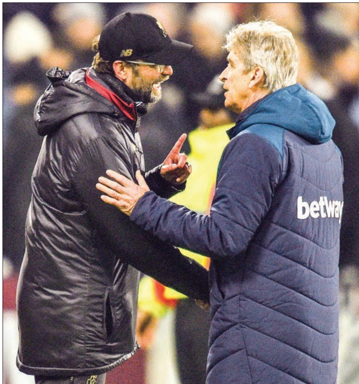
Liverpool's German manager Jurgen Klopp (L) speaks to West Ham United's Chilean manager Manuel Pellegrini after the final whistle in the English Premier League football match between West Ham United and Liverpool at The London Stadium, in east London on 4 February, 2019.

Hammers boss Manuel Pellegrini claimed it was "impossible to play worse" after his side's 3-0 capitulation to Wolves last week that followed a deeply disappoint-