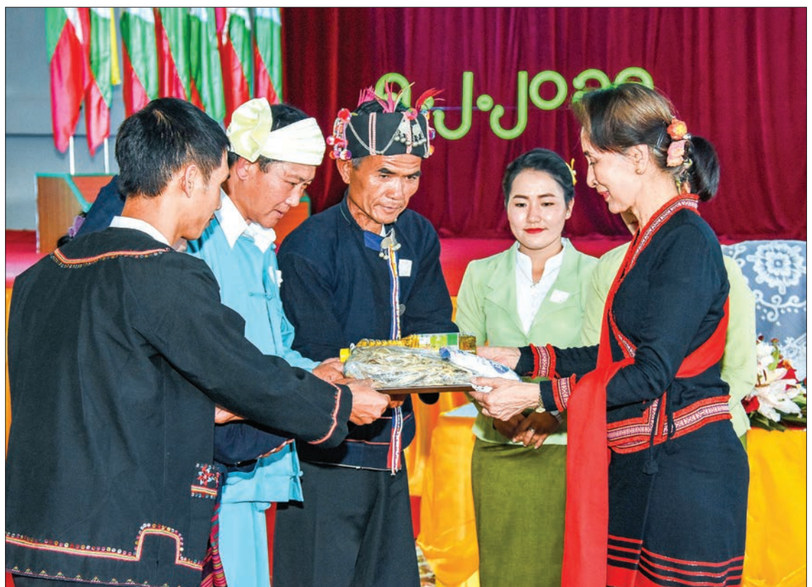
State Counsellor Daw Aung San Suu Kyi presents dried fish, edible oil and salt to the people in Mongyawng Township, Shan State.