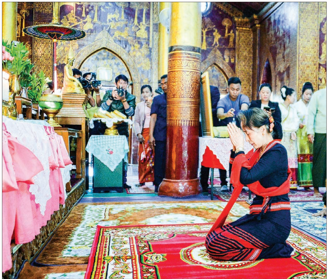
State Counsellor Daw Aung San Suu Kyi pays homage to the Buddha image housed inside Maha Myat Muni Pagoda in Kengtung.