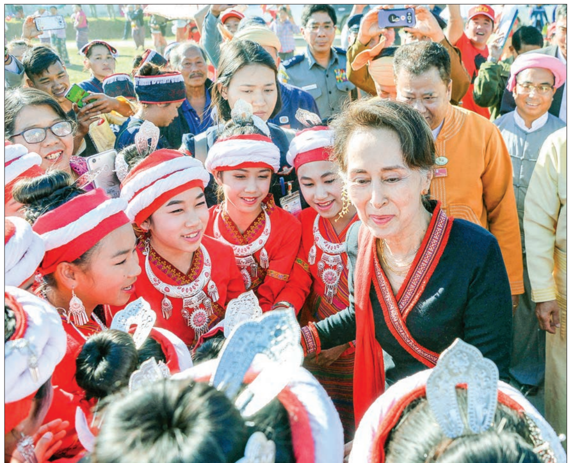
State Counsellor Daw Aung San Suu Kyi greets local ethnic people in Mongyayng.