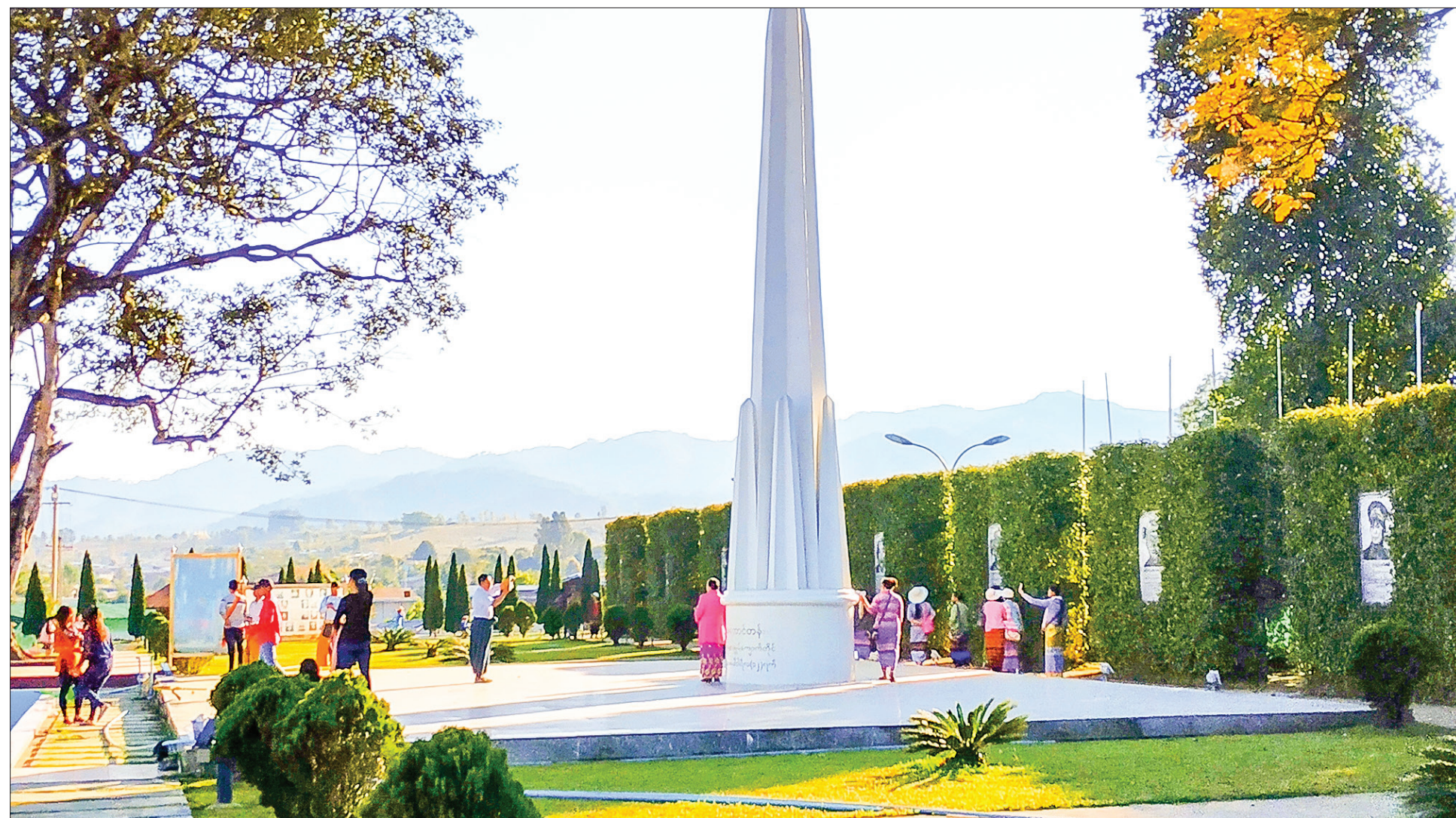
The historic site where the Panglong Agreement took place during the Panglong Conference.