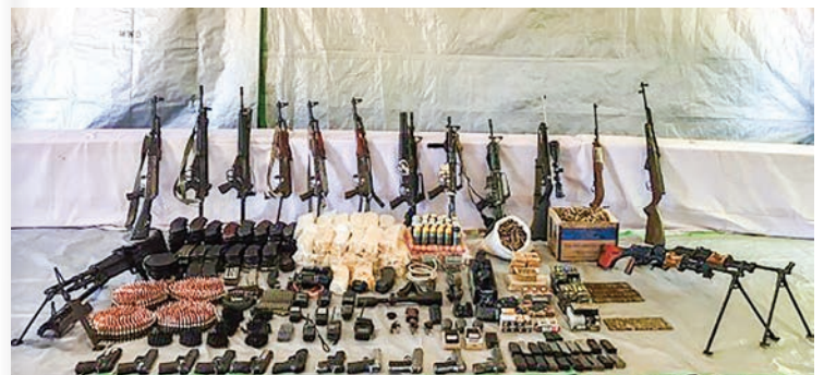
Photo shows arms and ammunition seized by Police Force.

ACTING on a tip off, a combined team intercepted and searched a Pajero near Hteen Shuee Myaing Village and seized a gun and ammunition from the vehicle at 7 pm on 1 February.