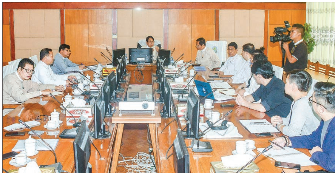
Union Minister Dr. Pe Myint addresses the coordination meeting to shoot major scenes of the movie Line Walker-2 held in Nay Pyi Taw yesterday.

Myanmar audience will be interested and like to see firsthand how movies are made in