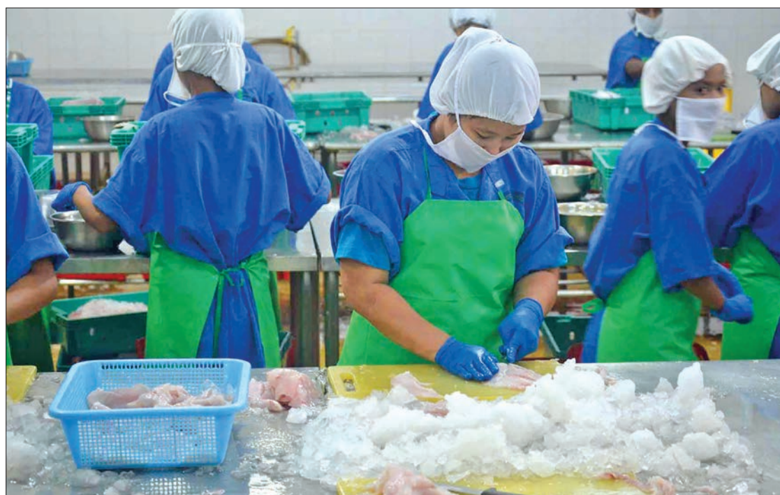
Workers handle produce at a fish processing factory in Yangon.

However, only the Pangasius Bocourtic species is registered for export to China, and so the Chinese authorities are rejecting Pangasius Hypophthalmus exported from Myanmar. According to the MFF, an official complaint has been sent to the Chinese government through the Myanmar embassy in China to resolve the problem, but the Chinese authorities are yet to grant permission for entry of Pangasius Hypophthal-