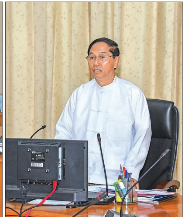
Vice President U Myint Swe delivers the speech at the 2 nd coordination meeting to organize 72 nd Union Day Ceremony held in Nay Pyi Taw yesterday.

VICE PRESIDENT U Myint Swe, in his role as Chairman of the Central Committee for Convening the 72 nd Union Day Ceremony, delivered the opening speech at the central committee's second coordination meeting in Nay Pyi Taw yesterday.