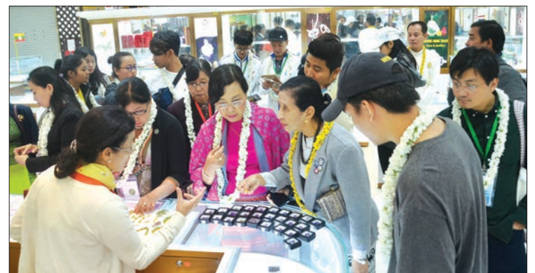
Artists visit Mandalay Yatanar Mall.