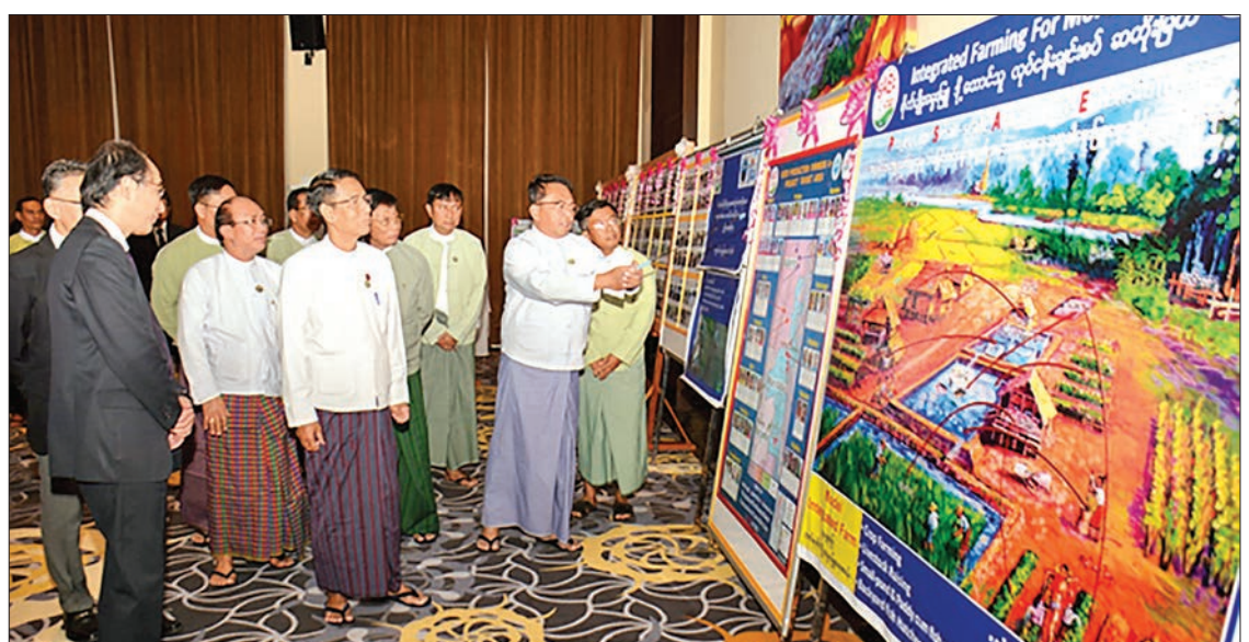
Union Minister Dr. Aung Thu observes the project plan for integrated farming.

This program is based on the local people's actual requirements and is implementing breeding system of aquatic animals appropriate for the local situation, which includes small input breeding system such as rice-fish breeding system. A hard core fish breeding farmer group will be established and through this, develop quality fish fingerlings with an aim of spreading important and technical information and providing fish fingerlings.—MNA