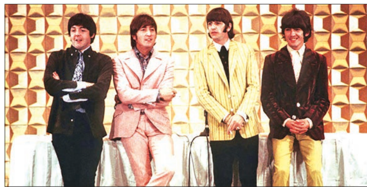
Peter Jackson says his new documentary on the Beatles will provide ‘unprecedented’ insight into the band’s creative process.

WELLINGTON (New Zealand) —Acclaimed “Lord of the Rings” director Peter Jackson announced Thursday he is working on a documentary detailing the making of The Beatles’ classic album “Let It Be” 50 years ago. The New Zealander said the film was based on 55 hours of never-before-seen footage and 140 hours of audio from the Fab Four’s recording sessions. Jackson said it provided an unprecedented insight into to band’s creative process and their interactions in the studio. “This movie will be the ultimate fly-on-the-wall experience that Beatles fans have long dreamt about,” he said in a statement. “It’s like a time machine transports us back to 1969 and we get to sit in the studio watching these four friends make great music together.”