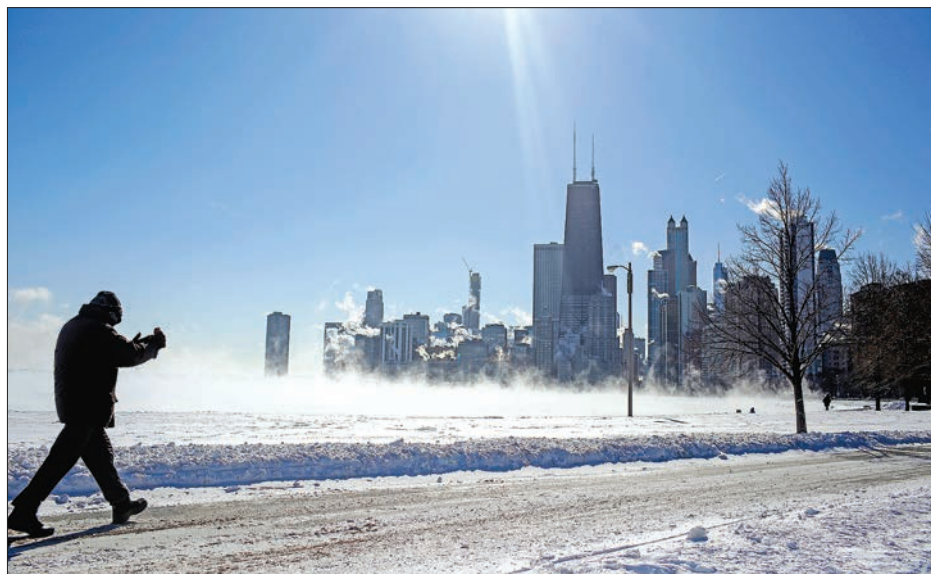
A man takes a photo of Lake Michigan and the skyline as temperatures dropped to -20 degrees F (-29 °C) in Chicago.

"This is a historic cold, obviously," Chicago Mayor Rahm Emanuel told a Wednesday night news