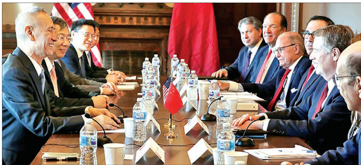
Beijing's trade envoy Liu He (L) meets with US Trade Representative Robert Lighthizer (R) at the Eisenhower Building near the White House.

The two sides have just a month remaining in a 90-day truce declared in December. Should the talks fail, US import duties on $200 billion in Chinese imports are due to more than double on 2 March — something economists say could help knock the wind out of the global econ-