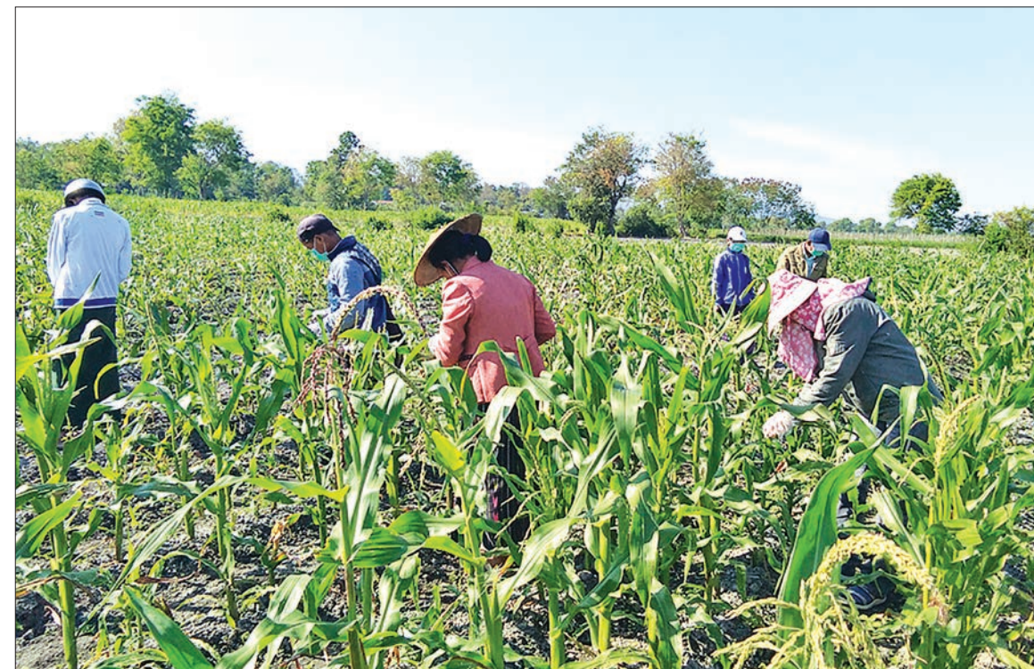
Agricultural experts monitor corn plantation which is threatened by pests in Dimawso.

How to increase food production using less water is one of the great challenges of the future; crops and livestock use 70 per cent of all water withdrawals and up to 95 per cent is in some developing countries; it is estimated that 1.8 billion people are projected to be living in countries or regions with abso-