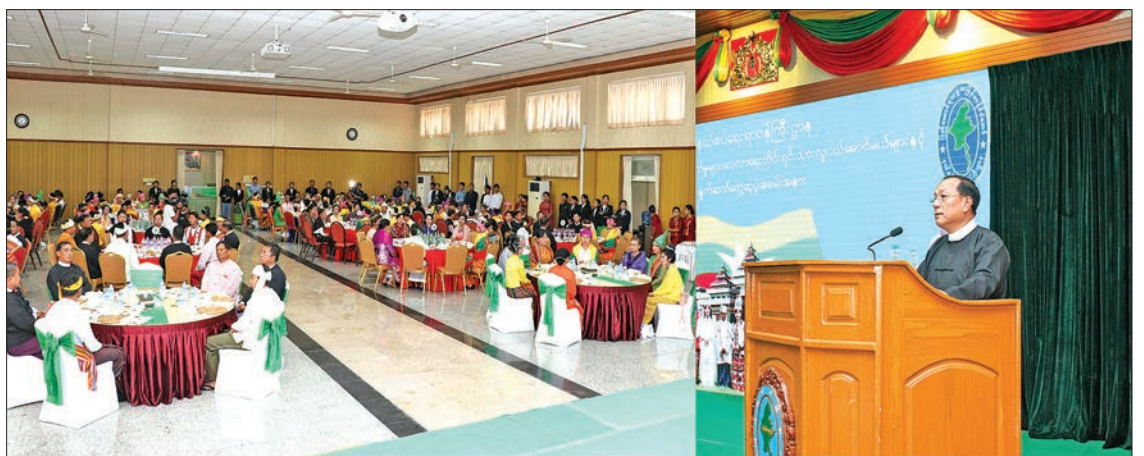
Union Minister Lt-Gen Ye Aung addresses the ethnic excursion group in Nay Pyi Taw.

Affairs is implementing basic infrastructures in every remote and difficult to travel border areas for the socio-economic development of the local populace. For the sustainable development, human resources development is being implemented in a balanced manner. The ministry places emphasis toward sustainable development of the entire country including states, regions as well as mountain and hill areas. Only then can the ethnic nationals in border area achieve equal and fair benefits. The country is implementing national reconciliation and peace process. The strength of the country lies within and through the collective strength of ethnic nationals based on national spirit, efforts must be made toward becoming