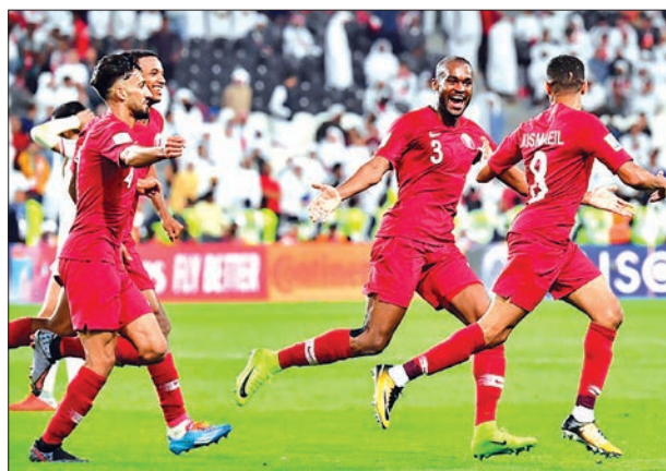
The 2022 World Cup hosts believe they have nothing to fear from the Blue Samurai.

“We will need patience in the final but if we are pa-