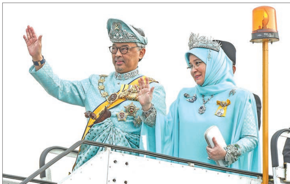
This handout photo taken and released by Malaysia's Department of Information on 31 January, 2019 shows the sixth Sultan of Pahang, Al-Sultan Abdullah Ri'ayatuddin Al-Mustafa Billah Shah Ibni Sultan Ahmad Shah Al-Musta'inBillah, (l), and Queen TunkuHajahAzizahAminahMaimunahIskandariahbinti Al-Marhum Al-MutawakkilAlallah Sultan Iskandar Al-Haj, (r), waving to well-wishers at a military airport in Kuantan, Pahang, before departing to Kuala Lumpur for the official oath taking ceremony as the 16 th King of Malaysia.

No official reason was given for his abdication, but it was the first time a king had stepped aside before the end of his term in the