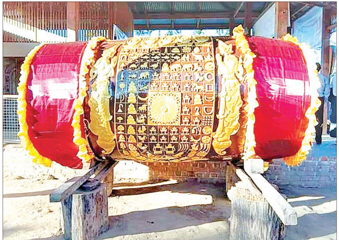
World's largest drum is constructed in Indaw Township.

According to Saya Pwel Myanmar Instrument Enterprise, the world's biggest drum has been carved from Kokko (Albizia lebeck) tree wood. The drum measures 128