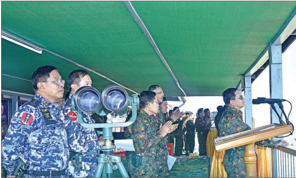
Senior General Min Aung Hlaing observes the joint military exercise conducted by troops of the Tatmadaw in Meiktila cantonment yesterday.