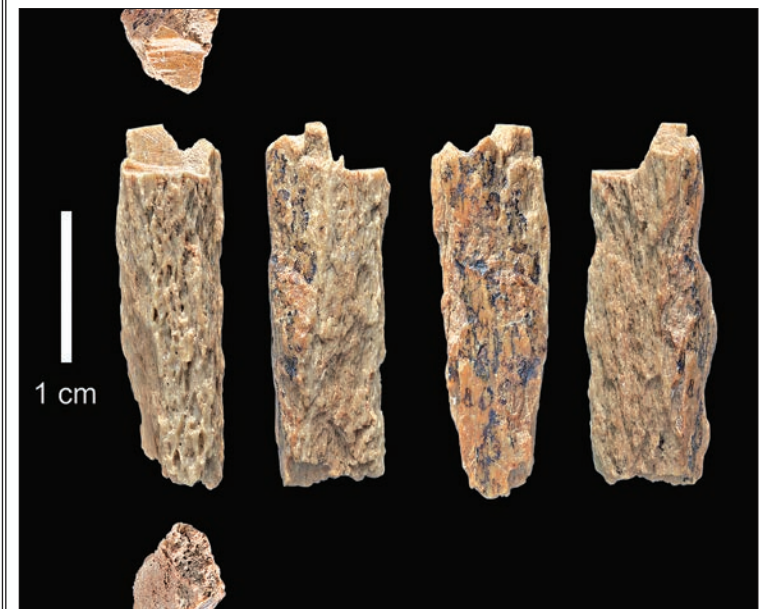
University of Oxford/Max Planck Institute images of a bone fragment of a female—known as ‘Denisova 11’? born of a Neanderthal mother and a Denisovan father. The bone was found in 2012 by Russian archaeologists at Denisova Cave in Siberia.

PARIS (France)—A rare species of primitive human roamed the forests of Eurasia 200,000 years ago and may have made tools and even jewellery, according to new research published Wednesday. Denisovans—a cousin of Neanderthals—were discovered in 2010 when scientists working in a cave in southern Siberia obtained a finger bone of a girl belonging to a previously unidentified group of humans.