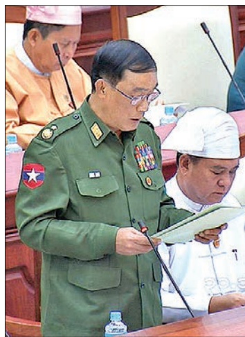
Maj-Gen Than Htut.

struction was completed and if there will be any actions taken against the construction company or inspecting authorities. Deputy Minister for Border Affairs Maj-Gen Than Htut replied that Augusta Co., Ltd. start the construction of the bridge on 25 October 2017 and was completed on 6 March 2018. Township quality inspection committee and State Hluttaw representative inspected the bridge during and after the construction of the bridge fully comply with the quality requirement. The reason the bridge was damaged was not due to inadequate or sub-standard construction but due to natural disaster, the extreme flow of the river during the raining season. As the company that constructed the bridge had conducted neces-