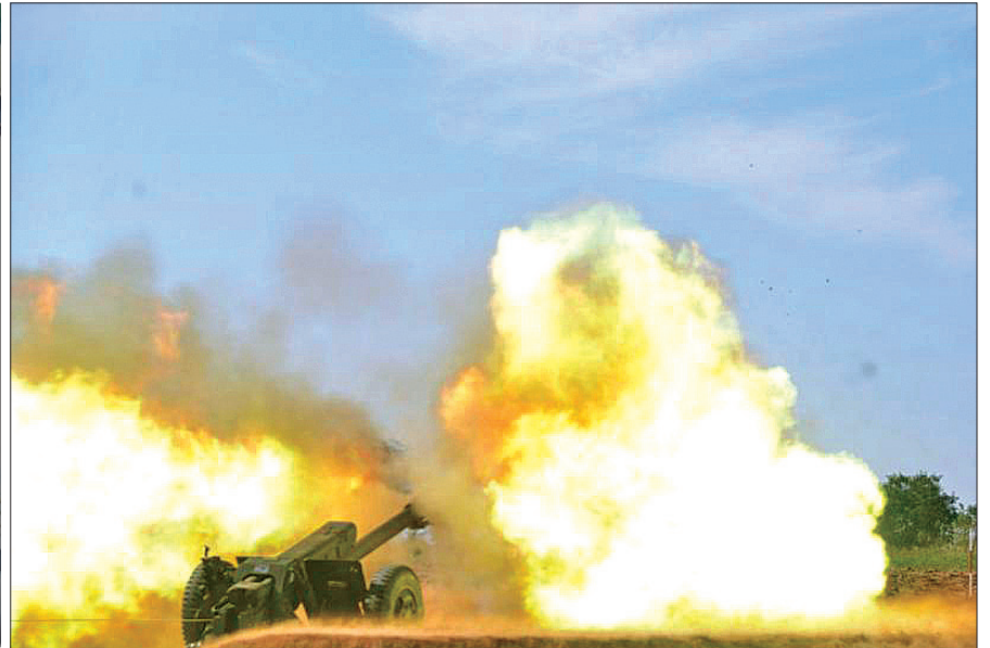
Artillery guns fire at target during a joint military exercise in Meiktila cantonment yesterday.

Tatmadaw Commander-in-Chief Senior General Min Aung Hlaing observed and inspected the Tatmadaw army and air joint military exercise of air, artillery and armored forces in Meiktila cantonment yesterday held with the aim towards security and defence of the country and to raise the capability of the armed forces.