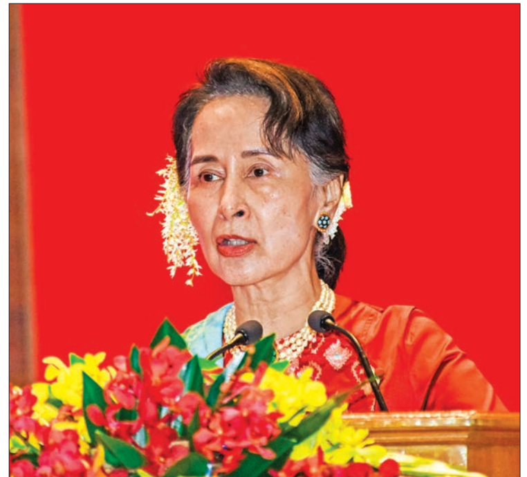
State Counsellor Daw Aung San Suu Kyi delivers the opening speech at the opening ceremony of Investment Myanmar Summit 2019 in Nay Pyi Taw yesterday.