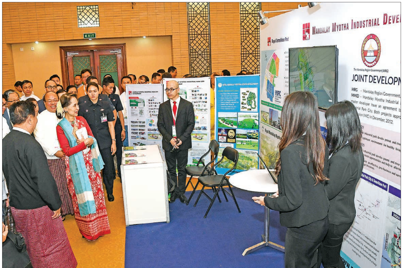
State Counsellor Daw Aung San Suu Kyi visits the Mandalay Myotha Industrial Development booth at the Invest Myanmar Summit 2019 in Myanmar International Convention Center II in Nay Pyi Taw yesterday.

With the launch of the Companies Law, we have been able to open up new economic sectors to investment. For example, in 2018 this administration successfully opened Myanmar to wholly foreign-owned firms operating in the wholesale and retail sectors, a move which has attracted solid investor interest from Europe,