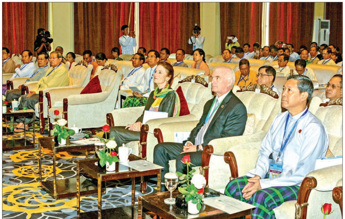
State Counsellor Daw Aung San Suu Kyi, (Left), addresses the High Level Forum on Realizing Myanmar's Development Vision for Every Child, in Nay Pyi Taw.

STATE Counsellor Daw Aung San Suu Kyi addressed an opening ceremony of a High Level Forum on “Realizing Myanmar’s Development Vision for Every Child” held in Park Royal Hotel, Nay Pyi Taw yesterday afternoon.