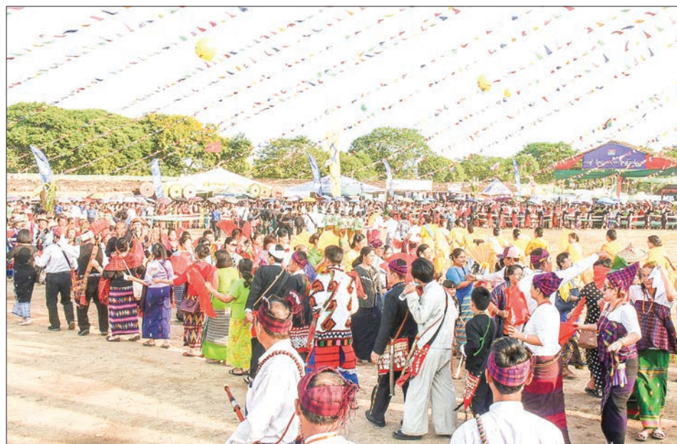
A multitude of festivalgoers join in the Manaw dance at Myanmar Ethnic Culture Fest in Kyaikkasan Sports Ground in Yangon.