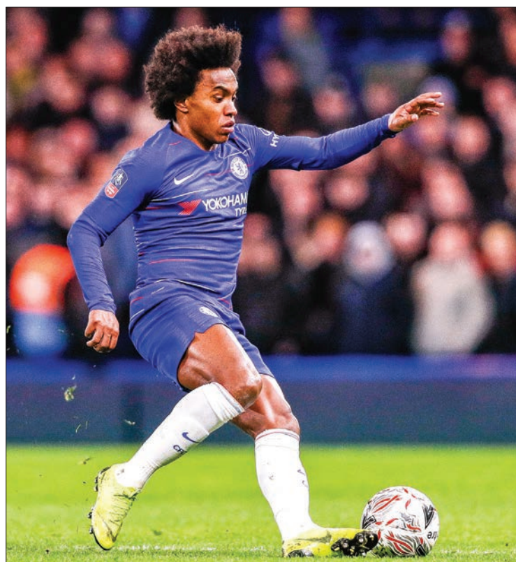
Chelsea's Brazilian midfielder Willian plays the ball during the English FA Cup fourth round football match between Chelsea and Sheffield Wednesday at Stamford Bridge in London on 27 January, 2019.

The Brazilian gave the Blues a 26th-minute lead from the penalty spot but it was not until midway through the second half that second-tier Wednesday conceded again when Callum Hudson-Odoi, linked with a transfer window move to Bayern Munich, made it 2-0. Willian completed the scoring seven minutes from time as Chelsea won their second knockout match in a matter of days after a midweek penalty shoot-out victory over Tottenham Hotspur in the semi-finals of the League Cup. Sunday also saw Gonzalo Higuain make his Chelsea debut after the Argentinian striker signed on loan until the end of the season from Juventus on Wednesday.—AFP ■