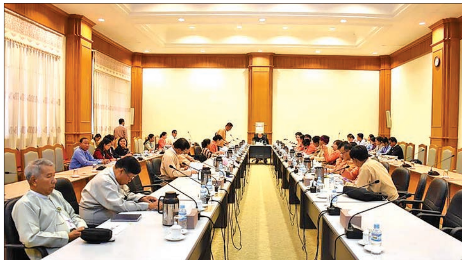
Pyidaungsu Hluttaw Deputy Speaker U Tun Tun Hein attending the Pyidaungsu Hluttaw Joint Bill Committee meeting in Nay Pyi Taw yesterday.