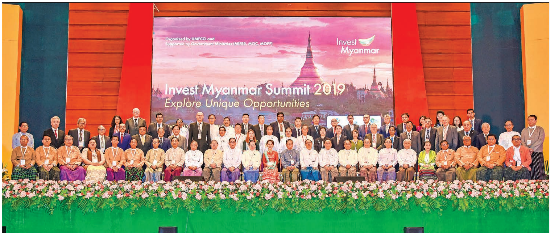
State Counsellor Daw Aung San Suu Kyi poses for a documentary photograph with attendees of the Invest Myanmar Summit 2019 in Nay Pyi Taw yesterday.