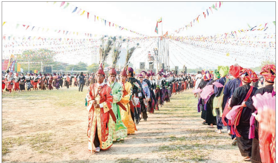
Various ethnic nationals participate together in the Manaw dance at Myanmar Ethnic Culture Fest in Kyaikkasan Sports Ground in Yangon.