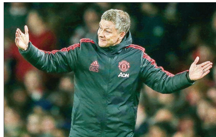
Manchester United's Norwegian caretaker manager Ole Gunnar Solskjaer gestures on the touchline during the English FA Cup fourth round football match between Arsenal and Manchester United at the Emirates Stadium in London on 25 January, 2019.

jaer had selected the same formation but different personnel, with Marcus Rashford and Anthony Martial supporting Lingard from wide positions.