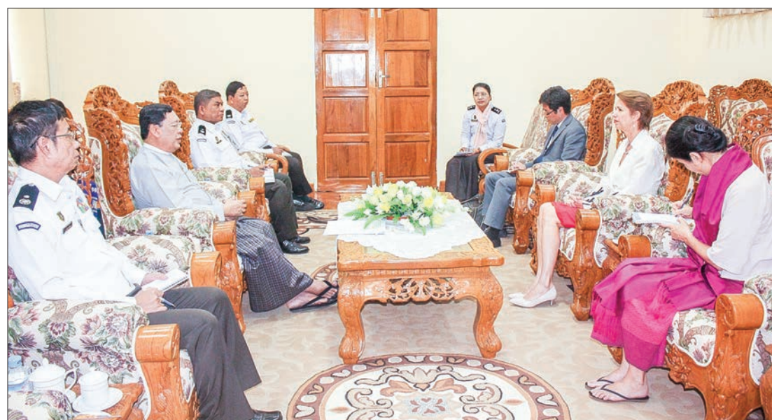
Union Minister U Thein Swe meets with United Nations Secretary General's Special Envoy on Myanmar Mrs. Christine Burgener in Nay Pyi Taw yesterday.