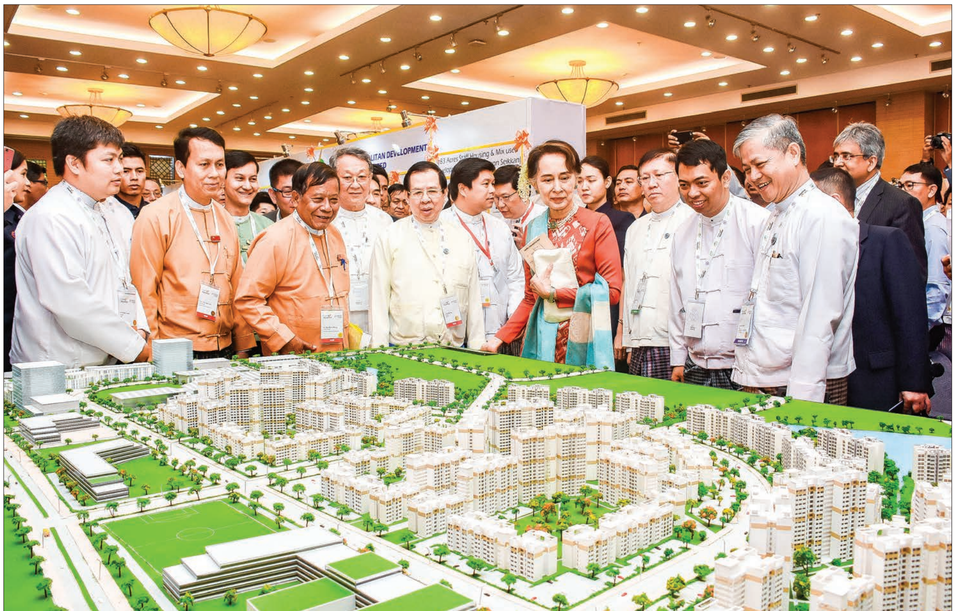
State Counsellor Daw Aung San Suu Kyi looks at a scale model of a housing project exhibited at the Invest Myanmar Summit 2019 in Nay Pyi Taw yesterday.

T HE Invest Myanmar Summit 2019 kicked off yesterday in Nay Pyi Taw, with an opening speech by State Counsellor Daw Aung San Suu Kyi.