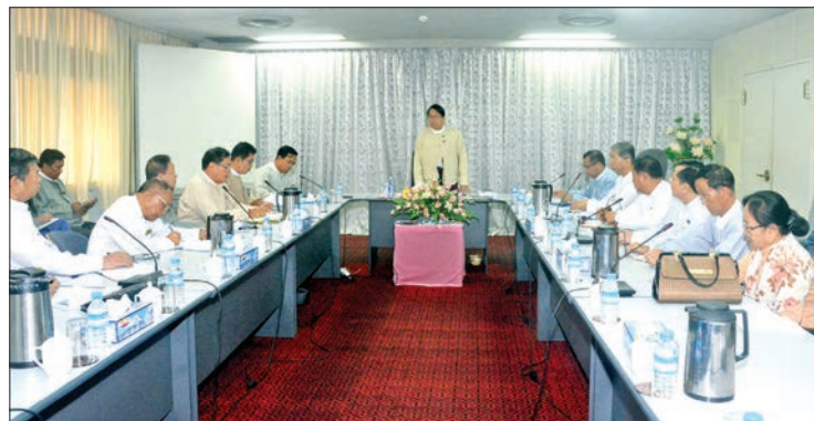
Union Minister Dr. Pe Myint addresses the meeting with Myanmar Music Asiayone and its Election Commission in Yangon.

At the meeting, formation of a group consisting of Myanmar Music Asiayone (Central), Myanmar Music Asiayone Election Commission and outside experts to draw up a charter of Music Asiayone, presenting the the charter to the members to seek their suggestions and approval, re-assessing and