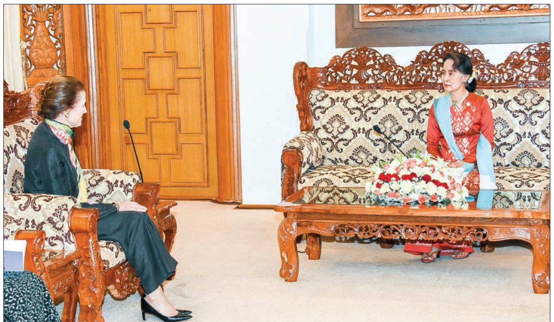
State Counsellor Daw Aung San Suu Kyi holds talks with UNICEF Executive Director Ms. Henrietta H. Fore in Nay Pyi Taw on 28 January 2019.