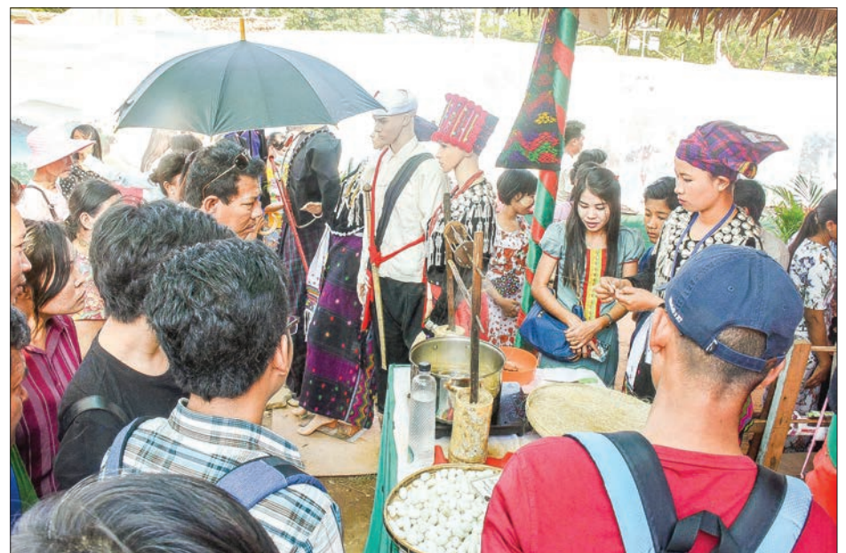
Visitors take a look around the Kachin ethnic culture exhibit at Myanmar Ethnic Culture Fest in Kyaikkasan Sports Ground in Yangon.