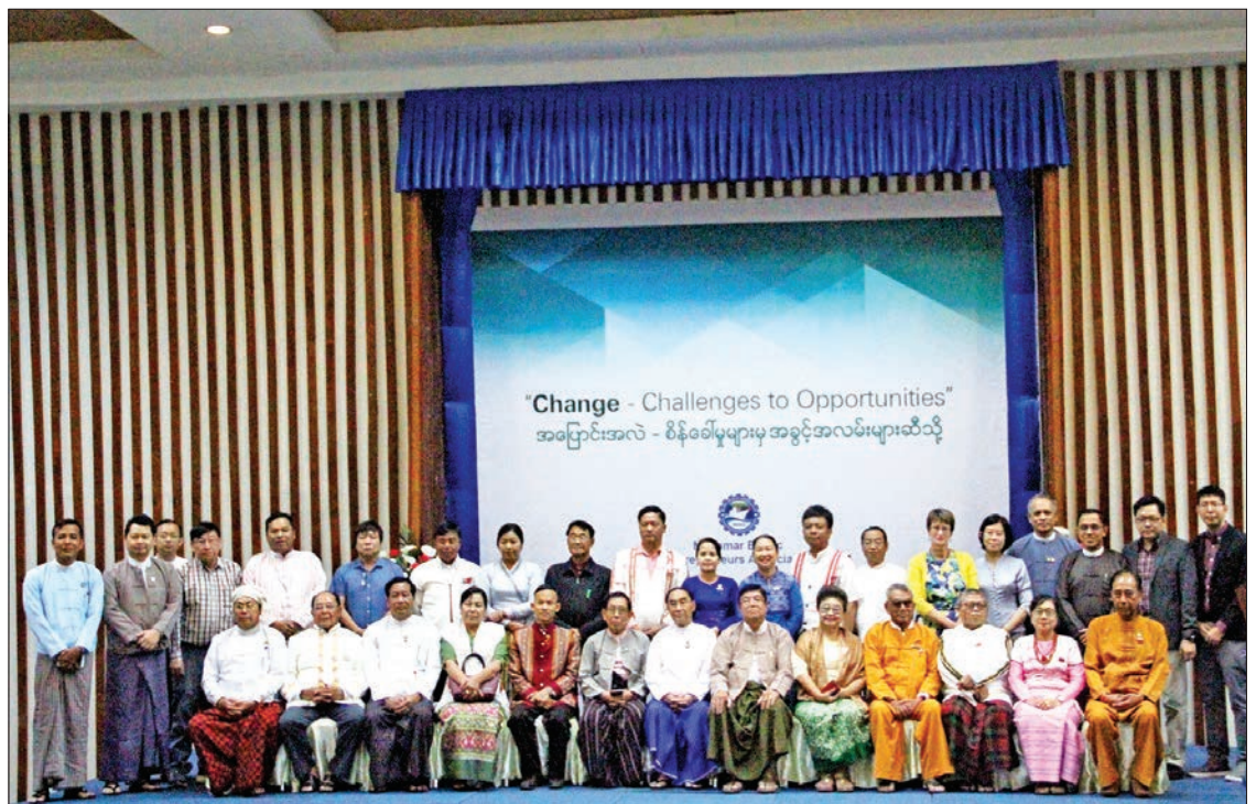
Union Minister Nai Thet Lwin and attendees pose for a documentary photo at the Change-Challenges to Opportunities Forum in Yangon.

At the event the Union Minister said now is the time when unity of ethnic nationals and peace can be achieved only through the ethnic national brothers and sisters working hand in hand together. According to the title of the forum, successfully overcoming changes and challenges and obtaining opportunities and prospects requires having aims and goals in addition to having knowledge and expertise. As more knowledge and expertise can be obtained from forums like this, holding such forums will develop the people's thoughts. The change desired by the people is not achieved simply by changing the Union government and state/region governments. If all the public servants under the Union and state/region governments didn't change, a democracy system couldn't be achieved. If the bad habits from the old system that the people didn't like are not changed the people's desire of a democracy system that protects the people wouldn't be achieved. If the people didn't have knowledge and expertise, they wouldn't know