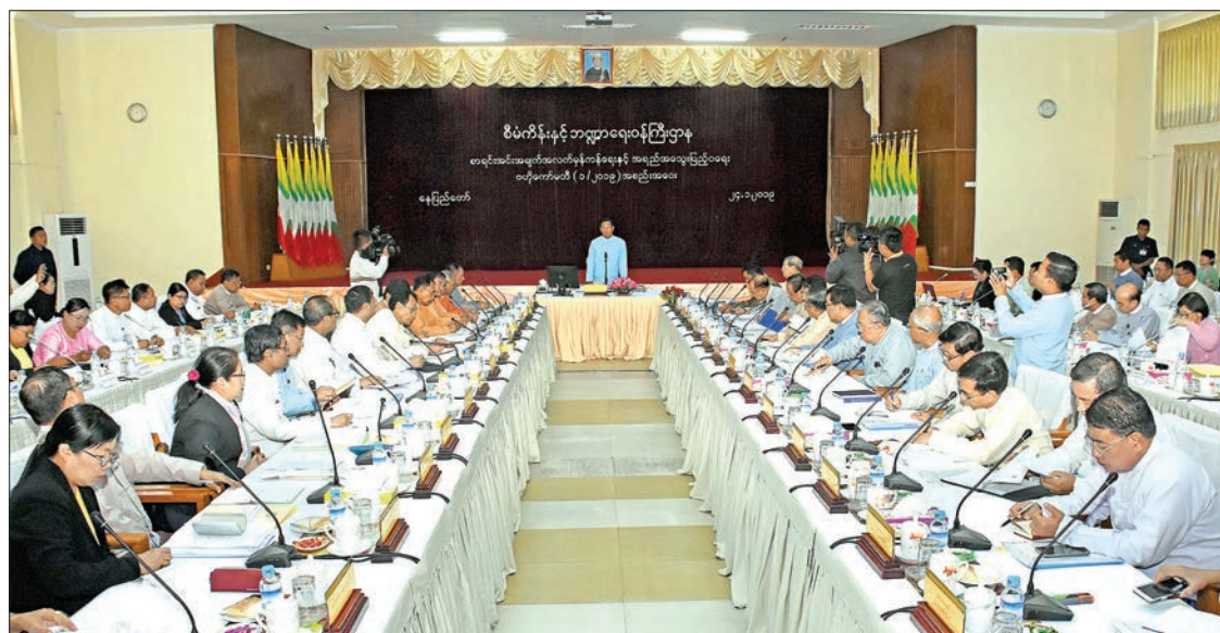
Vice President U Henry Van Thio delivers the speech at the committee meeting of Statistics Central Committee in Nay Pyi Taw yesterday.

Relevant work groups were learnt to keep NSDS Action Plan as a Living Document and implementing it. Cooperation among