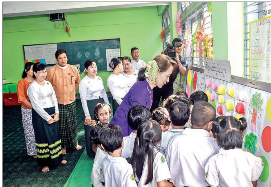
State Counsellor Daw Aung San Suu Kyi looks at colour paintings drawn by KG students in their classroom in B.E.H.S (1) Pabedan, Yangon yesterday.