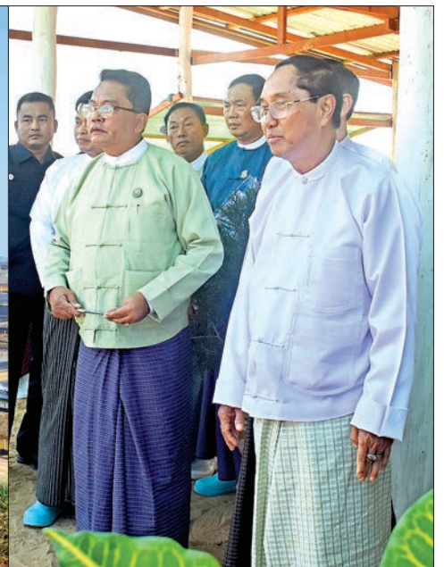
Vice President U Myint Swe inspects livestock breeding works from the viewpoint in Myeik, Taninthayi Region yesterday.

success in this pilot project. As success is achieved there'll be more work opportunities. The Vice President also spoke of the need to prevent losses by following bio-security and the need to follow rules and regulations.