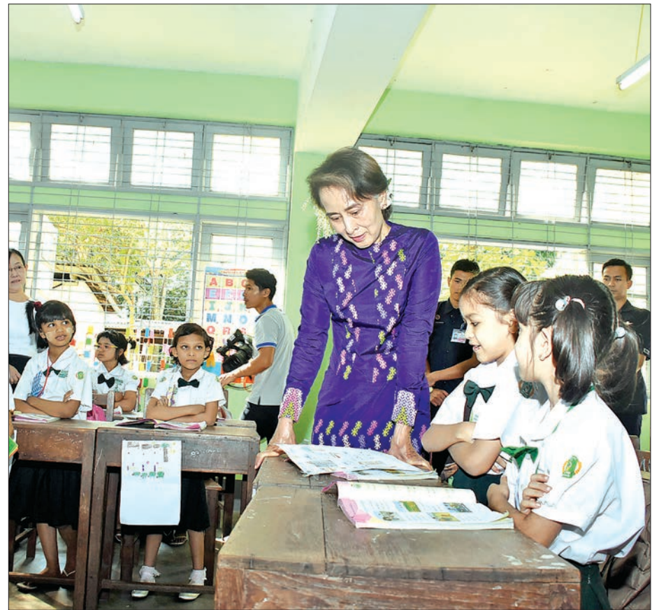
State Counsellor Daw Aung San Suu Kyi meeting with 1 st Grade students learning in the classroom in B.E.H.S (1) Pabedan Township, Yangon Region yesterday.