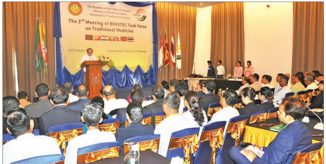
Union Minister Dr. Myint Htwe addresses the 2 nd Meeting of BIMSTEC Task Force on Traditional Medicine.

He pledged that his ministry would develop the traditional