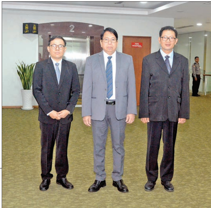
Union Minister Dr. Pe Myint and his delegation members seen at Yangon International Airport before departing for the Philippines.

The delegation led by Union Minister Dr. Pe Myint and party were seen off at Yangon International Airport by ministry officials.—MNA ■ (Translated