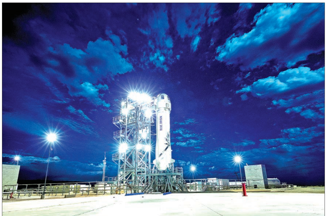
This handout photo shows Blue Origin's New Shepard rocket on a launch pad on 28 April 2018.

More test flights lie ahead, but the first flights with passengers on board could start by late 2019. "We are aiming for the end of this year," Cornell said.