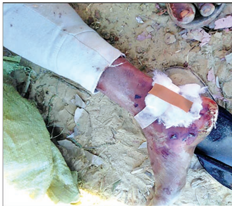
The attack on the police post leaves two policemen and one fence worker injured.