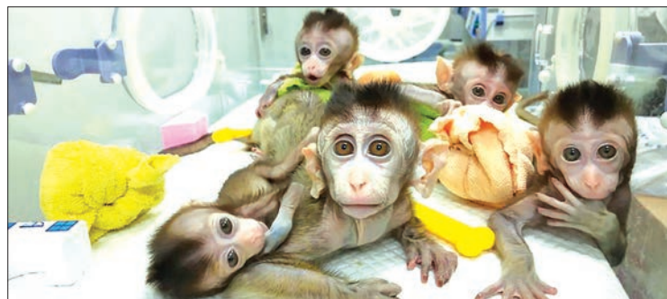
Photo taken on 26 November 2018 shows the five cloned monkeys with circadian rhythm disorders. China has cloned five monkeys from a gene-edited macaque with circadian rhythm disorders, the first time multiple monkeys have been cloned from a gene-edited monkey for biomedical research. Scientists made the announcement Thursday, with two articles published in National Science Review, a top Chinese journal in English. The cloned monkeys were born in Shanghai at Institute of Neuroscience of Chinese Academy of Sciences.

In order to create an ideal donor monkey, researchers knocked