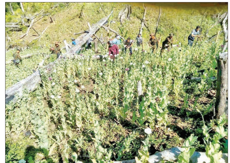
Authorities destroy the opium field in Ngaphe Township.