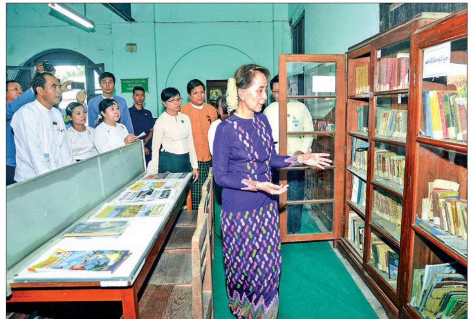
State Counsellor Daw Aung San Suu Kyi inspects school library in B.E.H.S (1) Pabedan, Yangon yesterday.