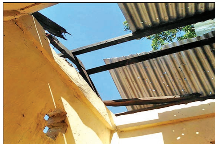
BP 41 was destroyed by the attack yesterday.