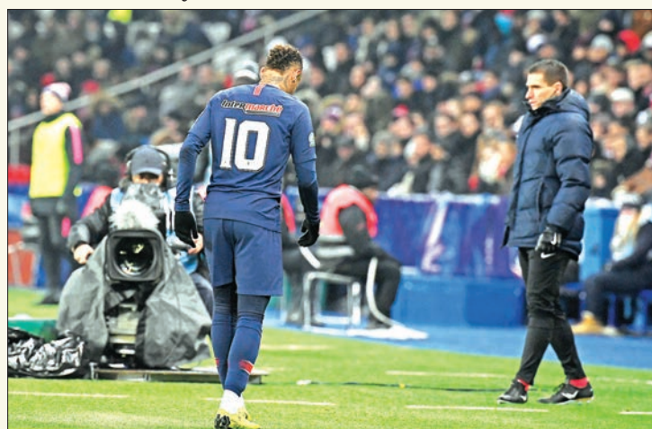
Neymar leaves the pitch with an apparent foot injury in PSG’s win over Strasbourg in the French Cup.

Elsewhere, Caen ended the run of plucky sixth-tier amateurs Viry-Chatillon in a 6-0 rout, with Yacine Bammou setting the Ligue 1 club on their way.—AFP ■