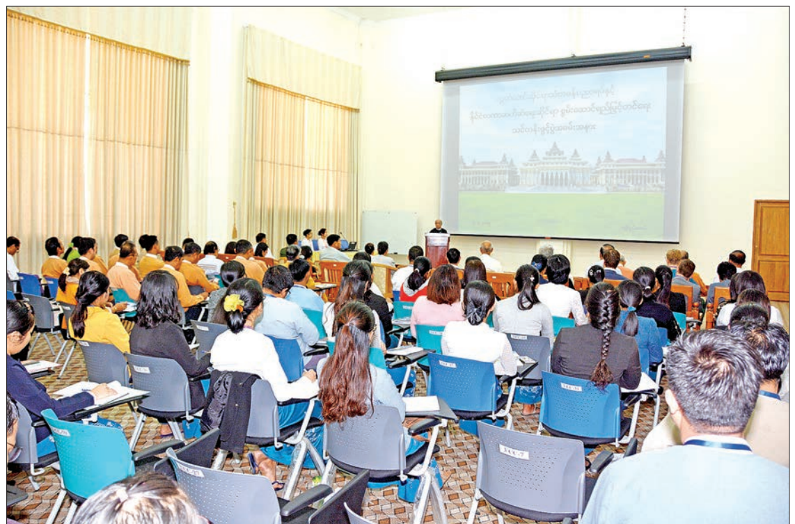
Pyithu Hluttaw Deputy Speaker U Tun Tun Hein addresses the opening ceremony of capacity building course in Nay Pyi Taw yesterday.

At the course Hluttaw representatives and experts from committees and commissions who had experience in international meetings, experts from Ministry of Foreign Affairs and international relation experts from partner organisations will give lectures on sector wise subjects covering international relations history, basic of bilateral relation, relationship between domestic politics and international politics, particulars of international organisations like AIPA and IPU, facts about ASEAN, international conventions and covenant. The course is attended by 66 trainees who are Hluttaw representatives and Hluttaw Office personnel.—MNA ■ (Translated by Zaw Min)