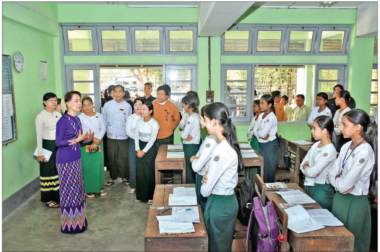
State Counsellor Daw Aung San Suu Kyi greets Grade-VIII school children in the classroom in B.E.H.S (1) Pabedan, Yangon yesterday.