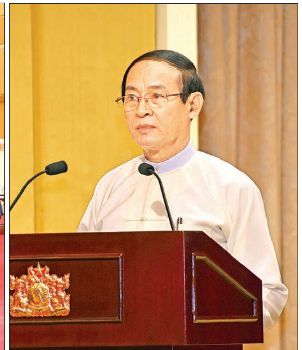
President U Win Myint addresses the ceremony to present the President's Honourary Award for to the highest taxpayers for the 2017-2018 tax year at the Presidential Palace in Nay Pyi Taw yesterday.