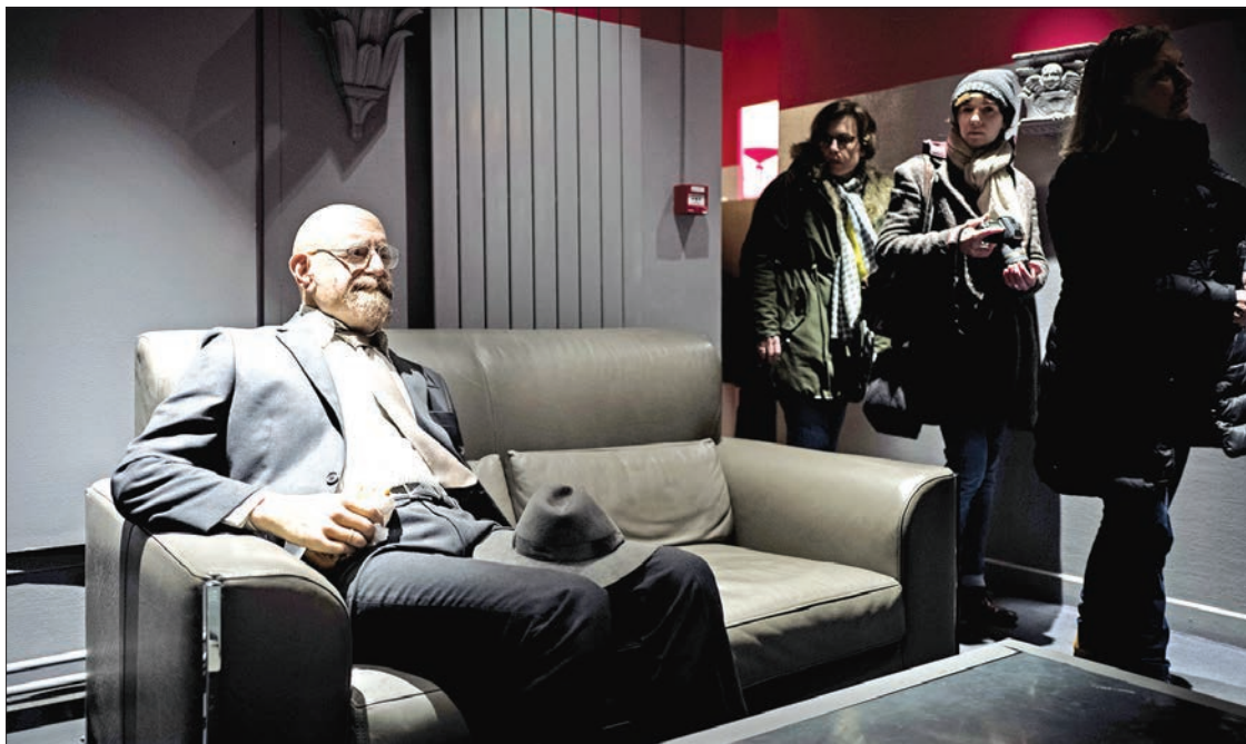
A mannequin sits on a couch inside the Theatre du Chatelet, where “Dau” — one of the strangest and most mind-boggling artistic projects ever undertaken — will begin unfurling on Thursday.

The replica scientific institute he had built for them was not far from the one the Nobel