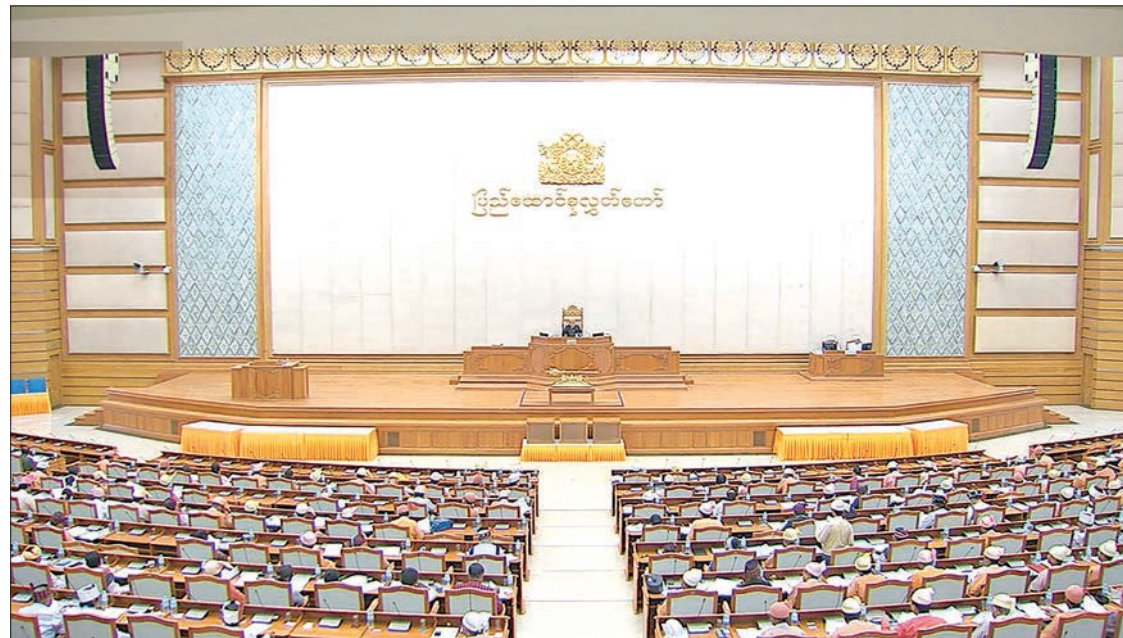
Pyidaungsu Hluttaw holds session in Nay Pyi Taw.