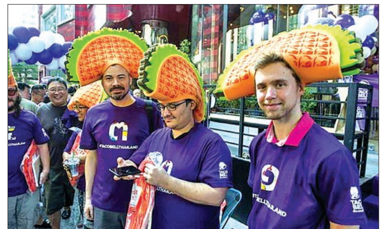
Fast food fans wait in line outside the first Taco Bell restaurant to open in Thailand.