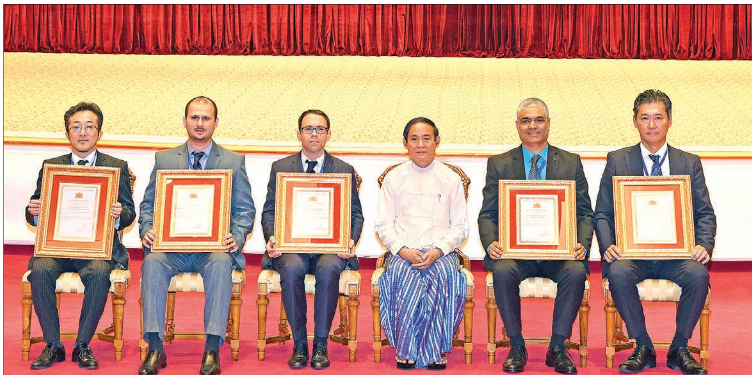
President U Win Myint poses for the documentary photo with all the foreign honorary award recipients for the top income tax payers for the 2017-2018 tax year at the Presidential Palace in Nay Pyi Taw.