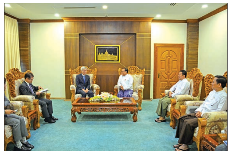
Union Minister U Kyaw Tin meets with ROK Vice Minister of the Ministry of Foreign Affairs Mr. Lee Taeho on 24 January.

Myanmar government's efforts on all-round development and rural area development sector of Myanmar through Samuel Undong Project, matters related to successful holding of ASEAN-ROK Commemorative Summit to celebrate the 30 th Anniversary of ASEAN-ROK Dialogue Relations and the first Mekong-Korea Summit in 2019 and ROK's support to overcome challenges faced by Myanmar during its transitional period.—MNA ■