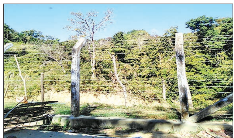
The border fence which is being upgraded by workers when they are attacked.