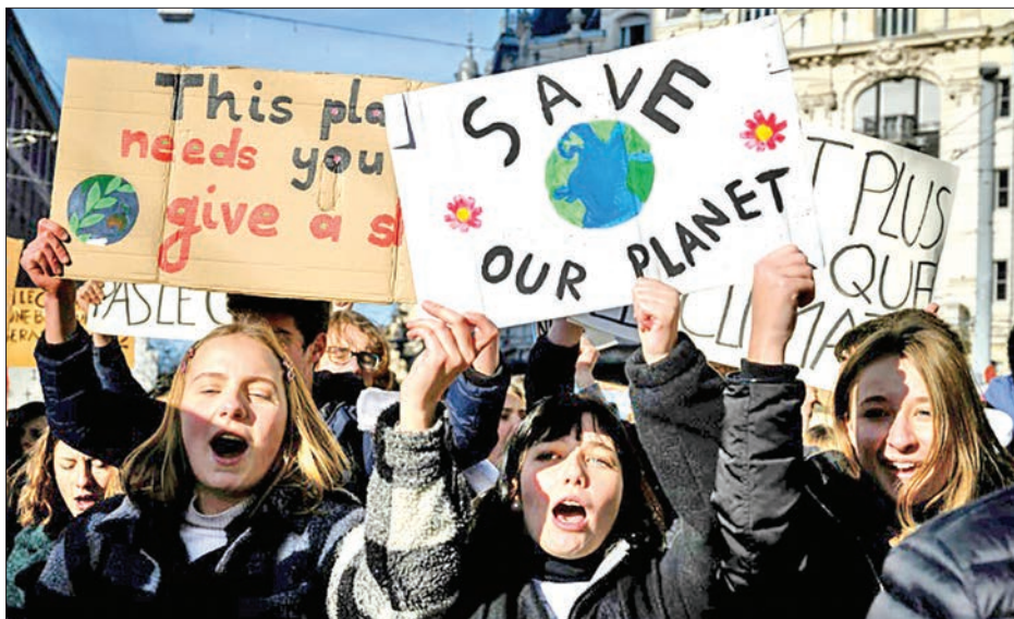
Scientific consensus is hardening that in order for Earth to avoid the worst scourges of climate change, emissions must peak by 2020 and drastically reduce thereafter.

They include radical changes to how we get our electricity, and to how goods and services are dis-