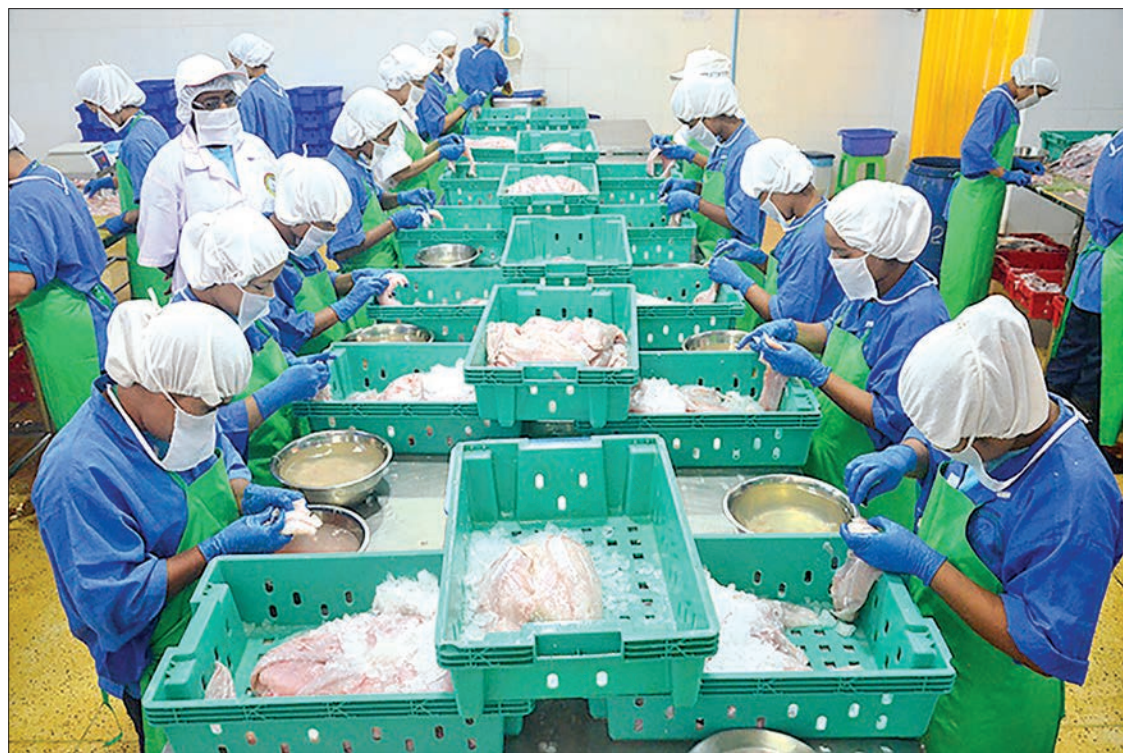
Workers processing fish to export at a marine product factory.

The Fisheries Department will inspect fish processing fac-