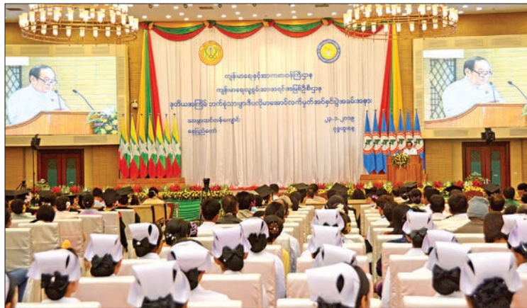
Union Minister Dr. Myint Htwe addresses the 2 nd batch of midwife graduates from Midwifery Training School in Nay Pyi Taw.