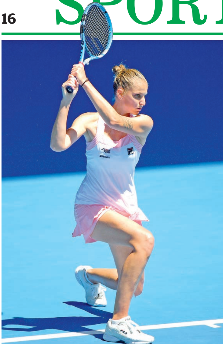
Czech Republic's Karolina Pliskova hits a return against Serena Williams of the US during their women's singles quarter-final match on day ten of the Australian Open tennis tournament in Melbourne on 23 January, 2019.