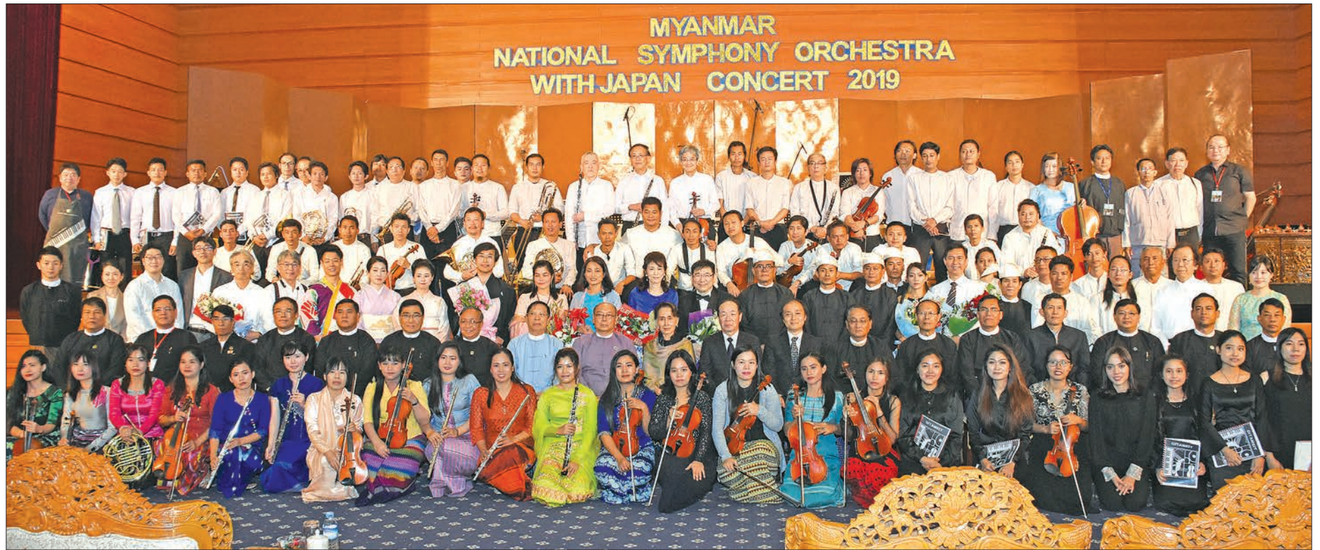
State Counsellor Daw Aung San Suu Kyi and officials pose for a documentary photo with the Myanmar National Symphony Orchestra and Japanese musicians.