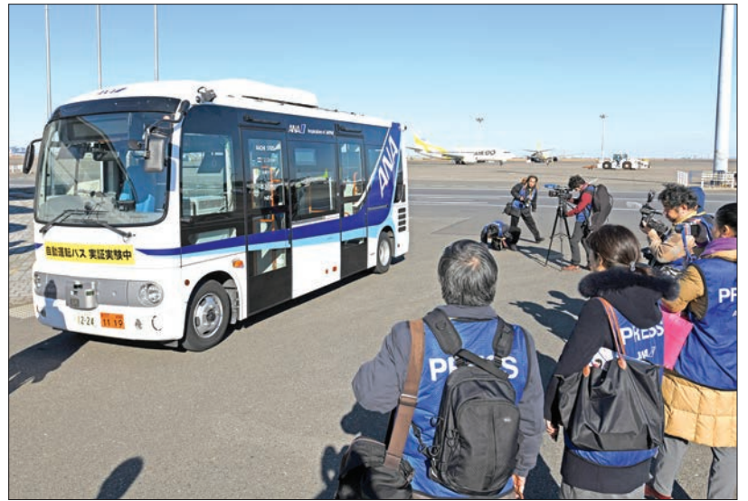
Journalists look at a driverless bus during an open test drive demonstration at Tokyo's Haneda International Airport on 22 January, 2019.

"The decline in the population puts us at risk of no longer being able to carry out operations and that is why we are now pushing to introduce new autonomous mobility technologies so we can guarantee good operations with less staff," said Yamaguchi.—AFP ■