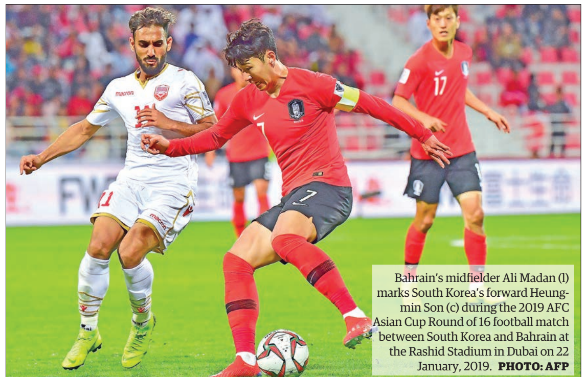
Bahrain's midfielder Ali Madan (l) marks South Korea's forward Heung-min Son (c) during the 2019 AFC Asian Cup Round of 16 football match between South Korea and Bahrain at the Rashid Stadium in Dubai on 22 January, 2019. PHOTO: AFP

But normal service was resumed in extra time when right-back Lee Yong's pinpoint cross invited Kim to come steaming in at the back post to score with an unstoppable header.—AFP ■