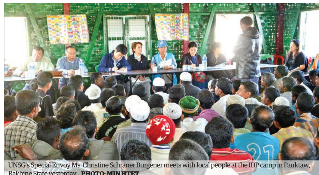
UNSG's Special Envoy Ms. Christine Schraner Burgener meets with local people at the IDP camp in Pauktaw, Rakhine State yesterday.