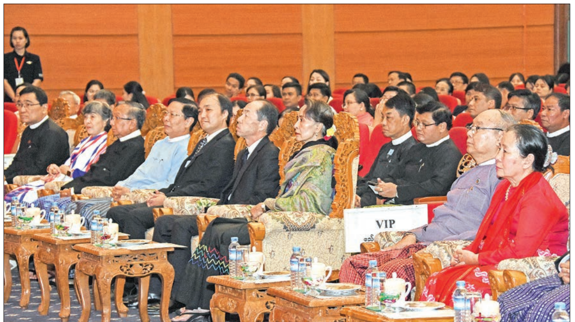
State Counsellor Daw Aung San Suu Kyi enjoys the entertainment of the Myanmar National Symphony Orchestra with Japan Concert 2019 in Nay Pyi Taw yesterday.