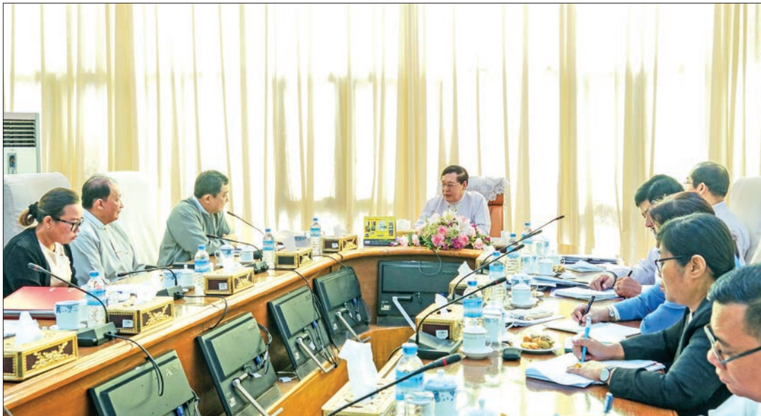
Union Minister U Thein Swe holds a meeting with U Maung Maung, Chairman of the Confederation of Trade Unions Myanmar, and delegation in Nay Pyi Taw.

UNION MINISTER for Labour, Immigration and Population U Thein Swe received a delegation led by U Maung Maung, Chairman of the Confederation of Trade Unions of Myanmar (CTUM), yesterday morning, at his ministry's meeting room in Nay Pyi Taw.