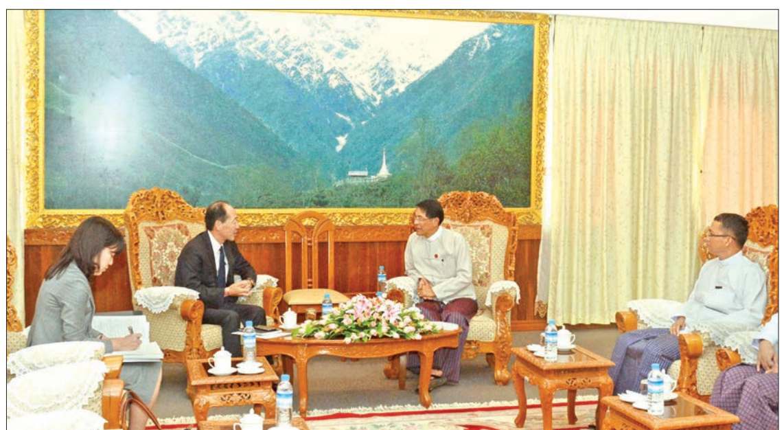
Union Minister for the Office of the Union Government, U Min Thu, meets with Japanese Ambassador to Myanmar Mr. Ichiro Maruyama in Nay Pyi Taw yesterday.