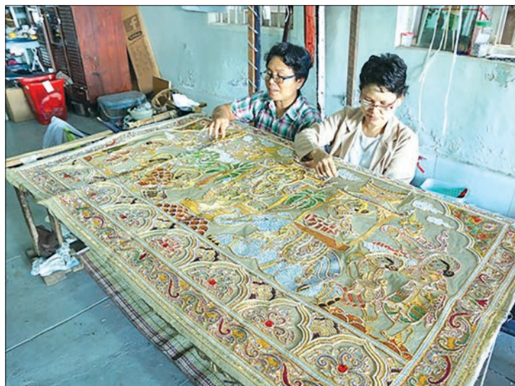
Artisans embroider the tapestry with gold thread and pearls in workshop-store in Mandalay.

used in gold embroidery is velvet. The embroidery may also incorporate other materials such as pearls, beads, quills, and