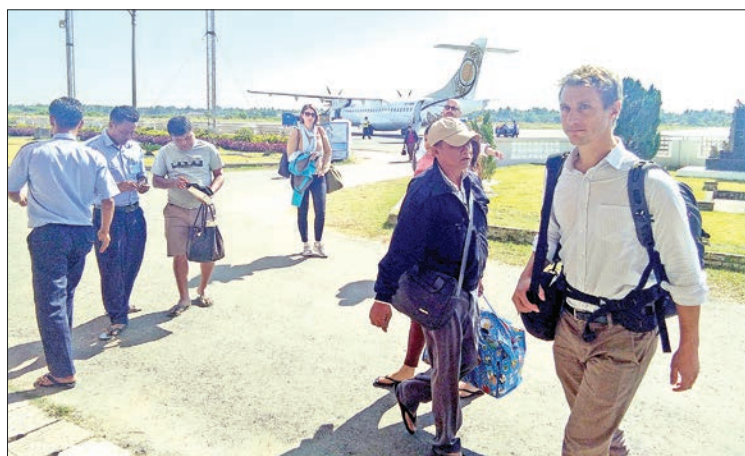
Local and foreign media personnel arrive in Sittway by Myanmar National Airlines yesterday for media coverage on the situation in Maungtau, Rakhine State.

Attending the meeting were officials from the ten UEHRD task forces, and members of the UEHRD committee.—Zaw Gyi ■ (Translated by Kyaw Myaing)