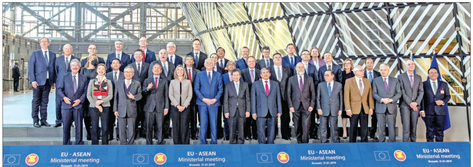
Union Minister U Kyaw Tin poses for documentary photo together with delegates of the ASEAN-EU Ministerial Meeting.

At the Lunch Retreat Session, the Union Minister updated the Meeting on the recent developments in Rakhine State in an informal setting. In his briefing, the Union Minister informed the Meeting of the cooperation between Myanmar and ASEAN in facilitating the repatriation process, preparations made by Myanmar for return of the verified displaced persons in accordance with the bilateral agreements between Myanmar and Bangladesh, progress of the implementation of the MoU between Myanmar, the