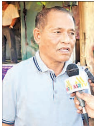
U Aung Gyi.