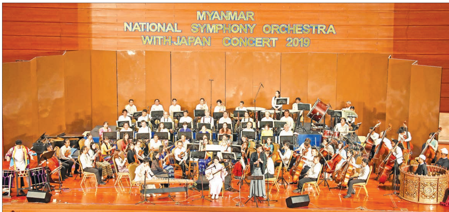
Myanmar and Japanese musicians perform in the Myanmar National Symphony Orchestra with Japan concert 2019 in Nay Pyi Taw yesterday.