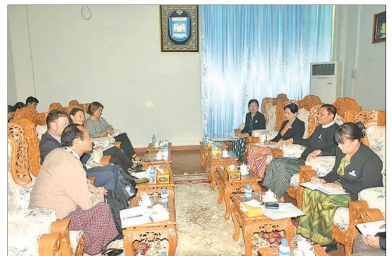
Union Attorney-General U Tun Tun Oo meets with MyJustice delegation in Nay Pyi Taw yesterday.