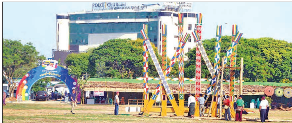
Officials erecting Manaw Shadung at Kyaikkasan Grounds for the Myanmar Ethnic Culture Fest.

Each of the ethnic entrepreneurs – the Mon, Pa-O, and Wa for example – have their own special qualities and services. If they can penetrate the global market then economic development will follow suit. I am thankful for the existence of the Ministry of Ethnic Affairs in this government