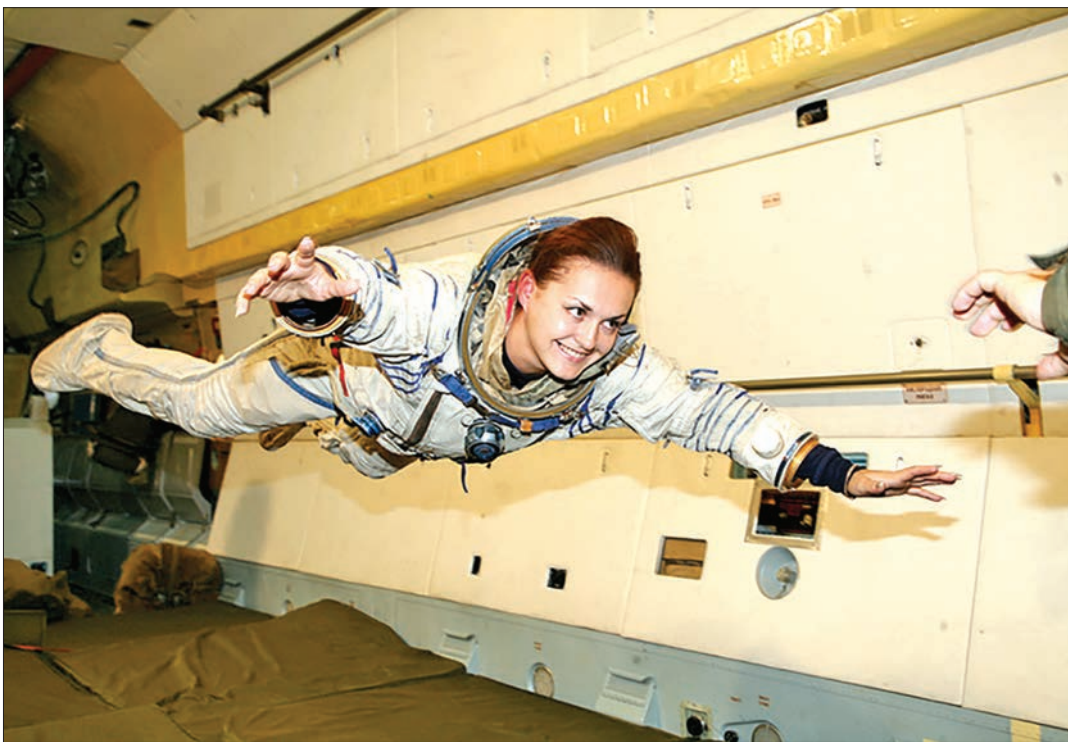
Yelena Serova became the first female Russian cosmonaut to visit the International Space Station on 26 September 2014. Russia's State Space Corporation Roscosmos is putting together a team of female cosmonauts to conduct flights into outer space, a source in the space industry said earlier. Only four women have traveled into orbit in the history of Soviet and Russian space exploration: Valentina Tereshkova (1963), Svetlana Savitskaya (1982, 1984), Yelena Kondakova (1994, 1997) and Yelena Serova (2014). Yelena Serova became the first Russian woman cosmonaut to set out on a long space flight in the past 20 years. Russian women in space - in photo gallery by TASS.