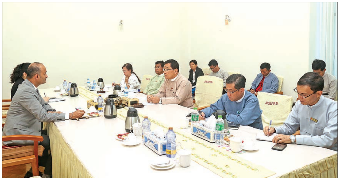
Union Minister Dr. Win Myat Aye holds talks with UNFPA Representative for Myanmar Mr. Ramanathan Balakrishnan in Nay Pyi Taw on 22 January.

mentation works conducted at union and state/region levels after drawing up and confirmation of youth policy, status of drawing up violence against women law, activities conducted during 16-day campaign to combat violence against women, status of amending children's rights law and effective mental, moral and social support for victims of sexual violence were discussed.—MNA ■ (Translated by Zaw Min)