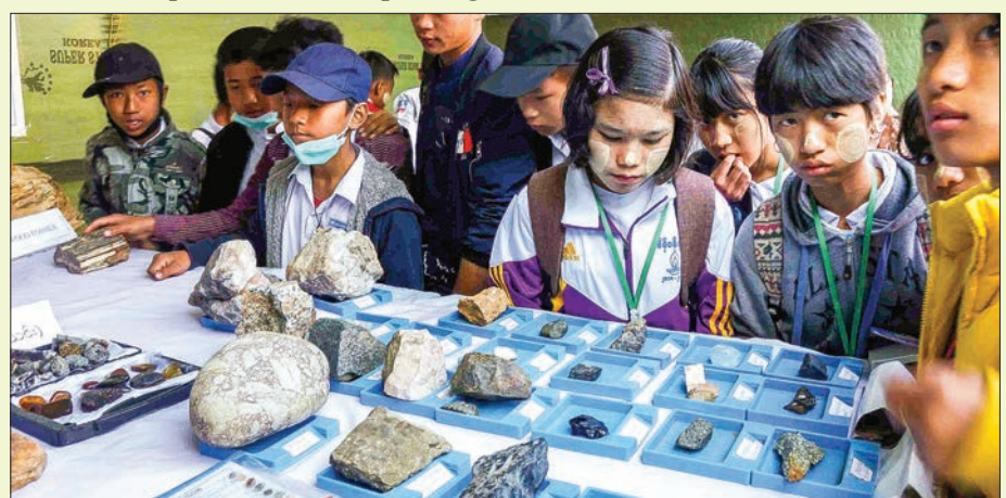
School children observe gem stones at the booth of the Children's Literature Festival in Myitkyina.