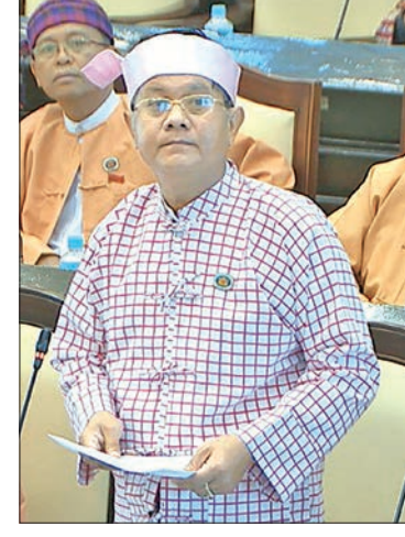
U Naing Thiha.

U Sai San Aung of Shan State constituency-12 raised the first question in the session and asked if there is a plan to upgrade self-relience basic education primary schools in Shan State north, Hopan District, Minemaw Township. In his reply to the question Deputy Minister for Education U Win Maw Tun noted that Lon Htan village self-relience basic education primary school, Kalonpa village self-relience basic education primary school, Lonkhwa village self-relience basic education primary school, Kone Lane village self-relience basic education primary school and Yaungwa village self-relience basic education primary school in