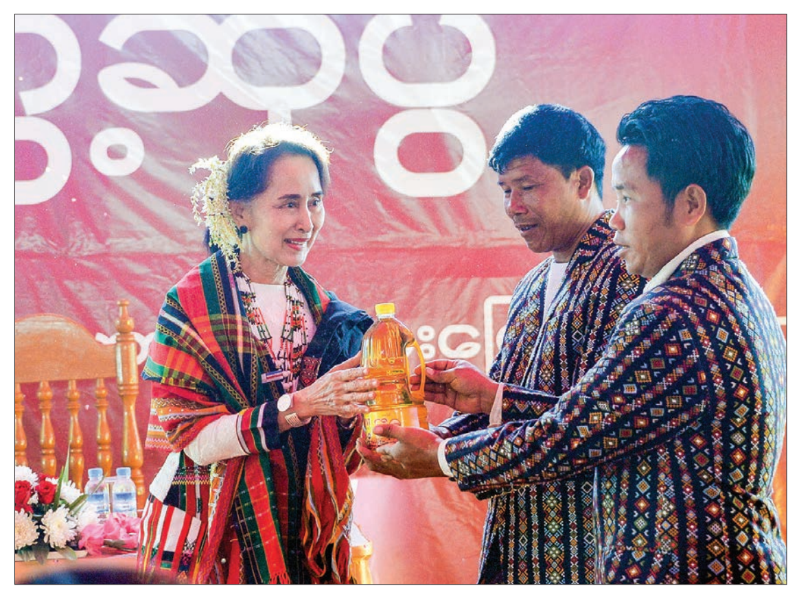
State Counsellor Daw Aung San Suu Kyi presents cooking oil to two representatives of Chin ethnic people from Haka Lay North and Haka Lay South villages during the meeting with local people yesterday.

"I want the children sitting in the front to think about this. Think how you can be valuable for others. If you are valuable for yourself alone, this isn't much of a value. Only when you are valuable for others can you be a valuable or worthy person.