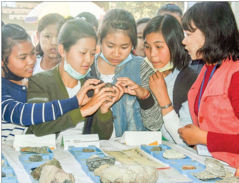
School girls check gem stone at the booth of the Children's Literature Festival in Myitkyina yesterday.

Children's Literature Festival, Children's Literature Exhibition and Book Sales was held for three days from 20 to 22 January. — MNA ■