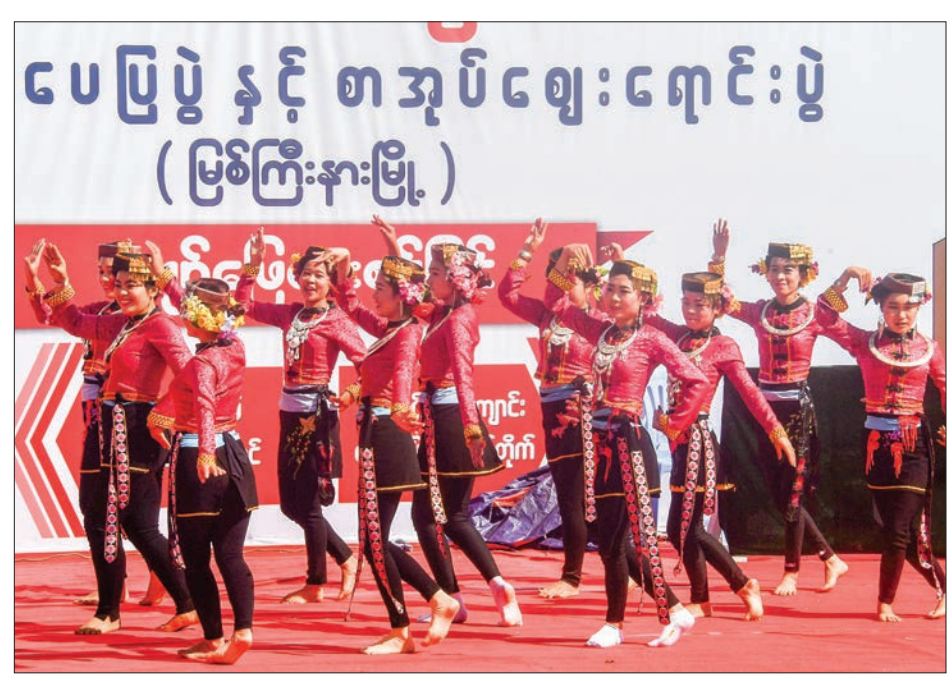
Students entertain the visitors with ethnic traditional dances at the Children's Literature Festival in Myitkyina yesterday.