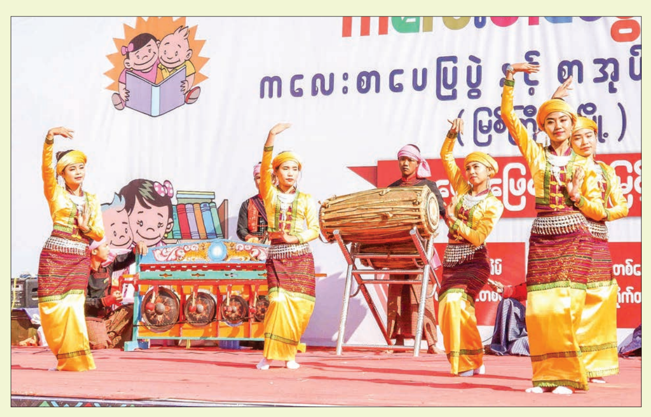
Students entertain the visitors with Shan traditional dances at the Children's Literature Festival in Myitkyina yesterday.