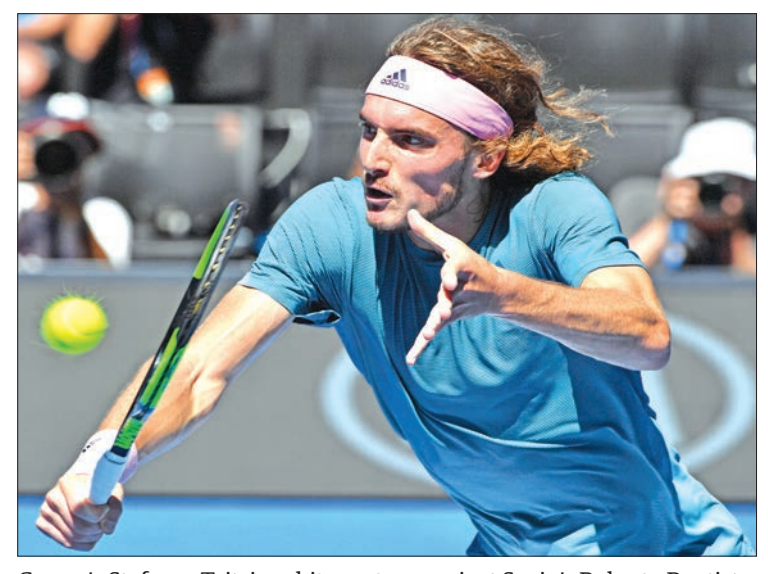
Greece's Stefanos Tsitsipas hits a return against Spain's Roberto Bautista Agut during their men's singles quarter-final match on day nine of the Australian Open tennis tournament in Melbourne on 22 January, 2019.

up event and was in his first quarter-final at this level, the wait for a maiden Grand Slam semi-final goes on. After encountering the gifted Greek at close quarters for the first time he still tipped either Nadal or Novak Djokovic to lift the famous Norman Brookes trophy.—AFP ■