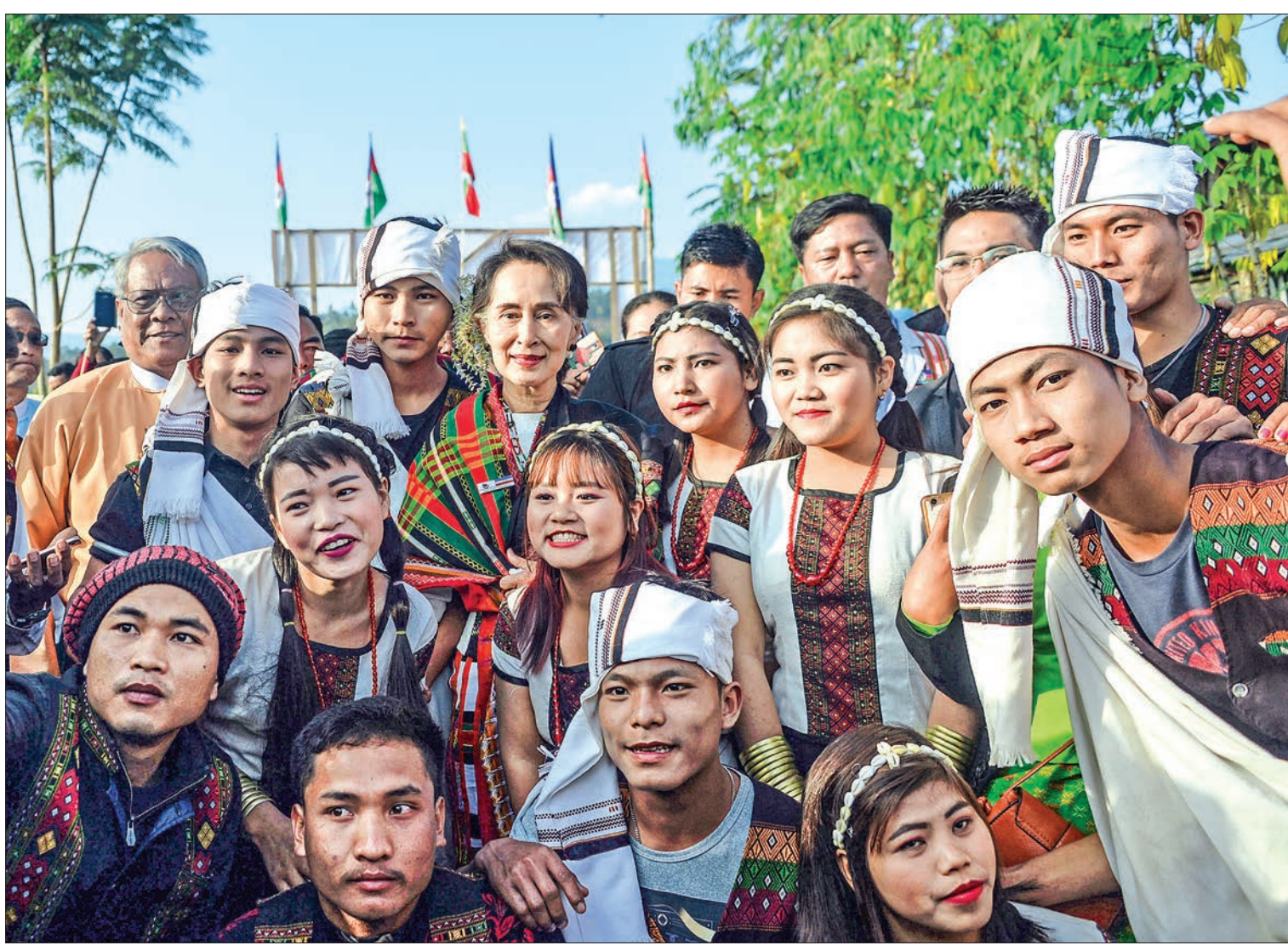
State Counsellor Daw Aung San Suu Kyi poses for the documentary photo together with ethnic people from Haka Lay South Village and North Village.

"It is for our people to live safely and securely. That is to be secure both physically and mentally."