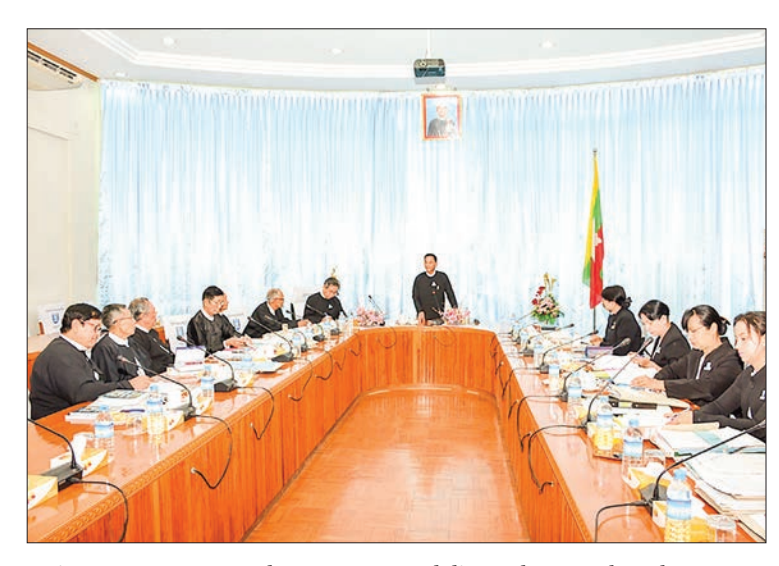
Union Attorney-General U Tun Tun Oo delivers the speech at the meeting of Supreme Court Bar Council.

and approval in Pyithu Hluttaw. Once the bill to amend the Act is enacted as law, Bar Council will be expanded to 15 members and will include up to 11 Supreme Court lawyers. Supreme Court lawyers are urged to raise their capacity and value their ethic and morality so that the people obtain a fair justice said the Union Attorney General. The meeting was attended by Bar Council of the Supreme Court chairman, vice chairman and 11 members it is learnt. — MNA