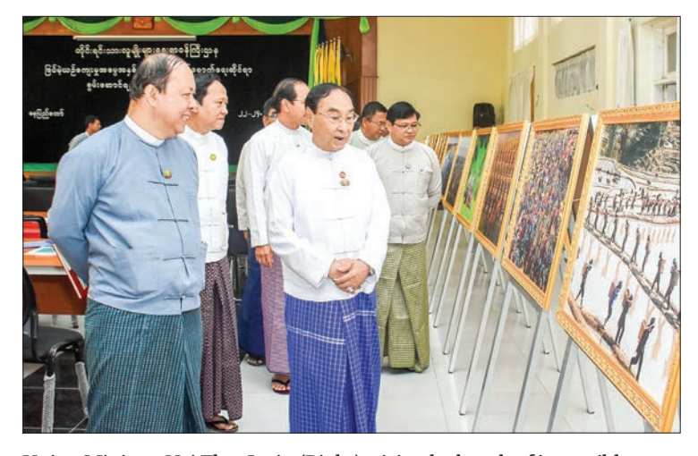
Union Minister Nai Thet Lwin (Right) visits the booth of intangible culture of ethnic peoples at his ministry yesterday.

THE Ministry of Ethnic Affairs well as submitting the country's and Ministry of Religious Affairs and Culture jointly conducted a course in Nay Pyi Taw yesterday to promote the conservation of the intangible culture of Myan-