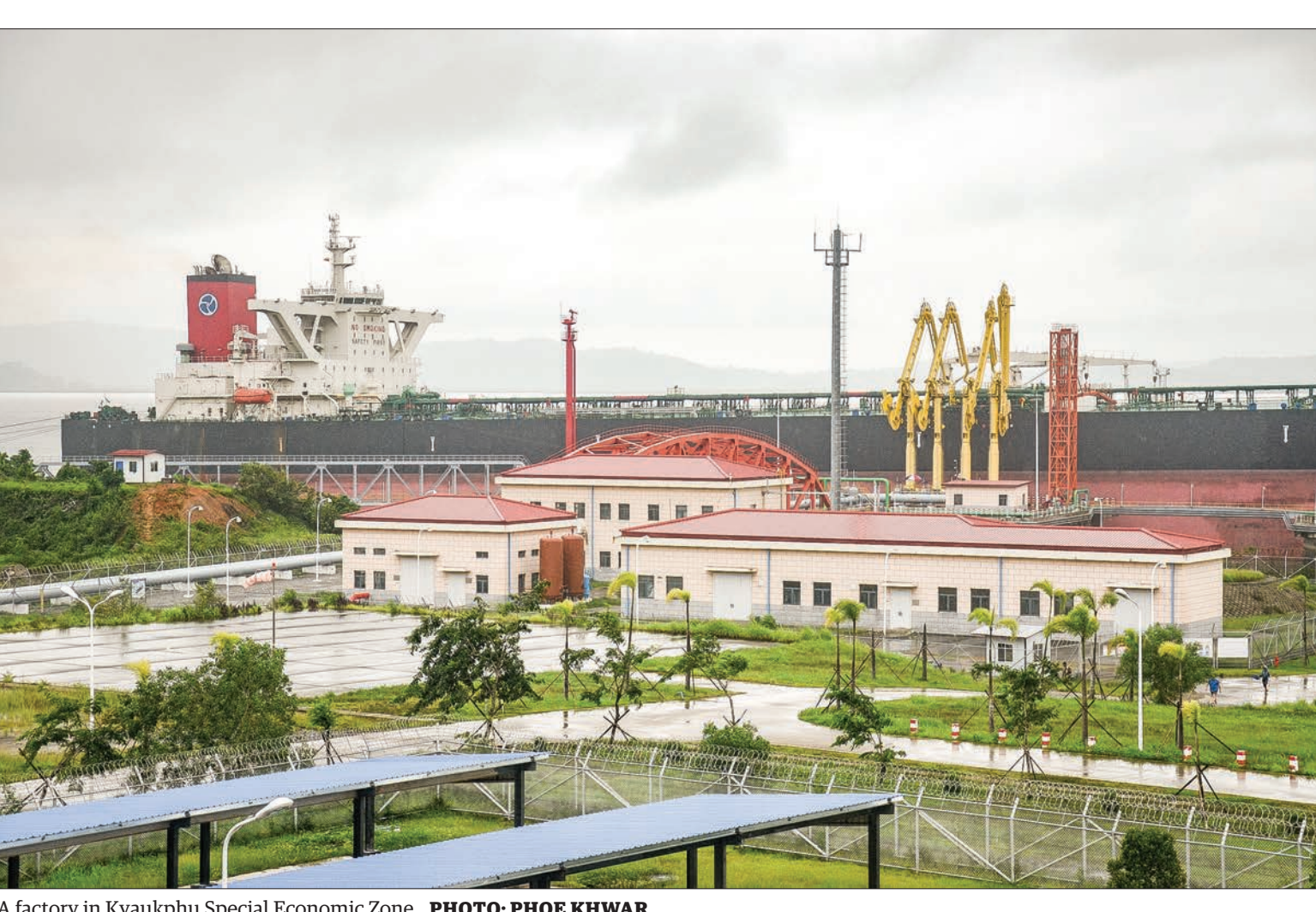
A factory in Kyaukphu Special Economic Zone.