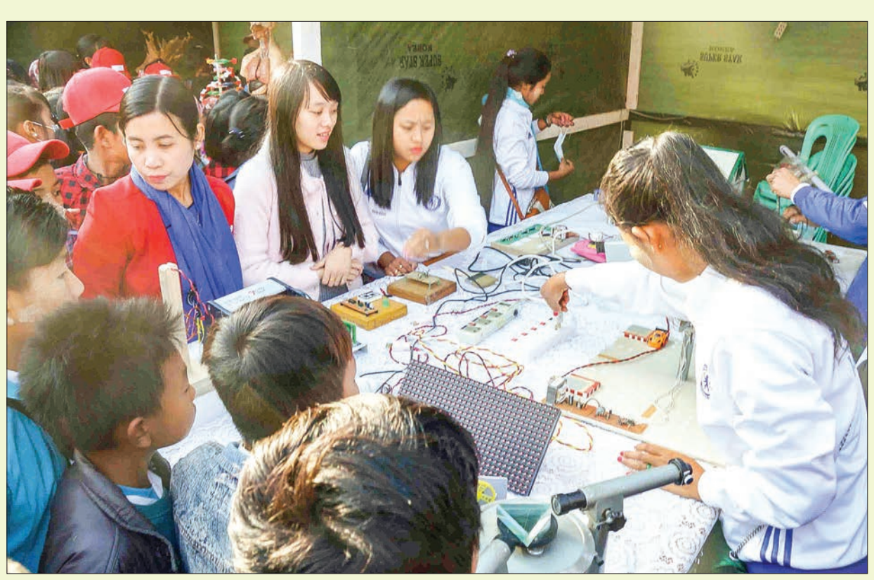
Visitors observe electric circuit accessories displayed at the booth of the Children's Literature Festival in Myitkyina.