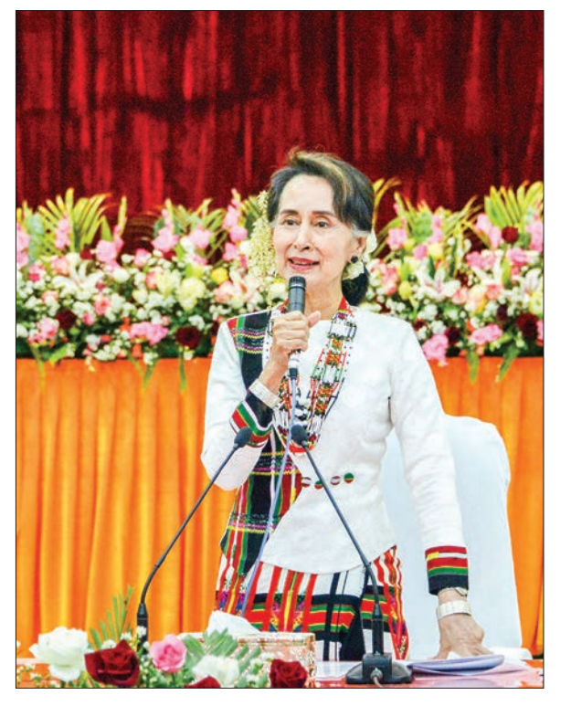
State Counsellor Daw Aung San Suu Kyi delivers the speech at the meeting with local people in Kalay Township, Sagaing Region.