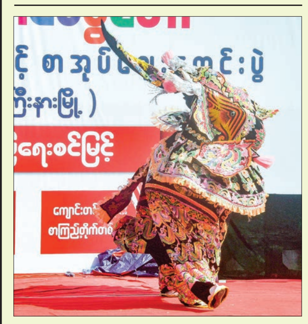
Kyaukse Elephant dance at the Children's Literature Festival in Myitkyina.