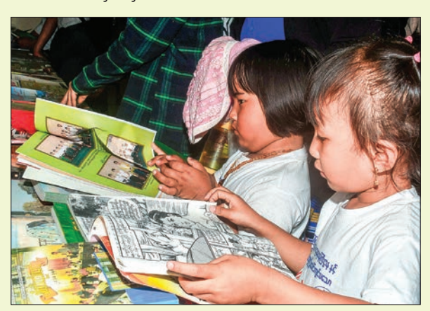
Children reading comic books.