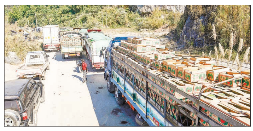
Trucks from Myanmar carrying agro-products seen near China-Myanmar border in Muse Township, nothern Shan State.

"We have reported this to the national economic