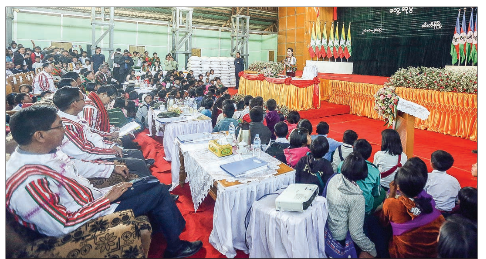
State Counsellor Daw Aung San Suu Kyi meets with local people in Tiddim Township, Chin State.