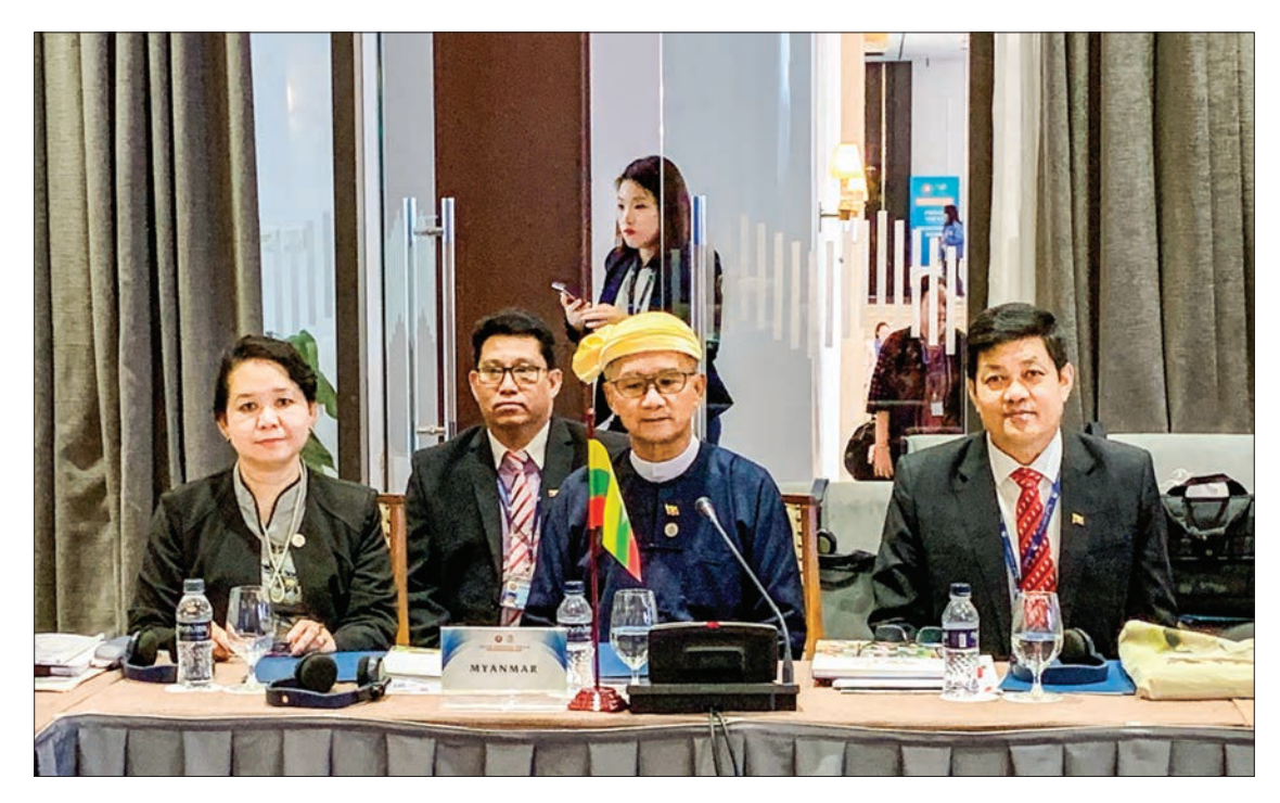
U Ohn Maung attends an ASEAN tourism meeting in Viet Nam.

The various meetings shared statistics and investment news on tourism development in ASEAN countries and partner countries, plans for China, Japan, South Korea and India to reduce visa restrictions in order to increase tourism, introducing Myanmar's new tourism campaign – 'Myanmar, Be Enchanted', and confirming Myanmar's active participation in promoting regional tourism. The Union Minister also participated in discussions