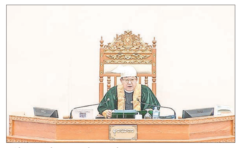
Pyidaungsu Hluttaw Speaker UT Khun Myat.

First, Pyidaungsu Hluttaw Speaker U T Khun Myat delivered a message of greeting saying Hluttaw representatives who are serving in the legislative sector are expected to continue their works for the country and the people with cooperation based on mutual understanding and respect and with new mind