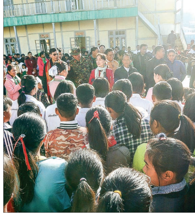
State Counsellor Daw Aung San Suu Kyi meeting with school children at No. 2 Basic Education High School in Haka.