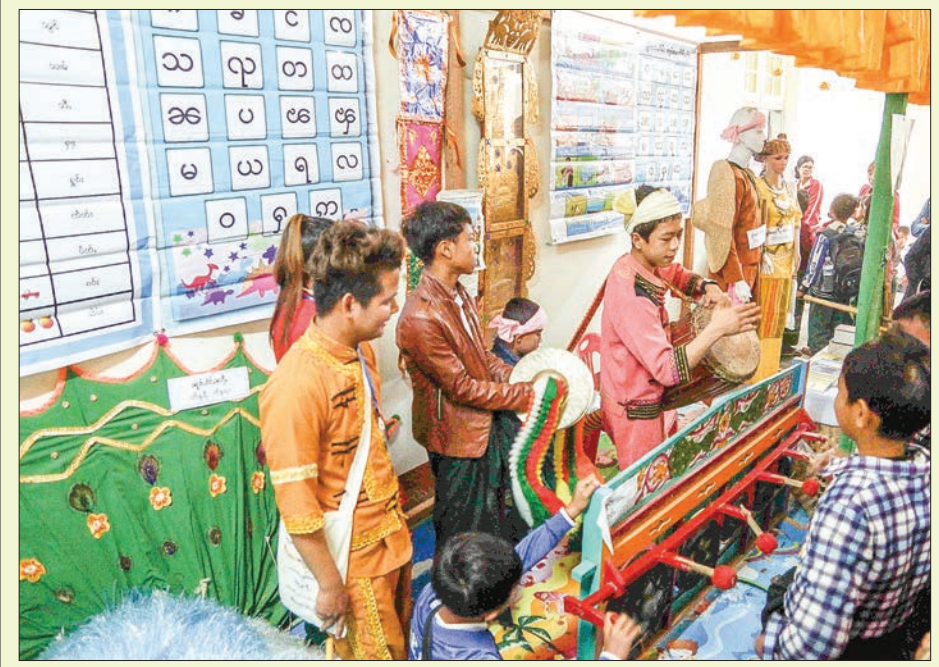
Visitors try Shan traditional muscial instrument at the festival.