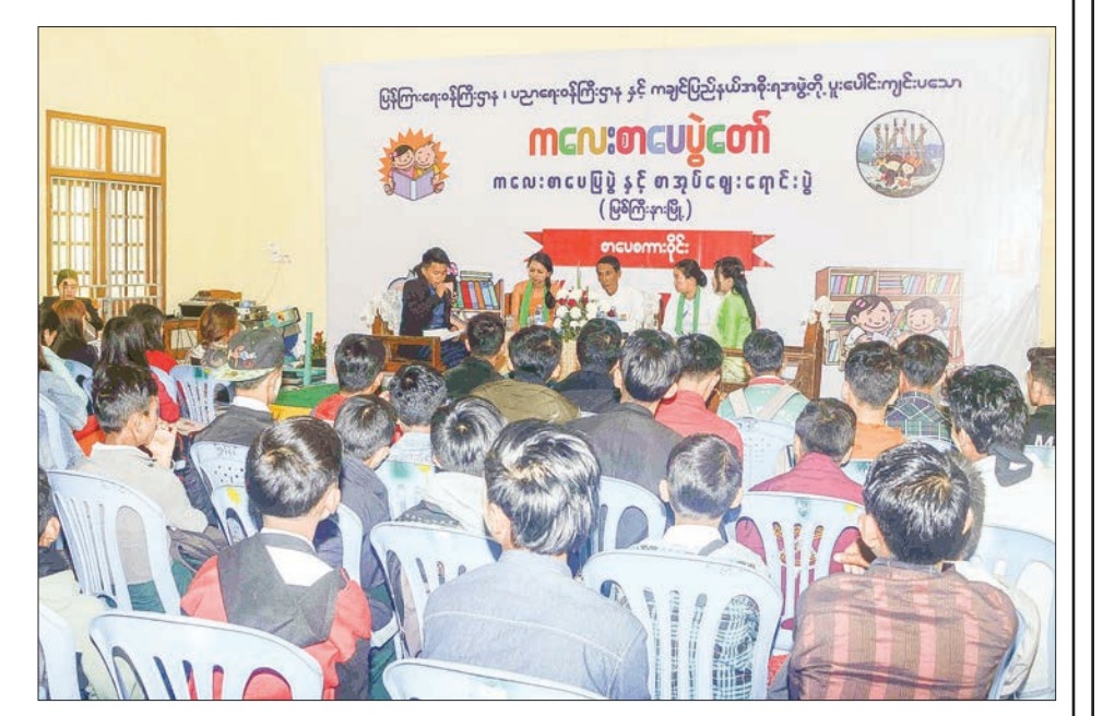
Literature talk together with youths held at the Children's Literature Festival.