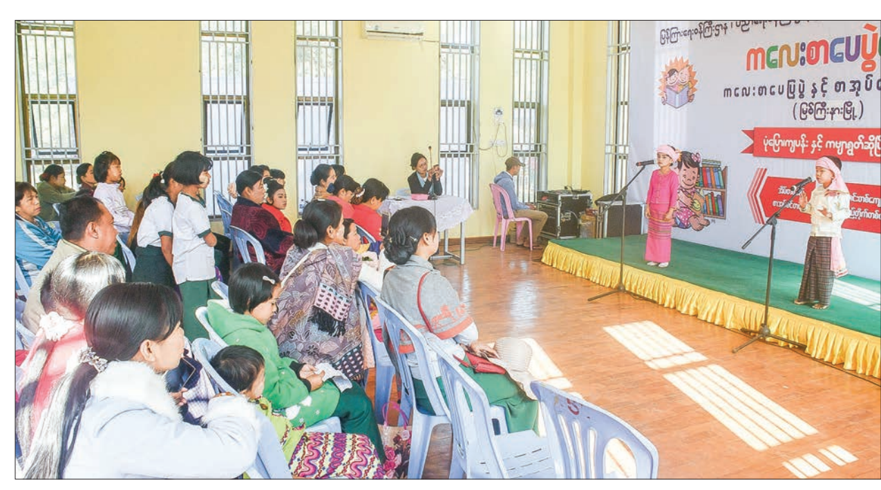
Students\ compete\ in\ the\ story telling\ contests\ in\ ethnic\ languages\ at\ the\ second\ day\ of\ Children's\ Literature\ Festival\ in\ Myitkyina.