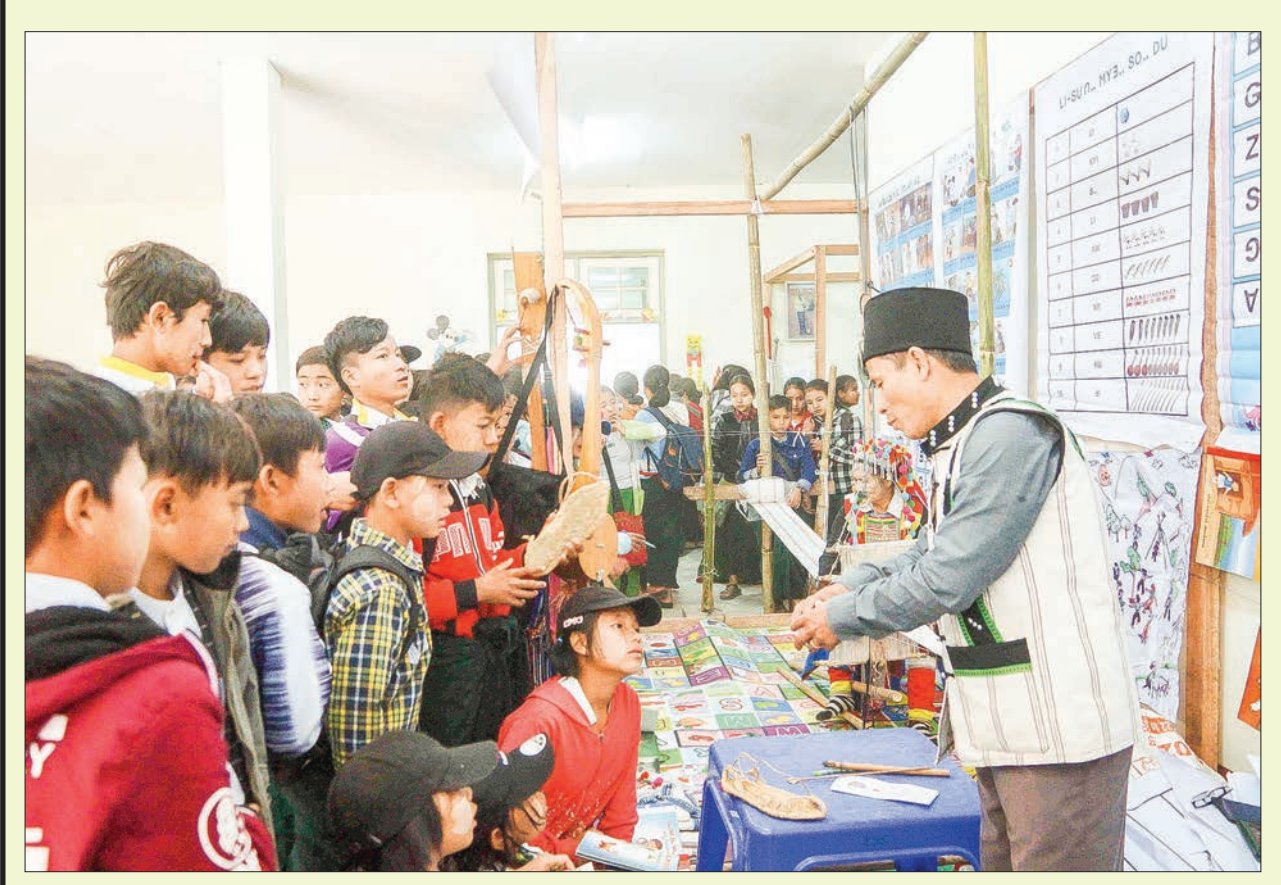
Students observe traditional shoe making at the booth of the ethnic lierature and traditional culture at the Children's Literature Festival in Myitkyina on 21 January, 2019.