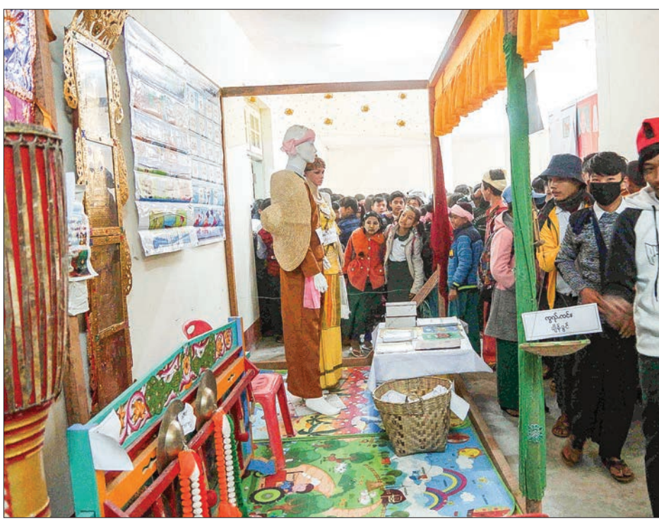
The booth of ethnic literature and culture is crowded with visitors on the second day of Childern's Literature Festival in Myitkyina.

YITKYINA Township's Children's Literature Festival and book sales continued its second day at the Convocation Hall of Myitkyina University yesterday. The festival was bustling with visitors and participants until 5 pm.