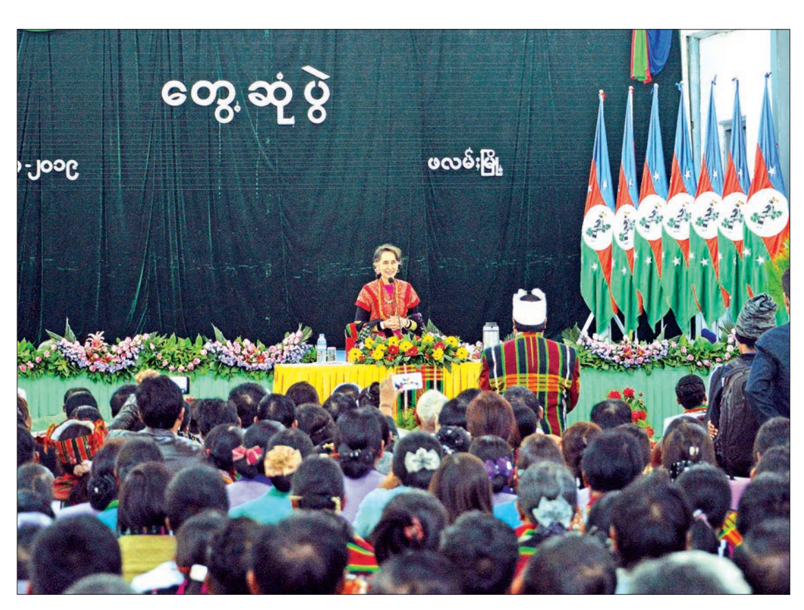
State Counsellor Daw Aung San Suu Kyi responds to queries submitted by local people in Falam Township, Chin State.