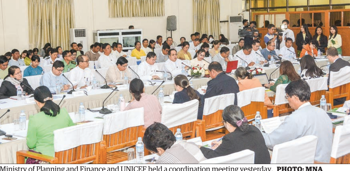
Ministry of Planning and Finance and UNICEF held a coordination meeting yesterday.

The coordination meeting then began the discussion ses-