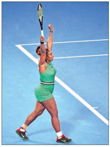
Serena Williams of the US celebrates her victory against Romania's SimonaHalep during their women's singles match on day eight of the Australian Open tennis tournament in Melbourne on 21 January, 2019.