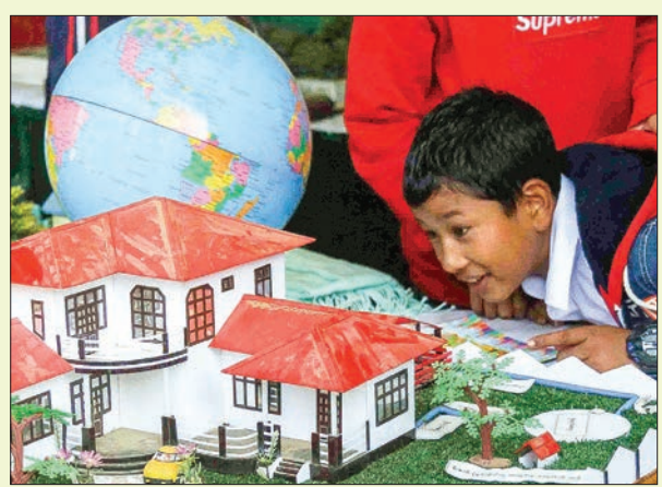
A student observes a scale model of a house showcasing in the booth of the Children's Literature Festival in Myitkyina on 21 January, 2019.