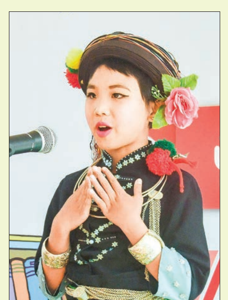
Ethnic students compete in the story telling contest at the Children's Literature Festival in Myitkyina on 21 January, 2019.