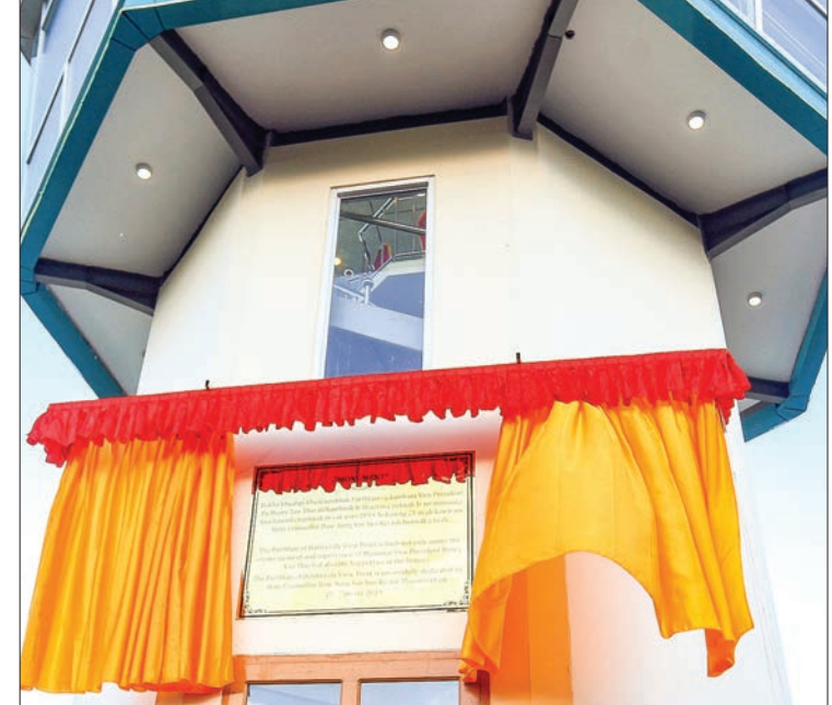
State Counsellor Daw Aung San Suu Kyi formally opens Haka City View Point Tower in Haka Township, Chin State.