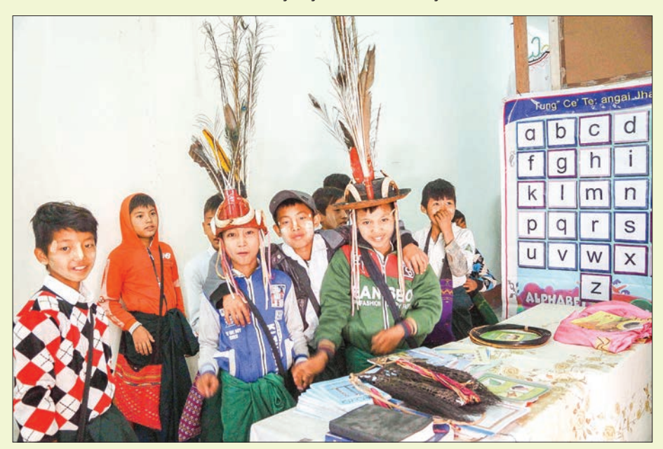
Students try traditional headdress displayed at the booth of the ethnic lierature and traditional culture at the Children's Literature Festival in Myitkyina.