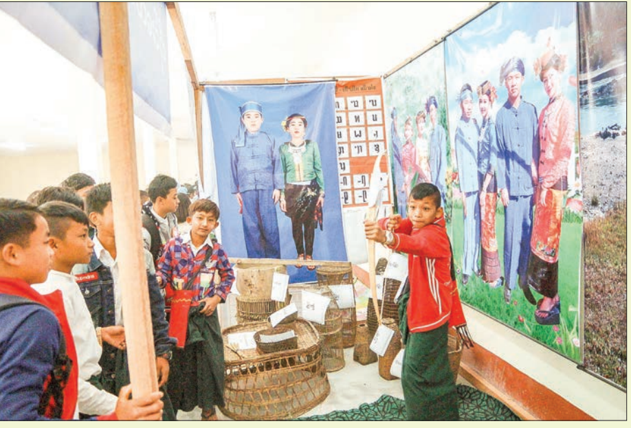
Students observe Shan traditional utensils displayed at the booth of the Children's Literature Festival in Myitkyina yesterday.