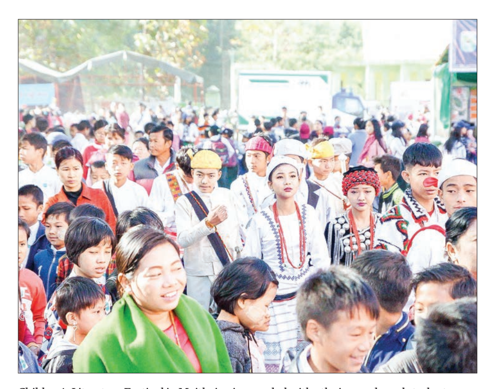
Childern's Literature Festival in Myitkyina is crowded with ethnic people and students on the second day.