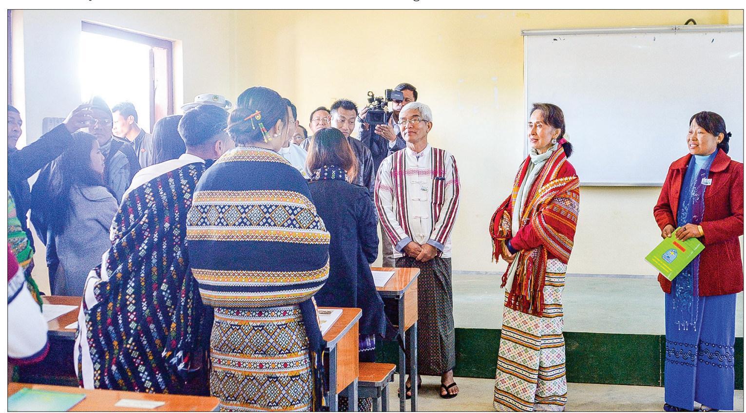
State Counsellor Daw Aung San Suu Kyi meets with students at Haka College in Chin State yesterday.