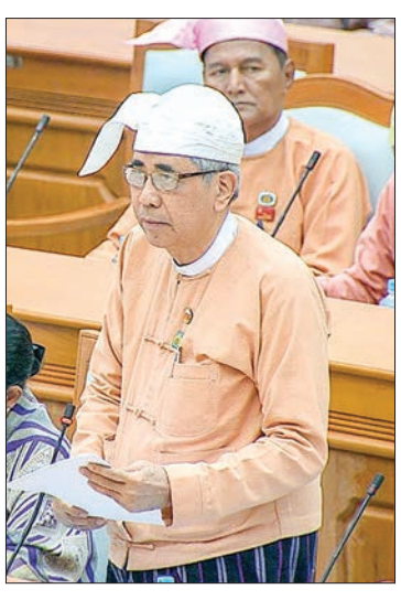
Deputy Minister for Transport and Communications U Kyaw Myo.

well as to cooperated in other Hluttaw works. The regular attendance and obtaining solutions at the regular session of the Hluttaw show each individual Hluttaw representative fulfilling the individual duties, responsibilities and following of ethics and regulations. It also shows the appropriateness of the representatives to the rights, responsibilities and entitlements accorded to them and thus all are urged to attend and participate as much as possible in the Hluttaw regular sessions and related Hluttaw committee meetings. Emphasis