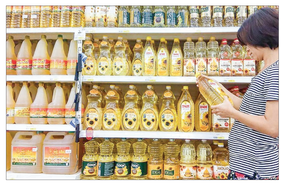
A woman shopper choosing an oil bottle in a supermarket in Yangon.

"Imported edible oils have certificates only from their country of origin and lack FDA testing. However, local millers cannot compete with them, as marketing and good advertising