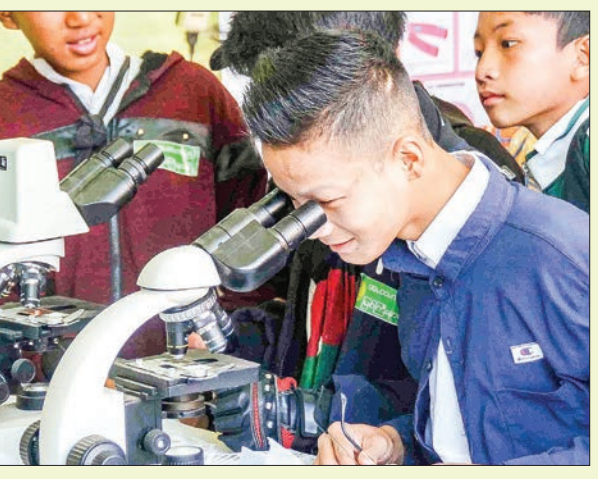
Students try microscopes at the Children's Literature Festival in Myitkyina on 21 January, 2019.