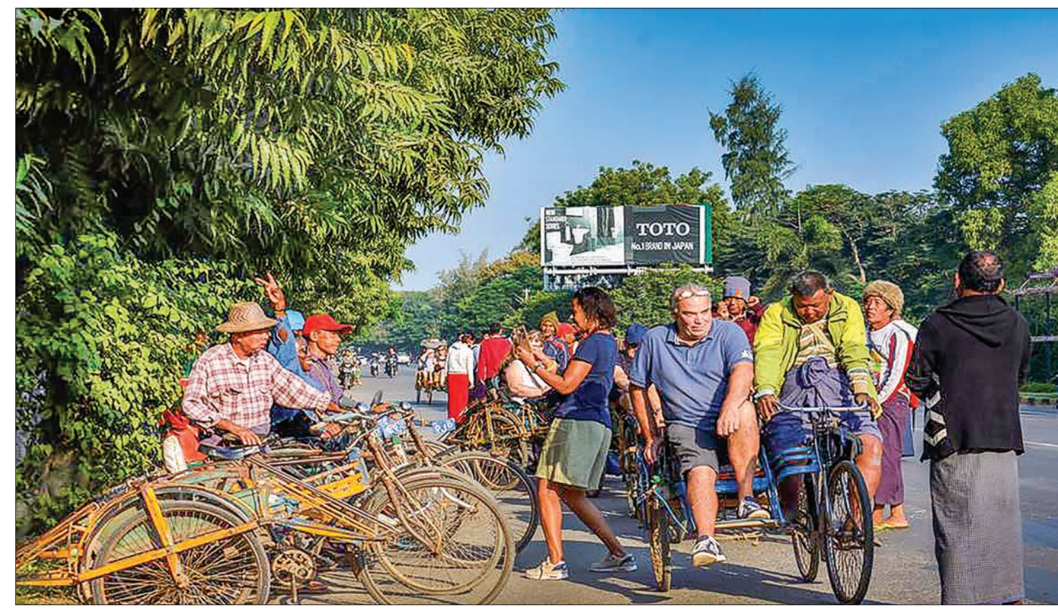
Tourists ride trishaws to tour the wards in Sagaing.

OVER 190,000 local and foreign travellers visited Sagaing Region in 2018, according to official statistics provided by the Sagaing Region's Directorate of Hotels and Tourism.