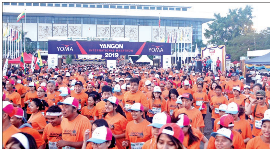
The Marathon participants takes part in the Yoma International Marathon 2019 in Yangon yesterday.

The race lay along significant landmarks in Yangon, such as the Botataung Pagoda, the Shwedagon Pagoda, and the Inya Lake. More than 8,000