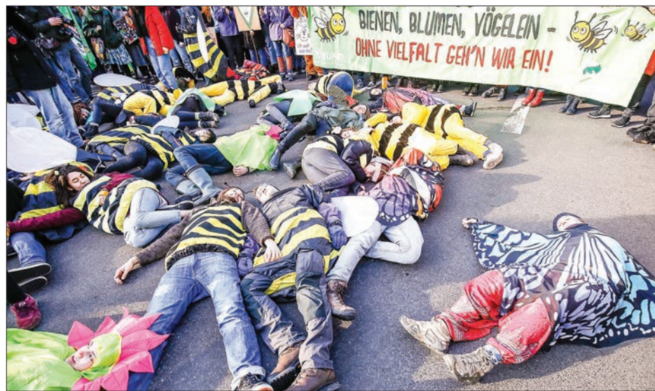
Protesters reenact the dying of bees and insects due to the use of pesticides during a rally for climate justice, animal welfare, low impact farming and good food on 19 January, 2019 in Berlin.

BERLIN (Germany)—Thousands of protesters, backed by a procession of farm tractors, marched in Berlin on Saturday for environmental protection and against the industrial agriculture lobby. Police put the number of demonstrators at over 12,000, while organizers said 35,000 turned out. While the "Grüne Woche" international agricultural fair was taking place in the German capital, the protesters took aim at government policy which prioritised large-scale farming,