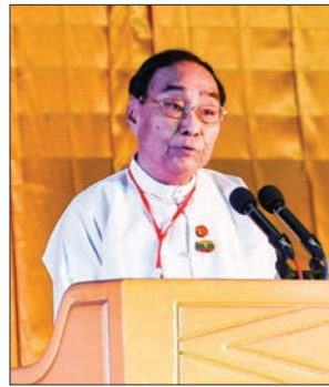
Union Minister for Ethnic Affairs Nai Thet Lwin.