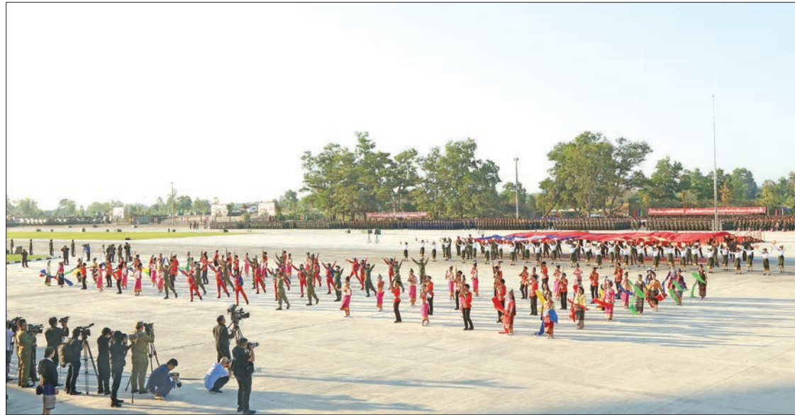
Dance troupes give performances at the military parade held in commemoration of the 70 th Anniversary of the Founding of the Lao People's Armed Forces.

Present on the occasion were President of Laos Mr. Bounnhang Vorachit and cabinet members, Minister of National Defence of Laos General Chansamone Chanyalath, senior military officers of Lao armed forces, invited high level officials of China, Viet Nam, Russia, Cam-