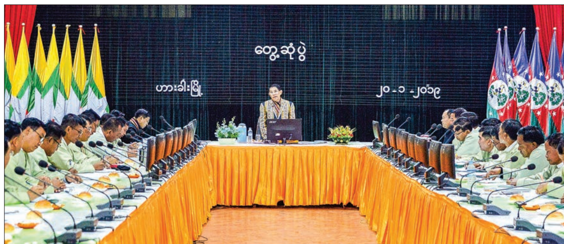
Union Minister U Min Thu addresses the meeting in Hakha, Chin State yesterday.

Firstly, the head of the Chin State GAD introduced the Union Minister to everyone in attendance. He then explained about the State GAD's processes and performances. Union Minister U Min Thu then delivered a speech.