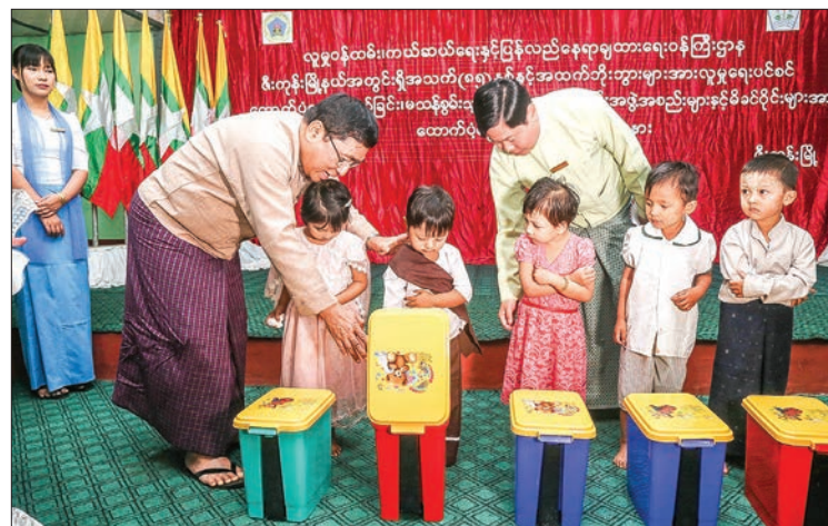
Union Minister Dr. Win Myat Aye meets with children in Zigon, Bago Region yesterday.

UNION Minister for Social Welfare, Relief and Resettlement Dr. Win Myat Aye provided cash assistance to the social organizations, philanthropic organizations and elderly in Zigon, Bago Region, yesterday.