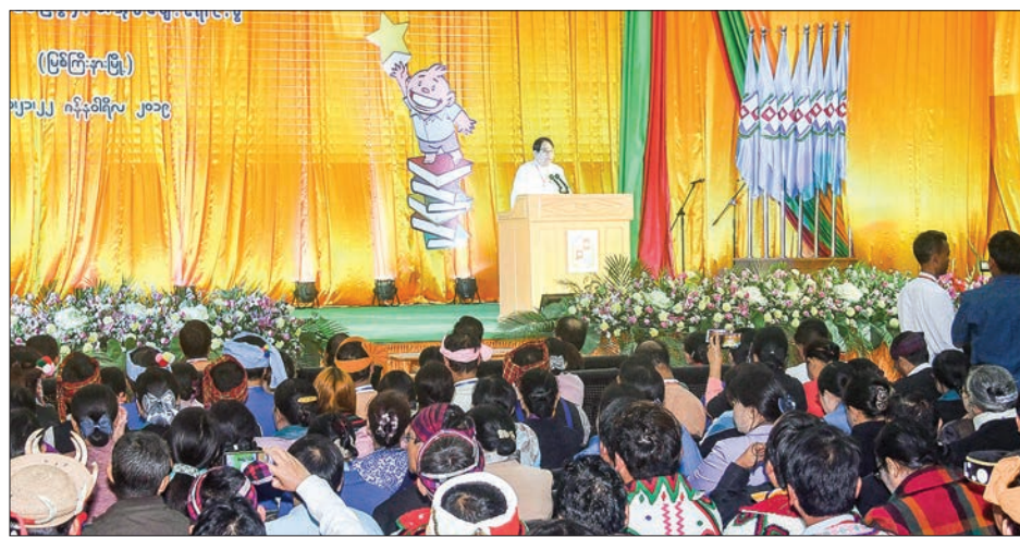
Union Minister Dr. Pe Myint addresses the opening ceremony of the Children's Literature Festival in Myitkyina yesterday.