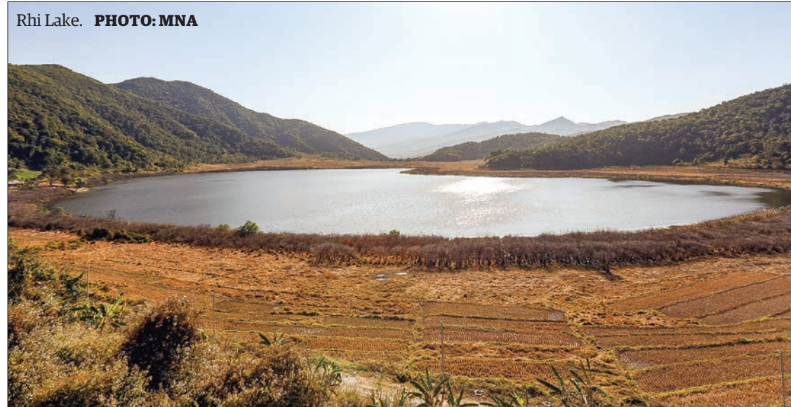
Rhi Lake.

successfully serve its duties is to listen to the public voice. It must know the public desire. People must have trust in the government to express their wishes. If they think that punishment will come for expressing something