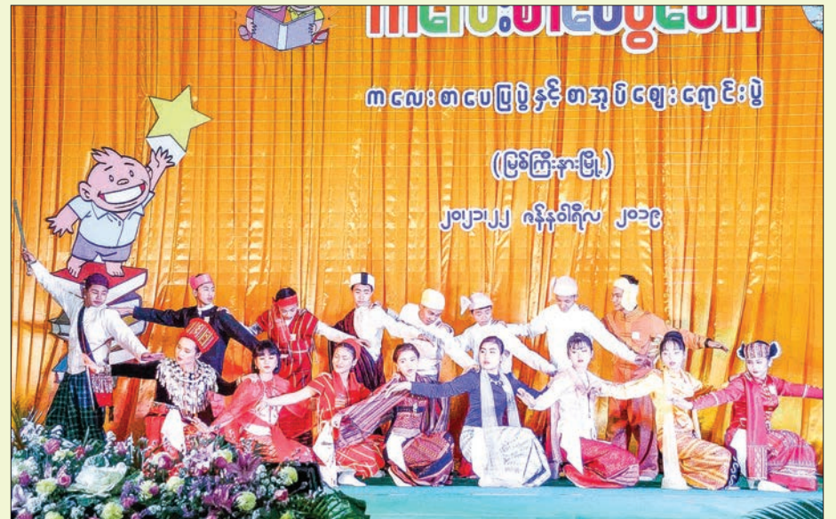
Students entertain the attendees with dance at the opening ceremony of the Children's Literature Festival in Myitkyina.