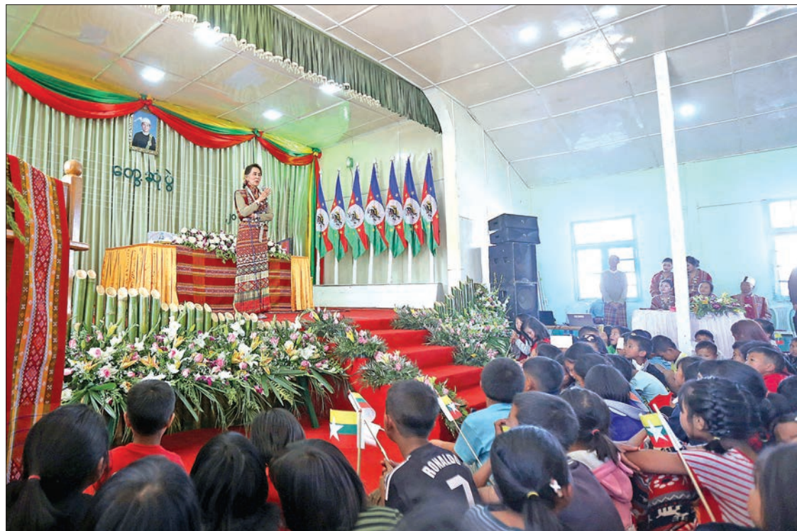
State Counsellor Daw Aung San Suu Kyi meeting with local people in Thantlang.