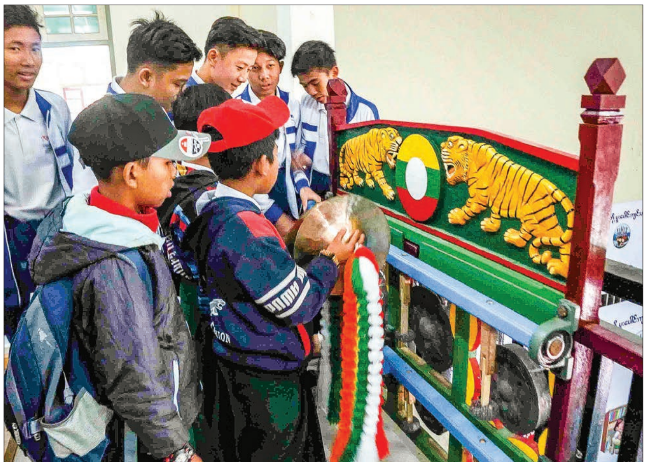
Students observe the Shan traditional musical instrument showcasing in the booth of the festival.