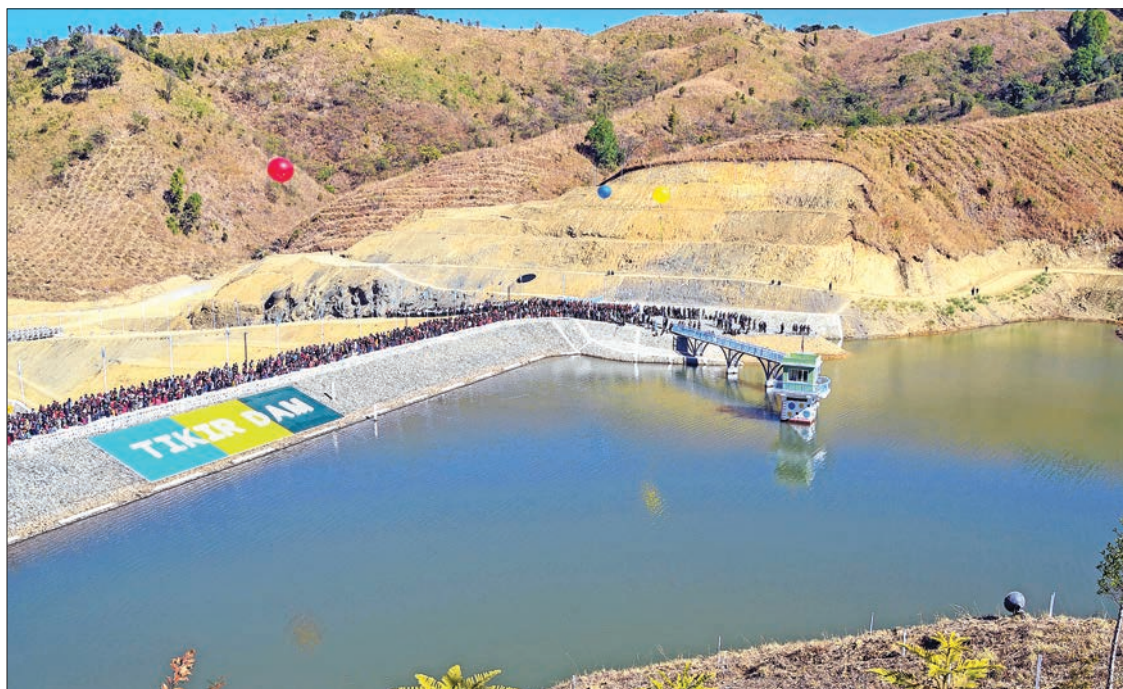
Tikir Dam is seen at the opening ceremony yesterday.

Each of the local people here has the strength to make that happen and the responsibility as well. Please make your surroundings green and healthy. We cannot avoid not changing the natural environment. This dam project, for example, did not come out of nature, it is manmade. We must protect the natural environment so that it becomes a better place to live for the people and other living things in the area.