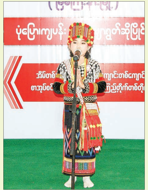
A student competes in the poetry recitation contest at the Children's Literature Festival.