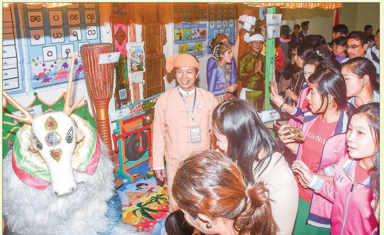
The booth of ethnic literature and culture is packed with visitors.