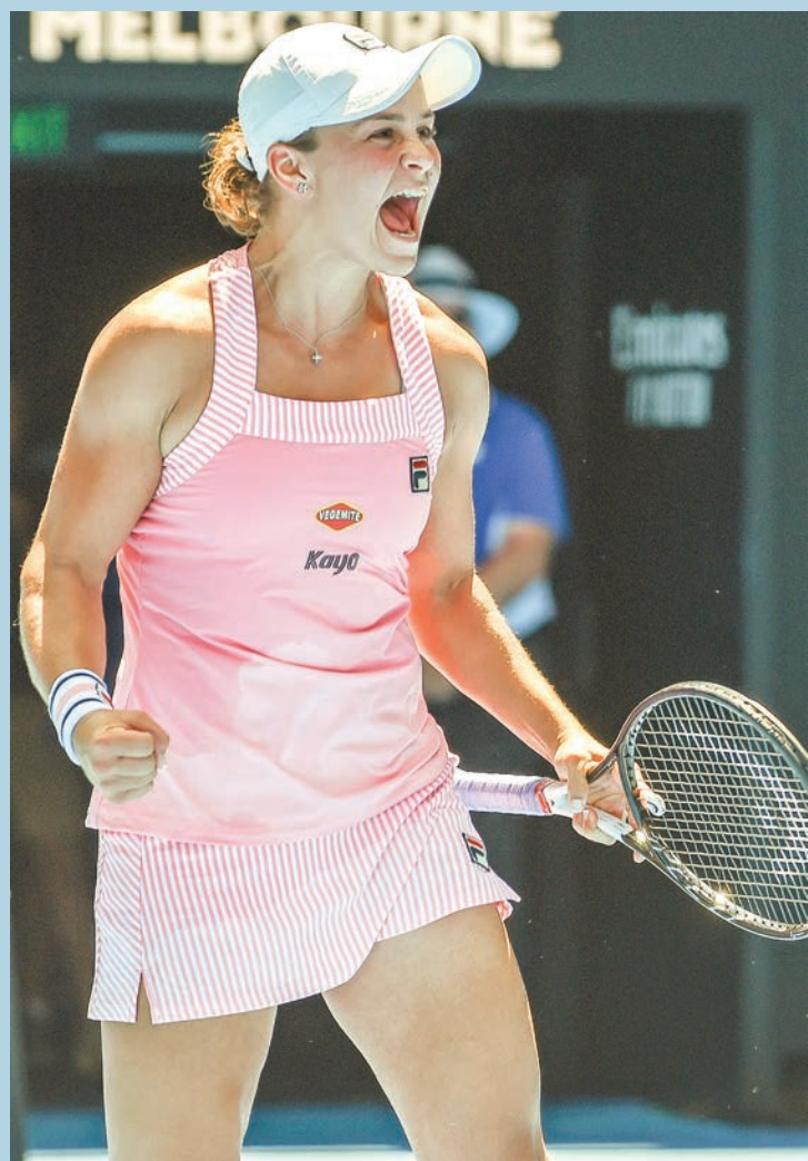
Australia’s Ashleigh Barty celebrates her victory against Russia’s Maria Sharapova during their women’s singles match on day seven of the Australian Open tennis tournament in Melbourne on 20 January, 2019.

Barty lost her only previous meeting with Sharapova in Rome last year but has won seven of her eight matches in 2019.—AFP ■