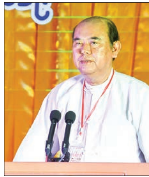
Deputy Minister U Win Maw Tun.