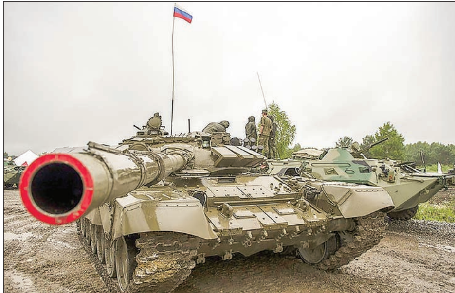
T-72 tank.

MOSCOW—Russia's T-72 tanks and BRDM-2M amphibious armoured patrol cars were featured in a parade on occasion of the 70 th anniversary since the founding of the Lao People's Armed Forces, the Russian Defence Ministry told reporters.