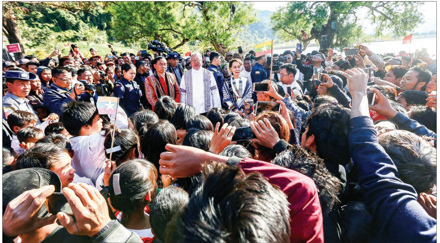
State Counsellor Daw Aung San Suu Kyi meeting with local people as she visits the Rhi Lake in Reedhorda.

All the people must combine their strength to generate energy. No one gained or lost in gener-