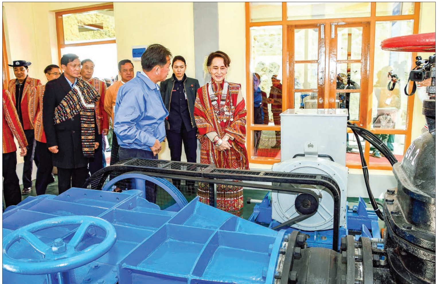
State Counsellor Daw Aung San Suu Kyi visits Tikir Hydropower Plant in Thantlang, Chin State, yesterday.

We (the Union government) wish to support the development of our citizens. In this regard, the involvement and participation of the people are of critical importance. Without public participation, no project will ever succeed.