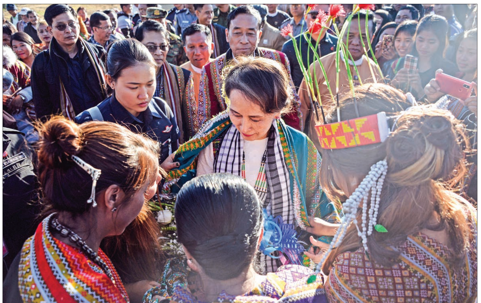
State Counsellor Daw Aung San Suu Kyi is welcomed by local ethnic people in Haka.