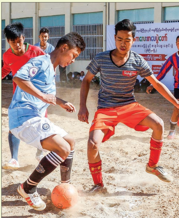
Students play football as part of the Children's Literature Festival's sports activities.