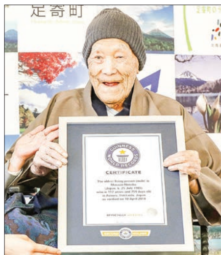
Masazo Nonaka, 112, poses in Ashoro on Japan's northernmost main island of Hokkaido on 10 April, 2018.

The British organization confirmed that Nonaka was the oldest living man on 10 April, 2018.—Kyodo News ■