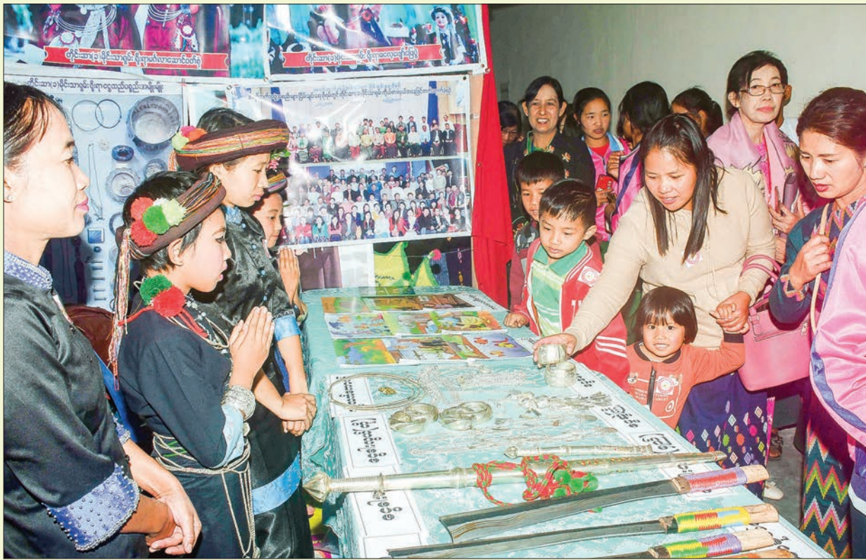
Visitors observe traditional swords and machetes displayed at the booth of the ethnic literature and traditional culture at the Children's Literature Festival in Myitkyina on 20 January, 2019.