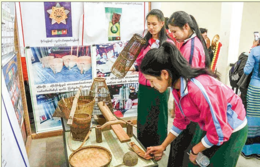
Ethnic people's traditional fishing equipment and household utensils made of bamboo have attracted the children at the Children's Literature Festival.