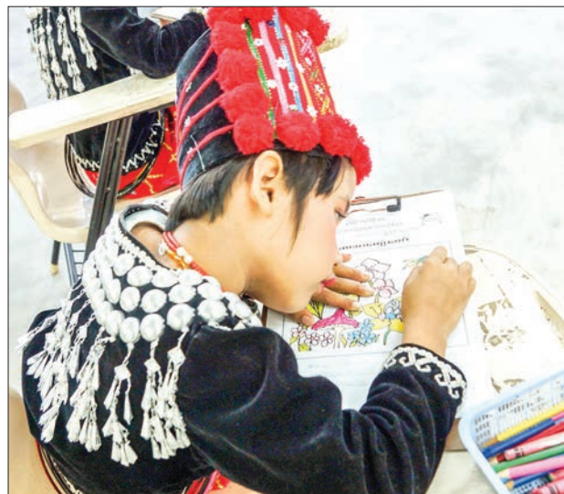
A child takes part in the colour painting contest in the Children's Literature Festival in Myitkyina yesterday.