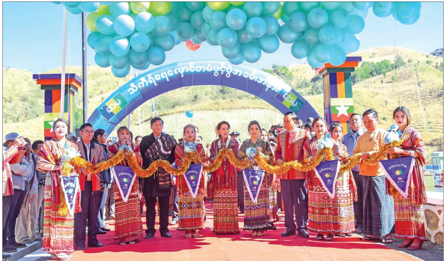
State Counsellor Daw Aung San Suu Kyi and Vice President U Henry Van Thio formally open the Tikir Dam.

“There are five dangers or enemies in Buddhist belief: floods, fire, bad rulers, people who do not appreciate you, and thieves. It won’t be too much of a stretch to say ThiKi dam has shown us the way to overcome these five dangers. We managed to find a way to acquire water. When you think about it, having