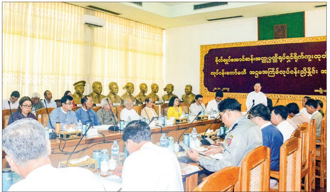
Union Minister Thura U Aung Ko addresses the meeting for Bogyoke Aung San Biographical Film Production in Yangon yesterday.

The vice chair of the working committee and the Deputy Minister for Culture, U Kyi Min, also spoke at the meeting. Later, Secretary U Tun On and Joint Secretary 2 U Lu Min presented a report on the progress of work and future programs. A general round of discussions then followed. The Union Minister made the concluding remarks.—MNA ■ (Translated by TMT)