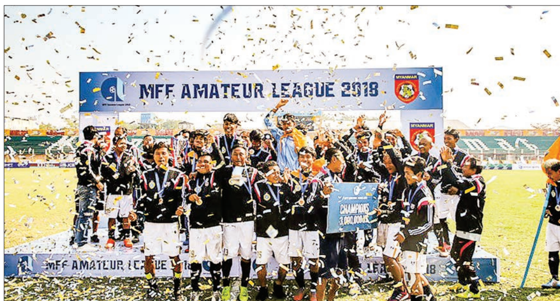
The champion team of Mandalay’s competition zone of the MFF Amateur League 2018, Kyel Sin Su FC celebrates the victory in Mandalay yesterday.

THE Myanmar Football Federation’s Amateur League concluded with victories for two teams — the Mon F.C. in the Yangon Region competition zone and the Kyel Sin Su F.C. in the Mandalay Region competition zone.