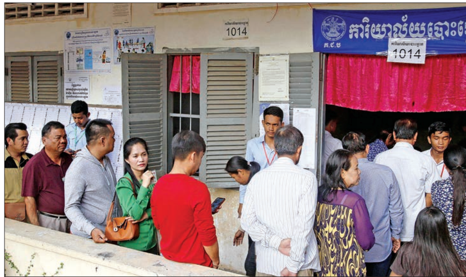
People line up to vote in the Cambodian general election at a polling station in Phnom Penh on 29 July, 2018.

PHNOM PENH — The Cambodian king has allowed two opposition figures to resume political activities from which they were banned ahead of last July’s general election, according to a government document obtained on Wednesday.