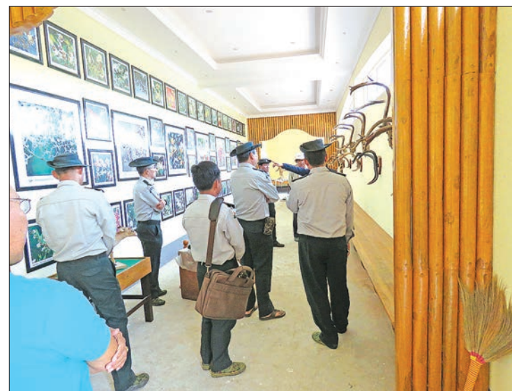
Kanbalu bat cave natural conservation park and education center showcases the area's biodiversity and ecosystem.

"The course is being conducted under a project entitled 'Sustainable Cropland and Forest Management in Priority Agroecosystems of Myanmar'.