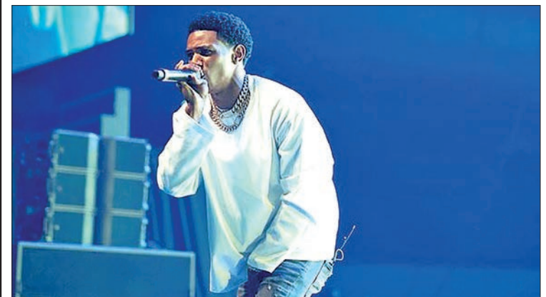
"Hoodie SZN" is rapper A Boogie Wit Da Hoodie's second full-length studio album.

His sophomore album did not sell enough downloads — "Hoodie SZN" has not been released in a physical format — to make Billboard's sales-only chart, which saw Lady Gaga and Bradley Cooper's "A Star Is Born" soundtrack take first place. The Billboard 200 chart began including streams in its ranking in December 2014, calculating figures based on "equivalent album units" that include streaming, album downloads and traditional album sales. —AFP ■