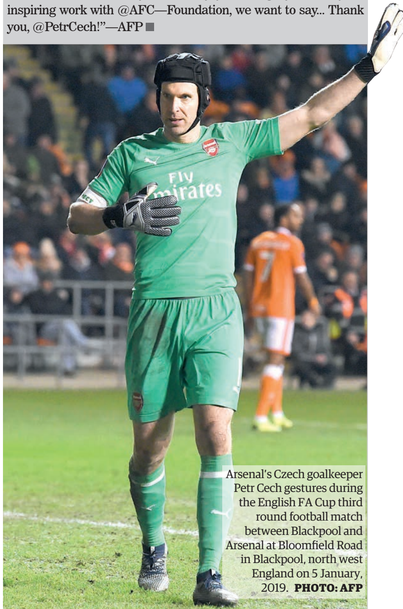
Arsenal's Czech goalkeeper Petr Cech gestures during the English FA Cup third round football match between Blackpool and Arsenal at Bloomfield Road in Blackpool, north west England on 5 January, 2019.

He is also the Czech Republic's most capped player, making 124 appearances. Cech is no longer first choice at Arsenal, with Bernd Leno preferred for most of this season so far, but the club were quick to pay their own tribute. Arsenal tweeted: "For your consummate professionalism, for being the perfect role model, for the 50 clean sheets, for your honesty, your integrity and for your inspiring work with @AFC—Foundation, we want to say... Thank you, @PetrCech!"—AFP ■