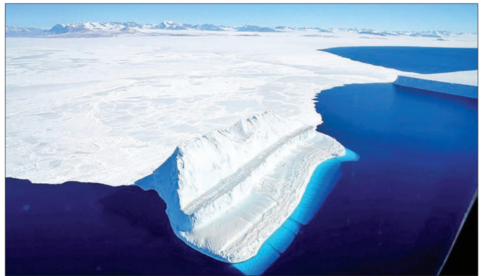
Global warming is melting ice in Antarctica faster than ever before, a new study says.

The total amount of ice in the Antarctic, if it all melted, would be enough to raise sea level 187 feet