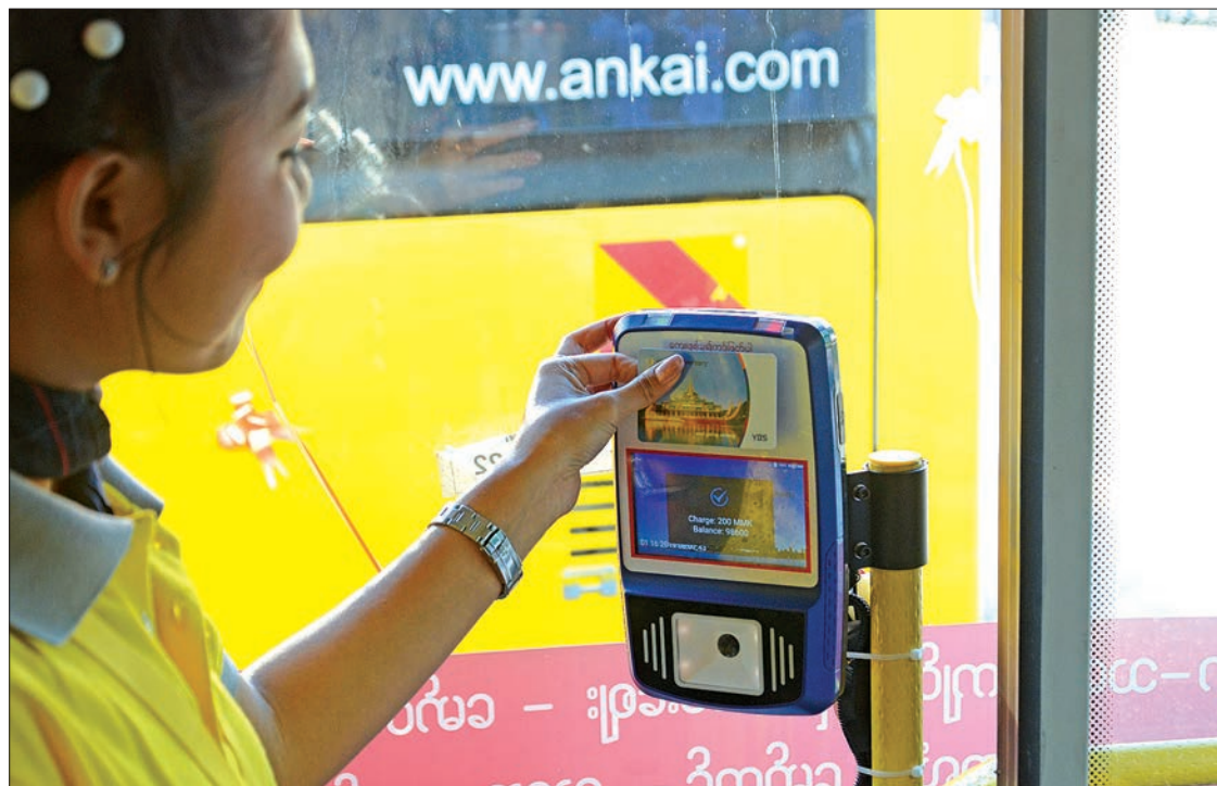
A staff of YBS demonstrates how to use a smart card with the card payment system to media at the ceremony to celebrate the 2 nd year anniversary of the Yangon Buse Service.

Within the next 9 months, we are planning to change the card payment system step by step and Asia Starmar Transport Intelligent Company will take responsibility for the YPS (Yangon Payment Service).