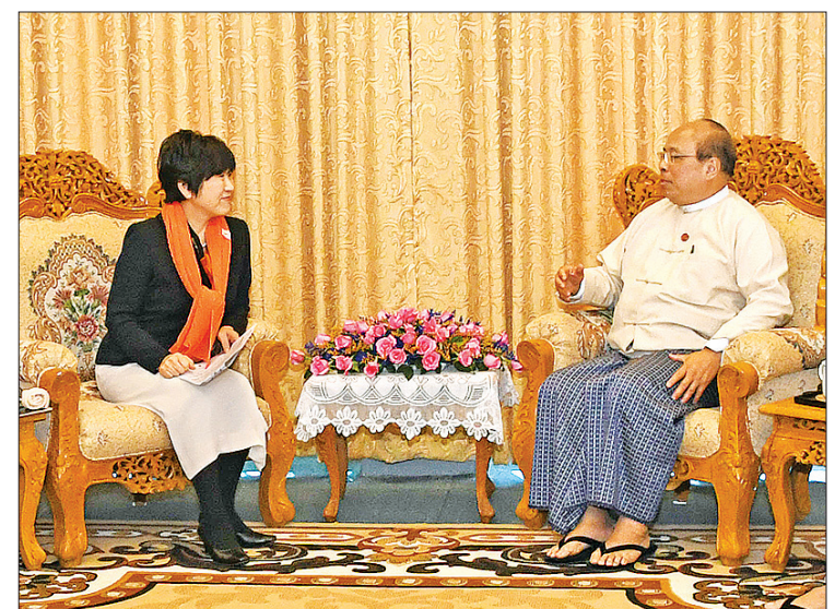
Union Minister U Thaung Tun meets with Japan's State Minister for Foreign Affairs Ms. Toshiko Abe yesterday.

The meeting was attended by officials from the Ministry of Foreign Affairs and Ambassador Mr. Ichiro Maruyama of the Japanese Embassy in Yangon. —MNA ■