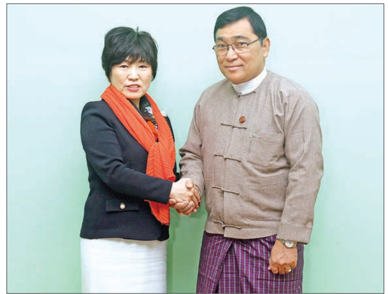
Union Minister Dr. Win Myat Aye shakes hands with Japanese State Minister for Foreign Affairs Ms. Toshiko Abe in Nay Pyi Taw.