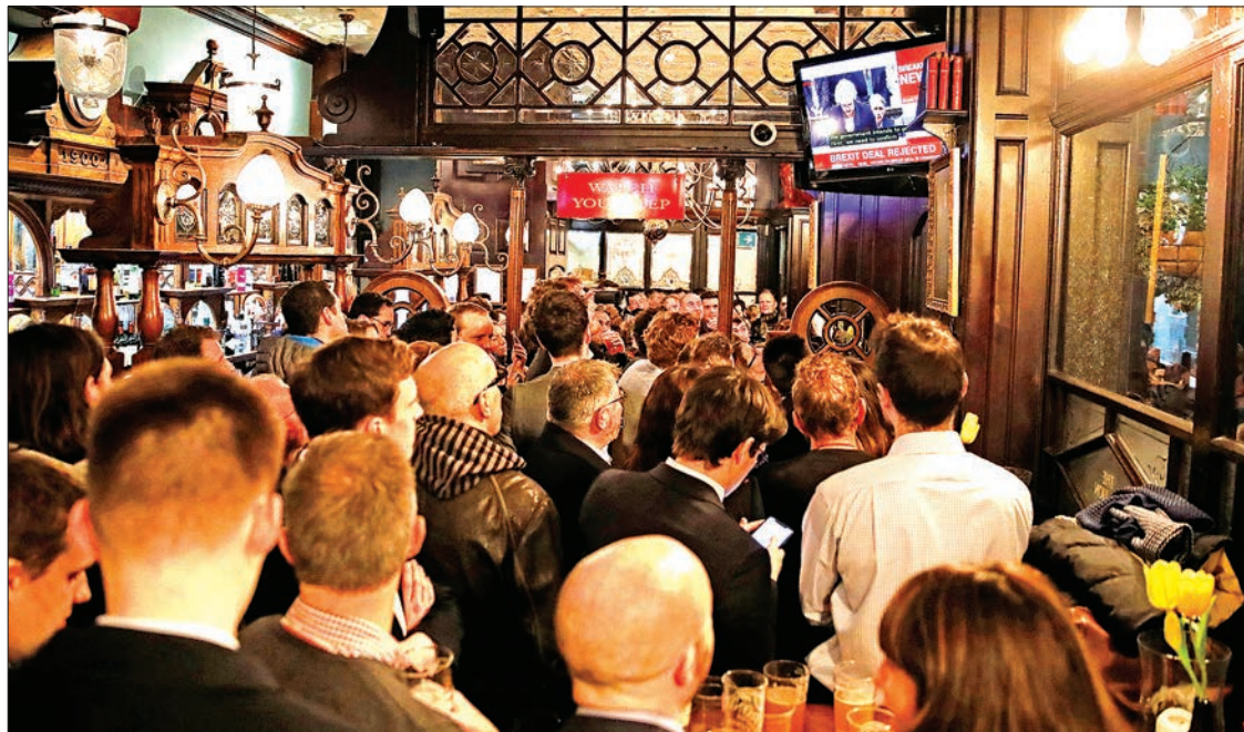
Drinkers watch a television screen in the Red Lion public house on Whitehall, as it shows Britain's Prime Minister Theresa May speaking in the Houses of Parliament in London on 15 January, 2019, after MPs vote against the government's Brexit deal. British lawmakers voted overwhelmingly on Tuesday to reject the EU divorce deal struck between London and Brussels, in a historic vote that leave Brexit hanging in the balance.

While her own Conservative MPs and her allies in Northern