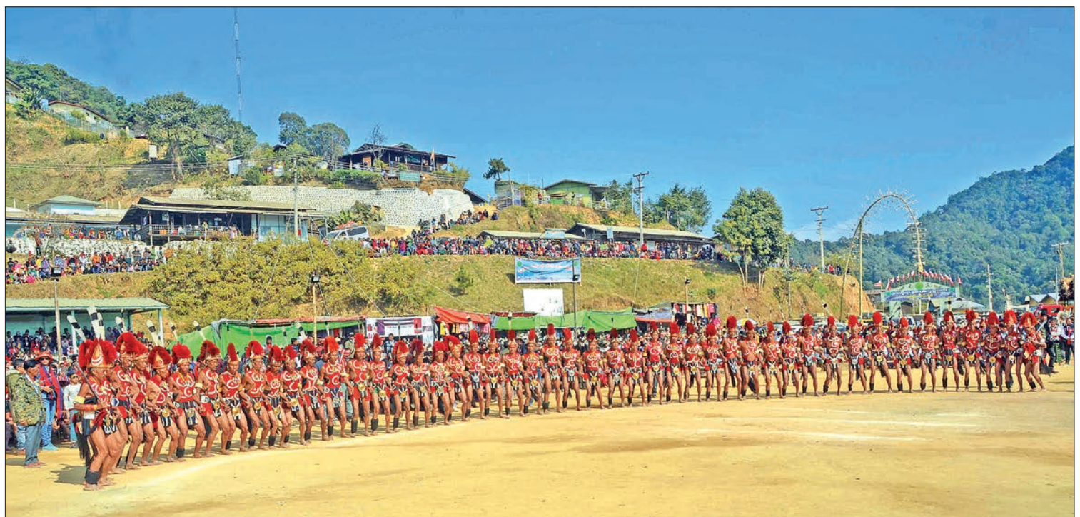
Naga people dancing at the traditional 2019 New Year festival in Leshi, Naga Self-administered Zone of Sagaing Region.

Due to limitation of space we are only able to publish "Letter to the Editor" that do not exceed 500 words. Should you submit a text longer than 500 words please be aware that your letter will be edited.