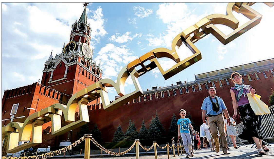
The exhibition "Encompassing the Globe: Portugal and the World in the XVI and XVII Centuries," opened in late 2017, attracted 183,865 visitors.