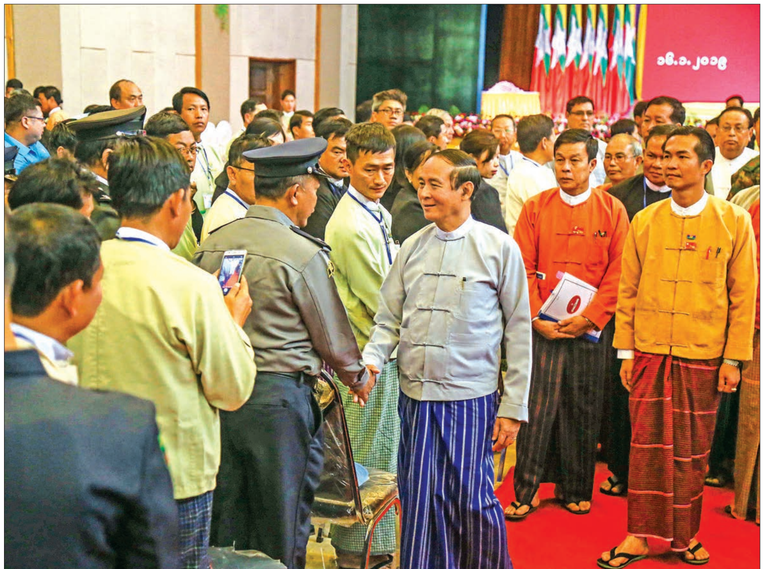
President U Win Myint greets attendees at the meeting with officials from the judiciary, executive and legislative pillars in Kayah State yesterday.

In his opening speech, the President said he has been traveling to the states and regions urging democratic transition and national reform to be carried out uniformly. He said that Myanmar was transitioning from an old system to a new and modern system, and that this required the people to break out of their old habits and onto new paths. He said every responsible official needed to cooperate to reach the intended goal. He said a firm resolution has been set to establish a 'democratic federal union'. He said all citizens in a democratic country enjoyed equality, justice, fairness, and the same rights and opportunities. He said Myanmar comprised many ethnic national races and cannot be called a Union without all of them in-