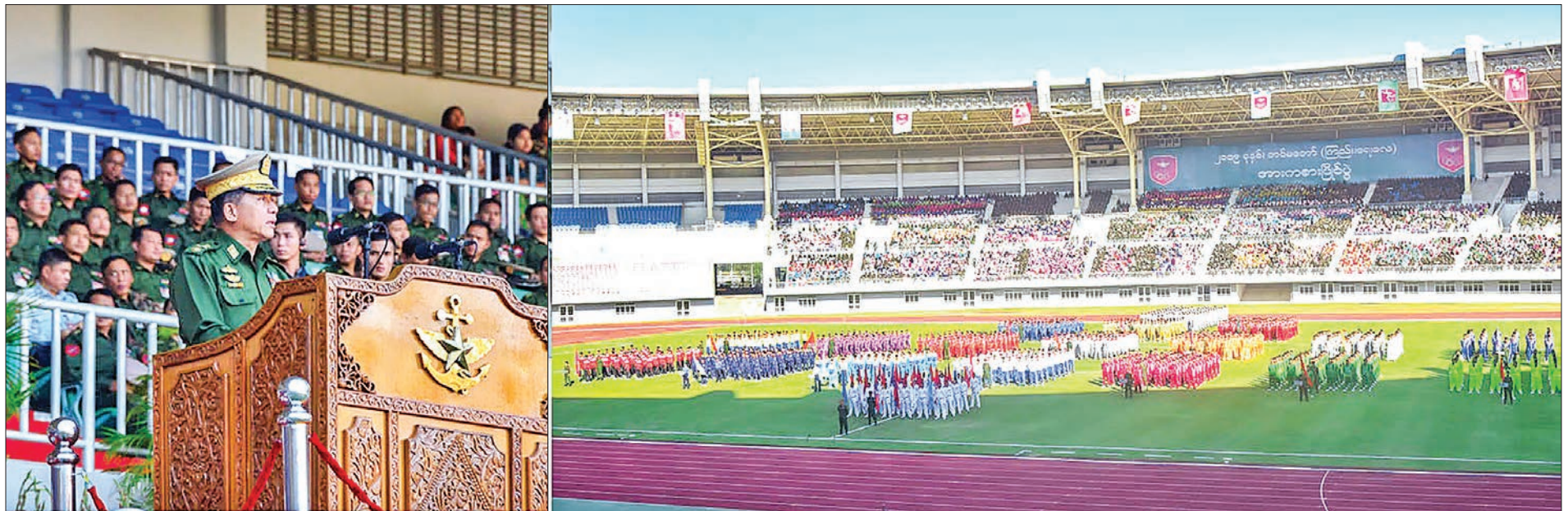
Commander-in-Chief of Defence Services Senior General Min Aung Hlaing delivers the opening speech at the Tatmadaw's sports competition in Nay Pyi Taw.

THE sports competition of the Tatmadaw (Army, Navy and Air) was opened yesterday at Zeyya Thiri Tatmadaw sports ground in Nay Pyi Taw yesterday.