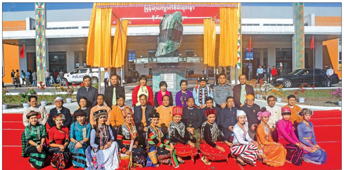
Kachin State Chief Minister Dr. Khet Aung and local people pose for documentary photo in front of jade stone to mark 71 st Anniversary of Kachin State Day at Myitkyina Airport.

The Chief Minister awarded honorable certificate to Donor Dr. Banlun Duwa Bomyan. After the ceremony, the Chief Minister and local people pose for documentary photos with jade stone. The jade stone is weight:6.37 tons, height:8 feet and width-4 feet.—MNA ■ (Translated by M T A)