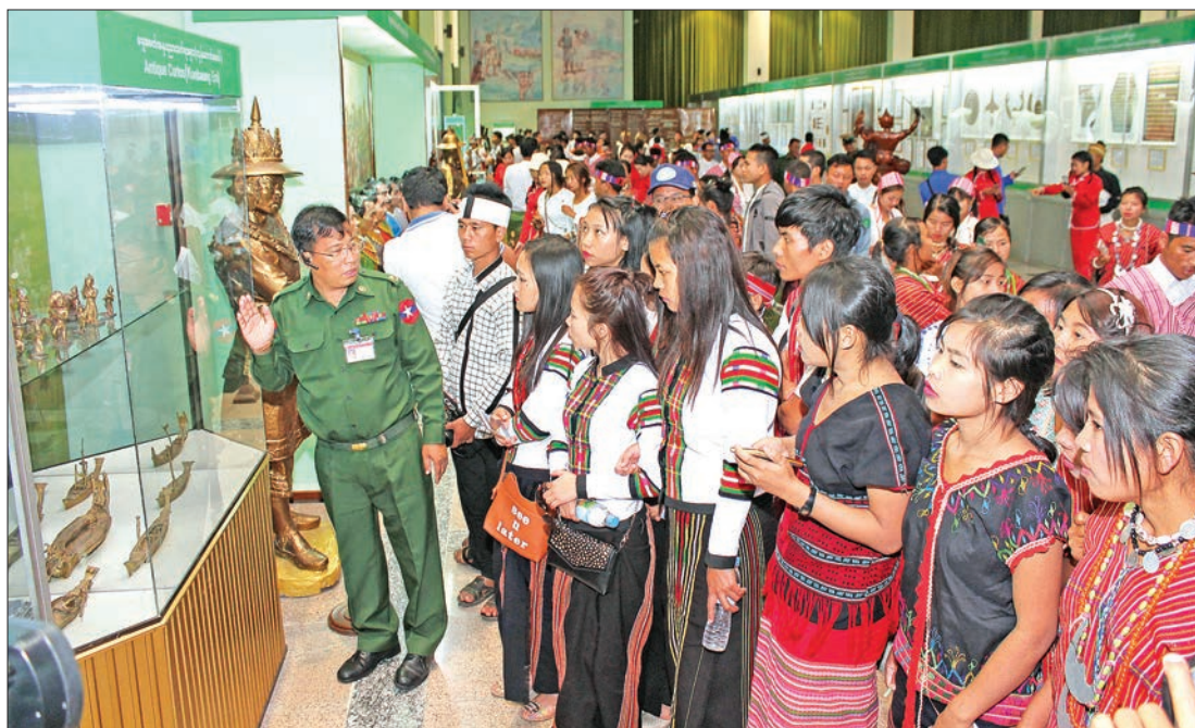
Ethnic excursion group observe Antique Curios (Konbaung) displayed at Defense Services Museum in Nay Pyi Taw yesterday.

WITH the aim of enhancing friendship and understanding among ethnic people, the Ministry of Border Affairs arranged the excursion programme for the ethnic people from remote areas to visit Nay Pyi Taw for four days from 15-18 January.