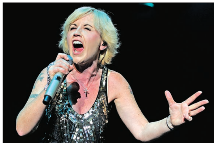
Singer Dolores O'Riordan of the Irish rock band "The Cranberries" performs at the Sant Jordi Club in Barcelona on 4 October, 2012.

"I have no doubt that she is happy now and would be delighted with today's announcement."—AFP ■