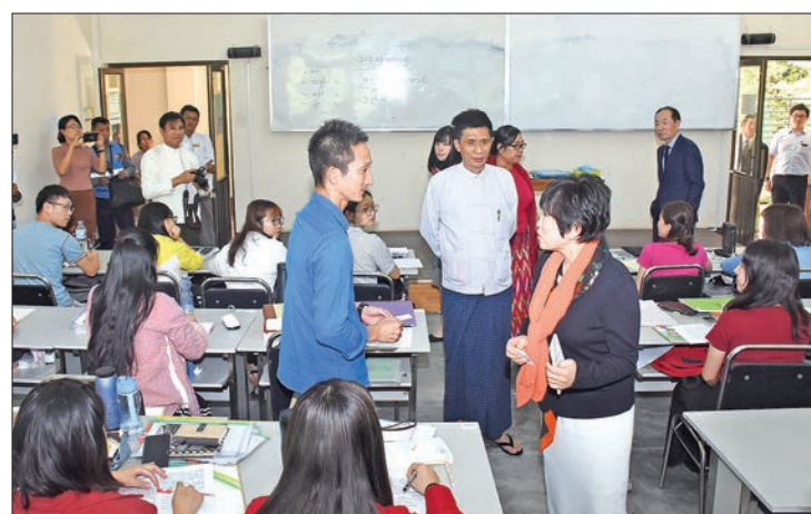
Japanese State Minister for Foreign Affairs Mrs. Toshiko Abe greets international students from Myanmar Language class at Yangon University of Foreign Languages in Yangon.