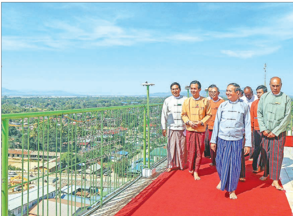
President U Win Myint and entourage visit the Myo Nam Pagoda in Loikaw yesterday.