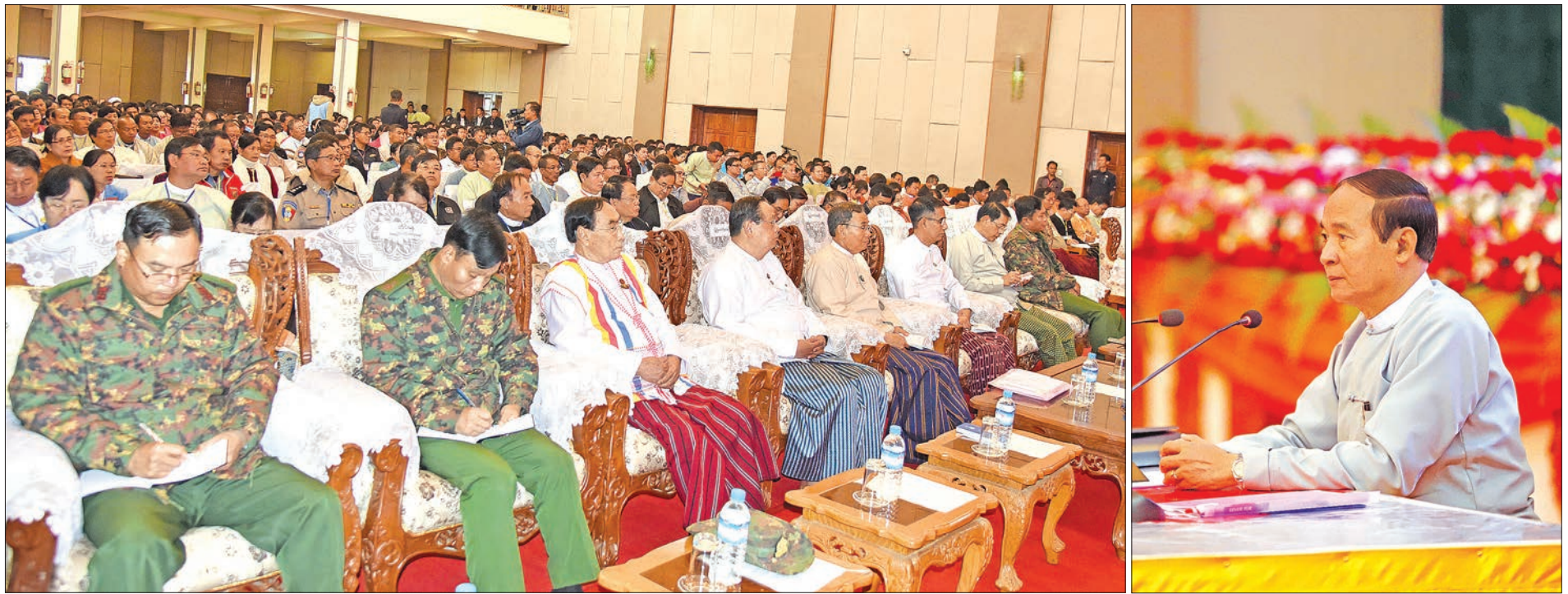
President U Win Myint meeting with officials from the executive, legislative and judiciary pillars of Kayah State in Loikaw, Kayah State yesterday.