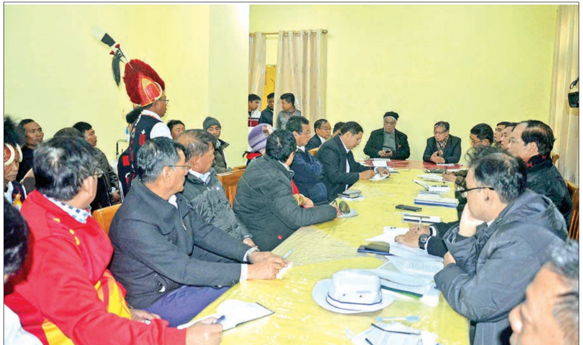
Union Minister U Kyaw Tint Swe holds a meeting together with officials from the Naga Self-Administered Zone Leading Body, Naga central traditional culture and literature committee.

members of the body, leaders of ethnic Naga tribes and officials from the Naga central traditional culture and literature committee.