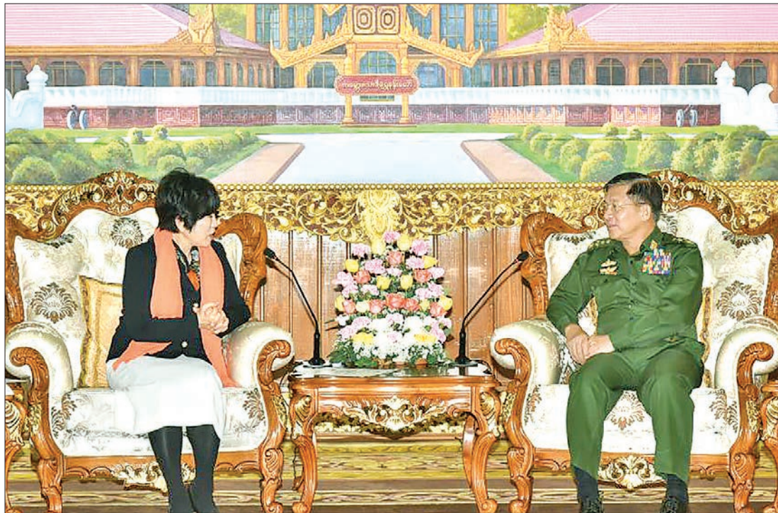
Senior General Min Aung Hlaing meets Japan's State Minister for Foreign Affairs Ms. Toshiko Abe.

Commander-in-Chief of Defence Services Senior General Min Aung Hlaing received Japan's State Minister for Foreign Affairs Ms. Toshiko Abe at the Bayintnaung Guest Hall in Nay Pyi Taw yesterday, according to the Office of the Command-