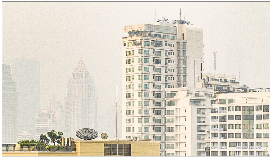
A layer of smog blankets the Thai capital Bangkok on 14 January, 2019. Thai authorities are set to deploy rain-making planes to combat the pall of pollution that has shrouding the capital in recent weeks.

BANGKOK (Thailand) — Thailand is set to deploy rainmaking planes to seed clouds in an effort to tackle the pall of pollution that has shrouded the capital in recent weeks.