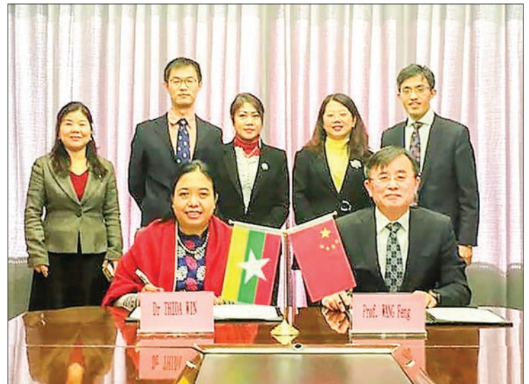
The MoU signed to promote the extensive cooperation between the Mandalay University and China's Beijing University of Chemical Technology on 14 January.