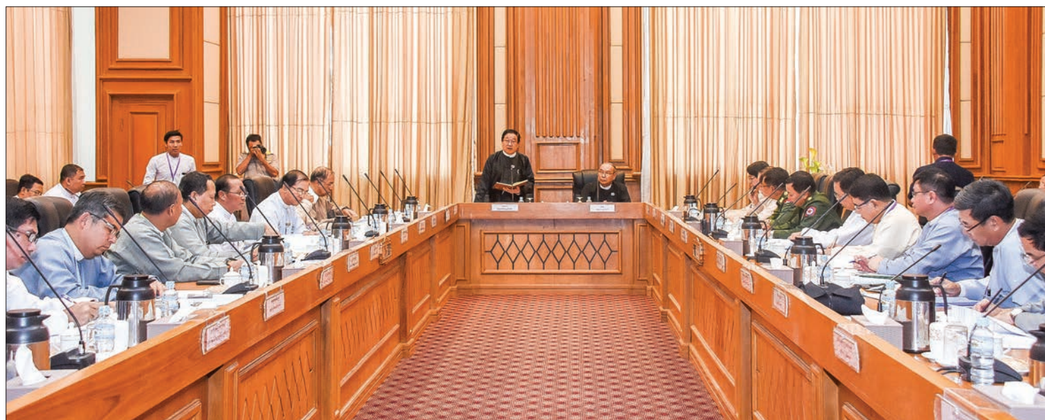
Pyidaungsu Hluttaw Speaker U T Khun Myat addresses the Myanmar Parliamentary Union (MPU) Meeting 1/2019 in Nay Pyi Taw.

At the meeting, U T Khun Myat, Pyidaungsu Hluttaw and Pyithu Hluttaw Speaker, said that the second Hluttaw regular sessions had been successfully held and which was convened from the first meeting to 10 th meeting. Moreover, the