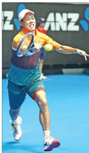
Kei Nishikori of Japan plays against Kamil Majchrzak of Poland in the first round of the Australian Open in Melbourne on 15 January, 2019.

MELBOURNE — An injury retirement allowed world No 9 Kei Nishikori to progress to the second round of the Australian Open on Tuesday, the Japanese