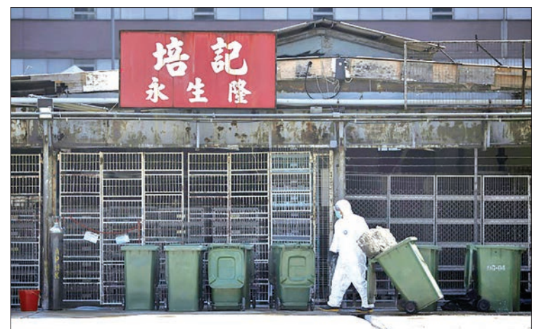
Broad-spectrum antivirals are considered a holy grail because they can be used against multiple pathogens.

The HKU team tested their chemical "AM580" on mice in a two-year study and found it stopped the replication of a host of flu strains — including H1N1, H5N1 and H7N9 — as well as the viruses that cause SARS and MERS.—AFP ■