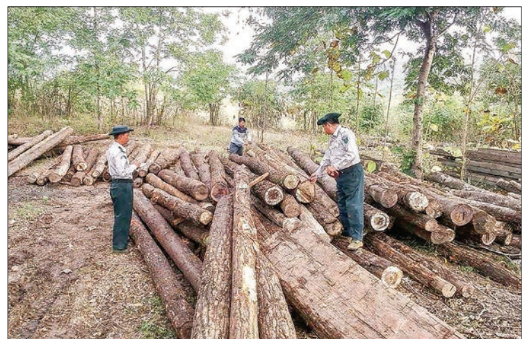
Forestry officers measure illegal logs seized near the Sedawgyi Dam, Madaya, Mandalay Region.