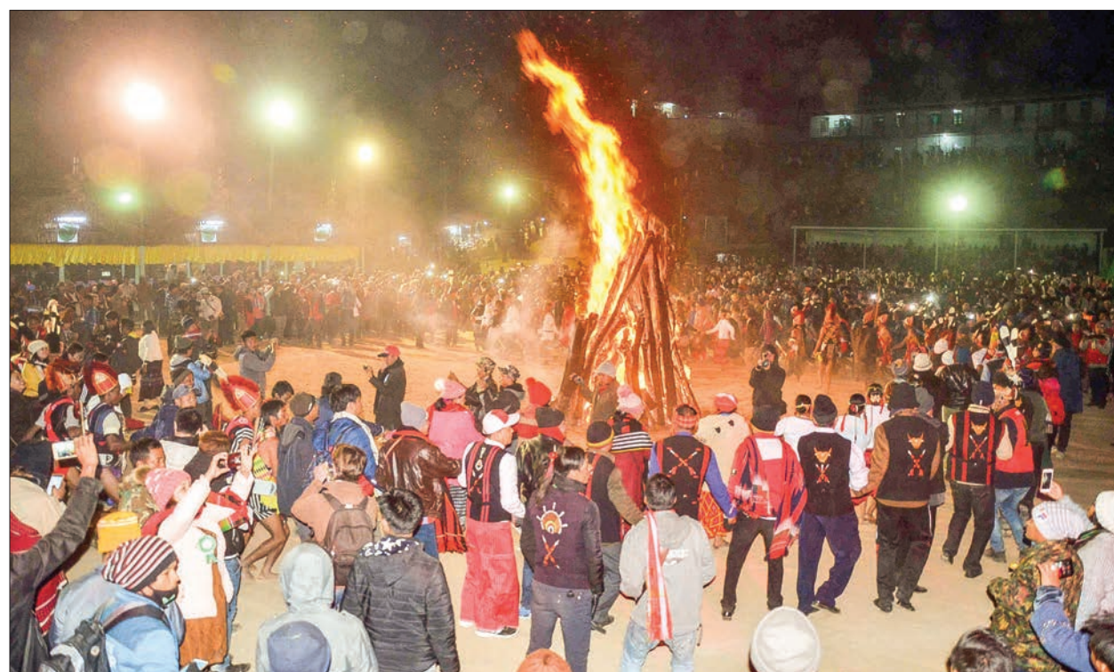
Naga ethnic people and guests enjoying the bonfire as they celebrate the Naga New Year Festival.

These natural beauties and the traditions and cultures of Naga ethnic nationals are a huge opportunity for the development of local and foreign travel business.