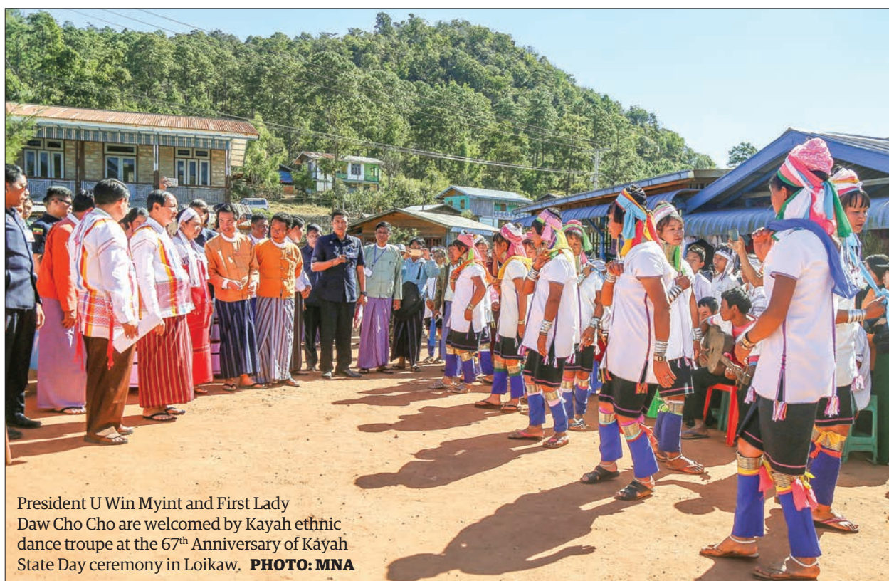
President U Win Myint and First Lady Daw Cho Cho are welcomed by Kayah ethnic dance troupe at the 67 th Anniversary of Kayah State Day ceremony in Loikaw.

and traditional sports/games competition held in Kayah State Day festival field.