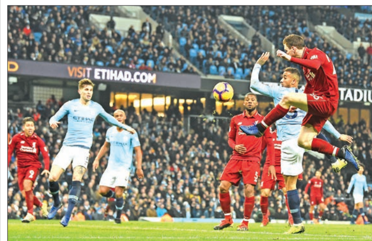
Liverpool’s Scottish defender Andrew Robertson (r) crosses the ball for Liverpool’s Brazilian midfielder Roberto Firmino (l) to head home Liverpool’s first goal during the English Premier League football match between Manchester City and Liverpool at the Etihad Stadium in Manchester, north west England on 3 January, 2019. Manchester City won the game 2-1.

Again, referee Craig Pawson appeared to have made the right decision as Raheem Sterling played a one-two only to be brought down by Ryan Bennett’s clumsy challenge. Jesus took a stuttering run-up for his spot kick, but there was nothing hesitant in his confident finish into the bottom right corner.—AFP ■