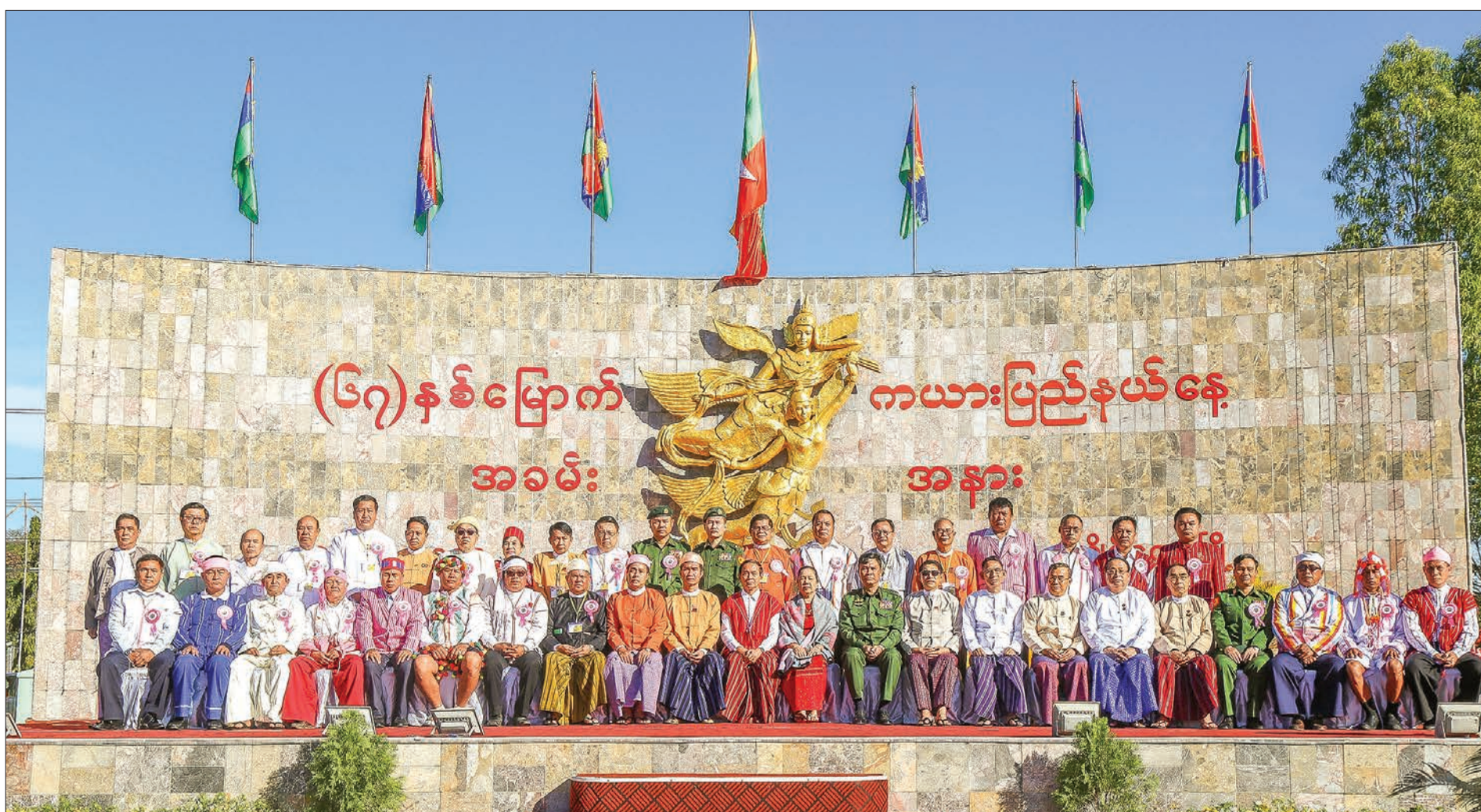
President U Win Myint poses for the commemorative photo together with attendees at the 67 th Anniversary of Kayah State Day in Kandahaywun Park in Loikaw.