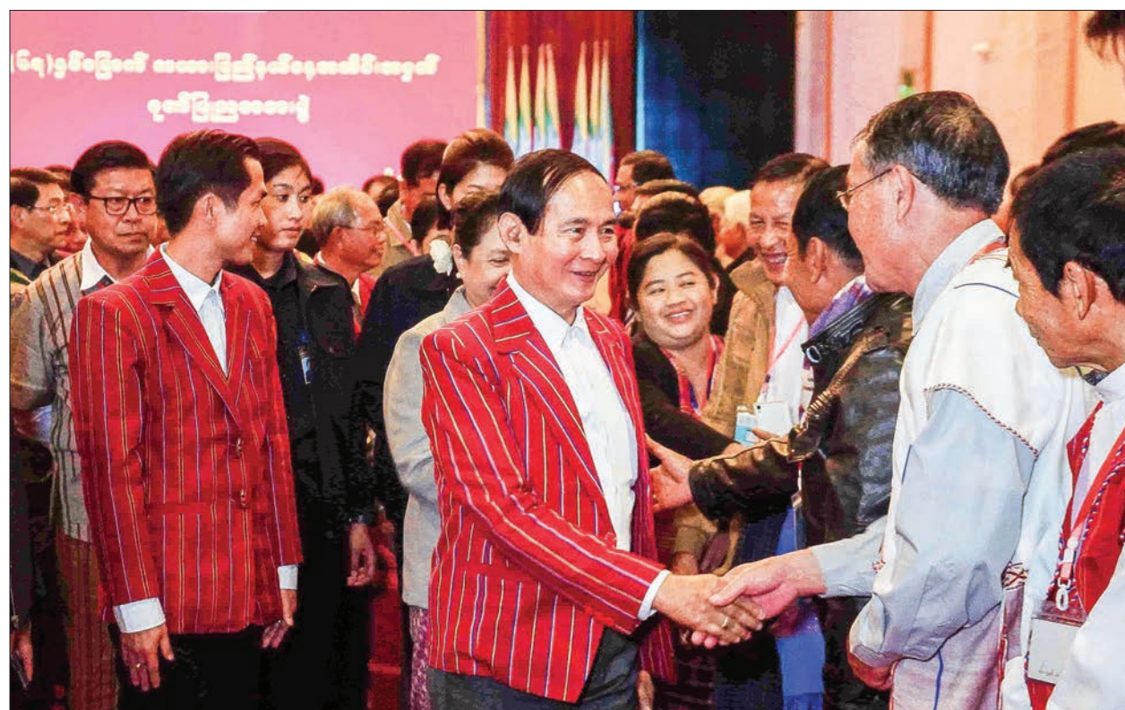
President U Win Myint greets ethnic people at dinner to mark the 67 th Kayah State Day in Loikaw.

As a national priority, we are also ensuring that our ethnic brothers and sisters are guaranteed of their complete rights.