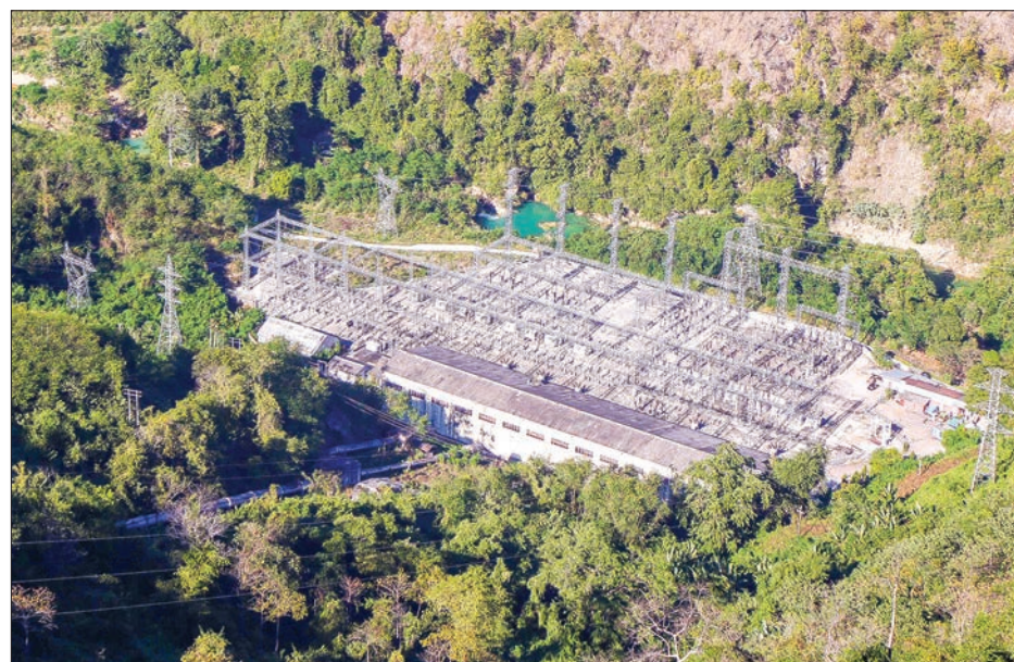
President U Win Myint and his entourage observe the Baluchaung hydro power plants from the view point in Loikaw, Kayah State yesterday.