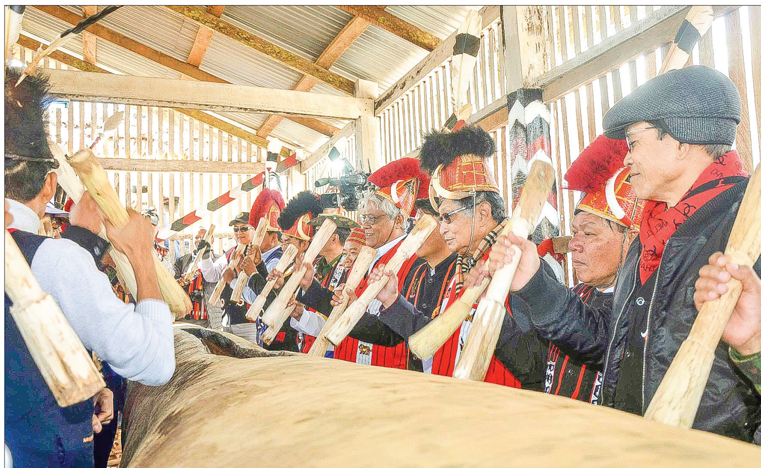
Union Minister U Kyaw Tint Swe and party together with Naga people beating a traditional drum at Naga New Year Festival.

Due to these facts to cease the 70 years long internal armed conflicts Union Peace Conference – 21 st Century Panglong meetings were being held to resolve political problems through political means by taking the Nationwide Ceasefire Agreement (NCA) path. At the moment, good results were being achieved by signing 51 basic principles in two parts of the Union Accord.