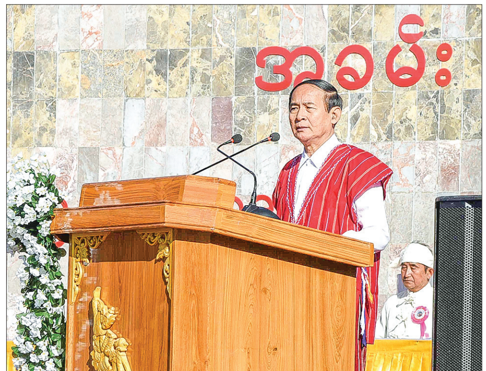
President U Win Myint delivers the greeting speech at the 67 th Anniversary of Kayah State Day.

to participate in it. After the ceremony the President and party took commemorative group photos with Kayah State Chief Minister, Eastern Command commander, State Hluttaw Speaker, State Chief Judge, state ministers, Hluttaw representatives, representative of political party, ethnic national leaders, members of the chairs and state government members. After the President had cordially greeted the local people, the President and party visited the 67th Anniversary Kaya State Day exhibitions