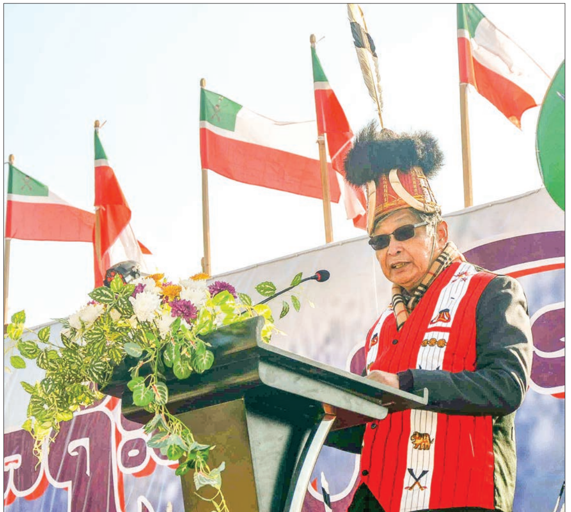
Union Minister U Kyaw Tint Swe delivers the opening speech at the 2019 Naga traditional New Year Festival at Naga Self-Administered Zone, Sagaing Region yesterday.

According to the 2018 Constitution there are six self-ad-