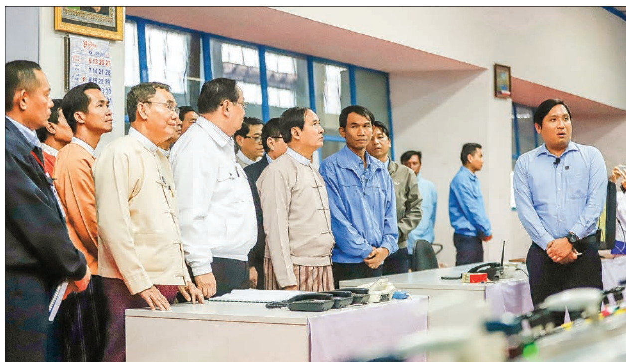
President U Win Myint inspects Baluchaung Hydro Power Station in Loikaw, yesterday.

ter for the long term sustainability of Baluchaung Power Station 1, 2 and 3 is to maintain Inle Lake and the long term existence of Moebyel Dam and relevant ministries are to cooperate in these works.