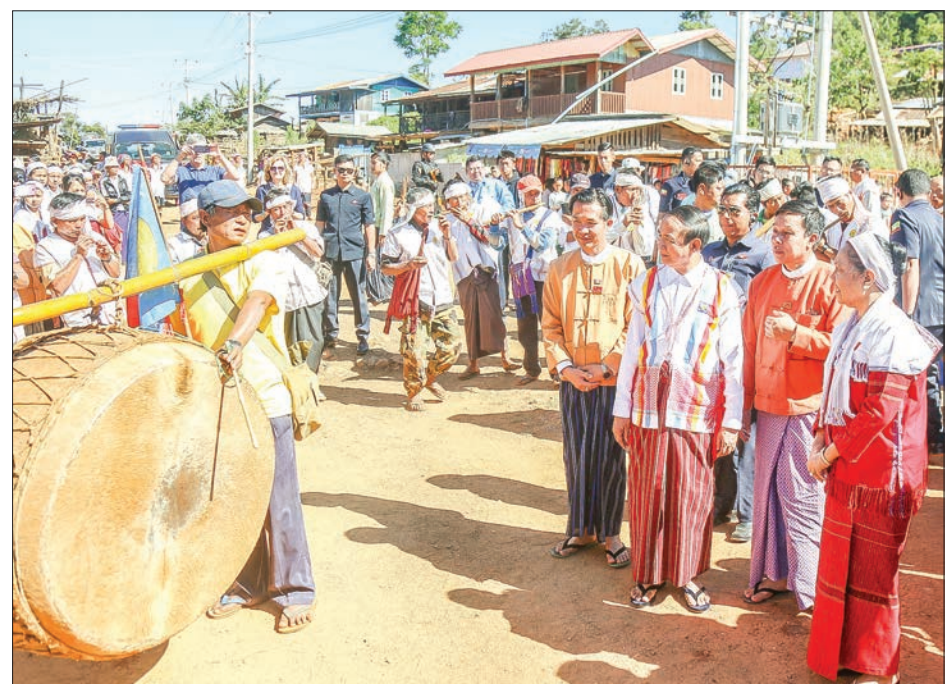
President U Win Myint looks around the celebration of 67 th Anniversary of Kayah State Day in Kandahaywun Park in Loikaw yesterday.