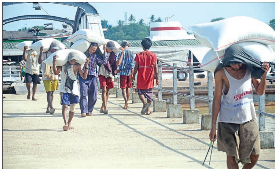
Workers unloading sacks of rice from a vessel at a jetty in Yangon.