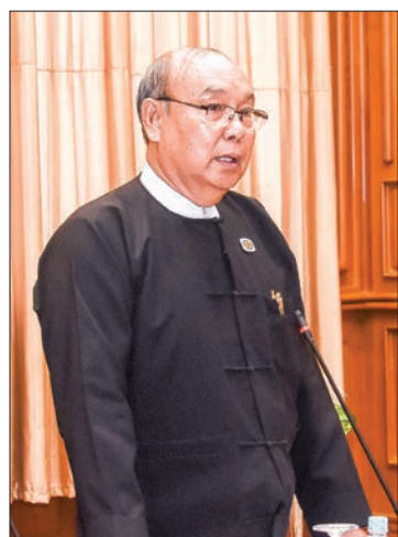
Speaker of Amyotha Hluttaw Mahn Win Khaing Than.

work process of the Hluttaw has been facilitated due to the support provided by relevant work committees.