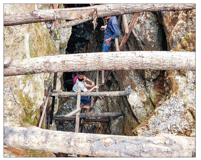
Small-scale miners at a local mine in Mandalay Region.