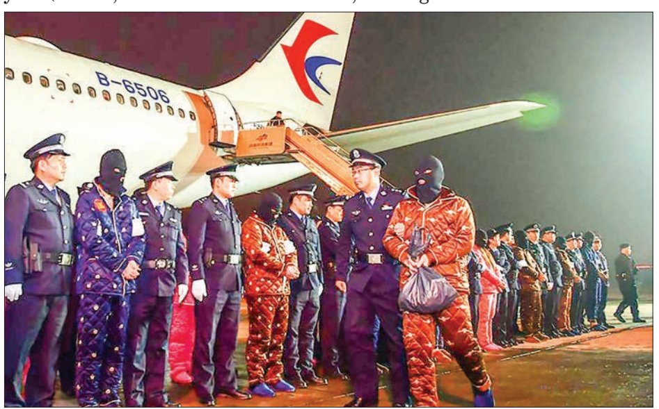
Suspects are brought back to China from Laos at Xinzheng International Airport in Zhengzhou, capital of central China's Henan Province on 11 January, 2019.

from 11 fraud groups. In December 2012, the ministry started a year-long campaign against telecom and Internet fraud.—Xinhua