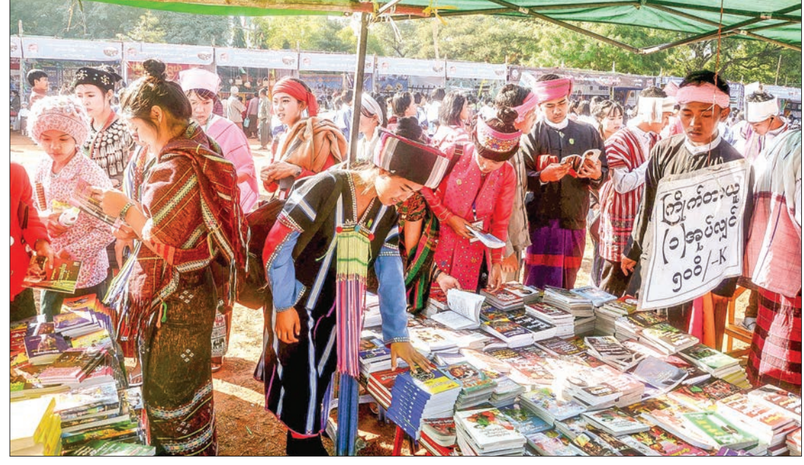
Bookstalls are crowded with visitors.