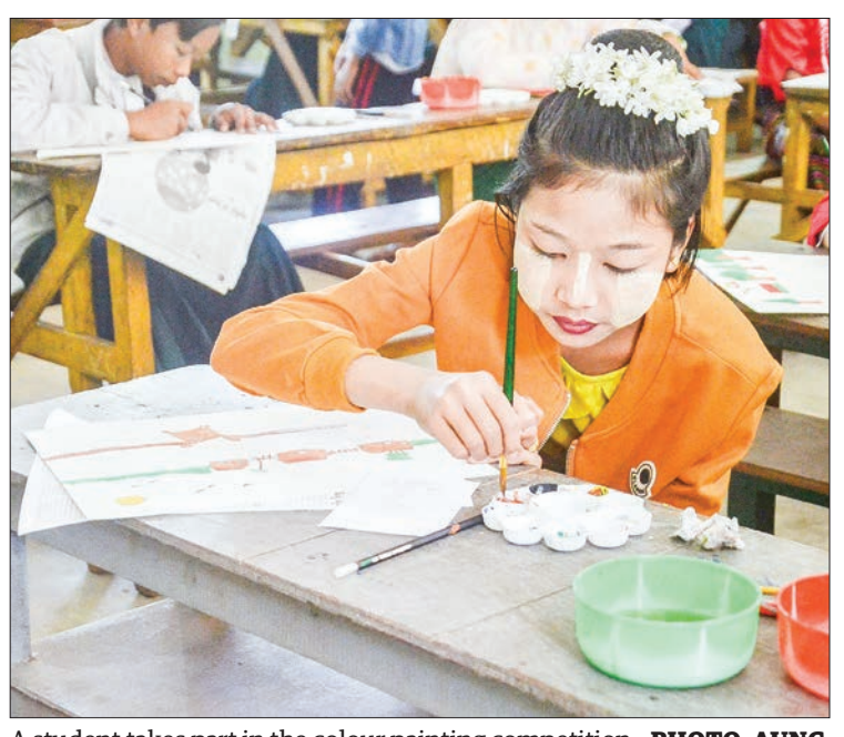
A student takes part in the colour painting competition.