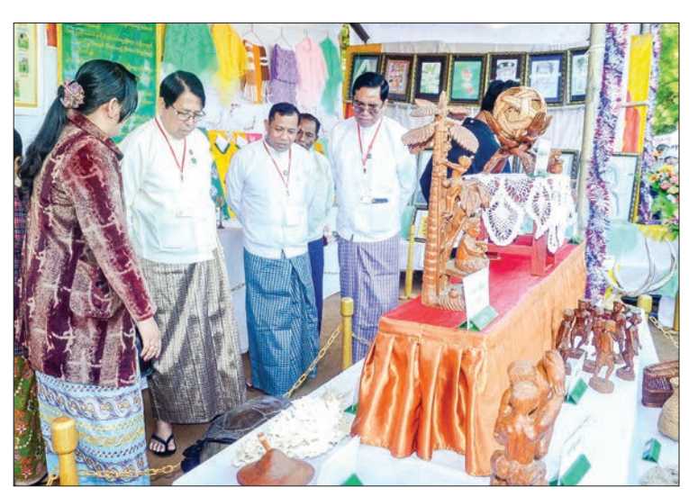
Union Minister Dr. Pe Myint visits the Myanmar traditional arts and crafts booth at the festival.