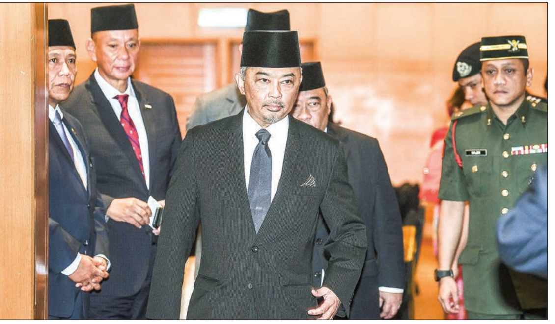
This pictures taken on 11 January, 2019 shows Tengku Abdullah Shah (c) walking after a meeting in Kuala Lumpur.

The country was thrown into shock Sunday when reigning king Sultan Muhammad V abdicated unexpectedly after just two years of rule, following reports that he married an ex-beauty queen in Russia in November during a purported two-month medical