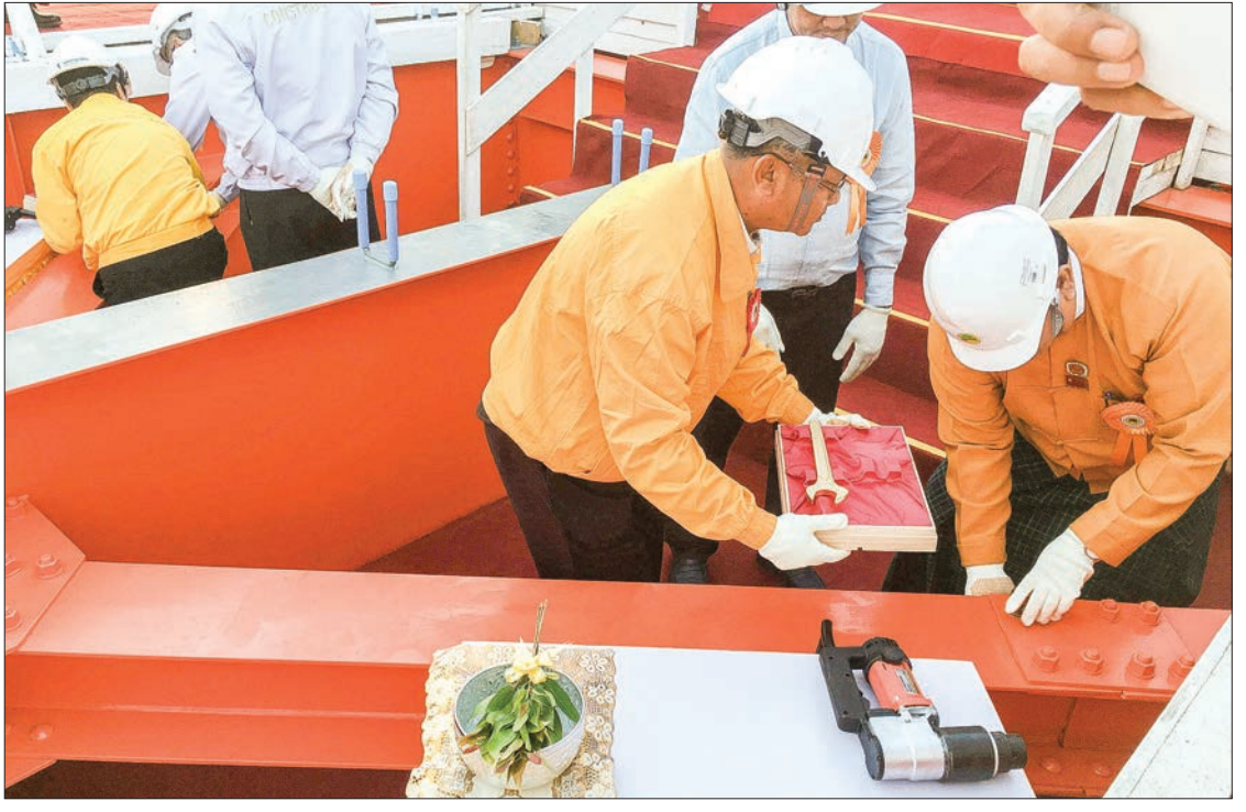
Union Minister U Han Zaw and Deputy Minister U Kyaw Lin confirm the durability of the Myaungmya Bridge based on the results of a survey yesterday.

Before the installation, Union Minister for Construction U Han Zaw and Deputy Minister for Construction U Kyaw Lin confirmed the durability of the bridge based on the finding results of survey data. Then, Union Minister U Han Zaw, Ayeyawady Region Chief Minister U Hla Moe Aung, Ayeyawady Region Hluttaw Speaker U Aung Kyaw Khaing, Myaungmya Township Pyithu Hluttaw representative Dr. Soe Moe Thu, and Region Hluttaw representative of Myaungmya Township Daw Khaing Zin Oo took their designated places to witness the first stage of the installation of the bridge's final section and sprinkled it with holy water. Afterwards, Deputy Minister U Kyaw Lin, the Ayeyawady Region Electricity, Power, Industry, and Communications Minister, U