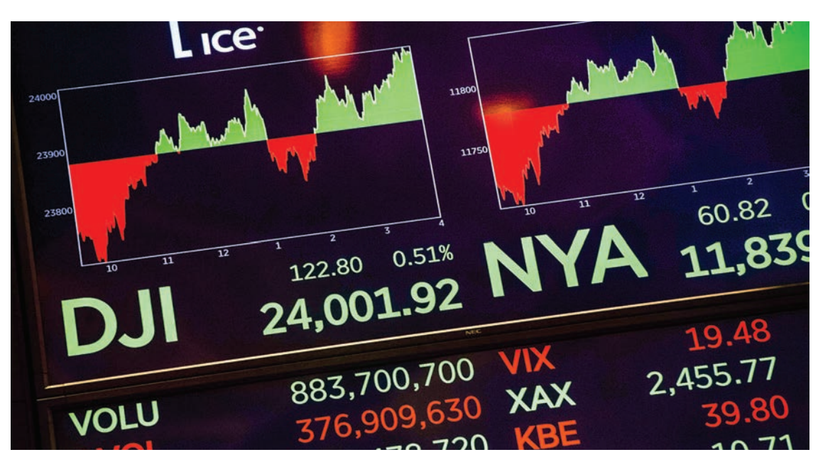
The closing numbers are displayed after the closing bell of the Dow Industrial Average at the New York Stock Exchange on 10 January, 2019 in New York.