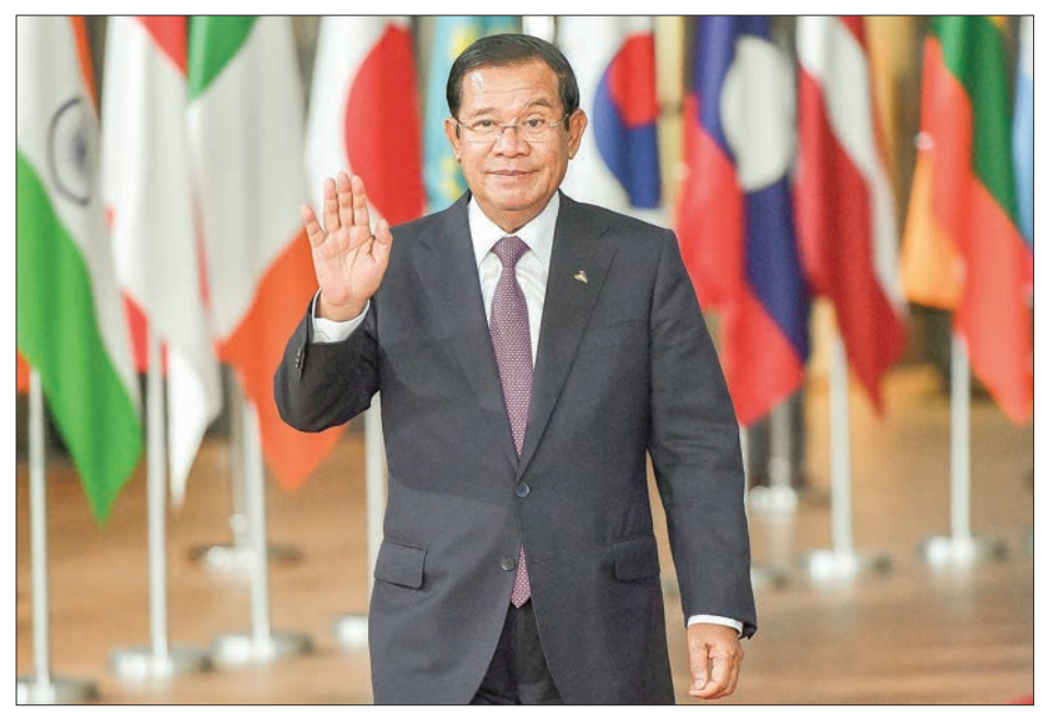
Cambodia's Prime Minister Hun Sen.

PHNOM PENH (Cambodia)—Cambodian Prime Minister Hun Sen blasted the European Union on Saturday for holding the country "hostage" with threats to axe trade preferences after it held elections with no credible opposition.