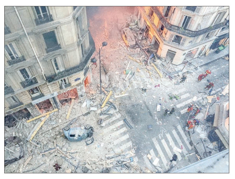
A woman's body has been found under the rubble following Saturday's massive blast in Paris, which also killed two firefighters and a Spanish tourist.

"We will only leave once everything is cleared, stone by