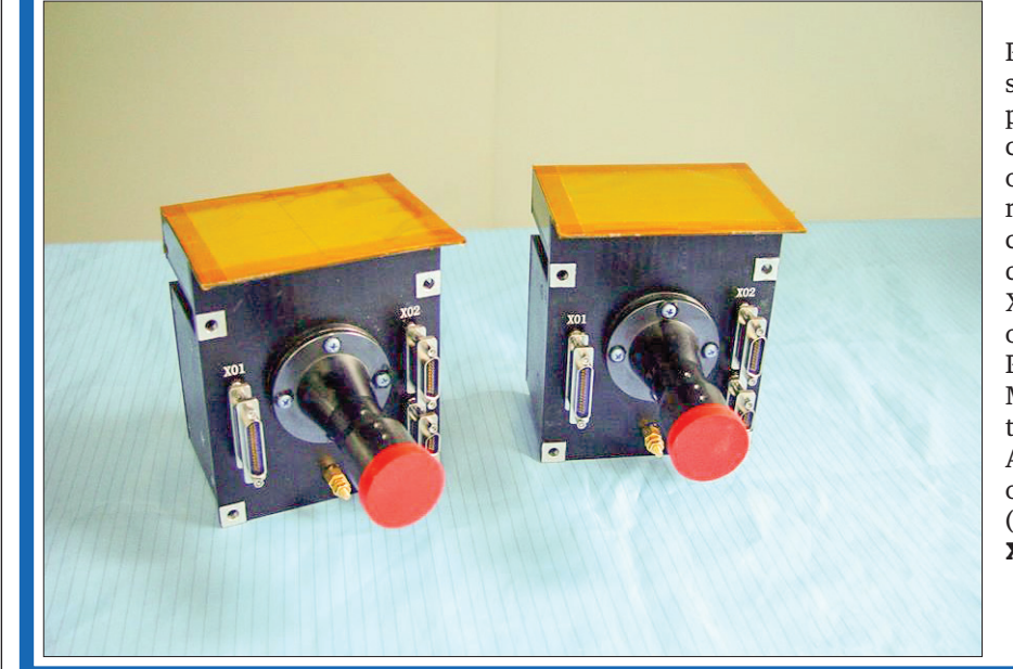
Photo shows samples of the panoramic cameras installed on the lunar rover Yutu-2. The cameras were developed by Xi'an Institute of Optics and Precision Mechanics of the Chinese Academy of Sciences (CAS).