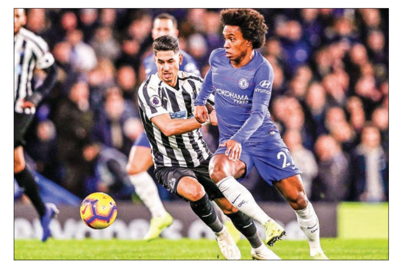
Chelsea's Brazilian midfielder Willian (r) vies with Newcastle United's Spanish striker Ayoze Perez during the English Premier League football match between Chelsea and Newcastle United at Stamford Bridge in London on 12 January, 2019.

But Sarri was unhappy with the way the Blues struggled to see off a Newcastle side stuck in the relegation zone."I am very happy with the result but the performance was not so good, especially between 1-0 and 1-1," he said.—AFP