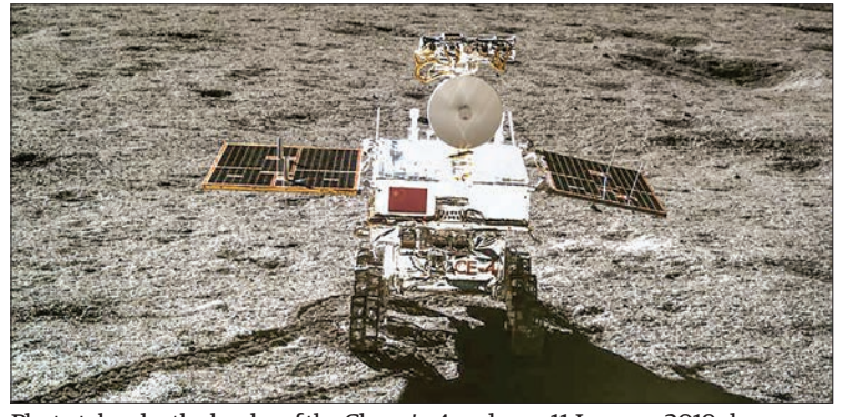
Photo taken by the lander of the Chang'e-4 probe on 11 January, 2019 shows the rover Yutu-2 (Jade Rabbit-2). China announced on Friday that the Chang'e-4 mission, which realized the first-ever soft-landing on the far side of the moon, was a complete success. With the assistance of the relay satellite Queqiao (Magpie Bridge), the rover Yutu-2 (Jade Rabbit-2) and the lander of the Chang'e-4 probe took photos of each other.