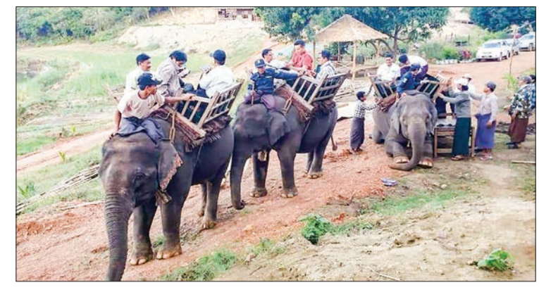
The new elephant camp not far away from the Shwesettaw Pagoda will offer an amazing experience for travellers .

related documents to the permanent secretary after which the Union Minister toured the ward.—MNA ■ (Translated by TMT)