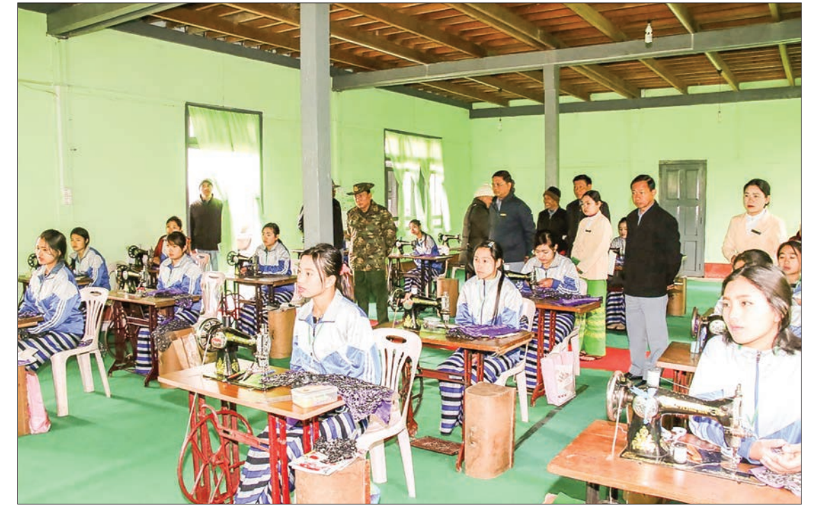
Union Minister Lt-Gen Ye Aung visits the women's vocational training school in Putao, Kachin State, on 12 January.

He then inspected the completed part of the 22-mile earth road connecting Putao and the snow-capped Phonkanrazi mountain. Yesterday morning, the Union Minister looked into the requirements for paving the Putao-Namhtonkhu gravel road and village-to-village earth roads in Putao Township. The Ministry of Border Affairs in its projects to develop infrastructure and human resources in border areas is also adopting and implementing sustainable development programs in Kachin State. — MNA (Translatey by TMT)