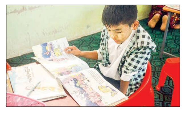
A child reading a comic book.