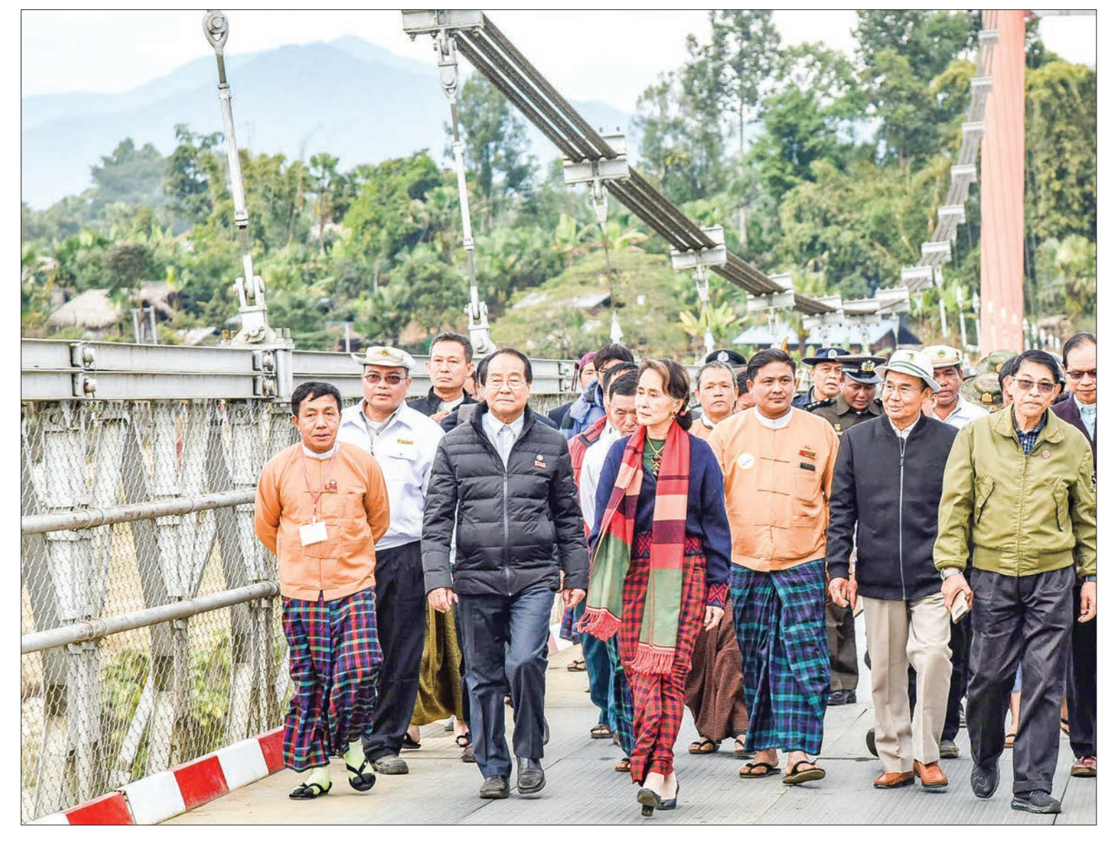
State Counsellor Daw Aung San Suu Kyi inspects Malikha Suspension Bridge (Machanbaw) in Kachin State yesterday.

The State Counsellor and party went by motorcade to Malikha Lodge Hotel and at the hotel hall, Union Minister for Border Affairs Lt-Gen Ye Aung explained about the status of constructing Maggwayza-Ngalondam-Ridam-Khaunglanphu (65 miles 4 furlong) road in fiscal year 2017-2018 and FY 2018-2019, road construction plan for FY 2019-2020 and FY 2020-2021. Chief Engineer U Khin Maung Latt explained about engineering portion of Maggayza-Khaunglanphu road. Next State Counsellor Daw Aung San Suu Kyi inspected a scale model of the construction of Maggwayza-Ngalondam-Ridam-Khaunglanphu (65 miles 4