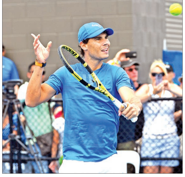
Rafael Nadal of Spain attends a media call with children from different Queensland tennis academies at the Brisbane International tennis tournament in Brisbane on 5 January, 2019.

Nadal will now head to Melbourne, where he was the champion in 2009, to get in as much practice as possible before the opening Grand Slam of the year begins on Monday.—AFP■