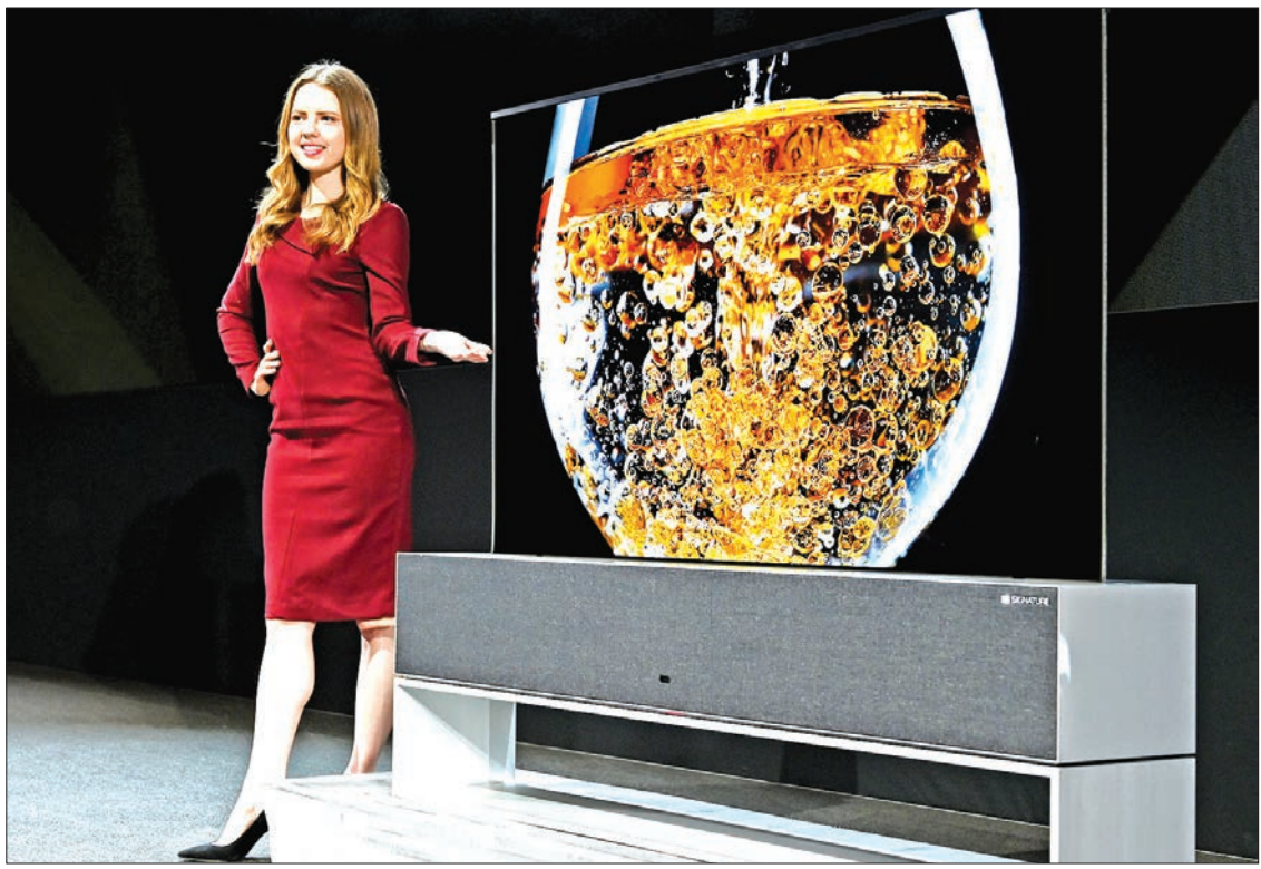
The Signature OLED TV R, a roll-up television, is presented ahead of the official start of the Consumer Electronics Show.

LG did not disclose pricing for the roll-up television. LG also unveiled its first super-high-definition 8K OLED television, joining competitors in offering premium screens that ramp up the richness of imagery. Bendable and foldable screens were expected to be among the technology trends on display at CES, which opens officially on Tuesday.— AFP