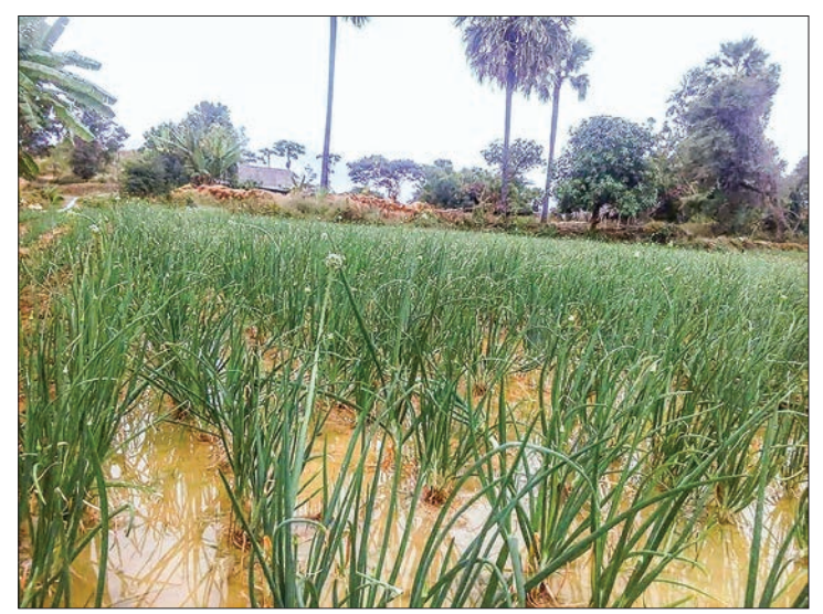
Onion fields submerged by the recent rain.