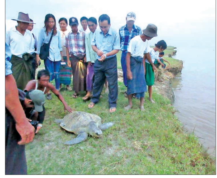
Sea turtle released back into the Sittoung River.