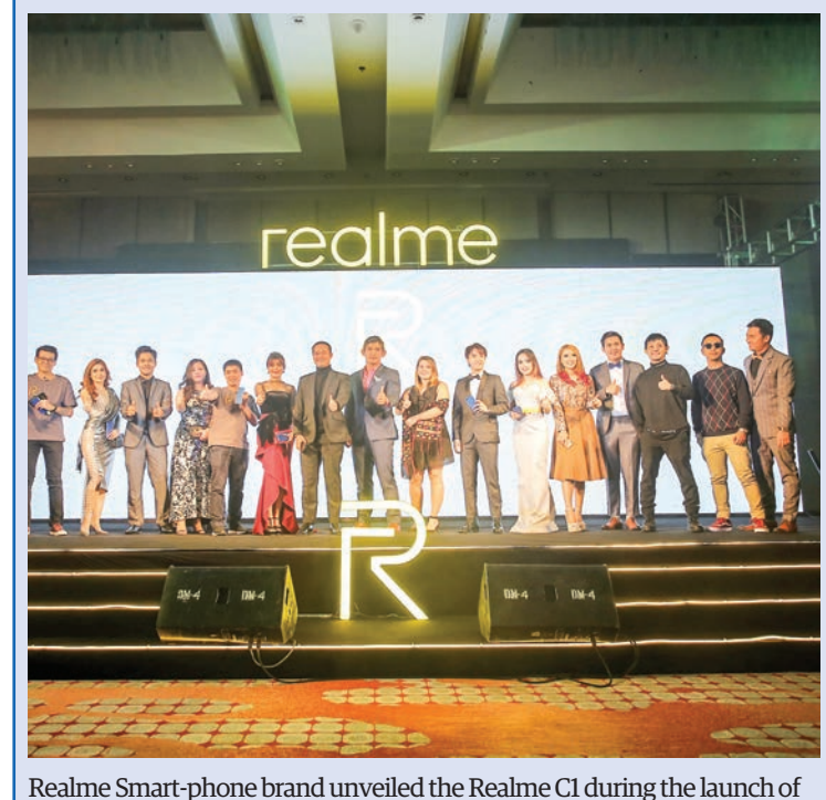
Realme Smart-phone brand unveiled the Realme C1 during the launch of the Realme 2 Pro at Melia Hotel in Yangon on 27 December. The handset will be available in two colour options, including Navy Blue and Mirror Black. The Realme C1 is priced at Ks 159,9000.

After, women donning cloth face masks coat the dried sticks with aromatic incense paste before redrying them and shipping them off for packaging.