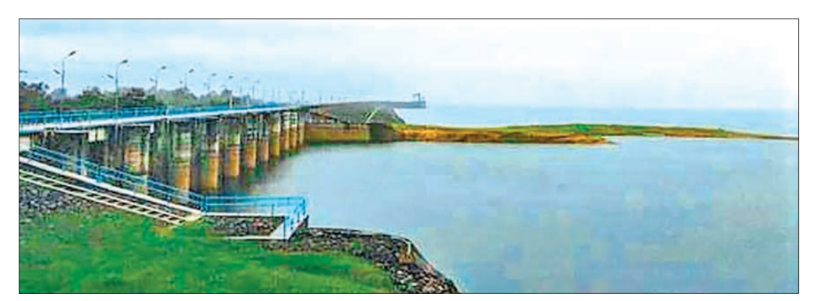
The photo of the Thaphanseik Dam. Cultivation of paddy, wheat, pulses & beans and sesame can be undertaken successfully with irrigated water.