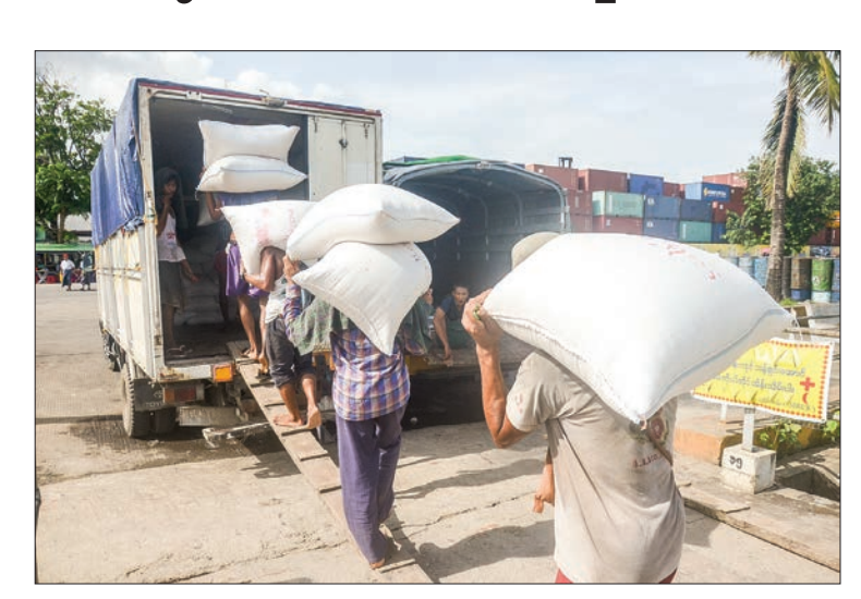
Workers carrying rice bags at the Botahtaung Jetty in Yangon.

"We expect export volume of 1.8 million tons at the most until 31 March. Low prices and tight confiscation at the border are hurting traders. Earlier, around 60,000 tons of rice flowed into China through the Muse check-