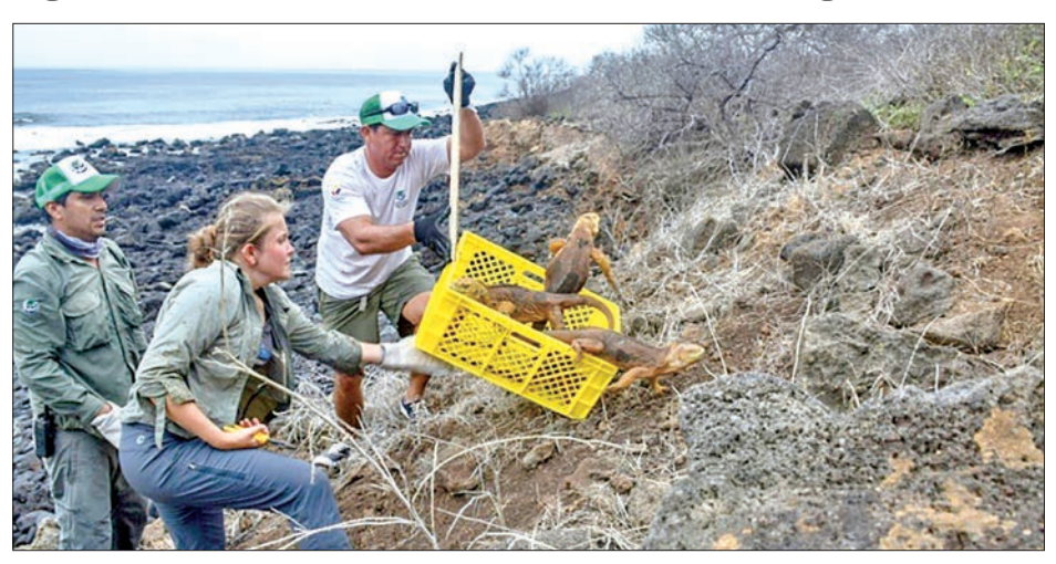
A group of 1,436 iguanas of the subspecies Conolophus subcristatus, from Seymour Norte island, are introduced to Santiago island as part of a conservation program in the Galapagos Islands, on 7 January, 2019.

QUITO (Ecuador) — A group of more than 1,400 iguanas have been reintroduced to an Ecuadoran island in the Galapagos archipelago around two centuries after they disappeared from there, authorities said on Monday.