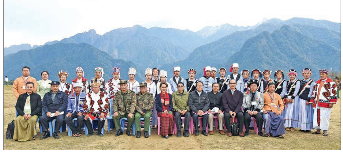
State Counsellor Daw Aung San Suu Kyi poses for the documentary photo together with local people in Khaunglanphu.