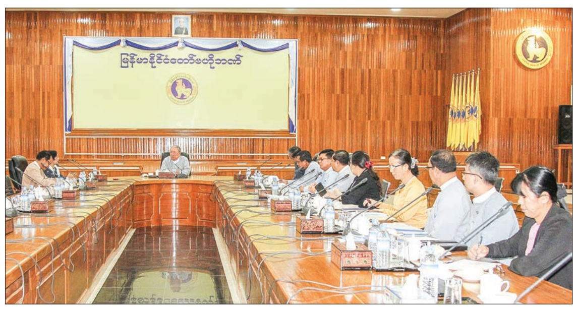
Central Bank of Myanmar Governor U Kyaw Kyaw Maung holds talks with MPs from Pyithu Hluttaw Banking and Financial Development Committee in Nay Pyi Taw.