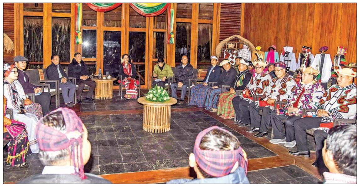
State Counsellor Daw Aung San Suu Kyi meets townselders and local people at Malikha Lodge Hotel in Putao, Kachin State, yesterday.

Following the speech of the State Counsellor, Union Minister for Border Affairs Lt-Gen Ye Aung, Chairman of the Work Committee to Implement the Development of Border Areas and Ethnic Nationals Chairman explained about the construction of Maggwayza-Mt. Sanlutchat (33 miles 6 furlong) road section and road section to be constructed in the future.