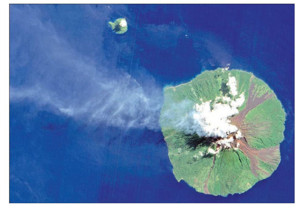
Handout photo released by the NASA shows a view captured on 28 June, 2009 by Advanced Land Imager (ALI) onboard NASA's Earth Observing-1 (EO-1) satellite of bright white clouds hovering over the Manam Volcano, just off the coast of mainland Papua New Guinea.

Some islanders who were evacuated from Manam 15 years ago and resettled elsewhere on Papua New Guinea recently complained they were still struggling with their new lives, The National newspaper reported.—AFP