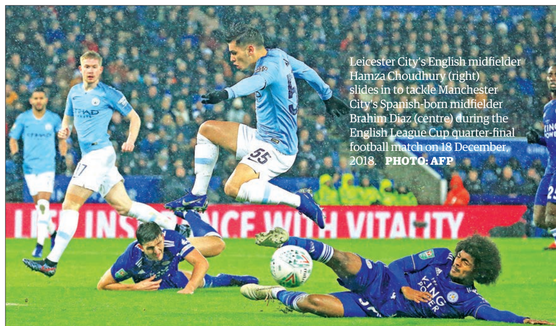
Leicester City’s English midfielder Hamza Choudhury (right) slides in to tackle Manchester City’s Spanish-born midfielder Brahim Diaz (centre) during the English League Cup quarter-final football match on 18 December, 2018.

Real sit fifth in La Liga after they were beaten 2-0 by Real Sociedad on Sunday.—AFP ■