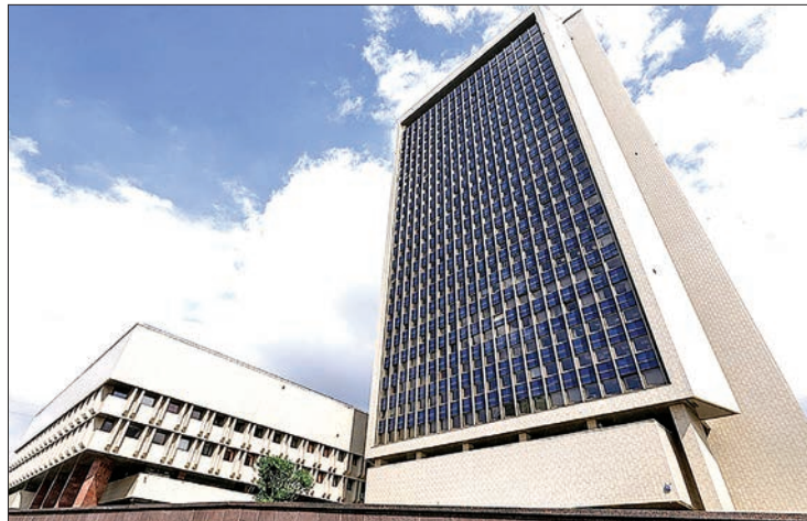
Roscosmos.

He also declared that the Trump Administration had made