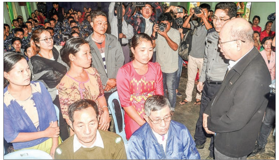
Deputy Minister U Khin Maung Tin consoles families of police personnel who were killed in action during the attacks on police outposts by AA terrorist insurgents.

Later in the afternoon, the Deputy Minister went to the office of No. 3 Border Guard Police Force to