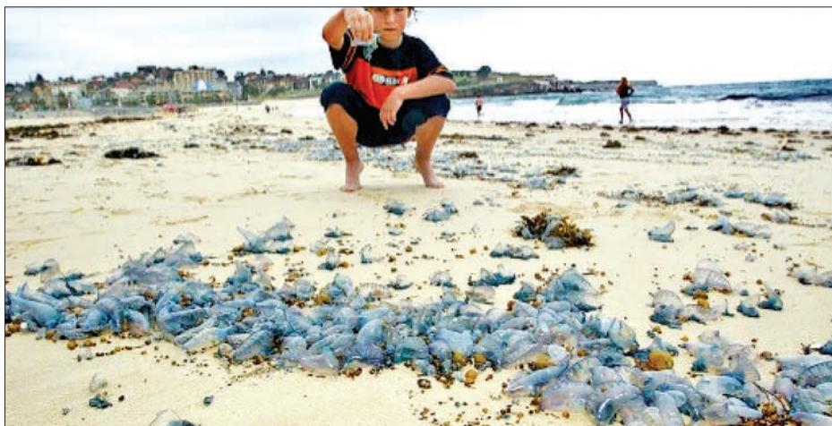
Bluebottle stings are a frequent occurrence in Australia.

"A wall of bluebottles is approaching #Rainbow beach. Lifesavers are clos-