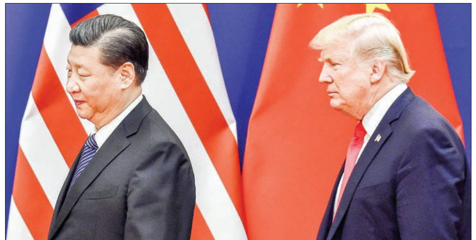
File photo taken in November 2017 shows US President Donald Trump (r) and Chinese President Xi Jinping at the Great Hall of the People in Beijing.

With trade tensions between the two powers escalating, stock prices have faced downward pressure across the globe and fears have grown that weakness in the Chinese and US economies could