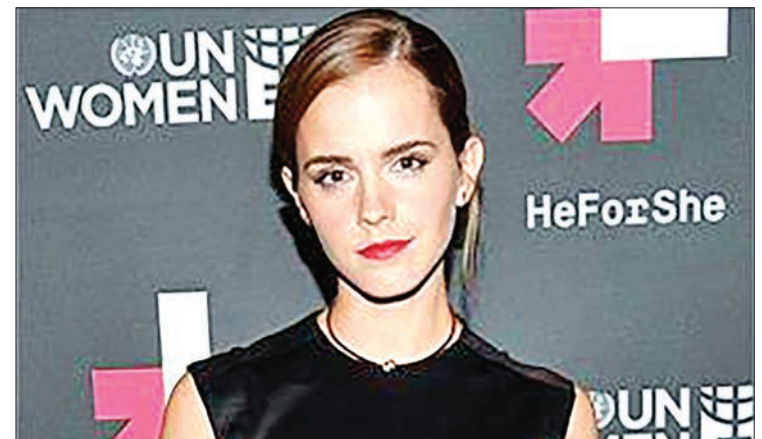
Emma Watson.

"I hope that more people will be inspired by the #TIMESUP anniversary to give at home here in the UK, so the Justice and Equality Fund can reach even more under-resourced organisations and campaign groups in 2019," the actor wrote.—PTI ■