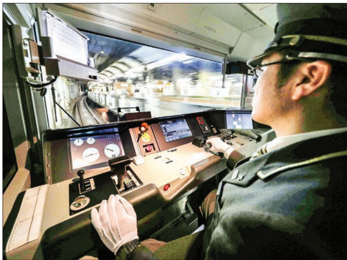
An East Japan Railway Co. driver is pictured during a test run conducted on Tokyo's Yamanote loop line in the early hours of 7 January 2019 to check its self-driving system.

The train started moving after the driver simply pushed