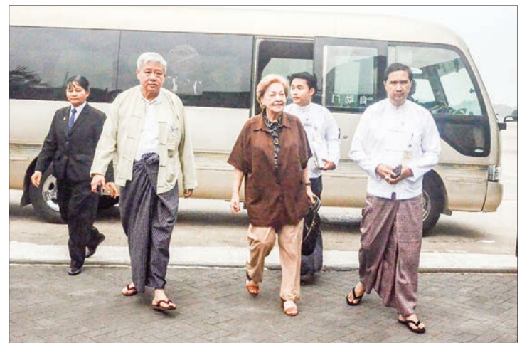
Independent Enquiry Commission chair arrives in Yangon.