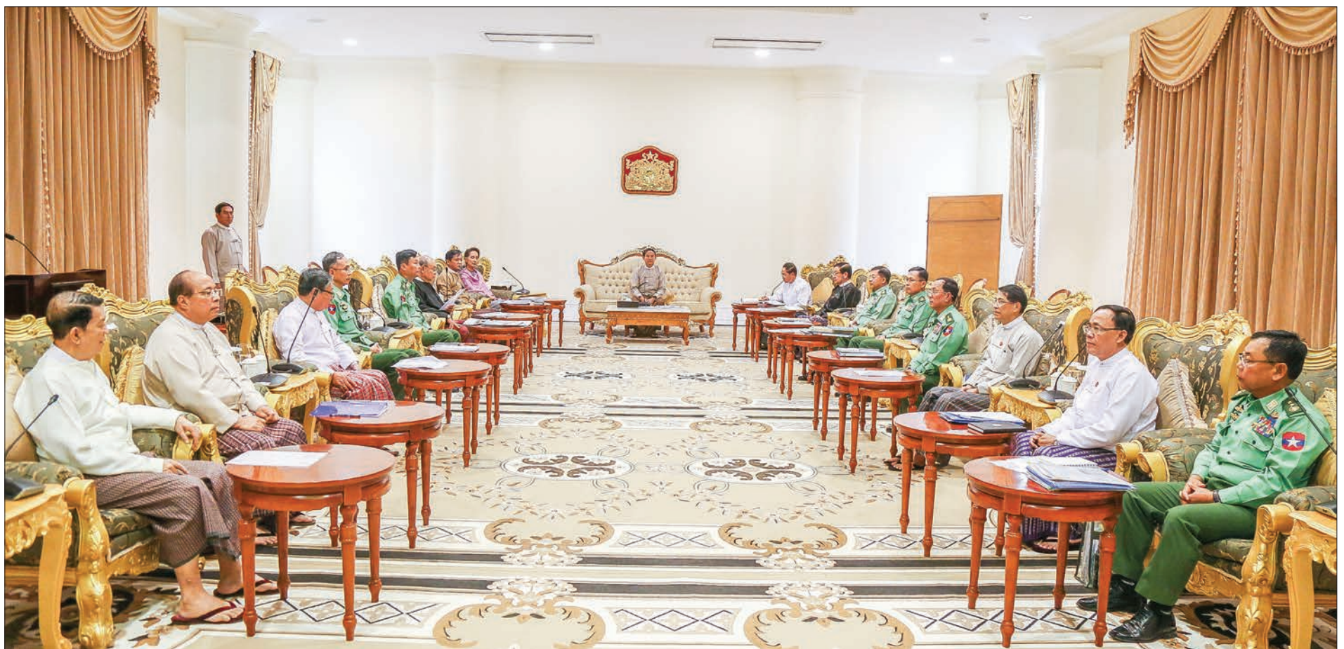
President U Win Myint, State Counsellor Daw Aung San Suu Kyi and Vice Presidents, Speakers of Hluttaws, Commander-in-Chief of Defence Services and Union ministers attend the coordination meeting on international relations, national security and Rakhine State and border security issues at the Presidential Palace in Nay Pyi Taw yesterday.

Tatmadaw's ceasefire, Rakhine State & border security issues discussed