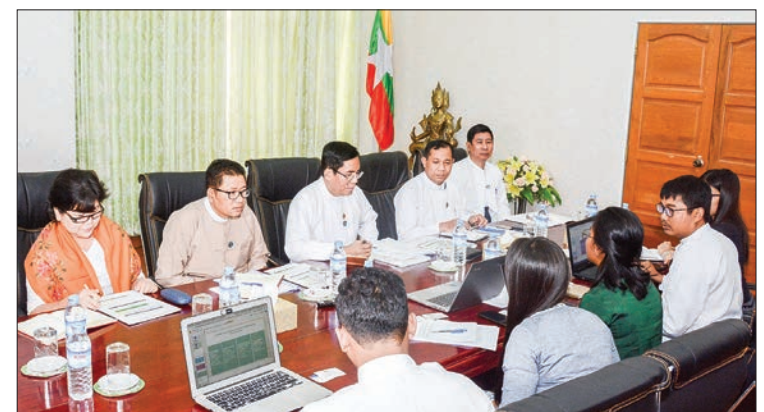
Deputy Minister U Aung Hla Tun holds talks with members of the civil society organizations yesterday.