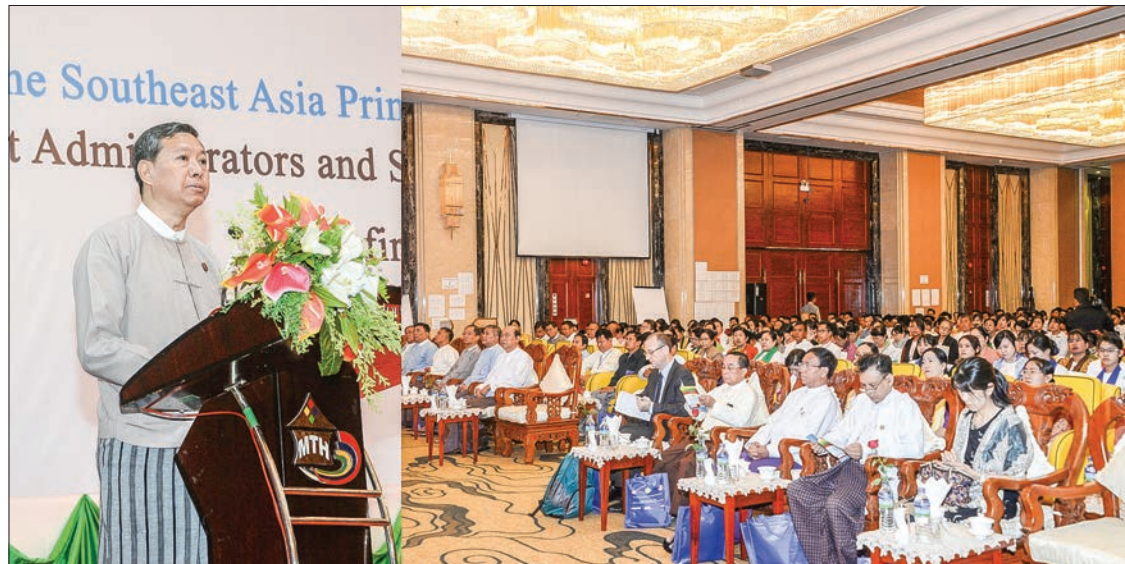
Union Minister Dr. Myo Thein Gyi addresses the opening ceremony of South-East Asia Primary Learning Metrics for Test Administrators and School Coordinators Training Workshop in Nay Pyi Taw.

AN opening ceremony of South-East Asia Primary Learning Metrics (SEA-PLM) training workshop for Test Administrators and School Coordinators was held at Grand Ballroom of Mingala Thiri Hotel, Nay Pyi Taw yesterday morning.