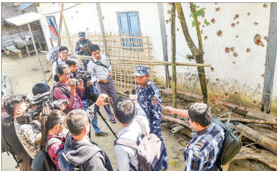
News media personnel interview the police officer at Khahtihla police outpost, one of the police outposts attacked by AA terrorist insurgents.