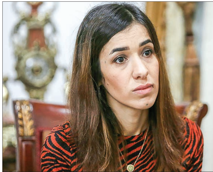
Iraqi Nobel laureate Nadia Murad (pictured December 2018) was the victim of human trafficking for sexual exploitation, but trafficking is also used to “finance activities” or increase workforces.

role of groups involved in various armed conflicts in using human trafficking “to finance activities or increase their workforce”, as well as for sexual slavery.