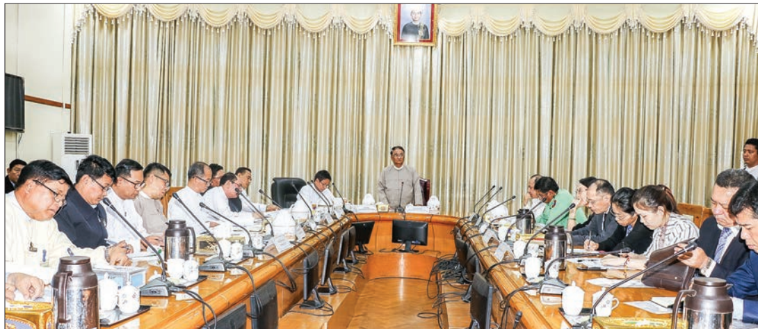
Union Minister Dr. Than Myint delivers the speech at the coordination meeting with officials from the People's Republic of China yesterday.

DR. THAN MYINT, the Union Minister for Commerce, attended a coordination meeting with officials from the People's Republic of China at his ministry yesterday, where they discussed opening the Kyin San Kyawt border gate in order to facilitate smoother trade between Myanmar and China.