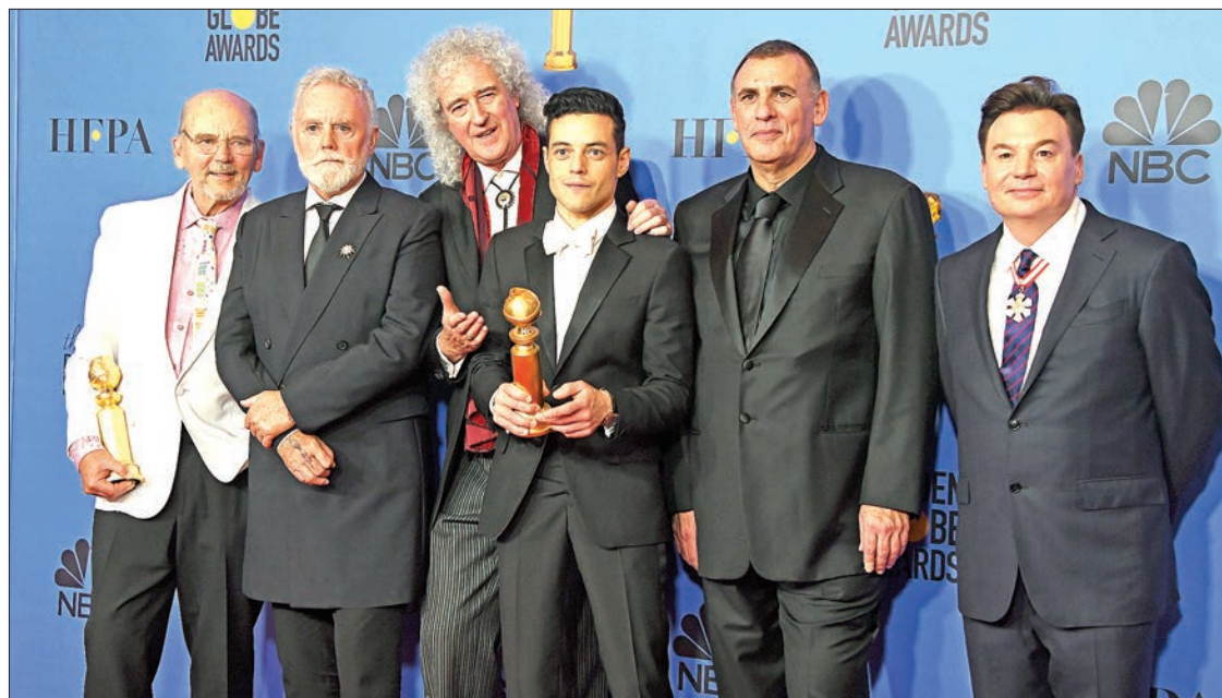
Best Actor in a Motion Picture – Drama for "Bohemian Rhapsody" winner Rami Malek poses with Graham King (2 nd), Brian May (3 rd) and Mike Myers (r) in the press room during the 76 th annual Golden Globe Awards on 6 January, 2019, at the Beverly Hilton hotel in Beverly Hills, California.

"Thank you to Freddie Mercury for giving me the joy of a lifetime. I love you, you beautiful man. This is for and because of you, gorgeous." The two trophies were the final prizes in a ceremony that had been expected to be a consecration for "A Star is Born" — starring Lady Gaga and Bradley Cooper in the