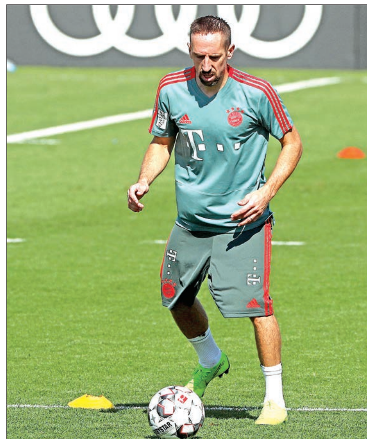
FC Bayern Munich’s French midfielder Franck Ribery takes part with other teammates in a training session during their winter training camp at the Aspire Academy for Sports Excellence in the Qatari capital Doha on 5 January, 2019.

Bayern and Rummenigge have also been on the defensive recently after criticism from some of the club’s own fans over the decision to return to Qatar for winter training.—AFP ■