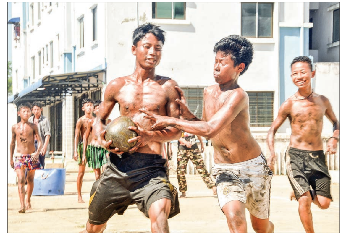
Children compete in sprinting contest, top-left, a child partaking in needle threading, bottom-left, young men scramble for possession of a coconut, right, as part of games and activities held to commemorate the 71st anniversary of Independence Day in Yangon.

THE streets of Yangon City were full of people holding celebrations, games and sporting events in commemoration of the 71st Independence Day yesterday.