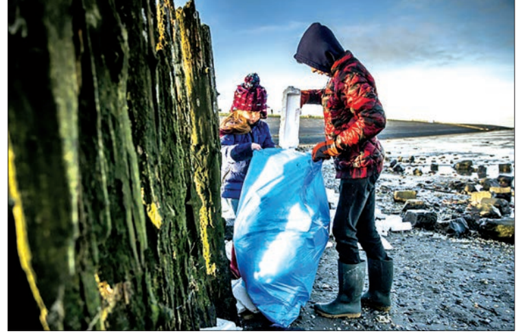
Dutch volunteers have been helping to collect the washed-up content from containers onboard the MSC Zoe .

On the tiny island of Ameland "130,000 kg of debris has already