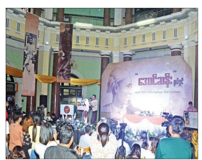
Launching ceremony of Bogyoke Aung San biopic's social media platforms.