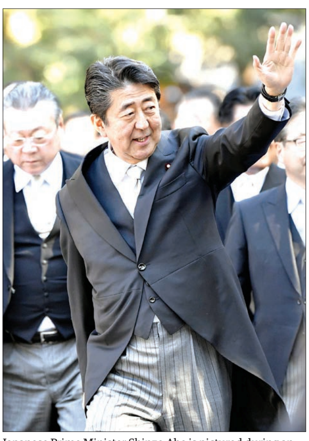
Japanese Prime Minister Shinzo Abe is pictured during an annual visit to Ise Grand Shrine in Mie Prefecture.

A "gengo," or era name, is used for the length of an emperor's reign. The current Heisei era, which means "achieving peace" commenced on 8 January, 1989, the day after Emperor Hirohito, posthumously known as Emperor Showa, died.