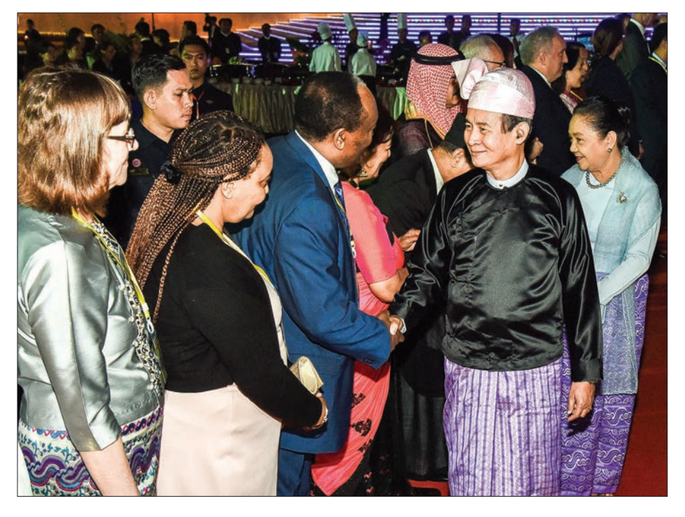
President U Win Myint and First Lady Daw Cho Cho greet diplomats at the dinner commemorating 71st Anniversary Independence Day in Nay Pyi Taw.