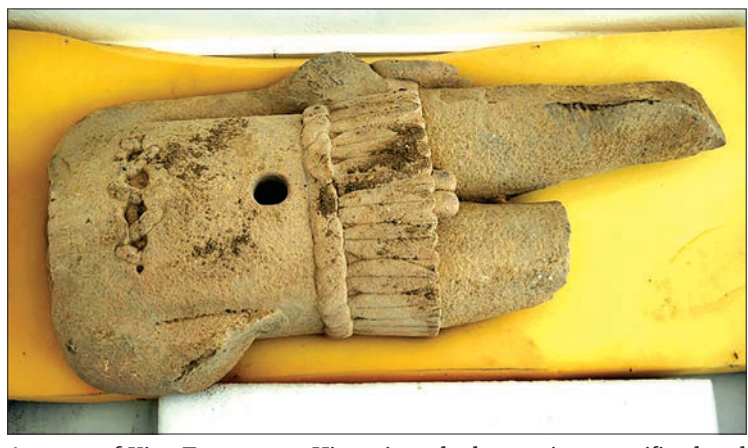
A statue of Xipe Totec, a pre-Hispanic god whose priests sacrificed and then skinned humans, and then wore their flayed skins on their own backs as part of a fertilty ritual in what is now Mexico.

The artefacts uncovered at the site include three stone sculptures of Xipe Totec: two skinned heads and a torso, whose back is covered in engravings repre-