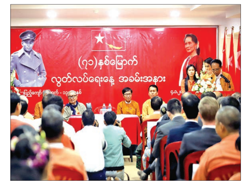
The National League for Democracy commemorates 71st Independence Day at party headquarters in Bahan Township, Yangon.

71st Anniversary Independence Day ceremony was held at National League for Democracy (Headquarters) in Bahan Township, Yangon at 10 am yesterday. At the ceremony, the State Flag, Bogyoke Aung San and the martyrs were saluted and then an 8 seconds silence observed in memory of the monks, people and students who lost their lives in the democracy revolution.