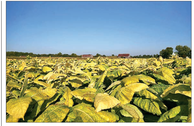
In results published in Science, researchers confirmed they had been successful making tobacco plants 40 per cent bigger thanks to a "genetic hack" or "shortcut".

"In males survival was all about regulating cell division, which suggests that drugs that block cell-cycle progression may be more effective in men. For females, survival was all about regulating invasiveness, which suggests that drugs targeting integrin signaling may be more effective in women," Rubin said. "This tells us it might be better to separate males and females and examine their sex-specific genetic signatures."—Xinhua■