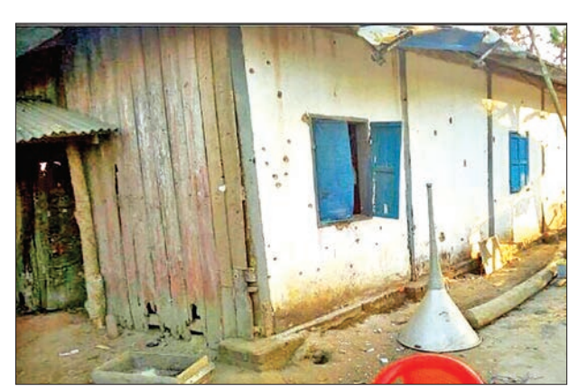
Bullet holes and damages left by coordinated attacks by AA insurgents on four police outposts in Buthidaung Township, Rakhine State on 4 January 2019.

As a result of massive coordinated attacks launched by the AA insurgent group on four border police outposts in Buthidaung township of Rakhine State yesterday morning, 9 police personnel were injured and 13 lost their lives, it is learnt.