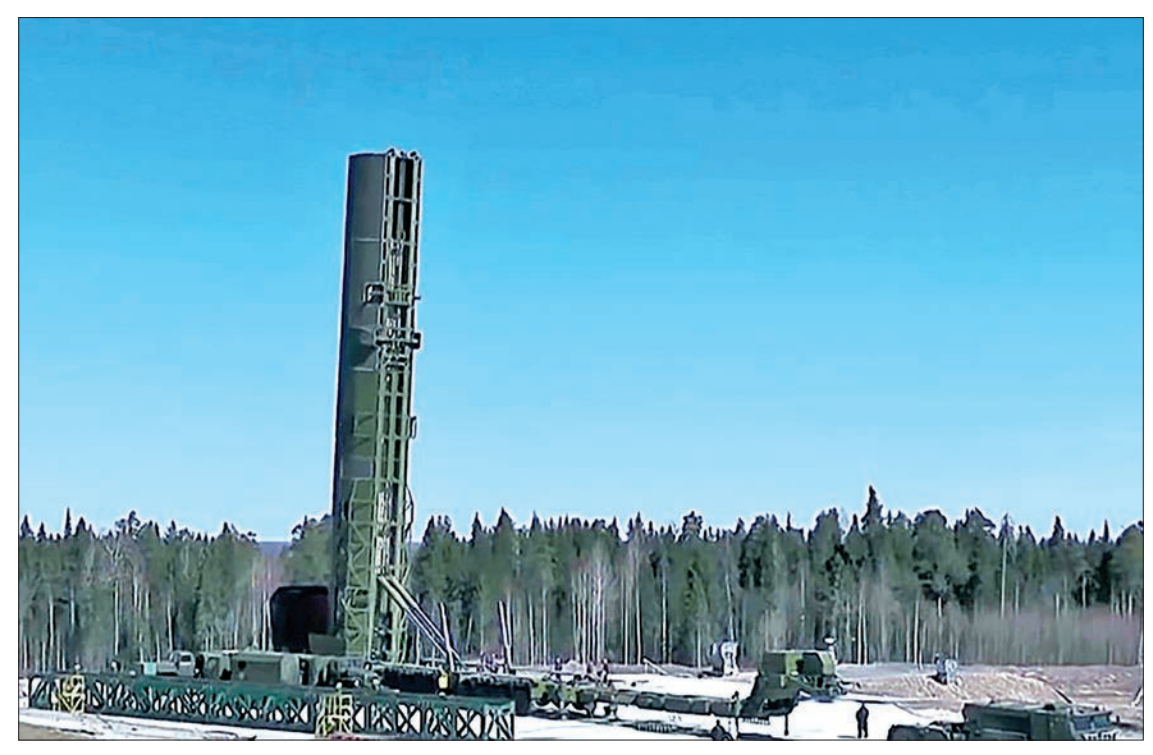
The RS-28 Sarmat is the Russian advanced silo-based system with the heavy liquid-propellant intercontinental ballistic missile.

sile Force Commander Sergei Karakayev told journalists on 18 December, the flight tests of the Sarmat heavy liquid-propellant intercontinental ballistic missile will first be conducted from the Plesetsk Cosmodrome and then from the base of the Uzhur missile division. As the commander noted, "work is currently underway to create the [missile's] experimental prototypes and prepare