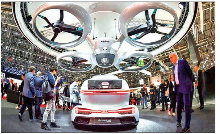
A number of designs for flying cars have been unveiled including the "Pop. up next"by Audi, italdesign and Airbus seen at the Geneva International Motor Show on 6 March, 2018.

"We are spending our time on the technology side and will partner with companies on assembly." The NFT vehicle with a projected price tag of $50,000 will function as a car, but be able to take off or land vertically and fly on auto-pilot.