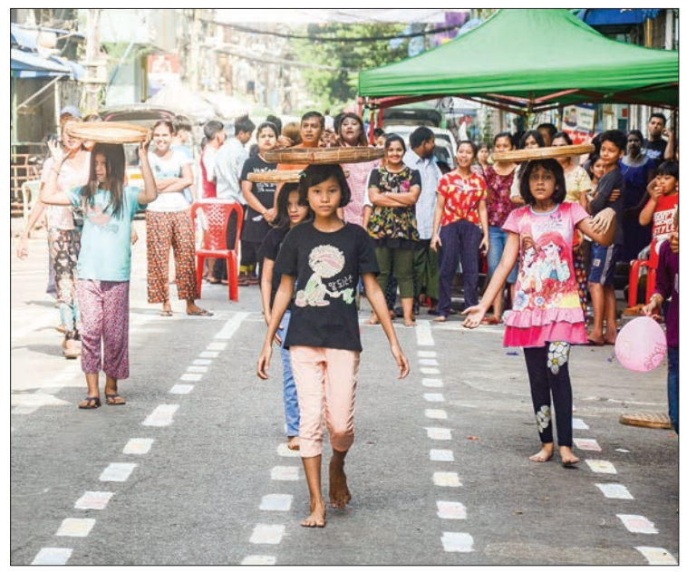
Children hold balloons in a race, (Left), young girls balance sieves on their heads as they race across the street, (Right) during 71st Independence Day celebrations in Yangon.