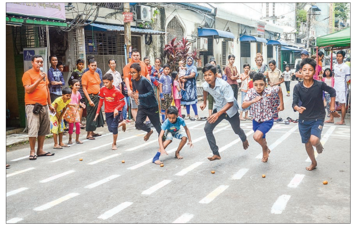
Young girls participate in gunny sack racing, (Left), young boys dashing in a potato picking race, (Right), in Yangon on 71st Independence Day celebrations.