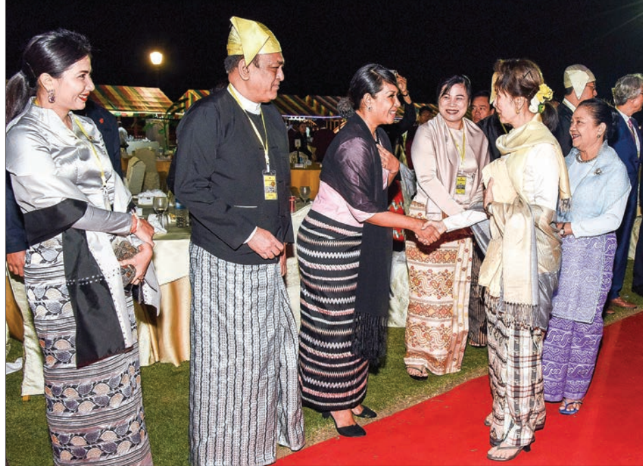
State Counsellor Daw Aung San Suu Kyi greets attendees at the dinner commemorating 71^{\rm st} Anniversary Independence Day in Nay Pyi Taw.

RESIDENT U Win Myint and First Lady Daw Cho Cho hosted a dinner in commemoration of the 71<sup>st</sup> Anniversary of Independence Day on the front lawn of the Presidential Palace in Nay Pyi Taw yesterday evening. The President and First Lady arrived at the dinner at 7:00 p.m. and cordially greeted the guests individually.