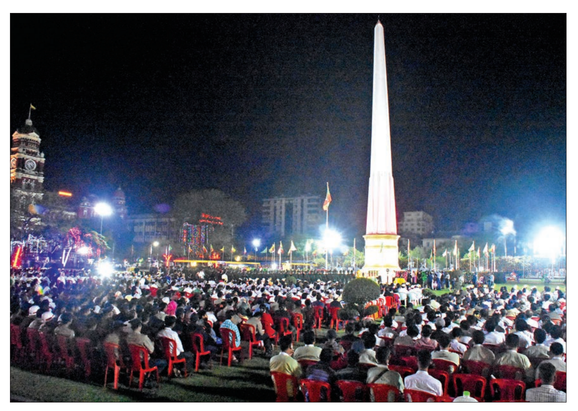
Yangon Region Chief Minister U Phyo Min Thein addresses the audience gathered in Maha Bandoola Park on 71st Independence Day.

Also present at the ceremony were Speaker of Yangon Region Hluttaw U Tin Maung