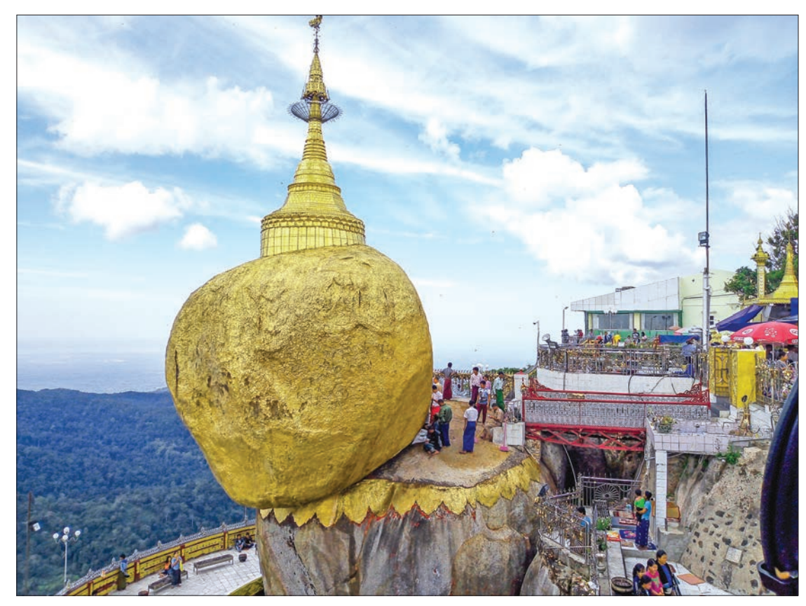
Kyaiktiyo Pagoda will be having its gold leaves renewed this year.

Scaffolding work will start on 17 January and is targeted to be completed on 28 January. Pasting of gold leaves on the stone will start on 29 January and the scaffolding will be removed in mid-March, once the pasting of leaves is complete. The board of trustees renews gold leaves on the stone every three years. Kyaiktiyo Pagoda is a well-known Buddhist pilgrimage site in Kyaikto Town of Mon State.