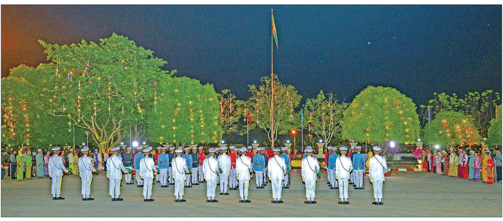
Attendees and Guard of Honour salute the State Flag of Myanmar at the ceremony to celebrate the 71st Anniversary Independence Day in Nay Pyi Taw.

2 NATIONAL 5 JANUARY 2019 THE GLOBAL NEW LIGHT OF MYANMAR