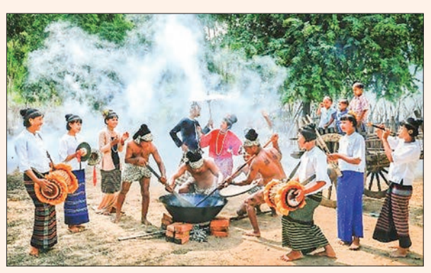
Myanmar traditional Htamane festival in Tabodwe month.

(Excerpt from the speech given by General Aung San on the middle terrace of the Shwedagon Pagoda on 20<sup>th</sup> August, 1946)