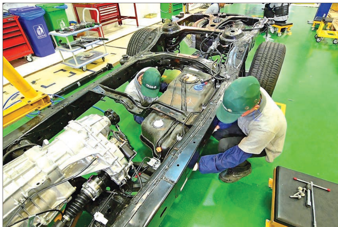
A worker assembles a Ford in a factory in East Dagon Myothit, Yangon.