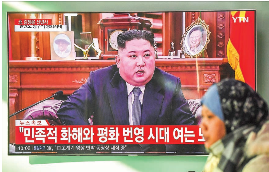
Kim Jong Un said North Korea wants good relations with the US but could consider a change of approach if Washington maintains its sanctions.