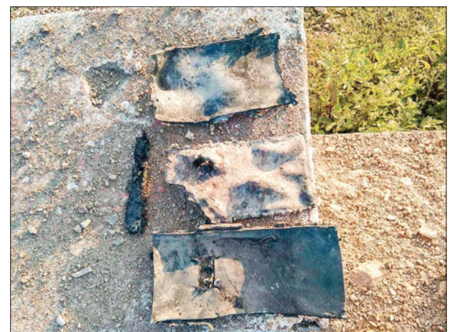
Three remote mines attack occurred near Mrauk-U on Yangon-Minbu-An-Sittway road yesterday, targeting of the Rakhine State Chief Minister's convoy.