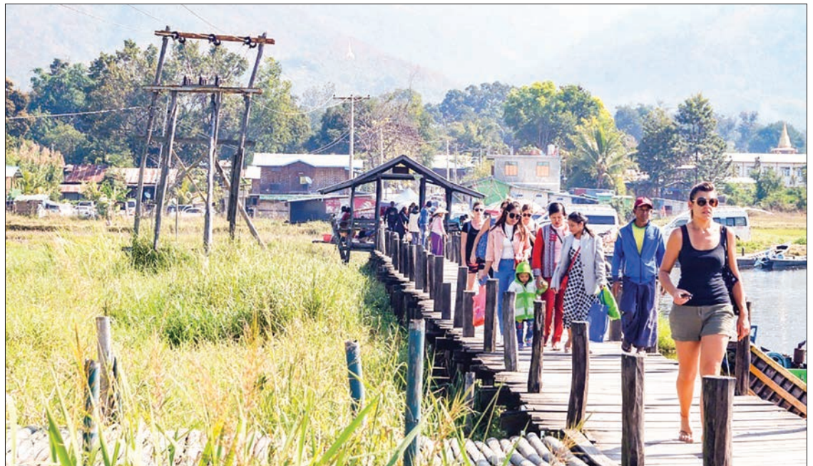
Inle Lake attracts numbers of visitors during New Year holidays.

Tourist attractions at Inle Lake include the Phaung Daw Oo Pagoda, the Alodaw Pauk