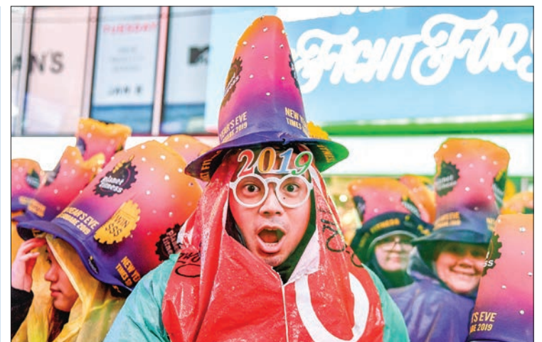
A reveler smiles under the rain as people gather for the New Year's Eve celebration in Times Square in New York.