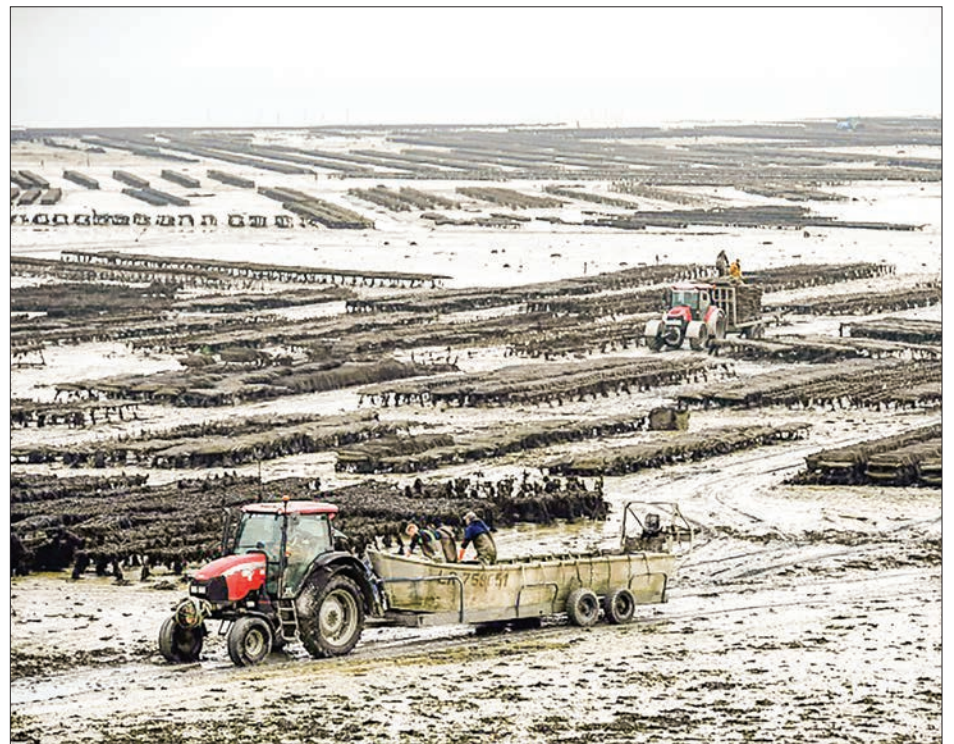
Cold weather normally encourages a needed rest for oysters to mature, experts say, but this winter has so far been unusually warm and, paradoxically, too rainy.

Adding to the challenges, rising ocean acidity requires oysters