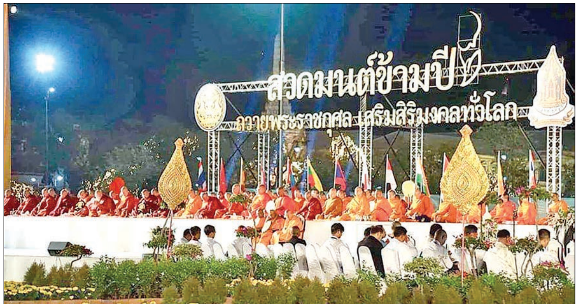
New Year's Eve Prayer ceremony held by Sanghas and buddhists in Bangkok, Thailand on 31 December 2018.

The New Year's Eve Chanting & Meditation for Happiness in 2019 was held in Sanam Luang Pavilion, Thailand by Sanghas and Buddhists from 12 countries.—MNA ■ (Translated by Zaw Min)