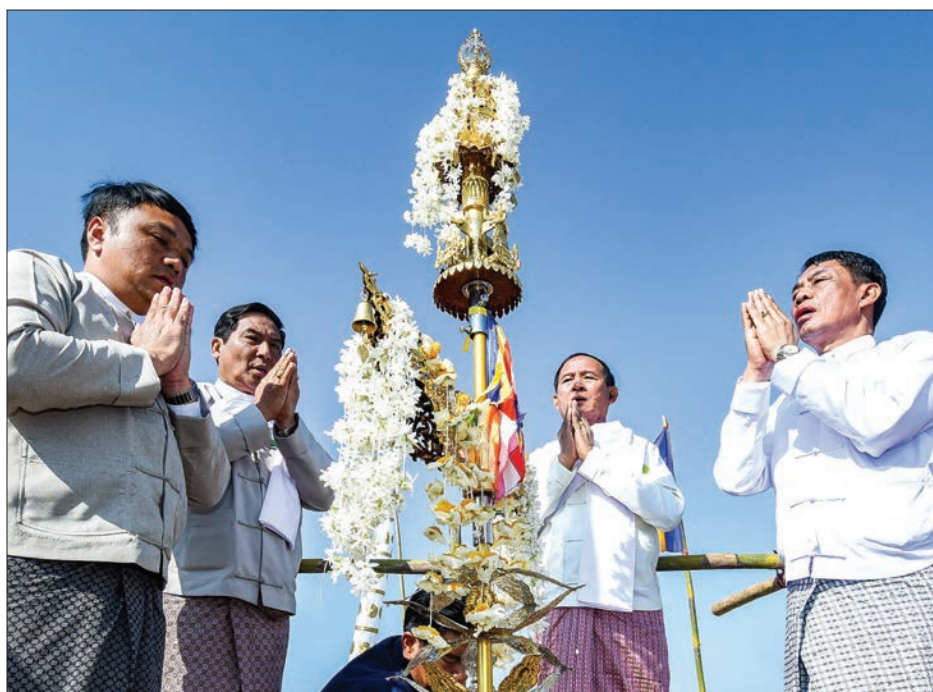
President U Win Myint and officials recite religious verses after the fixed the Diamond Bud atop Taungnya 'Wa' Zedi yesterday.