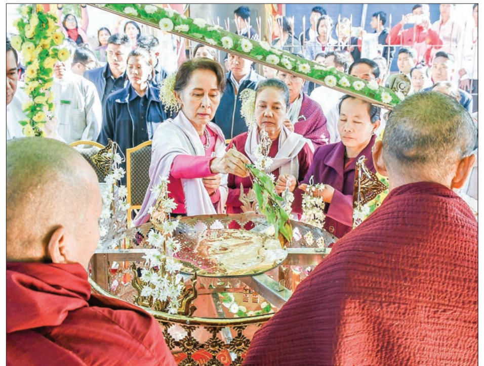
State Counsellor Daw Aung San Suu Kyi sprinkles scented water on the religious objects to be hoisted atop Taungnya 'Wa' Zedi at the consecration ceremony pagoda.