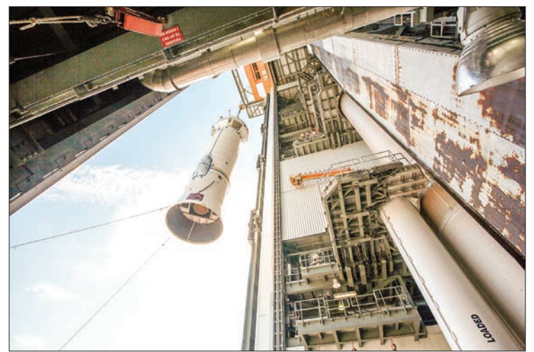
NASA spacecraft OSIRIS-REx is the first-ever US mission designed to visit an asteroid and return a sample of its dust back to Earth.

The study has been published in the journal Nature Chemical Biology .—Xinhua ■