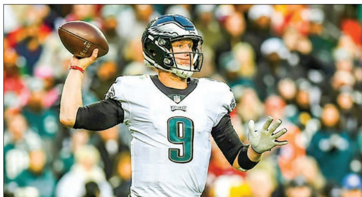
Nick Foles, who was left with sore ribs after the Philadelphia Eagles’ win over the Washington Redskins in their NFL regular-season finale, will start the team’s playoff opener against the Chicago Bears.

gles’ top quarterback, and isn’t expected to be with them next season, he has plenty of big-game experience.