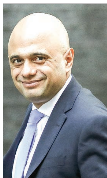
British interior minister Sajid Javid said two Border Force ships deployed in the Channel would balance protecting human life with protecting Britain's borders.

“I want to make sure that we are doing all we can to protect people. “This is one of the most treacherous stretches of water that there is, 21 miles with people taking grave risk, really putting their lives into their own hands.”— AFP ■