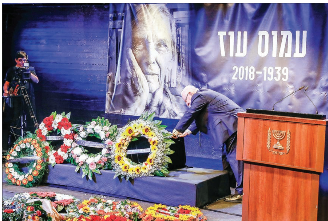
Mourners pay tribute to Israeli writer Amos Oz during a memorial service in Tel Aviv on 31 December 2018.

Netanyahu, currently visiting Brazil, paid brief tribute to Oz on Friday, calling him "one of our literary giants". "We will always remember his contribution to Hebrew literature and the Hebrew language," he said. —AFP ■