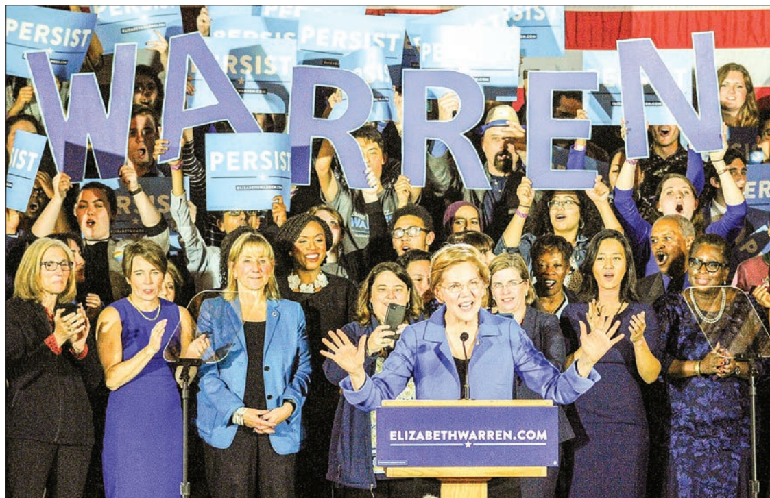
US Senator Elizabeth Warren is a fierce critic of President Donald Trump, and is now likely running to unseat him in 2020.

“Politicians look the other way while big insurance companies deny patients life-saving coverage, while big banks rip off consumers and while big oil companies destroy this planet.” That, she said, is why she is launching