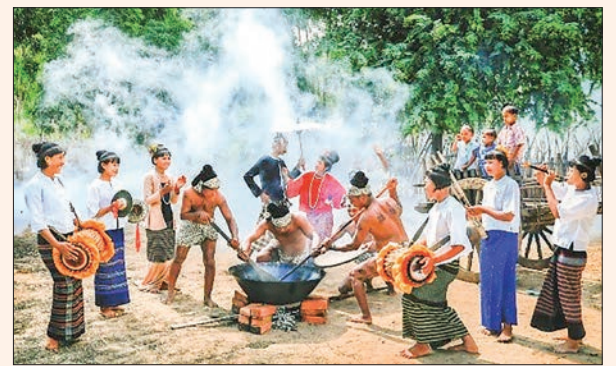
Myanmar traditional Htamane festival in Tabodwe month.

(Excerpt from the speech given by General Aung San on the middle terrace of the Shwedagon Pagoda on 20 th August, 1946)