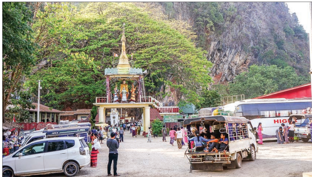
People visit Bayin Nyi Naung Cave during New Year holidays in Hpa-an, Kayin State.