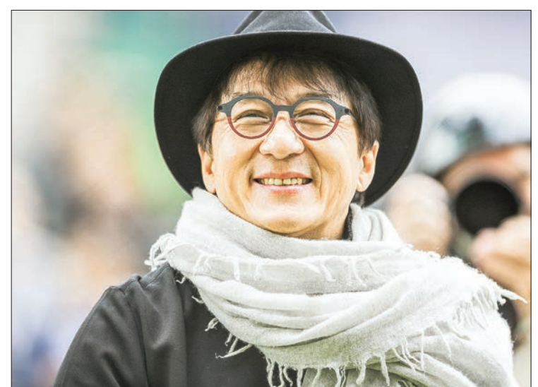
Hong Kong actor Jackie Chan looks on during the start of the FIA world Endurance Championship race in Shanghai on 5 November 2017.

He was referring to a programme last week in which IRIB added a caption to say a couple holding hands on screen were married in real life. ■