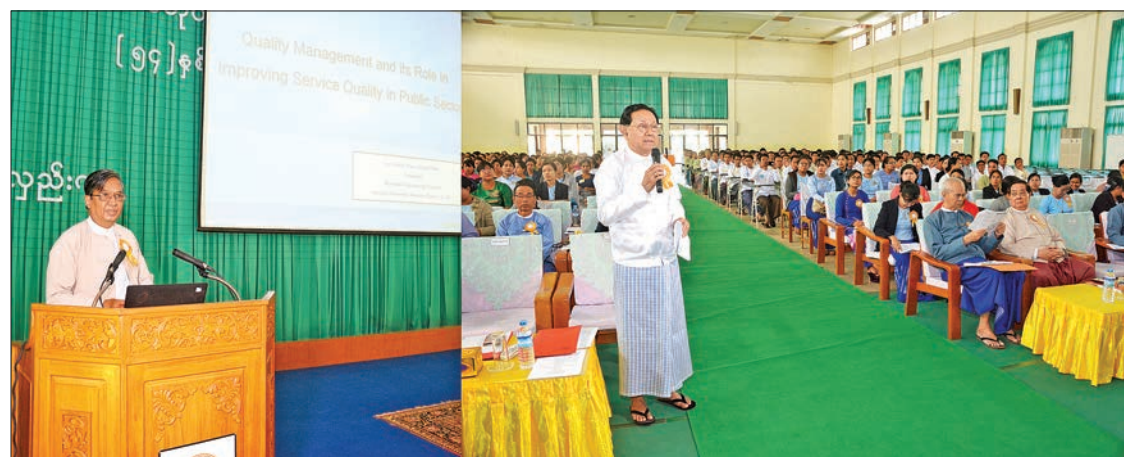
54 th anniversary of Central Institute of Civil Service (CICS) and paper reading session held in Yangon.