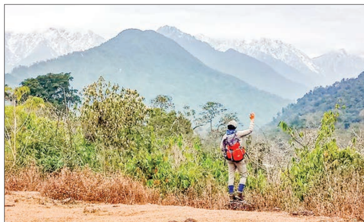
Mountaineering team from Meiktila is planning to climb the Mount Phonekanrazi in Putao.