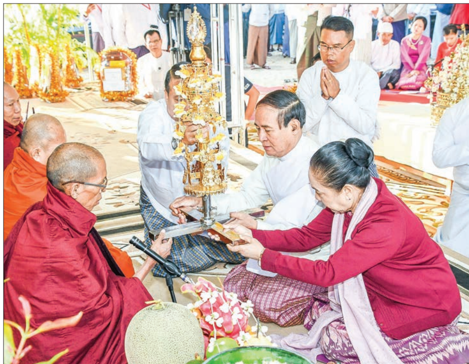
President U Win Myint and First Lady Daw Cho Cho offer pagoda's diamond bud to Sayadaw at the consecration ceremony of Taungnya 'Wa' Zedi yesterday.