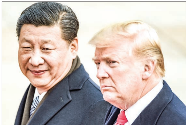
Tensions between Beijing and Washington soared in 2018 over trade disputes.

Since the two leaders agreed on a truce on the sidelines of the G20 summit meeting in Buenos Aires, however, there have been small signs of progress — and an absence of new threats from