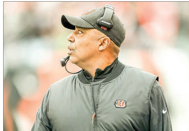
Marvin Lewis, seen here at a 16 December NFL game against Oakland, is out after 16 seasons as coach of the Cincinnati Bengals.

He took over as starter when Wentz was injured last season and led the Eagles to the Super Bowl crown — earning Super Bowl Most Valuable Player honors.—AFP ■