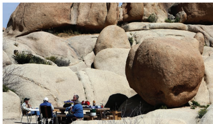
The time between Christmas and New Year's is among Joshua Tree park's busiest.

The findings suggest that plants are also affected by other sounds, including human-made ones, that may damage the ability of flowers and bees to communicate. — Xinhua ■