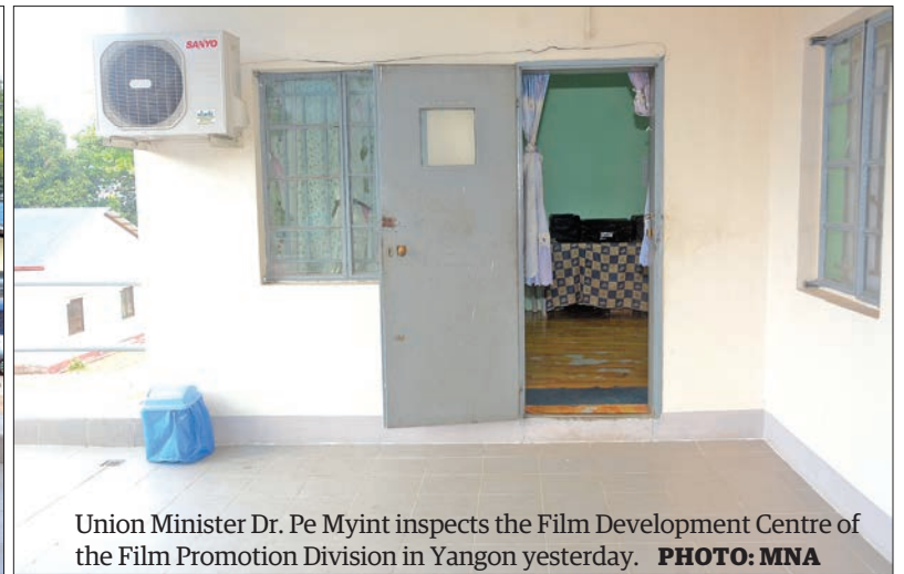
Union Minister Dr. Pe Myint inspects the Film Development Centre of the Film Promotion Division in Yangon yesterday.

Advertisement Printing Machine and distribution sessions at No. 53, Natmauk Street (1), Bahan Township, and Kyemon Daily's