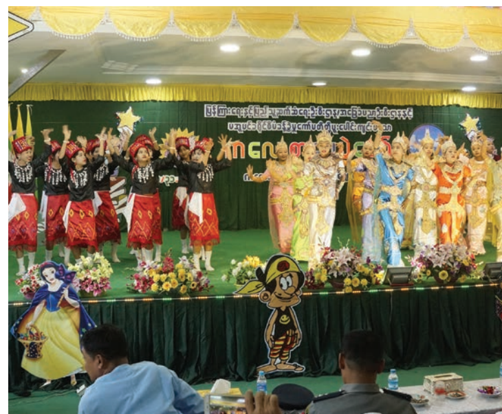
Cultural troupe performs dance at the Children Literature Festival in Maubin yesterday.

THE children's literature festival (Maubin) jointly conducted by the Information and Public Relations Department, Basic Education Department and Maubin District Management Committee came to an end yesterday at Myat Pyinnyar Hall, B.E.H.S (1) in Maubin.