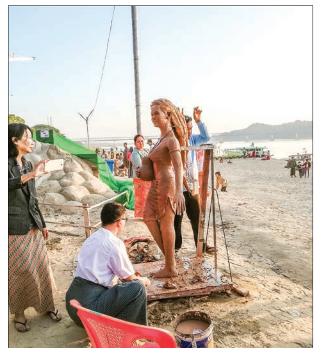
Artist making sand sculpture at the Ayeyawady Festival in Pyay attracting holidaymakers.

Ayeyawady Art Festival in Pyay welcomes New Year