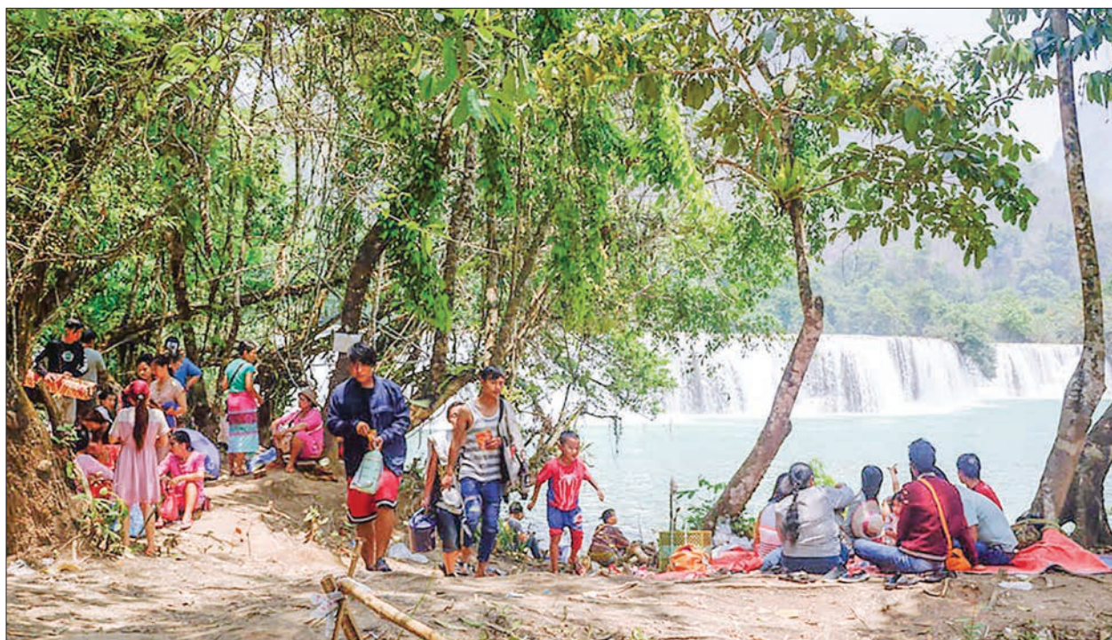
Families enjoying picnic on the New Year Day yesterday at Heikpa Waterfall, Loilem District, Southern Shan State.

Experiencing nature in Shan State on New Year Day