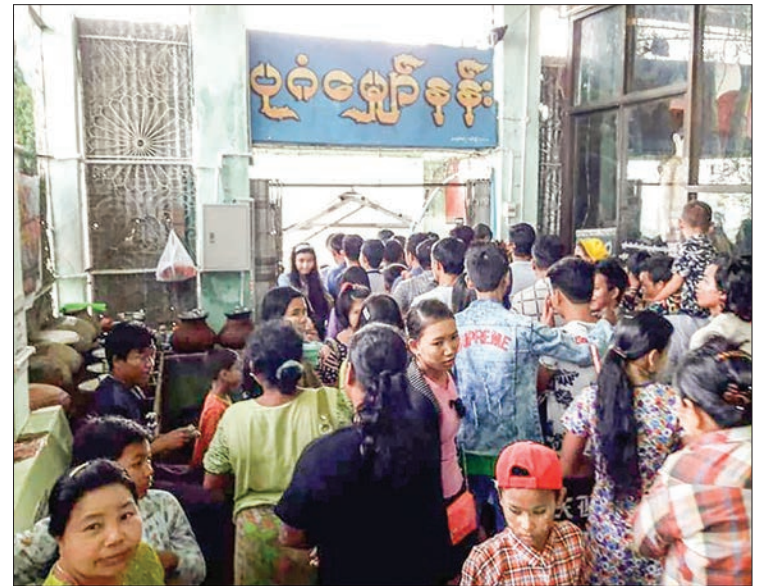
Pilgrims visit Mount Popa during New Year holidays.