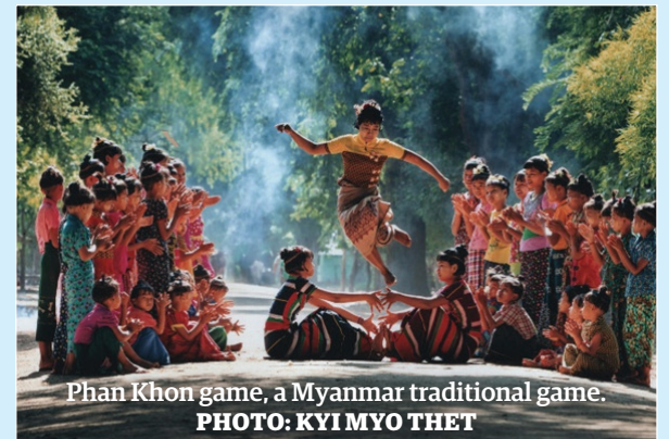
Phan Khon game, a Myanmar traditional game.

(Excerpt from the speech by State Counsellor Daw Aung San Suu Kyi at the 2 nd Anniversary of the Government on 1 st April, 2018.)