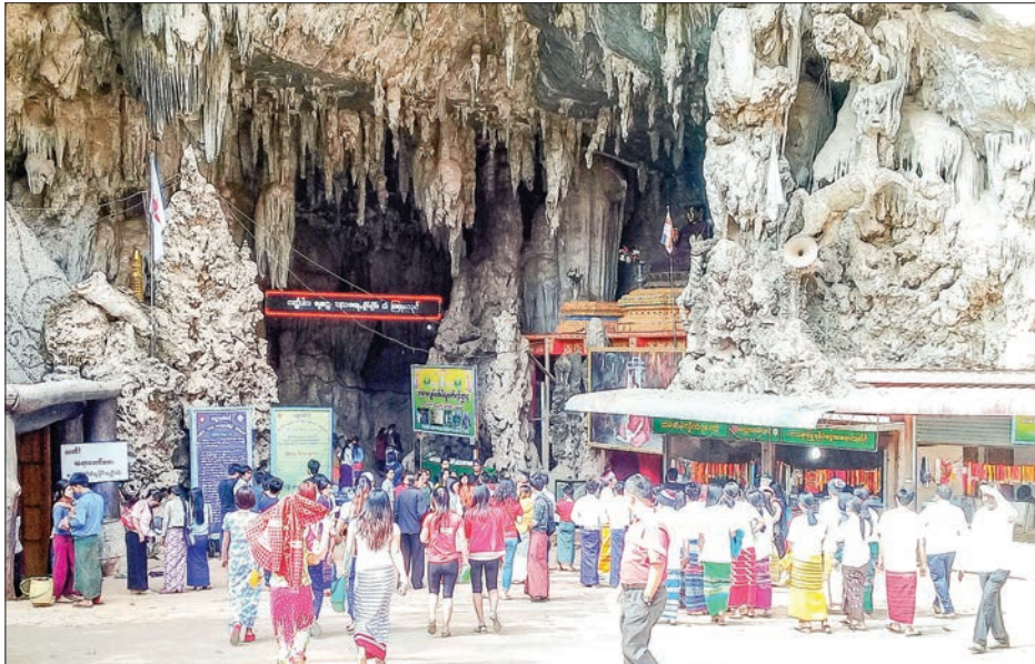
Holidaymakers visit Htam Sam Htam Cave in Pa-O Self Administered Zone in Shan State.

Htam Sam Cave in Hopone draws visitors on New Year Day