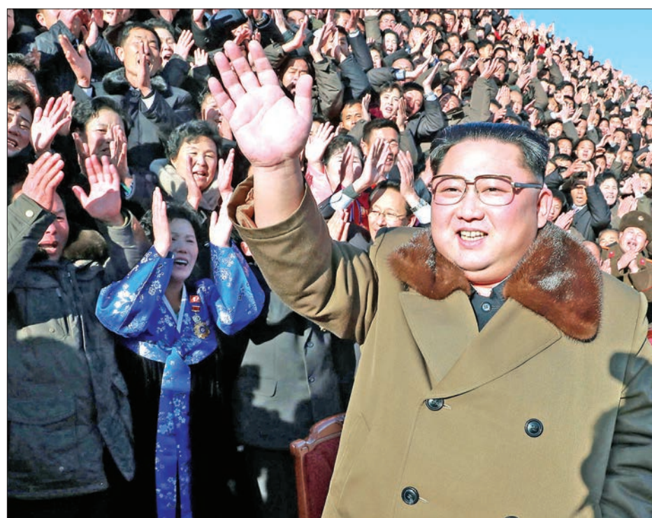
North Korean leader Kim Jong Un reportedly "expressed a strong determination to visit Seoul while watching future situation".

proved markedly in 2018 as Kim made a series of reconciliatory gestures — including a historic summit with US President Donald Trump in June in Singapore.