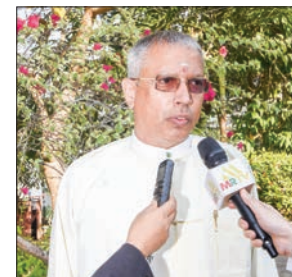
U Thein Lwin