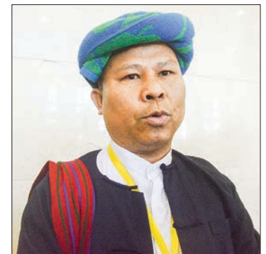
Khun Myint Tun (Vice Chairman) Pa-O National Liberation Organization (PNLO).

We'll continue to strive for groups who hadn't signed the NCA to sign it in 2019 and to successfully participate in the Union Peace Conference-21 st Century Panglong. We will reach the peace