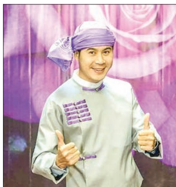
Academy Nay Toe.