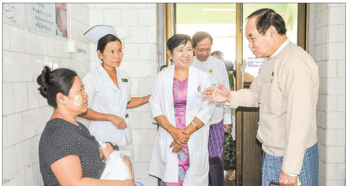
Union Minister Dr. Myint Htwe meets with patient at Dawei People's Hospital in Taninthayi Region yesterday.