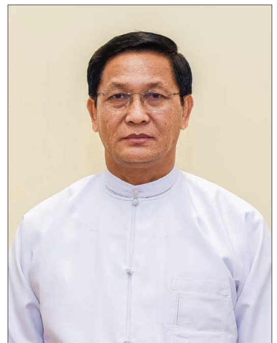
Vice President U Henry Van Thio.