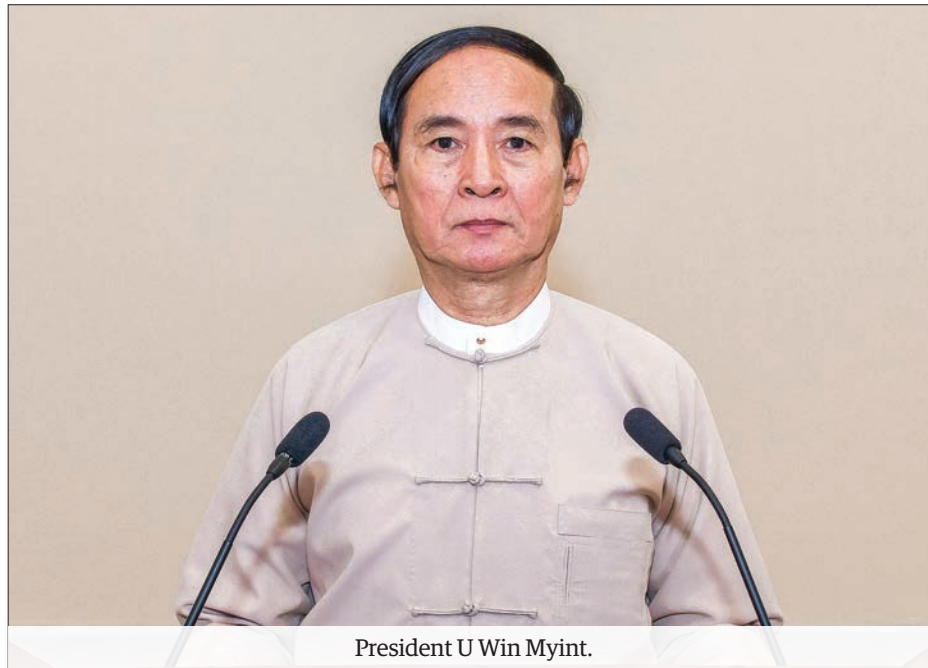
President U Win Myint.

For peace and prosperity in our country in the future and for the tranquility and happiness of our citizens, I wish to assure you all that our Union Government will strive with