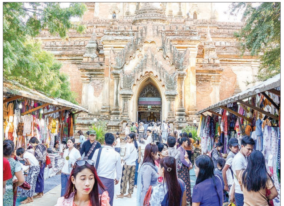
People visit's Bagan famous Pagoda on the New Year Day.

Experiencing nature in Shan State on New Year Day