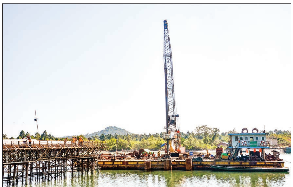
Kinchaung Bridge is under construction in Rakhine State.

In the afternoon, Rakhine State Chief Minister and party attended the meeting held at the Zinchaung High School in Kyaukpyu Township. During the meeting, Rakhine State Chief Minister U Nyi Pu said that the meeting