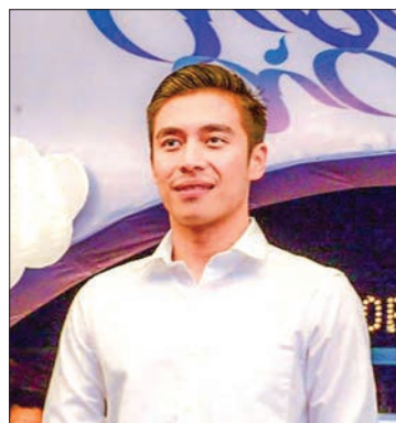
Academy Tun Tun.