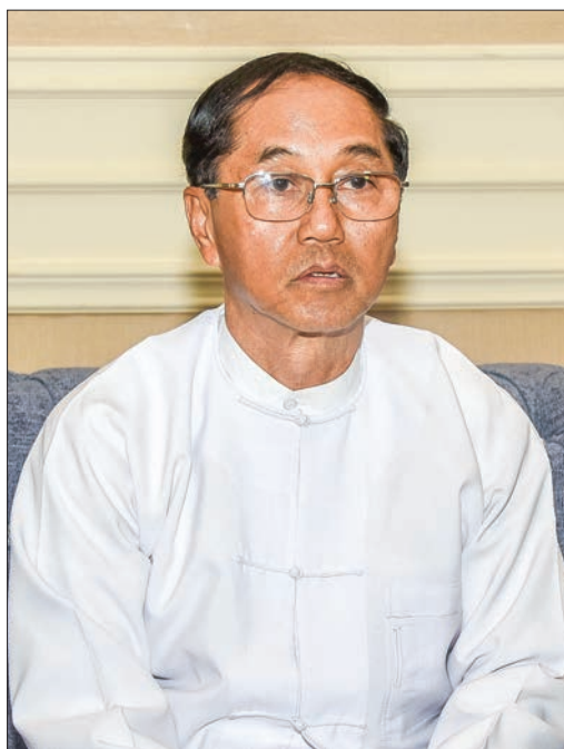
Vice President U Myint Swe.