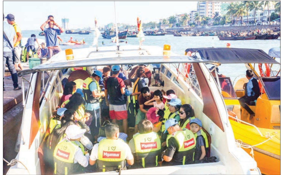
Holidaymakers taking a boat trip to experience nature around Myeik Archipelago on the New Year Day yesterday.

Bidding goodbye to 2018 at Myeik Archipelago