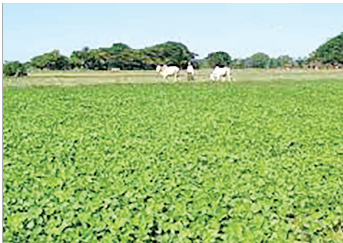
A farmer visits his peas plantation before harvest in Sagaing.