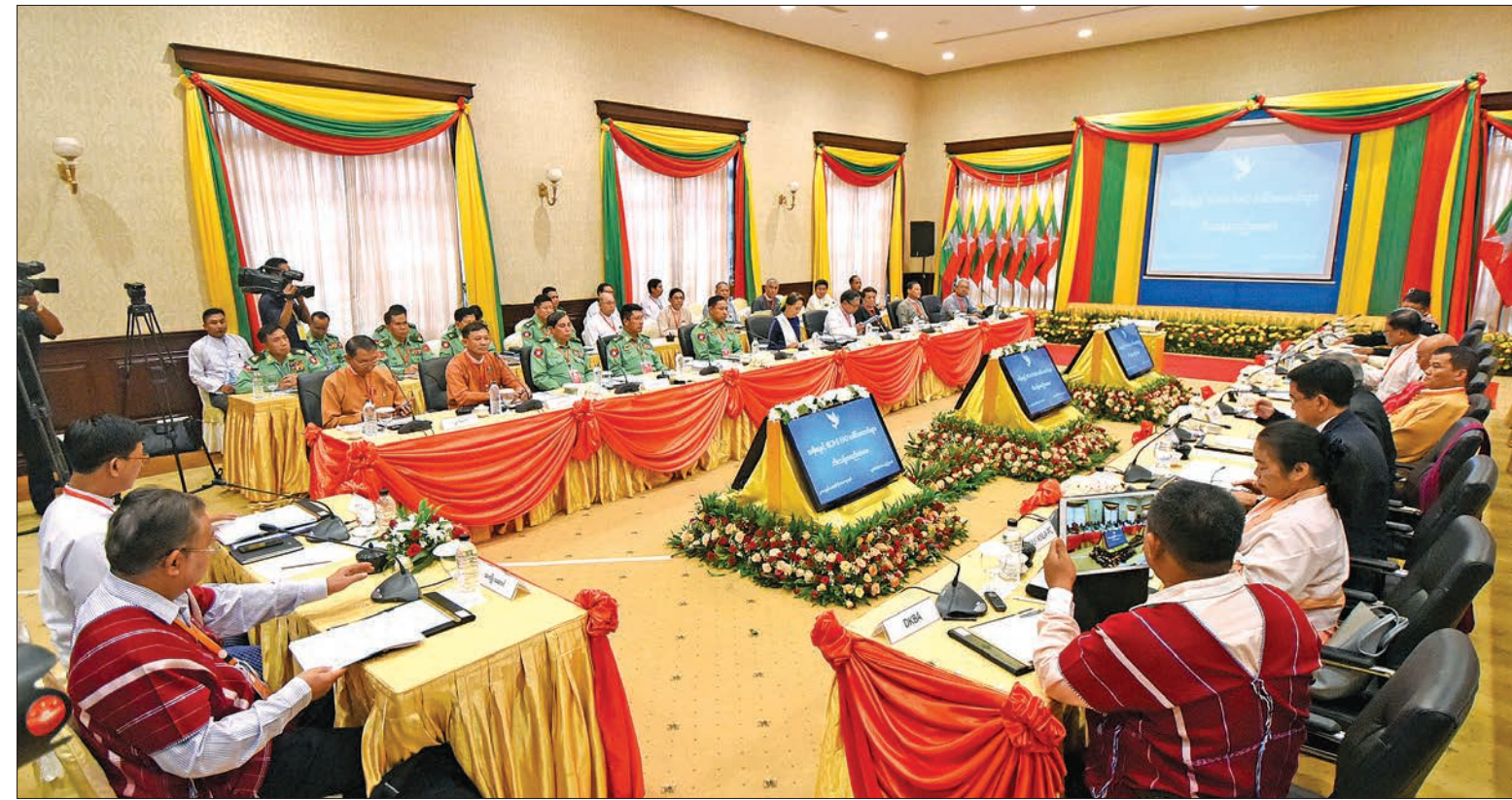
The peace talks between the government and the signatories to the Nationwide Ceasefire Agreement in Nay Pyi Taw on 15 October, 2018.

Since the very day, when the independence was lost, people