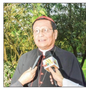
Cardinal Charles Bo