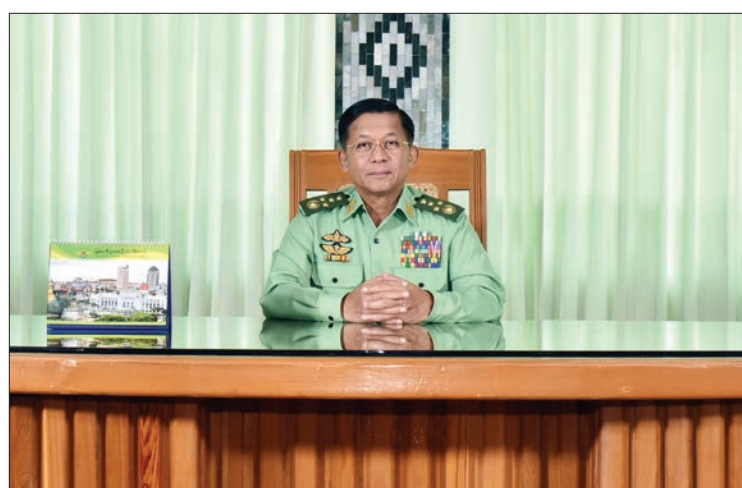
C-in-C Defence Services Senior General Min Aung Hlaing.

On the auspicious occasion of the 2019 New Year, as I send this message of greetings, I wish all esteemed and respected ethnic national brothers and sisters to be blessed with auspiciousness.