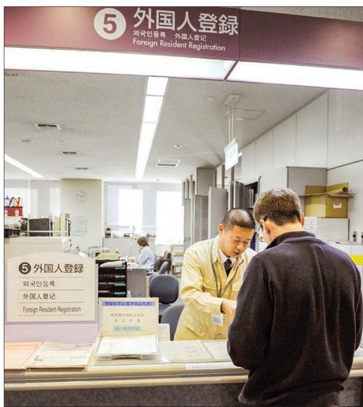
Photo from December 2010 shows the foreign resident registration counter at a ward office in Osaka.

With Japan expecting up to 345,150 foreigners to acquire the new residency statuses in the first five years, the government said it will take steps to avoid