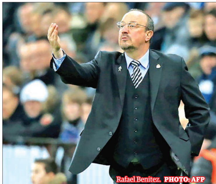
Rafael Benitez.

He added: "I know what is coming now and I know where we are. You can see the team