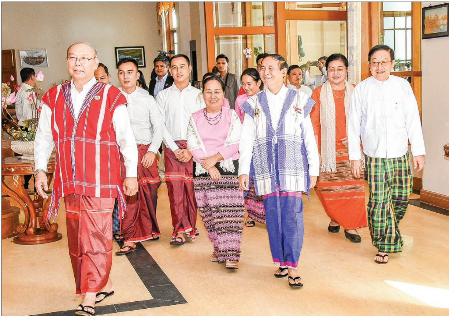
President U Win Myint and Pyithu Hluttaw Speaker U T Khun Myat are welcomed by Amyotha Hluttaw Speaker Mahn Win Khaing Than and family at his residence in Nay Pyi Taw yesterday.