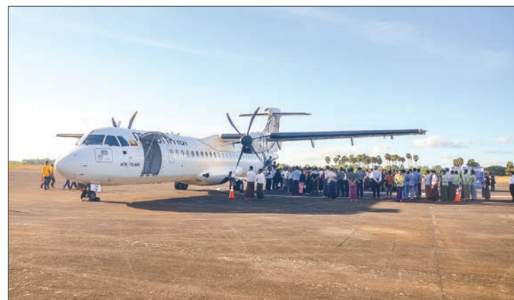
The maiden flight for the air route of the Yangon-Patheingyi-Yangon landed at Patheingyi Airport yesterday.

—Thi Thi Min ■ (Translated by Zaw Htet Oo)