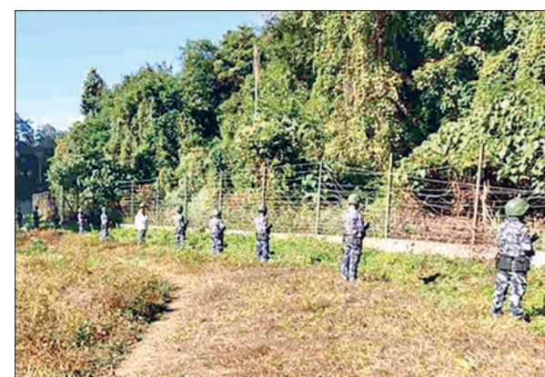
Myanmar border guard police forces patrolling along the border fence.