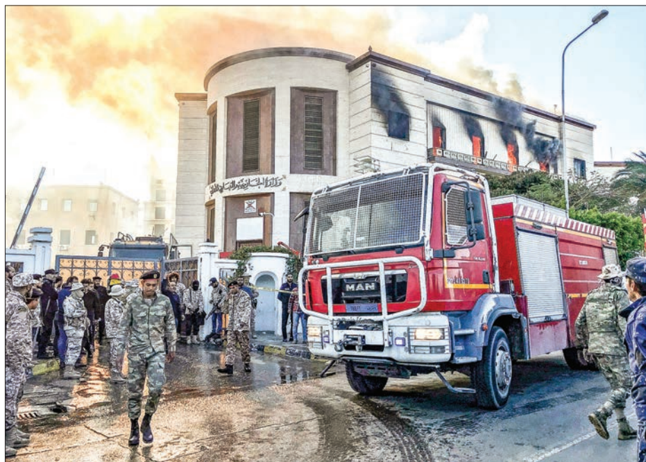
A picture taken on December 25, 2018 shows a firetruck and security officers at the scene of an attack outside the Libyan foreign ministry headquarters in the capital Tripoli. At least one person was killed on December 25 as attackers stormed Libya's foreign ministry after a car bomb exploded in front of the building and a suicide bomber then struck inside, a security source at the scene told AFP.

The Islamic State jihadist group (IS) took advantage of the chaos to gain a foothold in the coastal city of Sirte in