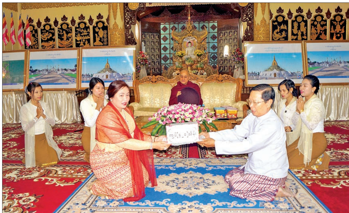
Union Minister Thura U Aung Ko accepts cash donation for the Eternal Peace Pagoda in Nay Pyi Taw.