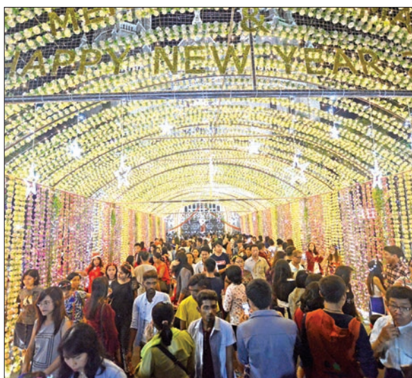
The lane to Emmanuel Church in downtown Yangon is decorated with lights and is crowded with people celebrating Christmas on 25 December, 2018.