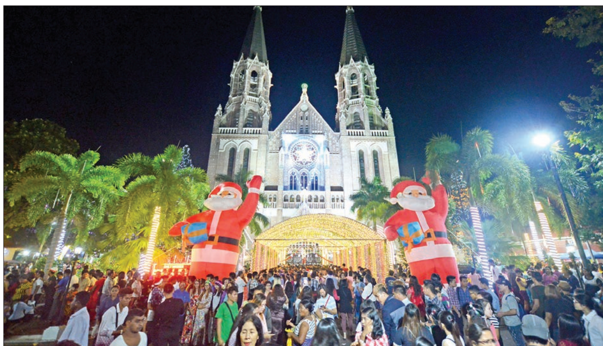
Emmanuel Church in downtown Yangon is crowded with people celebrating Christmas on 25 December, 2018.