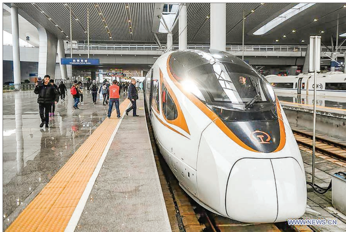
The first bullet train D9551 for Hangzhou-Huangshan railway waits to leave Hangzhou East Railway Station in east China's Zhejiang Province on 25 December, 2018. A high-speed railway linking the scenic cities of Hangzhou and Huangshan in east China was put into operation on Tuesday.

China's railway network is expected to hit 175,000 km in length by 2025, compared with 127,000 km of operating tracks by the end of last year.—Xinhua ■