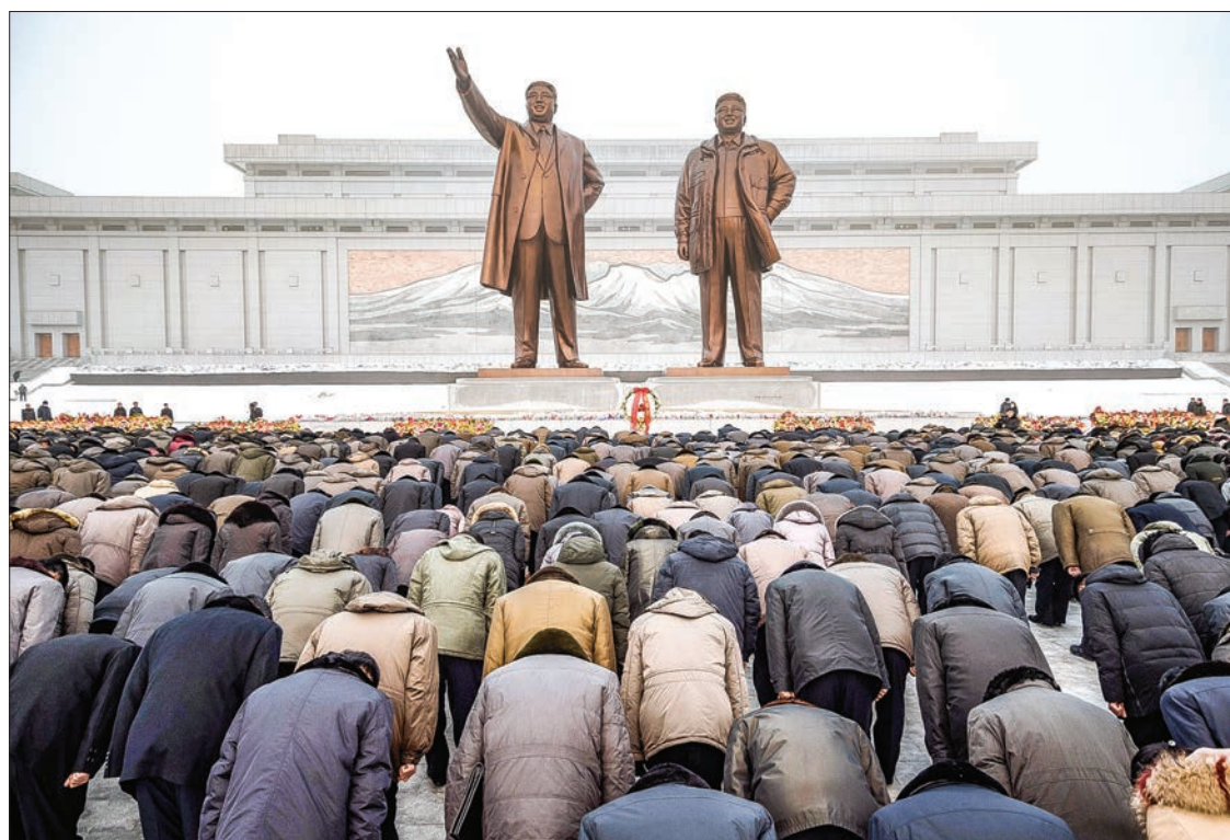
Pyongyang residents bow before the statues of late North Korean leaders Kim Il Sung and Kim Jong Il during National Memorial Day on Mansu Hill in Pyongyang on 17 December, 2018.

"The wicked intention of the US... in getting vocal about