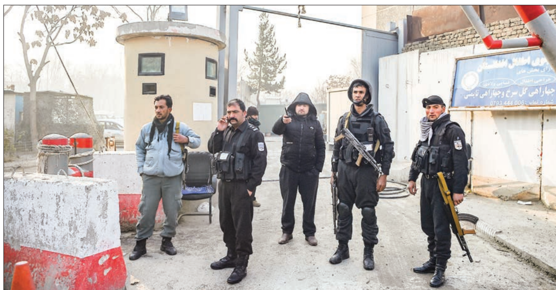
Aghan policemen stand guards at the entrance gate of the Ministry of Public Works a day after a deadly militant attack in Kabul on 25 December, 2018.

At least four militants, including the bomber, were killed and more than 350 people freed, officials said. Most of the dead