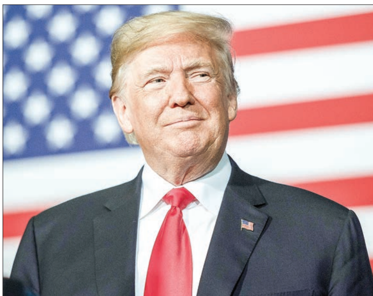
US President Donald Trump.

Trump wants the Democrats to fund for a border wall to stop illegal immigrants from entering the US. Democrats have refused his demands for USD 5 billion in funding for his border wall in a standoff that resulted in a partial government at midnight on