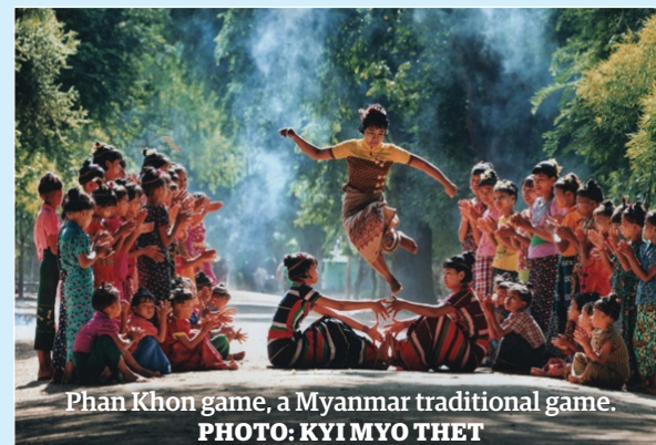
Phan Khon game, a Myanmar traditional game.

(Excerpt from the speech by State Counsellor Daw Aung San Suu Kyi at the 2 nd Anniversary of the Government on 1 st April, 2018.)