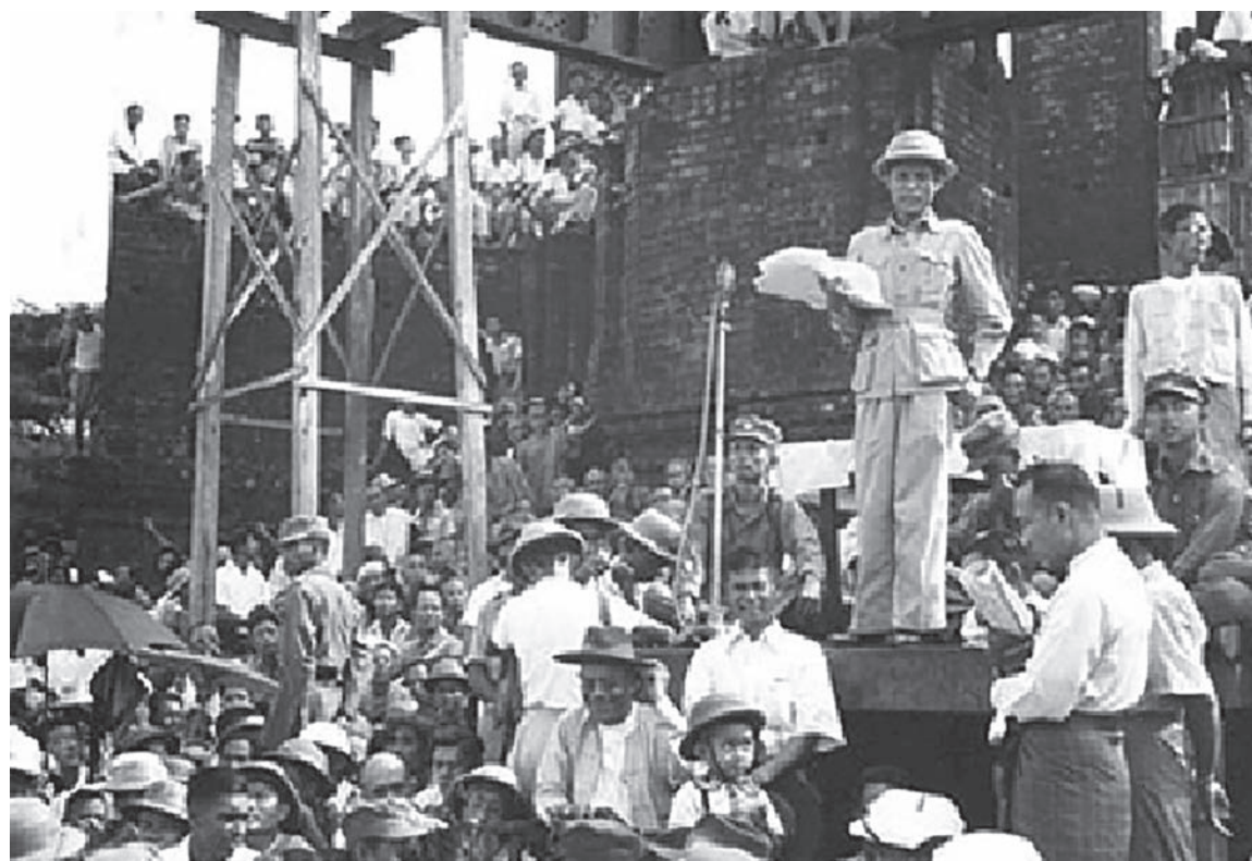
At different places and different times, Bogyoke unveiled his views in strongly worded statements for the country.

Myanmar saw many episodes such as that of the fight and revolt against the British by the combined forces of Japan and BIA; that of the Japanese handing over bogus and fake independence to Myanmar on 1 August 1943; that of the ill treatment and cruelty of Japanese troops to the people; that of the formation of anti-fascists groups and revolts; that of the resistance