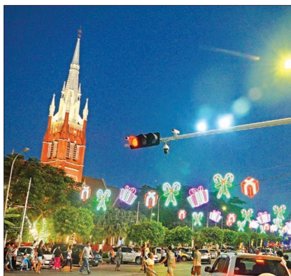
Christmas lights in the shape of candy canes and present boxes adorn Bogyoke Aung San Road near the Holy Trinity Cathedral in downtown Yangon.