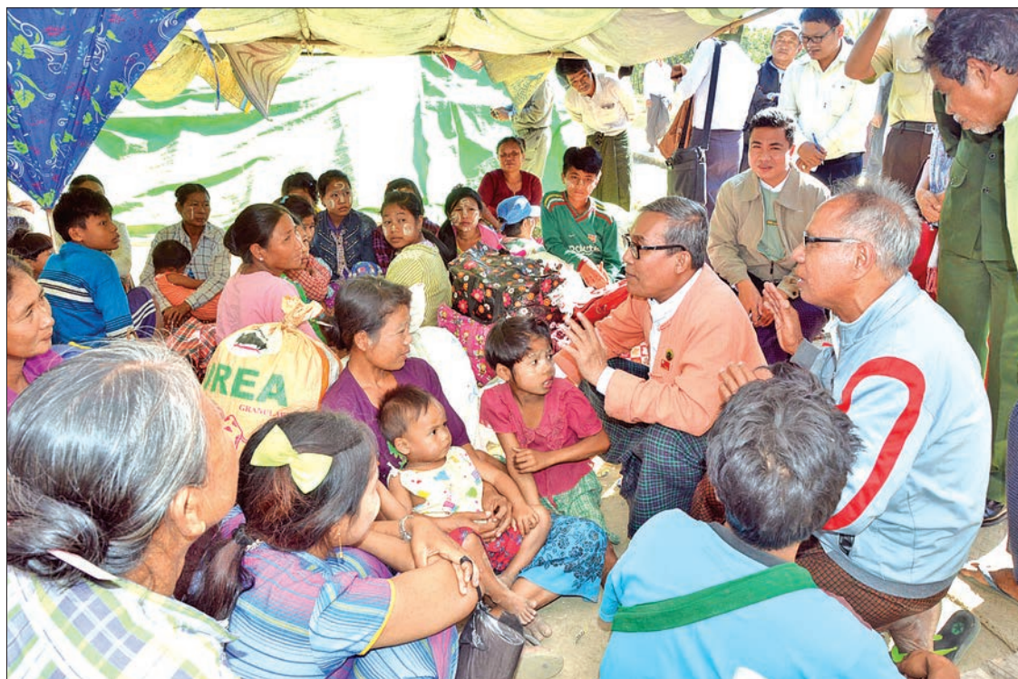
Rakhine State Chief Minister U Nyi Pu talks with displaced people in Taungminkalar Village.

As for the Rakhine State government, we were fulfilling the requirements of food and shelters in the all possible ways. In case of need, we would supply more assistance such as doctors, nurses and medical aids. Besides, Ministry of Social Welfare, Relief and Resettlement and the Red Cross Society were supporting the requirements of basic needs.