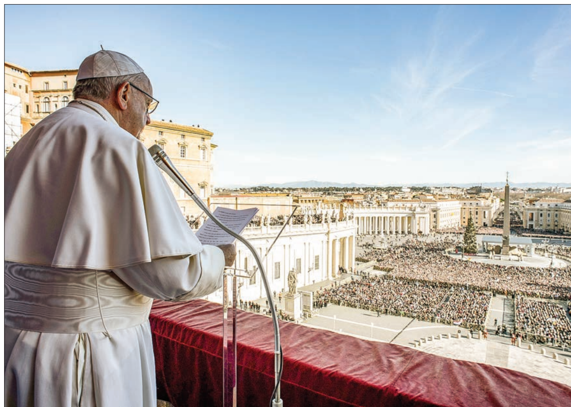
This handout picture released by the Vatican press office on 25 December 2018 at St Peter's square in Vatican shows Pope Francis delivering the “Urbi et Orbi” message from the balcony of St Peter's basilica during the traditional “Urbi et Orbi” Christmas message to the city and the world.

truce in conflict-ravaged Yemen would end a devastating war that has killed around 10,000 people since 2015 and pushed 14 million Yemenis to the brink of famine.