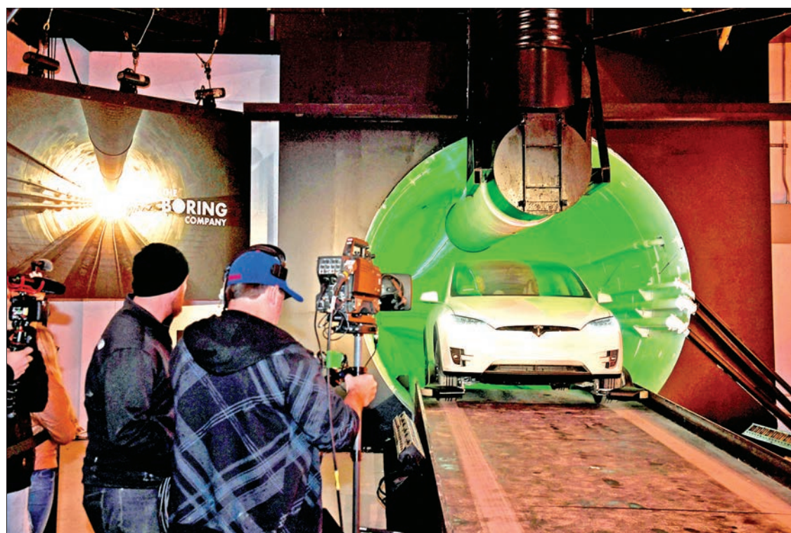
Elon Musk, co-founder and chief executive officer of Tesla Inc, arrives in a modified Tesla Model X electric vehicle during an unveiling event for the Boring Co Hawthorne test tunnel in Hawthorne, south of Los Angeles on 18 December, 2018.