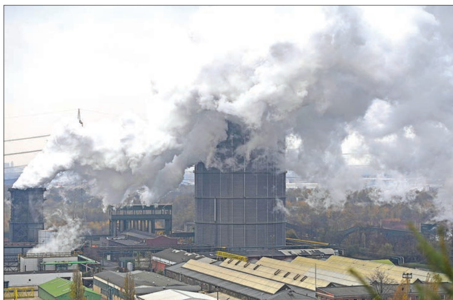
In this file photo taken on 20 November, 2018 a part of the Prosper Haniel coal mine is pictured in Bottrop, Germany.

If it reaches the water table just below the surface, it could contaminate drinking water resources