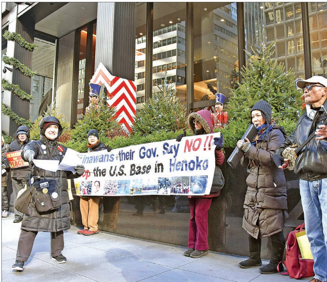
Protestors stage a rally in front of the Japanese Consulate General in New York on 18 August, 2018, against landfill work for the relocation of a major US military base in Japan's southern island prefecture of Okinawa.