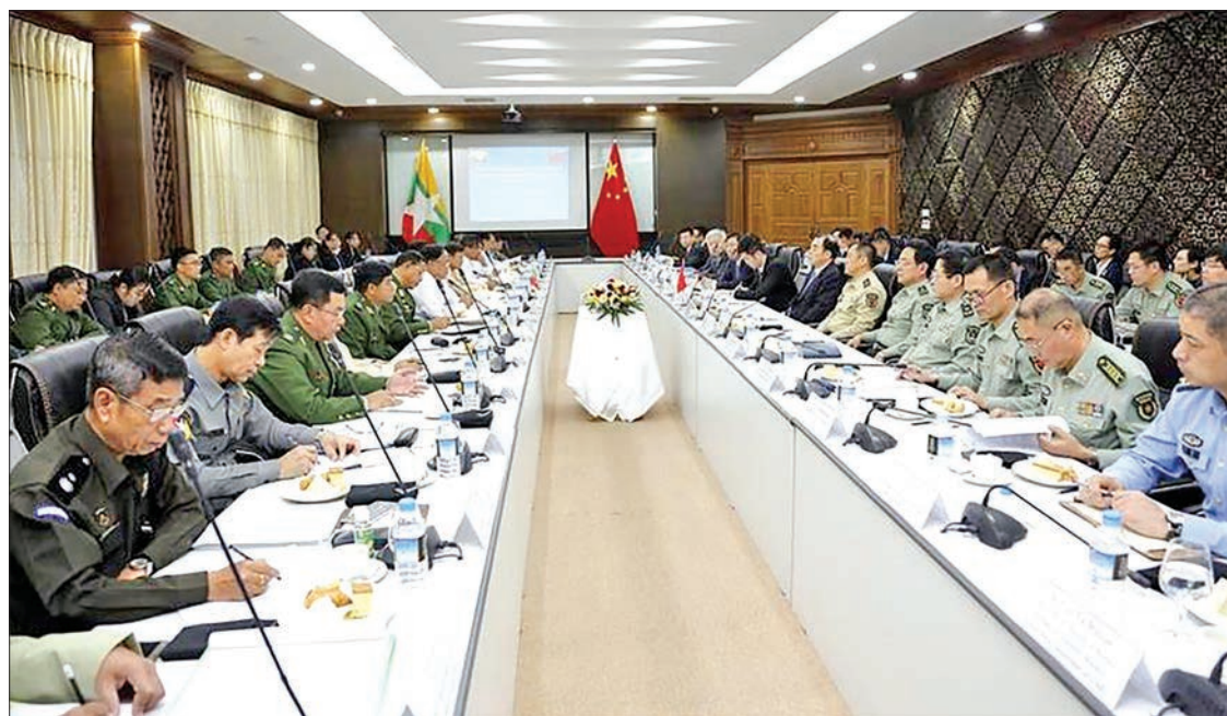
High-ranking officials from Myanmar and Chinese Foreign Affairs and Defence ministries discuss matters relating to the two countries' borders at the 4 th (2+2) High-Level Consultations in Kunming.

During the meeting, the two sides exchanged views in a friendly and cordial atmosphere on border related issues focusing on China's constructive support for the peace process of Myanmar; promoting rule of law, peace and stability along Myanmar-Chi-