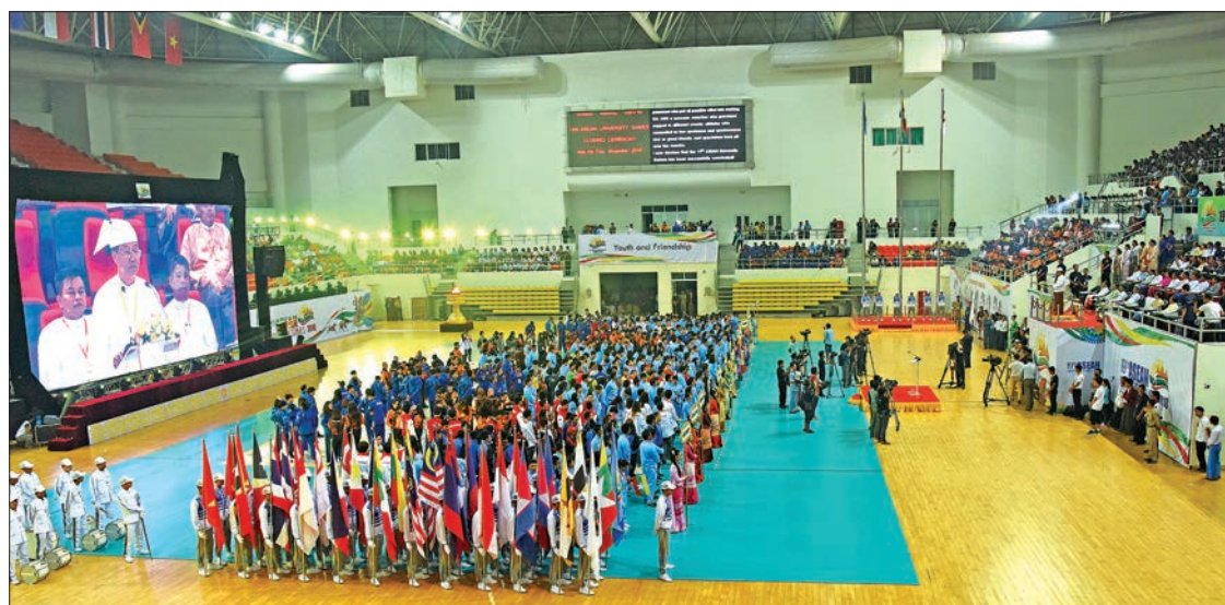
Vice President U Myint Swe delivers the closing speech at the Closing Ceremony of 19 th ASEAN University Games in Nay Pyi Taw yesterday.