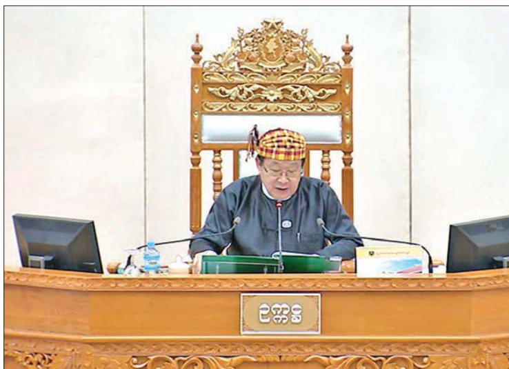
Pyithu Hluttaw Speaker U T Khun Myat.

The first agenda of the meeting was the question and answer session where the first question was raised by Dr. U Saw Naing from South Okkalapa constituency. He asked if there is a plan to construct a new office building for the township immigration department as the present building is quite old and deteriorated. Union Minister for Labour, Immigration and Population U Thein Swe said the ministry is annually request-