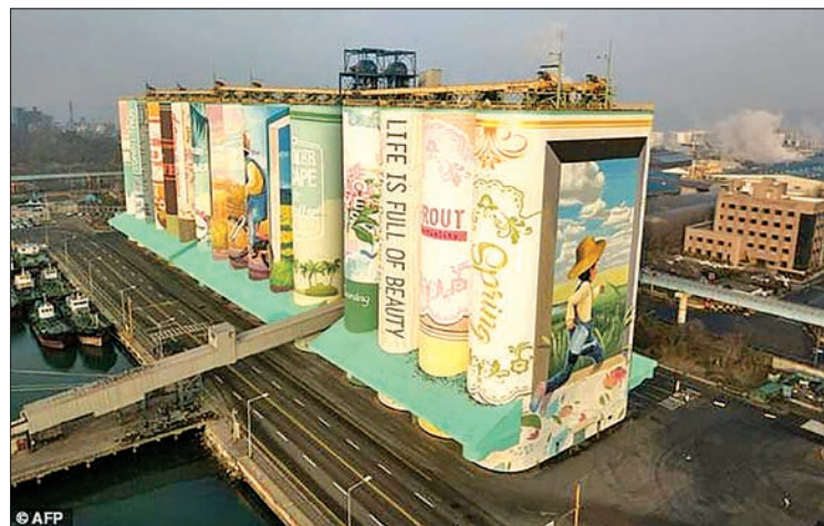
The painting which depicts a young boy's childhood covers the outside of giant storage containers in the port city of Incheon, west of Seoul.

The mural was commissioned by the city's government and port authority as part of efforts to improve the negative view of aged industrial facilities, an idea which originated from the community art projects of the 1920s that swept the United States and Mexico, according to the South's Yonhap news agency. Twenty-two artists used more than 850,000 litres of paint to tell the story which reflects the seasons and resembles 16 individual book covers, at a cost of 550 million won (US$487,000). It topples the previous record holder by a significant margin—the Pueblo Levee Project in Pueblo, in the US state of Colorado, at 16,554 square meters.— AFP ■