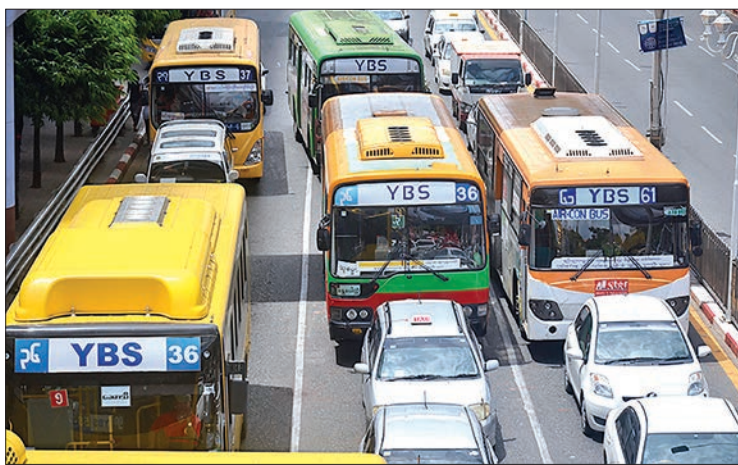
This photo shows YBS buses running through on the busy road in downtown area in Yangon.

“The YBPC is running 500 units. If passengers take free rides, the company faces losses