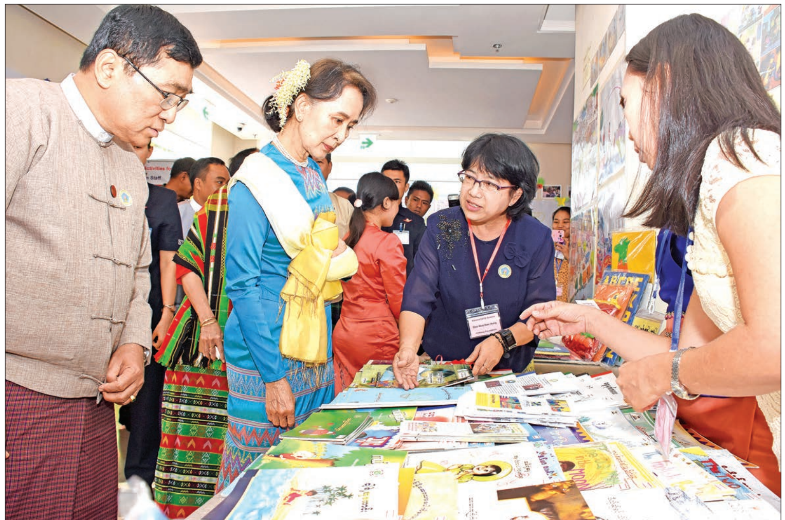
State Counsellor Daw Aung San Suu Kyi observes books displayed at the launching ceremony for the Myanmar Early Childhood Care and Development Strategy in Nay Pyi Taw yesterday.

The State Counsellor said the healthy development of