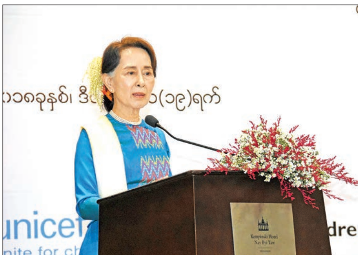
State Counsellor Daw Aung San Suu Kyi delivers the speech at a launching ceremony for the Myanmar Early Childhood Care and Development Strategy in Nay Pyi Taw yesterday.

She said everyone needed to be involved in early childhood