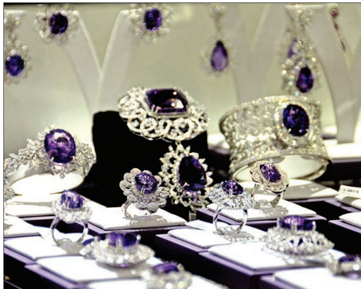
A view shows jewellery displayed in glass cabinets at a jewellery shop in Yangon.

"About 600 international gems and jewellery traders, over