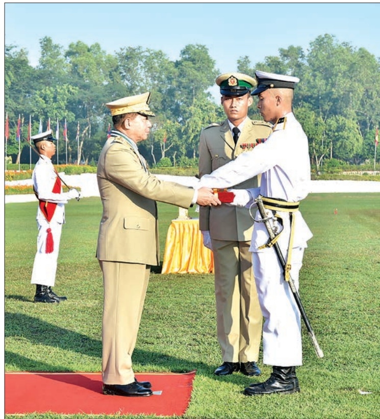
Senior General Min Aung Hlaing confers an excellence award to a cadet of the 19 th Defence Services Medical Academy.

SENIOR General Min Aung Hlaing, Commander-in-Chief of Defence Services, addressed the 19 th intake of the Defence Services Medical Academy held at the parade grounds of the DSMA in Yangon yesterday morning.