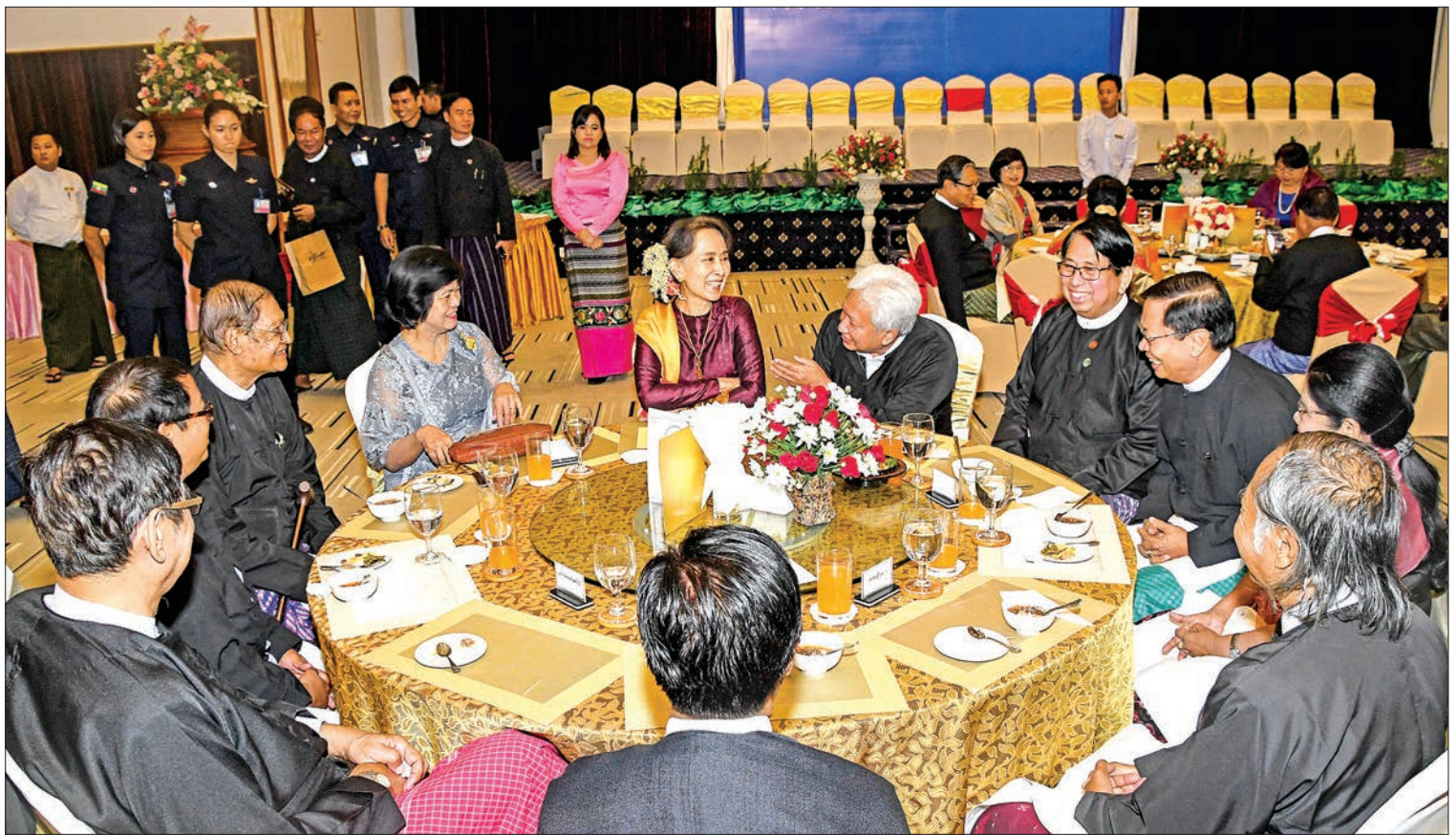
State Counsellor Daw Aung San Suu Kyi attends the dinner gathering together with the authors at the Tungapuri Hotel in Nay Pyi Taw yesterday.