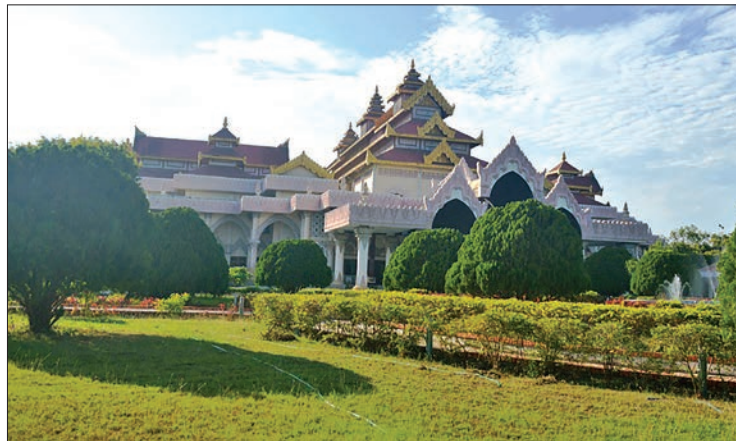
Bagan Archaeological museum in NyaungU District, Mandalay Region.

"The older archaeological museum was opened in 1904