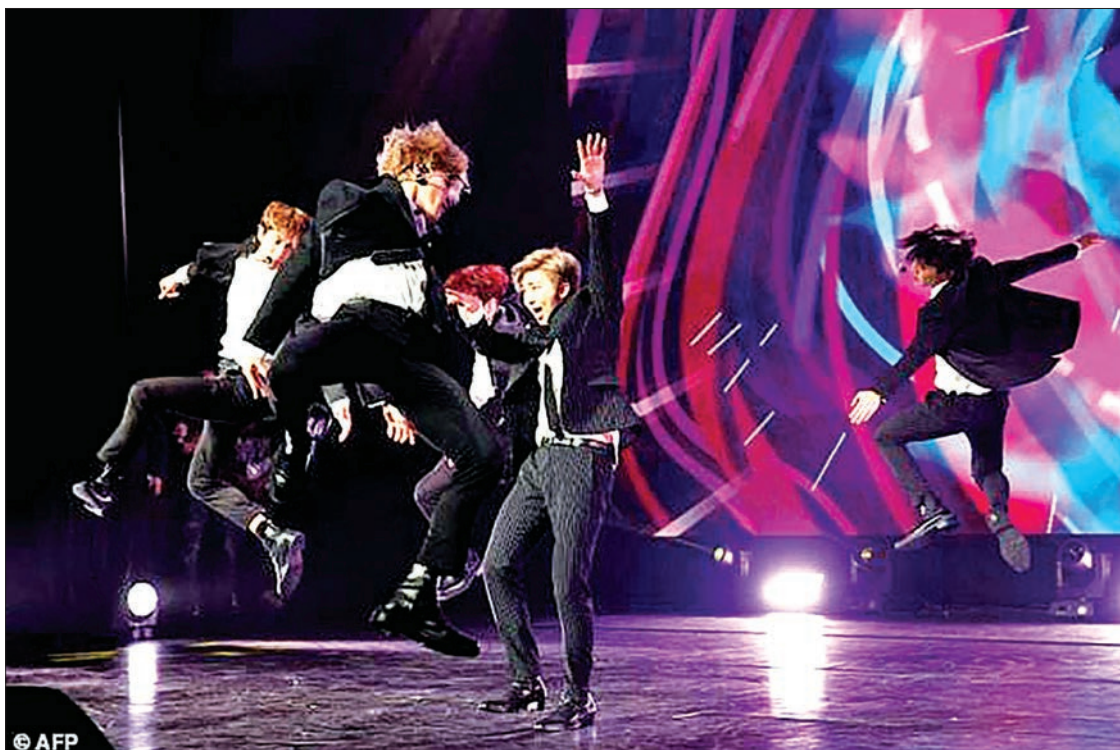
Known for their boyish good looks, floppy haircuts and meticulously choreographed dance moves, BTS have become one of South Korea's most valuable musical exports.

Researchers estimated the group's so-called annual produc-