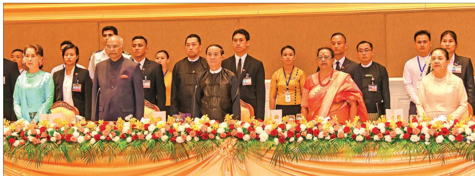
President U Win Myint and First Lady Daw Cho Cho, State Counsellor Daw Aung San Suu Kyi attend a state dinner with President of India Shri Ram Nath Kovind and first lady in Nay Pyi Taw on 11 December.

16. The Indian side also informed the Myanmar side that a DPR has been prepared by the Airports Authority of India for the redevelopment of Kalay Airport. This would soon be forwarded