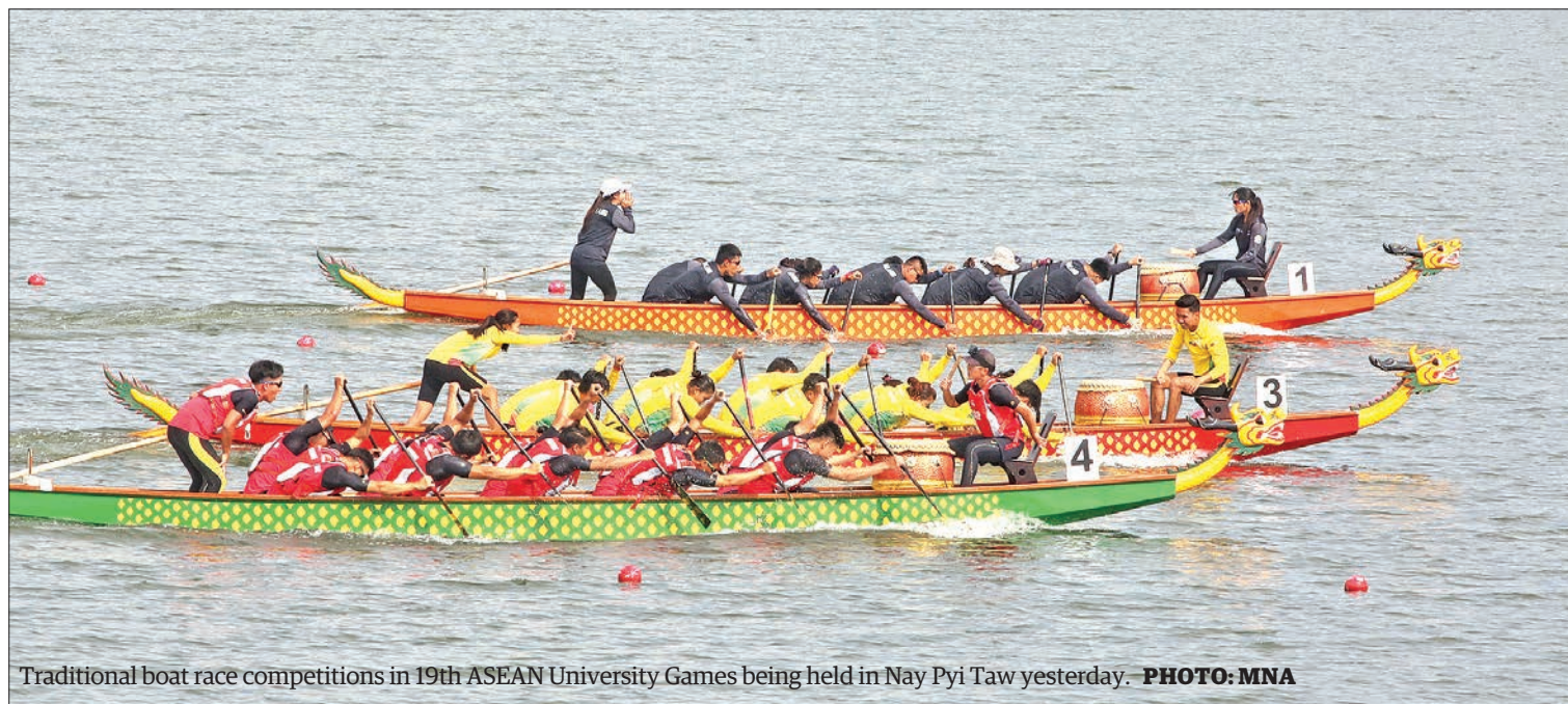
Traditional boat race competitions in 19th ASEAN University Games being held in Nay Pyi Taw yesterday.

In the 500-meter men's traditional boat race competition, Thailand secured the gold medal, Myanmar grabbed the silver medal, and Singapore earned the bronze medal. In the 500-meter men/women mixed traditional boat race competition, the Thailand team secured the gold medal, the Myanmar team won silver,