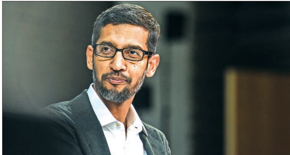
In this file photo taken on 1 November 2018, Sundar Pichai, CEO, Google Inc., speaks at the New York Times DealBook conference in New York City.

ogy in its early days is hard, but I do think companies should self-regulate,” he said. “This is why we’ve tried hard to articulate a set of AI principles. We may not have gotten everything right, but we thought it was important to start a conversation.” Google in June published a set of internal AI principles, the first being that AI should be socially beneficial.