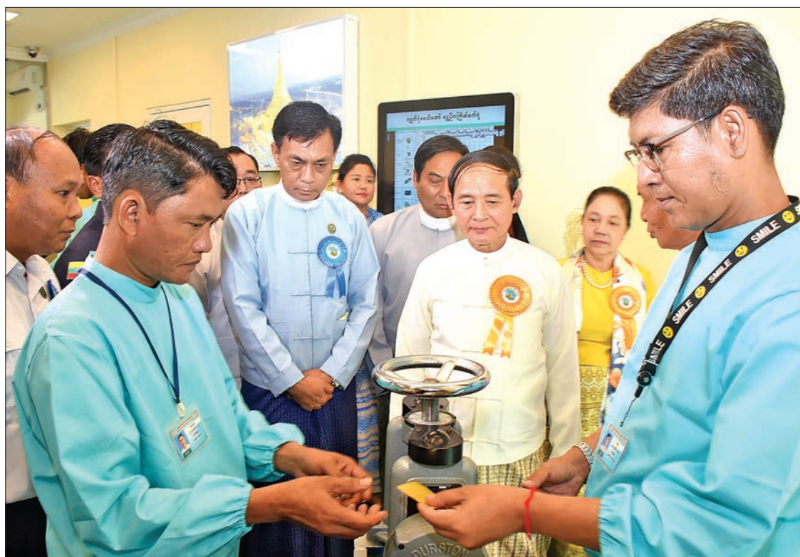
President U Win Myint visits the gold-moulding mill as workers make gold plates at the Shwedagon Pagoda.