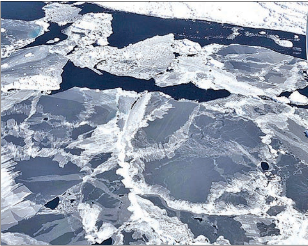
A recent study showed that parts of the Antarctic ice sheet — which holds enough frozen water to bury every major coastal city in the world — are melting far more quickly than thought only a few years ago.

Scientists have concluded that such impacts are already unmistakable with only 1C of warming so far. “The eyes of the world are upon us,” said