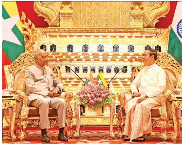
President U Win Myint receives President of India Shri Ram Nath Kovind in Nay Pyi Taw.

3. On 12 December 2018, President Kovind visited the Advanced Centre for Agricultural Research and Education and the Rice Bio Park that have been set up with the assistance of Indian Government in the precincts of Yezin Agricultural University. Both the facilities were formally dedicated by President Kovind to the people of Myanmar. They