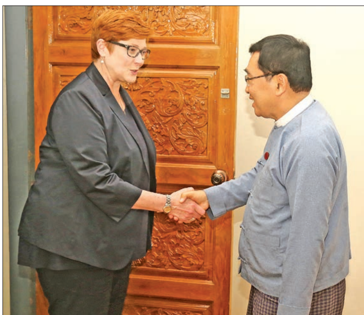
Union Minister Dr. Win Myat Aye meets with Australia Minister for Foreign Affairs and Senator the Honourable Marise Payne.