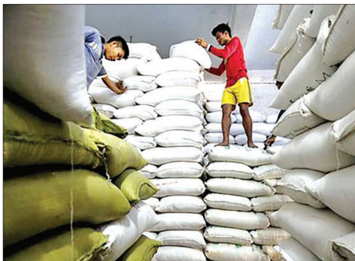
Workers arrange packs of rice at a warehouse in Yangon.