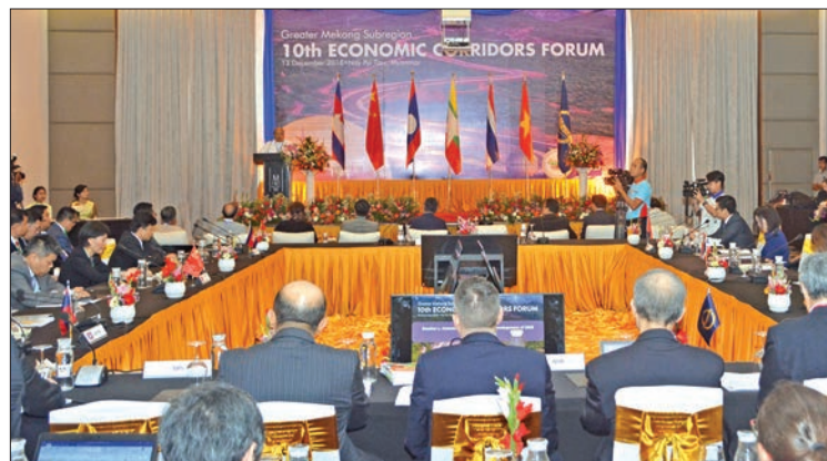
Union Minister U Thaung Tun addresses the 10 th Greater Mekong Subregion Economic Corridors Forum in Nay Pyi Taw yesterday.

10 th Greater Mekong Subregion (GMS) Economic Corridors Forum was held in M Gallery Hotel, Nay Pyi Taw yesterday.