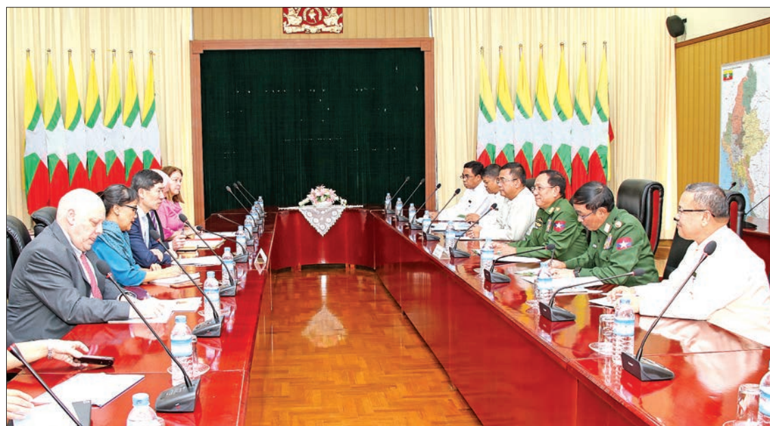
Union Minister for Border Affairs Lt-Gen Ye Aung holds talks with UNDP Regional Director Mr. Haoliang Xu at the meeting hall of the Union Minister yesterday.

tion with the UN in the internal peace process, carrying out the affairs of Rakhine State as for the Central Committee for the Implementation of Peace and Development, citizenship rights, freedom of movement, education, healthcare, security, closure of IDP camps, repatriation process conducted by the State Government, the provision of humanitarian aids, resettlement and rehabilitation affairs, regional development, the elimination of the long-term conflict, harmonization, socio-economic development and creating employment opportunities. —MNA ■ (Translated by Win Ko Ko Aung)