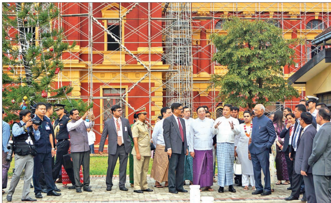
President of India Shri Ram Nath Kovind and First Lady Smt. Savita Kovind visit the Secretariat or Secretariat Building on Theinbyu Road in Yangon.