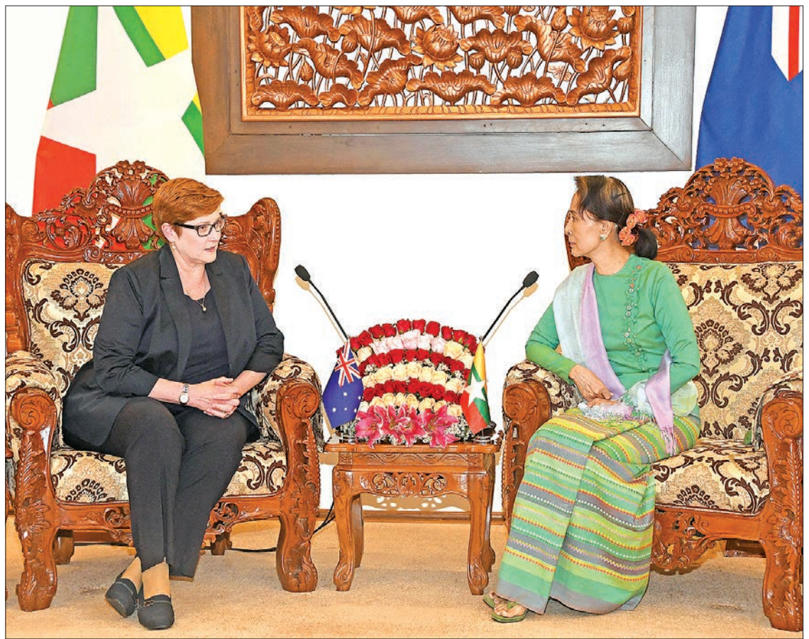
State Counsellor Daw Aung San Suu Kyi, right, meets with Honourable Marise Payne, Foreign Minister of the Commonwealth of Australia in Nay Pyi Taw yesterday.

ment institutions, repatriation of displaced persons from Rakhine State and provision of humanitarian assistance, educational support programs in Rakhine State conducted with Australian assistance, the progress of the implementation of the recommendations of Kofi Annan Commission and Myanmar democratization process. U Kyaw Tin, Union Minister for International Cooperation hosted a luncheon to the delegation led by Australian Foreign Minister at M-Gallery Hotel, Nay Pyi Taw.—MNA