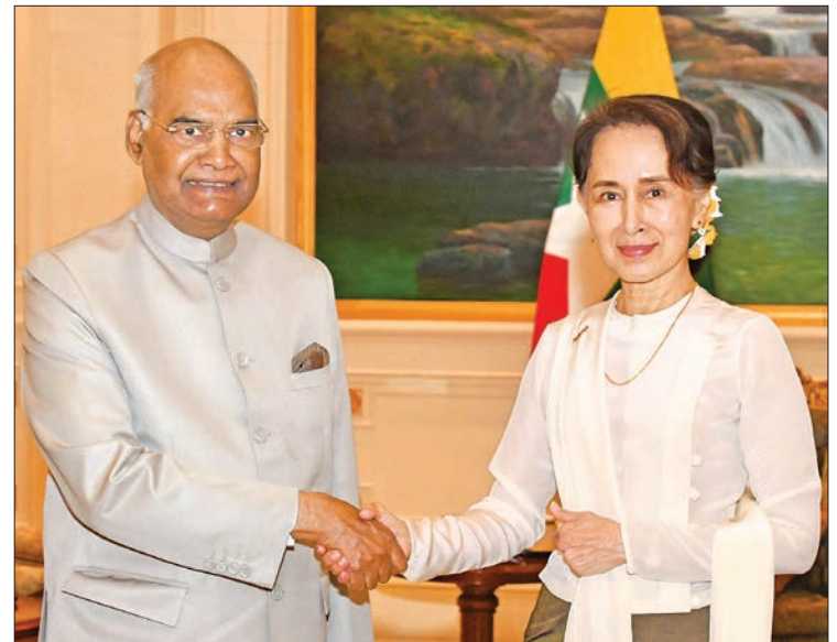
State Counsellor Daw Aung San Suu Kyi shakes hands with President of India Shri Ram Nath Kovind in Nay Pyi Taw.

8. The leaders agreed that terrorism constitutes a significant threat to peace and stability in the region and should be confronted in all its forms and manifestations. They called on the international community to end selective and partial ap-