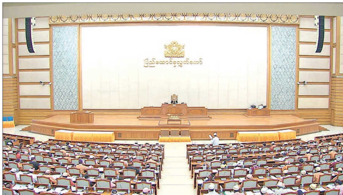
Pyidaungsu Hluttaw is being convened in Nay Pyi Taw.