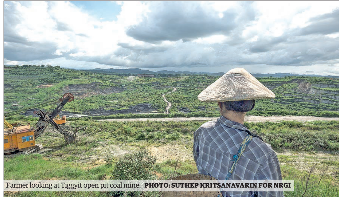
Farmer looking at Tiggyit open pit coal mine.

Plans to overhaul how mineral and gemstone rights are issued are an opportunity to promote good governance and boost investment. But political will is needed to ensure success.