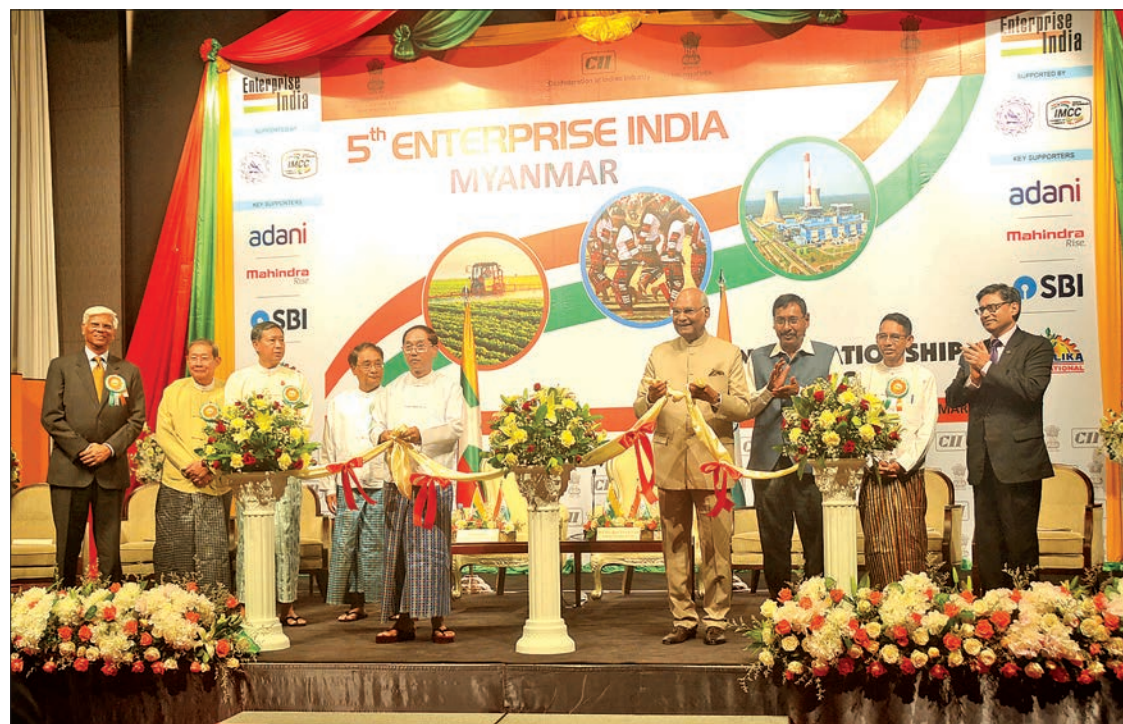
Vice President U Myint Swe and Indian President Shri Ram Nath Kovind cut ceremonial ribbons to formally open the 5 th Enterprise India Show in Lotte Hotel, Yangon.

In his address, the Vice President said there was no doubt that this event would