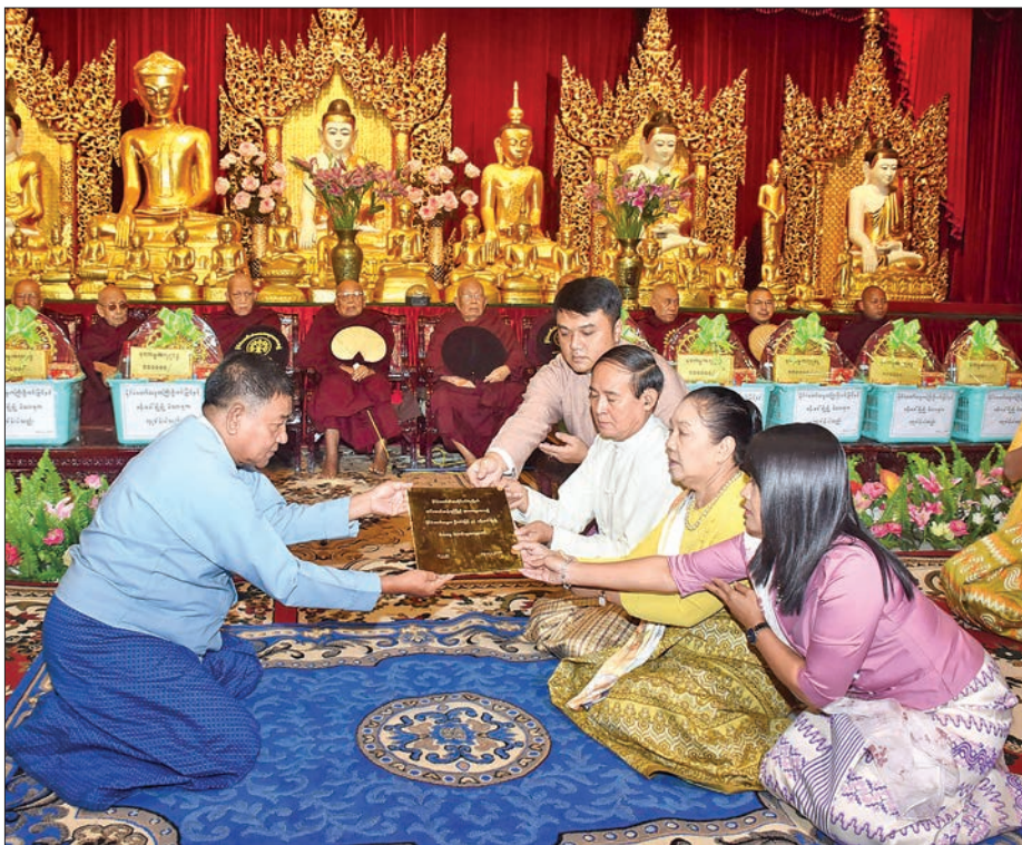
President U Win Myint, First Lady Daw Cho Cho and family hand over a gold plaque for the Shwedagon Pagoda to a member of the pagoda's board of trustees.