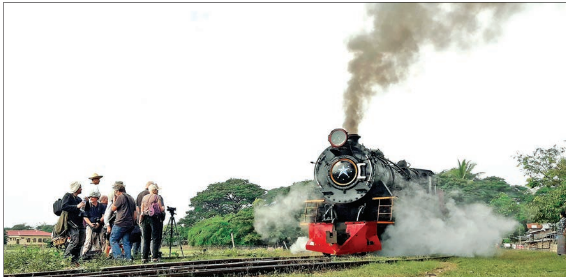
Tourists taking pictures the World War II steam locomotive on the railroad near Nay Pyi Taw.

The train completed the journey to Madauk in Nyaung-glyabin Township, Bago Region,