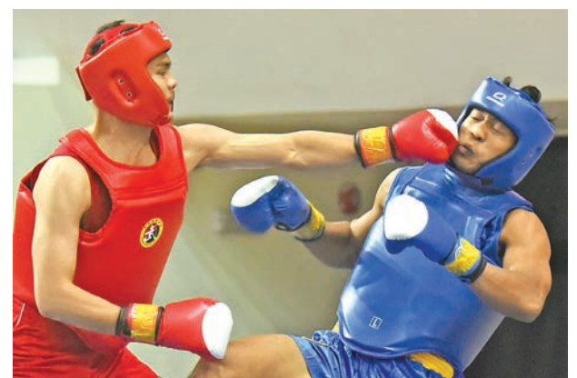
Two players compete at Wushu Sanshou event at the 19 th ASEAN University Games in Nay Pyi Taw.