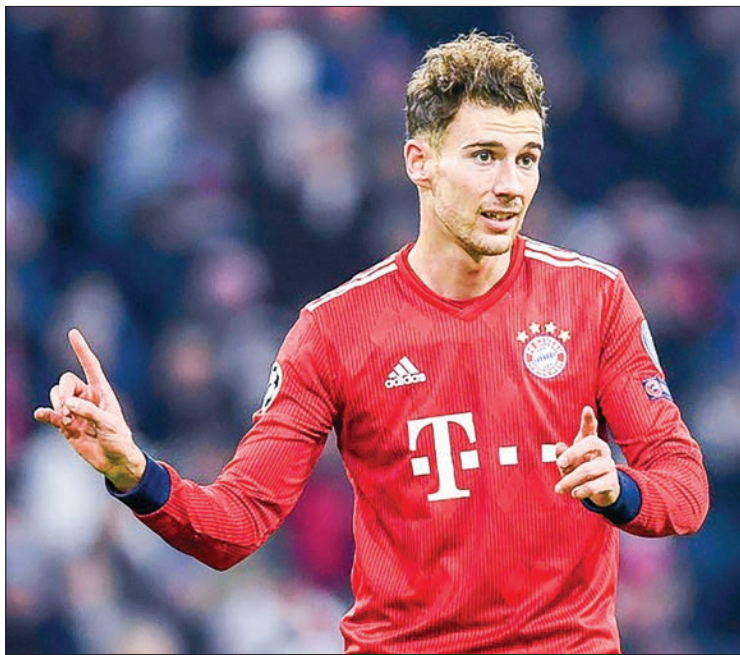
Bayern Munich's Leon Goretzka has profited from coach Niko Kovac's decision to abandon a rotation policy with three recent wins in the build-up to Wednesday's Champions League showdown at Ajax.

World Cup winners — Germany defender Mats Hummels, and Spain midfielder Javi Martinez — languished on the bench against Nuremberg alongside Euro 2016 winner Renato Sanch-