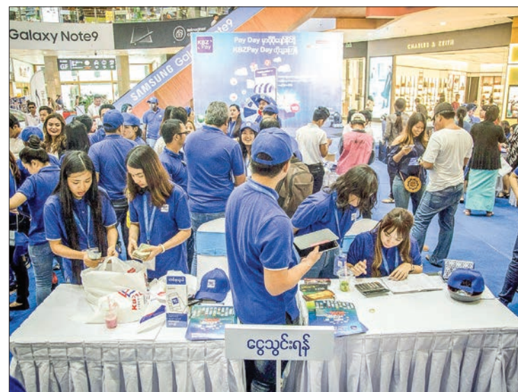
KBZ Bank staff members and customers seen at the launching ceremony of a digital wallet called KBZPay.