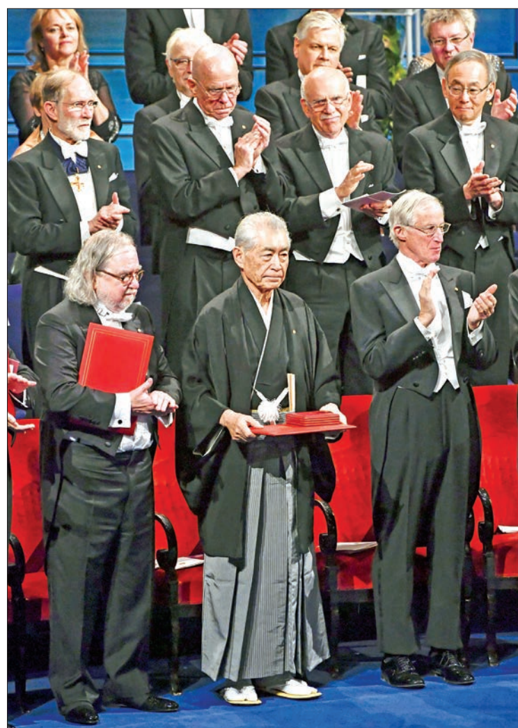
Tasuku Honjo (c, front row) receives the Nobel Prize in physiology or medicine at a ceremony in Stockholm on 10 December, 2018.

Before the ceremony took place at the Stockholm Concert Hall, Denis Mukwege, a Congolese gynecologist, and Nadia Murad, a Yazidi human rights activist and victim of war crimes from Iraq, were conferred this year's Nobel Peace Prize in the Norwegian capital Oslo for their work to end the use of sexual violence as a weapon of war and armed conflict. ■