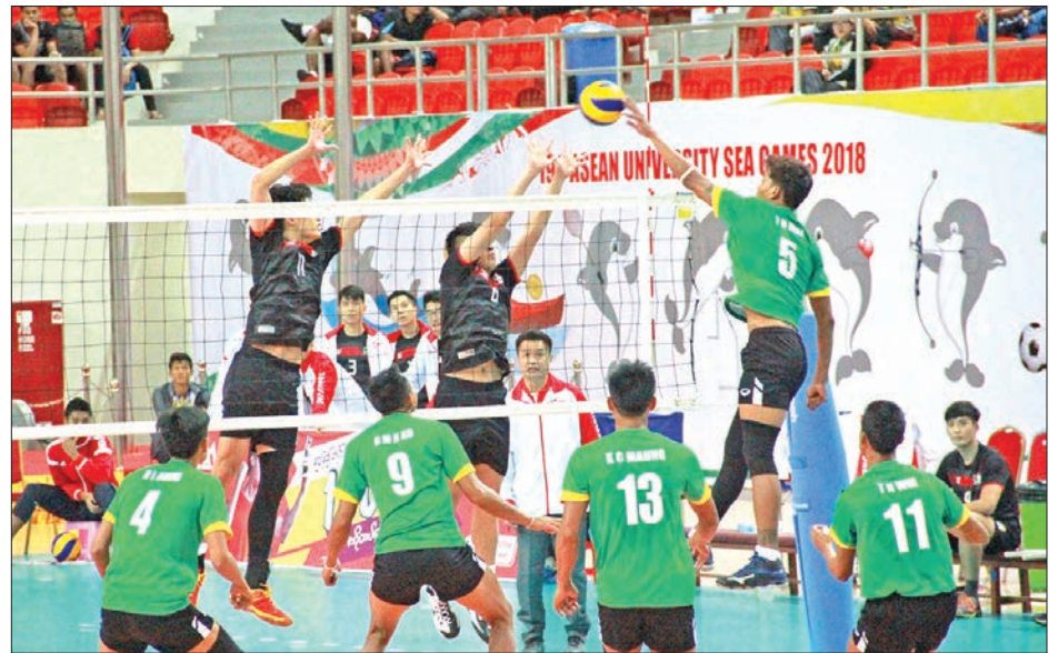
Volleyball players in action at the 19 th ASEAN University Games in Nay Pyi Taw.