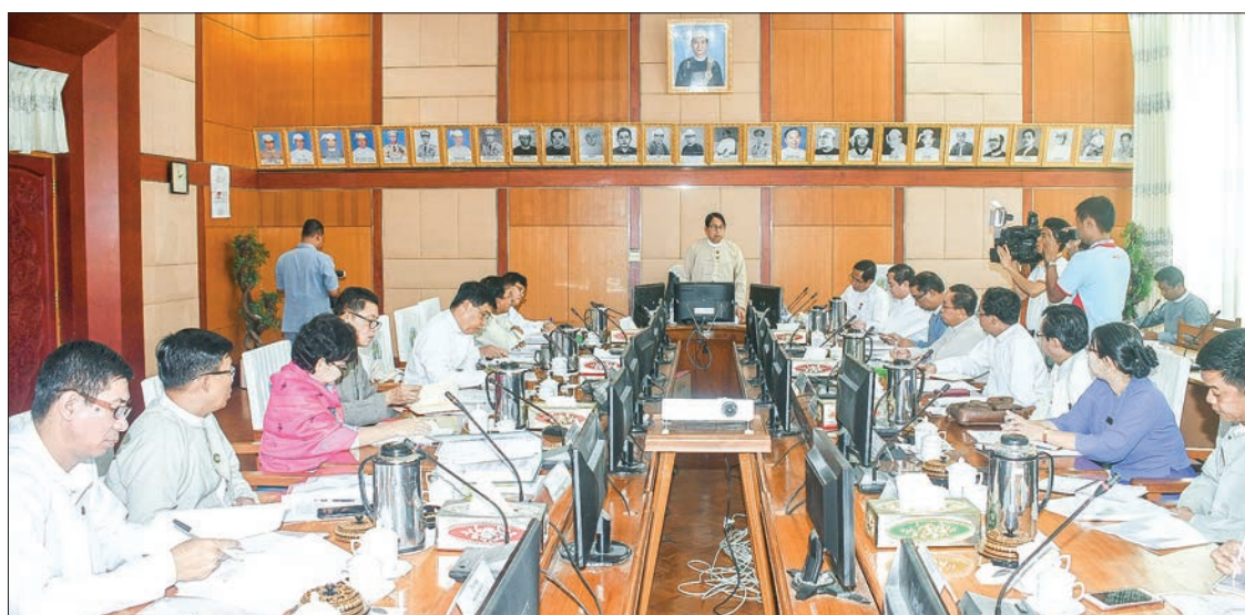
Union Minister Dr. Pe Myint delivers the speech at the second coordination meeting for holding “All who can read should read” campaign in Nay Pyi Taw yesterday.

Later, representatives from Ministry of Religious Affairs and Culture, Ministry of Education, Ministry of Planning and Finance, Myanmar Radio and Television, Printing and Publishing Department, National Archives Department, Myanmar Library Association, Forever Group Co. Ltd, Shwe Thanlwin Media, Myanmar Libraries Foundation and