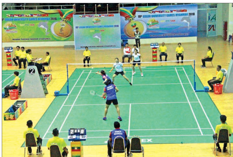
Indonesia and Singapore women badminton players in action at the 19 th ASEAN University Games in Nay Pyi Taw yesterday.