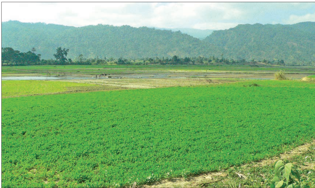
A photo shows a piece of farm land for seedling nursery.

Due to limitation of space we are only able to publish "Letter to the Editor" that do not exceed 500 words. Should you submit a text longer than 500 words please be aware that your letter will be edited.