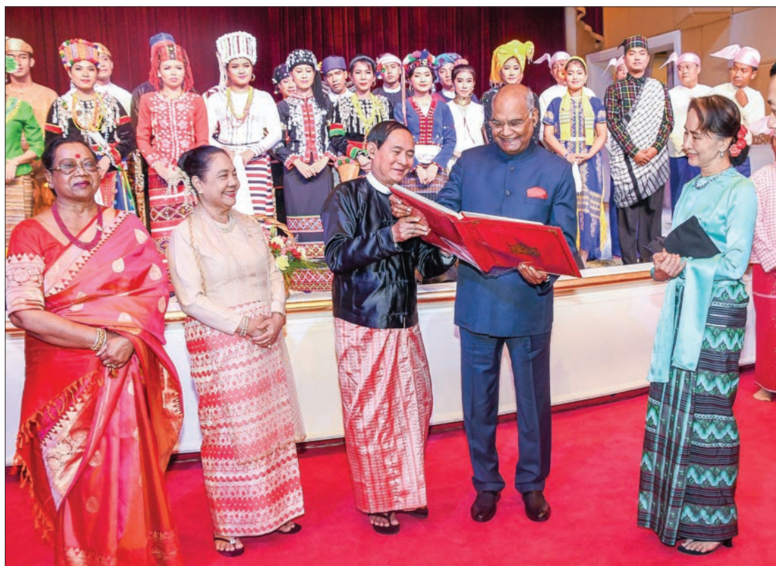
President U Win Myint presents photo album to President of India Shri Ram Nath Kovind at dinner in Nay Pyi Taw yesterday.

Afterwards, President U Win Myint presented a photo album of the visit to the President of India.—MNA ■