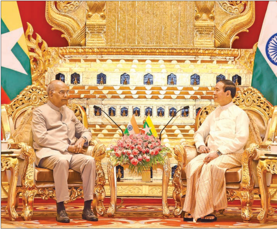
President U Win Myint receives President of India Shri Ram Nath Kovind at the Presidential Palace in Nay Pyi Taw yesterday.