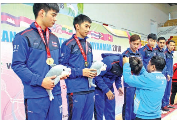
An official presents medals to the winners at the 19 th ASEAN University Games in Nay Pyi Taw.