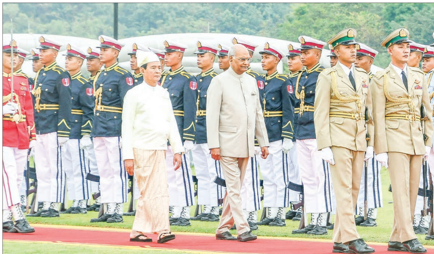
President of India Shri Ram Nath Kovind and President U Win Myint inspect the Guard of Honour at the Presidential Palace in Nay Pyi Taw.