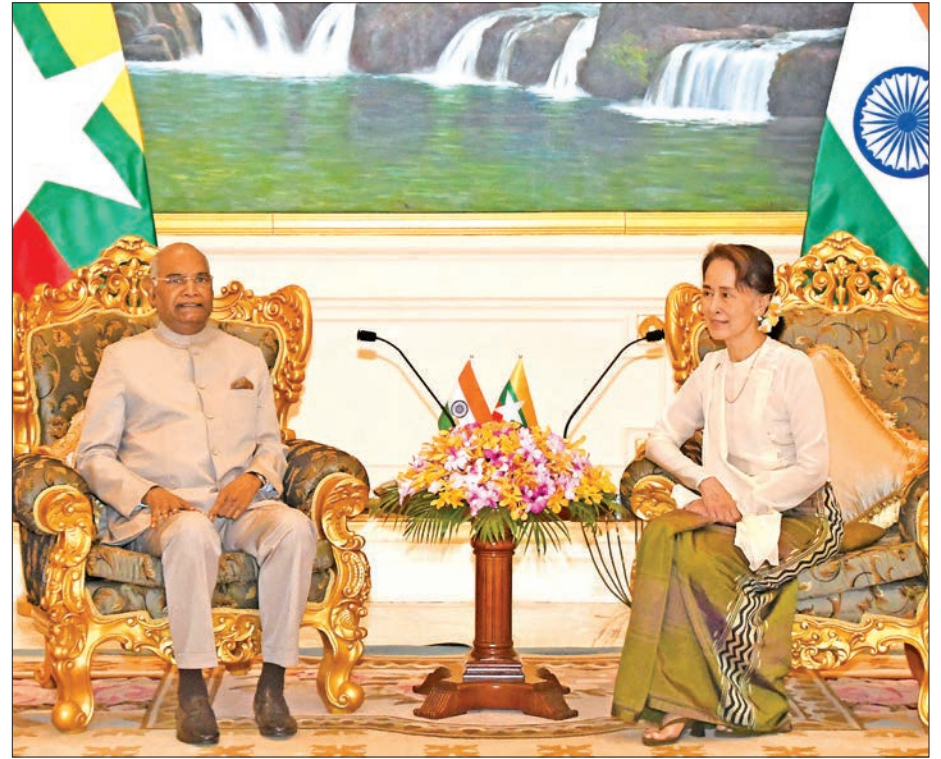
State Counsellor Daw Aung San Suu Kyi meeting with President of India Shri Ram Nath Kovind at the Presidential Palace in Nay Pyi Taw yesterday.