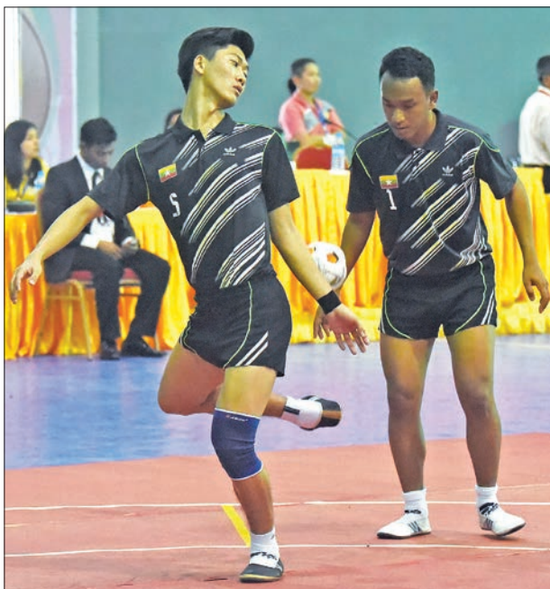
An athlete in action during a Chinlone game at the 19 th ASEAN University Games yesterday.