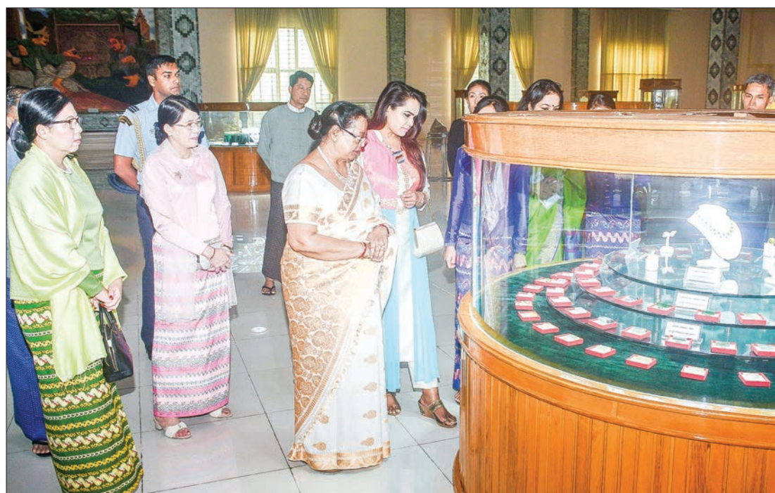
First Lady of India Smt. Savita Kovind visits Myanmar Gems Museum in Nay Pyi Taw.

FIRST Lady of India Smt. Savita Kovind and officials visited the jewellery galleries and gems market at the Myanmar Gems Museum in Nay Pyi Taw yesterday morning where Myanmar Gems Enterprise Man-