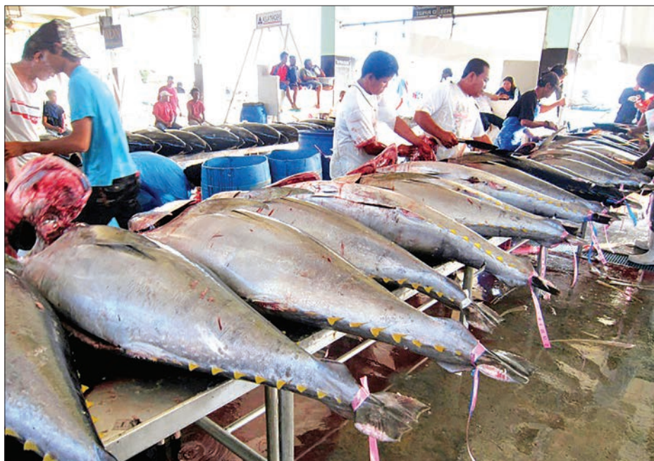
The Pacific accounts for almost 60 per cent of the global tuna catch, worth about $6.0 billion annually.

HONOLULU (United States) — Pacific island nations have vowed to oppose US efforts to increase its catch limit in the world's largest tuna fishery, saying the proposal does nothing to improve sustainable fishing.