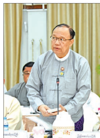
Union Minister U Thant Sin Maung.