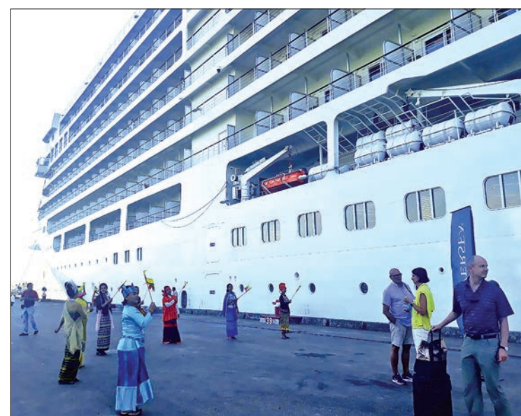
Myanmar women in ethnic dresses welcome tourists from Silver Muse vessel at the Thilawa Port in Yangon yesterday.