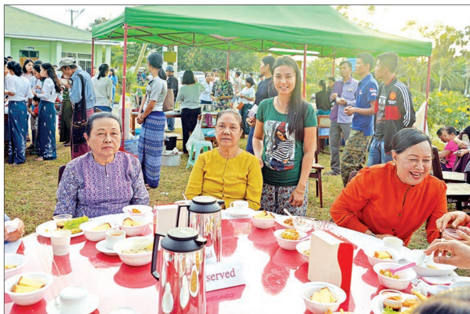
First Lady Daw Cho Cho (centre) visits the “Nibbana Market” festival in Nay Pyi Taw.

On this auspicious occasion of International Anti-Corruption Day and the 15 th Anniversary of the UN Anti-Corruption Convention, I wish to reaffirm the solemn pledge made by the Republic of the Union of Myanmar with regard to the aims and principles of the said convention. Furthermore, I send this Message of Greetings by expressing our solemn desire to work hand in hand and cooperate with other member countries as expressed in the United Nations motto “Let’s Unite to Combat Corruption”.