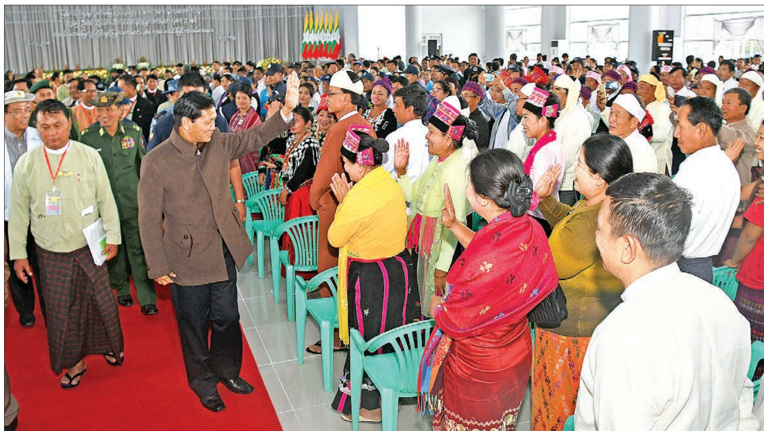
Vice President U Henry Van Thio cordially meets with local people at the ceremony to return released land in Mohnyin District to farmers and presenting of Temporary Land Use Permit Form 3 and Farmland Work Permit Certificate (Form 7) in Mohnyin yesterday.

The Central Committee for Scrutinizing Confiscated Farmlands and Other Lands was formed to quickly return the released land back to the farmers who were original owners and committees were formed in the