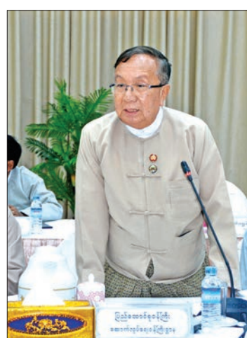
Union Minister U Han Zaw.

illegal goods worth about Ks. 1.3 billion.