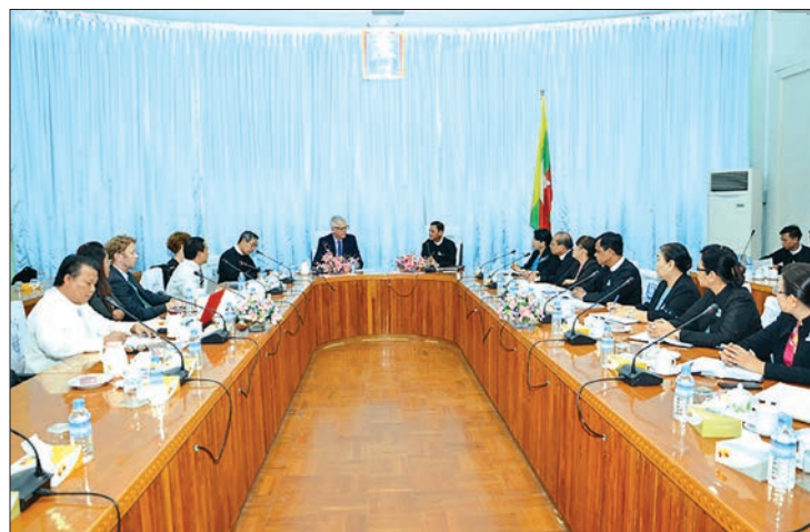
Fourth steering committee meeting on rule of law and human rights being held at the Union Attorney General's Office.