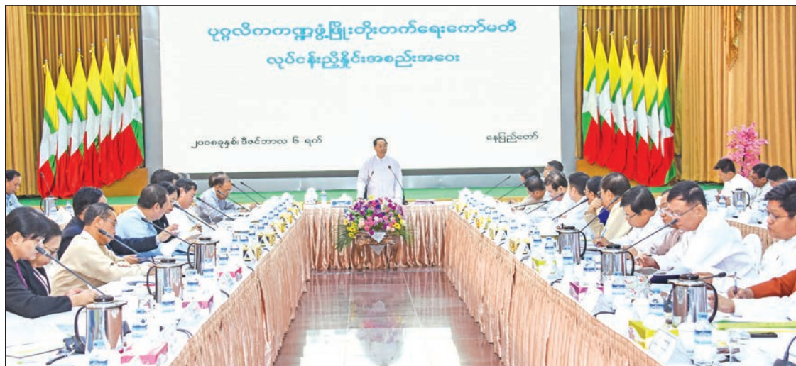
Vice President U Myint Swe address 8 th coordination meeting of Private Sector Development Committee in Nay Pyi Taw.

Illegal imports through the border is threatening the existence of micro, small and medium enterprises and special illegal trade prevention and control groups were formed in nine states and regions. The groups were found to be reasonably effective and in October there were a total of 59 cases of detaining