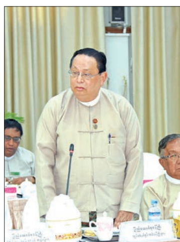
Union Minister U Win Khaing.