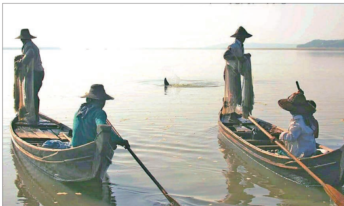
Fishermen catch the fish by throwing nets while a dolphin shows the position of the school of fish in the Ayeyawady River.

The survey to assess the population of the endangered species is conducted in February every year. According to the surveys, there were 69 adult dolphins, three babies, and three deaths in 2017, and 76 adult dolphins, eight babies and five deaths in 2018.