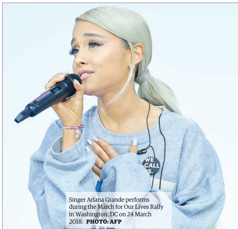
Singer Ariana Grande performs during the March for Our Lives Rally in Washington, DC on 24 March 2018.

The pop artist will release an album—also titled "Thank U, Next"—at a yet unannounced date.—AFP ■