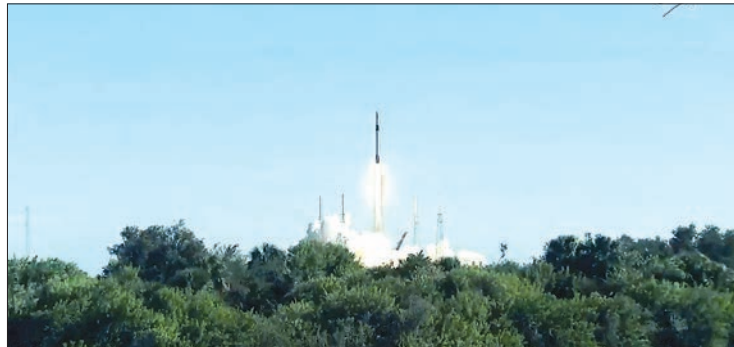
In this still photo from NASA TV, SpaceX launches its unmanned Dragon cargo ship to the International Space Station—the mission is SpaceX’s 16 th for NASA, as part of a long-term contract to ferry supplies to space.

“Engines stabilized rocket spin just in time, enabling an in-