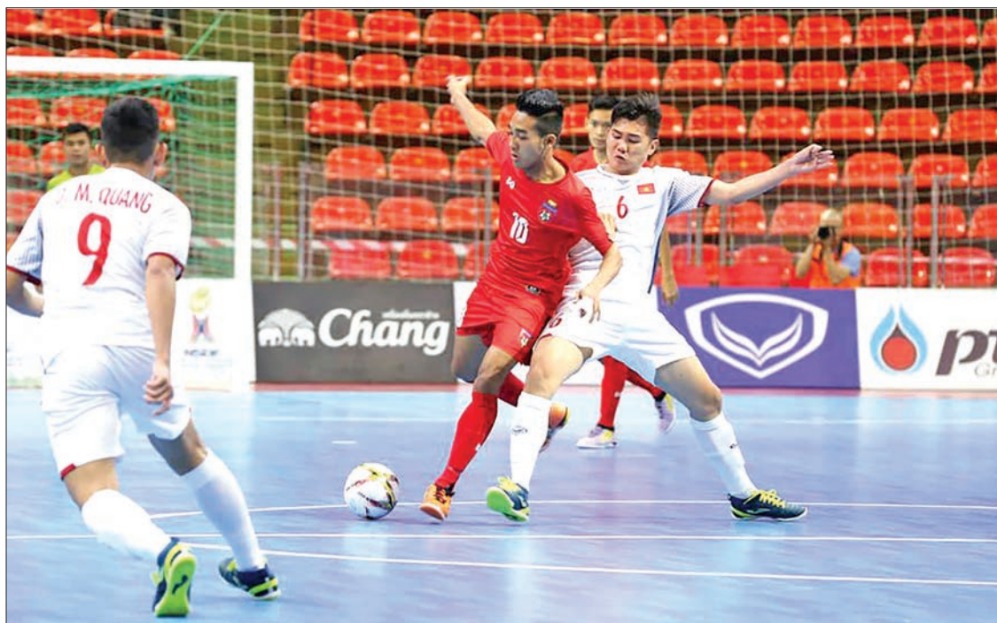
A player from Myanmar (red) vies for the ball with a player from Viet Nam (white) at AFC U-20 Futsal Championship ASEAN Zone qualifiers at Haumark Indoor Stadium in Bangkok, Thailand yesterday.