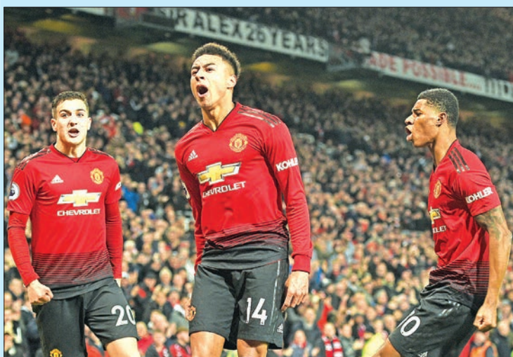
Manchester United's Jesse Lingard celebrates his equaliser in a thrilling 2-2 draw with Arsenal on Wednesday.

Herrera responded quickly, although replays suggested he may have been fractionally offside, reaching the loose ball on the by-line and turning it into the six-yard area where Martial was able to convert. That dramatic pattern would be repeated after 68 minutes when Arsenal regained a lead they could only hold, on this occasion, for 74 seconds. Lacazette played a one-two with fellow substitute Henrikh Mkhitaryan and advanced into the area where Rojo tackled him from behind and succeeded only in turning the ball into his own net. But there could be no faulting United's response as Arsenal panicked at a long ball punted forward, almost directly from kick-off.—AFP ■