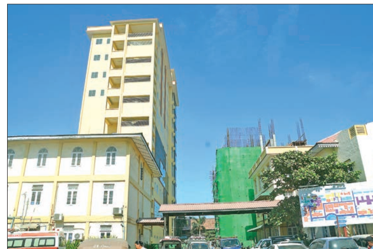
Two new 10-storey buildings have been undergoing construction at the Mandalay General Hospital in Mandalay.