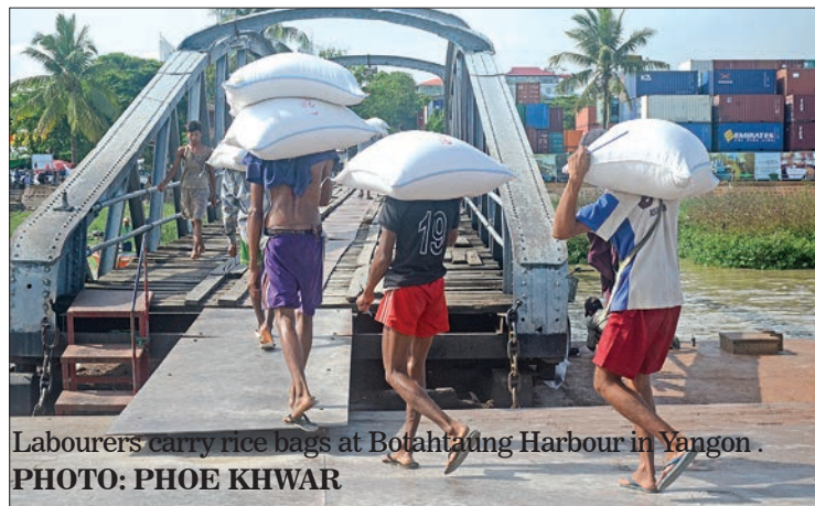
Labourers carry rice bags at Botahtung Harbour in Yangon.

Trade on the border has been comparatively higher than sea, accounting for 52.7 per cent of the total rice exports. The export of rice and broken rice through border checkpoints have earned an estimated $258 million. Exports over sea have fetched $220.7 million. Since the