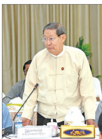
Union Minister U Soe Win.