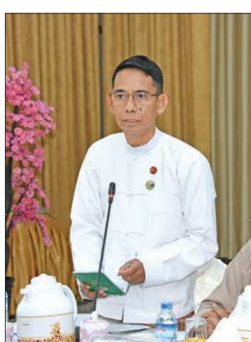
Union Minister Dr. Aung Thu.