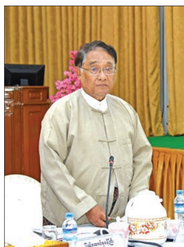
Union Minister Dr. Than Myint.