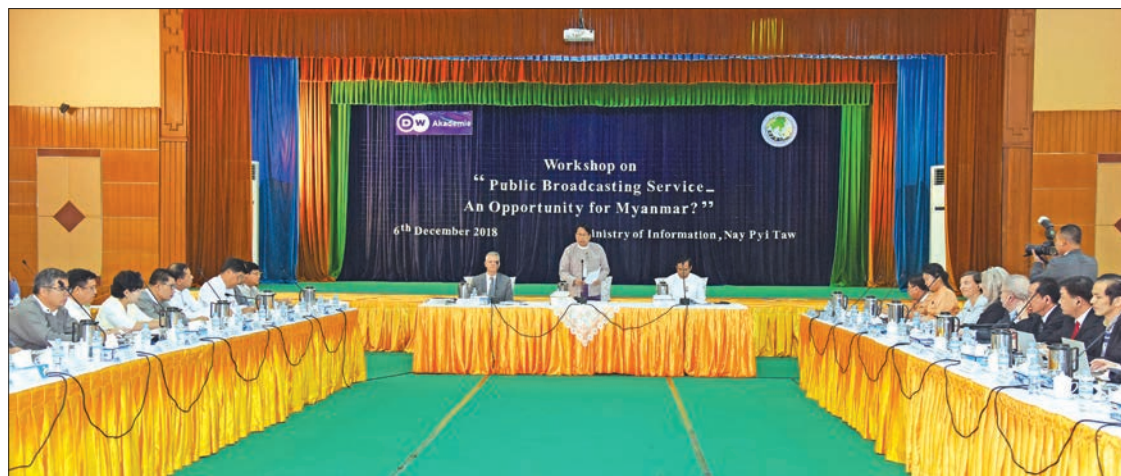
Union Minister for Information Dr. Pe Myint addresses the workshop on “Public Broadcasting Service—An Opportunity for Myanmar” in Nay Pyi Taw yesterday.

In his opening speech at the workshop, Union Minister Dr. Pe Myint discussed emergence of private media in Myanmar during the country’s transition to democracy; lack of relevant law and bylaws thus causing implementation of broadcasting effectively;