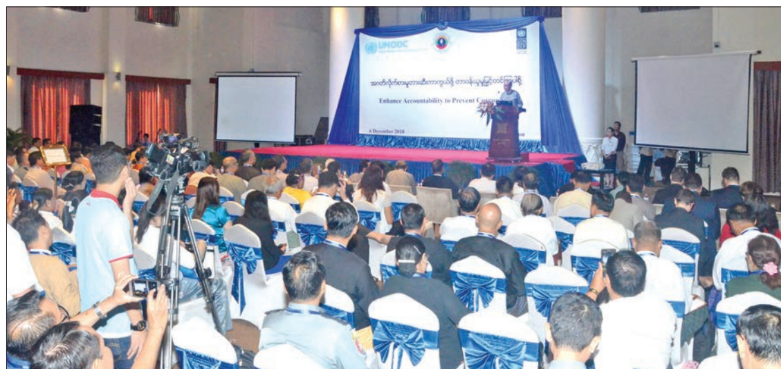
International Anti-Corruption Day Forum being convened in Yangon yesterday.

TO commemorate the International Anti-Corruption Day that falls on 9 December a 2018 International Anti-Corruption Day Forum was held under the theme "Enhance Accountability to Prevent Corruption" at the Rose Garden Hotel, Yangon yesterday morning.