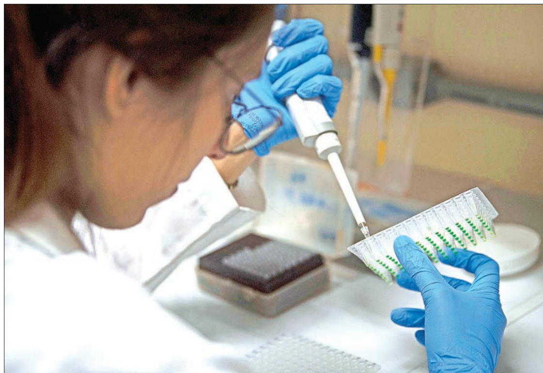
A student of the Federal University of Rio de Janeiro works at a biology laboratory.

“We are already cutting the number of students in our