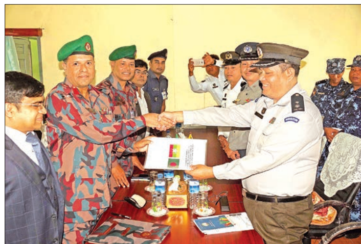
Myanmar officers (Right) exchange documents with Bangladeshi officers to hand over 17 Bangladeshi citizens.

Among the seventeen Bangladeshi citizens served prison time in Myanmar, 14 were arrested after they found strand-