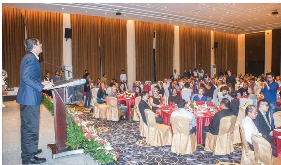
Deputy Minister U Aung Hla Tun delivers the speech at dinner in honour of 7 th Media Development Conference in Nay Pyi Taw.