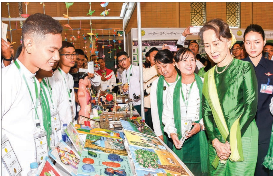
State Counsellor Daw Aung San Suu Kyi visits exhibition of student projects at conference on Implementation Education Development (Basic Education Sector) in Nay Pyi Taw.