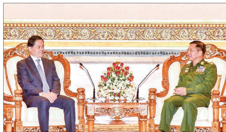
Senior General Min Aung Hlaing meets with Mr. Chan Hao, Secretary of the Yunnan Provincial Party Committee of the Communist Party of the People's Republic of China, in Nay Pyi Taw yesterday.