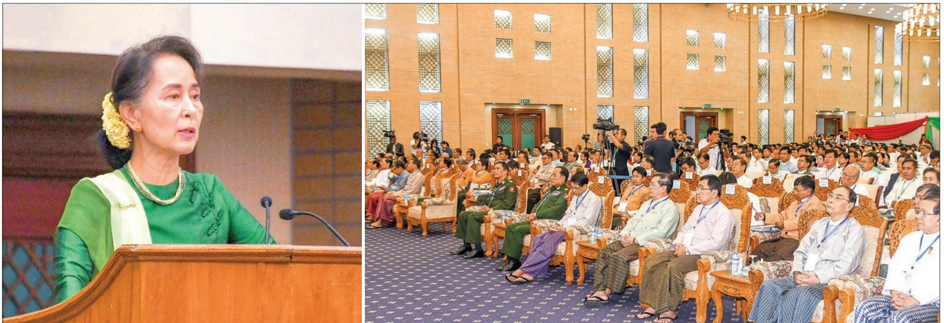
State Counsellor Daw Aung San Suu Kyi addresses the Education Development Implementation Conference (Basic Education Sector) in Nay Pyi Taw yesterday.

S TATE Counsellor Daw Aung San Suu Kyi addressed the Education Development Implementation Conference (Basic Education Sector) organized by the Ministry of Education at the Myanmar International Convention Centre 2 (MICC-2) yesterday morning.