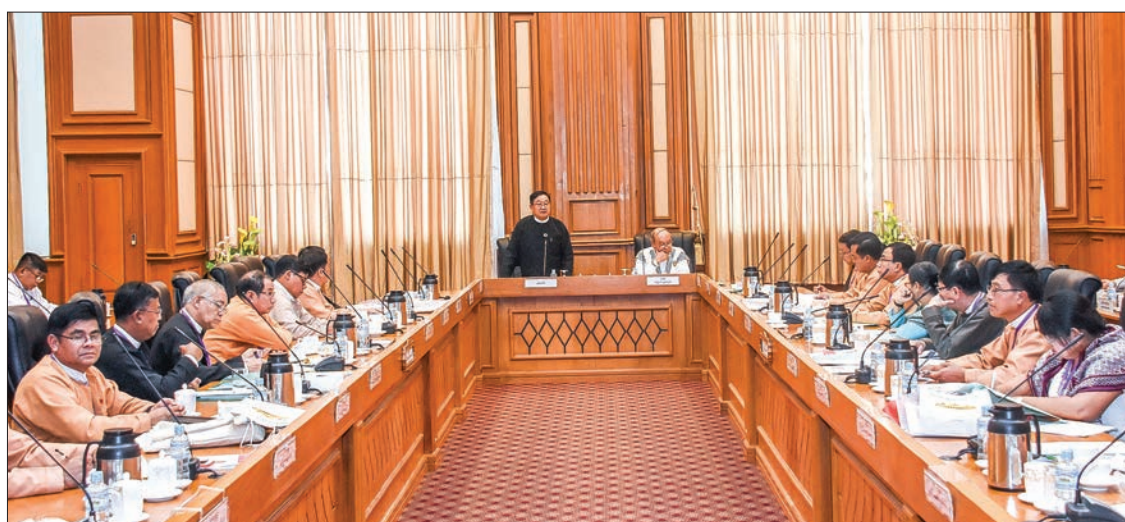
Pyithu Hluttaw Speaker U T Khun Myat delivers the speech at the Myanmar Parliamentary Union meeting in Nay Pyi Taw yesterday.

U T Khun Myat also stressed the important role of Hluttaws in putting checks and balances