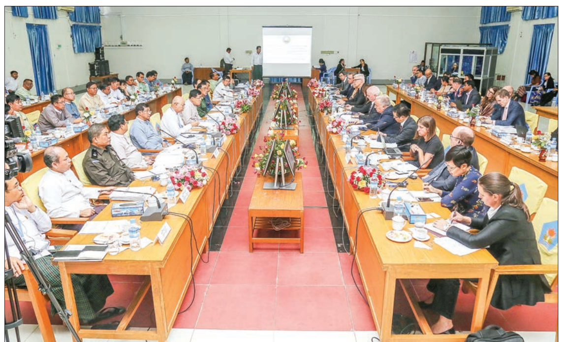
The meeting of the Committee for Implementation of Recommendations on Rakhine State, UN agencies and partner organizations held in Nay Pyi Taw yesterday.