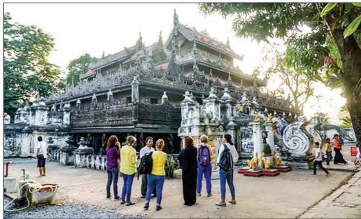
Tourists visit Mandalay Shwenandaw Monastery, Mandalay.

"Local and foreign tourists love to visit the monastery and its vicinity. The visitors are interested in observing the delicate art inside and outside the monastery, especially its paintings and sculptures. The structure of the Mandalay Shwenandaw Monastery is systematic. Myanmar people are proud of the ancient art and sculpture of their forefa-