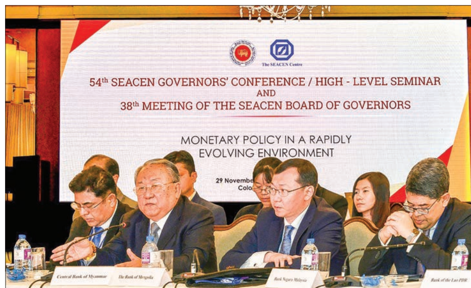
CBM Governor U Kyaw Kyaw Maung attends the 54 th SEACEN Governors' Conference in Colombo.