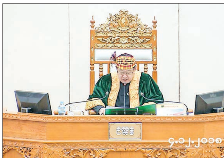
Pyithu Hluttaw Speaker U T Khun Myat.

U Kyaw Aung Lwin of Sedoktara constituency asked the Union government whether it plans to construct a suspension or Bailey bridge across the Mone Creek in the northern part of Sedoktara Township. The Deputy Minister replied that starting from fiscal year 2019-2020, funds will be ear-