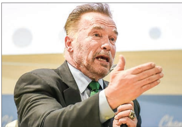
Arnold Schwarzenegger.

Schwarzenegger added a sprinkle of stardust to Monday’s opening session of COP24 climate talks in Poland, where nations must agree on a rulebook to limit global temperature rises and the devastating economic and health im-