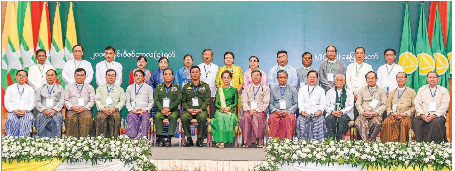
State Counsellor Daw Aung San Suu Kyi poses for photo together with union ministers and dignitaries at the Education Development Implementation Conference in Nay Pyi Taw.