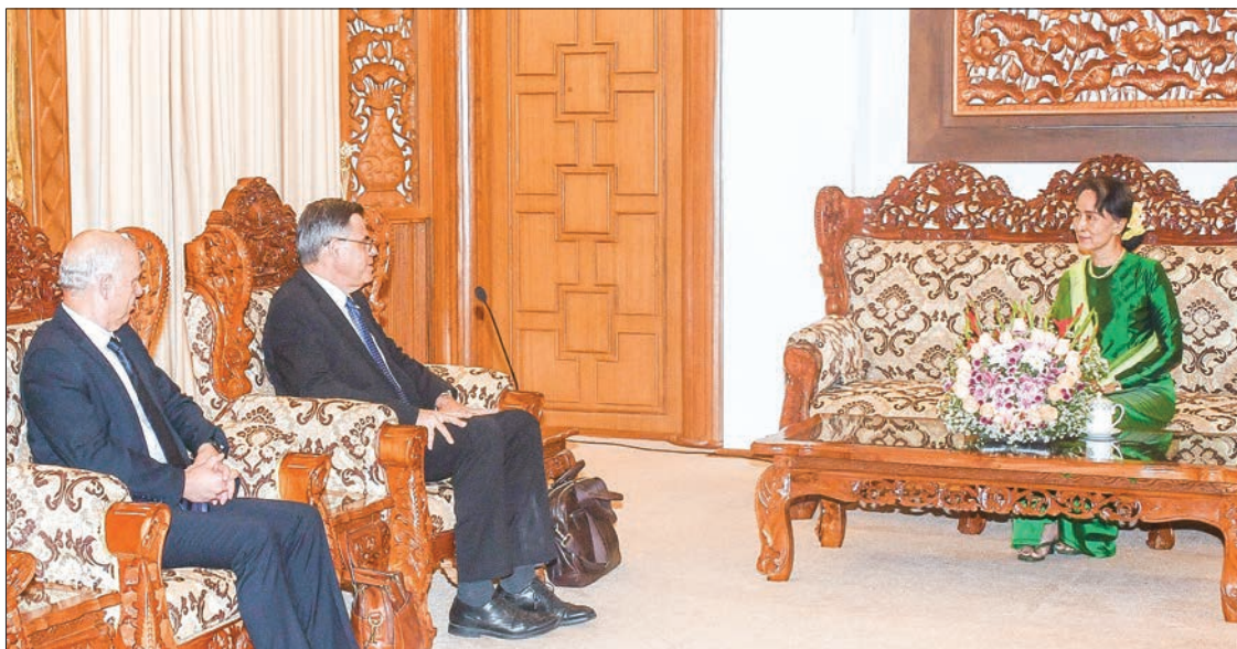
State Counsellor Daw Aung San Suu Kyi meets with Ambassador of the State of Israel to Myanmar Mr. Ronen Gilor in Nay Pyi Taw yesterday.

cordially discussed and exchanged views on matters relating to promotion of bilateral relations and cooperation, strengthening people-to-people contacts and enhancing agriculture, health care and vocational training sectors.—MNA ■