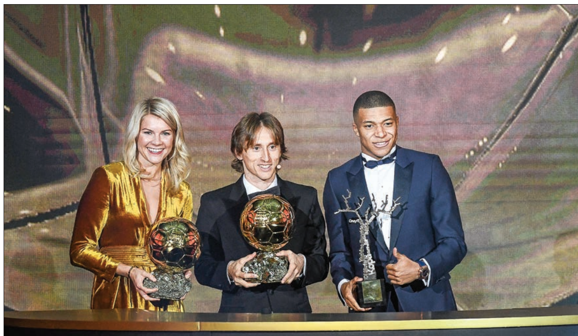
(FromL) 2018 FIFA Ballon d'Or awarded for best player of the year, Men's Ballon d'Or Real Madrid's Croatian midfielder Luka Modric, Women's Ballon d'Or Olympique Lyonnais' Norwegian forward Ada Hegerberg and Under-21 Ballon d'Or (Kopa trophy) Paris Saint-Germain's French forward Kylian Mbappe pose at the end of the 2018 FIFA Ballon d'Or award ceremony at the Grand Palais in Paris on 3 December, 2018.