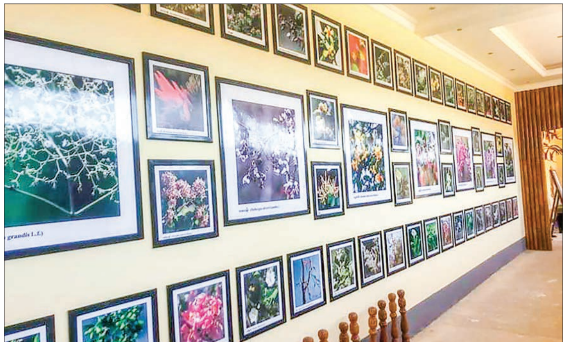
Photos of wildlife and flower patterns displayed at gallery in bat cave natural conservation area, Kanbalu Township. PHOTO: AUNG THANT KHINE

At a media conference held during the project's implementation period, Sagaing Region Chief Minister Dr. Myint Naing had said, "The bat cave natural conservation area will be opened to help students and travellers observe and learn about biodiversity, interaction between ecosystems, and the