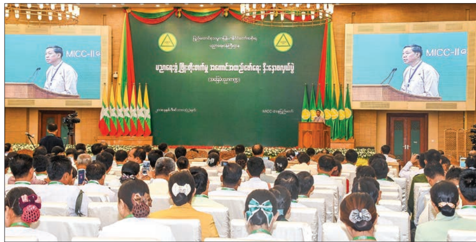
Union Minister Dr. Myo Thein Gyi delivers the speech at the Education Development Implementation Conference (Basic Education Sector) in Nay Pyi Taw.