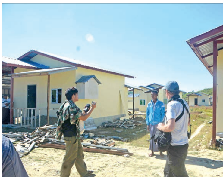
Foreign journalists interview a man at Mingyi Village in Maungtau Township, Rakhine State.