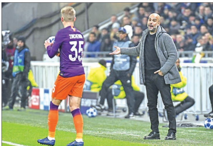
Pep Guardiola was again impressed by Lyon as Manchester City rallied for a draw in France.

“I see it as a final for qualification, but we go into it full of confidence because we're still unbeaten despite a lot of draws.” —AFP ■