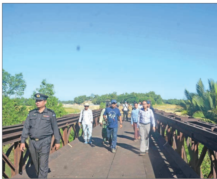
Foreign and local media visit the Myanmar-Bangladesh Friendship Bridge in Maungtau Township, Rakhine State.