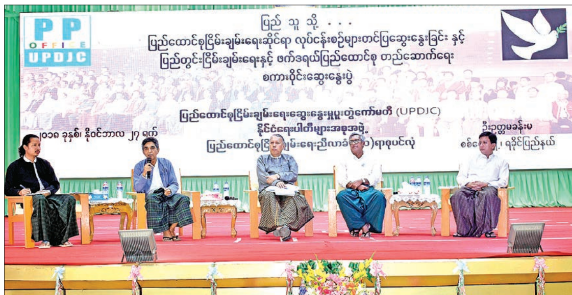
Talks on peace and building a federal union in progress in Sittway Township on 27 November, 2018.

The people of Myanmar had lived under the one party system and under the rule by a group of people for many years. Since 2010, Myanmar has practiced the