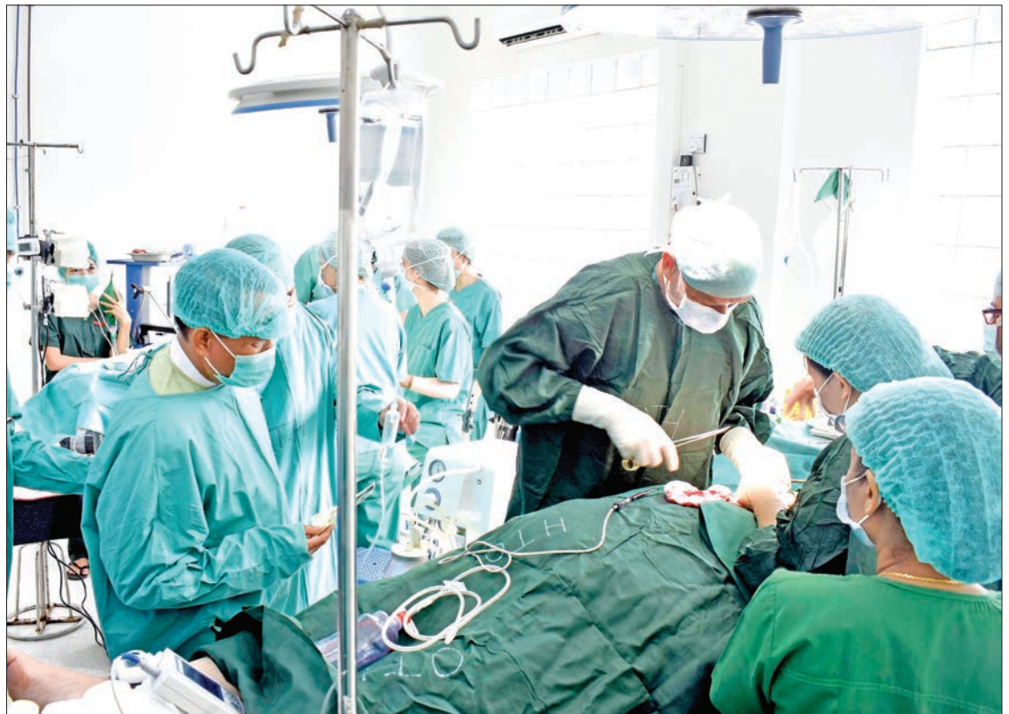
German specialists conducting free surgeries in Rakhine State from 26 th November to 5 th December, under the 8 th free operations program.