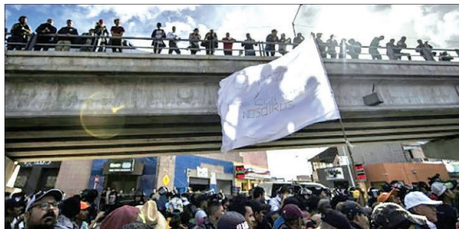
Migrants have played all their cards in recent days, after more than a month's trek across Central America and Mexico — but with little success.

But sneaking in through the desert alone is a perilous strategy. Hundreds of migrants die trying every year, of dehydration, hypothermia or snake bites. Seeking asylum in the United States is not much easier.