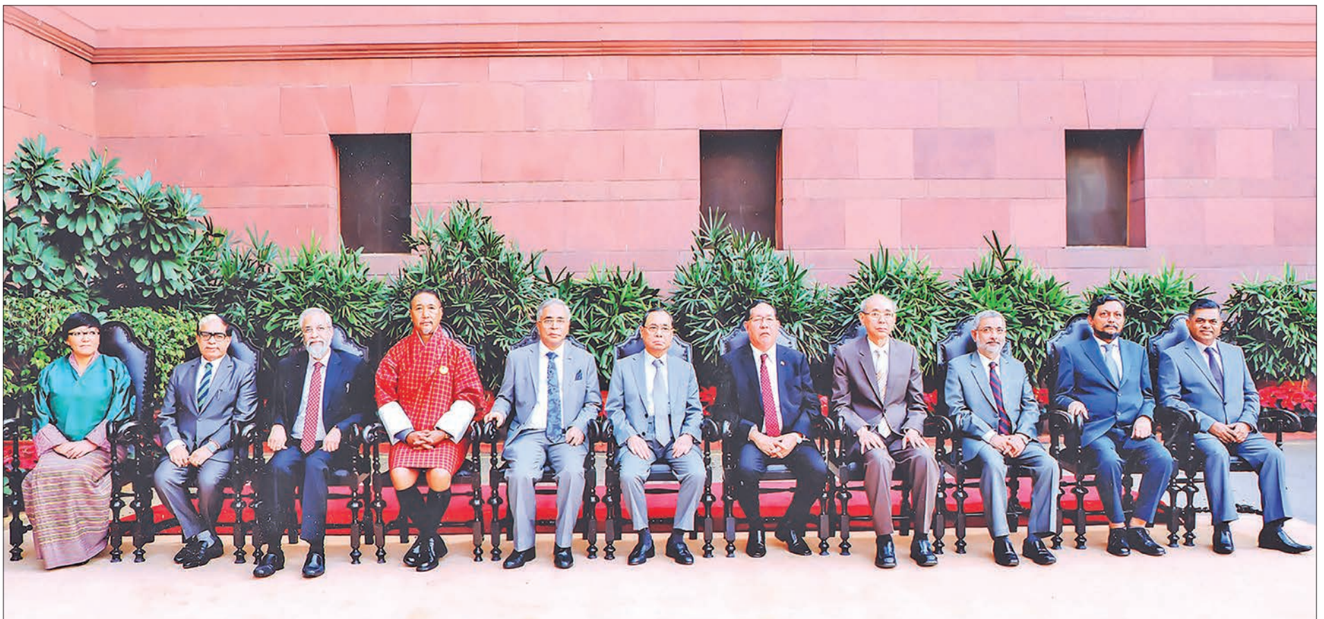
Chief Justice of the Union U Htun Htun Oo, (fifth from right) and heads of judiciary of BIMSTEC countries pose for photo.

CHIEF Justice of the Union U Htun Htun Oo attended the 'First Round Table of the Head of Judiciary of BIMSTEC (Bay of Bengal Initiative for Multi-Sectoral Technical and Eco-