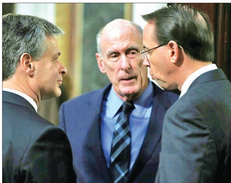
US Director of National Intelligence Dan Coats (C) will meet NATO defense and intelligence officials in Brussels to discuss President Donald Trump's decision in October to withdraw from the 1987 Intermediate-Range Nuclear Forces Treaty (INF).