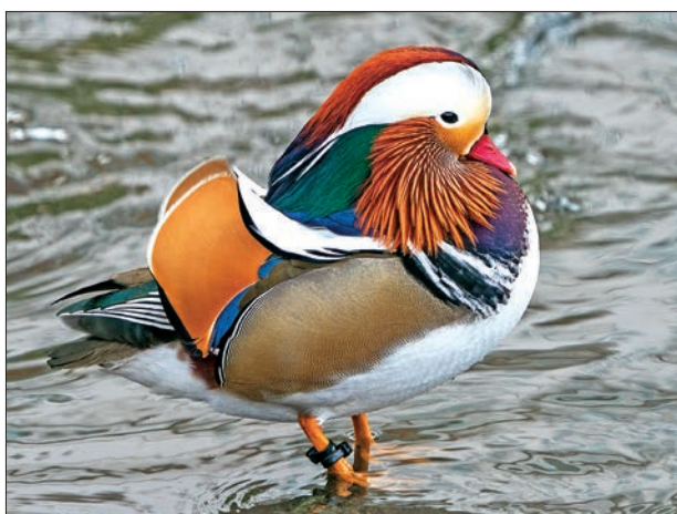
A Mandarin duck nicknamed Mandarin Patinkin has made a big splash for bird watchers and the general public at New York's Central Park.

The duck, whose species is native to East Asia