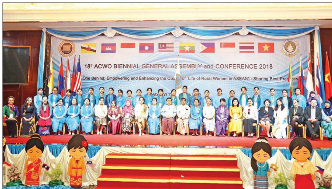
Union Minister Dr. Win Myat Aye and dignitaries pose for photo at 18 th ACWO Biennial General Assembly and Conference 2018.

The Myanmar Maternal and Child Welfare Association, the Myanmar Women and Children Life Promotion Organization, the Myanmar Women Entrepreneur's Association, the Gender Equality Network, the Women's Organizations