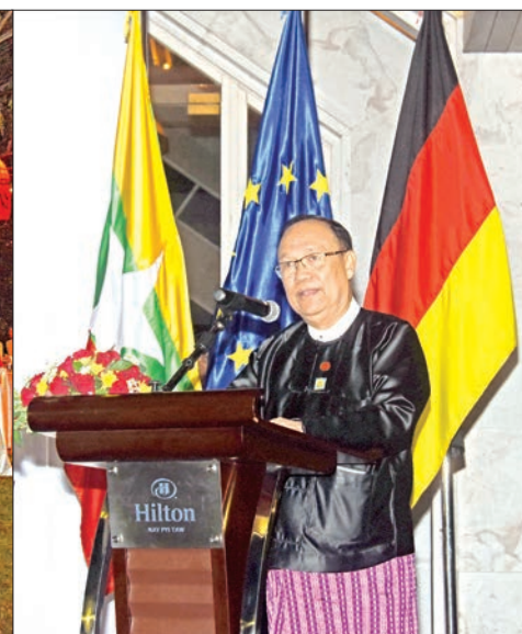
Union Minister for Transport and Communications U Thant Sin Maung delivers the speech at the ceremony to celebrate the German Unity Day organized by the German Embassy on 27 November, 2018.

The ceremony commenced with the playing of the national anthems of Germany and the Re-