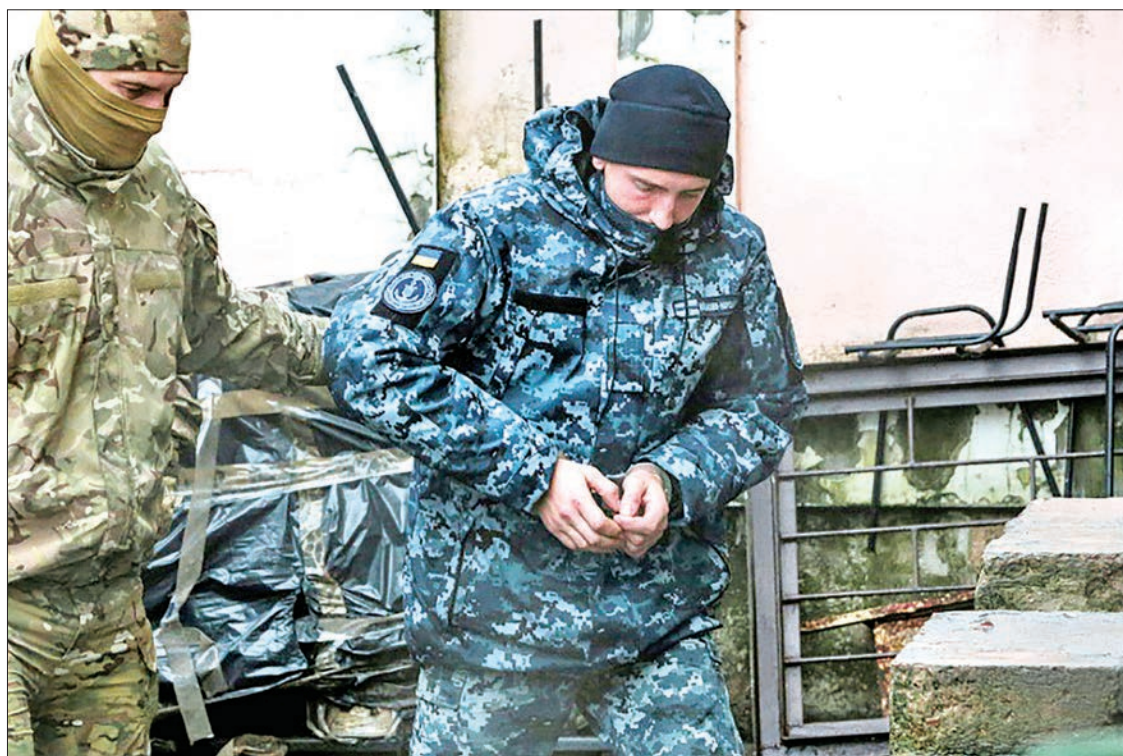
A court in Simferopol, the main city in Russian-annexed Crimea, ordered nine of the sailors to be held in pre-trial detention for two months. More are to appear before the court on Wednesday.

The Ukrainian parliament late on Monday voted in favour