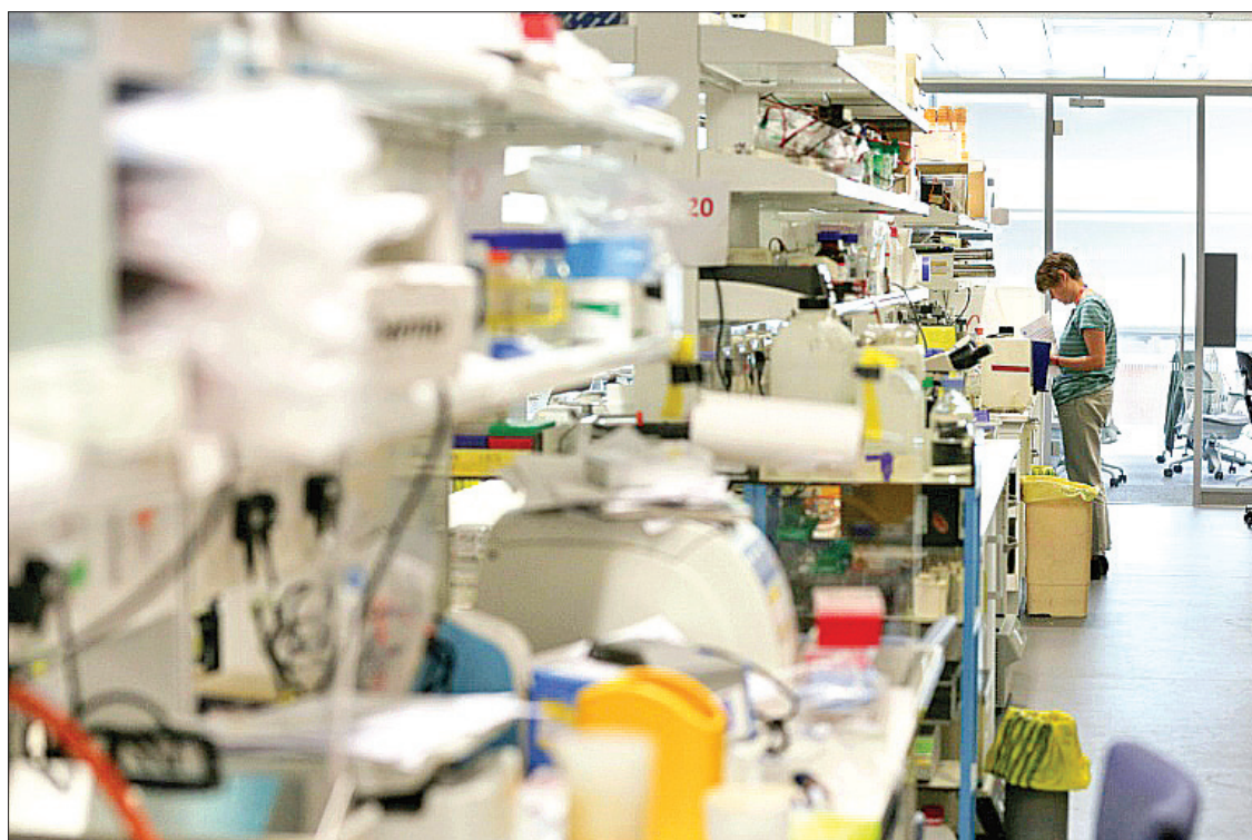
CRISPR technology has opened up enormous potential to battle genetic faults and diseases.

without teeth, cannot bite people. So we try to provide the teeth to the ministry head, so they can bite people when people violate the regulations," he told reporters in English at a gene editing conference in Hong Kong. "The mainland is very protective of scientists, if you make some small mistake, that's the end of it, there's no punishment. I suggest that they should be punished," he added.