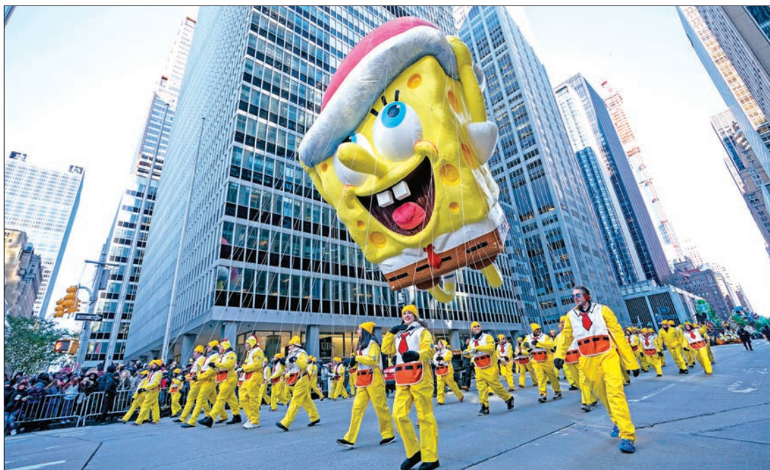
In this file photo taken on 22 November 2018 SpongeBob SquarePants floats above 6 th Avenue during the 92 nd Annual Macy’s Thanksgiving Day Parade in New York. Stephen Hillenburg, the biology teacher who created the wildly successful “SpongeBob SquarePants” children’s animation series has died, Nickelodeon announced on 27 November 2018.

“Steve imbued SpongeBob SquarePants with a unique sense of humor and innocence that has brought joy to generations of kids and families everywhere. “His utterly orig-