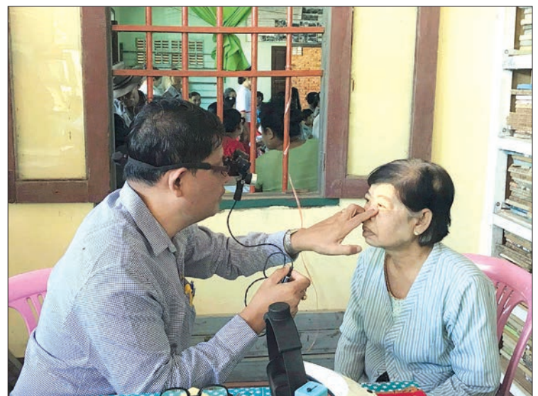
An eye specialist provides medical check up to a woman in Bago.