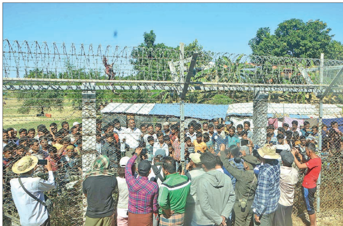
Journalists meeting with displaced people living at the border.

The mediapersons also visited Mingyi Village and took a tour of newly constructed houses for villagers. During the visit, they interviewed the head of the village about the livelihood of the villagers and the aid they received, their