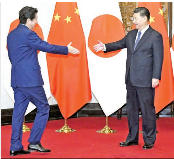
Chinese President Xi Jinping (R) greets Japanese Prime Minister Shinzo Abe prior to their talks in Beijing on 26 October 2018.