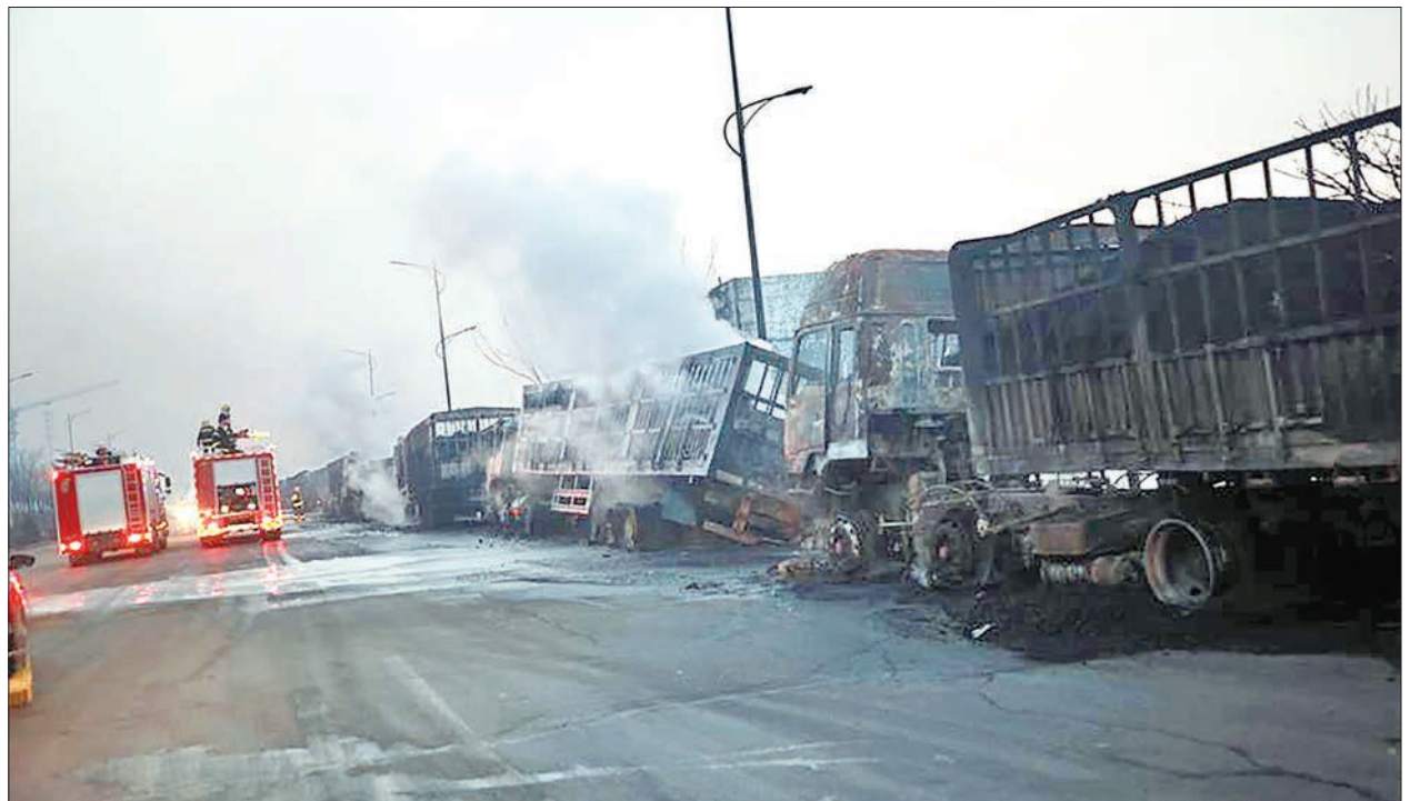
Photo taken on 28 November 2018 shows the blast site near Shenghua chemical plant in Zhangjiakou City, north China's Hebei Province. The blast has killed 22 people and injured 22 others early Wednesday morning, local authorities said.

Local government is verifying the identities of the victims. Rescue work and further investigation are underway. — Xinhua ■