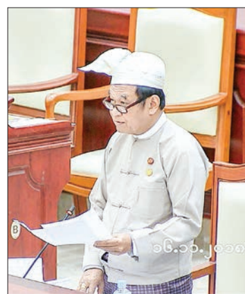
Union Minister for Health and Sports Dr. Myint Htwe.

Afterwards, U Ar Moe Si of Khaunglanphu constituency tabled a motion urging the Union Government to draw up a plan