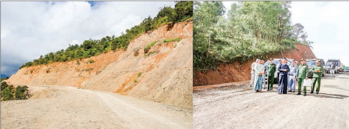
Union Minister Lt-Gen Ye Aung and officials inspect an asphalt road under construction in Southern Shan State.

UNION MINISTER for Border Affairs Lt-Gen Ye Aung accompanied by Shan State Minister for Security and Border Affairs Colonel Hla Oo, Minister for the transport and communication U Khun Ye Htwe and Eastern Command Deputy Commander Brig-Gen Win Zaw Moe inspected Kyaukgu–Naung Woe road in Yaksawk Township, Southern Shan State and Pa’O Self-Administered Zone on 14 November. They inspected the completion status of constructing (5/0) mile asphalt road, (15/0) mile gravel road constructed with fund from fiscal year 2017-2018 and two 25-ft concrete bridges and three 8 ft. box culverts constructed with first six months fund from fiscal year 2018-2019. The Union Minister coordinated on matters submitted by officials.