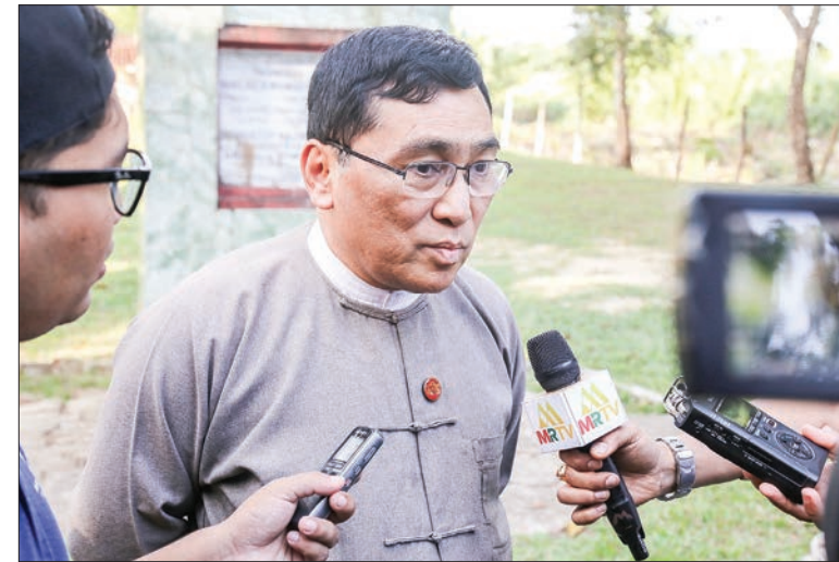
Union Minister for Social Welfare, Relief & Resettlement Dr. Win Myat Aye.

"For Myanmar's side, there's a Repatriation and Resettlement Committee and two working committees. The chairman of the committees are the deputy minister for home affairs and the Rakhine state