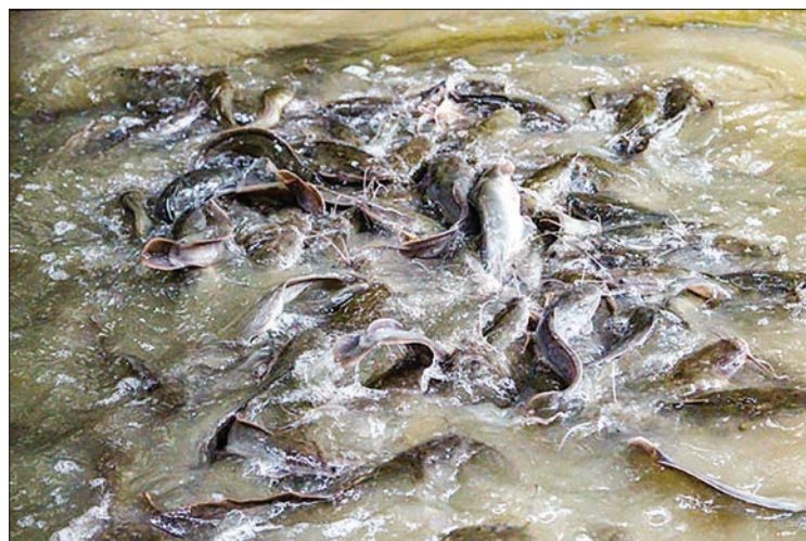
Freshwater catfishes are seen at a small-scale fish farm.

Striped catfish started to penetrate the export market last year. As demand for the fish has been growing significantly, the MFF has been urging fish farmers to increase area under striped catfish production in the past few months. As a result, the