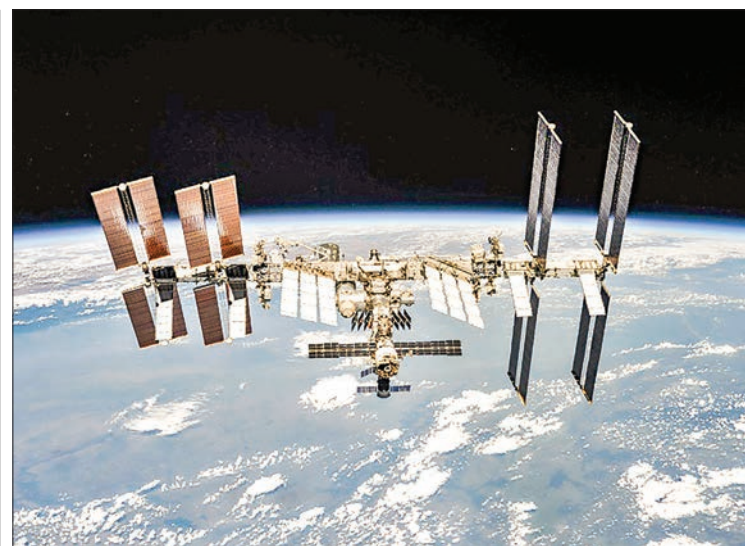
The International Space Station has been awaiting resupply since a Soyuz rocket carrying three people failed last month.