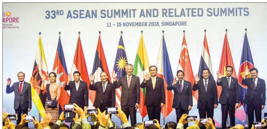
State Counsellor Daw Aung San Suu Kyi poses for a photo with other ASEAN leaders at the 33 rd ASEAN Summit and related summits in Singapore.

THE Myanmar delegation led by Daw Aung San Suu Kyi, State Counsellor of the Republic of the Union of Myanmar, arrived back Nay Pyi Taw International Airport yesterday afternoon after attending the 33 rd ASEAN Summit and Related Summits held in Singapore from 12 to 15 November 2018.