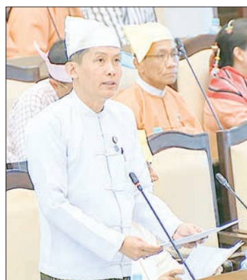
Deputy Minister for Electricity and Energy Dr. Tun Naing.

Replying to her question, the Deputy Minister for Electricity and Energy, Dr. Tun Naing, said that 66 / 11 kV of Pindaya will be distributed to three villages, including Seekyainn, Myayni (South), and Parmei villages. He said the NEP has been formulated to provide power supply in the first phrase. "A transformer will be built for Htut Ni village, and a 11 kV distribution power line (3.8 miles) and a 11/0.4 KVA transformer will be built for Seekya Inn Village. To provide power to Myayni (South) Village, a transformer will be built using 11 KV power line (0.5 miles), 11 / 0.4KV-100 KVA transformer through the Seekya Inn village. For Parmei village, a 11 KV power line (1.2 miles) and a 11 / 0.4 KV, 100 KVA transformer will be built to get power supply through Myayni