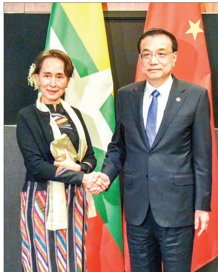
State Counsellor Daw Aung San Suu Kyi shakes hands with Mr. Li Keqiang, Premier of the People's Republic of China, (Right) in Singapore.

State Counsellor also pointed out that while in the view of many countries, the Myanmar Government is biased for the Rakhine people, the Myanmar people view that the international community is totally biased in favour of the other community. She added that if Myanmar resolved the Rakhine issue in a short sighted approach, it would hurt the stability and the future of the country and that it would be no one else but our own people to suffer the consequences. She apprised him of the measures taken by Myanmar Government to start the repatriation of first batch of displaced persons from Rakhine State and to address the