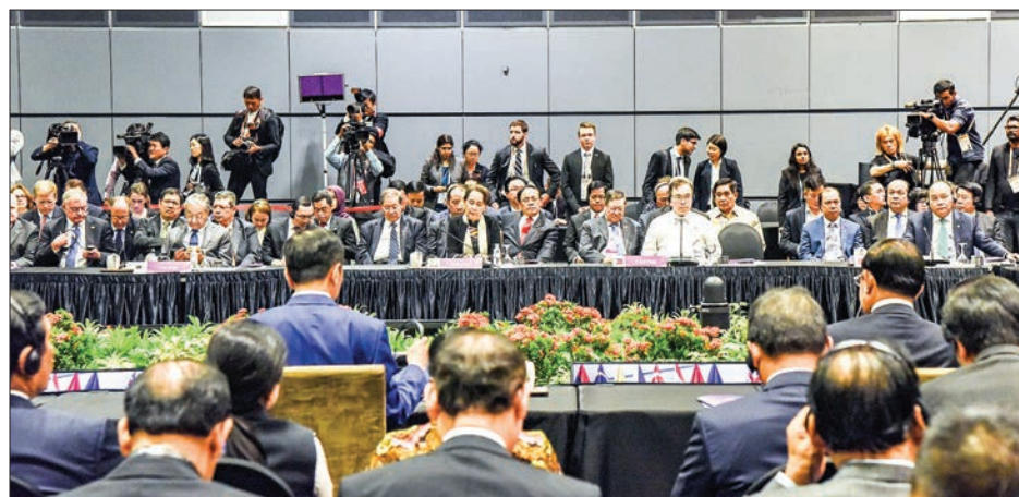
State Counsellor Daw Aung San Suu Kyi attends the 13 th East Asia Summit held in Singapore.

At the 33 rd ASEAN Summit, the leaders discussed and exchanged views on matters relating to building a Resilient and Innovative ASEAN, ASEAN's external relations and future direction, regional and international issues. With regard to Rakhine issue, the ASEAN Leaders highlighted its complexity and noted the agreement between Myanmar and Bangladesh to commence the repatriation of the first batch of verified displaced persons to Myanmar. The Leaders recognized the need for ASEAN to play a role in rehabilitation and humanitarian assistance and welcomed the invitation extended by Myanmar to the AHA Centre to dispatch a needs assessment team to identify possible areas of cooperation in Rakhine State to facilitate the repatriation process. The ASEAN Leaders also expressed their continued support for Myanmar in its efforts to bring peace, the rule of law, to promote harmony and reconciliation among the various communities and to ensure sustainable and equitable development in Rakhine State.