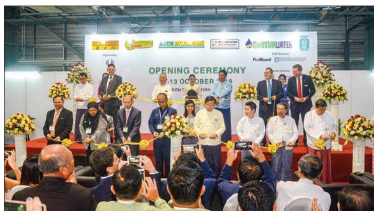
Press conference of the Myanmar Commerce Fair 2018 opened in Yangon on 15 November.

At the event, lectures will be conducted on every sector of the economy. There will lectures on 'Union Budget and Fiscal Transparency/ Pres-