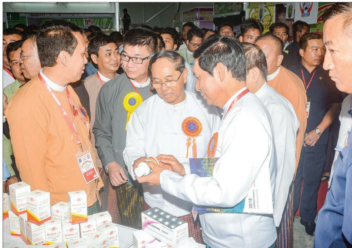
Vice President U Myint Swe inspects products displayed at the 7 th MSME Exhibition in Yangon.

Vice President U Myint Swe, Union Minister U Khin Maung Cho and officials then attended the opening ceremony of SME Center held at the SMIDB on Pansodan Street, Kyauktada Township, Yangon. — MNA ■ (Translated by Zaw Min)