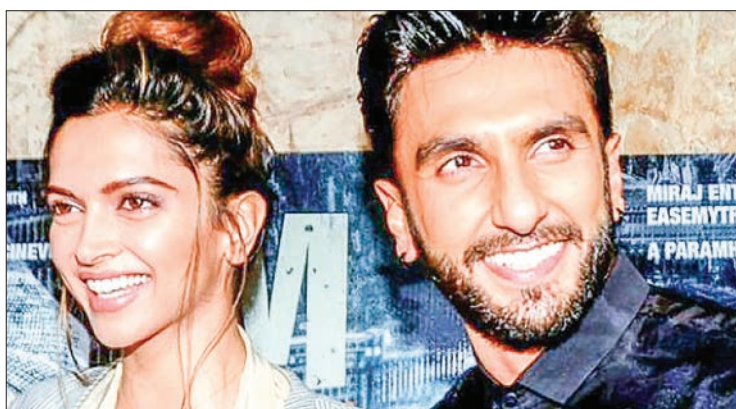
Indian Bollywood actors Deepika Padukone and Ranveer Singh have reportedly married in Italy.

Hindi film director Karan Johar, a friend of the couple, tweeted his congratulations. —AFP ■