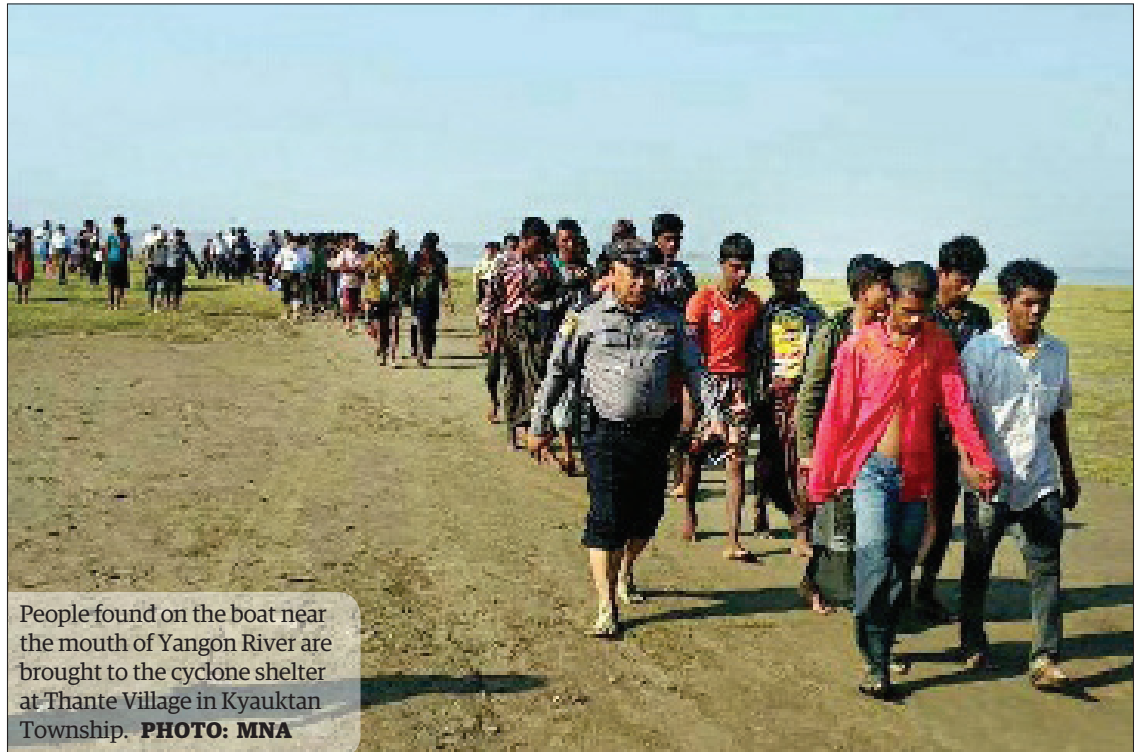
People found on the boat near the mouth of Yangon River are brought to the cyclone shelter at Thante Village in Kyauktan Township.

After local authorities found the boat, it was inspected by a combined team led by the head of the Kyauktan Township's General Administration Office, and comprising officials of the Kyauktan Township's Police Force and the Kyauktan Township Immigration and Population Department. Officials found the boat carrying 50 men, 31 women, 13 boys, and 12 girls left the Narzi IDP camp, Rakhine State, on 22 October and was on its way to Thailand and Malaysia when it ran out of fuel. The boat's passengers