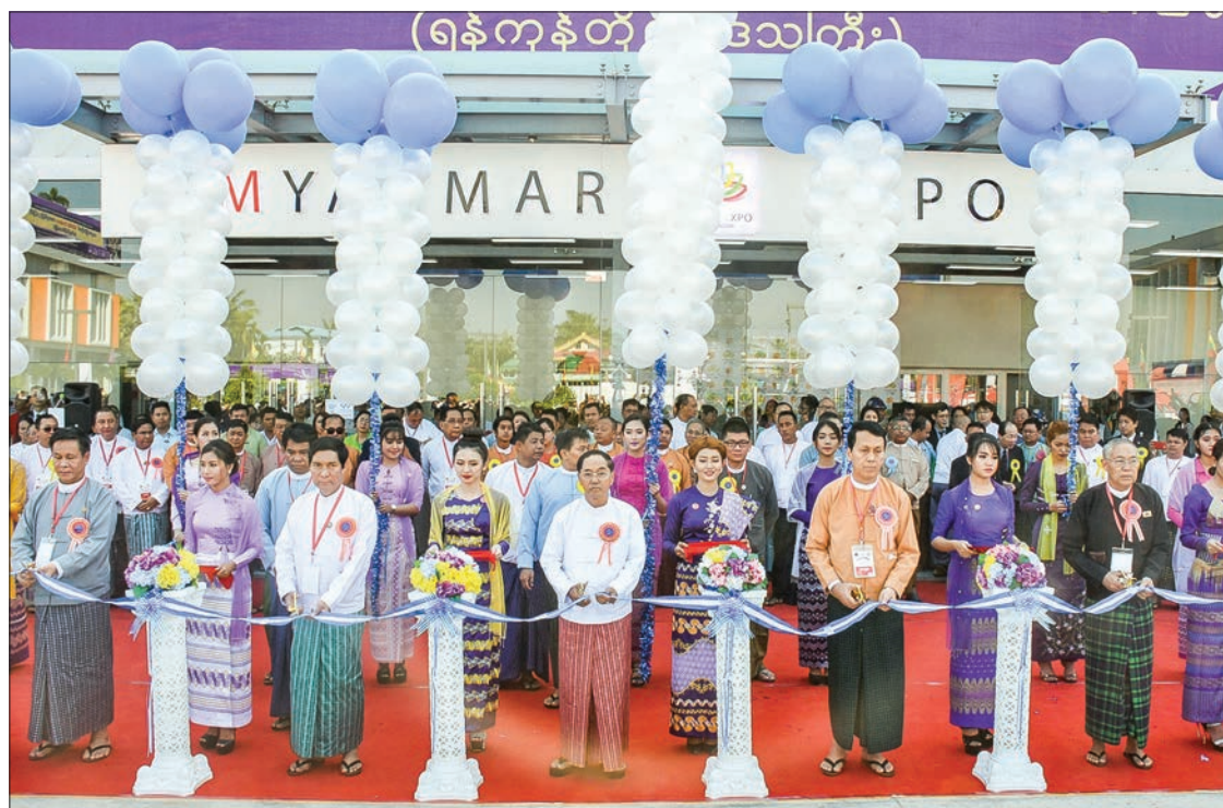
Vice President U Myint Swe, centre, cuts ceremonial ribbon to open the 7 th MSMEs Product Exhibition and Competition in Yangon.

“In each country of the world businesses were conducted in many forms and had been transforming. Now is the time when information technology is used to transform towards a digital economy and MSMEs in our country need to strive towards going along with the transformation and to use digital technology in