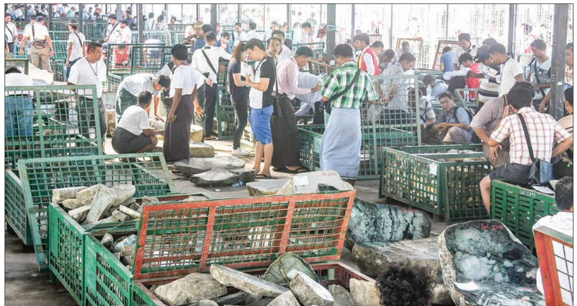
Gems merchants evaluate raw jade stones at Gems Emporium in Nay Pyi Taw.

On 14 November, 96 gems lots were put on sales through the open tender system and the emporium made 794.90 million kyats from the sales