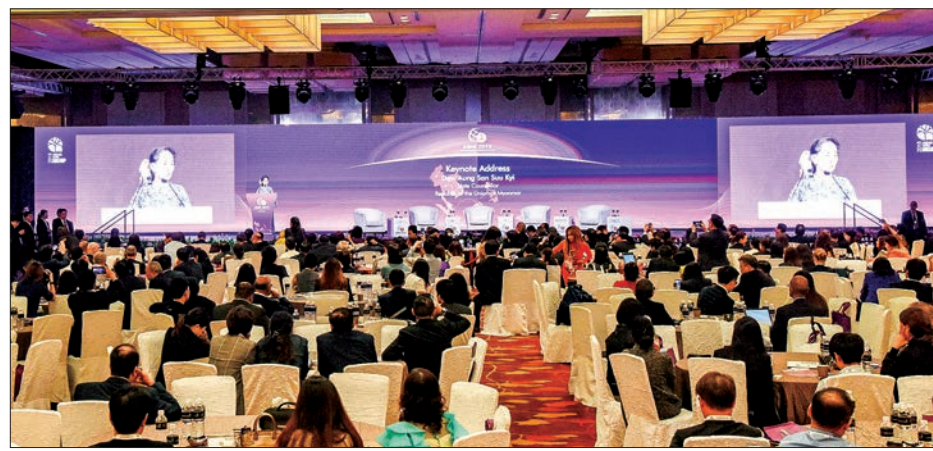
State Counsellor Daw Aung San Suu Kyi delivers the keynote speech at the ASEAN Business and Investment Summit-2018 in Singapore.

In response to the comments about Rakhine issue, the State Counsellor said that Myanmar listens to the voices of concern of some of our ASEAN friends and is grateful for the support to resolve the problem. She informed the meetings of the agreement made between Myanmar and Bangladesh to commence the repatriation of the first batch of displaced persons and explained that there are many areas which our ASEAN friends would like to help us in facilitating development, repatriation and enabling us to ensure security for all communities in Rakhine State. She said that Myanmar has been negotiating with ASEAN as to how AHA Centre could help to facilitate the repatriation process since it would be able to contribute not only in the way of helping us practically but also in the way of providing confidence for all around, making the displaced persons feel that they can be safe. She underscored the Government's continued efforts in ensuring the harmony and peace among different communities not only for the repatriation process but also for the future since they have to live together for many years.