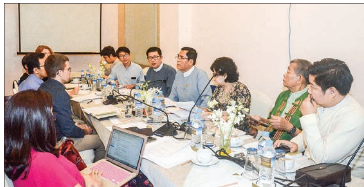
Deputy Minister U Aung Hla Tun holds the meeting with personnel from private media over preparation for holding 7 th Conference on Media Development.

Republic of the Union of Myanmar Office of the President Order 39/2018 9 th Waxing of Tazaungmone, 1380 ME (16 November 2018)