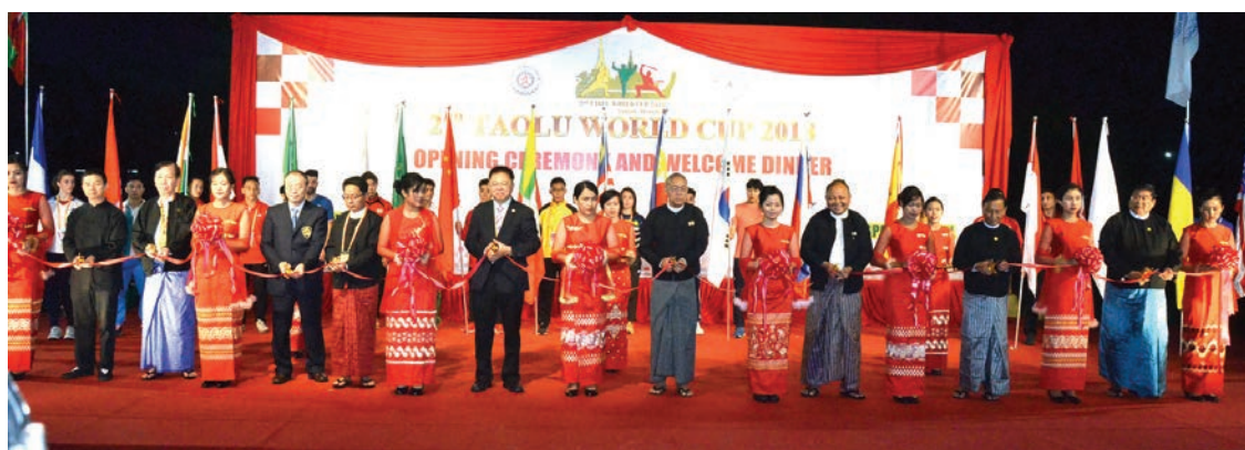
Officials open the 2nd Taolu World Cup 2018 at the Myanmar Sports Hotel in Yangon yesterday.