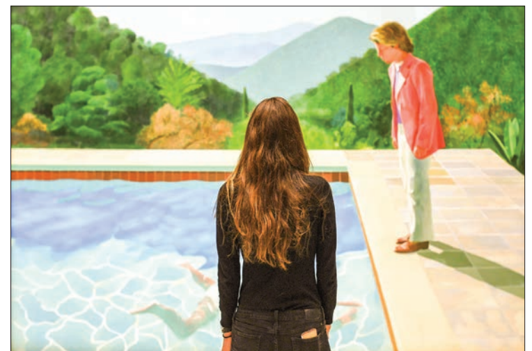
A woman looks at David Hockney's "Portrait of an Artist (Pool with Two Figures)".