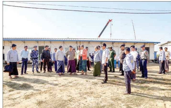
Union Ministers U Thein Swe and Dr. Win Myat Aye, and Rakhine State Chief Minister U Nyi Pu inspect Hla Pho Khaung Reception Centre yesterday.

Meanwhile, a 230-KV transmission line linking Mawlamyine and Myawady and a 230 KV 100 MVA sub-power station are being constructed in Myawady, and the construction are expected to be finished in march 2019.—MNA ■ (Translated by JT)