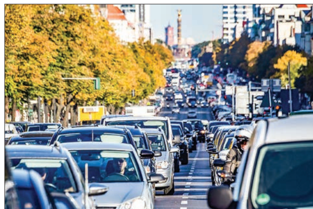
The German government is to ease air pollution laws aimed at curbing diesel vehicle use in urban areas.

“We will secure the right for clean air in all cities in 2019, the courts will ignore the weakening of the thresholds,” he added. DUH plans to sue the federal government for breaking EU law if it presses ahead with the changes.—AFP ■