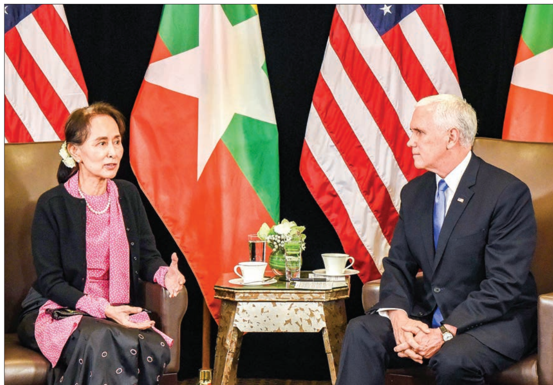
State Counsellor Daw Aung San Suu Kyi holds talks with Vice-President of the United States of America Mr. Michael Pence in Singapore.

Myanmar to overcome the challenging issue of Rakhine State and expressed that the United States will continue to support for the success of Myanmar's democratization process. — Ministry of Foreign Affairs ■