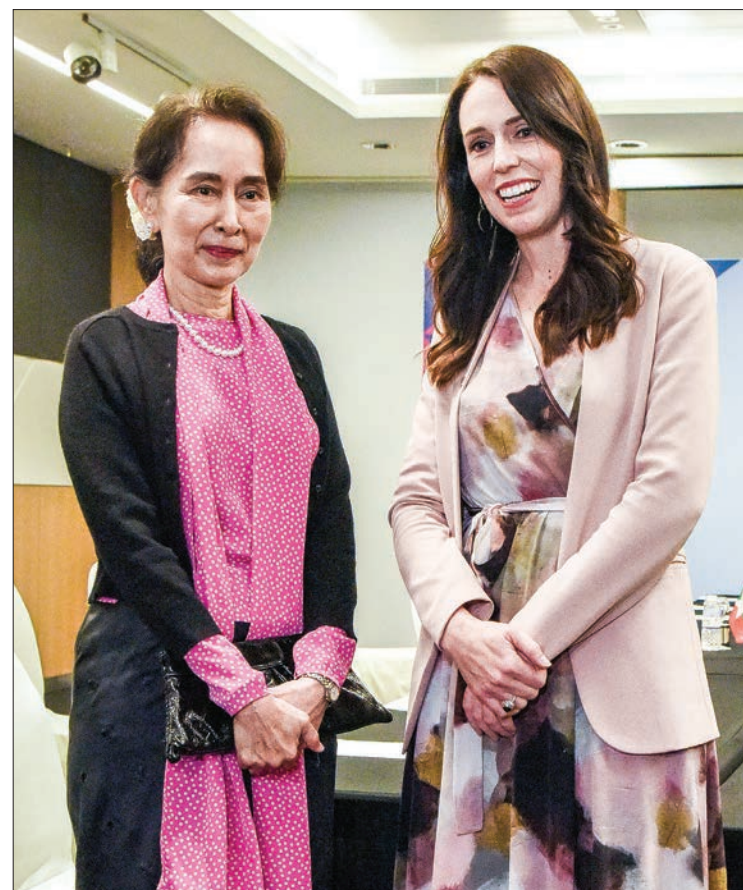
State Counsellor Daw Aung San Suu Kyi meets with Prime Minister of New Zealand Rt. Hon Jacinda Ardern in Singapore.