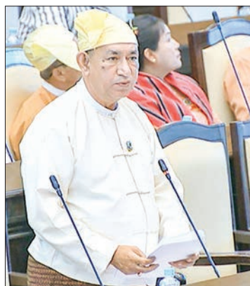
Deputy Minister for Natural Resources and Environmental Conservation Dr. Ye Myint Swe.

U Bawi Khing of Chin State's Constituency 3 asked if the government planned to construct windmills in Chin State. Deputy Minister for Electricity and Energy, Dr. Tun Naing, said eight Wind Measurement Towers had been set up in Lort Lan of Chin State, in Yebawgyi of Rakhine State, in Chaungtha of Ayeyawady Region and in Taungtat and Wathinka of Yangon Region by the China Three Gorges Corporation (CTGC). To study wind speed and pressure, the Asia Eco-energy Development and Primus