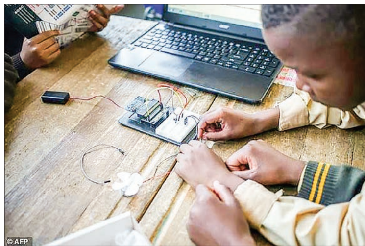
Pupils at the coding club in Ivory Park take wires from the breadboard — the base for building an electronics circuit — to a fan that they will programme to work from a laptop.

A 2018 report by McKinsey highlights that 45 per cent of all current tasks could be automated with present technology. —AFP ■