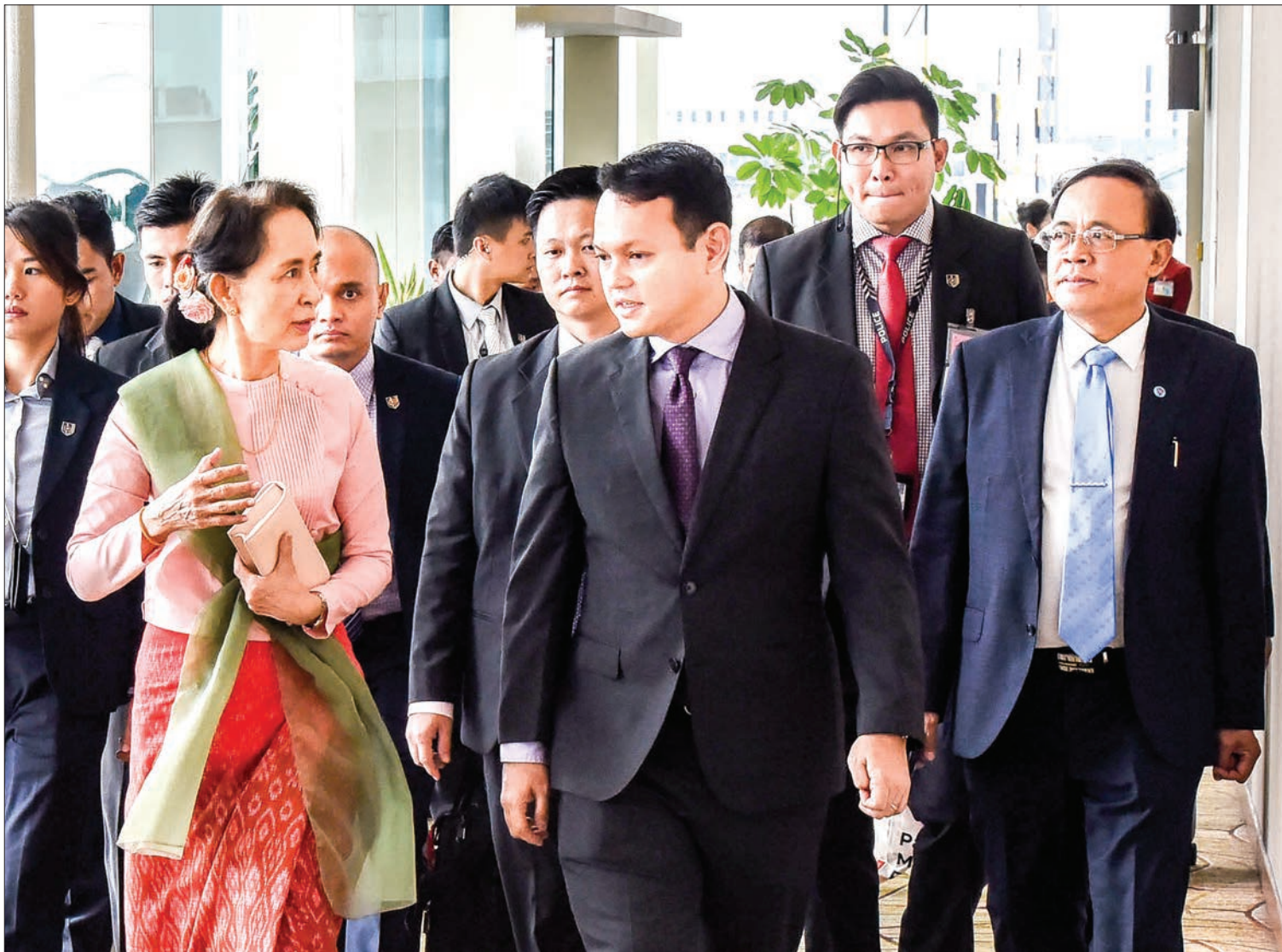
State Counsellor Daw Aung San Suu Kyi departs from Changi International Airport in Singapore to Myanmar yesterday.