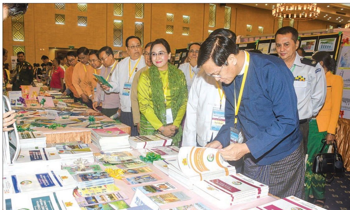
Vice President U Henry Van Thio looks around the exhibition on Myanmar Statistics Forum 2018.

The Myanmar Statistics Forum was then continued where round table discussions, reading of 15 papers and presentation of Myanmar Statistical Information Service were conducted. —MNA (Translated by Zaw Min)