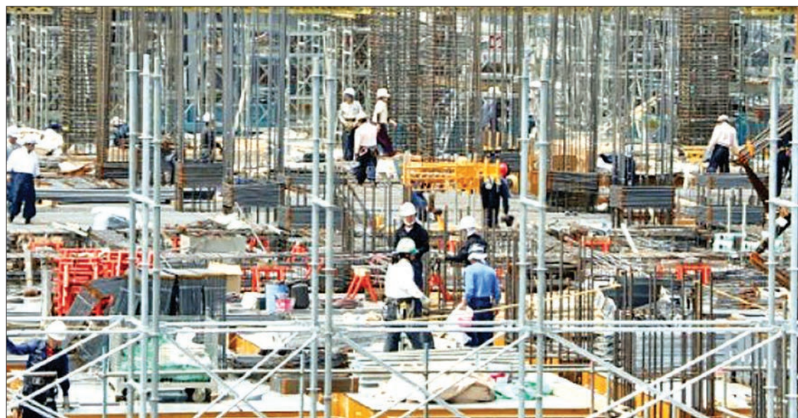
Japan is looking to boost the number of workers in the construction industry as well as other sectors including nursing and agriculture.

In 2014, an AirAsia crash in the Java Sea during stormy weather killed 162 people. The worst disaster in Indonesia's aviation history left 234 dead in 1997 when an Airbus A-300B4 operated by national carrier Garuda Indonesia crashed in a smog-shrouded ravine in North Sumatra, just short of the airport. —AFP ■