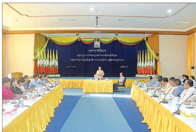
Union Minister Dr. Myo Thein Gyi addresses the coordination meeting at the Ministry of Education office in Nay Pyi Taw.

At the meeting Union Minister for Education Dr. Myo Thein Gyi said National Education Strategic Plan (2016-2021) was drawn up and set for Myanmar education sector development and efforts are being made toward balanced development of basic education sector, higher education sector and technical and vocational education sector. Human resources development plays a major role in socio-economic development. Having a good education system and a good curriculum is important to produce skilled technicians and experts for human resources development. Subject wise curriculums are to be drawn up according to set norms and frames and must be appropriate to the region and meet the requirement of the