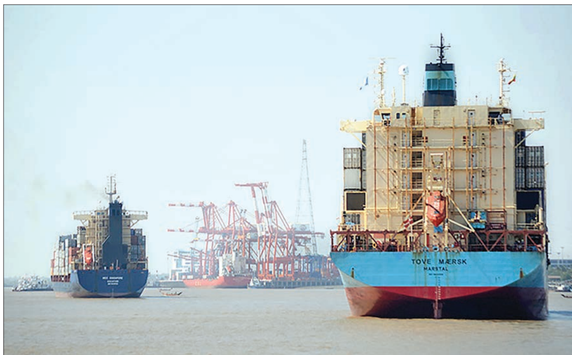
Containerships dock in Yangon Port.

BILATERAL border trade between Myanmar and Thailand this fiscal year totaled US$144.6 million, with exports worth $84.013 million and imports worth $60.624 million, according to the official statistics issued by the Ministry of Commerce.