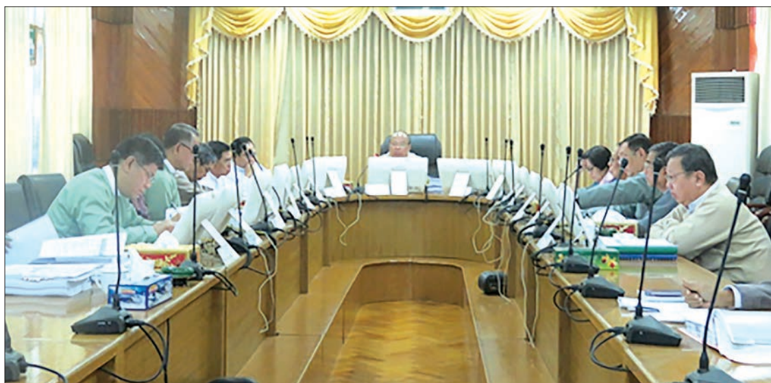
Chairman of Myanmar Investment Commission U Thaung Tun attends Myanmar Investment Commission (18/2018) meeting held in Yangon yesterday.