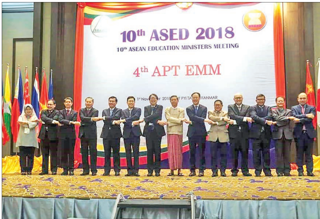
Union Minister Dr. Myo Thein Gyi and participants join hands as they pose during the 4 th ASEAN Plus Three (China, Japan and ROK) Education Ministers meeting (4 th APT EMM) in Nay Pyi Taw.

The participants took part in the discussion and made the approval of academic criteria for student exchange programmes between the SAEAN countries and Plus Three (China, Japan and ROK) countries and promoting student exchange programmes. Other topics included academic exchange and China Scholarships for students of ASEAN countries, higher academic sector on peace and