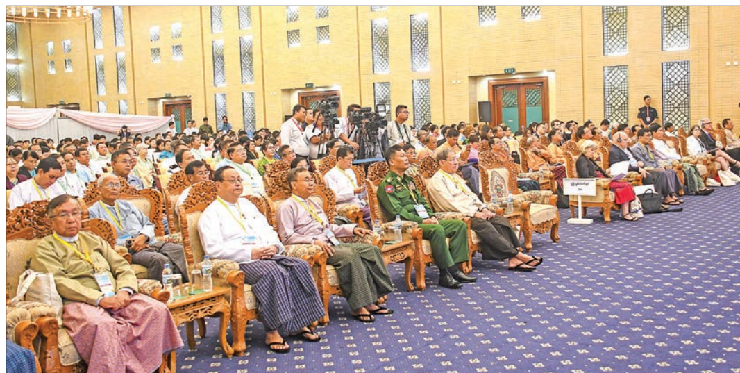
Vice President U Henry Van Thio delivers the opening speech at the Myanmar Statistics Forum 2018 in Nay Pyi Taw yesterday.

In working towards the development of the statistics sector, ministries are required to do