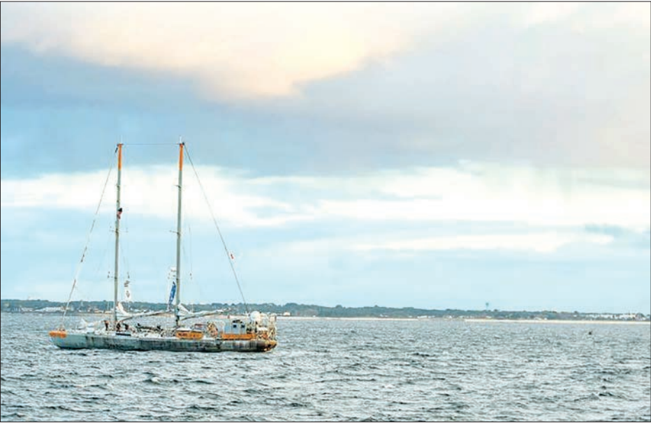
A scientific expedition yacht in the waters off Groix Island, Western France, on 27 October, 2018. Scientists said the world's oceans have absorbed 90 per cent of the temperature rise caused by man-made carbon emissions.

By measuring atmospheric oxygen and CO 2 for each year, scientists were able to more accurately estimate how much heat