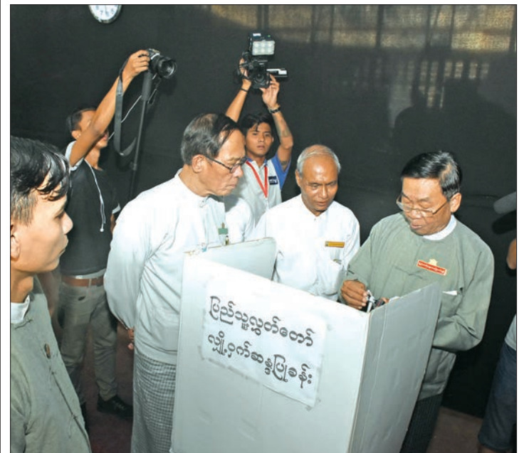
UEC member U Myint Naing inspects preparations made at a polling station in Yangon yesterday.

MEMBER of Union Election Commission U Myint Naing (in-charge of the Yangon Region) together with Yangon Region Election Sub-Commission chairman U Kyi Myint and members yesterday inspected Tamu Township's Pyithu Hluttaw constituency and Seikkan Township Regional Hluttaw constituency 2 for today's by-election.