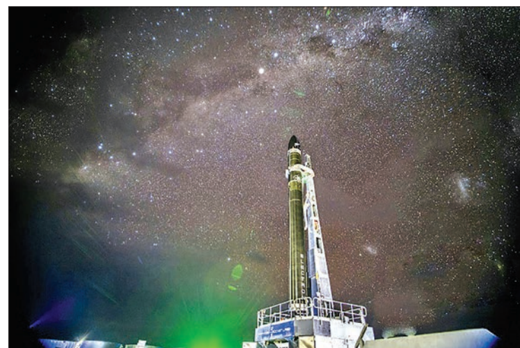
Rocket Lab's Electron rocket — seen on the launch pad in Mahia, New Zealand in June 2018 — is expected to take flight sometime in November.