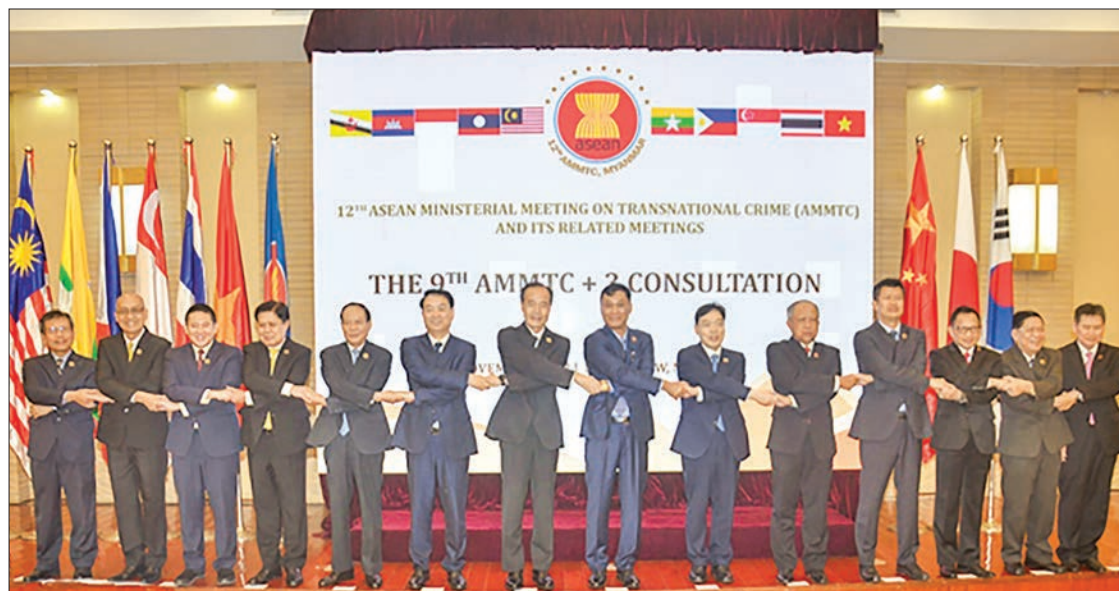
Union Minister for Home Affairs Lt-Gen Kyaw Swe and Ministers from ASEAN Countries join hands as they pose during the 2nd day of the 12th ASEAN Ministerial Meeting in Nay Pyi Taw yesterday.

The 9 th AMMTC+3 was held at 8.30 am and was attended by Union Minister for Home Affairs Lt-Gen Kyaw Swe chaired the meeting and ministers and ministerial level delegates from 10 ASEAN countries and dialogues partners China, Japan and South Korea, the Secretary-General of ASEAN and officials, senior