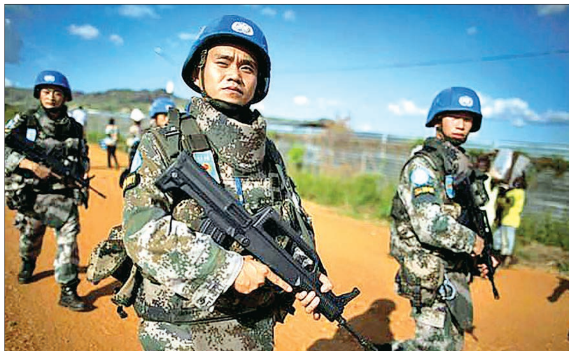
About 2,500 Chinese peacekeepers are serving in complex missions including in South Sudan, where these Blue Helmets from China were patrolling in Juba, in October 2016.

The Chinese ambassador said “international rules and multilateral mechanisms are being undermined”, creating a world “filled with uncertainties and destabilizing factors.” — AFP ■