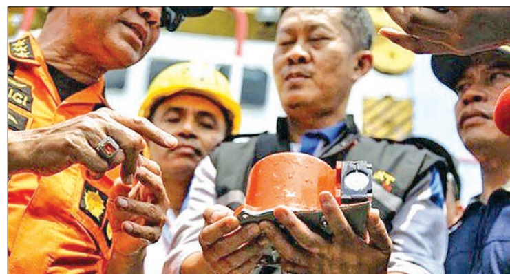
Officials display part of the ill-fated Lion Air flight JT 610's black box after it was recovered from the Java Sea during search operations on Thursday, 1 November.

The chronic labour shortages are only worsening as Japan's ageing and shrinking population means a declining pool of workers. —AFP ■