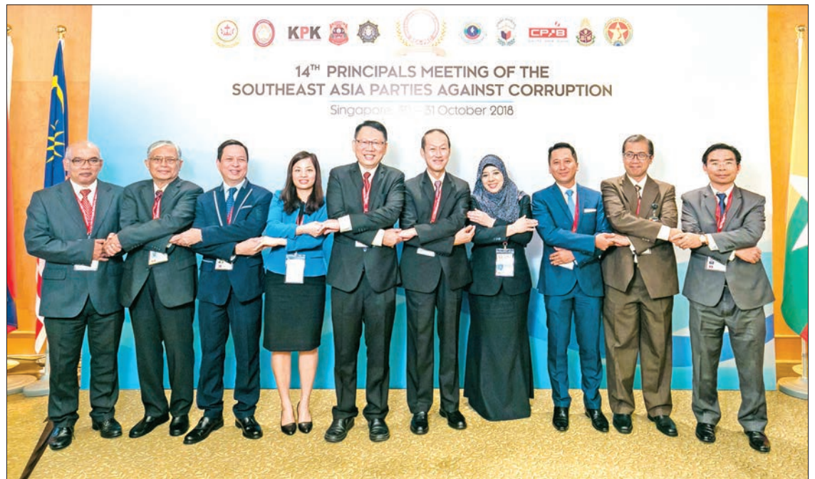
Anti-corruption Chairman U Aung Kyi poses for the documentary photo with participants at the 14 th Principals meeting of the Southeast Asia parties against corruption in Singapore.

At the workshop, the participants discussed the topics relating to using applications of modern techniques in the process of filing a complaint against the corruption, the benefits of using mobile technology and online-communication system, application of digital processing, the important role of getting