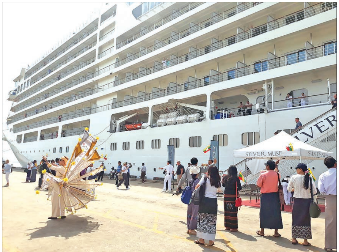
Silver Muse luxury cruise ship from the United State of America docks at Thilawa Port in Yangon on 2 November.