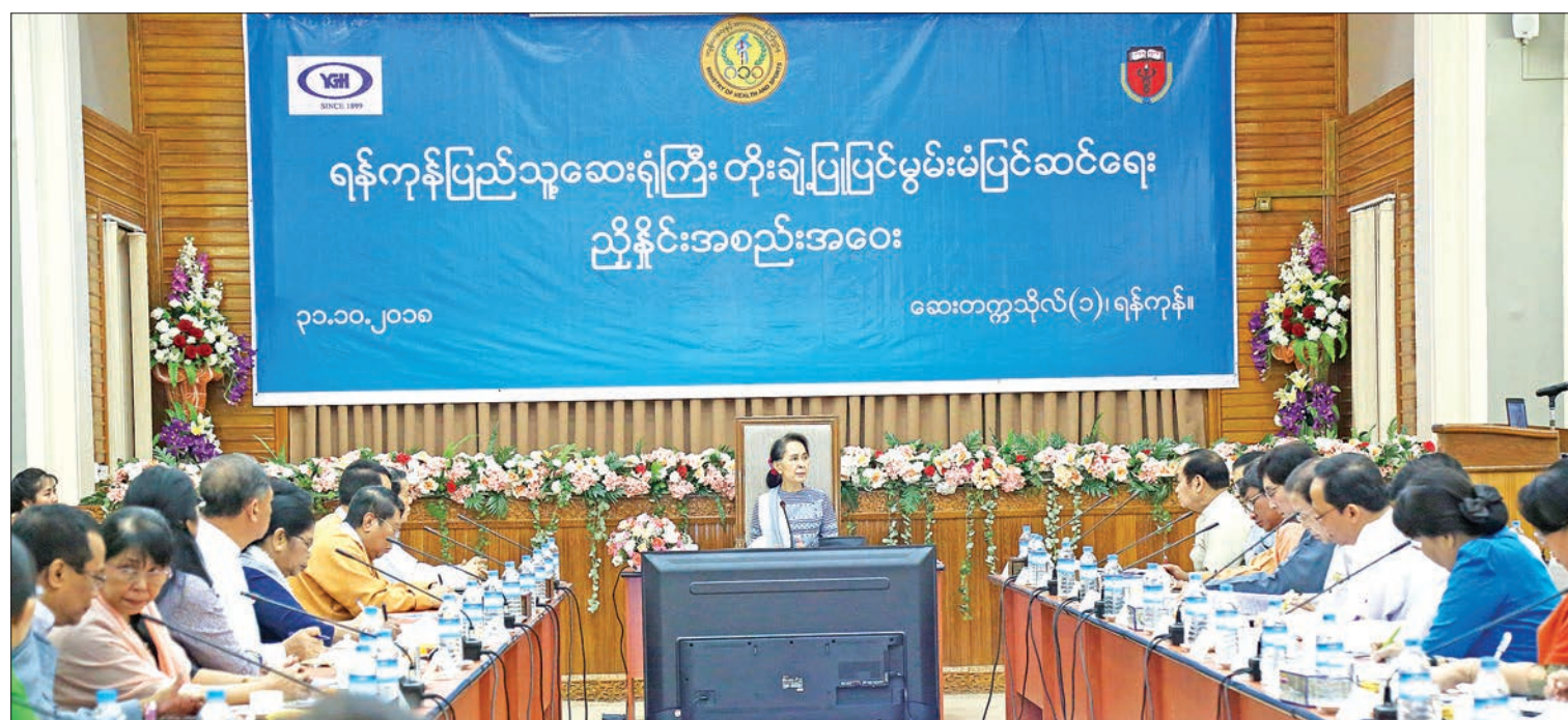
State Counsellor Daw Aung San Suu Kyi addresses the meeting on the Yangon General Hospital Reinvigoration in Yangon.

"The incumbent government is carrying out public health works from a basic level, highlighting the importance of public health as part of efforts to decrease the risks when receiving care at the hospital, and to