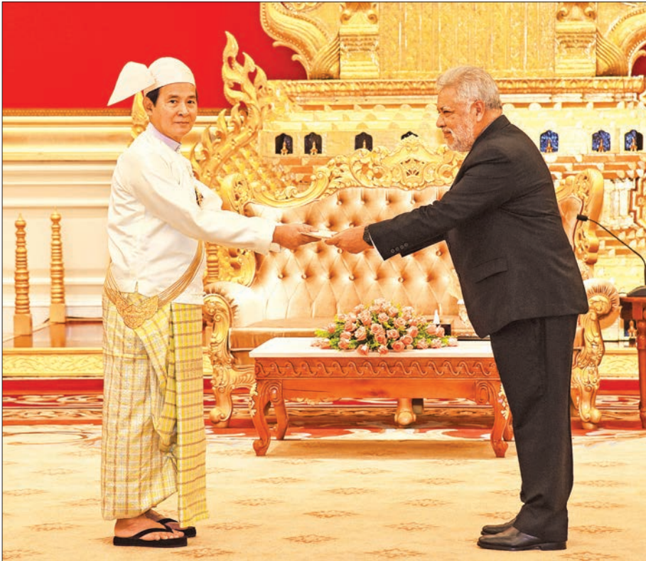
President U Win Myint accepts the credentials of incoming Ambassador of the Bolivarian Republic of Venezuela at the Presidential Palace.