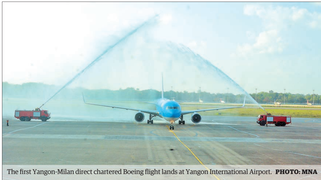
The first Yangon-Milan direct chartered Boeing flight lands at Yangon International Airport.

According to statistics from the Ministry of Hotels and Tourism, the number of travellers from Italy to Myanmar for the period of up to September last year reached 11,976, though the number declined by 14.6 per cent to 10,221 visitors.—Thi Thi Min, Zaw Gyi ■