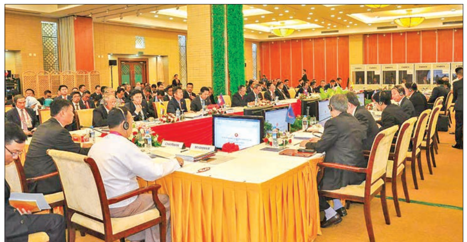
Union Minister for Home Affairs Lt-Gen Kyaw Swe attends the 12 th AMMTC in Nay Pyi Taw yesterday.

The second day of the 12 th AMMTC and its Related Meeting will continue at MICC-II today.—MNA ■