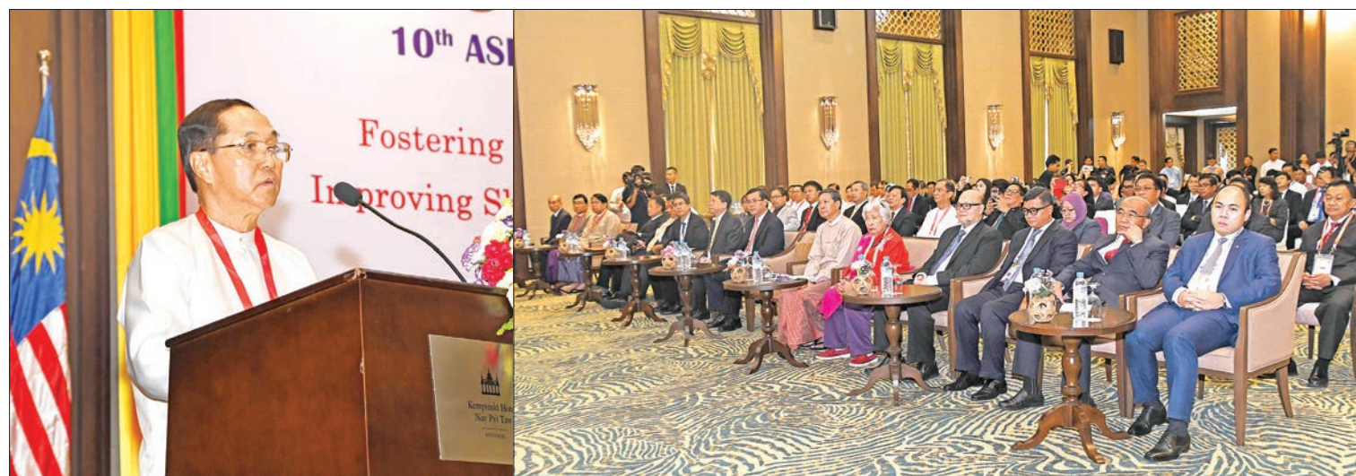
Vice President U Myint Swe delivers the opening speech at the 10 th meeting of the ASEAN Education Ministers (ASEM) in Nay Pyi Taw.

The Vice President mentioned that the National Education Law, enacted in 2014, calls for every child to receive primary education and to develop methods for children without easy access to education. He said the law requires every citizen to receive a minimum of