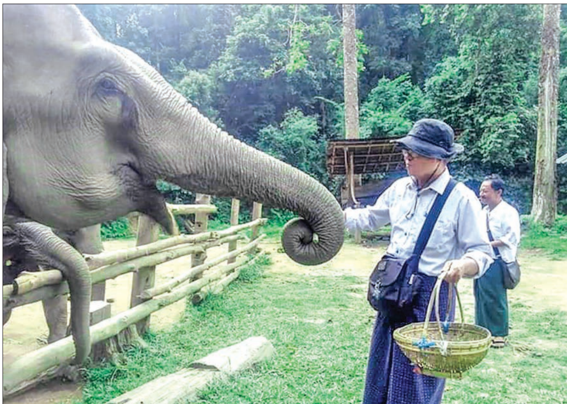
Visitor feeding elephant at Nat Pauk elephant camp in Indaw Township Sagaing Region.

"The number of visitors started to increase in October. If there are only a few visitors, we operate elephant shows with only nine elephants. We also reserve some elephants for those visitors who want to ride them. We have some other costs for the elephants, so we just run elephant shows with nine elephants. The remaining 13 elephants are kept at another elephant camp, which is one mile from Nat Pauk elephant camp. Initially, the camp operated the elephant shows for only foreign visitors, but since November 2016 we have been holding elephant shows for local visitors, as