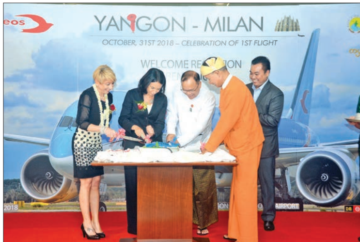
Union Ministers U Ohn Maung and U Thant Sin Maung and the Italian Ambassador slice the celebratory cake.