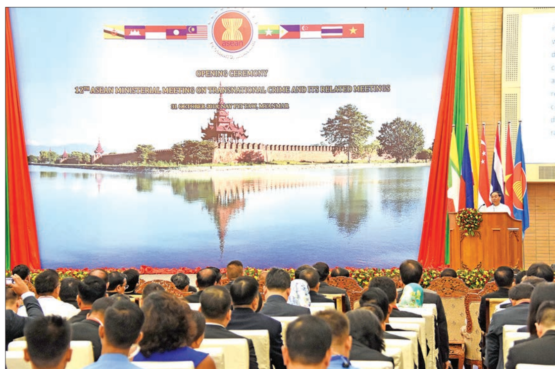
Vice President U Myint Swe addresses the opening ceremony of the 12 th ASEAN Ministerial Meeting on Transnational Crime and its Related Meetings in Nay Pyi Taw yesterday.

The Vice President noted that the effective handling, prevention and solving of transnational crimes, and unconven-