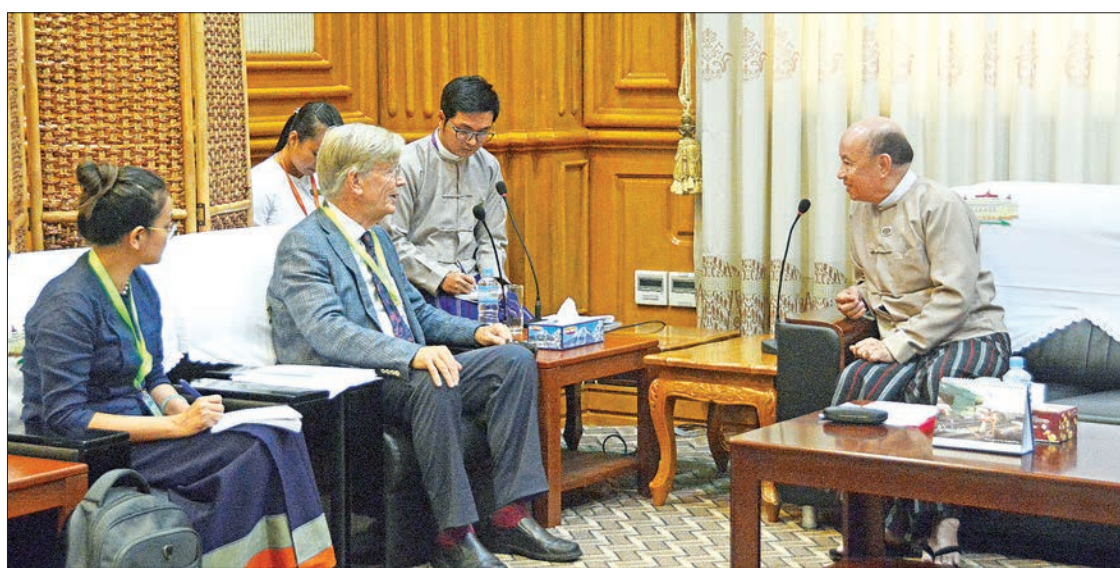
Pyidaungsu Hluttaw Deputy Speaker U Tun Tun Hein holds talk with British Supreme Court Judge Rt. Hon Lord Carnwath in Nay Pyi Taw yesterday.

During the meeting, they exchanged views regarding the friendship and cooperation between Britain and Myanmar, and discussed the legislative processes of the Myanmar Hluttaws, as well as environmental conservation laws. —MNA ■