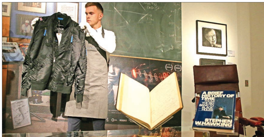
A gallery assistant poses with a bomber jacket that belonged to late British theoretical physicist Stephen Hawking with an estimated price of £100-£150 GBP during a photocall for the sale of personal items from Hawking’s estate at Christie’s auction house in London on 30 October, 2018.

BEIJING—Russia is set to accept an invitation by Peking University’s Nuclear Magnetic Resonance Centre to team up to develop new cancer and AIDS drugs, Russian Deputy Prime Minister Tatyana Golikova said on Tuesday. “We will accept your invitation,” she said in a conversation with the Centre’s staff member. According to the Chinese scientist, the university’s research laboratory does not yet have experience in cooperating with Russia but it already works together with research centres in Canada, the United States and Europe. “We will take this into consideration,” the Russian deputy prime minister noted. Golikova arrived in the Chinese capital of Beijing in the run-up to Russian Prime Minister Dmitry Medvedev’s visit, scheduled to take place on 5-7 November. While in Beijing, she will hold talks with her Chinese counterpart Sun Chunlan, attend the 19th meeting of the Russian-Chinese Commission on Humanitarian Cooperation, and visit the inauguration ceremony for the Russian-Chinese Association on Television Cooperation. In addition, she is also going to take part in a ceremony to launch an online section dedicated to humanitarian ties and interaction between both countries within the mobile app called “Russia and China: the Basics”.—Tass ■