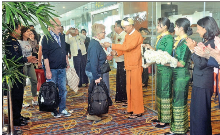
Union Minister U Ohn Maung gifts a flower necklace to passengers of the direct chartered flight at Yangon International Airport.