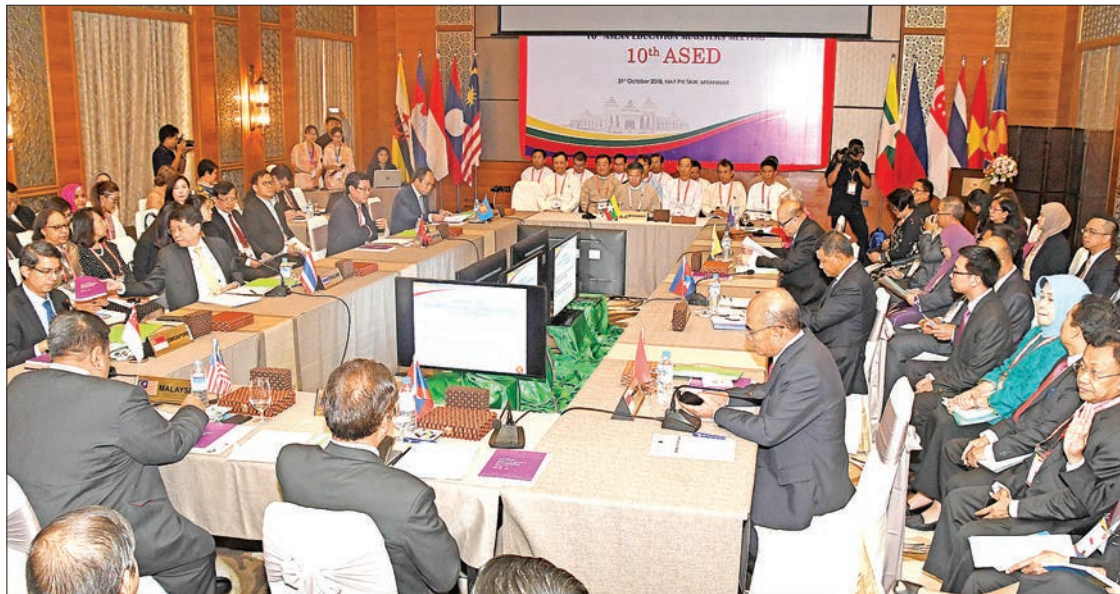
Union Minister Dr. Myo Thein Gyi attends 10th ASEAN Education Ministers Meeting (10th ASED) and its associated meetings held in Nay Pyi Taw yesterday.

"I would like to present the measures of Myanmar's education reforms briefly. In order to implement a quality education system, the Ministry of Education launched National Education