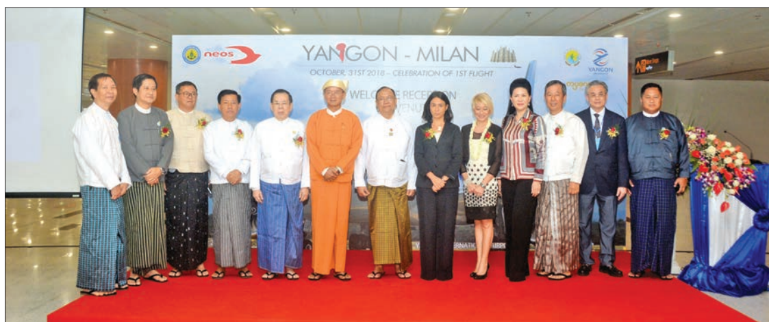
Union Ministers U Thant Sin Maung and U Ohn Maung, Italian Ambassador Ms. Schiavo and officials pose for documentary photo.