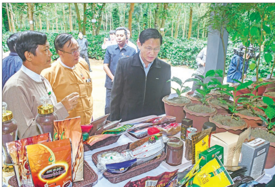
Vice President U Henry Van Thio inspects coffee plants and products at the Central Department on Coffee Research and Technology in Mandalay.

will we see the fruits of our efforts," said the Vice President.