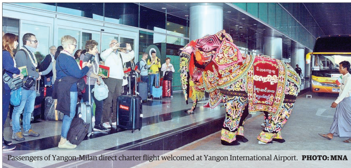
Passengers of Yangon-Milan direct charter flight welcomed at Yangon International Airport.