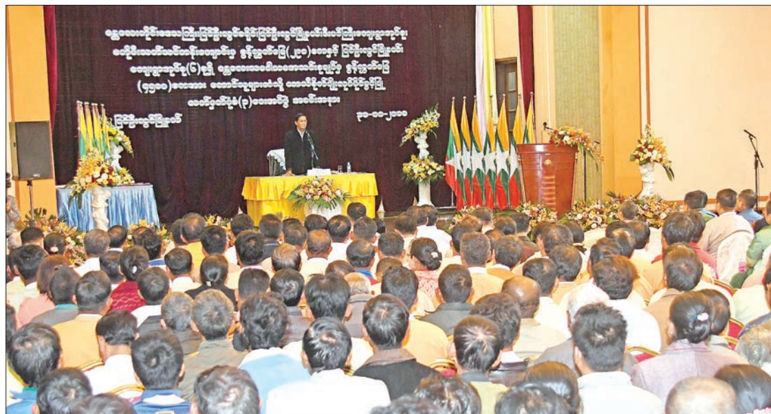
Vice President U Henry Van Thio addresses the ceremony in PyinOoLwin where 4,580 acres of farmland out of 4,790 acres released by two union-level ministries were returned to farmers.

"Only when we minimize such losses as much as we can,