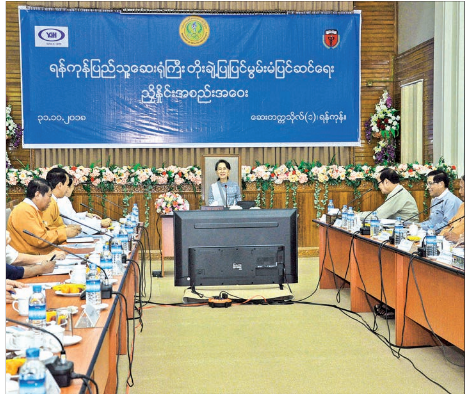
State Counsellor Daw Aung San Suu Kyi attends the meeting on the Yangon General Hospital Reinvigoration at University of Medicine-1 in Yangon yesterday.