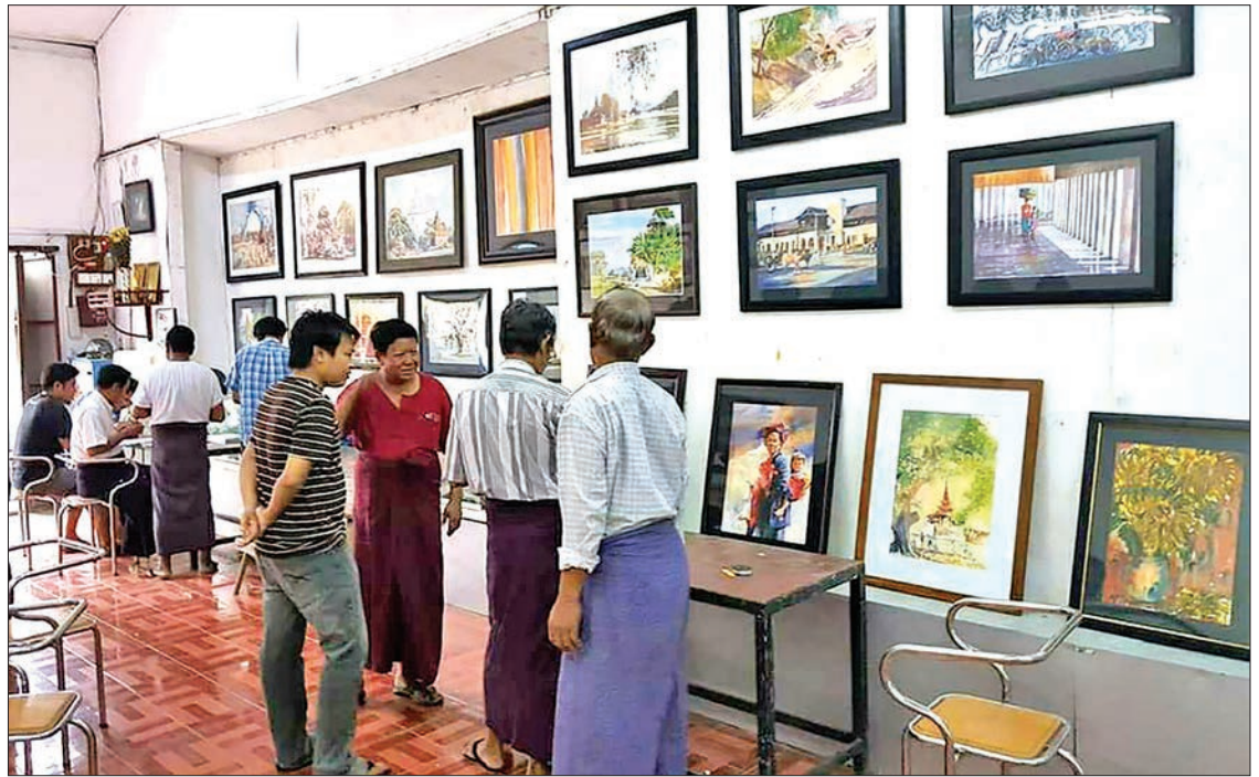
Visitors look at paintings by watercolorists displayed at the Mandalay Hill Art Gallery in Mandalay.