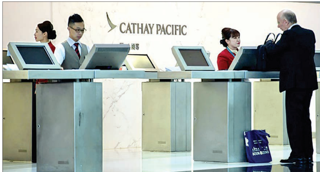
The Cathay Pacific passenger data compromised by hackers included passport and ID card numbers, credit card information, phone numbers, emails and physical addresses.