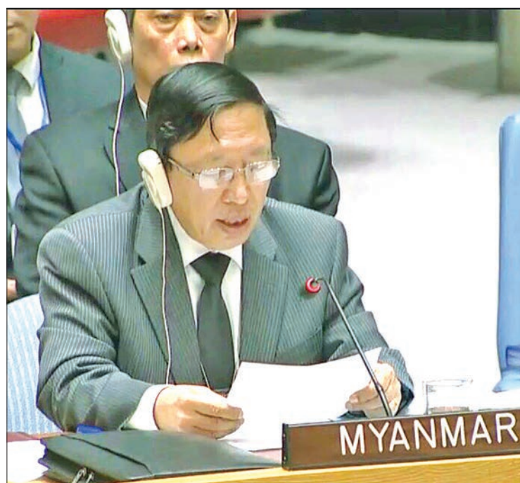
Permanent Representative of Myanmar to the United Nations Ambassador U Hau Do Suan.

sion of moral and institutional integrity of the United Nations as a result of the blatant attempt by some members of the Council to hijack human rights issue for their political purpose.