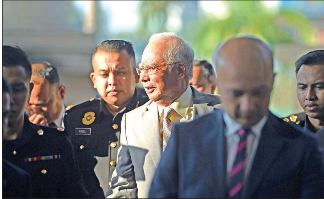
Former Malaysia's prime minister Najib Razak (C) is escorted by police to the courthouse in Kuala Lumpur on October 25, 2018. Malaysia's former leader Najib Razak and two of his allies will face corruption charges on October 25, as authorities target a growing list of figures linked to the scandal-plagued old regime.