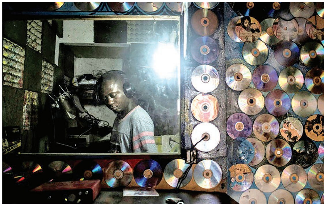
Congolese hiphop enthusiasts have flocked to Kinshasound, one of Kinshasa’s few local recording studios at the heart of a wave of new rap music.

This tiny studio has attracted rap artists like Sista Becky,