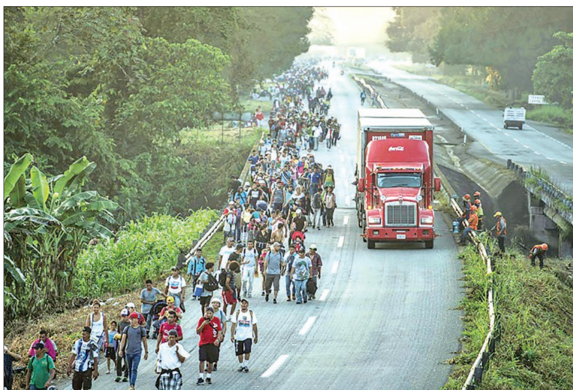
The Honduran migrants heading toward the US border left the Mexican town of Huixtla at dawn after taking a one-day break to rest.

In a show of solidarity, Mexicans watching the caravan pass