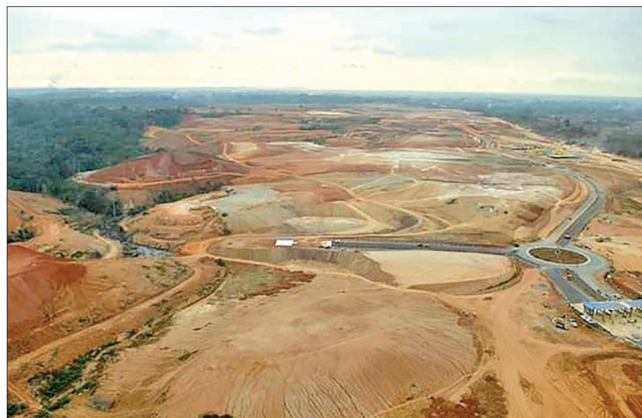
An aerial view shows Nkok, a special economic site in Gabon dedicated to the transformation of wood, some 30 kilometres from Libreville.

The ban on felling the trees is intended to "limit