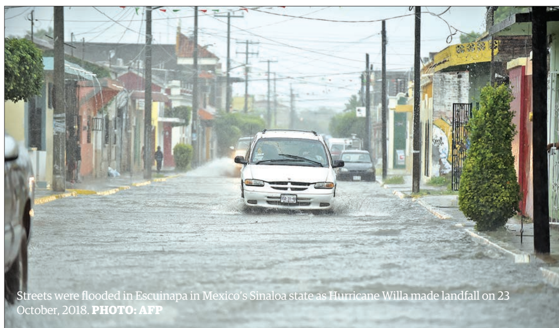
Streets were flooded in Escuinapa in Mexico's Sinaloa state as Hurricane Willa made landfall on 23 October, 2018. PHOTO: AFP

Halted at the final gate by hundreds of riot police, most of the caravan entered Mexico by swimming or taking rafts across the river that forms the border.— AFP ■