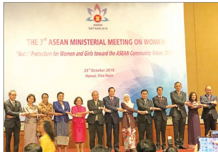
Union Minister Dr. Win Myat Aye poses for a documentary photo with attendees at third ASEAN Ministerial Meeting on Women (AMMW) in Hanoi, Viet Nam.

THE third ASEAN Ministerial Meeting on Women (AMMW) was held in Hanoi, Viet Nam on 24-25 October. Union Minister for Social Welfare, Relief and Resettlement Dr. Win Myat Aye who is also chairman of Myanmar National Committee for Women's Affairs attended the meeting.