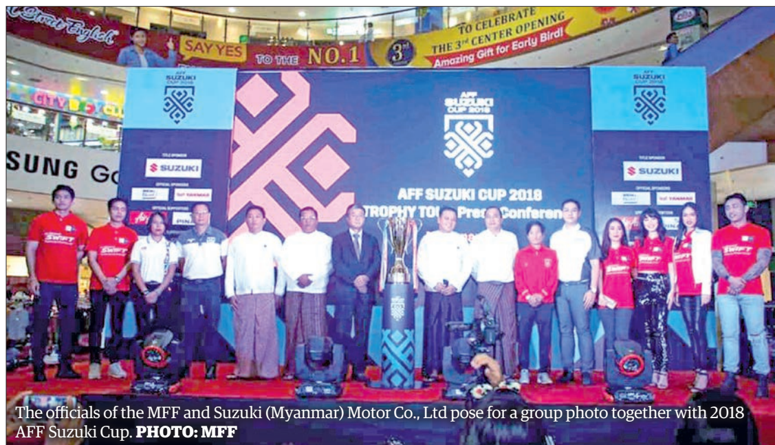
The officials of the MFF and Suzuki (Myanmar) Motor Co., Ltd pose for a group photo together with 2018 AFF Suzuki Cup.

A ceremony to introduce Myanmar football enthusiasts to AFF Suzuki Cup 2018 Trophy Tour to Yangon was held at Myanmar Plaza, Yangon.