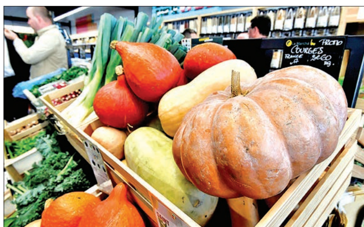
Consumption of organic produce, like these at an organic supermarket in western France, is on the rise, but can scientists really prove the health benefits?

Even the findings of the largest are sometimes disputed, like one in 2013 that purportedly showed the sweeping benefits of