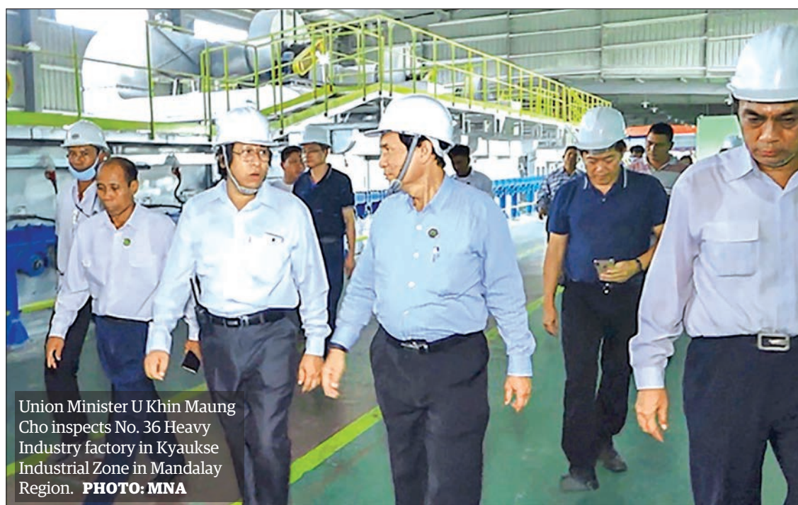
Union Minister U Khin Maung Cho inspects No. 36 Heavy Industry factory in Kyaukse Industrial Zone in Mandalay Region.

UNION Minister for Industry U Khin Maung Cho inspected No. 36 Heavy Industry (Kyaukse) Kyaukse Industrial Zone in Mandalay Region on 24 October. He observed the production of high quality glass with modern machineries by expanding the glass furnace. The Union Minister was accompanied by the International Glass Co.Ltd. Managing Director, No. 2 Heavy Industries Enterprise Managing Director and officials.