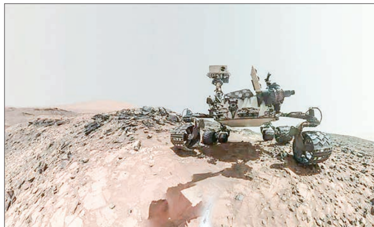
The new research was made possible by the discovery by NASA’s Curiosity Mars rover of manganese oxides.

Depending on the region, season and time of day, temperatures on the Red Planet can vary between minus 195 and 20 degrees Celsius (minus 319 to 68 degrees Fahrenheit).