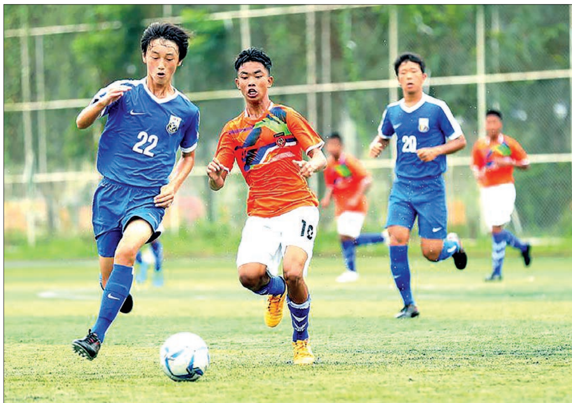
Myanmar Mandalay U-14 Academy (orange) vies Japan Fukushima U-14 Academy for the ball.