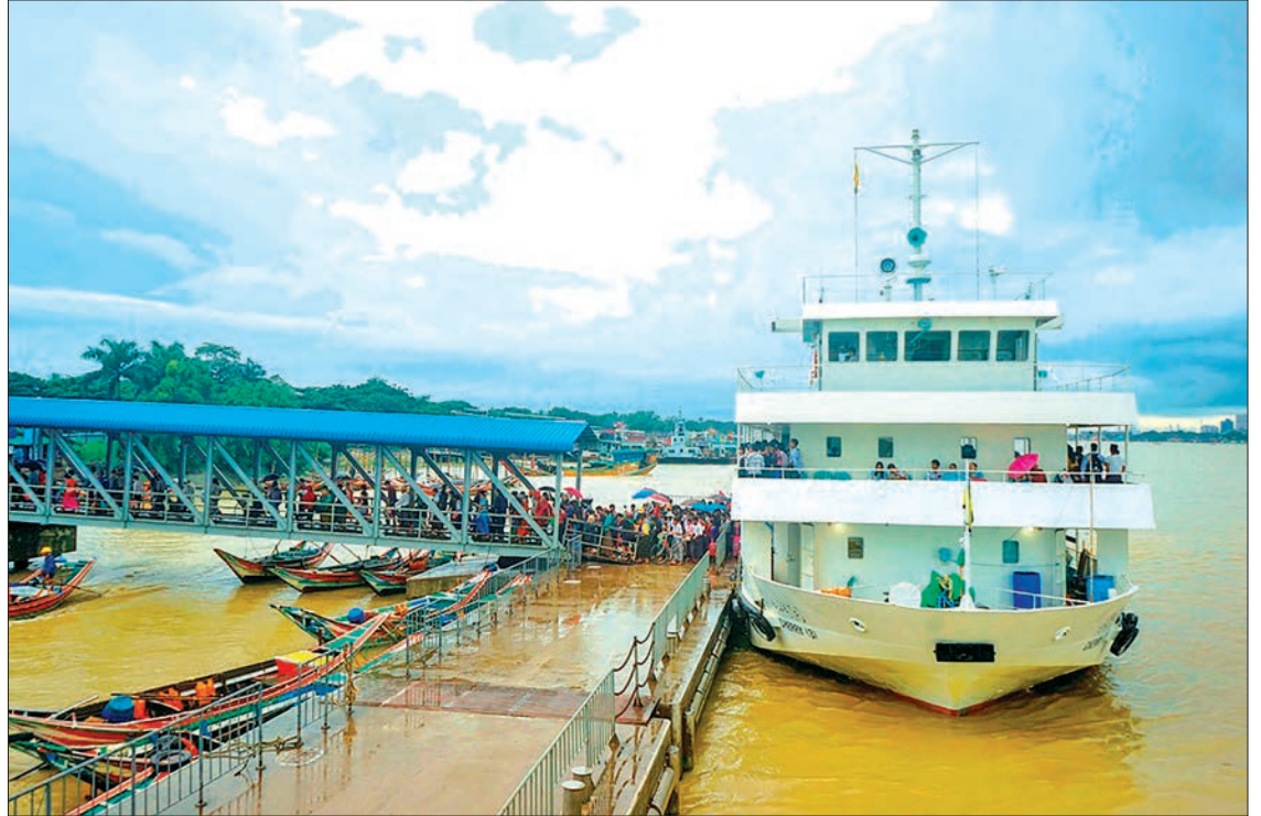
Passengers disembark on the ferry to cross the Yangon River to Dala yesterday.

"Life-jackets are on Cherry ferries. The ships are warned not to leave the terminal during high wind conditions. Heavy rain at 11:40 am yesterday caused five-minute delay for ferry service. Usually, ferry service run 46 times a day yet it depends on weather condition. Three Cherry ferries are running in turn. Cherry ferry staff ensures passenger comfort and safety. Additionally, they manage for the passen-