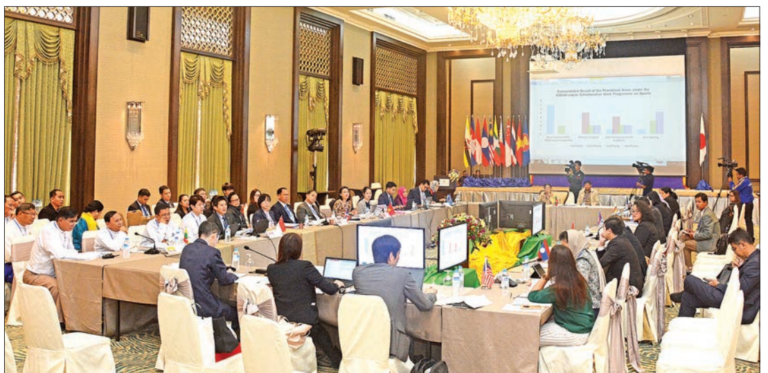
Deputy Minister for Health and Sports Dr. Mya Lay Sein attends ASEAN+Japan Senior Officials Meeting on Sports (SOMS) in Nay Pyi Taw yesterday.

Later in the afternoon session, meeting attendees held discussion under the title of increasing participation of women in sports sector. — MNA ■