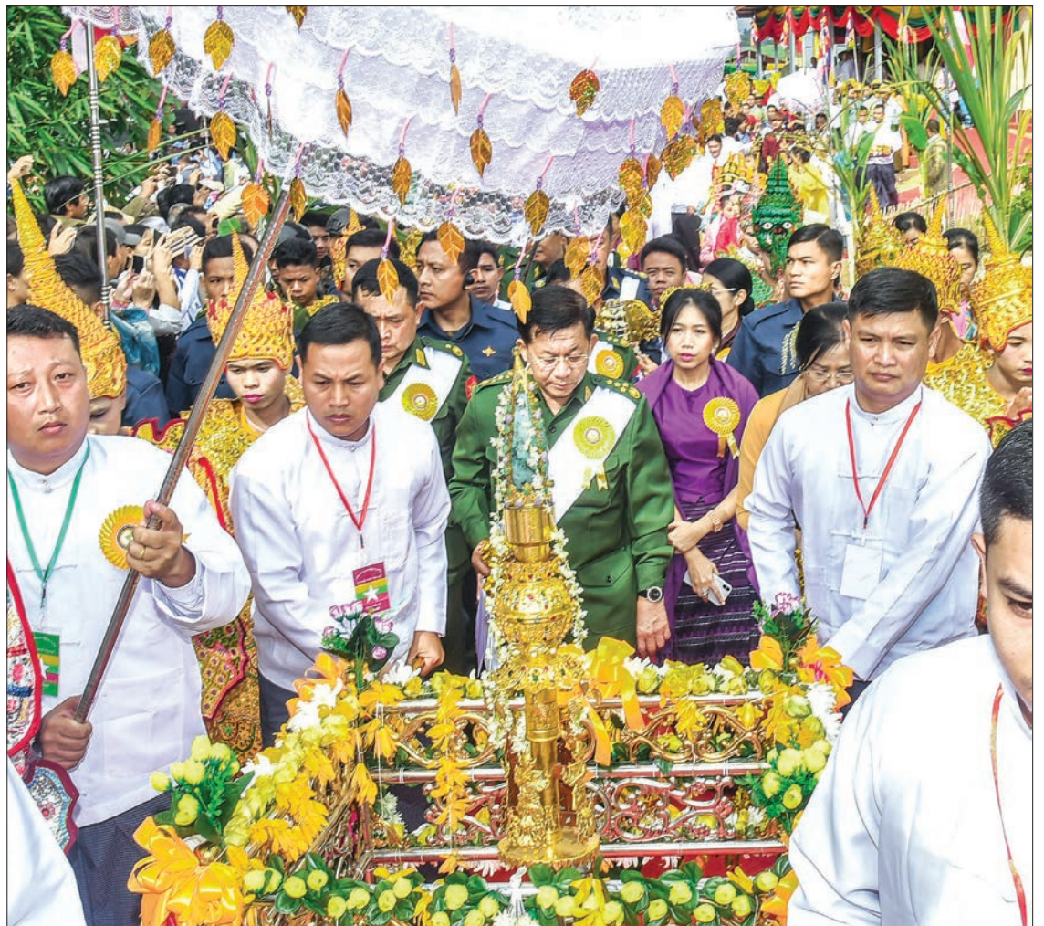
Senior General Min Aung Hlaing and wife Daw Kyu Kyu Hla carry religious objects.