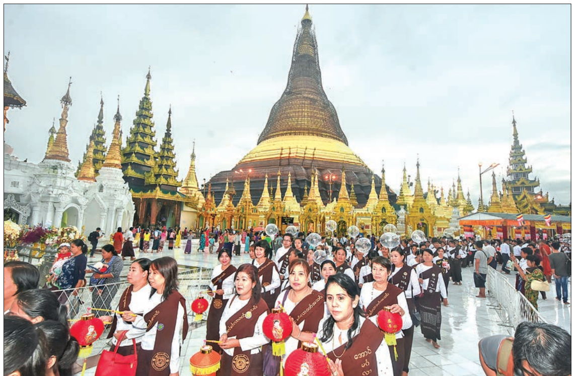
Buddhist devotees take part in a religious ceremony at the Shwedagon Pagoda yesterday.

At pagodas in Yangon yesterday, wellwishers donated charity food and water to the visitors. Religious associations chanted religious verses at the pagodas, and office buildings and parks were illuminated with multi-coloured lightings at night. People will hold candlelight offering ceremony at pagodas nationwide to mark the Full Moon Day of Thadingyut. — MNA ■