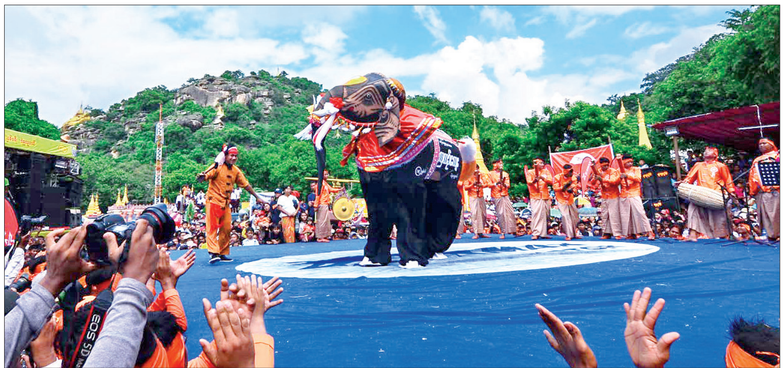
A troupe participates in traditional elephant dance festival in Kyaukse.