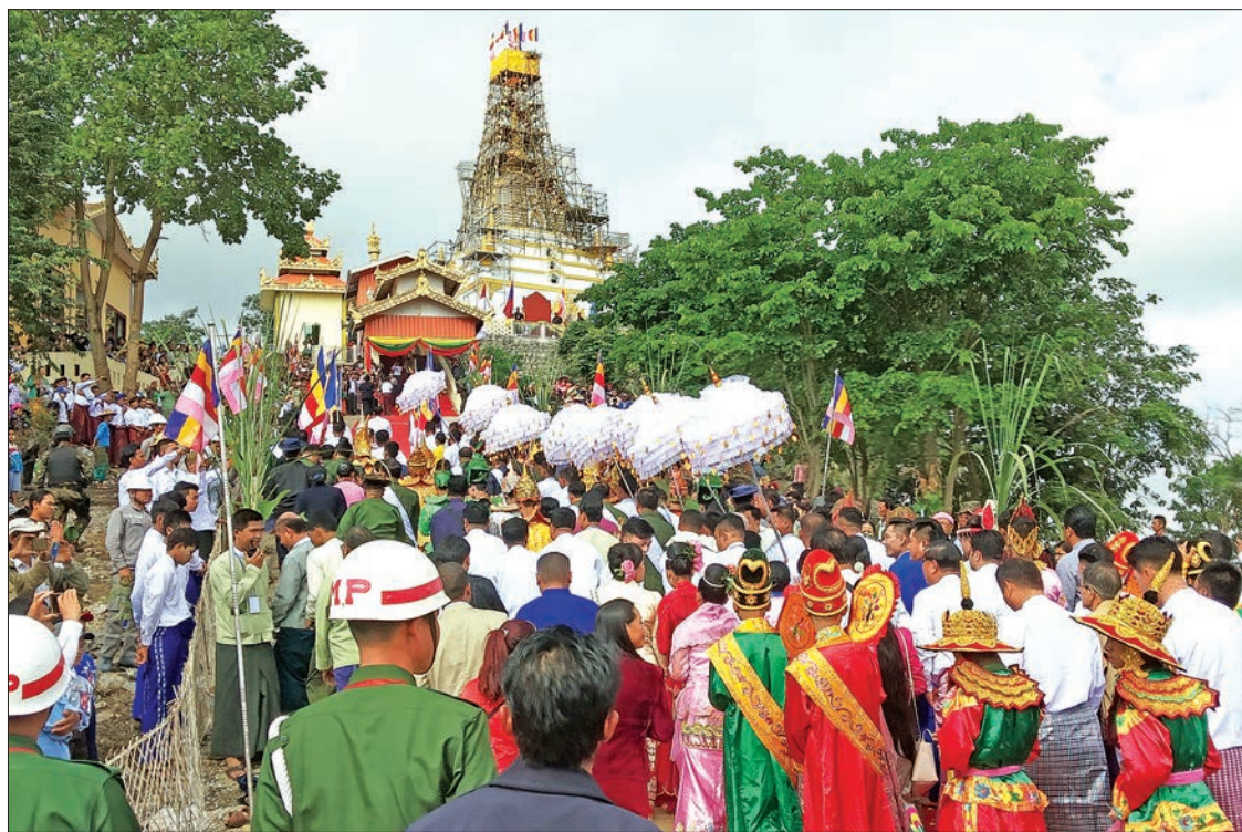
Tiers of umbrella are being carried to the pagoda.