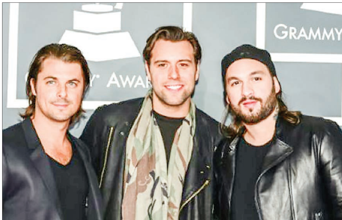
Swedish House Mafia DJs Axwell, Steve Angello (c) and Sebastian Ingrosso have announced they are getting the band back together.

The Carnegie Hall concert, at 7:30 pm on Monday, will look to the future, with a program consisting entirely of world-premiere compositions by CCOM's composition faculty. —Xinhua ■