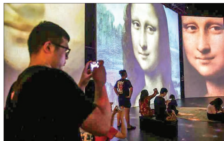
A study in the JAMA Ophthalmology journal suggests a common eye disorder may have helped Leonardo Da Vinci’s art.

People with strabismus often have monocular instead of binocular vision, meaning that