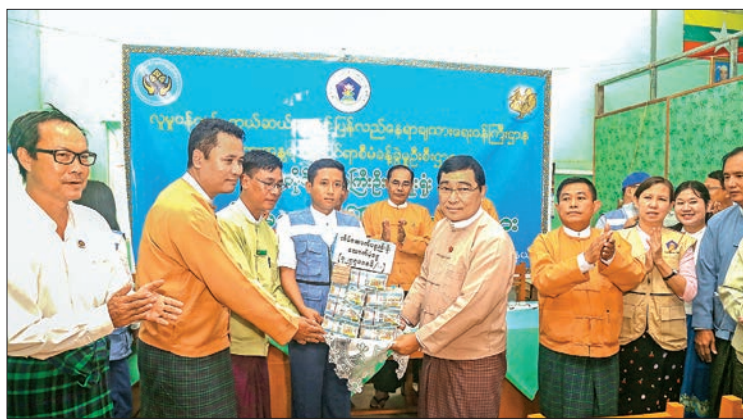
Union Minister Dr. Win Myat Aye hands over cash assistance to authorities for strong wind victims in Bago Region.

UNION Minister for Social Welfare, Relief and Resettlement Dr. Win Myat Aye encouraged and helped local people living in Kawa and Thanatpin Township, Bago Region, who had their houses damaged and roofs blown off due to strong winds on 21 October.