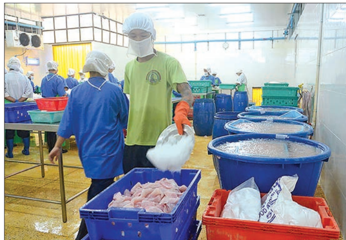
Workers processing fish for export at a marine product factory, Yangon. PHOTO: PHOE KHWAH

Generalized Scheme of Preference from 19 July 2013. Myanmar can enjoy GSP for export of fisheries, rice, pulses, agro products, bamboo and rattan finished products, forestry products, apparels and finished industrial goods.