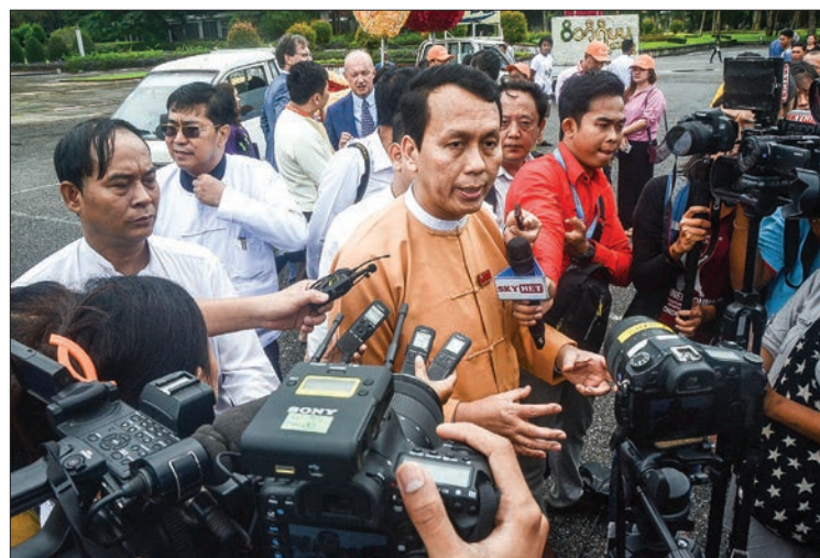
Yangon Region Chief Minister U Phyo Min Thein answering to questions from media about Agricultural Master Plan.

YANGON Region Chief Minister U Phyo Min Thein said an Agricultural Master Plan that was drawn up will soon be implemented in Yangon Region with the aim of developing the agriculture sector.