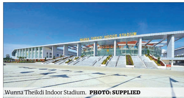
Wunna Theikdi Indoor Stadium.