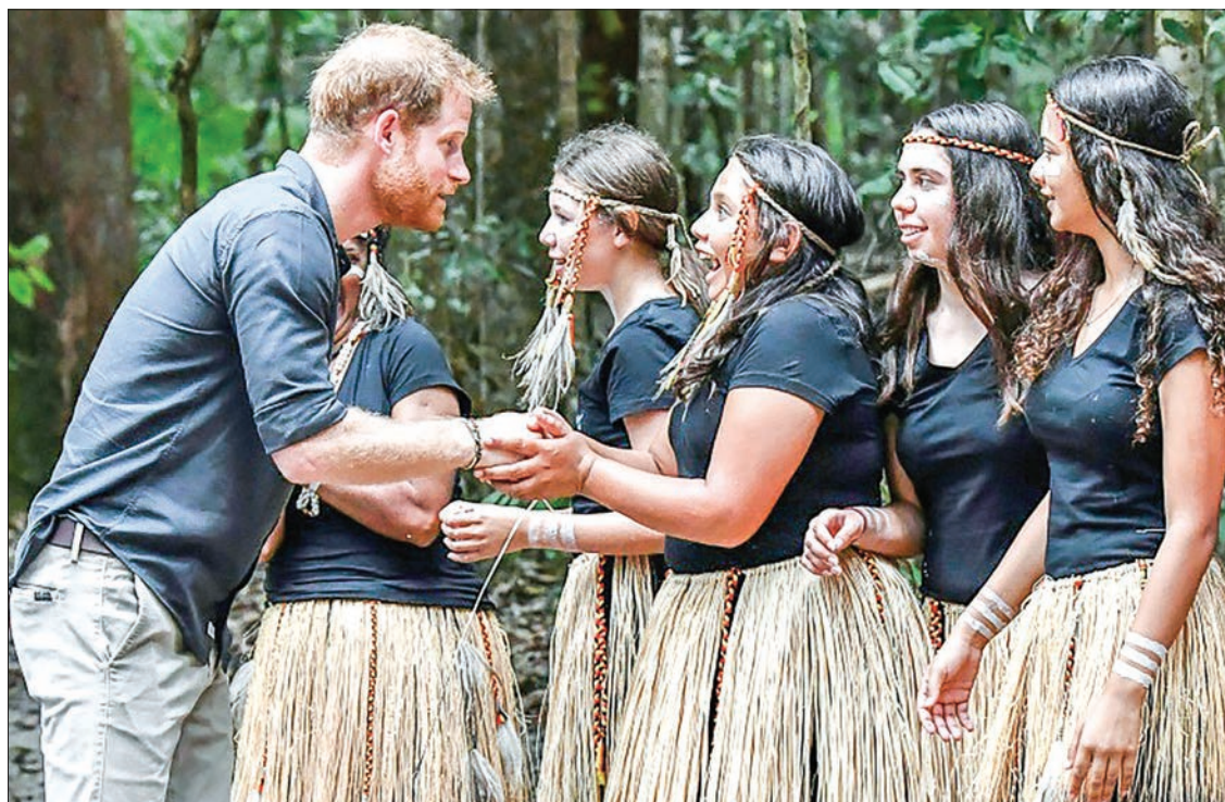
Prince Harry was greeted with a traditional Aboriginal ceremony from the local Butchulla people on the peaceful shores of Lake McKenzie.

FRASER ISLAND (Australia) — Prince Harry greeted an Aboriginal community on the stunning World Heritage-listed Fraser