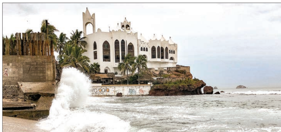
View of waves in Mazatlan, Sinaloa state, Mexico on 22 October, 2018, before the arrival of Hurricane Willa. Hurricane Willa upgraded to maximum Category 5 storm, US forecasters informed.

dump 15 to 30 centimetres (six to 12 inches) of rain on parts of Jalisco, Nayarit and Sinaloa states, with some areas getting up to 45 centimetres (18 inches), it said.