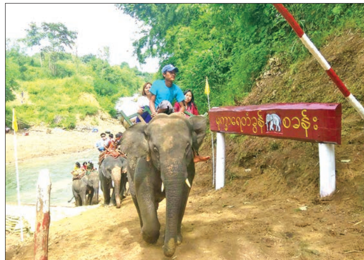
Visitors ride elephants at Mokkha Waterfall Elephant Camp.

There are over 6,578 elephants in Myanmar of which 3,078 were owned by Myanmar Timber Enterprise, more than 2,000 privately owned and over 1,500 in the wild. — Pauksa Minhla ■