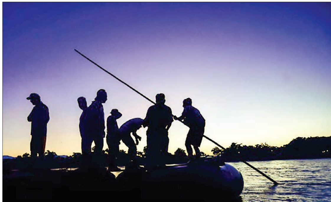
Honduran migrants cross the border river between Guatemala and Mexico as they head to the US in a caravan at Ciudad Hidalgo, Mexico on 22 October, 2018.

“Sadly, it looks like Mexico’s Police and Military are unable to stop the Caravan heading to the Southern Border of the United States. Criminals and unknown Middle Easterners are mixed