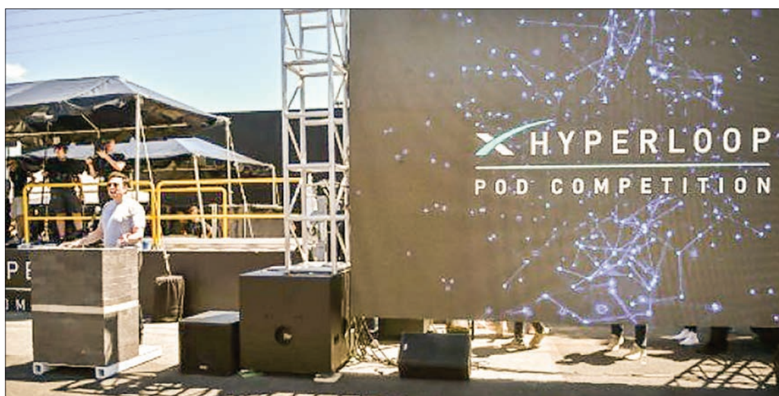
Elon Musk said his Boring Company will hold an event to open its first test tunnel 10 December that will travel 155 miles per hour.