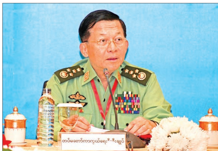
Commander-in-Chief of Defence Services Senior General Min Aung Hlaing.

ciples can be adopted thanks to the benefits of NCA and the adherence to its roadmap. It is not an easy task to reach accords among the warring factions through face-to-face discussions. It is the result of collective talks under the spirit of oneness. Basic principles should be adopted in accordance with the 11-point