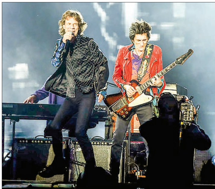
British rockband the Rolling Stones with their singer Mick Jagger and Ronnie Wood (r) perform at the Esprit arena during the Rolling Stones tour “Stones - No Filter” in Duesseldorf, western Germany on 9 October, 2017.

As they browse the exhibit, nearby speakers pump out classic songs of “the Rolling Stones,” such as “It’s only rock ‘n’ roll (But I like it),” “Start me up,” “You can’t always get what you want” and “(I can’t get no) Satisfaction.” —Xinhua ■