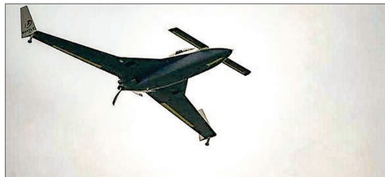
The Mobius aircraft system seen here, which can be piloted by a pilot or remotely, was designed by defense technology firm L3, which on Sunday announced a merger with another big defense firm, Harris Corporation.

WASHINGTON — Harris and L3 Technologies, two American companies specializing in military communications and technology, announced their merger on