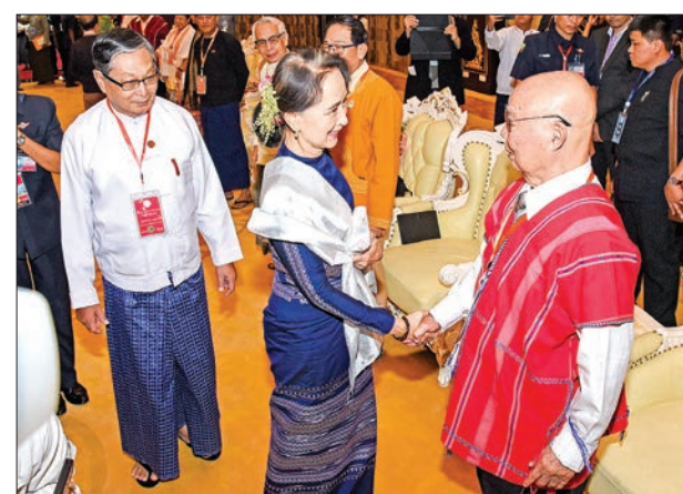
State Counsellor Daw Aung San Suu Kyi greets KNU Chairman Saw Mutu Sae Poe in Nay Pyi Taw.

The meeting continues today to discuss matters, such as self-determination and non-secession from the Union, adopting principles for establishing a unified Tatmadaw, and general issues. — MNA ■