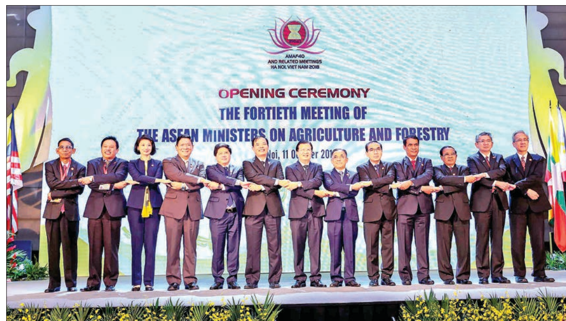
Union Minister Dr. Aung Thu poses for a documentary photo with other ministers at the ASEAN meeting on agriculture and forestry in Viet Nam.

During the meetings, they exchanged views on the progress made in the food, agriculture and forestry sector; the cooperation processes on re-