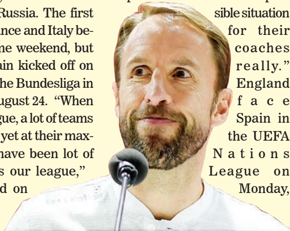
England's manager Gareth Southgate gives a press conference at the Benito Villamarin stadium in Sevilla on 14 October, 2018, on the eve of the UEFA Nations League football match between Spain and England.

Spain have also changed tack under Luis Enrique, who has instilled a more direct, attacking approach since taking charge following the disappointing performances at the World Cup. — AFP ■