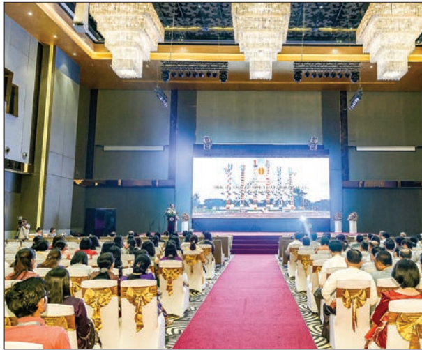
30 th Myanmar Ophthalmological Conference held in Yangon yesterday.