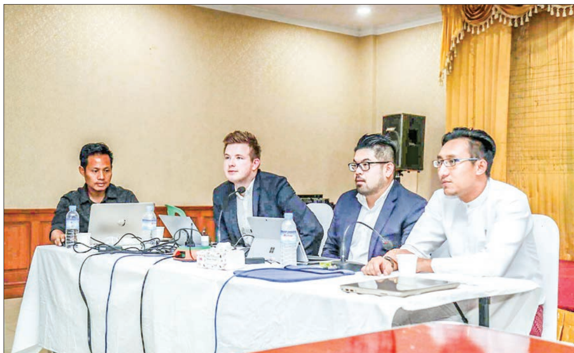
Officials of the FIFA and Myanmar officials discuss at a FIFA Programme Workshop.