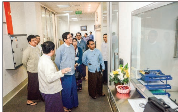
Deputy Minister U Aung Hla Tun inspects the M&A Data Center Facilities on the fifth floor of Vantage Tower.

M&A Data Center obtained Tier III Certificate after it was scrutinized by the American-based Uptime Institute. —Yi Yi Myint ■