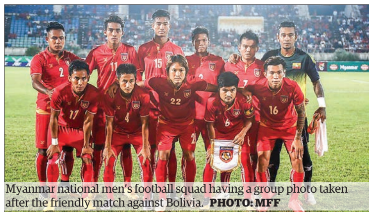
Myanmar national men's football squad having a group photo taken after the friendly match against Bolivia.

Myanmar national men's football squad lost to Indonesia 0-3 in an away friendly match on 10 October. Similarly, Myanmar played the home warm-up match against Bolivia on 13 October, facing a loss with the same result as against Indonesia. —Htut Htut (Twantay) ■