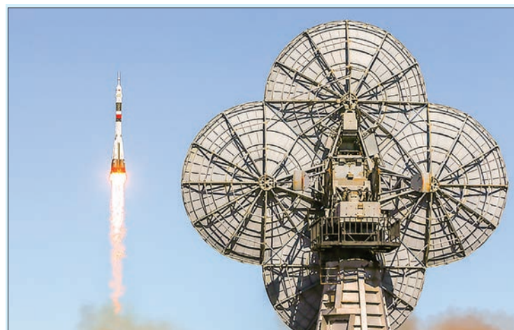
Following its smooth liftoff, the Soyuz’s booster malfunctioned between the first and second stages of separating, whereupon the crew was forced to abort the flight and switch to ballistic descent.

“It is about making sure really important shows are seen by children,” she said. —AFP ■