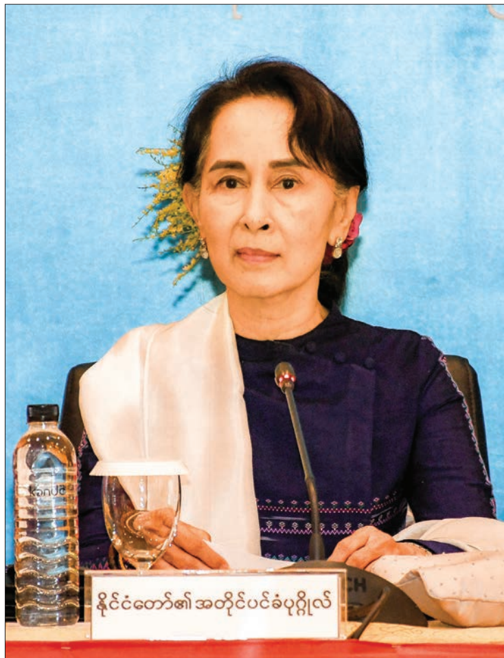
State Counsellor Daw Aung San Suu Kyi.

If we study the political dialogues held internationally, when these political dialogues are stalled, there'll be impatience and there'll be those who are within or without the groups participating in the dialogues who want to disturb the dialogues through theories and ideologies. The result of the decline in trust causes more tension and carries a fifty percent possibility of degenerating back to armed conflicts. As the time taken for political dialogue lengthens ten-