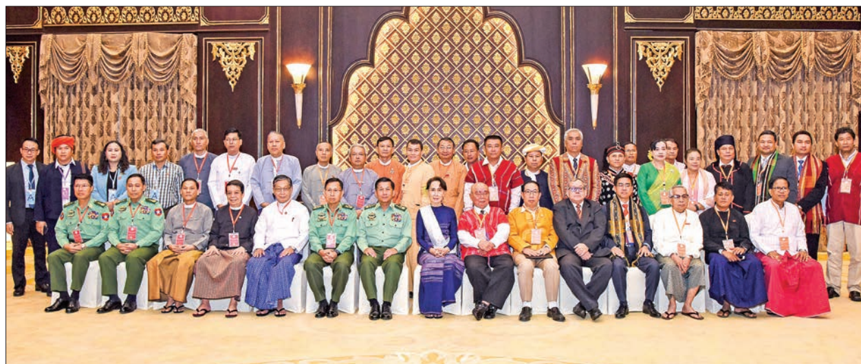
Representatives of the Union Government and leaders of the Nationwide Ceasefire Agreement Signatory ethnic armed organizations pose for documentary photos at the first session of their special meeting in Nay Pyi Taw.