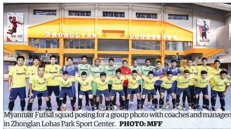
Myanmar Futsal squad posing for a group photo with coaches and managers in Zhonglian Lohas Park Sport Center.