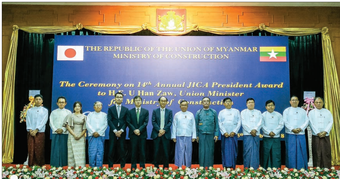
Union Minister for Construction U Han Zaw poses together with attendees at a ceremony of the 14 th Annual JICA President Award from JICA.

The aims of the projects are for the development of Yangon and reduction of traffic jams. — MNA ■