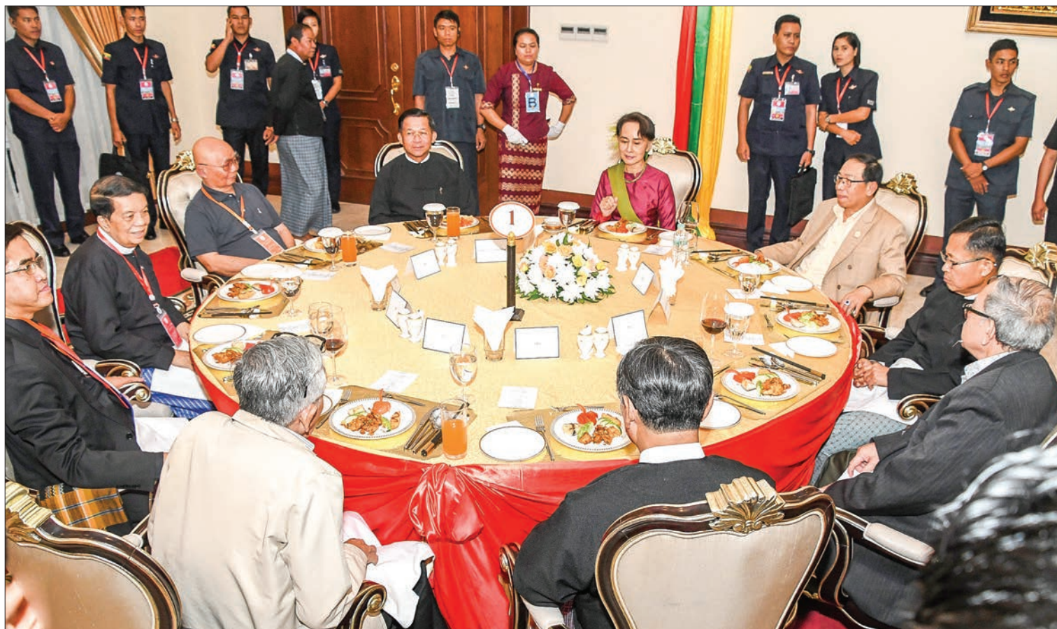
State Counsellor Daw Aung San Suu Kyi, Senior General Min Aung Hlaing and leaders of Nationwide Ceasefire Agreement Signatory Ethnic Armed Organizations enjoy dinner at the Shwe San Ein Hotel in Nay Pyi Taw yesterday.