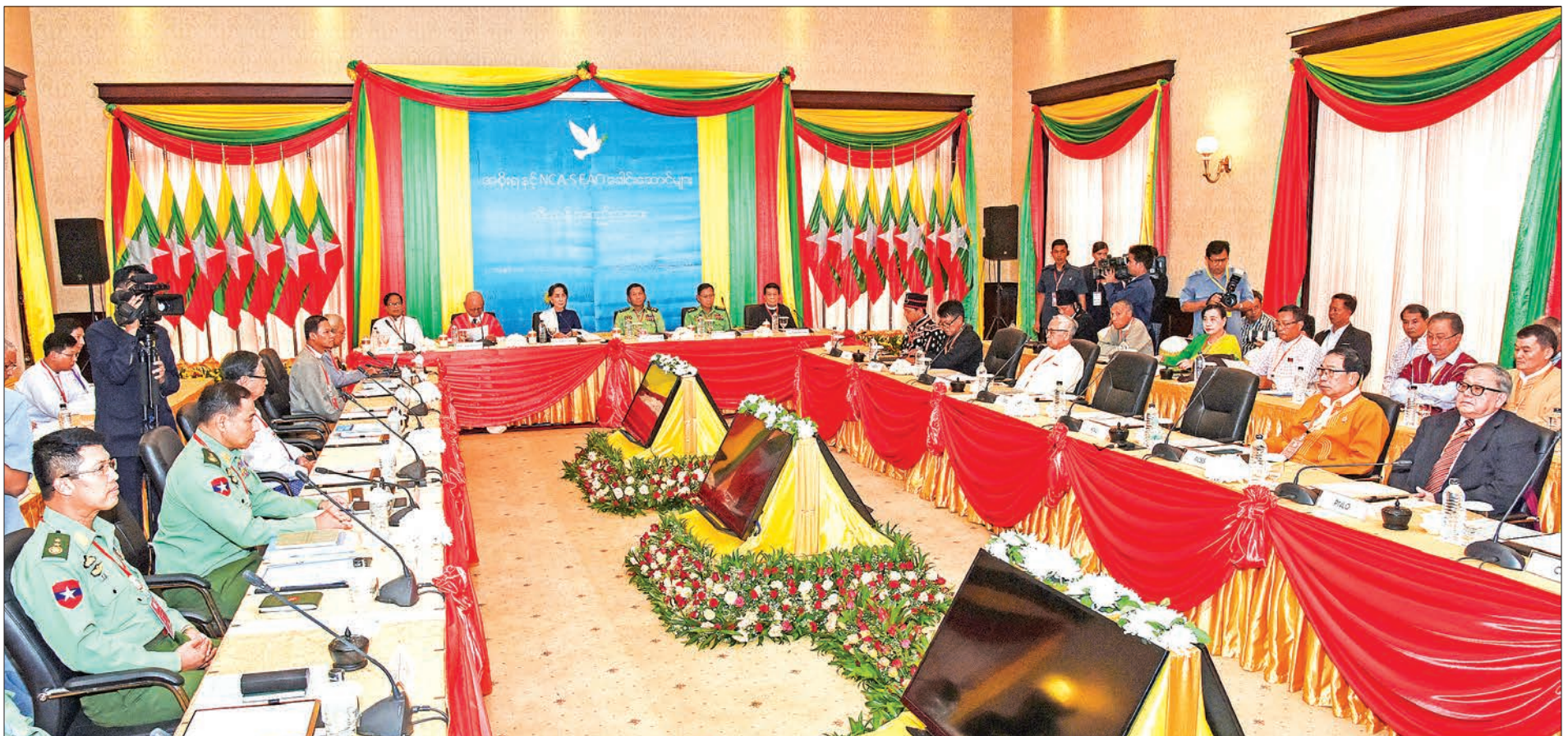
State Counsellor Daw Aung San Suu Kyi, Senior General Min Aung Hlaing and leaders from Nationwide Ceasefire Agreement Signatory Ethnic Armed Organizations attend a special meeting between the Union Government and NCA Signatory EAOs in Nay Pyi Taw yesterday.

Attaining basic principles for forthcoming Union Peace Conference - 21 st Century Panglong among issues discussed