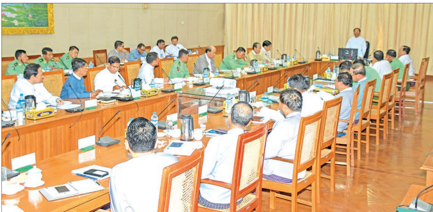
Vice President U Myint Swe addresses the first coordination meeting of the central committee for holding the 71 st Independence Day ceremony.

Due to limitation of space we are only able to publish "Letter to the Editor" that do not exceed 500 words. Should you submit a text longer than 500 words please be aware that your letter will be edited.