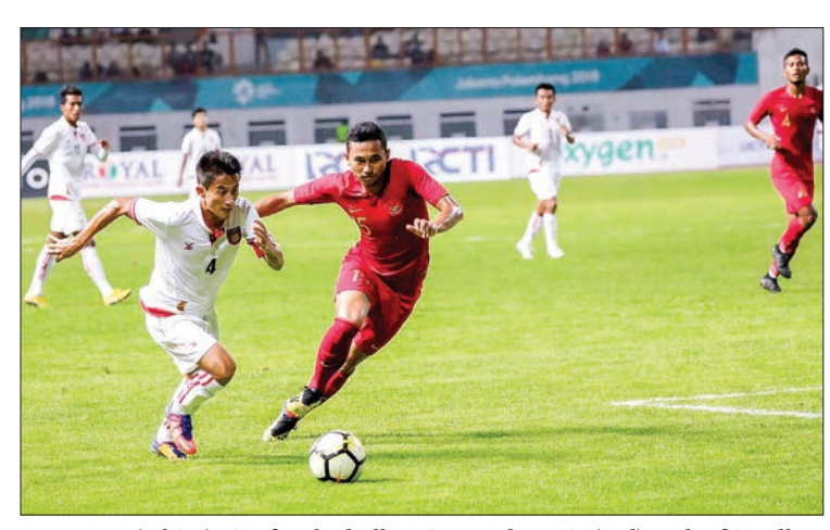
Myanmar (white) vies for the ball against Indonesia (red) at the friendly match at the Wibawa Mukti Stadium in Indonesia.

He also pointed out that the clubs promoted to the Premier League in 2016-17 all stayed up last season, while those relegated did not bounce back to the top flight. — AFP ■