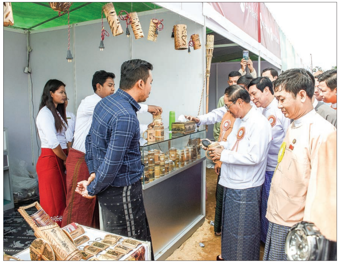
Vice President U Myint Swe viewing traditional utensils at the opening ceremony of 6<sup>th</sup> Product Exhibition of Micro, Small and Medium Enterprises (MSMEs) in Nay Pyi Taw and Bago Region.

Only when economically innovative thoughts and views are developed and better production and services are provided can we compete with regional businesses and penetrate the internation-