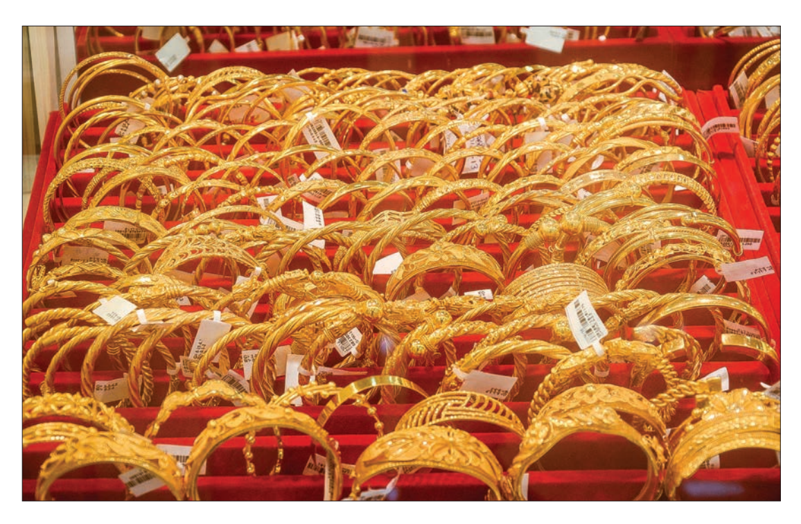
Gold jewellery displayed at a shop in downtown Yangon.

THE domestic gold price climbed up above Ks1 million per tical (1.729 OZ) in recent days, which crashed the market, according to domestic gold market.