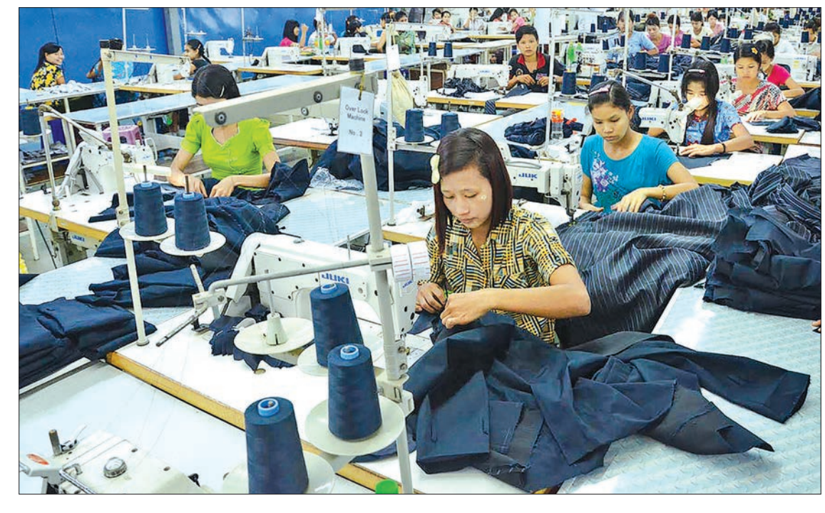
Employees working at a production line of a large garment factory in Hlinethaya Township.

During the last fiscal year 2017-2018, YRIC allowed 39 foreign businesses and 9 domestic projects to invest in Yangon Region, with a capital of $56.6 million and Ks2.3 billion, creating 22,481 jobs. Between April and October