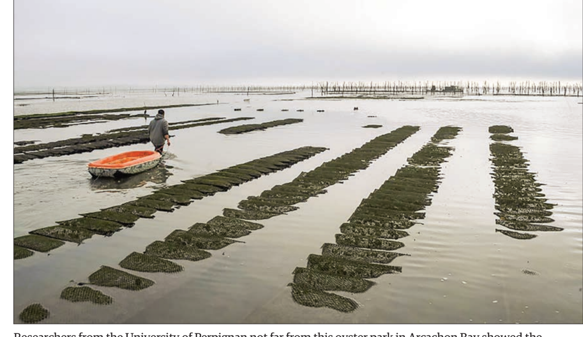
Researchers from the University of Perpignan not far from this oyster park in Arcachon Bay showed the disease-complex hits both farmed and wild Crassostrea gigas oysters, by far the largest commercial species in the world.

That probe returned from a smaller, potato-shaped, asteroid with dust samples in 2010, despite various setbacks, during an epic seven-year odyssey hailed as a scientific triumph.—AFP ■