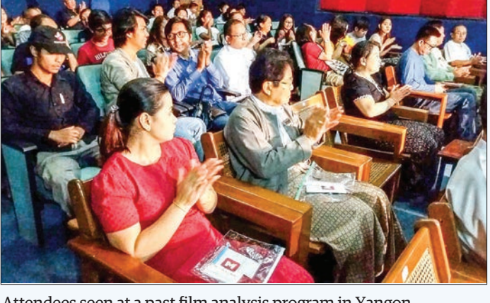
Attendees seen at a past film analysis program in Yangon.

for Information, Union Minister for Trade, Union Minister for Planning and Finance, Constitutional Tribunal of Myanmar, Anti-Corruption Commission, Union Civil Service Board, Office of the Auditor General of the Union, directors general from departments, Union of Myanmar Federation of Chambers of Commerce and Industry, deputy ministers, chairmen, members and deputy directors general from Office of the Union Enterprise for Humanitarian Assistance, Resettlement and Development in Rakhine. — MNA ■