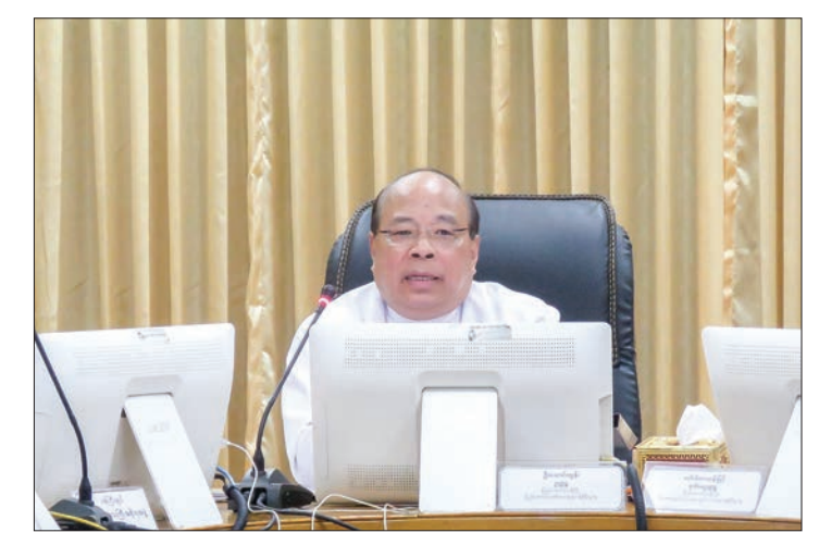
Chairman of MIC U Thaung Tun attends the Myanmar Investment Commission (MIC) meeting (17 / 2018) in Yangon.

Deputy Minister for Information U Aung Hla Tun, Hluttaw Speaker U Tin Maung Tun, Senior Tatmadaw Officials, Foreign Ambassadors to Myanmar, Charge d'affaires, representatives from UN organisations and invited guests attended the ceremony. --MNA 🔳