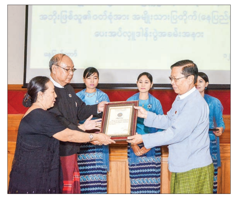
Union Minister Thura U Aung Ko presents certificate of honour to Amyotha Hluttaw Speaker Mahn Win Khaing Than for donation of martyr Mahn Ba Khaing's Kayin national dress in Nay Pyi Taw.