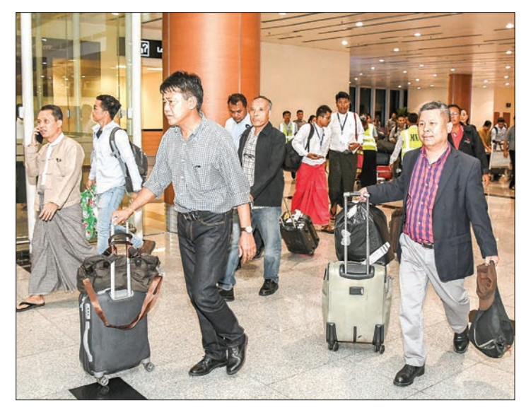
Nationwide Ceasefire Agreement signatories arrive at the Nay Pyi Taw international Airport yesterday.

Organisation (PNLO) Khun Myint Tun, Chairperson of All Burma Students' Democratic Front (ABSDF) U Than Khe, New Mon State Party (NMSP) Member of the central Committee Nai Aung Ma Ngay and Vice Chairperson of Lahu Democratic Union (LDU) Kyar Solomon. They were welcomed by responsible officials at the Nay Pyi Taw International Airport. — MNA