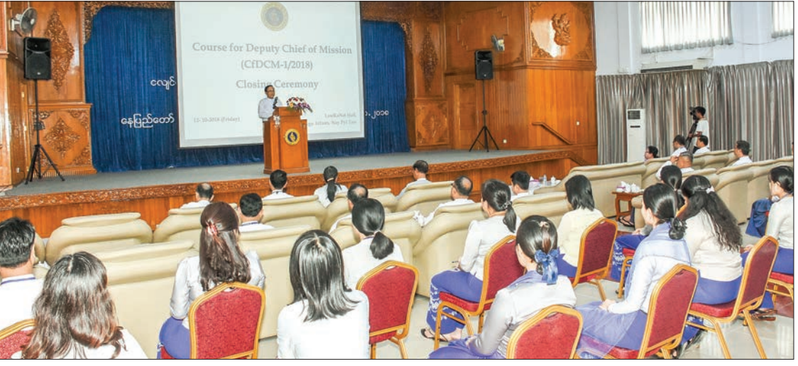
Union Minister U Kyaw Tin delivers a speech at the graduation ceremony for CFDCM (1/2018) in Nay Pyi Taw yesterday.

GRADUATION ceremony of Course for Deputy Chief of Mission (CFDCM) 1/2018 conducted by Strategic Studies and Training Department convened at the Ministry of Foreign Affairs in Nay Pyi Taw yesterday afternoon.