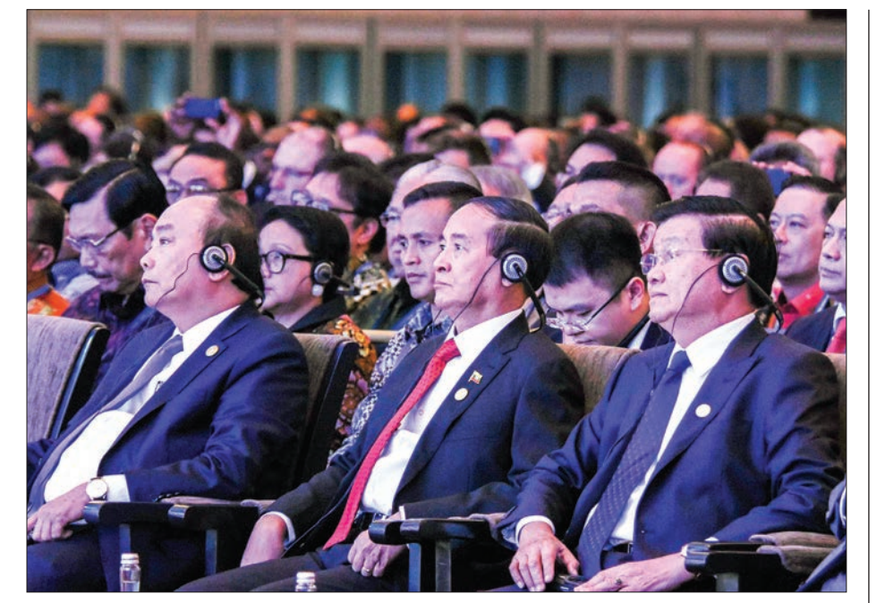
President U Win Myint attends the opening of IMF, World Bank annual meetings in Bali, Indonesia, yesterday.

Vol. V, No. 180, 4<sup>th</sup> Waxing of Thadingyut 1380 ME