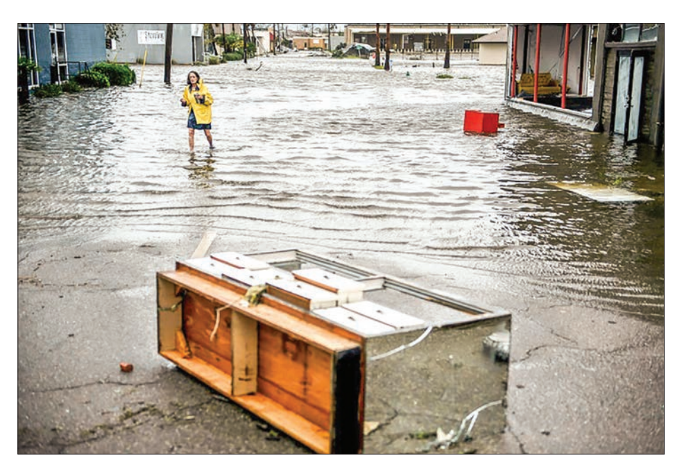
A flooded street after Hurricane Michael, the worst storm to hit Florida's Panhandle since records began in 1851, as scientists have warned that global warming will make storms more destructive.

about climate change more and more... and authors