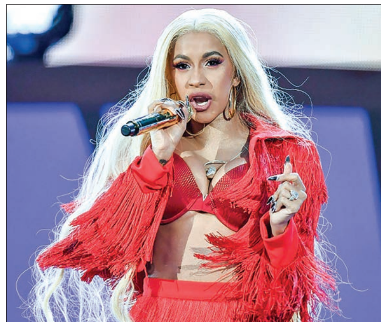
Celebrity gossip website TMZ reported that Cardi B allegedly ordered an attack on two bartenders at a strip club in Queens.

She urged young people to pay attention ahead of the November 6 midterm elections, in which President Donald Trump's Republican Party risks losing control of Congress.—AFP ■