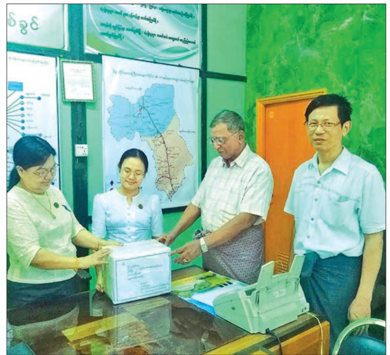
Myanmar Post Office staff providing free delivery service of donated books starting from 1 October.

Myanmar Post Office under the Ministry of Transport and Communications, is providing free delivery service of donated books to community centres (libraries) opened by the Ministry of Information to raise the reading frequency of the public. This service started on 1 October 2018 in all the 793 post offices throughout the whole country. —Maung Shwe Win (Pyay) ■