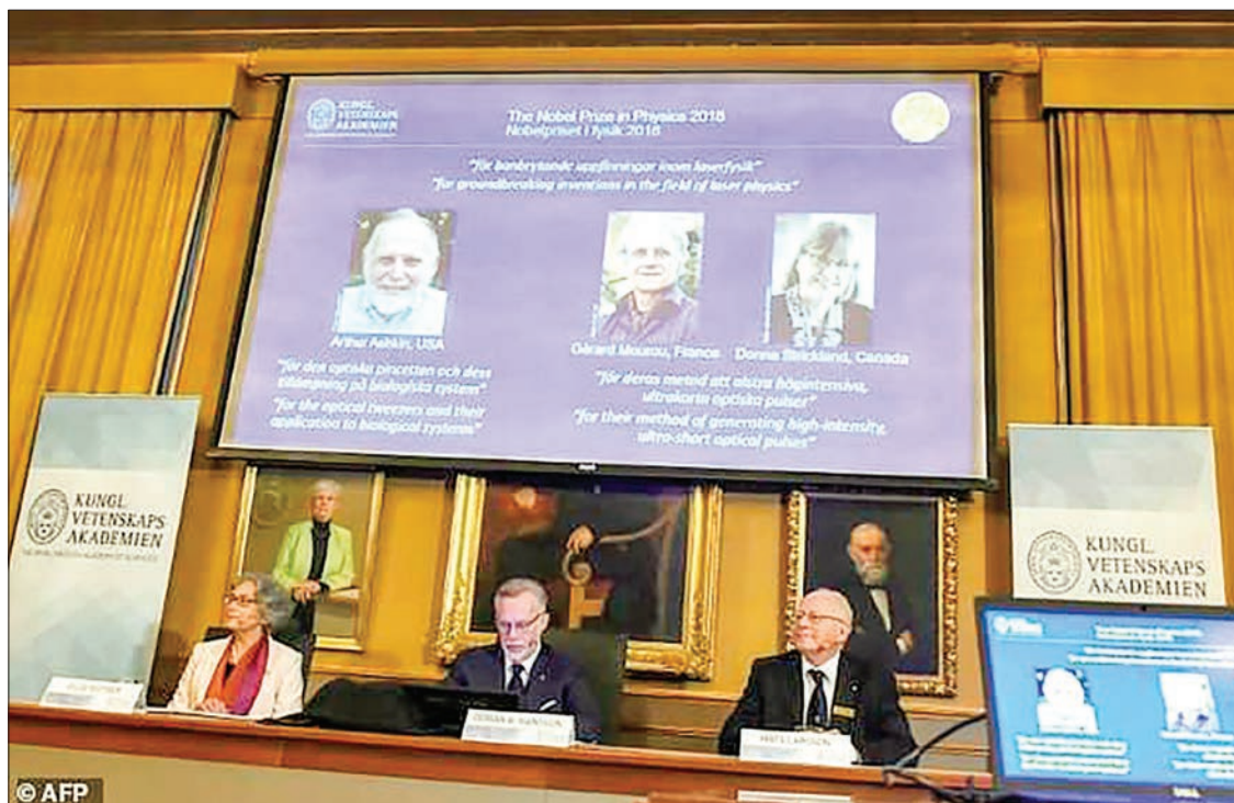
Arthur Ashkin of the US split the 2018 Nobel Physics Prize with Gerard Mourou of France and Donna Strickland of Canada.

The Royal Swedish Academy of Sciences has in the past lamented the small number of women laureates in the science