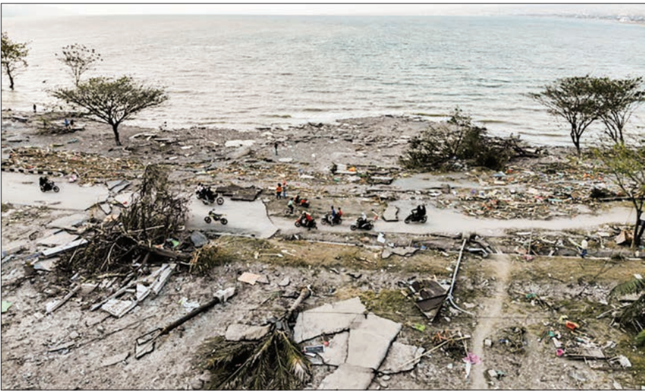
The tsunami crashed into the seaside city of Palu.

The Palu tsunami, by contrast, was generated by a strike-slip fault, where