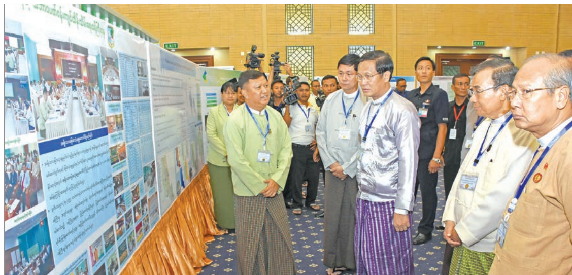
Vice President U Henry Van Thio looks around the exhibit showing works conducted on the establishment of national land use policy.

The forum will be continued today, and on the second day of the forum, land sector development of agriculture land, vacant, fallow and virgin land, co-existence of local ethnic nationals between people and forest and priority work processes of the National Land Use Council will be discussed, it is learnt. — MNA