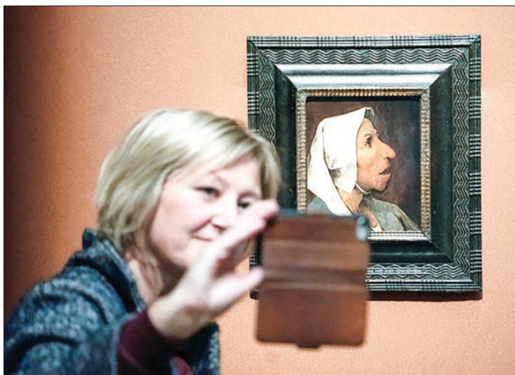
A visitor takes a selfie with the painting 'Head of a Peasant Woman' at the world's first monograph exhibition dedicated to Flemish master Pieter Bruegel the Elder in Vienna.