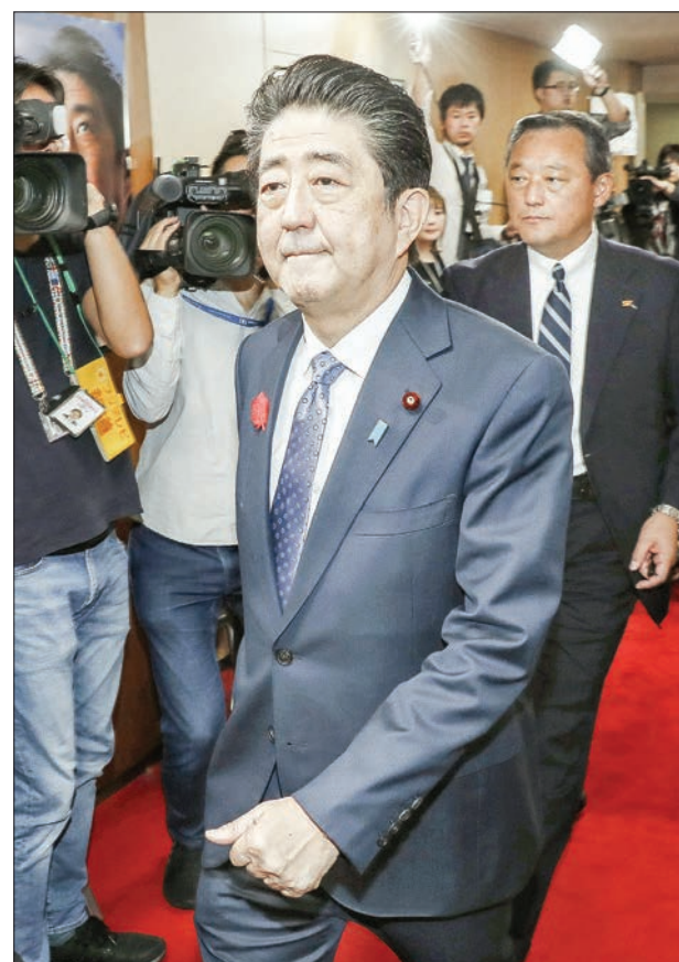
Japanese Prime Minister Shinzo Abe arrives at the headquarters of his ruling Liberal Democratic Party in Tokyo on 2 October, 2018.

The LDP president appointed former education minister Hakubun Shimomura as head of the party's panel promoting constitutional revision and welfare minister Katsunobu Kato