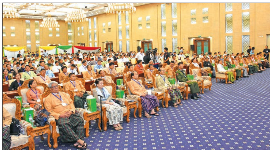
Vice President U Henry Van Thio delivers a speech at the National Land Use Policy Forum in Nay Pyi Taw yesterday.

In order to use and manage the land resources in the country sustainably, a national land use policy was drawn up with the participation of the people and