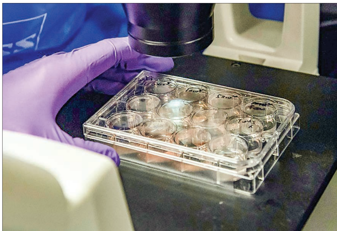
While chemotherapy destroys cancerous cells along with normal cells, often with toxic and debilitating effects on a patients' body, immunotherapy unleashes the body's immune system to target tumour cells.

Goldstein, whose team first identified the CTLA-4 molecule in 1987, said the results have been very promising. —AFP ■