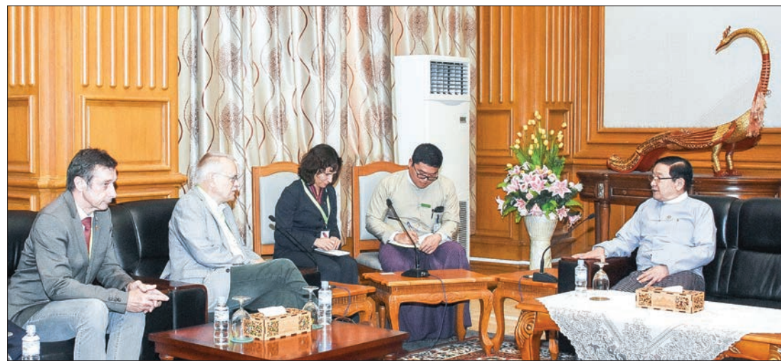
Pyithu Hluttaw Speaker U T Khun Myat holds talks with Mr. Uwe Kekeritz in Nay Pyi Taw.

PYITHU Hluttaw Speaker U T Khun Myat received H.E. Mr. Uwe Kekeritz, Deputy Chairman for Economic Cooperation and Development Committee of Germany's lower house of