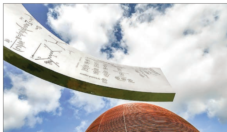
The European Organization for Nuclear Research (CERN) has disavowed a guest scientist who claimed physics was “built by men”.

“CERN considers the presentation delivered by an invited scientist during a workshop on High Energy Theory and Gender as highly offensive,” the lab said in a statement. —AFP ■