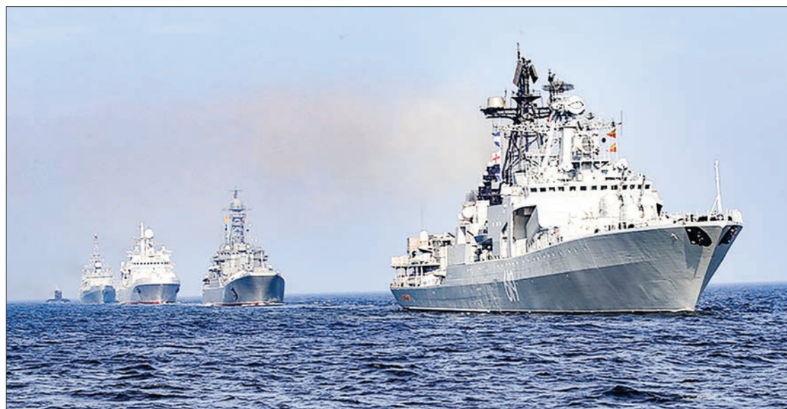
The large anti-submarine warship, the Severomorsk, has sailed into the Indian Ocean from the Red Sea where it will be protecting civilian vessels against pirates.

According to the Hurriyet daily, police launched simultaneous operations in 40 provinces across the country to capture the suspects who allegedly received commissions for sending money to 28,088 accounts abroad. The suspects have reportedly transferred some 2.5 billion Turkish liras (about 420 million US dollars) to the accounts mostly belonging to Iranians living in the United States. The investigation, being conducted by the Istanbul Chief Public Prosecutor’s Office, aimed at those “who targeted the economic and financial security of the Turkish Republic,” Hurriyet said.— AFP ■