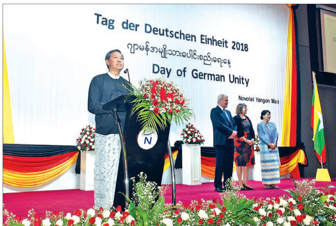
Union Minister Dr. Myo Thein Gyi delivers a message of greetings at the German Unity Day in Yangon yesterday.