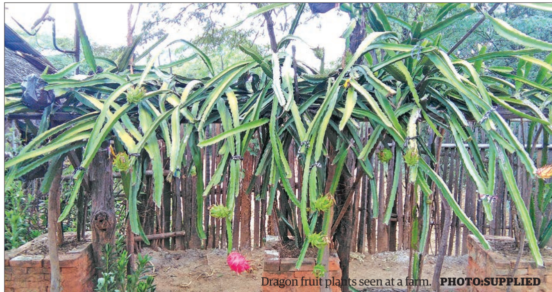
Dragon fruit plants seen at a farm.

HIGHER production of dragon fruits with extended plantation has brought down the price of the fruit this harvest season.