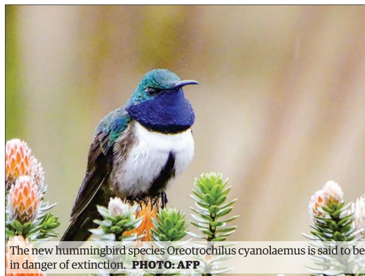
The new hummingbird species Oreotrochilus cyanoaemus is said to be in danger of extinction.