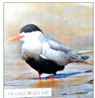
Oriental Bird Club