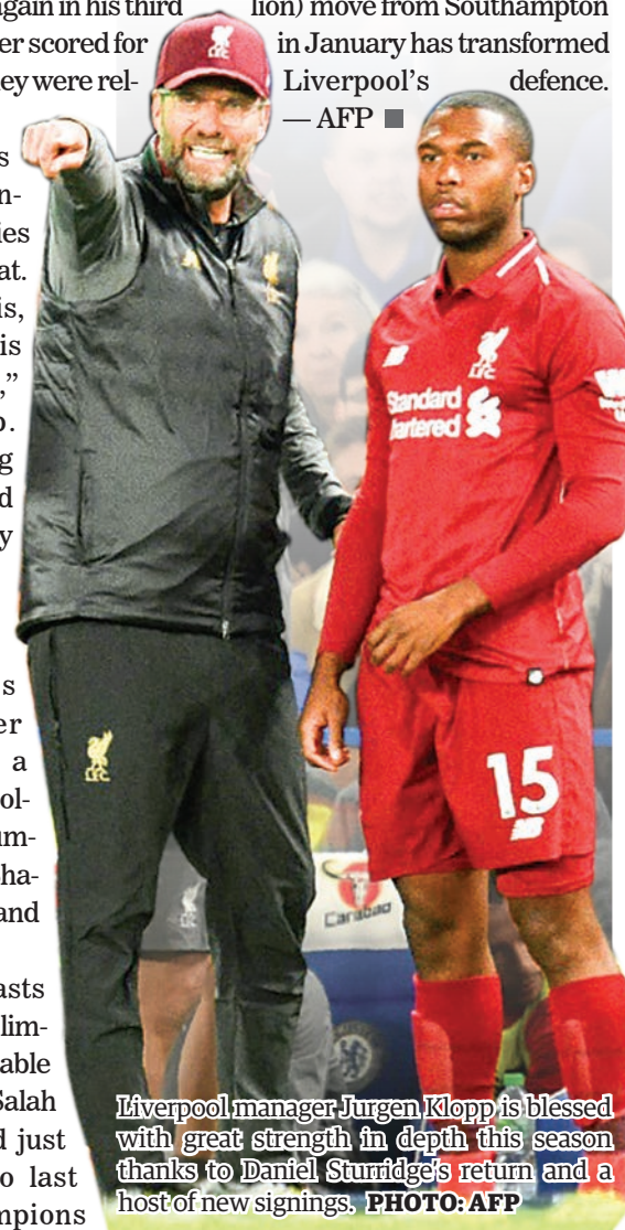
Liverpool manager Jurgen Klopp is blessed with great strength in depth this season thanks to Daniel Sturridge's return and a host of new signings.

"We have a great squad, world-class players, and he's one of them," said Virgil van Dijk, whose own £75 million ($98 million) move from Southampton in January has transformed Liverpool's defence. — AFP ■