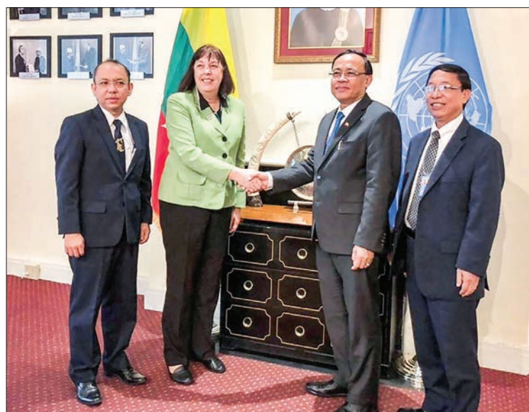
Union Minister U Kyaw Tin shakes hands with Ms. Virginia Gamba, Special Representative of the United Nations Secretary-General for Children and Armed Conflict in New York.

At the meeting, the Union Minister briefed her on Myanmar's achievements in solving Rakhine State issue, including repatriation, resettlement and rehabilitation of displaced people. — MNA ■