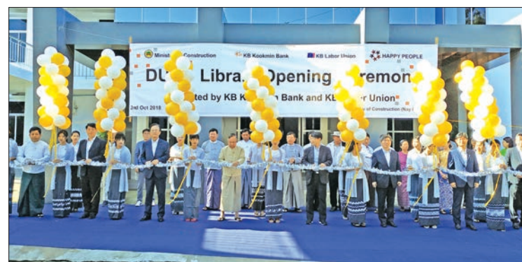
Union Minister U Han Zaw and ROK's representatives cut ribbon to open library donated by ROK's KB Kookmin Bank and KB Labour Union in Nay Pyi Taw.

It was reported that the donation purposes of the KB Kookmin Bank are to keep the information concerned with civil housing sector in beneficial and systematic ways, to be able to use and share the advanced information for the staffs under the Ministry of Construction, to improve the work efficiency of the ministry, and for the library to become an information hub that contributes new values to the ministry. — MNA ■