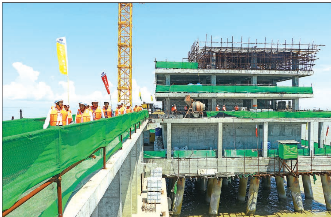
Union Minister U Thant Sin Maung inspects the construction process of a fixed pilot station.

When the weather is bad, pilot vessels have to move to a safe place, they are unable to get enough rest, there is an increase vessel maintenance