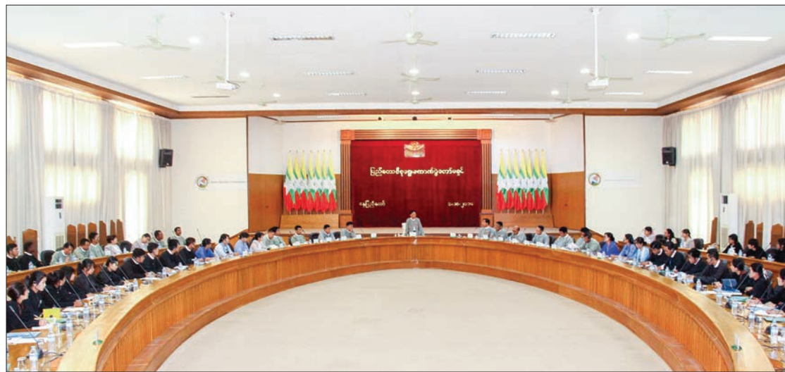
UEC Chairman meets with faculty members and students of Department of Law from Mawlamyine University on an observation trip to Union Election Commission in Nay Pyi Taw yesterday.

THE Chairman of the Union Election Commission (UEC), UEC members, and officials from the UEC office received an observation group from Mawlamyine University, led by the head professor of the Department of Law and including 6 faculty members and 68 fifth-year law students, at the meeting hall of the UEC office in Nay Pyi Taw yesterday.