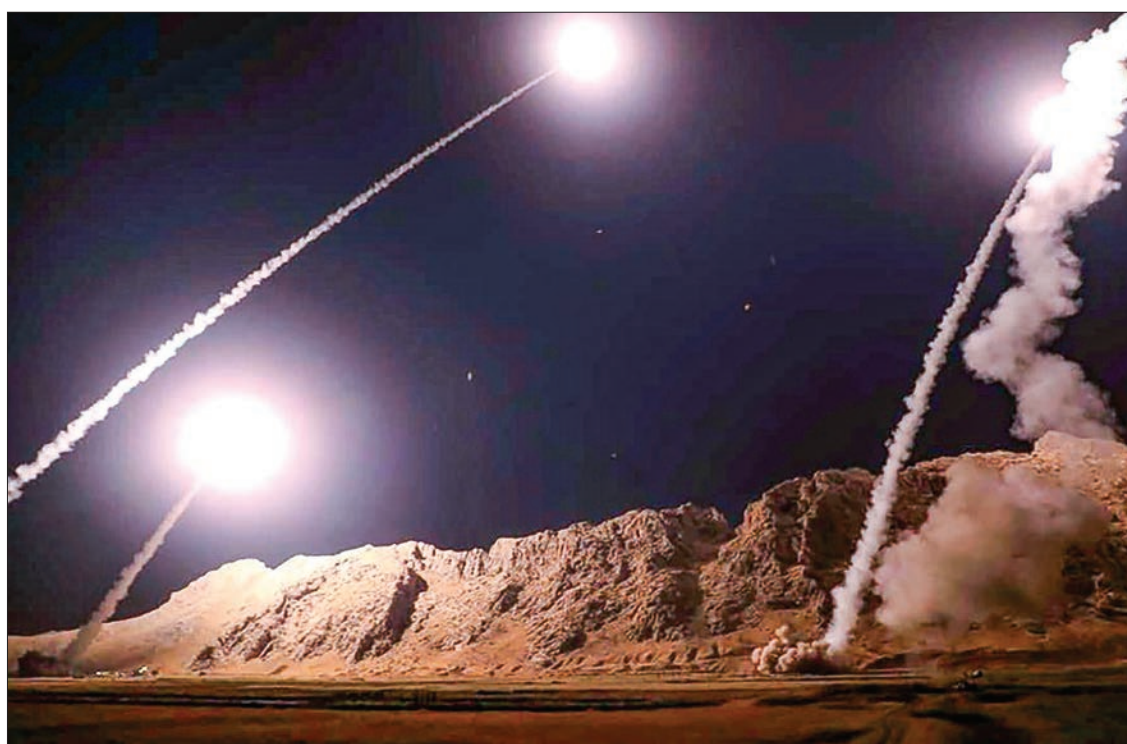
Iran Revolutionary Guard photo shows missiles being launched from an undisclosed location to target militants in eastern Syria.

Iranian President Hassan Rouhani had vowed a "crushing" response in retaliation.—AFP ■