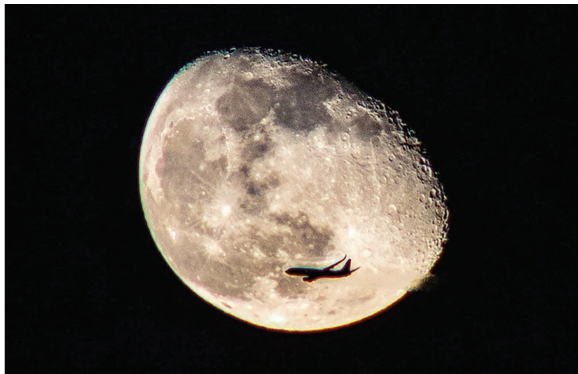
Roscosmos corporation said Russia had plans for building its own base for space crews on the surface of the Moon.