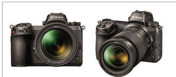
Photo shows Nikon Corp.'s full-frame mirrorless cameras "Z7" (l), which went on sale in September 2018, and "Z6" to be released in November.

BANGKOK — Japanese camera maker Nikon Corp. has shifted its Asian sales target to a photo-uploading younger generation from professionals, offering handier models and opening its first showroom in Thailand. "The new full-frame mirrorless Z series is designed in response to demand from many customers for a cam-