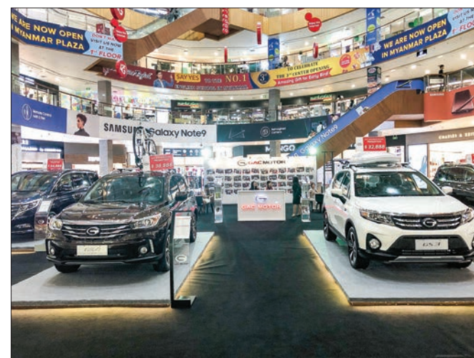
GAC Motor, showcased its signature vehicle models in Myanmar Plaza promotion area starting from 28 to 30 September. Models include the GS7, GM8, GS8, GS4, GS3 and GA4. —GNLM

CHIEF JUSTICE of the Union U Htun Htun Oo, Supreme Court judges U Myint Aung and U Khin Maung Kyi of Special Appellate Bench sat at Union Supreme Court Room number 1 yesterday morning and heard four (Certiorari) civil cases and passed judgment on six (Certiorari) civil cases. —MNA