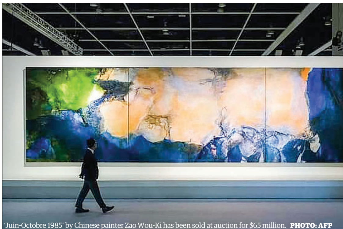
‘Juin-Octobre 1985’ by Chinese painter Zao Wou-Ki has been sold at auction for $65 million.

The book has been previously adapted into a 1978 film, with Peter Ustinov as Poirot along with Bette Davis, Mia Farrow, Maggie Smith, among others. —PTI ■