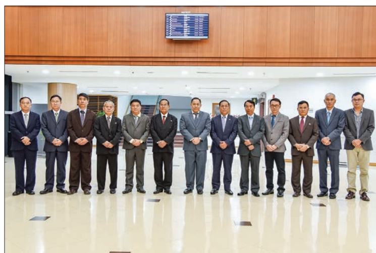
A delegation of JMC-U poses for a documentary photo before departure for Nepal at the Yangon International Airport.

A DELEGATION from the Union-level Joint Monitoring Committee — (JMC-U), led by Chairman Lt-Gen Yar Pyae, left for Nepal yesterday to observe the peace process in the country. The delegation flew from Yangon to Bangkok, Thailand, and then flew from there to Kathmandu Airport in Nepal.