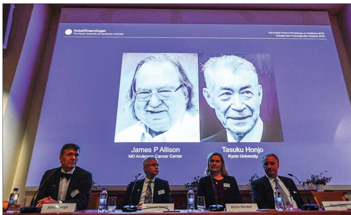
Members of the Nobel Committee for Physiology or Medicine sit in front of a screen displaying James P Allison (l) and Tasuku Honjo, the winners of the 2018 Nobel Prize in Physiology or Medicine, during a press conference at the Karolinska Institute in Stockholm, Sweden on 1 October, 2018.

Writing on his cancer centre's website, Allison said he was "honoured and humbled to