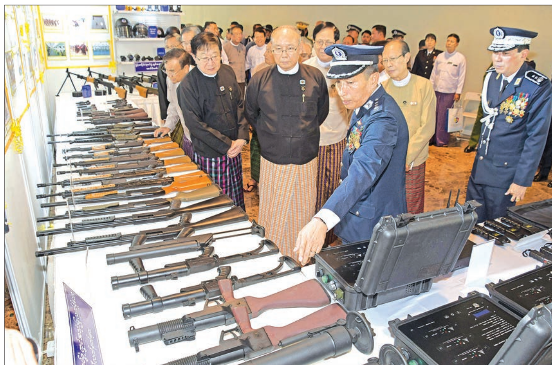
Pyithu Hluttaw Speaker U T Khun Myat and Amyotha Hluttaw Speaker Mahn Win Khaing Than look around the exhibition booths of Myanmar Police Force.

Outstanding police were also honored at this event.—MNA ■