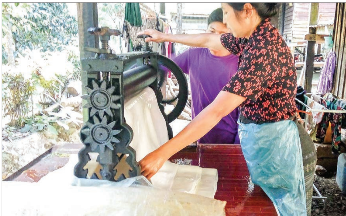
Workers rolling raw rubber into sheets before drying in the sun.

ers are not consistent enough in assessing the quality of their products, as it varies across farms. Therefore, Myanmar’s rubber is sold at $400 per ton lower than the global market price.