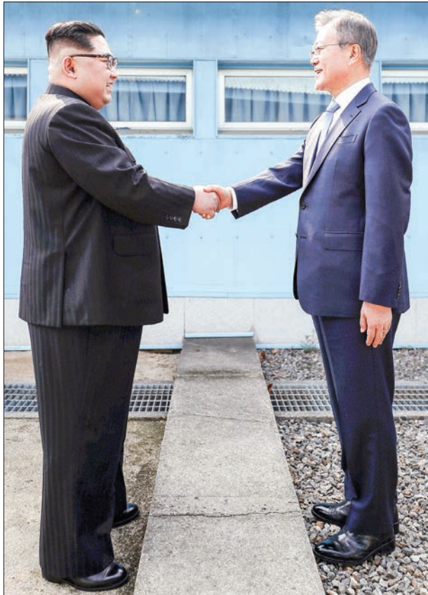
South Korean President Moon Jae In (R) and North Korean leader Kim Jong Un shake hands across the border between their countries at Panmunjeom in the Demilitarized Zone on April 27, 2018.

The ministry sees the land mine removal work as the first step toward preventing armed conflict between the Koreas, a goal stipulated in the side