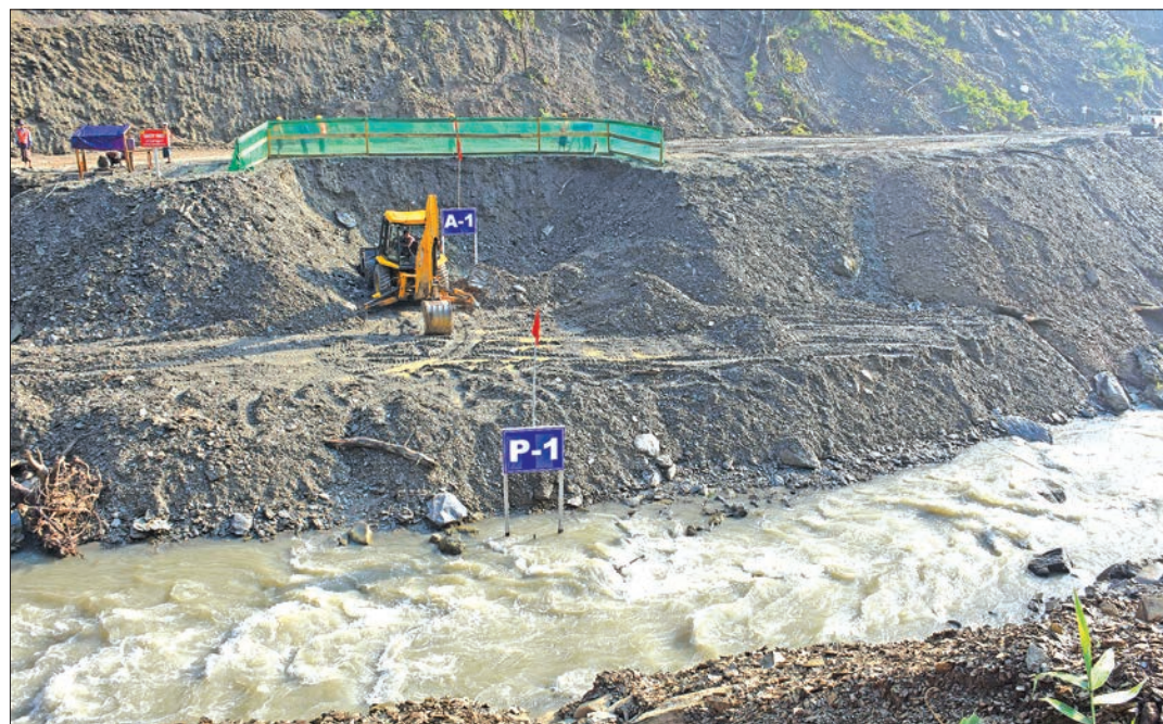
Vice President U Henry Van Thio inspects Botvar bridge construction site in Chin State yesterday.