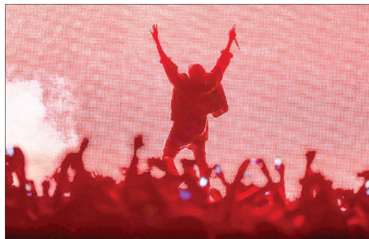
Now known as Ye, the artist Kanye West, shown performing at the 2014 Bonnaroo Music & Arts Festival in Manchester, Tennessee, is one of the few celebrities — and one of the only prominent African Americans — to support President Donald Trump.

West closed the show by singing a track off “Ye” while wearing one of President Donald Trump’s signature red “Make America Great Again” caps. —AFP ■