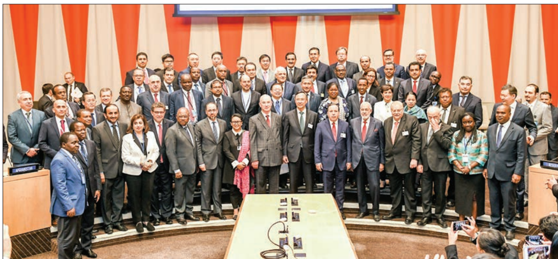
Ambassador U Hau Do Suan poses for a photo with participants at the High-Level Special Event for signature of the “Code of Conduct towards Achieving a World Free Terrorism” in New York.

The Code of Conduct will help to promote a global alliance of countries committed to prevent and fight against terrorism. Likewise, it also creates a venue for the countries to strengthen cooperation with the United Nations to implement recommendation embedded in the United Nations Global Counter-Terrorism Strategy (GCTS) and United Nations Global Counter-Terrorism Strategy Review. — MNA ■