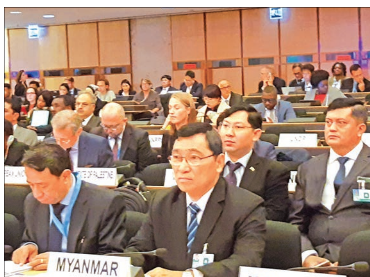
Union Minister Dr. Win Myat Aye attends the 69 th meeting of the Executive Committee of the High Commissioner's Programme in New York.

"We attach great importance to needs to create peace, stability