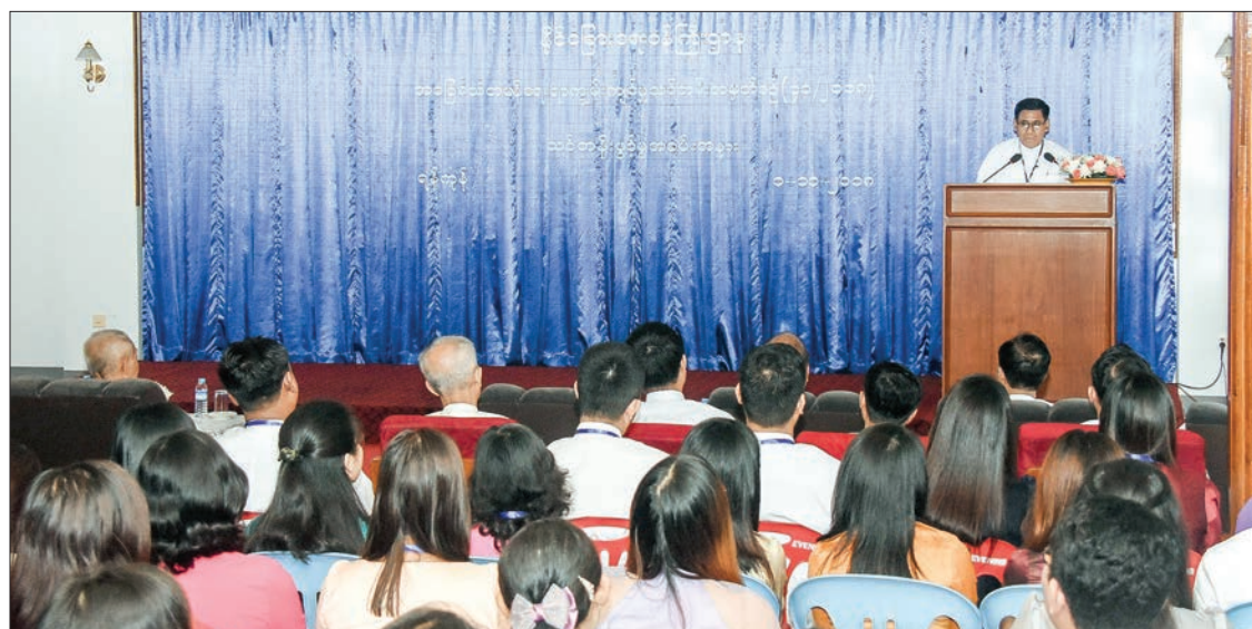
Permanent Secretary U Myint Thu delivers a speech at the inauguration ceremony of the Certificate Course in Basic Diplomatic Skills (41/2018) in Yangon.

THE inauguration ceremony of the Certificate Course in Basic Diplomatic Skills (41/2018), conducted by the Ministry of Foreign Affairs, was held at Wunzinminyarzar Hall of the Ministry in Yangon at 10:00 am yesterday, with opening remarks delivered by U Myint Thu, Permanent Secretary of the Ministry of Foreign Affairs.