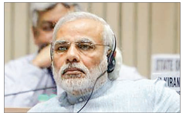
Prime Minister Narendra Modi.

His remarks came days after India called off the planned meeting of foreign ministers in New York, citing the brutal kill-