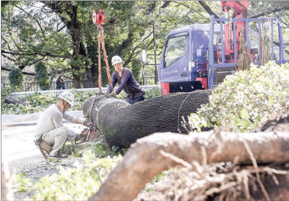
Work is underway to clear a tree knocked down by Typhoon Trami from a street in Tokyo on 1 October, 2018.

On 4 September, Typhoon Jebi flooded a terminal and a runway at Kansai airport, built on an artificial island, and caused a tanker to smash into and damage a bridge connecting the airport with the mainland, stranding thousands of people at the airport at one point.—Kyodo News ■