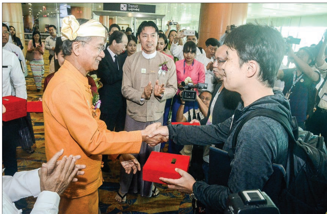
Union Minister for Hotels and Tourism U Ohn Maung welcomes tourists at the Yangon International Airport yesterday.

Afterwards, the Union Minister, together with the Chinese military attaché, and other officials greeted and welcomed the 109 Chinese tourists from Air China (CA-415) flight and gave them gifts. The tourists were entertained with Kyaukse elephant dance, Thu Nge Taw dance, and