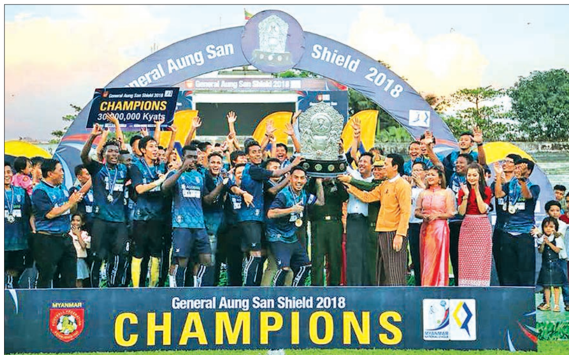
Yangon United team which won the General Aung San Shield 2018 for the first time.