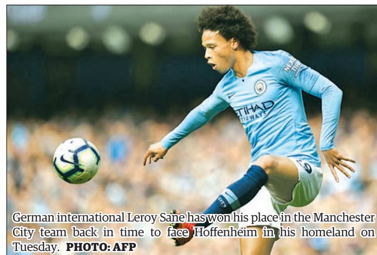
German international Leroy Sane has won his place in the Manchester City team back in time to face Hoffenheim in his homeland on Tuesday.