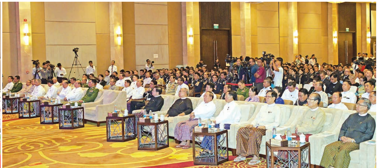
Vice President U Myint Swe delivers an opening address at the 54 th Myanmar Police Force Day celebration in Nay Pyi Taw yesterday.

VICE President U Myint Swe delivered a speech at the 54 th Myanmar Police Force Day held in Thingaha Hotel, Nay Pyi Taw, yesterday morning.