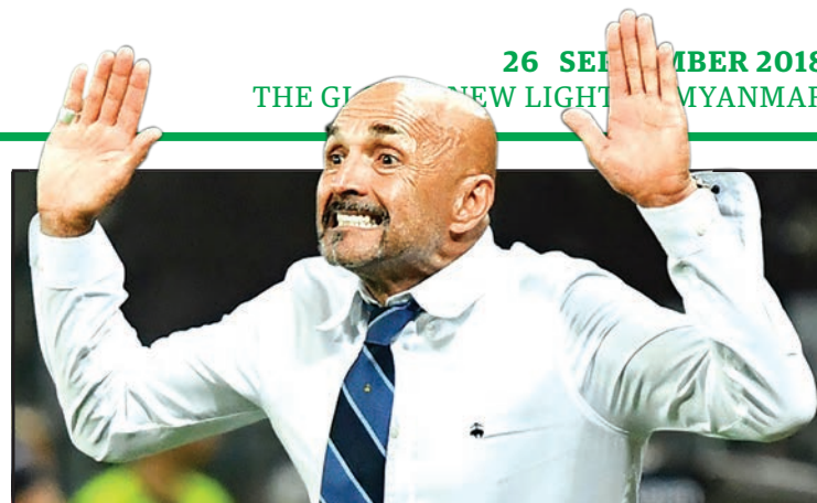
Inter Milan coach Luciano Spalletti has been banned from the touchline for one match for his over exuberant goal celebration.

Modric beat out Liverpool's Egyptian forward Mohamed Salah and Ronaldo, who along with Messi did not attend the glitzy awards ceremony in London. — AFP ■