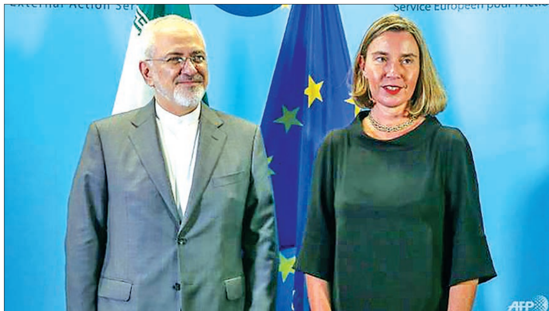
EU foreign policy chief Federica Mogherini (r), speaking alongside Iranian Foreign Minister Mohammad Javad Zarif (l), said the countries were still working out the technical details.

EU foreign policy chief Federica Mogherini, speaking at the United Nations alongside Iranian Foreign Minister Mohammad