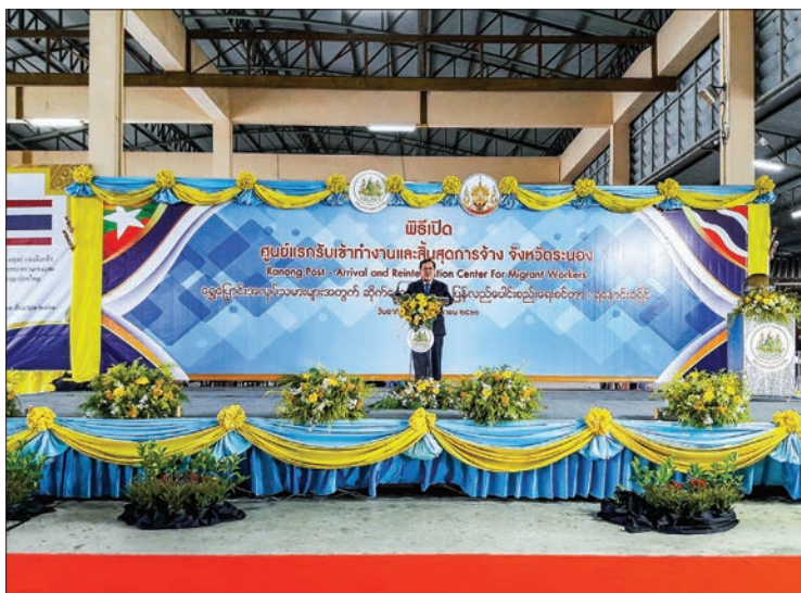
Union Minister U Thein Swe addresses a meeting with migrant worker assistance groups in Bangkok on 22 September.

At the meeting, the Union Minister spoke of his gratitude and appreciation to the worker assistance groups for taking care of Myanmar workers and families in Thailand, requirement to conduct matters according to the law of the relevant country, five embassy officials in Thailand being ready to assist where necessary and Myanmar workers in the past crossing the border illegally and being exploited, trafficked and forced to work. He then said that, at present, workers were being sent under an MoU system that protects and provides full rights. The situation