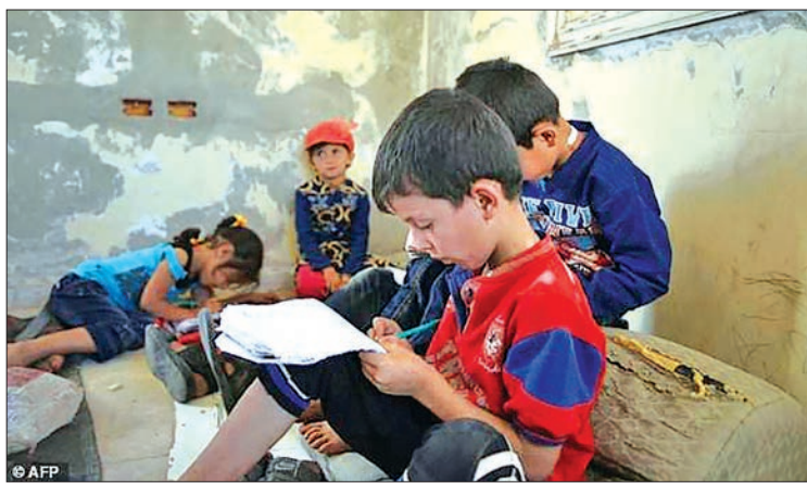
Displaced Syrian children attend class at a makeshift school in an opposition-held area in the west of the northern province of Aleppo.