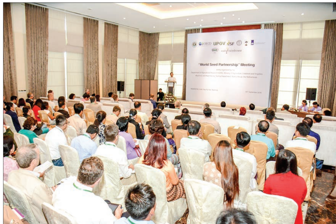
Union Minister Dr. Aung Thu addresses the “World Seed Partnership meeting” in Nay Pyi Taw yesterday.

In that meeting, they mainly discussed developing rights of plant breeders and growers, increasing the investment from international seeds and plants breeders companies and to be able to distribute seeds internationally by Myanmar, in accordance with international standards.—MNA ■