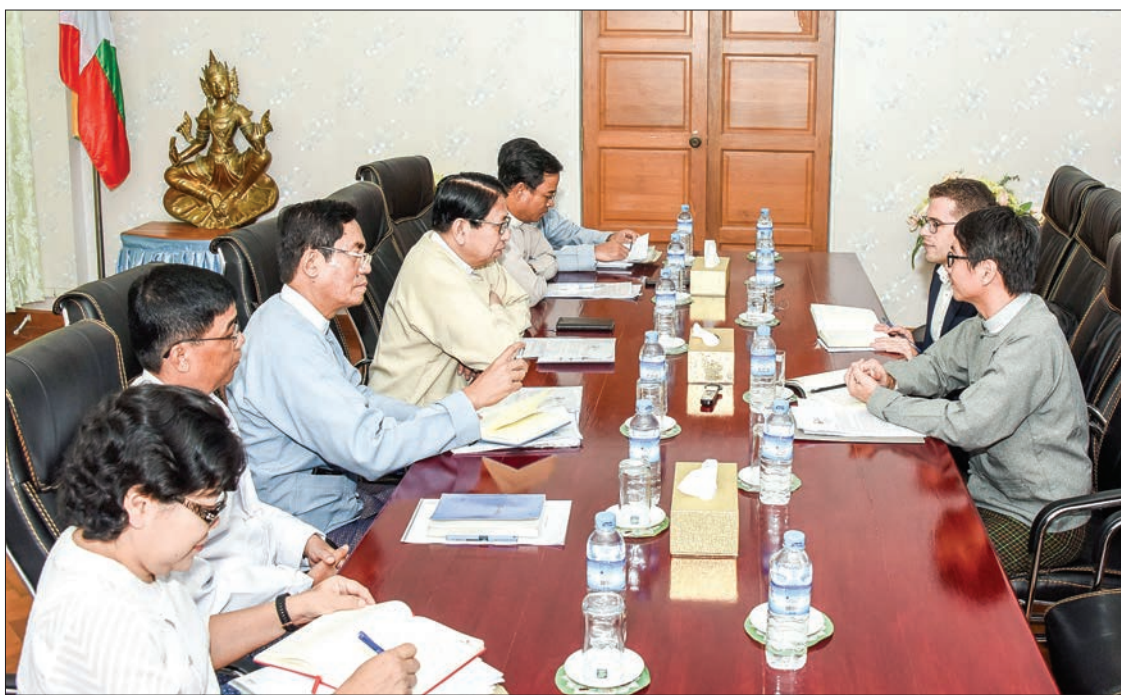
Union Minister Dr. Pe Myint meeting with the UNESCO and IMS/Fojo delegation yesterday.

Also present at the meeting were Deputy Minister U Aung Hla Tun and officials of the ministry. —MNA ■