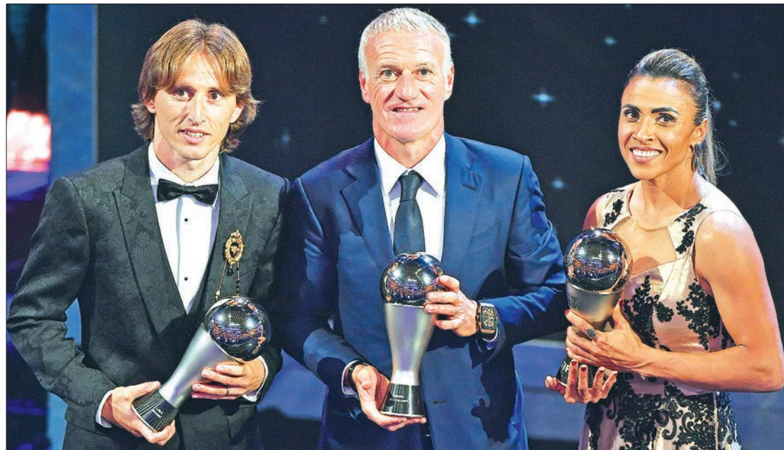
France's coach Didier Deschamps (c), winner of the Best FIFA Men's Coach of 2018 Award, is flanked by Orlando Pride and Brazil forward Marta (r) and Real Madrid and Croatia midfielder Luka Modric (l) winners of the Best FIFA Women's and Men's Player of 2018 Award, as they pose for a photograph with their trophies during The Best FIFA Football Awards ceremony, on 24 September, 2018 in London.

LONDON (United Kingdom) — Luka Modric ended Cristiano Ronaldo and Lionel Messi's decade-long domination of football's individual awards by being crowned FIFA's best player of the year on Monday. The Real Madrid and Croatia midfielder