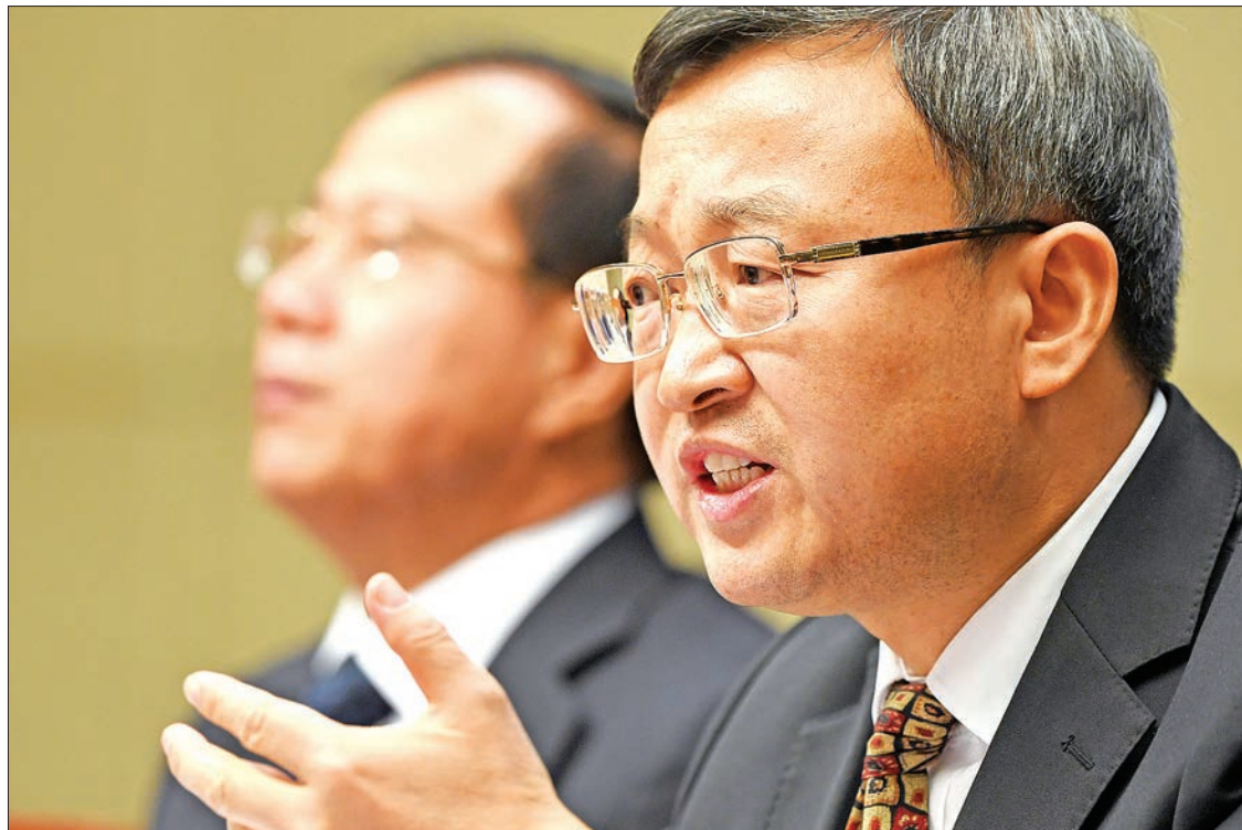
China’s Vice Minister of Commerce Wang Shouwen speaks at a press conference in Beijing on 25 September, 2018.

Officials in Beijing said they planned to step up support for harmed industries and compa-