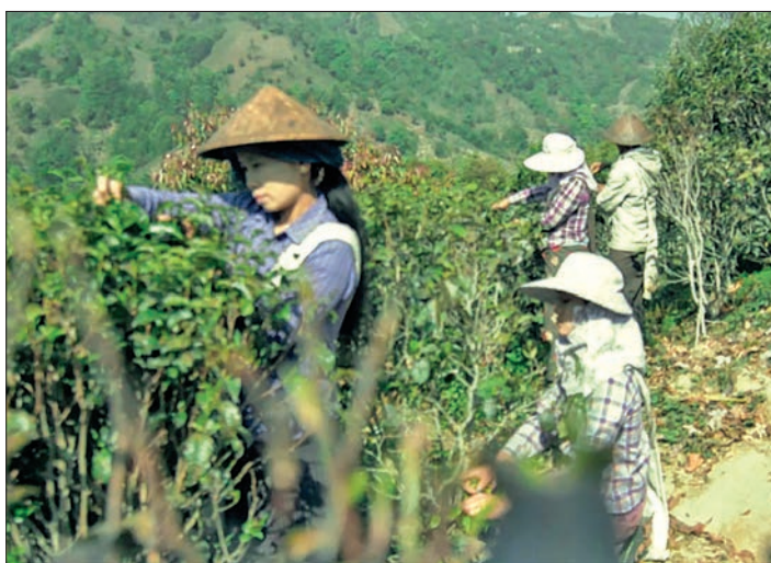
Farmers harvesting tea leaves in a hilly region. The number of tea leaf consumers has increased in the US.

social responsibility in supply chain from farm to consumers. We try to offer better services and support to the market", she continued.