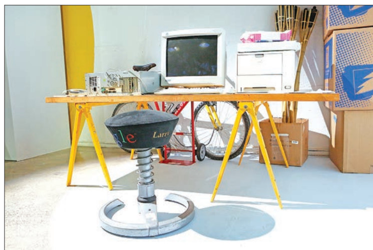
Google co-founder Larry Page's original stool and desk are displayed at Google Search's 20 th Anniversary Event on 23 September, 2018 in San Francisco, California.

SAN FRANCISCO — Google unveiled changes on Monday aimed at making the leading search engine more visual and intuitive to the point that it can answer questions before being asked.