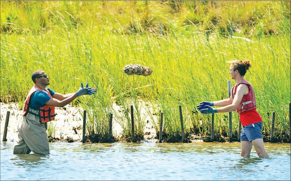
Workers with the Billion Oyster Project chuck net sacks of oyster shells down a human chain, before planting them in containers on the riverbed to build an oyster reef.

The waters of New York became too toxic to cultivate much marine life until the Clean Water Act of 1972 prohibited the dumping of untreated wastewater and garbage. Since then, life has slowly returned.