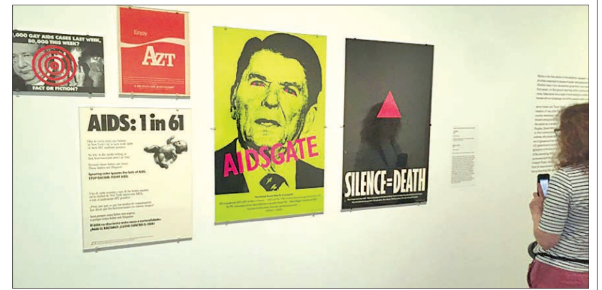
A woman looks at works by the SILENCE = DEATH Project (1987) at New York's Met Breuer museum as part of the "Everything Is Connected: Art and Conspiracy" show that runs through 6 January, 2019.

itself but the investigations that followed, notably the Warren and Church commissions that examined the actions of the US spy agencies, which drive the show.