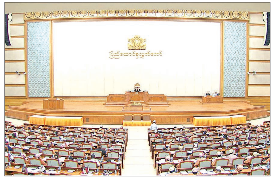
SEE PAGE-2 Second Pyidaungsu Hluttaw concluding its ninth regular session in Nay Pyi Taw yesterday.