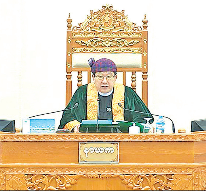
Speaker of Pyidaungsu Hluttaw UT Khun Myat.

cent during the suspension period and 1.5 per cent during the repayment period, according to the deputy minister.