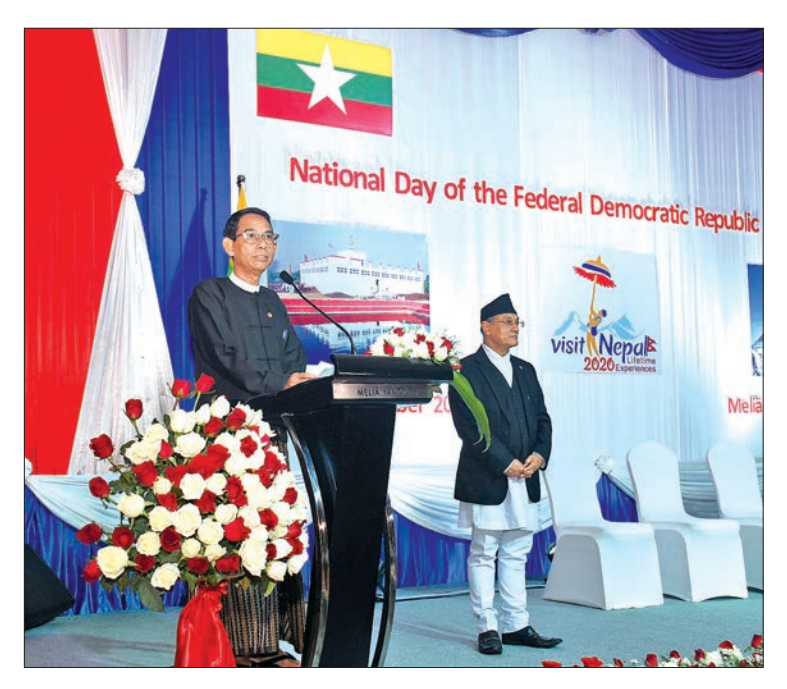
Union Minister Dr. Aung Thu delivers a speech at a celebration of the Nepali National Day in Yangon.

d'affairs, UN departmental representatives and other invited guests. —MNA