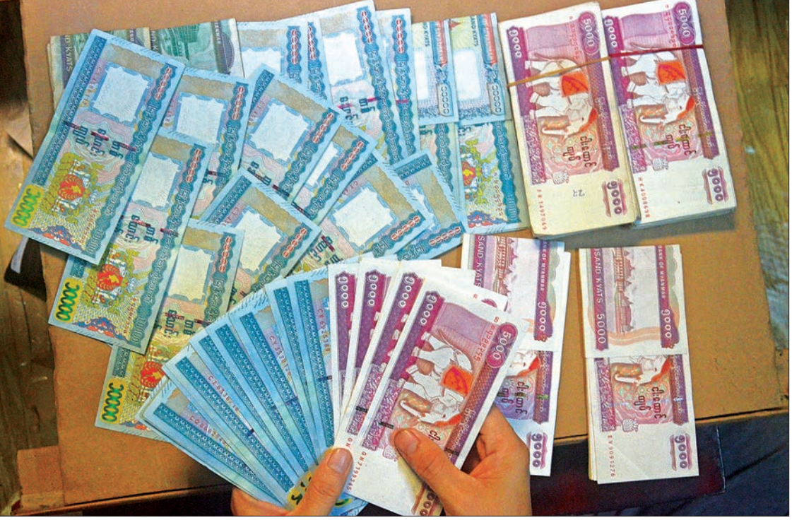
Myanmar local currency banknotes.

In the floating exchange rate regime, traders buying foreign currency in hard cash are more seen than international bankto-bank transfers or foreign exchange dealing services for large