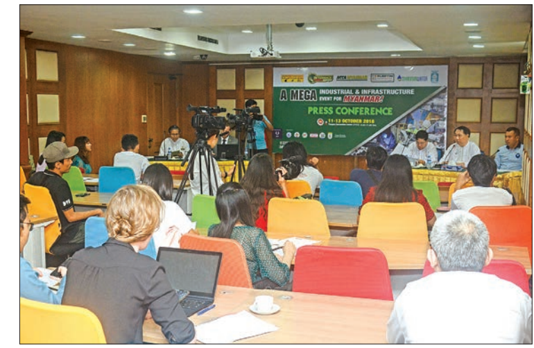
Industrial & Infrastructure Event holding a Press conference in Yangon.

Over 350 companies from 23 countries will showcase their products, technology and their services, including subcontracting, business-match-