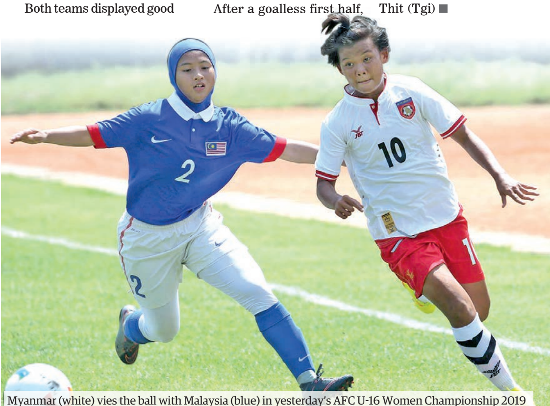
Qualifiers in Kathmandu, Nepal, yesterday.

Myanmar U-16 women team will next play against Nepal U-16, while Malaysia U-16 will play against the Philippines U-16 on Friday.