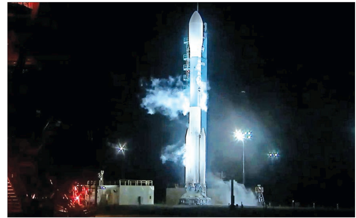
Cloaked in pre-dawn darkness, the $1 billion, half-ton ICESat-2 launched aboard a Delta II rocket from Vandenberg Air Force base in California at 6:02 am (1302 GMT).

The first ICESat revealed that sea ice was thinning, and ice cover was disappearing from