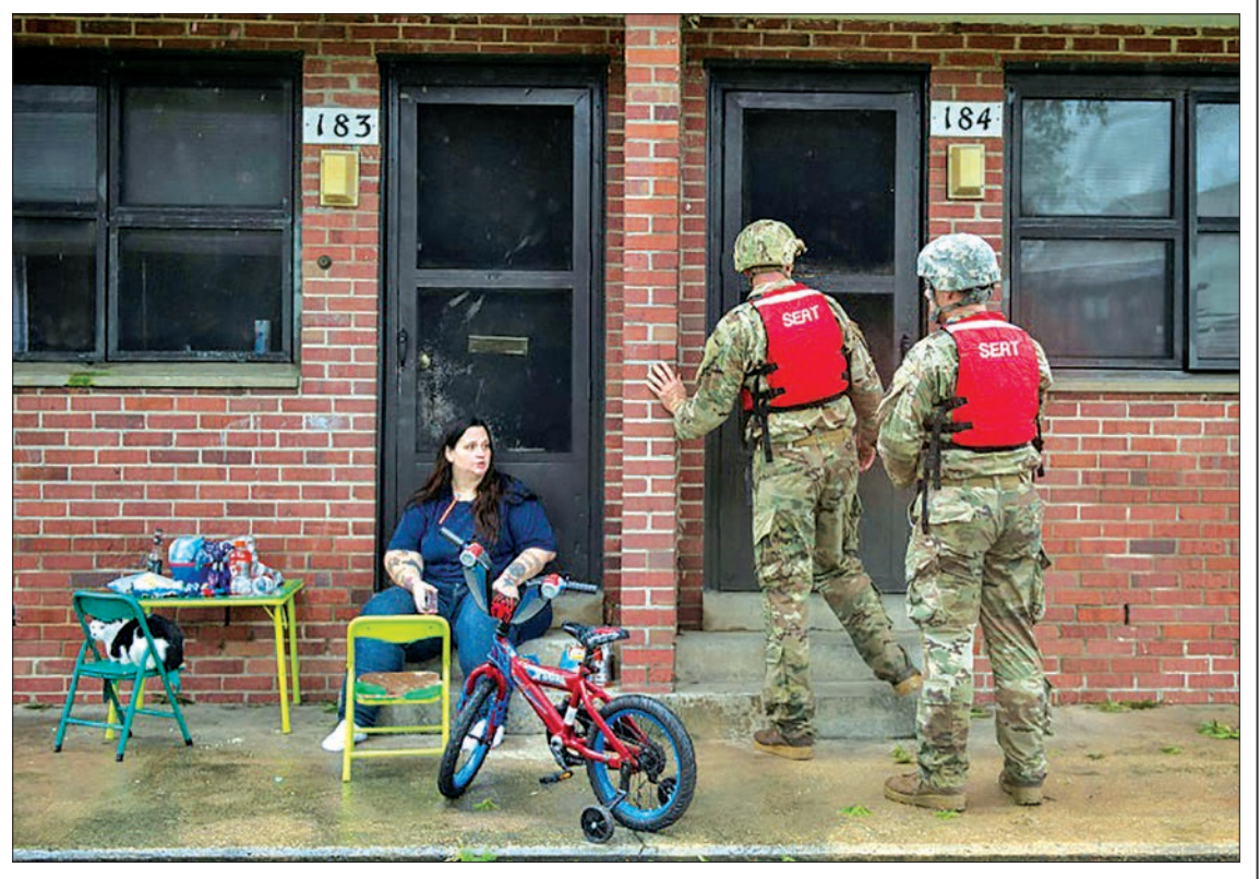
Members of the National Guard check a neighborhood in New Bern for anyone who needs help.

Debris litters the ground around their modest red brick home and neighbors have left