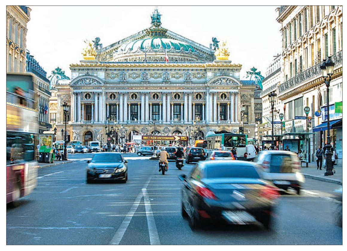
Starting in October, six historic districts in central Paris will remain traffic-free on the first Sunday of every month, including Opera, City Hall says.