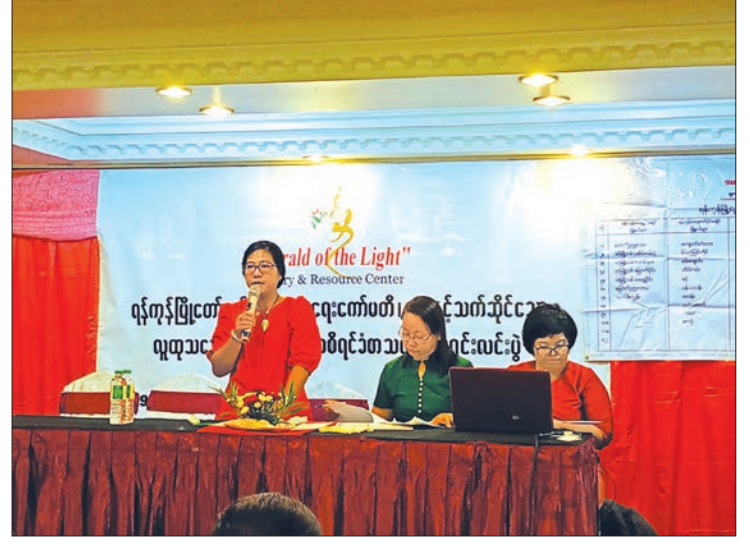
A media conference on public opinion survey report on YCDC being held at Orchid Hotel in Yangon.

Further aims are for the local government to implement essential reforms through awareness of public requirements and electing of representatives who truly represent the public in a democratic regional municipal