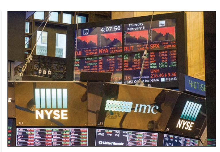
The closing numbers are displayed at the New York Stock Exchange on Wall Street. New York.

"Our level of spending for the moment is the lowest in the European Union, and it is truly alarming in the perspective of future development," Rasmusa noted.—Xinhua