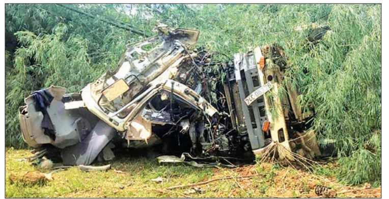
Photo taken on 15 September 2018 shows the site of a traffic accident in Viet Nam's Lai Chau province. A truck crashed into an inter-provincial coach in Viet Nam's northern mountainous Lai Chau province on Saturday, killing 12 people and injuring three others, the provincial police said.

HANOI — A truck crashed into an inter-provincial coach in Viet Nam's northern mountainous