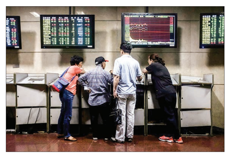
Shanghai is the world's worst-performing major stock market this year despite respectable corporate earnings

As a result, share valuations in relation to earnings are the most attractive in years, down as much as 50 percent compared to 10-year averages in some cases. Investors are waiting to pounce "like lions and leopards lurking in the