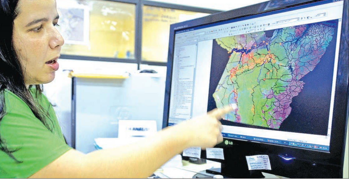
Priscila Santos, a Brazilian Environmental Intitute geographer, points at a satellite map to detect deforestation areas in Para state, northern Brazil, on 27 November 2009.

SAN FRANCISCO-In the Brazilian state of Para, every week, authorities receive alerts showing them which parts of the Amazon forest have been chopped down, with photos to back it up-.The pictures are taken every day at 10:30 in the morning by American satellites, offering a detailed view of every three to five meters on the ground.