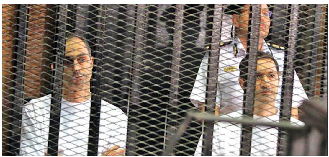
File photo taken on 9 July 2012 shows Gamal Mubarak(L) and Alaa Mubarak(R front) behind bars during a trial in Cairo. An Egyptian court ordered on Saturday the arrest of Gamal Mubarak and Alaa Mubarak, the sons of former president Hosni Mubarak, and two other defendants over charges of stock market manipulation, official Ahram news website reported. PHOTO: XINHUA

Alaa and Gamal Mubarak were put on trial over a number of corruption charges in the wake of the January 2011 uprising that led to the fall of their father's regime. —Xinhua