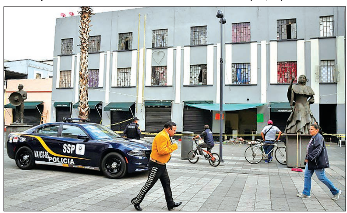
Downtown Mexico City's Plaza Garibaldi square the morning after gunmen dressed as mariachi musicians opened fire with rifles and handguns, killing four people and wounded nine others.

"There are five people who have died in the Plaza Garibaldi incident. Three men died at the scene and two women while in hospital," a prosecutors' state-