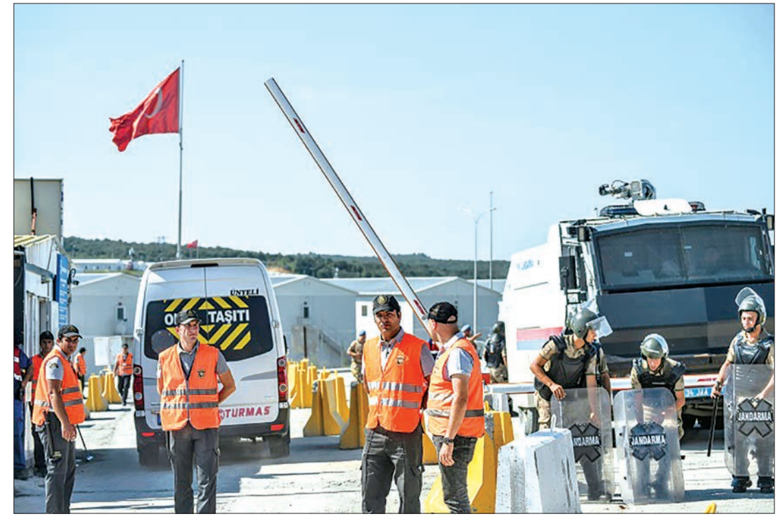
Riot police and security officers at the entrance of Istanbul new airport building site on Saturday.

The opposition daily Cumhuriyet quoted live-in workers