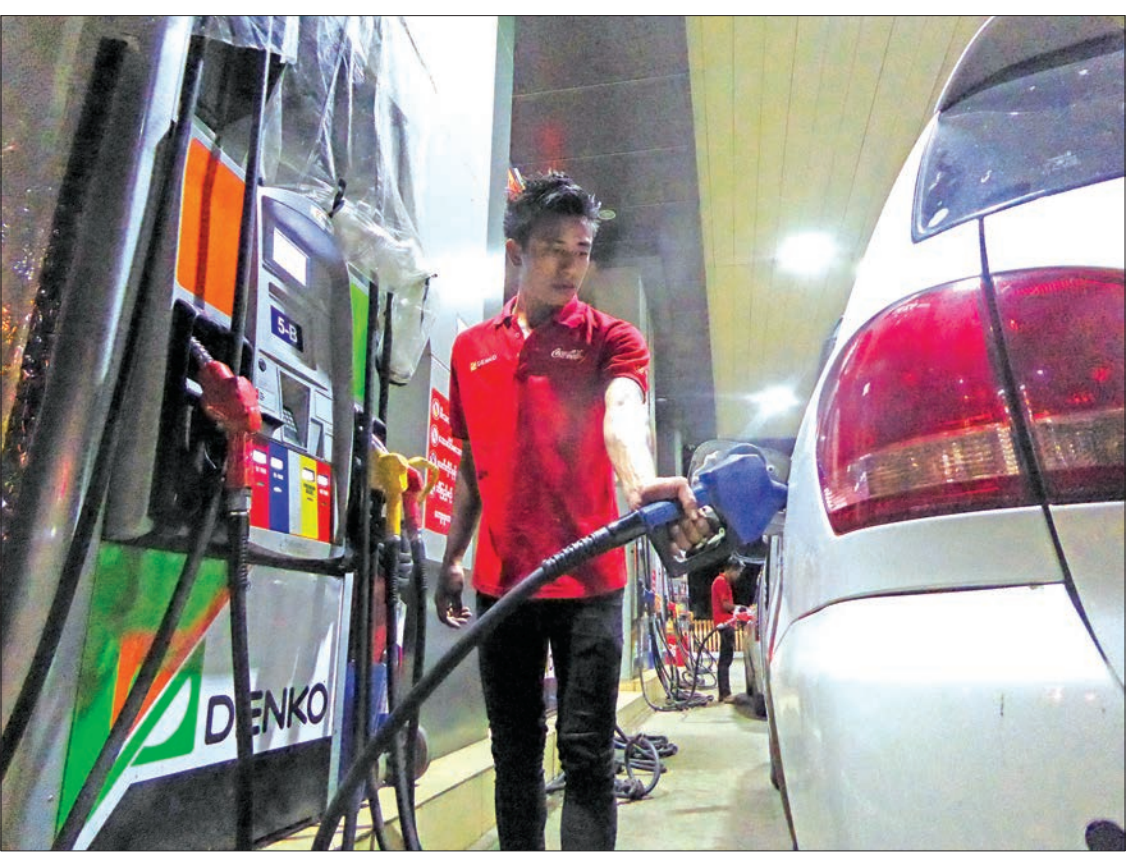
An attendant filling up a car at a petrol station.

Myanmar imports fuel oil primarily through Singapore, with a monthly figure of 200,000 tons of gasoline and 400,000 tons of diesel. There are around 70 fuel oil importer companies in Myanmar, with over 2,000 petrol stations.