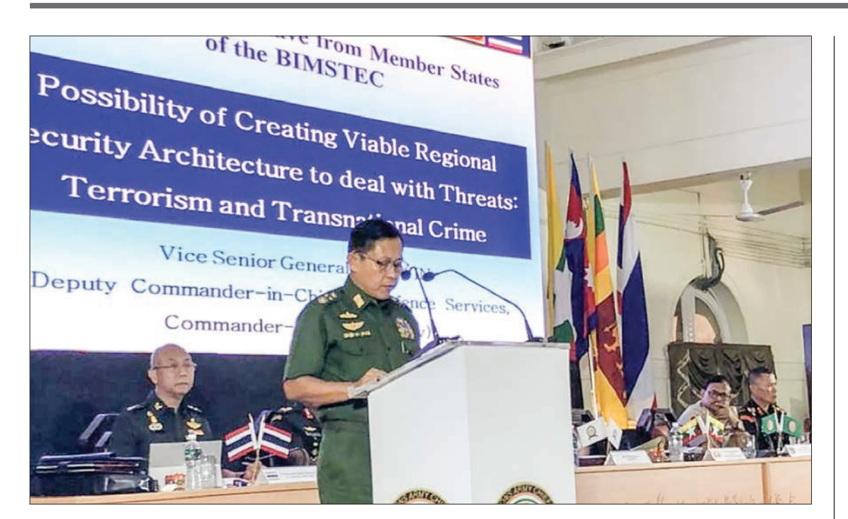
Vice Senior-General Soe Win addresses the BIMSTEC Army Chiefs' Conclave in Pune, India.