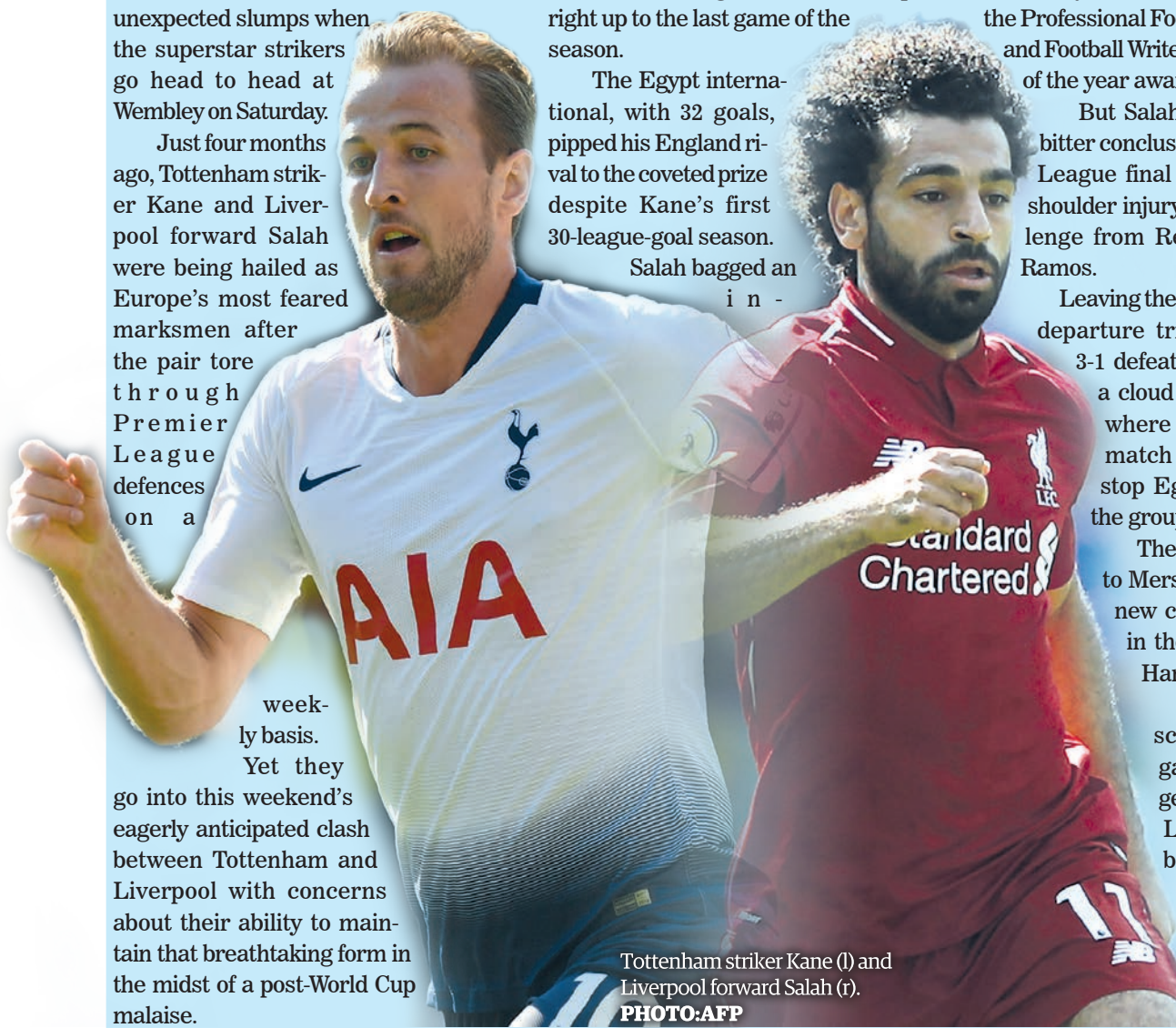
Tottenham striker Kane (l) and Liverpool forward Salah (r).

Yet, by his own admission, Kane was not quite at his best in Russia despite England's run to the semi-finals and the hangover has continued into the new campaign. The 25-year-old has just scored two goals in six games for club and country this season, with the statistics behind those numbers making for even more unsettling reading.—AFP ■