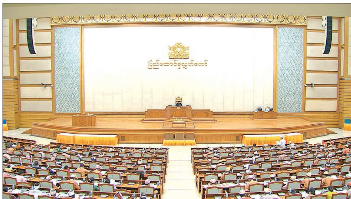
Pyidaungsu Hluttaw is being convened in Nay Pyi Taw yesterday.

Pyidaungsu Hluttaw Speaker then obtained the decision of the Hluttaw by paragraph the fiscal year 2018-2019 Union Budget Bill and approved it.