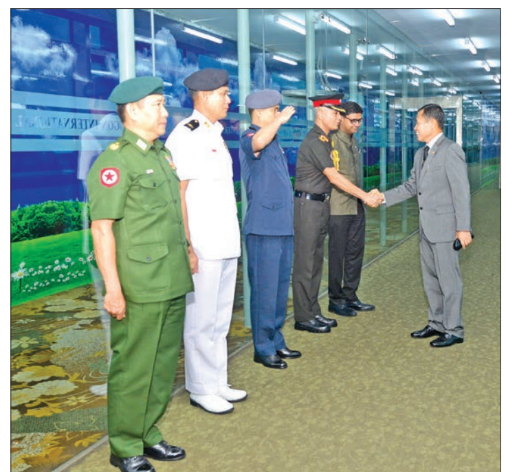
Vice-Senior General Soe Win seen off by Commander of Yangon Command Maj-Gen Thet Pon and senior military officers at Yangon International Airport yesterday.

A Myanmar military delegation led by Deputy Commander-in-Chief of Defence Services Vice-Senior General Soe Win left for India yesterday to pay an official goodwill visit at the invitation of India's Army Chief General Bipin Rawat.