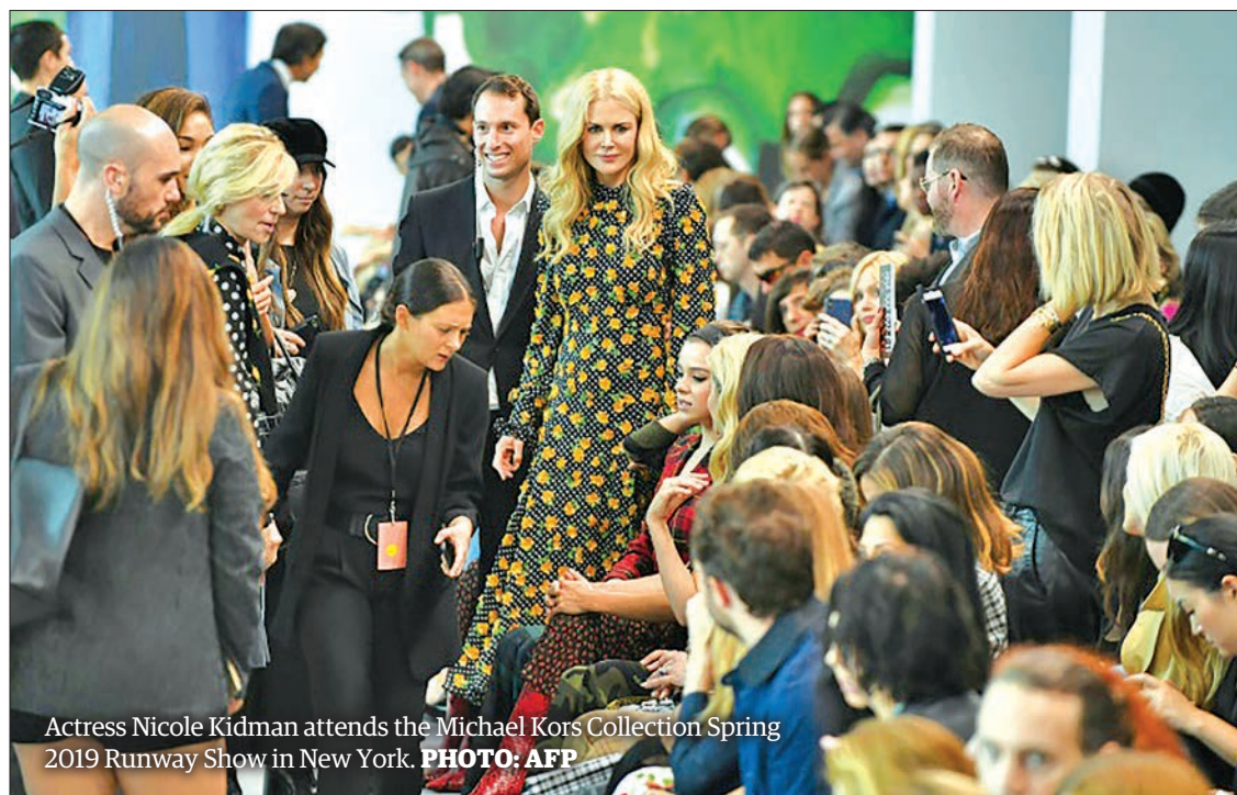
Actress Nicole Kidman attends the Michael Kors Collection Spring 2019 Runway Show in New York.