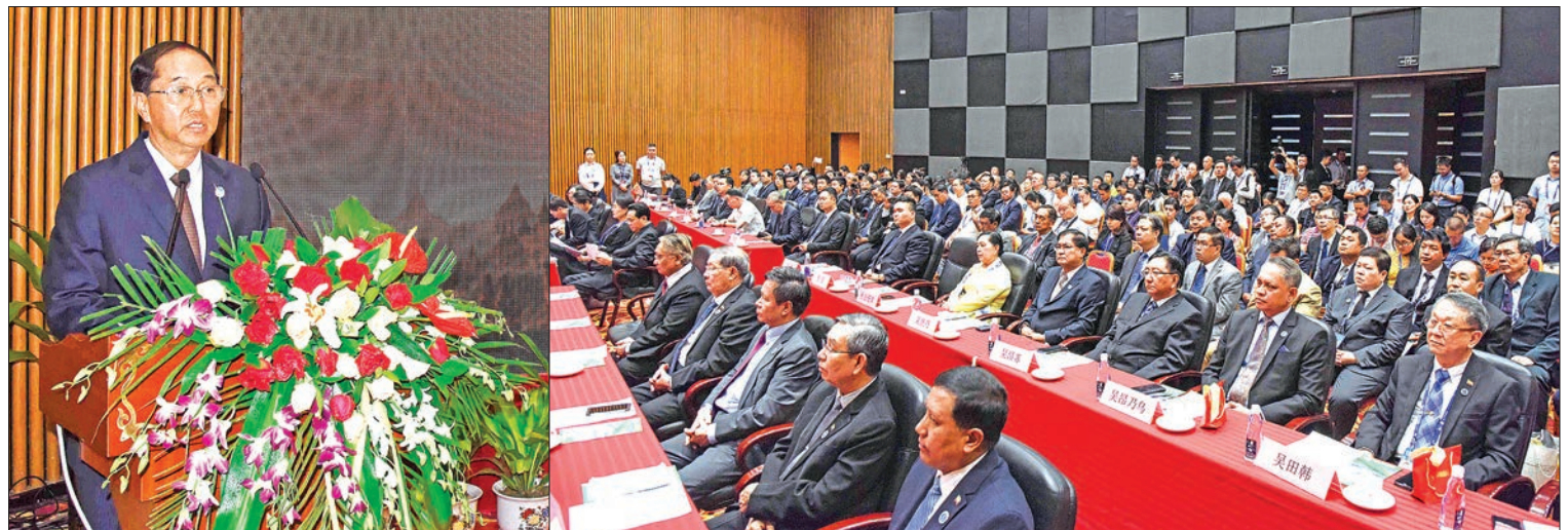
Vice President U Myint Swe delivers the address at the opening ceremony of Natural Myanmar; National Promotion Conference at 15th China-ASEAN Expo (CAEXPO) in Nanning, China yesterday.

The conference is held by Myanmar Ministry of Commerce, Myanmar Trade Promotion group and Myanmar chambers of commerce and business owners will participate. Digital economy/e-commerce sector, gem sector, pulses & bean sector, coffee & tea sector and fruit sector will be discussed by Myanmar business owners. Myanmar is producing and exporting to China natural fruits and agriculture products that China likes and are in high demand. As the day's discussion will be on opportunities for cooperation among businesses, it will support Myanmar-China trade