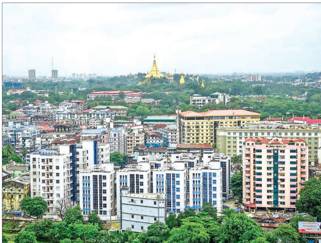
File photo shows an aerial view of Yangon's developing real estate, which draws in a considerable amount of investment from its citizens.

Only $1.4 billion of foreign direct investments were brought into the country in the past five months, in spite of the fact that