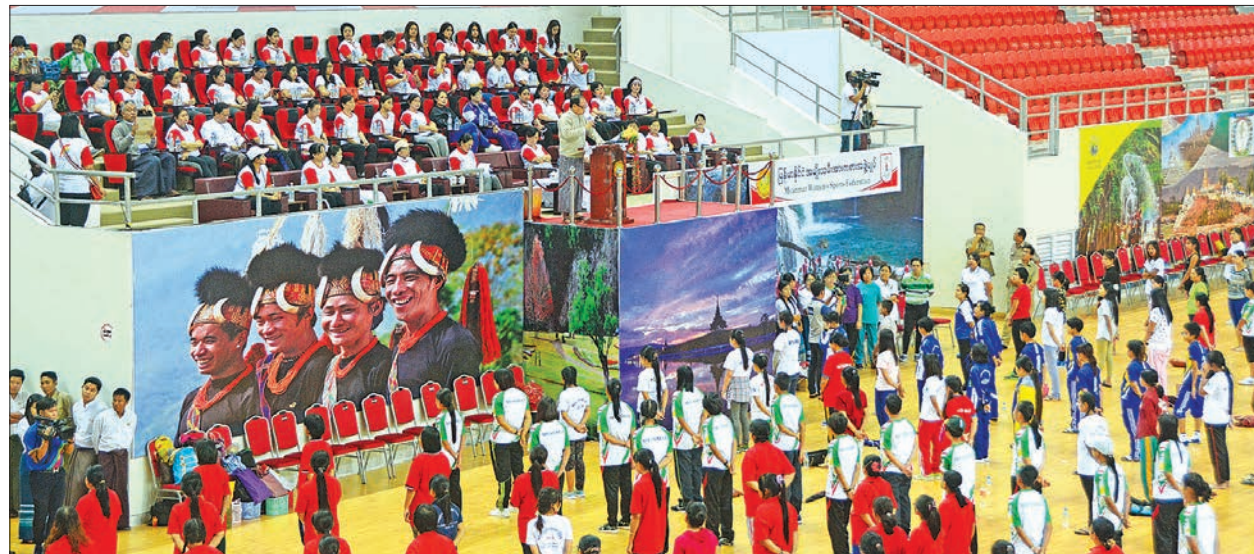
Union Minister Dr. Myint Htwe addresses the MWSF's physical activity in Nay Pyi Taw.

JOINTLY conducted by the Ministry of Health and Sports and Myanmar Women's Sports Federation, a physical activity titled “Healthy Myanmar-Exercise, Physical Activity is Medicine” in Nay Pyi Taw yesterday.