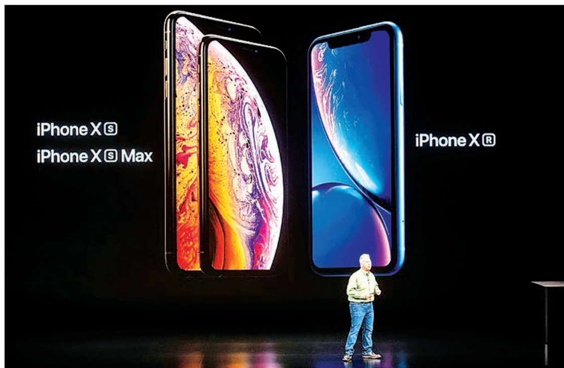
The new iPhone line-up includes three updates to the top-end X model.

The new iPhones have more powerful processors and cameras, and a dual-SIM card feature for top-of-the-line