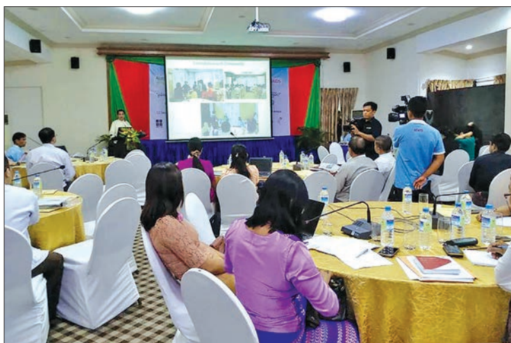
Awareness raising event for drafting a bill for the rights of people living with HIV (PLWHA) held in Nay Pyi Taw.