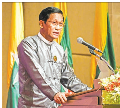
Vice President U Henry Van Thio delivers the address at the Sixth Anti-Trafficking in Persons Day of Myanmar in Nay Pyi Taw yesterday.

When it comes to challenges in relation to trafficking in persons in Myanmar, such challenges are being faced such as difficulties in arresting offenders hiding in foreign countries, difficulties in arresting offenders hiding in foreign countries, difficulties in conducting timely rescues of victims of trafficking who are abroad and a need for creating more concrete job opportunities. In 2018, the book on cooperation guidelines between Station Police