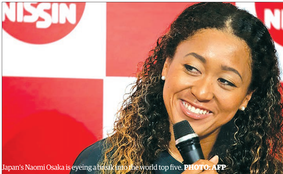
Japan's Naomi Osaka is eyeing a break into the world top five.

"I don't think I even thought about feeling sad because there's no experience for me to draw on in any other Grand Slam