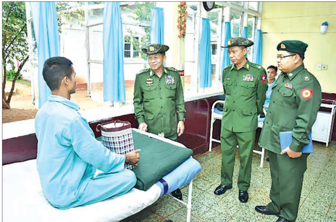
Defence Services Commander-in-Chief Senior General Min Aung Hlaing encourages Tatmadaw member receiving treatment at the Defence Services Hospital in Taunggyi.

and his entourage travelled to the Tatmadaw Computer and Technological Science School in