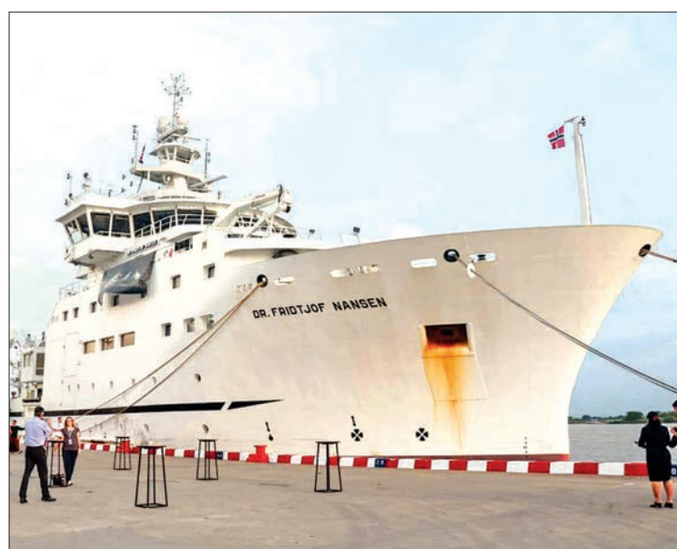
Norwegian research vessel RV-Dr Fridtjof Nansen docks at the Myanmar Industrial Port.

In all the surveys, scientists from the beneficiary countries have received hands-on training in survey design, implementation, analysis and report writing. On average, there are eight to 10 surveys a year over 270 survey days involving about 80 participants from developing countries, the FAO brochure says.—Zaw Gyi ■