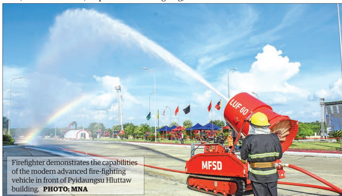
Firefighter demonstrates the capabilities of the modern advanced fire-fighting vehicle in front of Pyidaungsu Hluttaw building.

A total of 75 modern fire-fighting and search & rescue vehicles brought by Fire Services Department under Ministry of Home Affairs with Poland government backed European Union loan assistance program will be deployed in state/region fire stations and highway fire stations it is learnt.—MNA ■