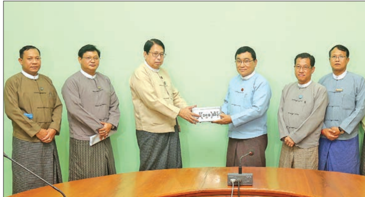
Union Minister Dr. Pe Myint hands over cash donation from MPPO for flood victims to Union Minister Dr. Win Myat Aye.

Next, Union Minister for Social Welfare, Relief and Re-