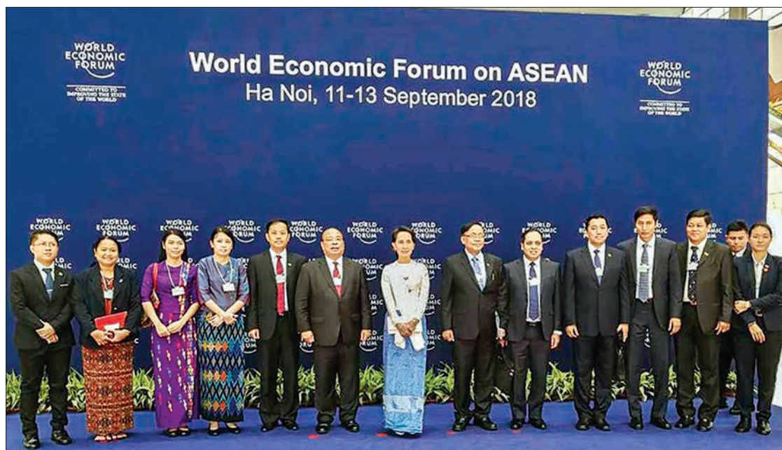
State Counsellor Daw Aung San Suu Kyi poses for the documentary photo together with members of the Myanmar delegation in Ha Noi, Viet Nam yesterday.

At the meeting, they cordially discussed about how the WEF could help Myanmar and efforts in the country to overcome current challenges. Also present at the meeting were Union Ministers U Thaung Tun and U Kyaw Tin and Deputy Minister U Set Aung.