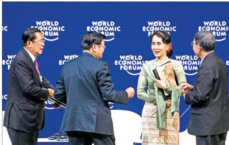
(L-R) Cambodia's Prime Minister Hun Sen, Laos Prime Minister Thongloun Sisoulith, State Counsellor Daw Aung San Suu Kyi and Thailand's Deputy Prime Minister Prajin Juntong attend a panel discussion at the World Economic Forum on ASEAN at the National Convention Center in Hanoi on 12 September 2018.

row the development gap among ASEAN member countries.