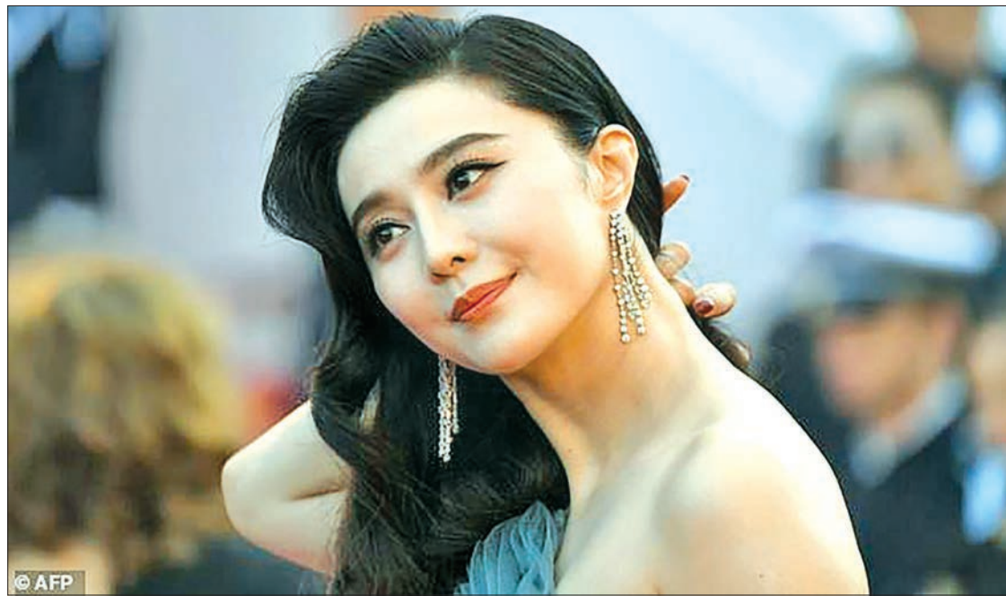
Fan Bingbing has not been seen in public since July, following claims of tax evasion.

The report's authors said they studied the celebrities' be-