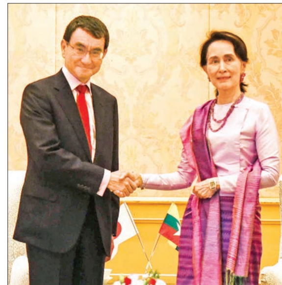
State Counsellor Daw Aung San Suu Kyi shakes hands with Japan's Foreign Minister Taro Kono during a bilateral meeting on the sideline of the World Economic Forum on ASEAN in Hanoi yesterday.

In the evening, the State Counsellor attended a dinner hosted by the Vietnamese government together with the Heads of State of the ASEAN member countries.—MNA