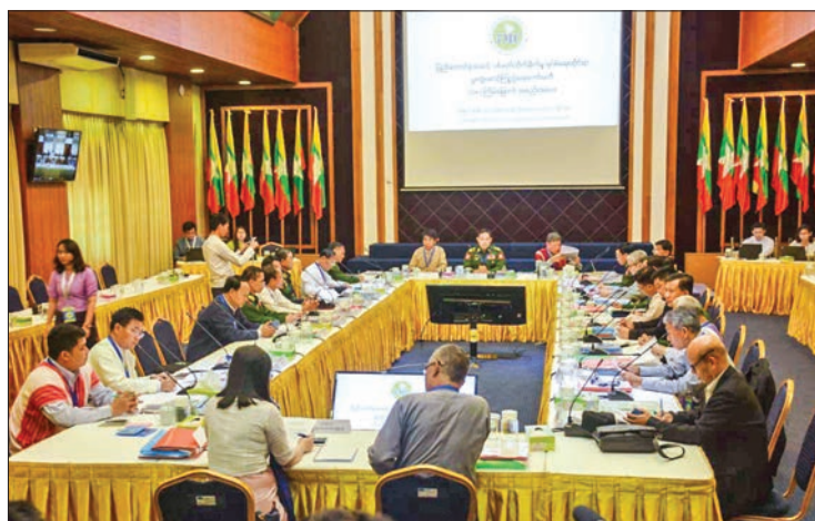
The first day of the 18 th meeting of the Union-level Joint Monitoring Committee in progress in Yangon yesterday.

He urged avoiding armed conflicts as they bring negative consequences for the concerned organization and local residents