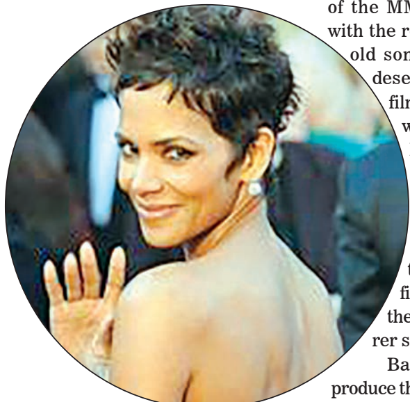
Actress Halle Berry.

Basil Iwanyk will also produce the film alongside Linda Gottlieb. —PTI ■