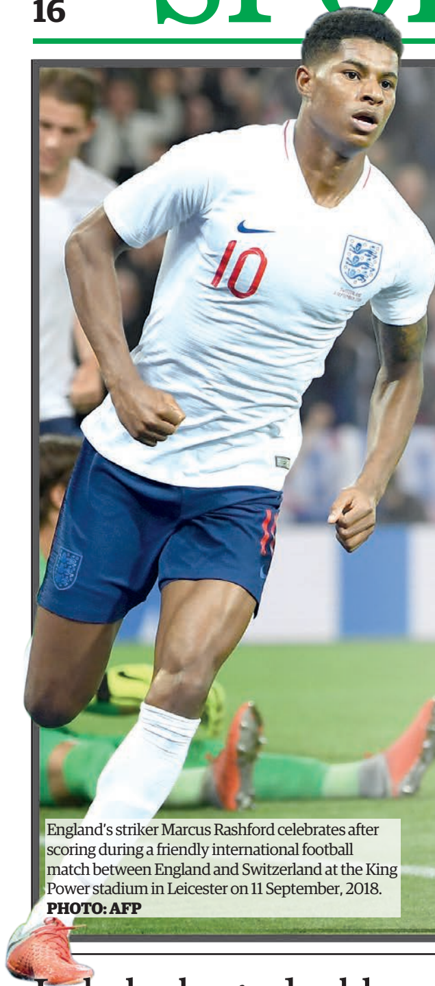
England's striker Marcus Rashford celebrates after scoring during a friendly international football match between England and Switzerland at the King Power stadium in Leicester on 11 September, 2018.