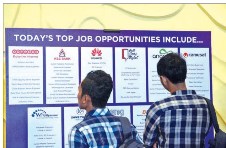
Employees checking job vacancies on the board.

Staff from 65 companies, including PTTEP Nestle, Ooredoo and Myanmar Japan Tobacco