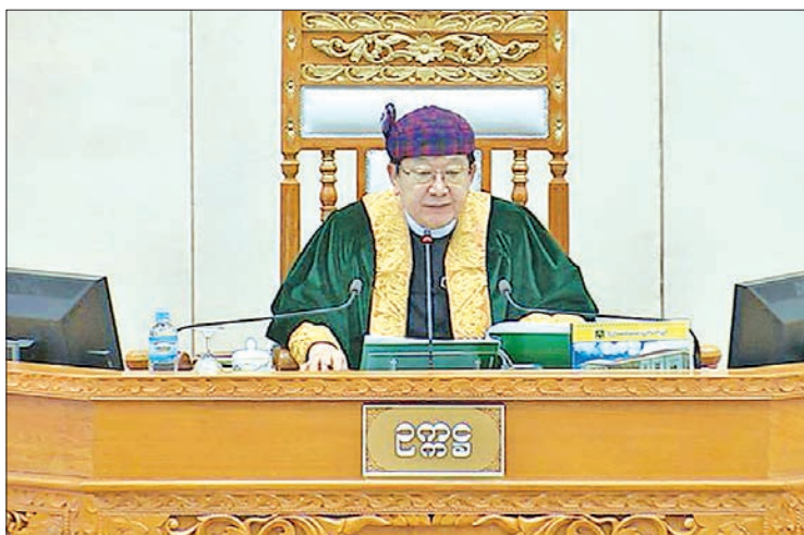
Pyithu Hluttaw Speaker U T Khun Myat.

Deputy Minister for Health and Sports Dr. Mya Lay Sein replied that there are no plans for supplying additional medical staff at the moment but it will be prioritized in 2019. In addition, once the Sanha and Mongyun