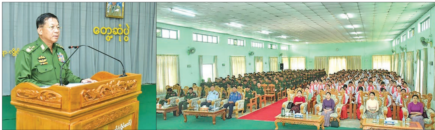
Senior General Min Aung Hlaing meeting with officers and other ranks of Loikaw Station and their families yesterday in Loikaw.

Commander-in-Chief of Defence Services Senior General Min Aung Hlaing met with officers, other ranks and their families in Loikaw Station at the station hall in Loikaw Township, Kayah State.