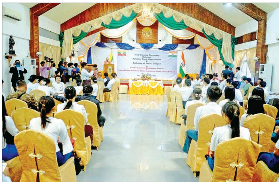
Rakhine State Chief Minister U Nyi Pu delivers the opening addresses at the MoU signing ceremony between Rakhine State Government and Embassy of India, Yangon, in Sittway.

Vikram Misri, explained about the aim for the donation along with signing the MoU.