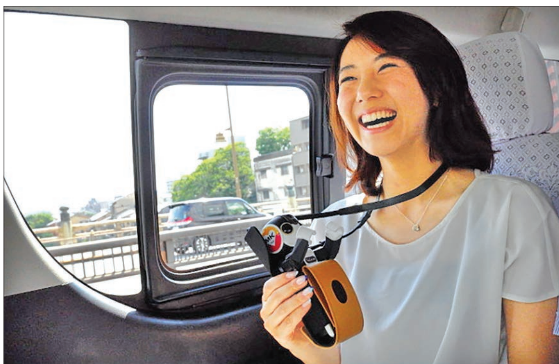
This photo shows Sharp Corp's RoBoHon, a small humanoid robot with artificial intelligence features.