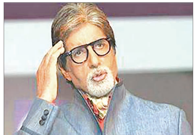
Megastar Amitabh Bachchan.

Pannu, who has previously shared screen space with Bachchan in "Pink", shared her photo - sprawled on the