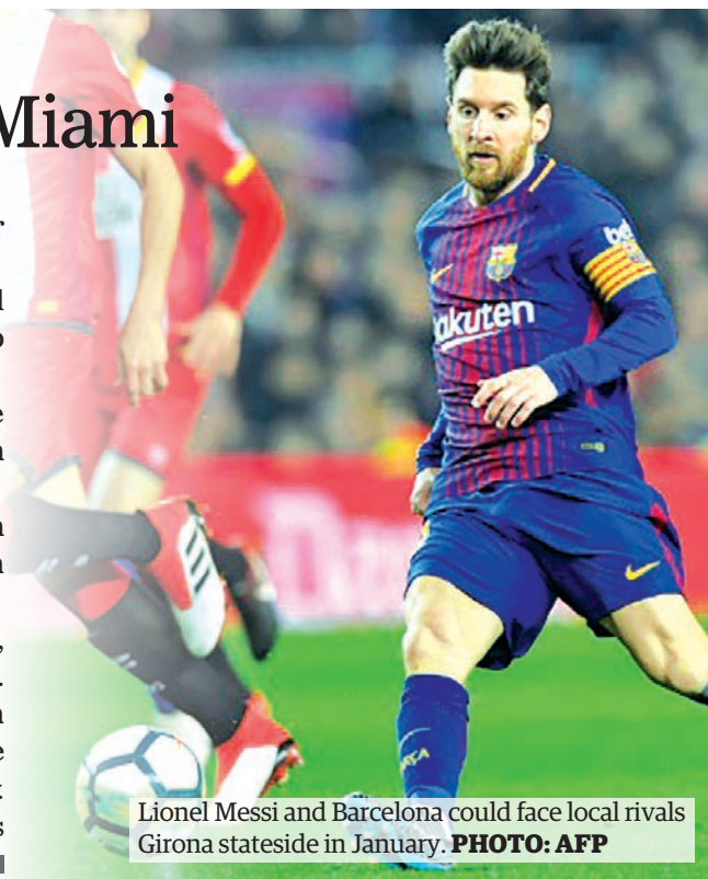
Lionel Messi and Barcelona could face local rivals Girona stateside in January.

La Liga is discussing playing one game per season in the United States as part of a 15-year agreement struck with the media company Relevent. — AFP ■