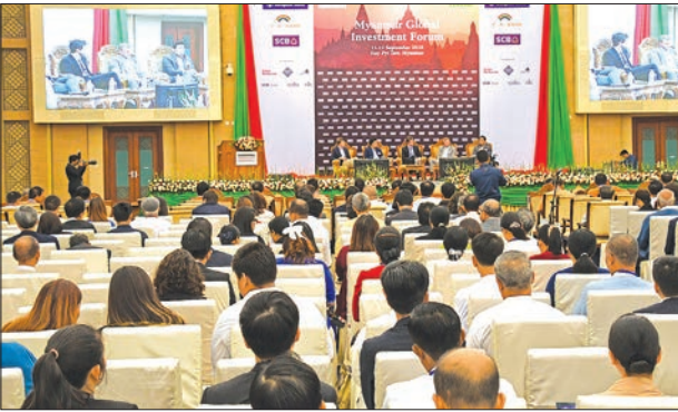
The second day of Myanmar Global Investment Forum held in Nay Pyi Taw.

Increasing FDI inflow contributes to the enhancement of trade, job opportunities and increase of GDP. Myanmar Investment Commission has prioritized for investment facilitation in Myanmar,