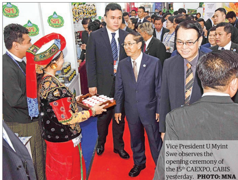
Vice President U Myint Swe observes the opening ceremony of the 15 th CAEXPO, CABIS yesterday.

We are in need of striving to make renovation and making the best use of opportunities utilizing trading, digital economy, technology and fourth industrial revolution. At the same time, we should find ways to promote the ASEAN-China Strategic Partnership aiming to cooperate with the new fields including science, digital and tech-