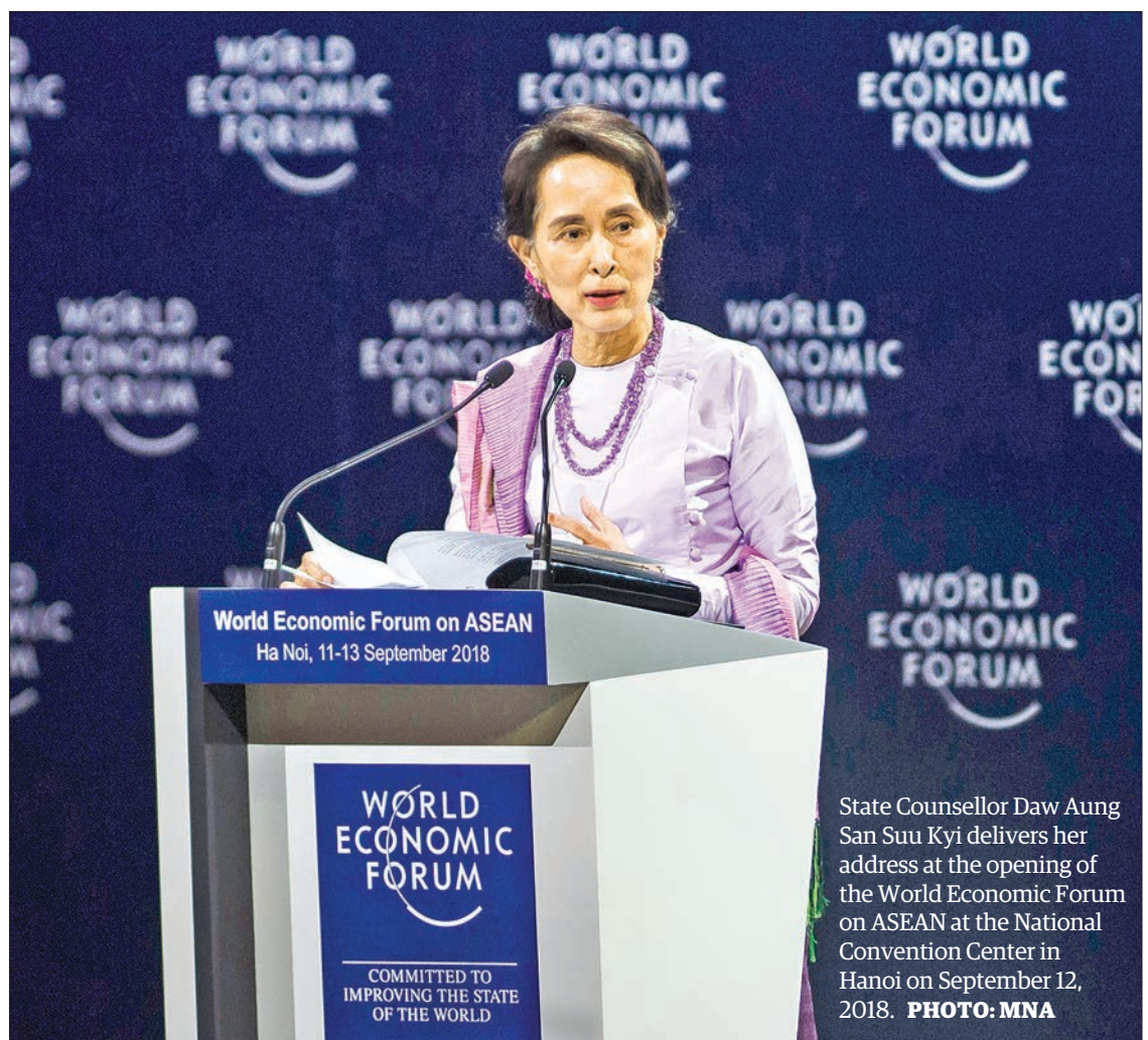
State Counsellor Daw Aung San Suu Kyi delivers her address at the opening of the World Economic Forum on ASEAN at the National Convention Center in Hanoi on September 12, 2018.