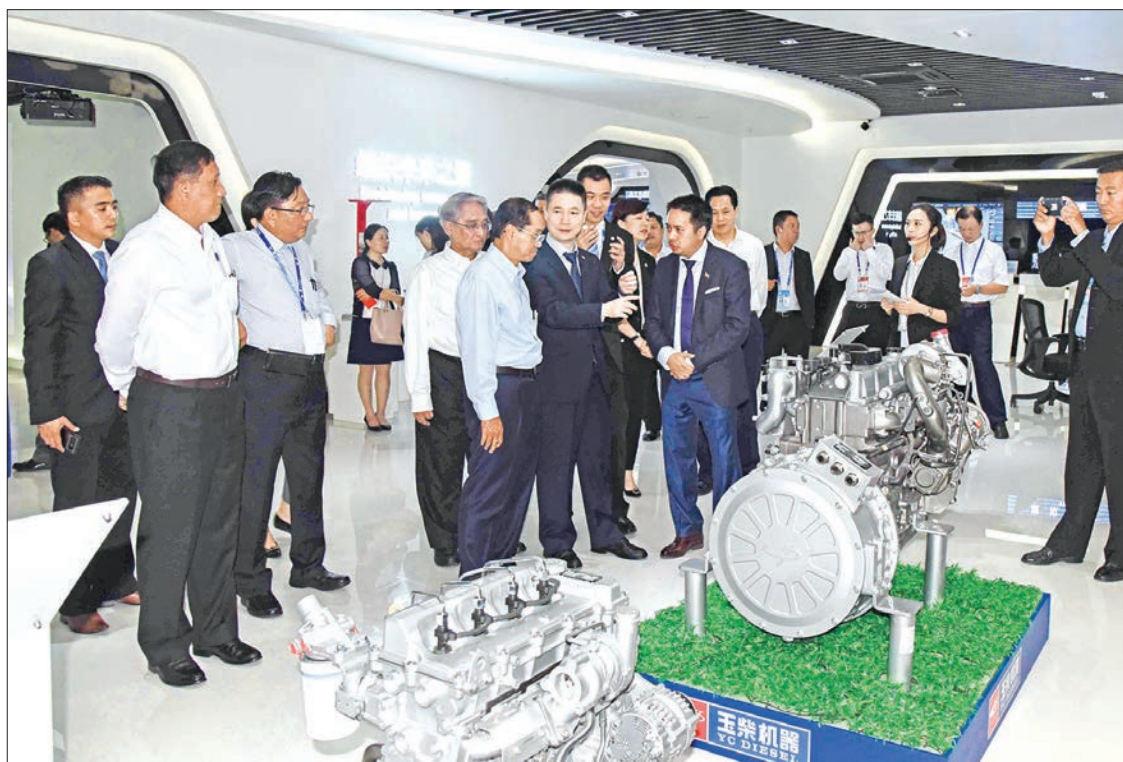
Vice President U Myint Swe visits 15 th CAEXP, CABIS in China.