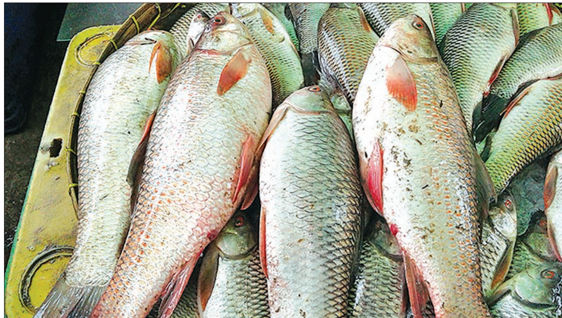
Tilapia fishes seen in the market.

“Thai traders connected with us to produce aqua feed powder with the use of fish scales of fresh water fish including rohu, carp and catla. They purchased a kilo of fish