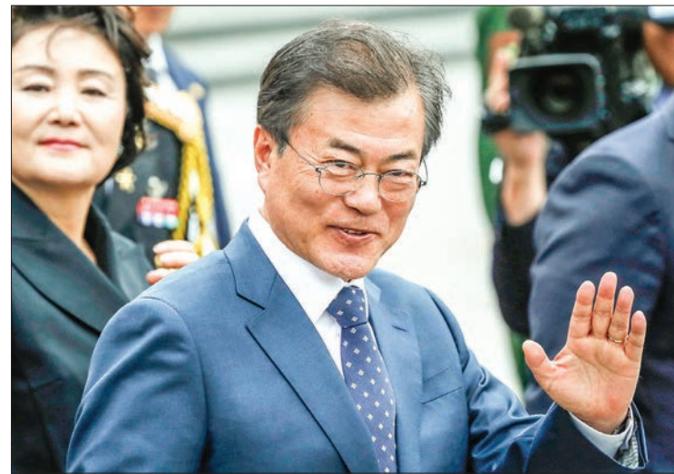
South Korean President Moon Jae-in.

His comments came after the White House said it was “in