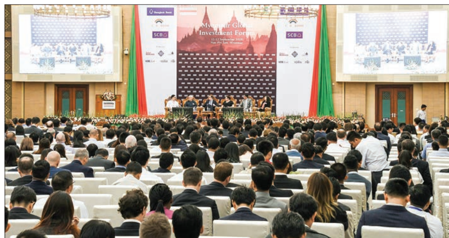
Myanmar Investment Commission and Hong Kong-based Euromoney Institutional Investor (Asia) hold a forum in Nay Pyi Taw.

THE Myanmar Global Investment Forum, jointly-organised by the Myanmar Investment Commission and Hong Kong-based Euromoney Institutional Investor (Asia), was held at Myanmar International Convention Centre-II, in Nay Pyi Taw on 11 September.