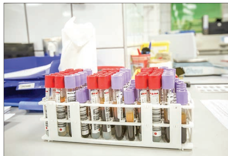
Blood samples are stored before testing in Spain in June 2018. Researchers have designed a blood test that can measure a person’s inner body clock within 1.5 hours, an advance that may help personalize medical care.

to understand how this structure functioned,” Kuznetsov said, adding that archaeologists believe the building used to serve as a sanctuary dedicated to gods associated with the underworld. According to archaeologists, the altar was used to place a sacrifice on it, with the blood trickled to the bowl so that it would not be sprinkled on the altar. The pit, judging by the bone finds, was used to dispose of flesh. — Tass ■