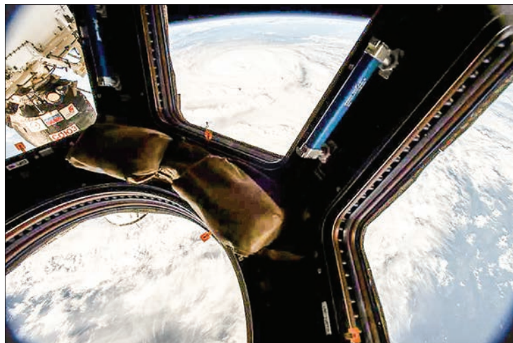
The head of the Russian space agency caused a sensation last week when he said a hole in the International Space Station may have been drilled deliberately.

MOSCOW (Russia) — A cosmonaut on Monday showed off a hole in the International Space Station that caused loss of oxygen after Russia suggested the leak could have been caused deliberately.