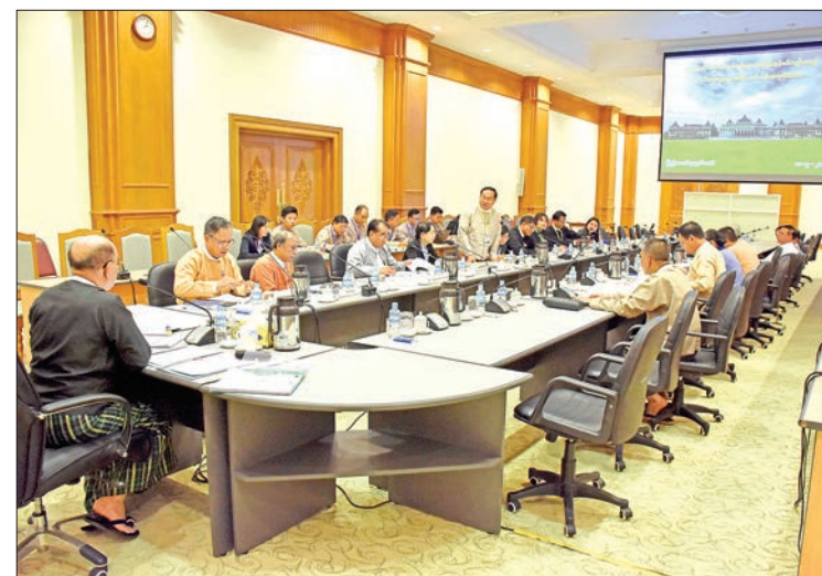
Pyidaungsu Hluttaw Deputy Speaker U Tun Tun Hein attends Pyidaungsu Hluttaw Joint Bill Committee meeting in Nay Pyi Taw yesterday.

Commission members, Office of the Supreme Court of Myanmar, officials from Ministry of Natural Resources and Environmental Conservation, Ministry of Finance and Planning, Union Attorney General Office, the Republic of the Union of Myanmar Federation of Chambers of Commerce and Industry (UMFCCI) and Pyidaungsu Hluttaw Office.—MNA ■