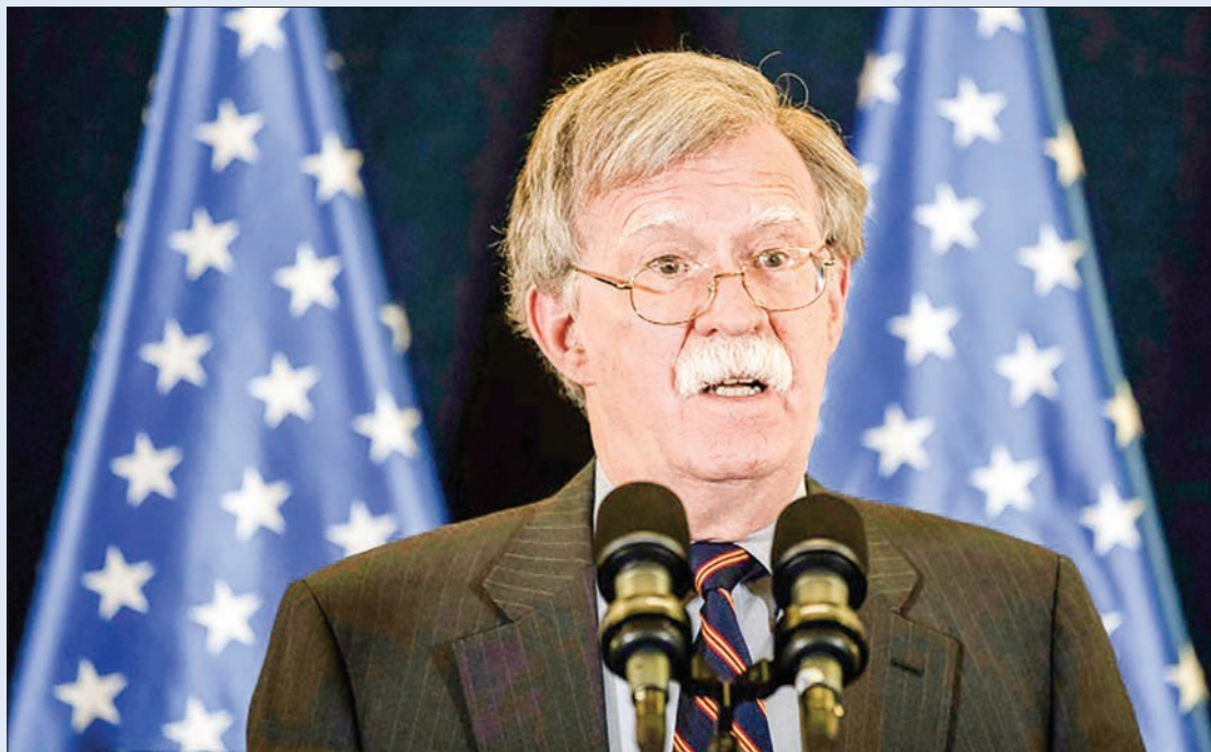
US National Security Advisor John Bolton, pictured in Jerusalem in August 2018, described the International Criminal Court as ‘outright dangerous’.

Bolton made the comments in a speech in Washington to the