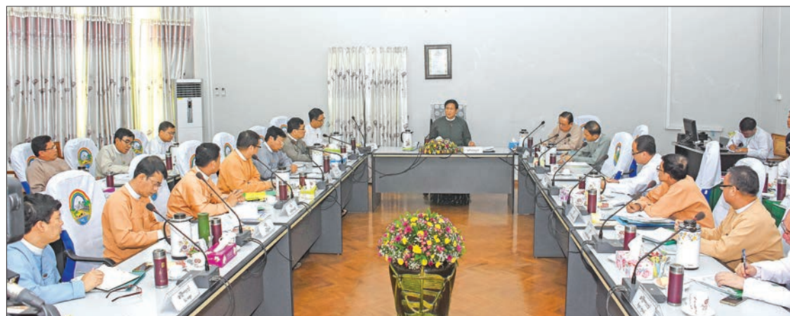
Vice President U Henry Van Thio meets with officials at a meeting concerning agricultural sector and providing remedies to the country's basic production sector in Nay Pyi Taw.

In his concluding remarks, the Vice President urged the state and regional authorities, private associations and farmers to cooperate among each other to overcome the current challenges and to give priority to rice rather than other crops.—MNA ■