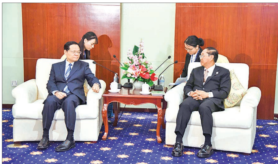
Vice President U Myint Swe meets with Guangxi Zhuang Autonomous Region Governor Mr. Chen Wu at Liyuan State Guest House in Nanning yesterday.

The Vice President and party then went on to Liyuan State Guest House where they will be staying and received Guangxi Zhuang Autonomous Region Governor H.E. Mr. Chen Wu. During the meeting, matters relating to increasing cooperation between Myanmar and Guangxi Zhuang Autonomous Region in economic, social, education, investment, agriculture, trade and