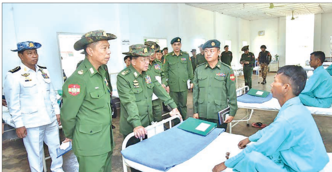
Senior General Min Aung Hlaing encourages a patient in Bawlakhe Station.