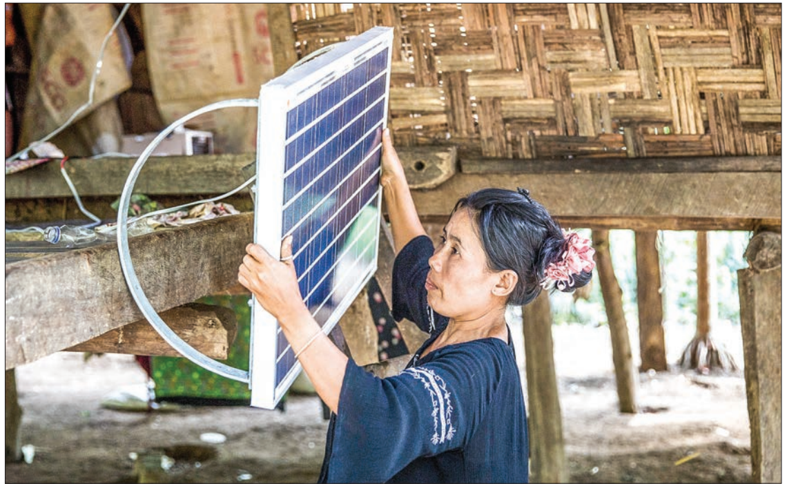
A woman installs a solar panel at her home in Kayin State.

According to a news release by WWF-Myanmar, the governments of Denmark and Sweden and European Climate Foundation will provide assistance to implement the project between Kayin State government and WWF-Myanmar. "Kayin State mainly needs